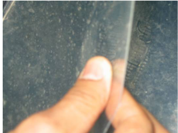
Site Photo 39. Protective film was installed on interior side of windows to prevent shattering

We observed and photographed the exterior and interior walls in the services, ministry, guard, and conference buildings and found them to be adequately plastered/stuccoed and painted. Site Photo 40 shows an example of a refurbished interior wall.