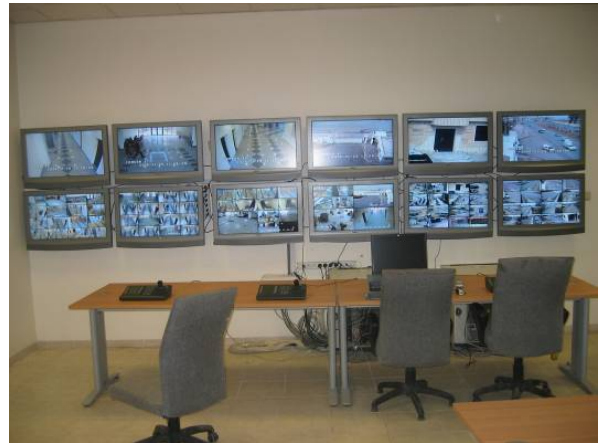
Site Photo 22. Twelve monitors in the security control room