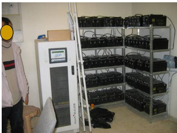
Site Photo 23. Backup power supply in the security control room

We rode one elevator in the MOI building to the third floor. The ride was smooth and the elevator started and stopped, level with the floor, without jerking. Site Photo 24 shows the elevator condition at the time of our site visit.