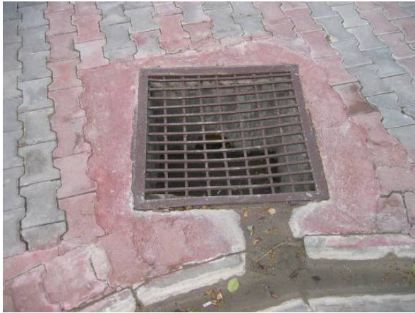
Site Photo 10. Roadside drainage ditch emptying into a manhole

photographed the landscaping and noticed the general slope of the grounds. It had recently rained and there was no evidence of water pooling. There was an efficient network of manholes, culverts and piping to collect and convey runoff water offsite. At the garage entrance, a culvert captured water that drained down the driveway and a sump pump moved the water vertically up the driveway wall to the upper road and into the drainage ditch. Site Photos 10 and 11 show two water drainage components.