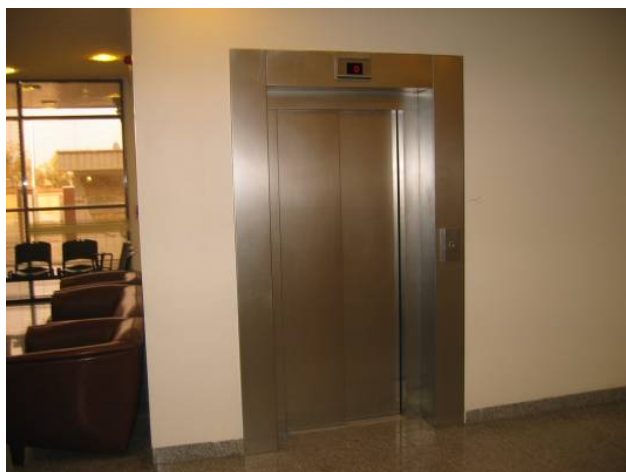
Site Photo 24. Elevator in MOI building

We rode one elevator in the MOI building to the third floor. The ride was smooth and the elevator started and stopped, level with the floor, without jerking. Site Photo 24 shows the elevator condition at the time of our site visit.