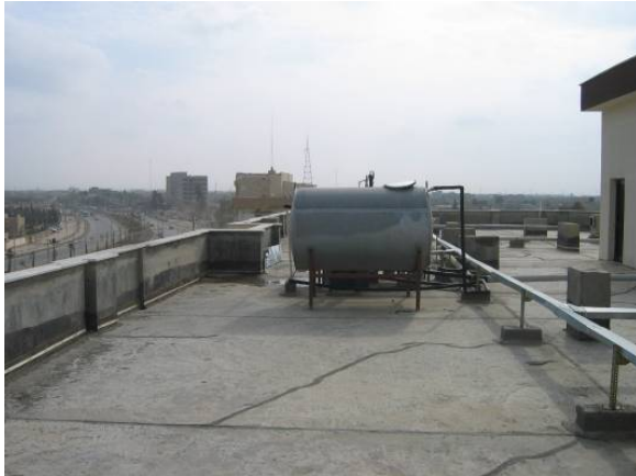
Site Photo 30. Rooftop water supply tank

Fresh water is provided by the city waterline and from a deep-water well located at a secured property across the street from the MOI. Water comes in through the perimeter wall into two separate locked tanks where it is treated and then pumped to rooftop tanks for distribution within the facility. With the exception of the rooftop tanks, the domestic water supply had minimal damage to the outside supply system. We observed and photographed the incoming lines to the storage tanks and noted the access covers were secured with locks to prevent tampering. We found the system to be adequate and functioning. Site Photos 30 and 31 show the rooftop tank and secured treatment tanks.