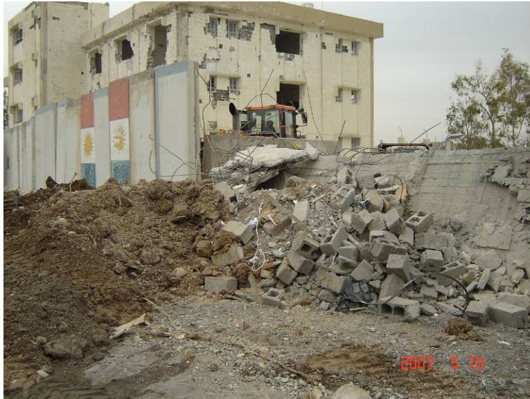
Site Photo 2. Security building damage