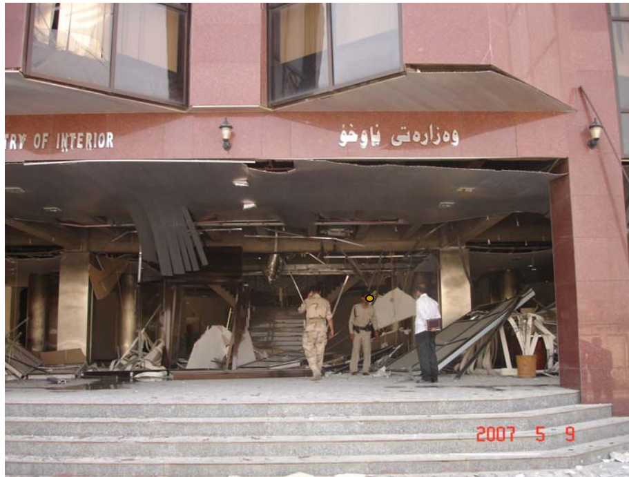
Site Photo 8: The MOI entrance was located at the opposite side of the complex from the blast which carried through the building interior.

granite siding was not damaged and was retained in the new construction. Site Photos 8 and 9 show the destruction and completed repairs.