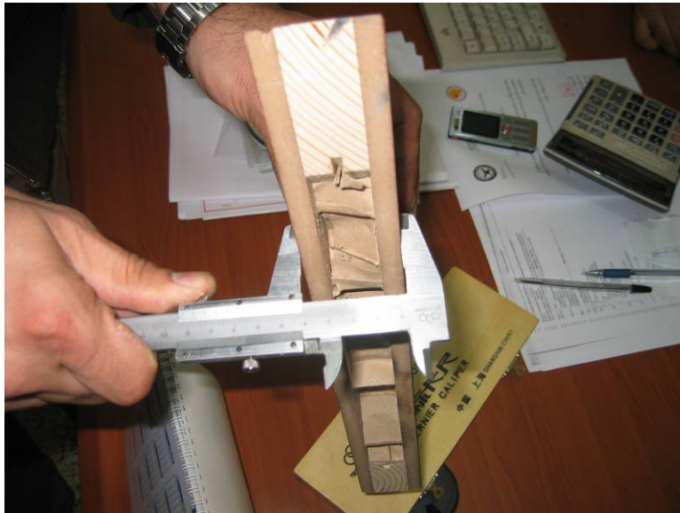
Site Photo 34. Cross section of an upgraded interior wooden door

We observed and photographed a crosscut section of a new door (Site Photo 34) and tested a sample of doors which operated properly.