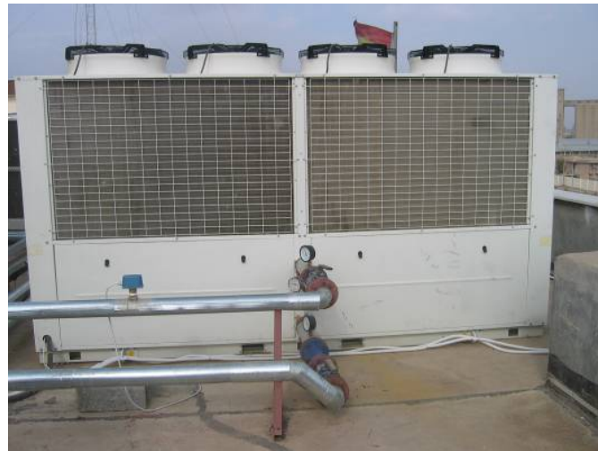
Site Photo 27. New boiler located on the roof of the services building

We observed and photographed the plumbing in a number of bathrooms including the basement of the ministry and services buildings. The plumbing and fixtures were of good quality and functioned properly. Site Photos 28 and 29 show the material quality and workmanship in sample bathrooms.