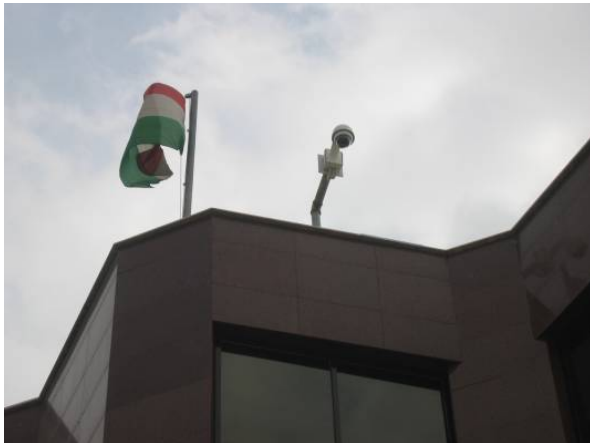
Site Photo 21. 360° Camera located on the services building

We observed and photographed a number of security cameras around the facility perimeter and visited the security control room to observe the camera monitors. Twelve newly installed Sony monitors provide good resolution and coverage of the entire complex. The system includes telephoto capability that allows close-ups adequate to read license plates on vehicles traveling along the perimeter roads. We also observed and photographed the backup system of batteries and uninterrupted power supply systems located in the room. Site Photos 21 through 23 show a security camera and control room equipment.