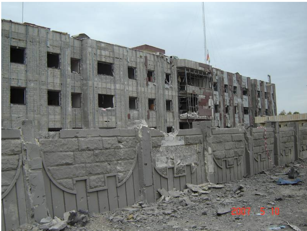
Site Photo 1. Damage to the north side of the services building & perimeter wall.