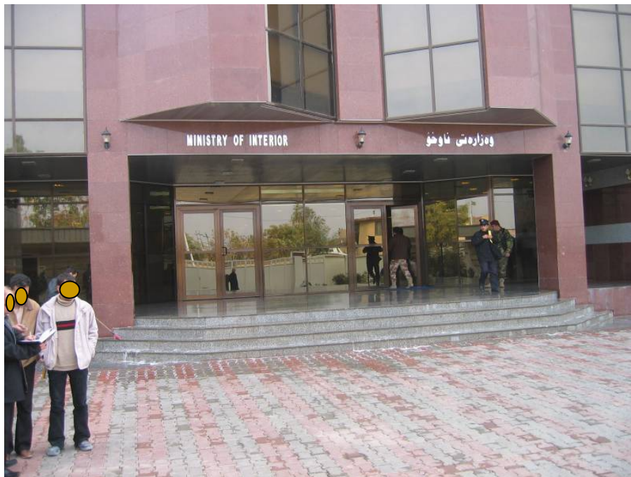
Site Photo 9: Repaired MOI entrance

The contract required that the site be properly graded to allow for positive drainage toward any adjacent roads. As we moved about the grounds of the complex, we