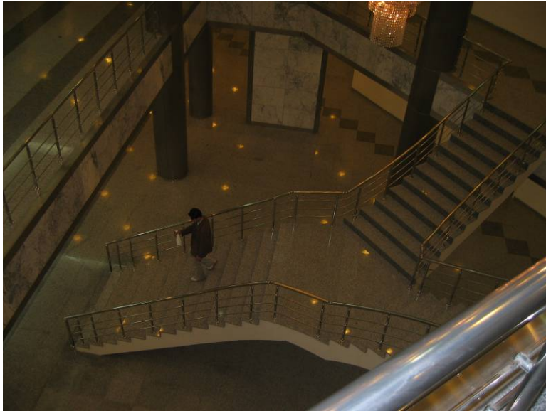
Site Photo 37. Handrails and staircases in MOI entrance