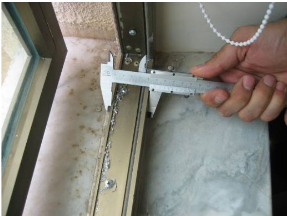
Site Photo 38. MOI blast resistant window