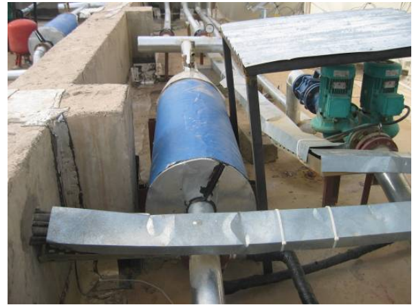
Site Photo 26. New instant water heater located on the roof of the services building