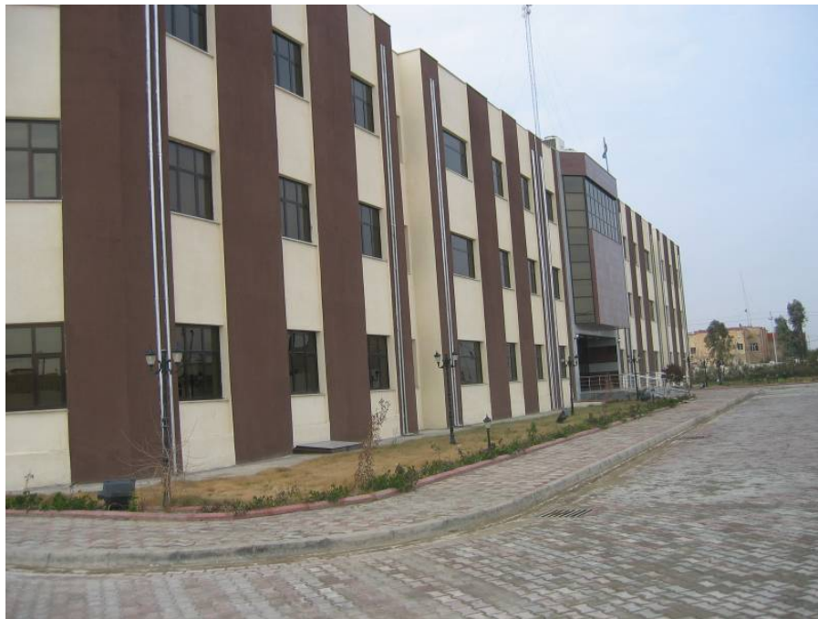
Site Photo 5: Refurbished services building

The VBIED detonated at the northeast entry gate, destroying the guard shack and severely damaging the perimeter wall. The guard shack was rebuilt, the perimeter wall repaired, and T-walls were erected along the “60-Meter” road that passes the complex. Site Photos 6 and 7, taken from the roof of the services building show the destruction and completed repairs.