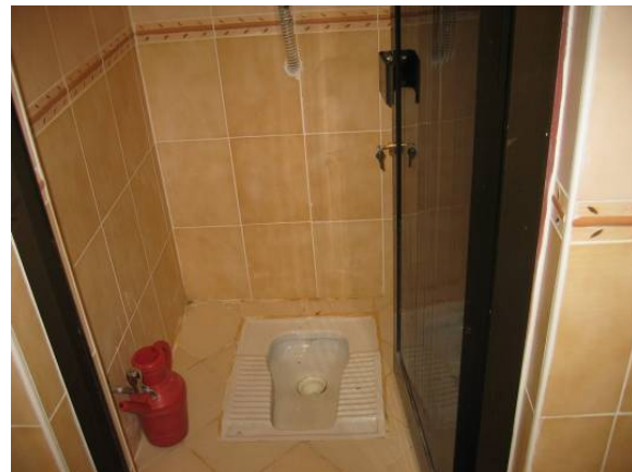
Site Photo 29. New eastern toilet in a MOI bathroom