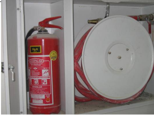
Site Photo 19. Fire extinguisher and fire hose

had been turned off by an employee who was performing maintenance in the control room. When the system was re-energized, the test with the burning cardboard passed. The GRN RE noted that the system should not be that easy to deactivate and added a punch list item securing the system from being deactivated unless authorized. Site Photos 19 and 20 show sample fire extinguishers and the system test.