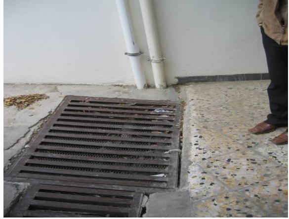
Site Photo 11. Garage culvert with a sump pump that moves water vertically to the roadway approximately three meters above the driveway

The contract required installation of one 250 kilovolt amp (kVA) and one 400-kVA transformer. The work included providing poles for 11-kV high-voltage lines with all accessories to be energized. Site Photos 12 and 13 show both transformers were installed and connected to power lines adjacent to the complex.