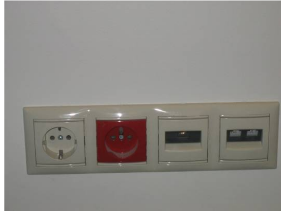
Site Photo 15. Electrical outlets