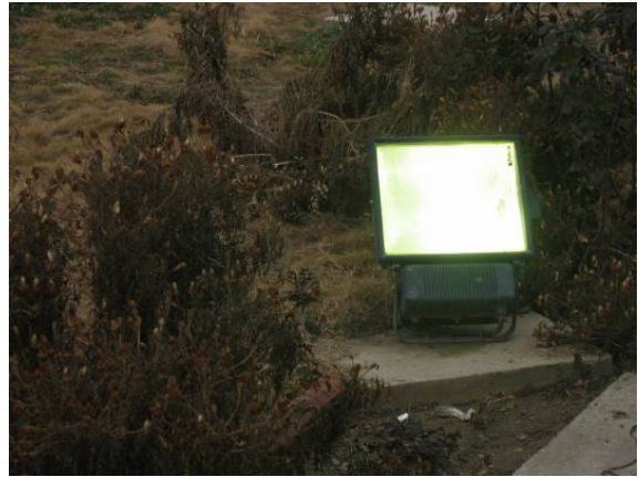
Site Photo 17. Outside floodlight