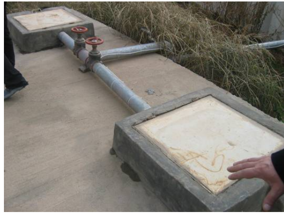
Site Photo 31. Secured access covers to fresh water treatment tanks

The sewage system includes a number of sump pumps that transfer wastewater through a system of pipes which drain into septic tanks located near the perimeter walls. The system was operating and there were no apparent leaks anywhere throughout the system. Site Photos 32 and 33 show the sump pump in the ministry basement and the outside septic tank covers.