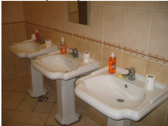
Site Photo 28. New sinks and tile in a MOI bathroom

We observed and photographed the plumbing in a number of bathrooms including the basement of the ministry and services buildings. The plumbing and fixtures were of good quality and functioned properly. Site Photos 28 and 29 show the material quality and workmanship in sample bathrooms.