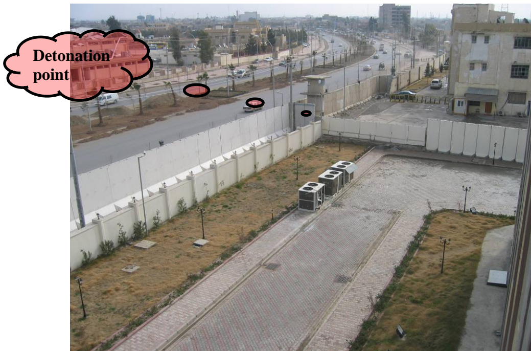
Site Photo 7: Repaired wall, installed T-walls and reconstructed guard shack. Photo taken from the roof of the services building.

The MOI main entrance is located at the southwest part of the complex. The blast carried through the building interior and blew out the entrance doors, windows, and ceiling. The