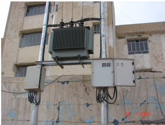
Site Photo 12. 400-kVA Transformer

The contract required installation of one 250 kilovolt amp (kVA) and one 400-kVA transformer. The work included providing poles for 11-kV high-voltage lines with all accessories to be energized. Site Photos 12 and 13 show both transformers were installed and connected to power lines adjacent to the complex.