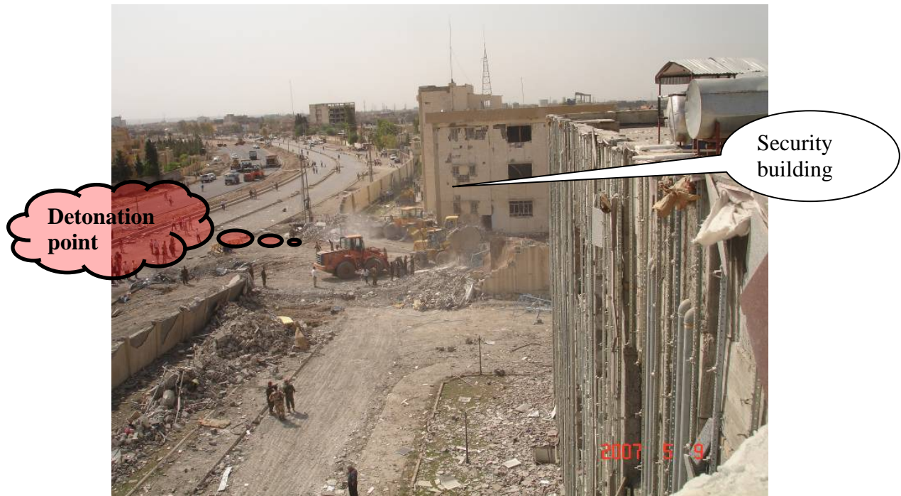
Site Photo 6: Damage to the perimeter wall, services building and security building.