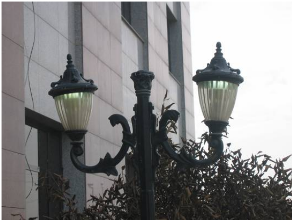
Site Photo 16. Outside walkway light