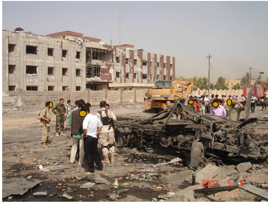
Site Photo 4: Damage to the services building and perimeter wall