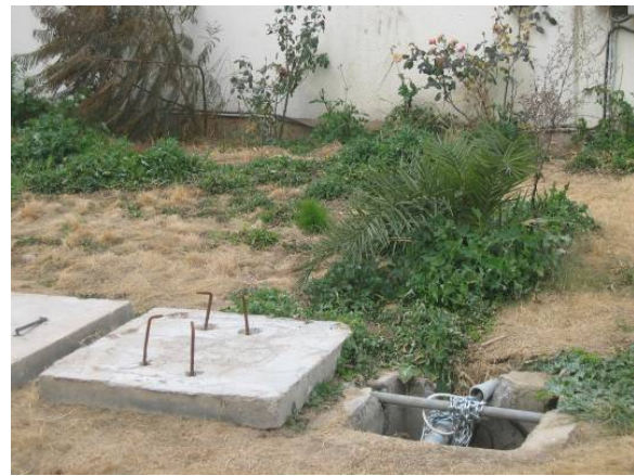
Site Photo 33. Septic tanks located near the south side perimeter wall

The contractor's assessment concluded that stronger doors and shatter proof windows would have significantly mitigated damage from the blast. The current contract required industrial grade doors and hardware installed throughout the facility to prevent the level of destruction experienced when the other doors and windows collapsed from the blast.