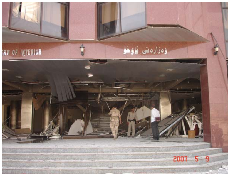
Site Photo 3: Entryway to MOI building

Engineers from the U.S. Army Corps of Engineers' (USACE) Gulf Region Division-North (GRN) Erbil Resident Office, the contractor, and KRG assessed the structural integrity of the buildings after the bomb-blast. They evaluated the load bearing columns, beams and walls as well as the non-loading bearing elements. There was significant damage to the ceiling, finishes, doors, and windows. Some of the partition walls in the buildings were moved from their original position. The engineering team concluded the building structural frames were not damaged and did not need to be replaced. All windows were replaced with higher grade shatter proof materials and interior doors were replaced with industrial grade materials.