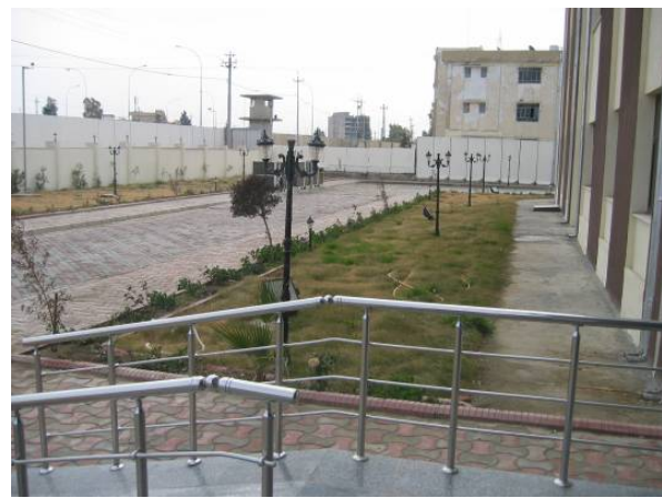
Site Photo 36. Hand rails at services building entrance