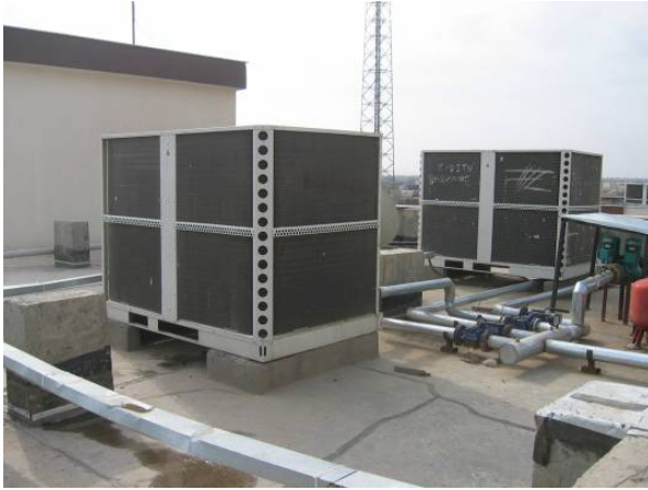
Site Photo 25. New chiller units located on the roof of the services building