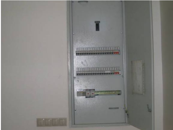
Site Photo 14. Circuit breaker panel