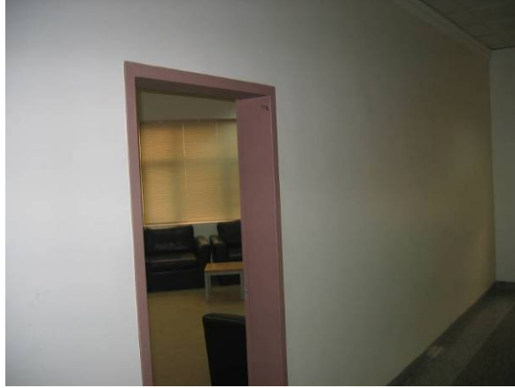
Site Photo 40: Example of a finished interior wall