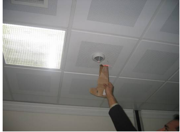
Site Photo 20. Fire alarm test

We observed and photographed a number of security cameras around the facility perimeter and visited the security control room to observe the camera monitors. Twelve newly installed Sony monitors provide good resolution and coverage of the entire complex. The system includes telephoto capability that allows close-ups adequate to read license plates on vehicles traveling along the perimeter roads. We also observed and photographed the backup system of batteries and uninterrupted power supply systems located in the room. Site Photos 21 through 23 show a security camera and control room equipment.