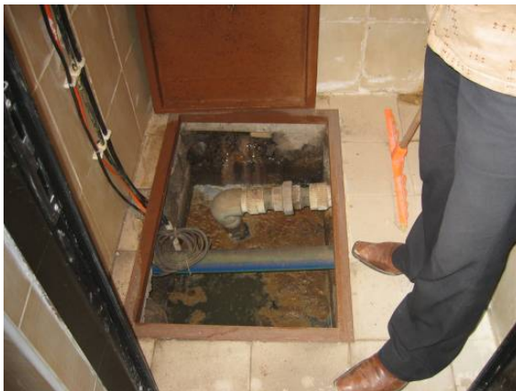
Site Photo 32. Sump pump located in the basement of the MOI building

The sewage system includes a number of sump pumps that transfer wastewater through a system of pipes which drain into septic tanks located near the perimeter walls. The system was operating and there were no apparent leaks anywhere throughout the system. Site Photos 32 and 33 show the sump pump in the ministry basement and the outside septic tank covers.