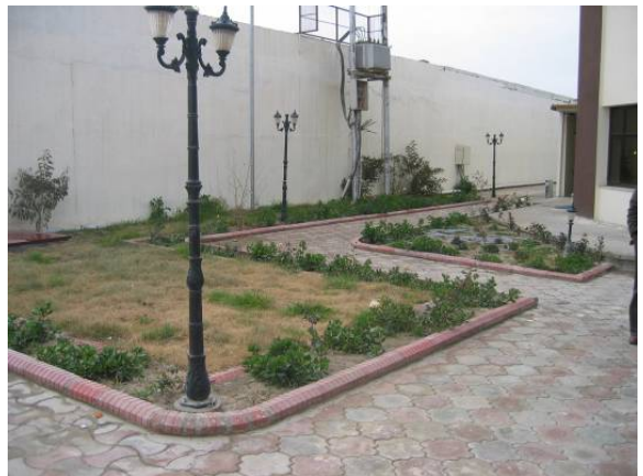
Site Photo 13. 250-kVA Transformer

The contractor assessed circuit breakers, electrical fixtures, and lights for damage and made necessary replacements. Our observation showed that circuit breaker panels, electrical outlets, and light fixtures were operating, in good repair and constructed with adequate materials. Site Photos 14 through 18 show the condition of the electrical components.