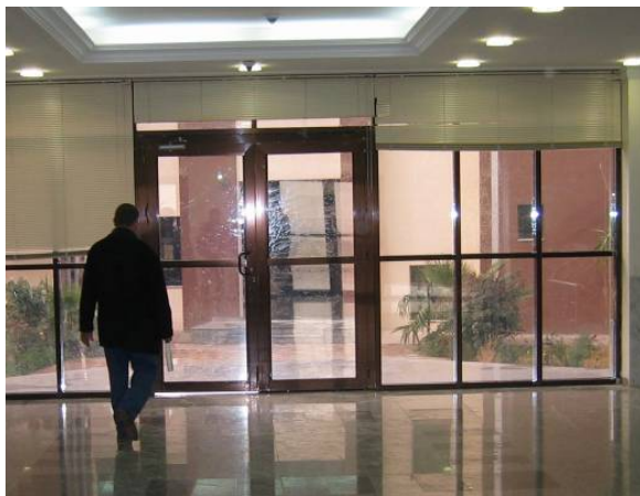
Site Photo 35. Aluminum entry door

Aluminum doors were installed at the building entrances and bathrooms. The new materials were 30 percent thicker (2 centimeters (cm) vs. 1.5-cm) than those used in the previous construction. Handrails were repaired or replaced with the same quality material as before. We observed, photographed, and tested the operations of a sample of doors in the ministry and services buildings and found them to function properly. The handrails were stable and well anchored. Site Photos 35 through 37 show examples of the new aluminum doors and refurbished handrails.