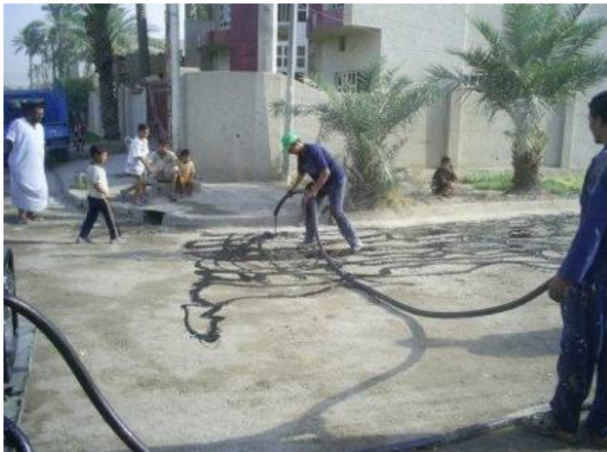
Site Photo 5. Preparing base for asphalt concrete pavement

At the time of the assessment, the USACE stated that the contractor was completing the road. The contractor had filled in the trench, compacted the base material, and was in the pre-stages of paving the road (Site Photos 5 and 6).