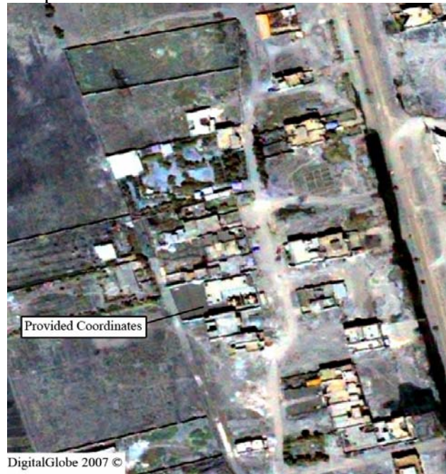
Aerial Image 1. Aerial overview denoting provided geo-coordinates of the Mahalla 824 Sewer.

In assessing the Mahalla 824 Sewer Collapse Project, we focused on the completed installation of the new sewer pipes. According to the USACE, the project was approximately 84% complete as of 1 November 2007.