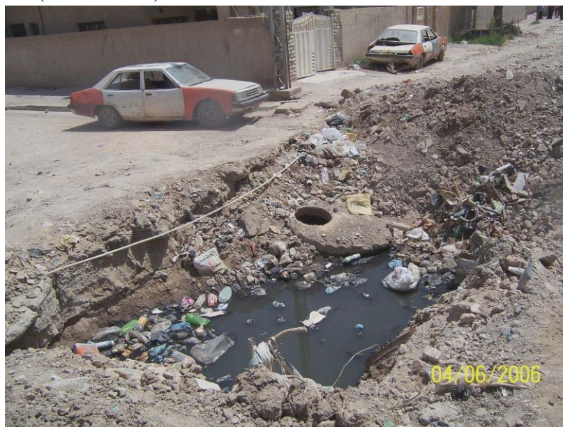
Site Photo 3. Collapsed existing manhole

According to the USACE, the contractor had removed the existing pavement in the areas to be trenched and removed and replaced the contaminated soil from the sewage spill below the pipe grade. Then the contractor placed bedding material in the trench, installed the new sewer line, and backfilled the trench. In addition, the four existing manholes were removed (Site Photo 3), and four new manholes were constructed (Site Photo 4).