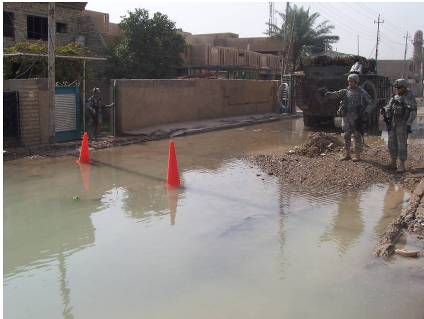
Site Photo 1. Sewage pond