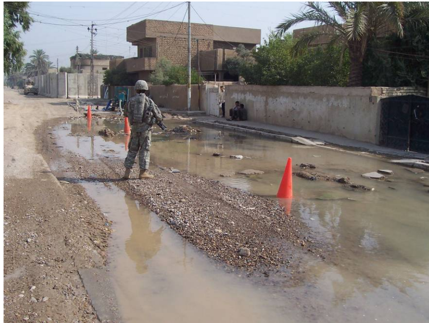
Site Photo 2. Sewage pond