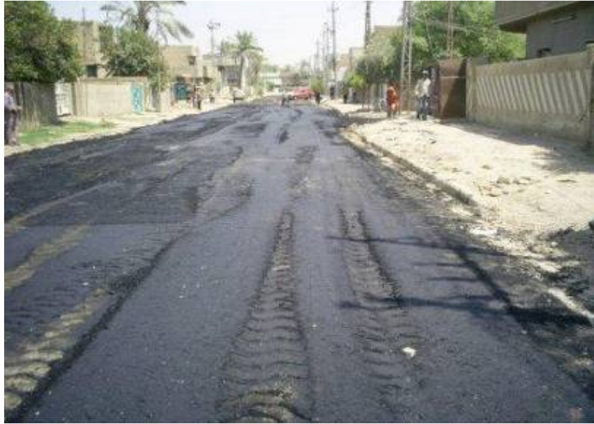
Site Photo 6. Preparing base for asphalt concrete pavement