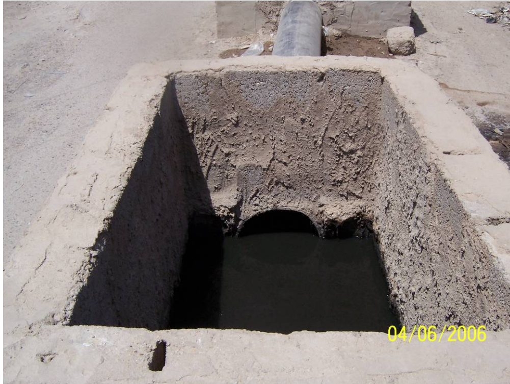
Site Photo 4. Constructed new manhole