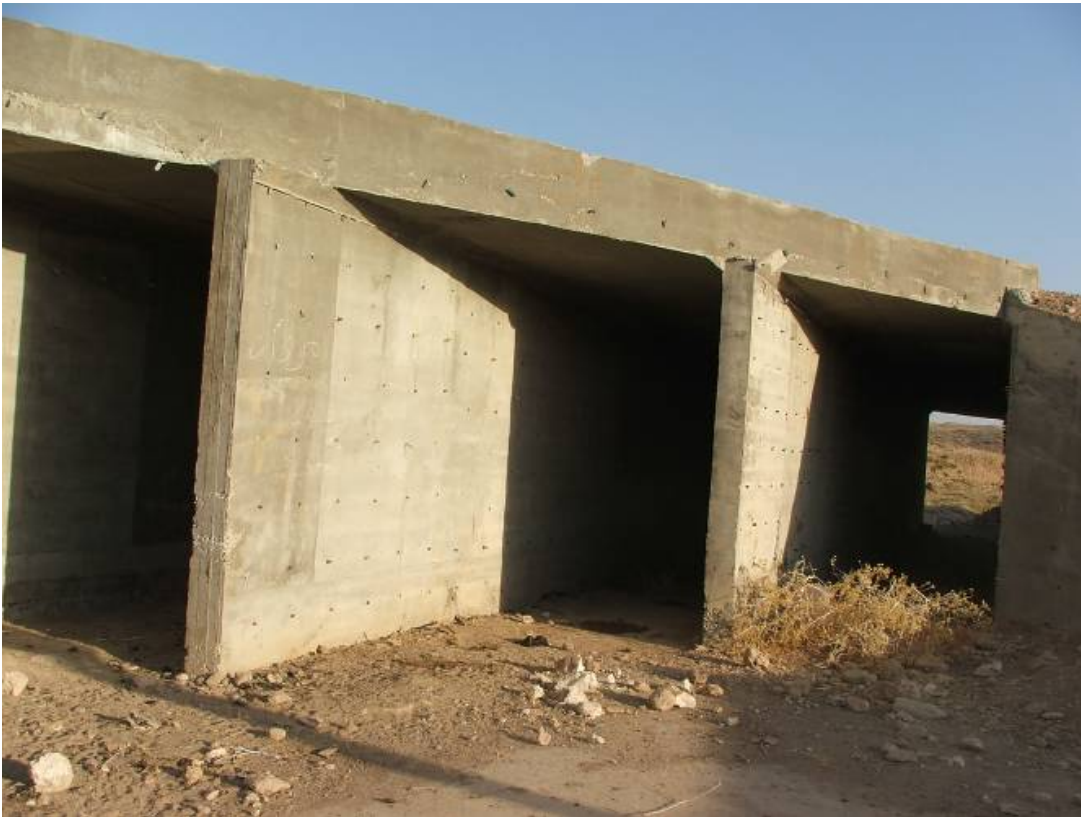
Site Photo 15. Box culverts for new road.

During our site visit, we did not detect any instances of incomplete road construction. The constructed road and box culverts are shown in Site Photos 15 and 16.