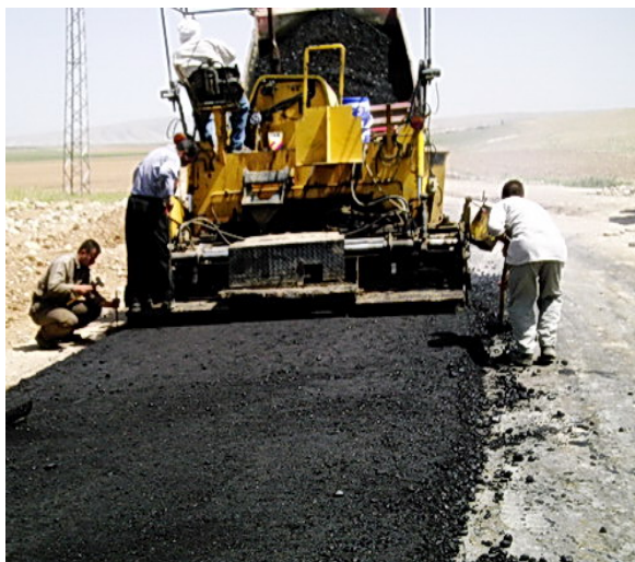
Site Photo 13. Top coat asphalt laying.

Site Photo 13 documents the top-coat of asphalt being laid for the new road. Finally, the completion of the newly constructed road with shoulders is shown in Site Photo 14.