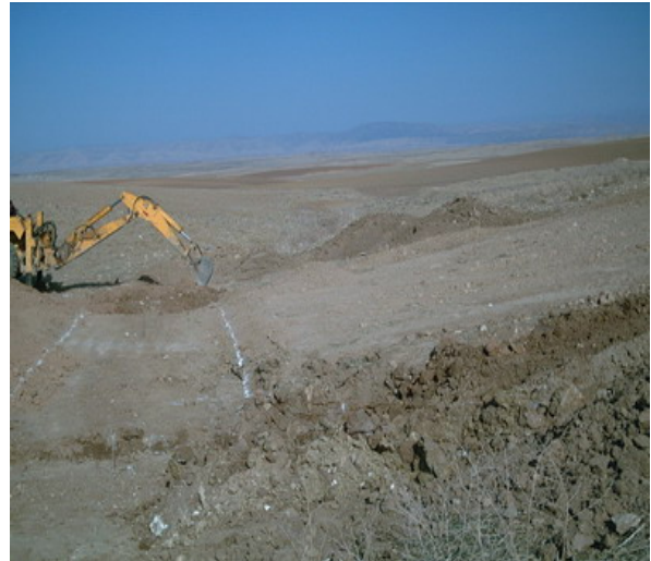
Site Photo 4. Road excavation, leveling, and marking (Photo courtesy of USACE).