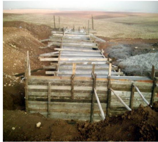
Site Photo 9. Box culvert construction.