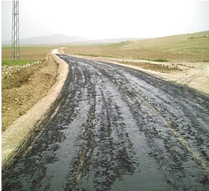
Site Photo 7. Tack coat.

The box culverts documented in the quality assurance (QA) reports were constructed as cast-in-place reinforced concrete structures. Site Photo 8 shows the culvert concrete testing. The box culvert construction, and reinforced steel application for the top slab prior to concrete placement are shown in Site Photos 9 and 10.