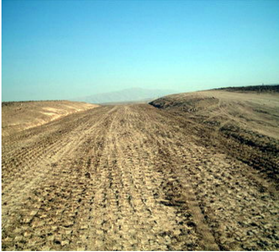
Site Photo 5. Road compaction (Photo courtesy of USACE).