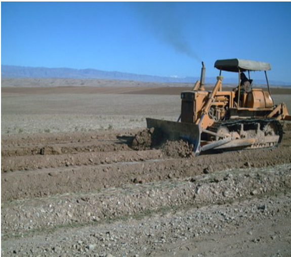
Site Photo 3. Road excavation.