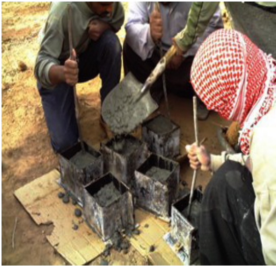
Site Photo 8. Culvert concrete testing (Photo courtesy of USACE).