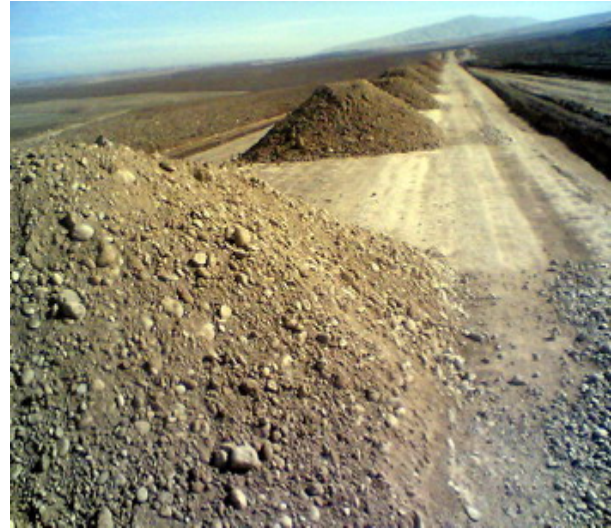
Site Photo 6. Sub-base material.