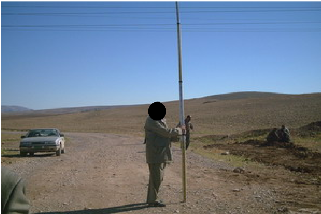
Site Photo 1. Existing road condition prior to construction

Although the assessment team could not verify the actual number of each type of culvert, we utilized the quality assurance reports to review the construction of the culverts.