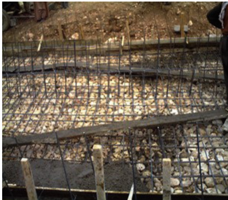
Site Photo 10. Box culvert reinforced steel (Photo courtesy USACE).

Based on our review of the QA reports, it appeared the reinforced concrete pipe culverts were constructed in the following manner: