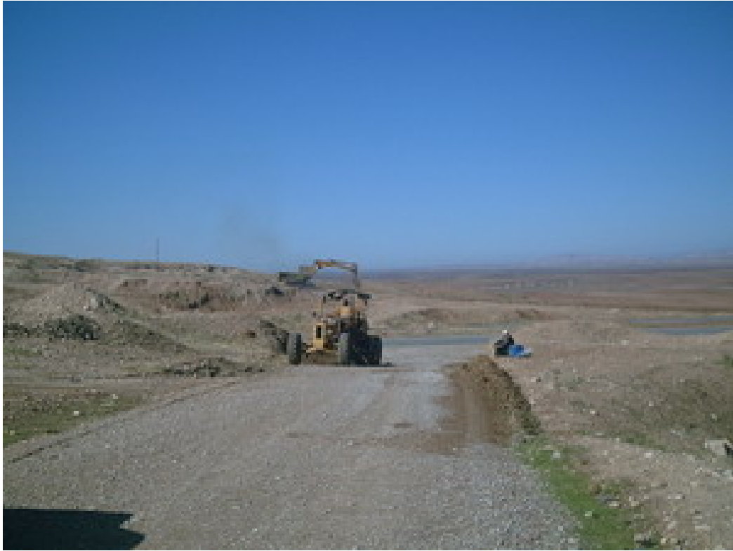
Site Photo 2. Removal of excess road material