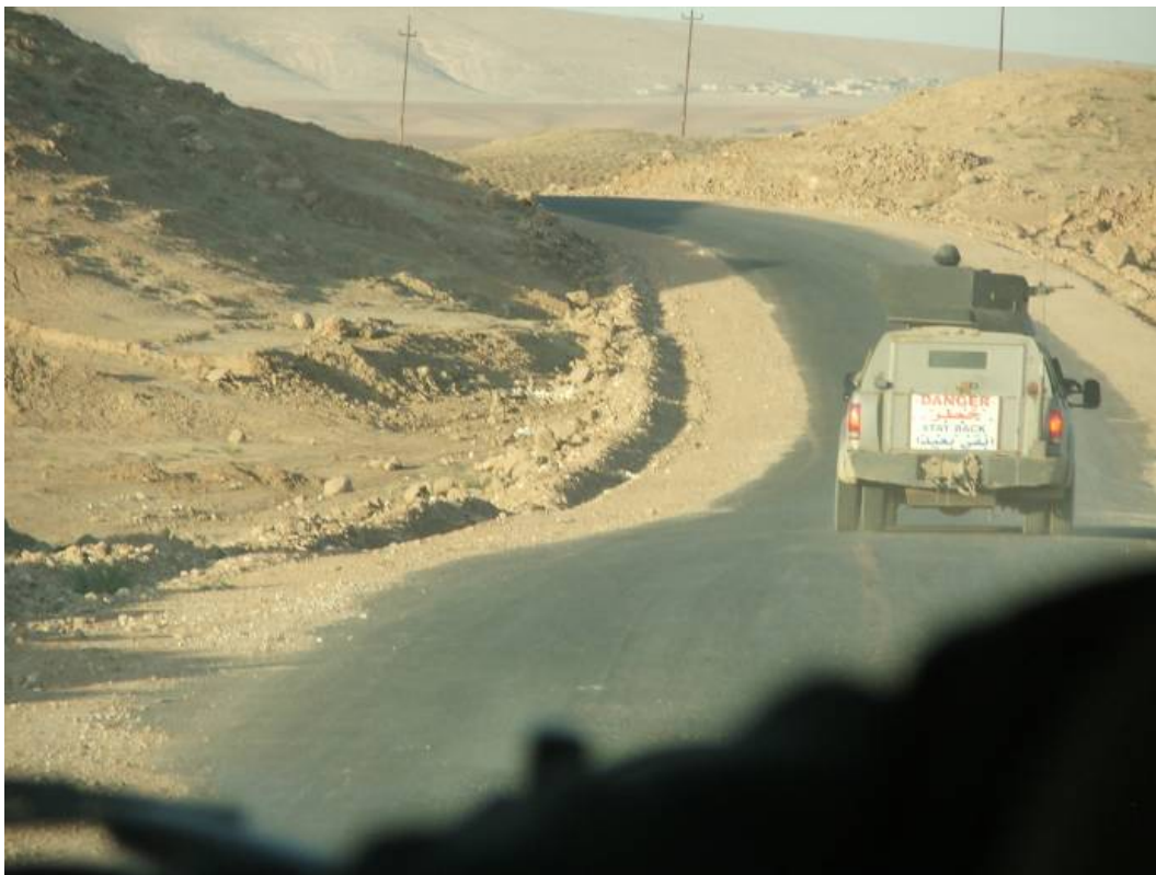
Site Photo 16. New road in use.