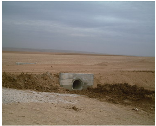
Site Photo 12. Completed pipe culvert (Photo courtesy of USACE).

Site Photo 13 documents the top-coat of asphalt being laid for the new road. Finally, the completion of the newly constructed road with shoulders is shown in Site Photo 14.