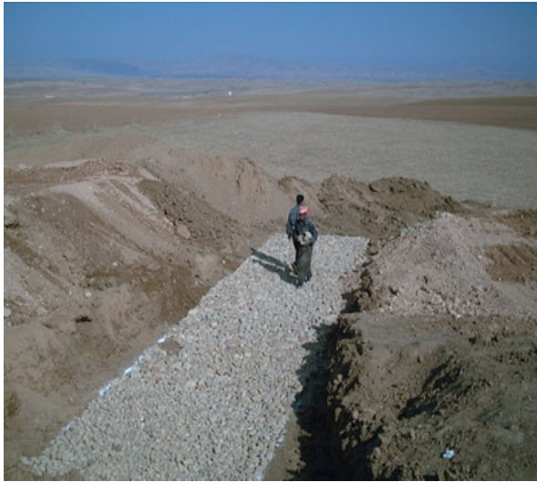
Site Photo 11. Trench excavated for pipe culvert.

Site Photos 11 and 12 show part of the construction process noted above.