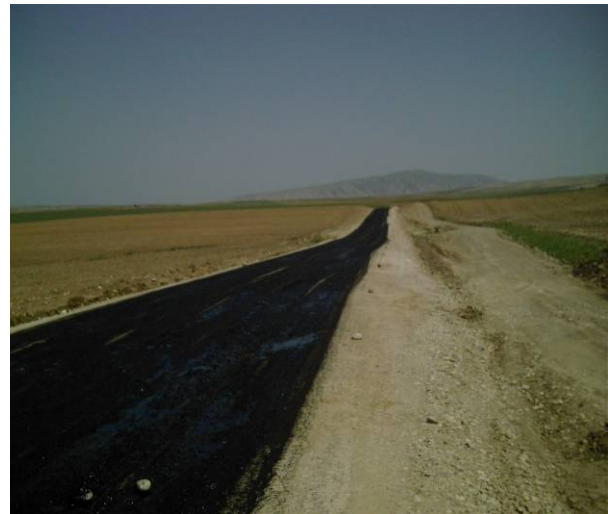
Site Photo 14. Completed asphalt road with shoulders.