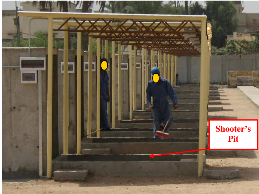
Site Photo 8. Shooter's pit at rifle firing tubes

The reinforced concrete shooter's pit at the end of the firing tube was below grade so that the pit floor was 0.75 m below the floor of the firing tube. The outside dimensions of the pit were 2 m wide by 3 m long, and the pit was covered with a metal cover supported by truss frame and four steel posts. The shooter's pit contained an overhead fluorescent light fixture as well as an exterior light mounted to the outside of the metal cover frame.