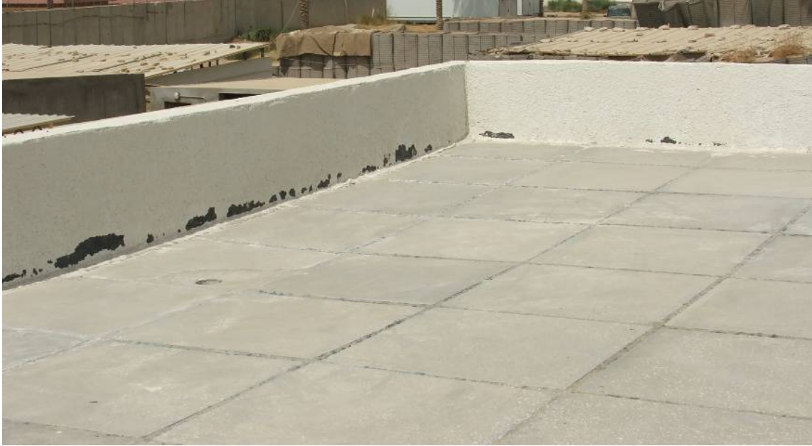
Site Photo 2. Range control building roof

The interior of the range control building included the rooms as shown in the floor plan. The rooms contained mosaic tile flooring except for the bathrooms which had a ceramic tile floor. The rooms contained suspended acoustical tile ceilings, although the armory's ceiling was plastered and painted. In addition, except for the bathrooms, the walls in each room were plastered and painted. In the bathroom, the walls were finished with ceramic tile. The contractor had installed security bars on each window and a steel door in the armory room. The contractor had also installed two-ton split system heating, ventilation, and air conditioning units (HVAC) for most rooms, augmented by ceiling fans and exhaust fans.