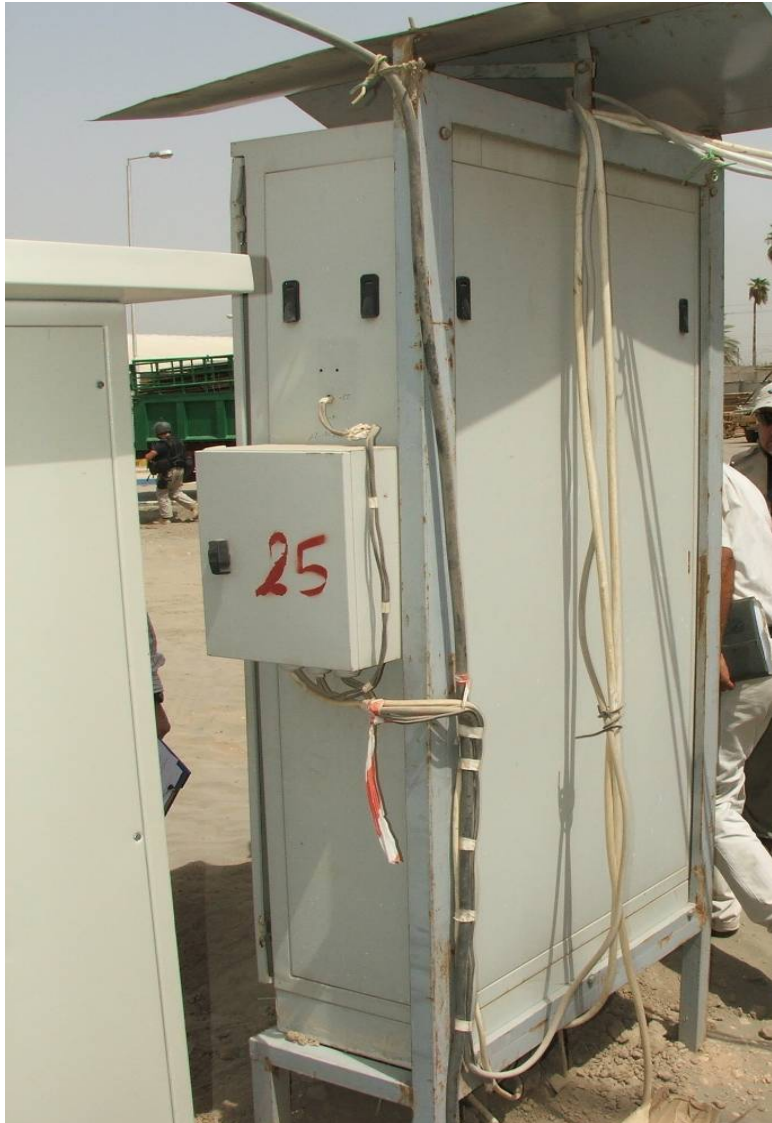
Site Photo 12. Rear side of electrical panel