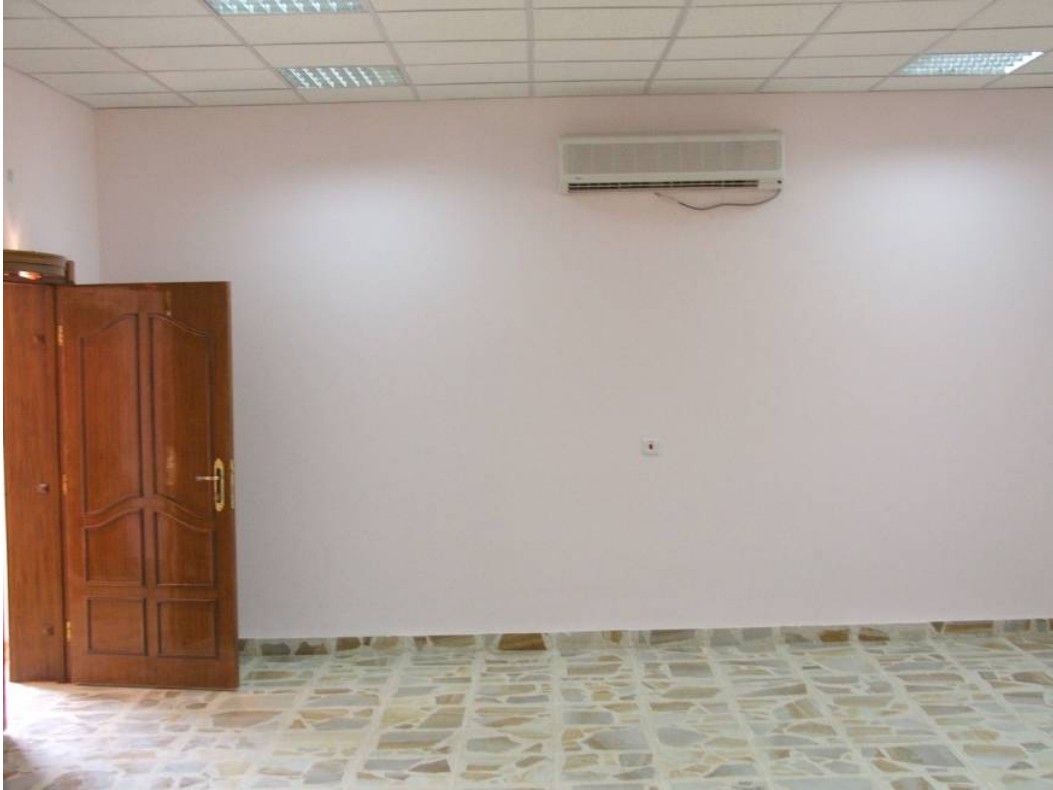
Site Photo 3. Range control building waiting room