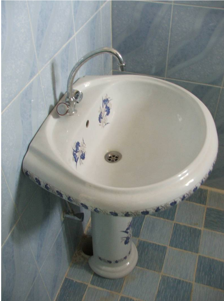
Site Photo 5. Wash basin and tile work in one of the range control building bathrooms