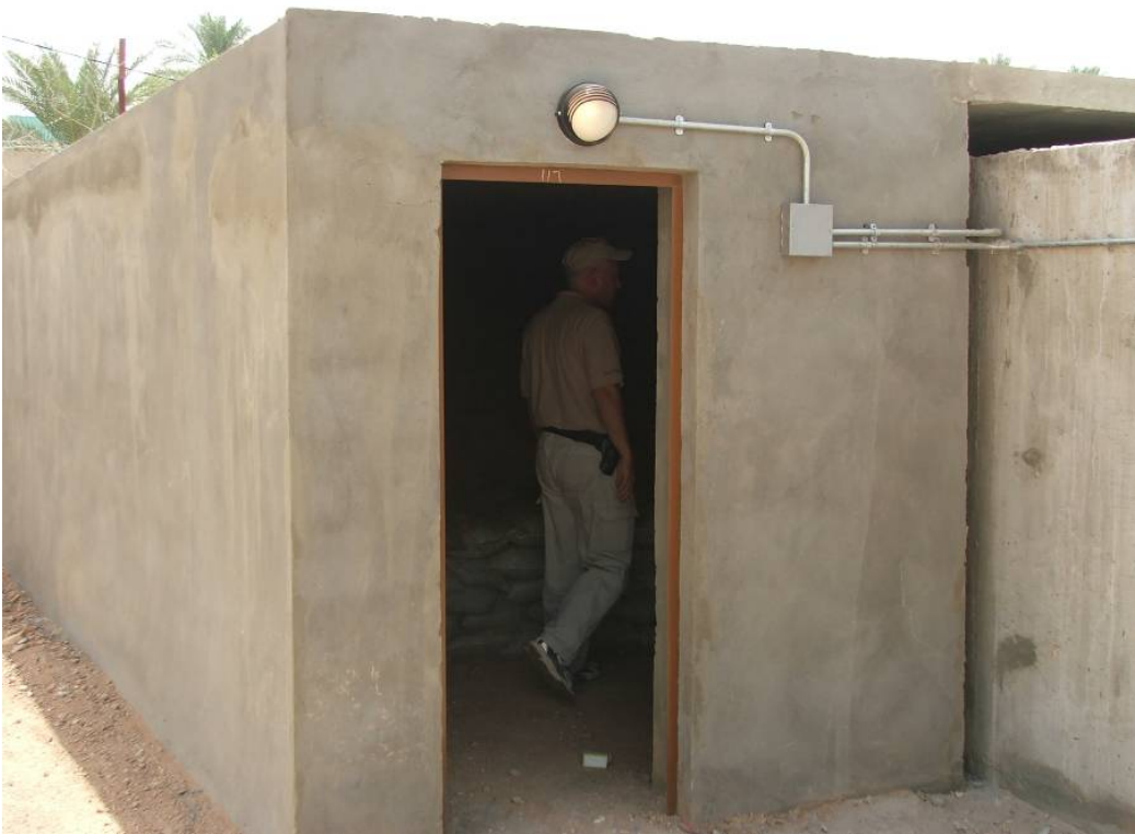
Site Photo 7. Target enclosure entrance