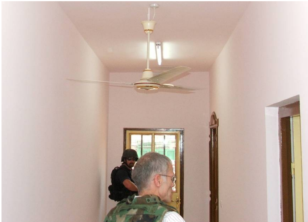
Site Photo 4. Hallway in range control building