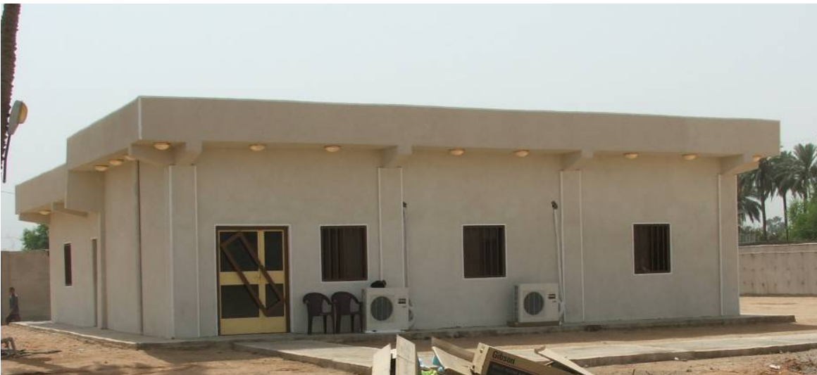
Site Photo 1. Range control building

We inspected each room of the building (Site Photo 1) as well as the exterior and the roof. The building's exterior walls were plastered, textured, and painted. A concrete walkway was constructed around the perimeter in accordance with the design.