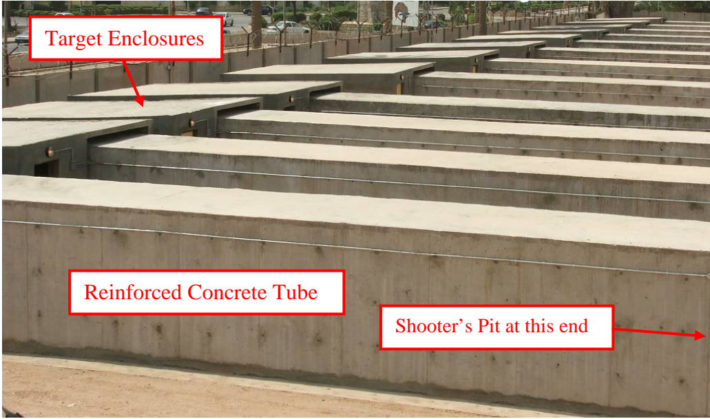
Site Photo 6. Rifle firing tubes