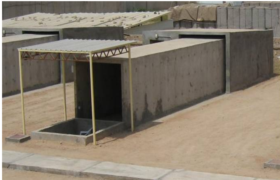
Site Photo 10. One of the 12 pistol firing tubes

The design for the pistol firing tubes was similar to the rifle firing tubes except the reinforced concrete tube length was 10 m. Site Photo 10 shows one of the 12 pistol firing tubes. During our inspection, we verified the correct dimensions associated with the pistol firing tubes. The construction appeared to meet contract requirements.