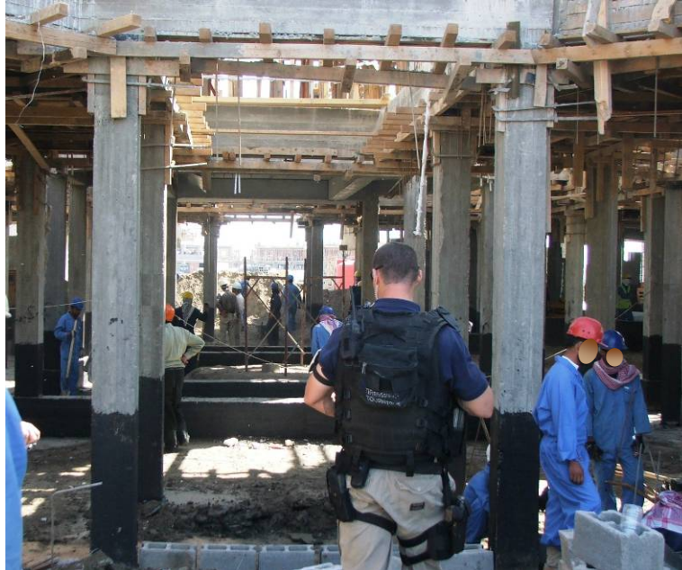
Site Photo 5. Central core area under construction in inmate housing building

The four wings of each inmate housing unit connect to a central core area located on the ground level. The central core area contained a control room and control stations for each wing, a medical office, a pharmacy, rooms for a barber shop, and a commissary for prisoners. At the time of our site visit, the work in this area involved preparing the soil base for the floor slab and interior block wall construction. Site Photo 5 shows the central core area construction in one of the inmate housing units.