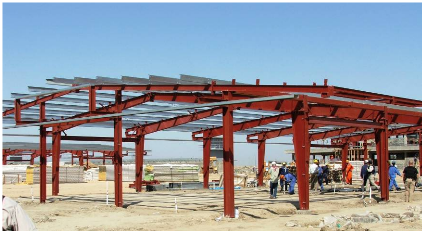
Site Photo 9. Maintenance building structural frame; workers installing under-slab conduit

The maintenance building is another pre-engineered building with a similar foundation and structural design as the visitation centers and the intake/release/medical building. The 38 m x 17.1 m maintenance building included a vehicle maintenance area, workshops, as well as equipment and material storage rooms. When we inspected the maintenance building, workers were preparing the floor slab sub-base and installing PVC electrical conduit and PVC sewer pipe prior to the floor slab being poured. Site Photo 9 shows the work activity taking place at the maintenance building. The work we observed appeared to be consistent with the requirements of the design.