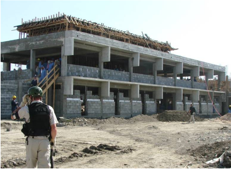
Site Photo 2. Exterior view of one of the four wings of an inmate housing unit