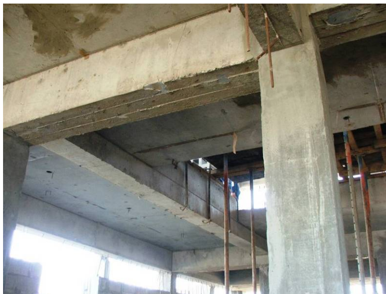
Site Photo 6. Structural concrete frame for inmate housing building, second level

The quality of workmanship exhibited in both inmate housing areas was good. The structural concrete we observed did not have any noticeable cracking, segregation or honeycomb areas. Site Photo 6 shows the reinforced concrete workmanship in one of the inmate housing units. In addition to the structural concrete, the block wall construction also appeared to meet the requirements of the design drawings and specifications.