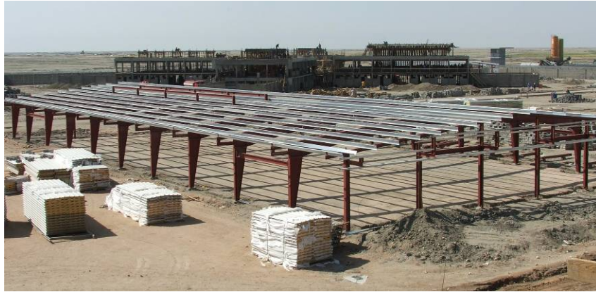
Site Photo 10. Kitchen and laundry building structural frame

constructed and most of the structural steel frame erected as shown in Site Photo 10. Due to time constraints, we did not inspect the kitchen and laundry building other than to verify its location and current construction status.