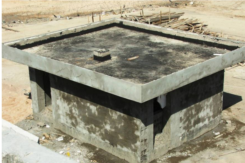
Site Photo 14. The prison armory

The other prison facilities under construction we did not inspect were the access road and the visitor/employee parking lot. The 160-space parking lot was not complete, although the traffic islands, curbing, and pavement base were constructed. As a result of delays caused by the shortage of asphalt, paving operations had not started. For a picture of the parking lot islands, curbing and base preparation, refer to Site Photo 15.