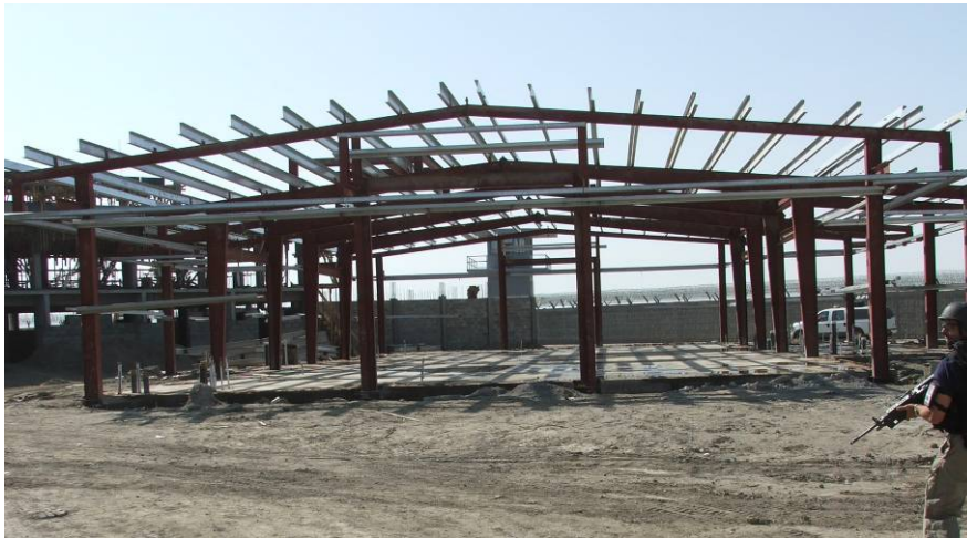
Site Photo 7. Structural frame for visitation center building

A visitation center was co-located with each inmate housing unit. Visitation centers were separate structures adjacent to an inmate housing unit. They were designed as one story, pre-engineered metal buildings, approximately 20.7 m by 32 m in size. The design required a foundation consisting of isolated reinforced concrete pad footings (2 m x 2 m) supporting reinforced concrete column pedestals (400 mm x 400 mm) and the reinforced concrete grade beams around the building perimeter. The concrete pedestals were designed to support the pre-engineered building's structural steel columns, and the grade beams supported the building's exterior walls. At the time of our site visit, both visitation centers had complete foundations and concrete floor slabs, and most of the structural steel frame (steel columns, roof joists, etc.) on each center had been erected. Utility (sanitary and electrical) pipe and conduit were also installed under the concrete slab and stubbed up through the slab. During the site visit, we did not observe any defects with the quality of the visitation center construction. Site Photo 7 shows the construction on one of the two visitation centers.