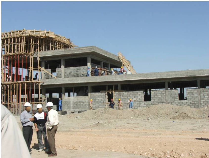
Site Photo 12. Exterior wall construction on the 2nd story of the administration building

The administration building structural design required a reinforced concrete frame supported by a reinforced concrete foundation consisting of a combination of isolated pad footers and continuous spread footers. The exterior walls, similar to the inmate housing units were designed as cavity walls consisting of an inner 200 mm block wythe, horizontally and vertically reinforced, anchored to an outer 100 mm block wythe. Within the cavity between the walls, the design called for 50 mm of insulation board, and a finish coating of cement plaster and paint on the interior and exterior side of the wall. At the time of our assessment, workers were installing conduits and PVC pipe on the ground floor as well as constructing exterior block walls, and installing forms for window and door lintels. Site Photos 12 and 13 show construction work taking place on the exterior and interior of the building during our inspection.