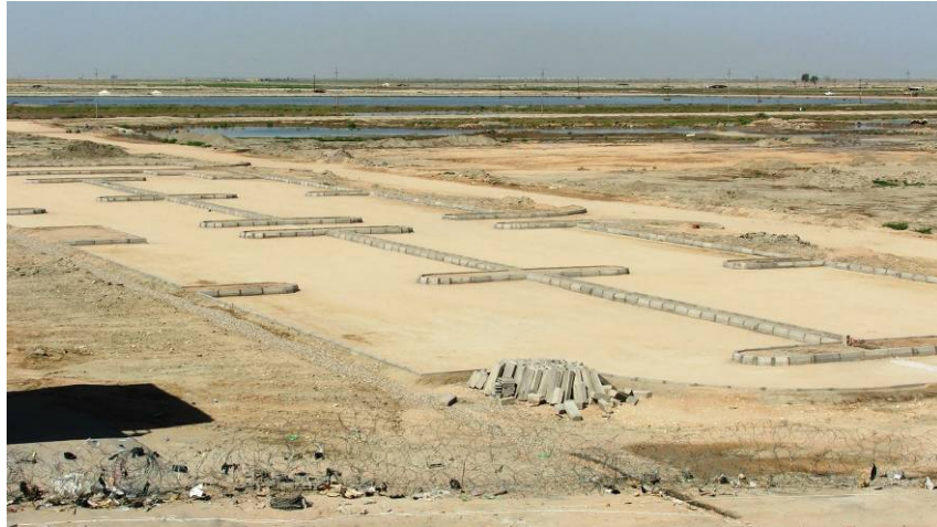
Site Photo 15. Prison parking lot ready for paving

The other prison facilities under construction we did not inspect were the access road and the visitor/employee parking lot. The 160-space parking lot was not complete, although the traffic islands, curbing, and pavement base were constructed. As a result of delays caused by the shortage of asphalt, paving operations had not started. For a picture of the parking lot islands, curbing and base preparation, refer to Site Photo 15.