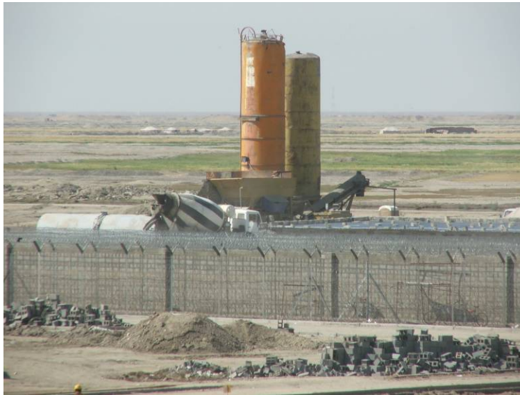
Site Photo 16 Primary and secondary batch plants

During construction, the contractor stated they utilized a primary and a secondary batch plant for on-site batching of concrete. Site Photo 16 shows the primary plant, located just outside the prison perimeter wall. The use of the concrete batch plants appear to have contributed to more consistent concrete quality.