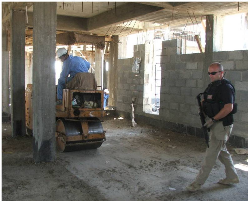
Site Photo 4. Ground floor soil base being compacted

Each inmate cell is designed for two persons, with a sink, an eastern style toilet, a shower, and two beds consisting of a 750 mm by 1800 mm concrete pad on the cell floor as one bed and the other being a wall mounted 750 mm x 1800 mm steel bed frame. The design also required an exercise area at the end of each wing, partially covered with a pre-engineered metal roof structure. Plumbing work had not started yet, so we did not observe any interior finishes within the cells. Additionally, on the ground floor in each of the two inmate housing units, the contractor was still preparing the site prior to pouring a 150 mm reinforced concrete floor slab. Site Photo 4 shows one of the workers compacting the ground floor soil base prior to the construction of the concrete floor slab.