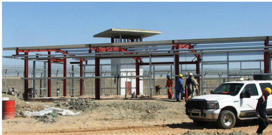
Site Photo 11. Prayer room building structural frame

The 18 m x 10.2 m prayer building architectural design included prayer rooms and ablation facilities. The building is the smallest pre-engineered building at the prison. At the time of the assessment, the prayer building's reinforced concrete footers and column pedestals had been constructed and most of the structural steel frame erected. Utility stub ups were also in place in the floor slab base. Site Photo 11 shows the construction status of the prayer building. We did not closely inspect the building other than to verify its location and current construction status.