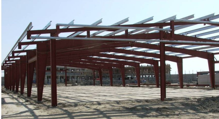
Site Photo 8. Intake/release/medical building structural frame