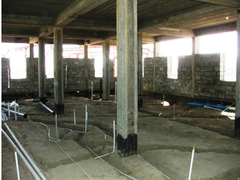
Site Photo 13. Under-slab PVC conduit and pipe being installed in administration building

We also toured the roof area of the administration building. The roof design required a built up roof consisting of the reinforced concrete roof slab, three felt layers, hot-mopped to serve as a waterproofing membrane, insulation board, two layers of sand and soil to level the roof for drainage, and a cover of concrete roofing tiles, sealed with mastic joints. The built up portion of the roof had not started, but the roof slab and parapet were completed. Also, concrete bases to support the roof top heating, ventilation, and air conditioning (HVAC) units were in place as well as utility stub-ups for HVAC units.