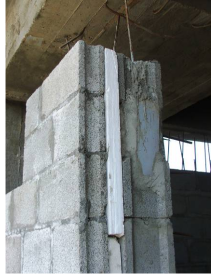
Site Photo 3 – Exterior cavity wall

Each inmate cell is designed for two persons, with a sink, an eastern style toilet, a shower, and two beds consisting of a 750 mm by 1800 mm concrete pad on the cell floor as one bed and the other being a wall mounted 750 mm x 1800 mm steel bed frame. The design also required an exercise area at the end of each wing, partially covered with a pre-engineered metal roof structure. Plumbing work had not started yet, so we did not observe any interior finishes within the cells. Additionally, on the ground floor in each of the two inmate housing units, the contractor was still preparing the site prior to pouring a 150 mm reinforced concrete floor slab. Site Photo 4 shows one of the workers compacting the ground floor soil base prior to the construction of the concrete floor slab.