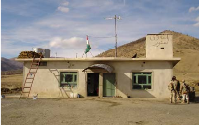
Site Photo 30: Front exterior of border post (Project 20571)