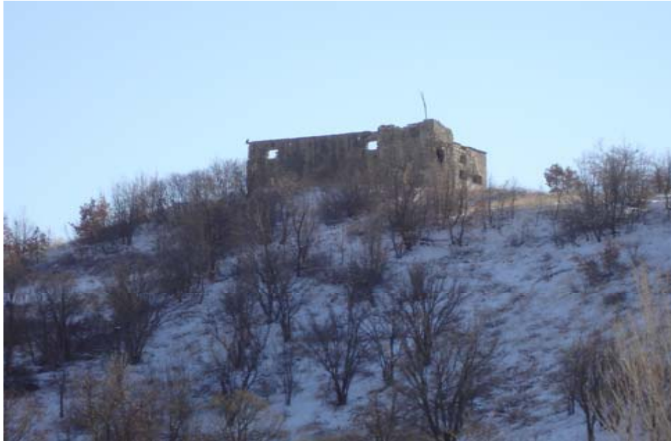
Site Photo 36: Exterior view of border post - Project 20574