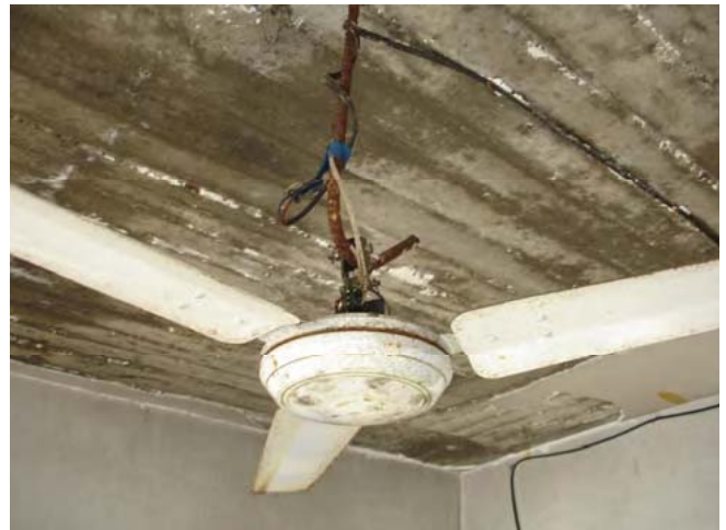
Site Photo 27: Ceiling fan with exposed wiring (20558)