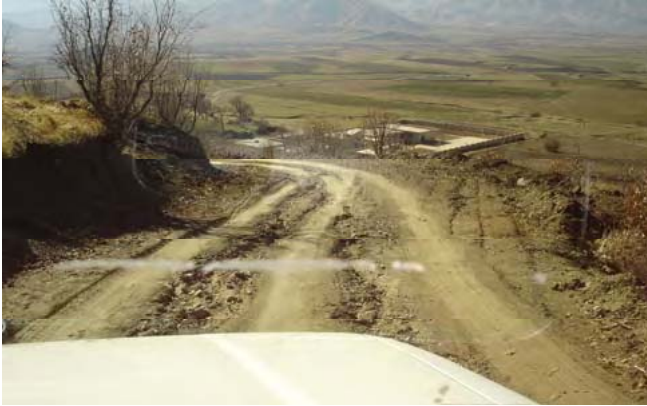
Site Photo 11: Access road (Project 12827)