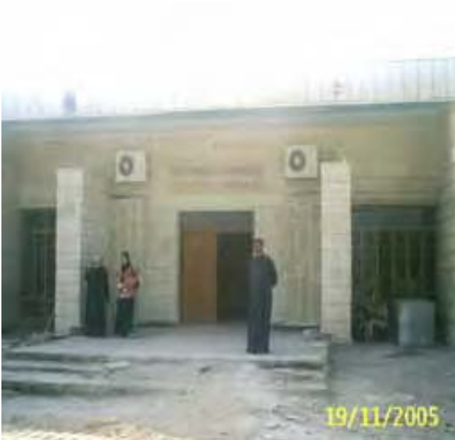
Site Photo 84: Front entrance of train station (Project 21263)