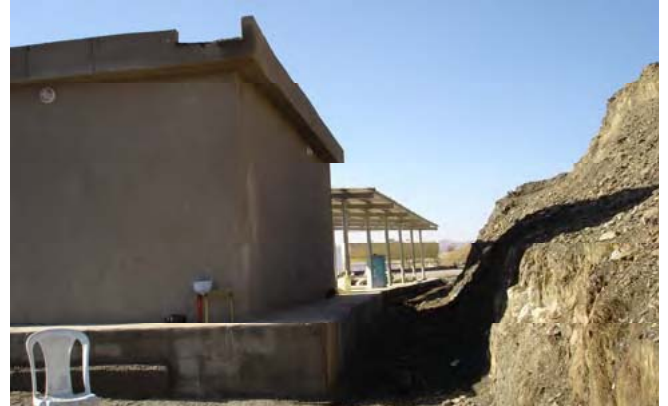
Site Photo 12: Cut bank behind jail facility (Project 12827)