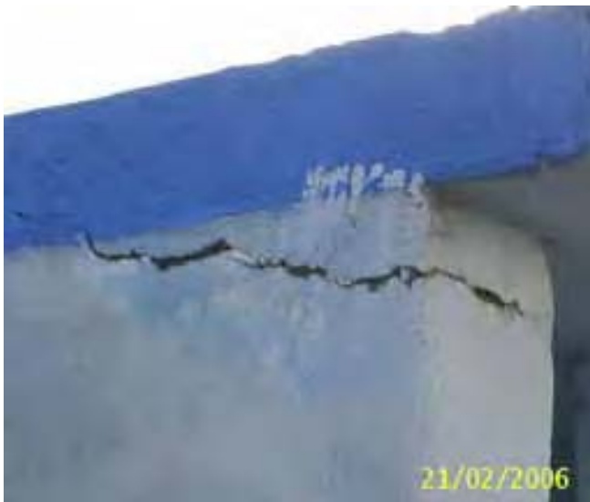
Site Photo 80: Cracks in exterior walls (Project 19230)