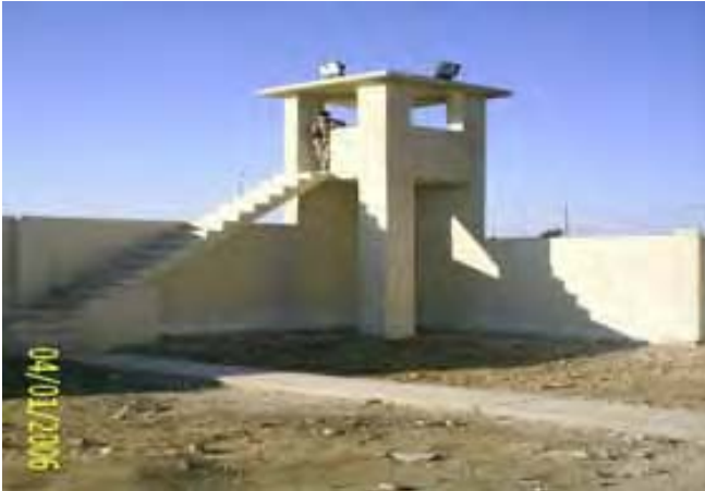
Site Photo 70: Corner guard post and perimeter walls (Project 19179)

improper electrical connections. Site Photo 72 shows exterior electrical wiring located on the ground surface and Site Photo 73 shows interior lights with possible fire damage.