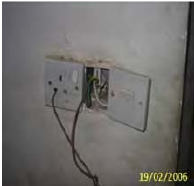
Site Photo 66: Electrical wall switches (Project 19175)