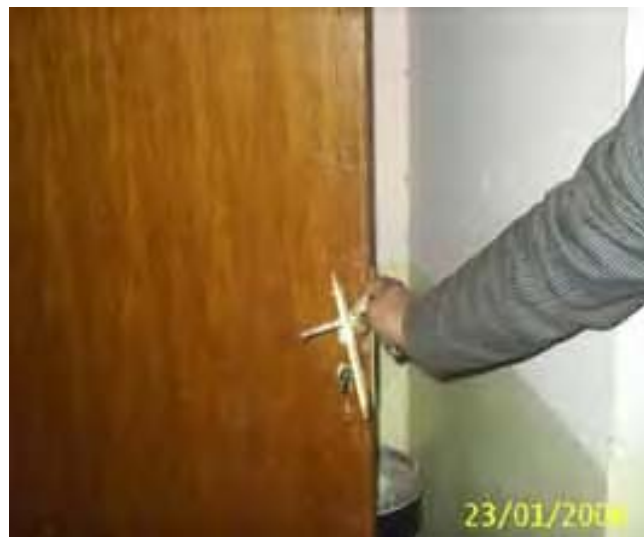
Site Photo 83: Broken door handle (Project 20324)