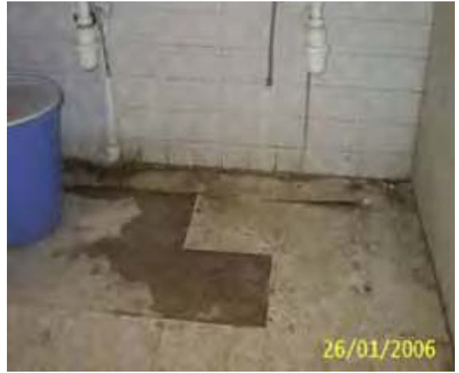
Site Photo 52: Damaged tile in bathroom (Project 16124)