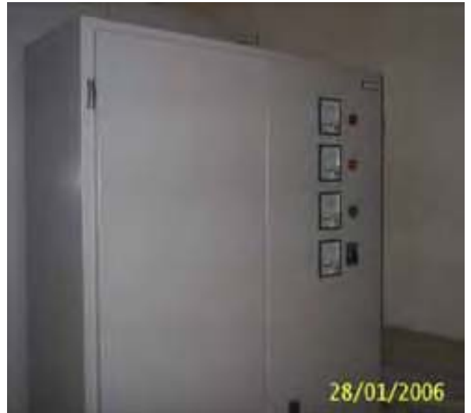
Site Photo 57: Electrical controls (Project 11913)