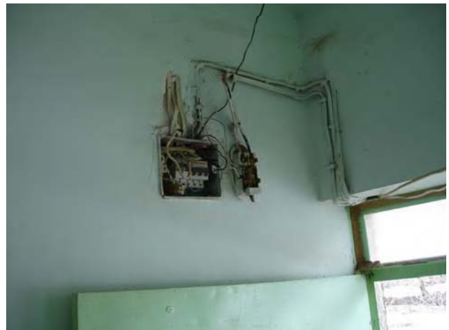
Site Photo 42: Interior electrical panel (Project 20577)