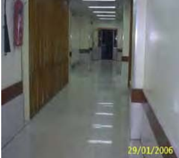
Site Photo 47: Renovated hallway floor tiles (Project 10309)