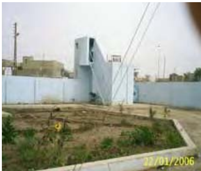
Site Photo 60: Perimeter security walls and corner guard (Project 18334)

The IRMS database listed the project as 100 percent complete on 27 July 2005. The project included new construction of four guard towers, a parking lot, and an officer's room and renovation work. Site Photo 60 shows one of the corner guard posts. A new 63 KVA generator with two fuel tanks was on site. Discrepancies noted during the site visit included electrical and plumbing systems. Electrical panels were exposed, and an electrical outlet showed possible signs of recent fire damage. Site Photo 61 shows the fire damaged electrical outlet.