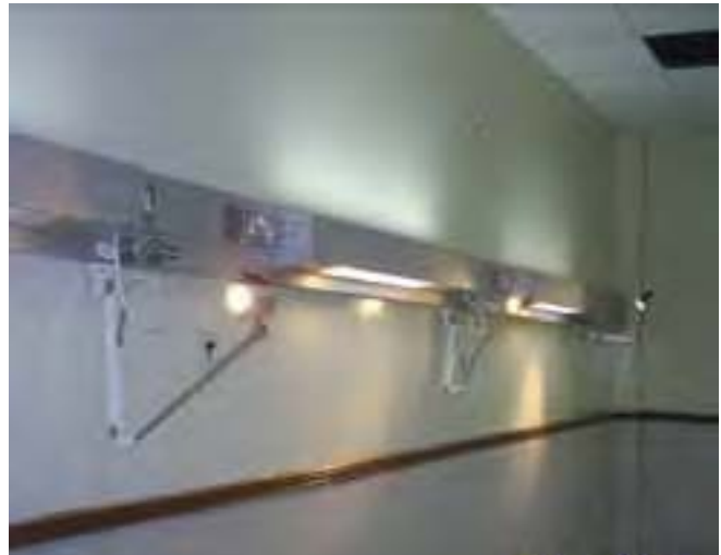
Site Photo 50: Lighting system (Project 10309)