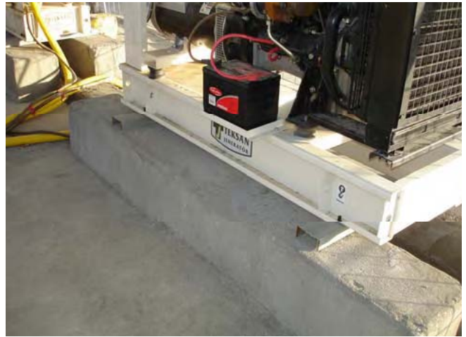
Site Photo 21: Generator on concrete base (Project 12850)