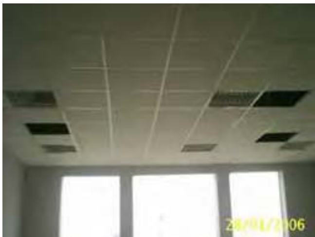
Site Photo 58: Suspended ceilings (Project 11913)