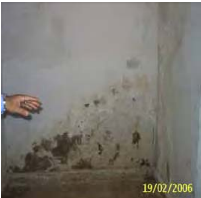
Site Photo 68: Interior wall with peeling paint (Project 19175)