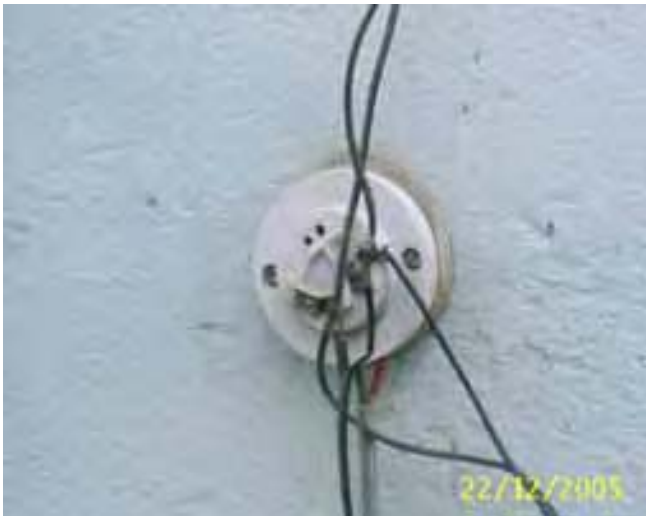
Site Photo 76: Exposed electrical wirings (Project 19189)