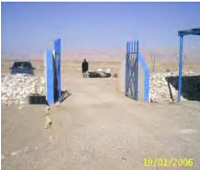
Site Photo 1: Perimeter security berm and entrance gate (Project 12826)

A review of the report and photos provided by the QC/QA teams determined that overall, the site associated with Task Order 0034, Project 12826, appeared to be complete and consistent with contract requirements. A perimeter berm surrounded the post and a gate was located at the entrance. Site Photo 1 shows the perimeter security berm and entrance gate. The site also contained the border post, jail facility, two electrical generators and fuel tank mounted on a concrete pad, covered parking area, and water tanks set on a concrete base. Site Photo 2 shows the exterior side of the border post.