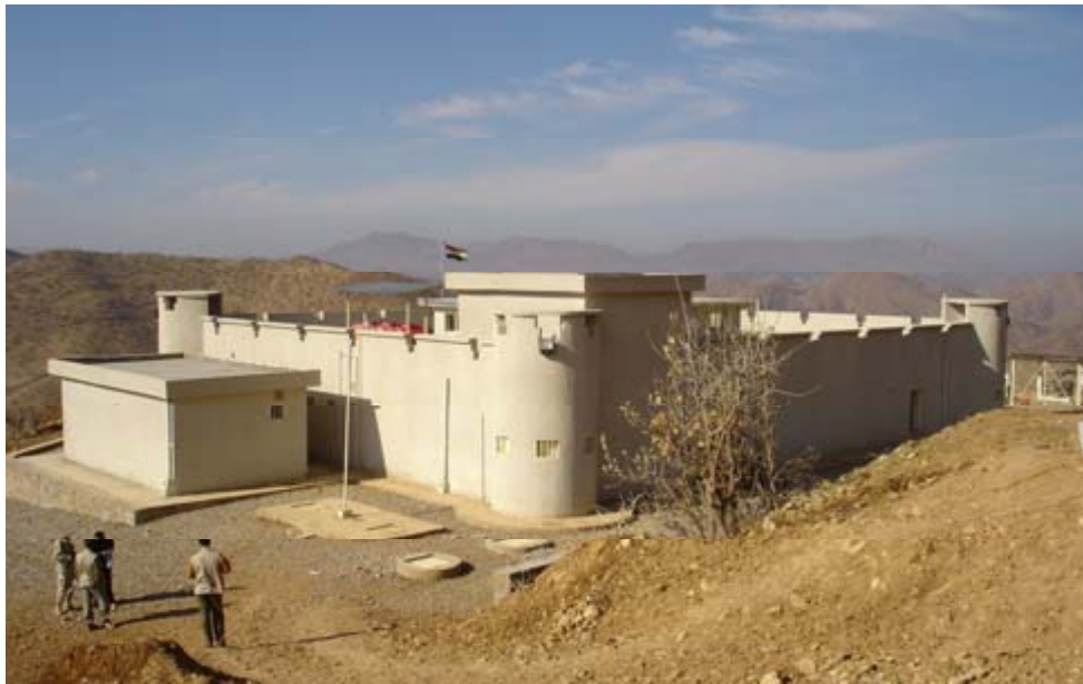
Site Photo 19: Exterior view of border post – Project 12836