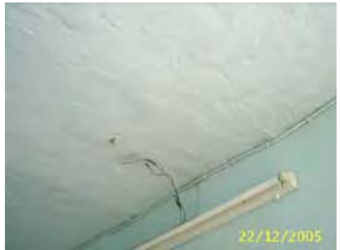
Site Photo 77: Roof and inconsistent ceiling texture (Project 19189)