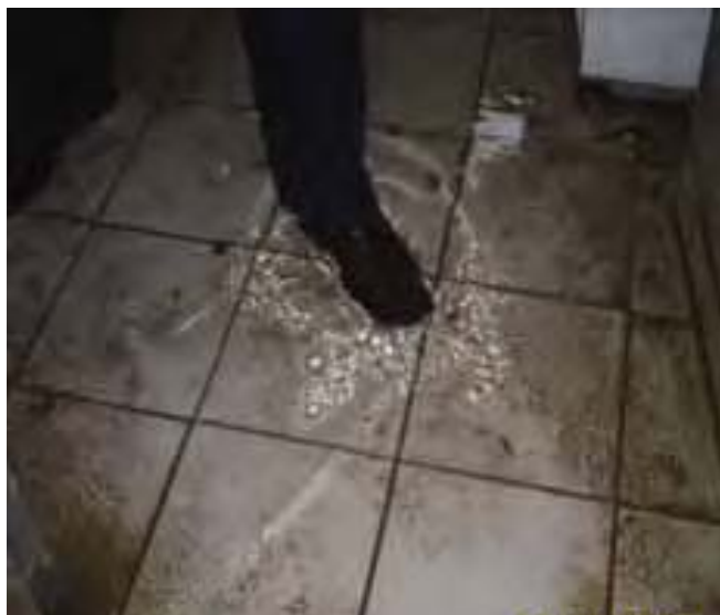
Site Photo 82: Pooled water on bathroom floor (Project 20324)