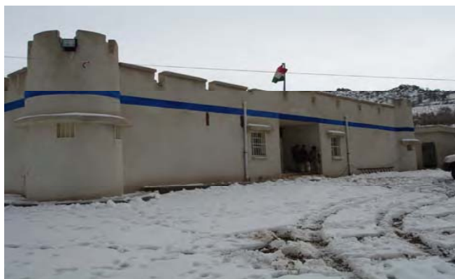
Site Photo 24: Front exterior of border post (Project 12884)