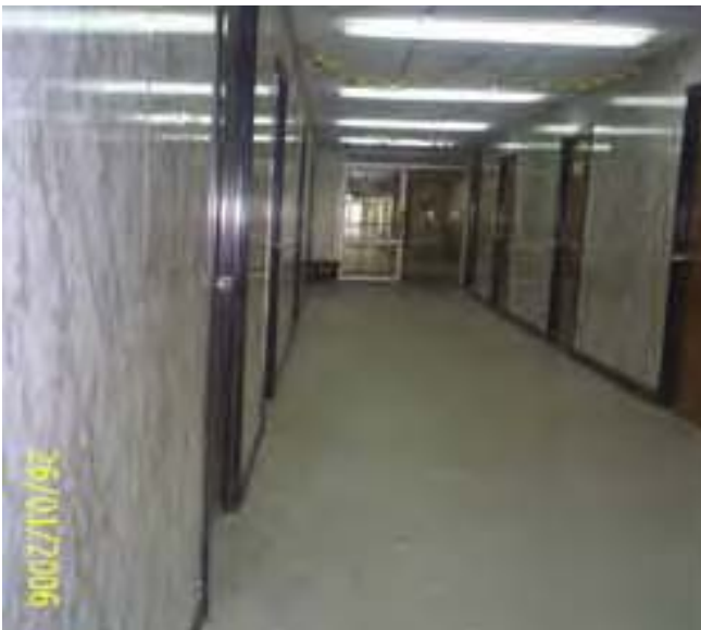
Site Photo 54: Lighting system (Project 19873)