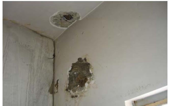
Site Photo 29: Holes in wall of kitchen area (Project 20570)