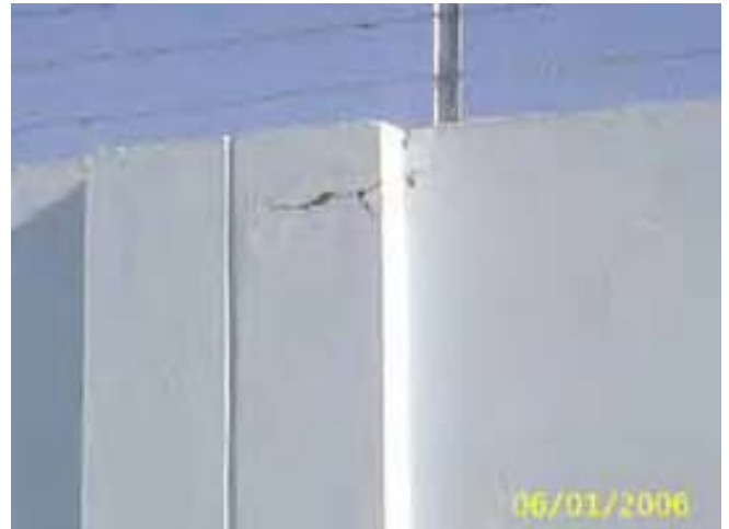
Site Photo 63: Crack in perimeter wall (Project 19111)