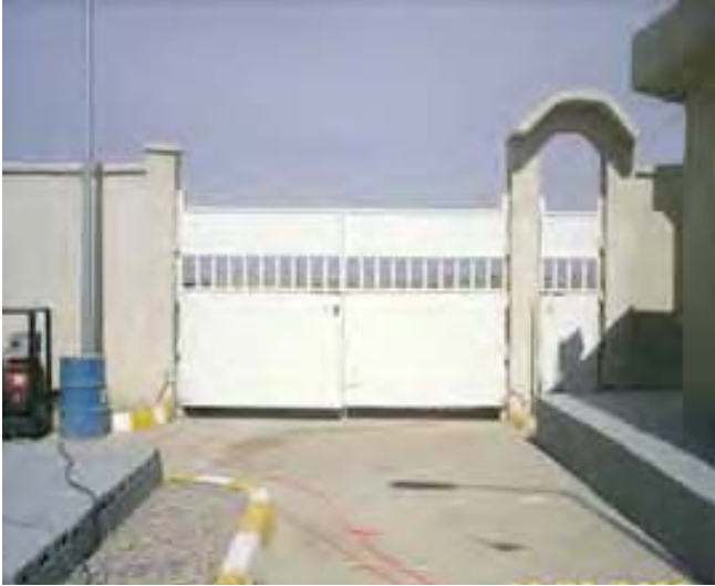
Site Photo 43: Front entrance gate (Project 1861)