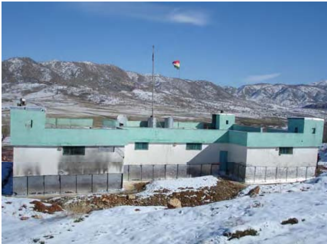
Site Photo 34: Exterior view of border post (Project 20573)