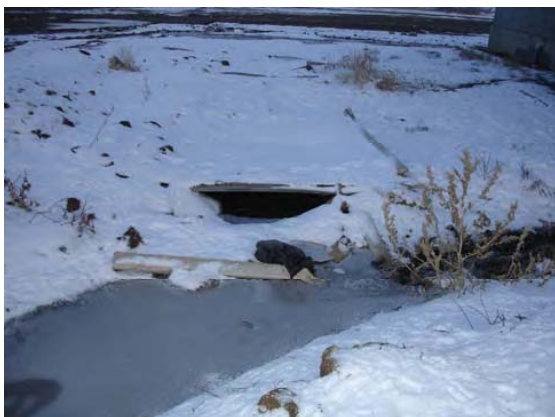
Site Photo 37: Sewage overflow area (Project 20575)