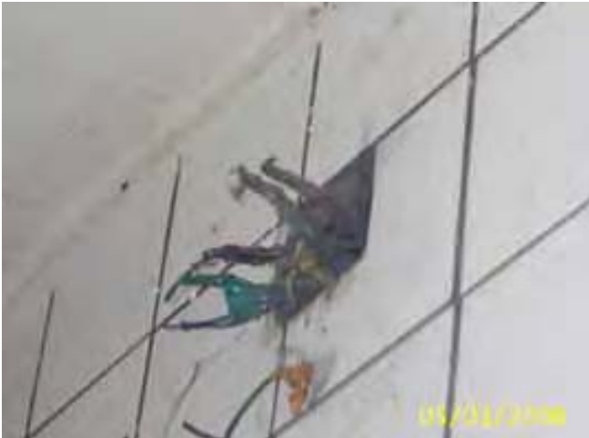
Site Photo 74: Exposed electrical wirings (Project 19181)