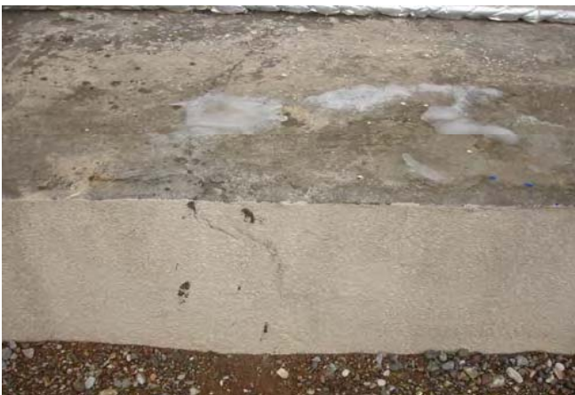
Site Photo 7: Cracks in sidewalk (Project 12807)