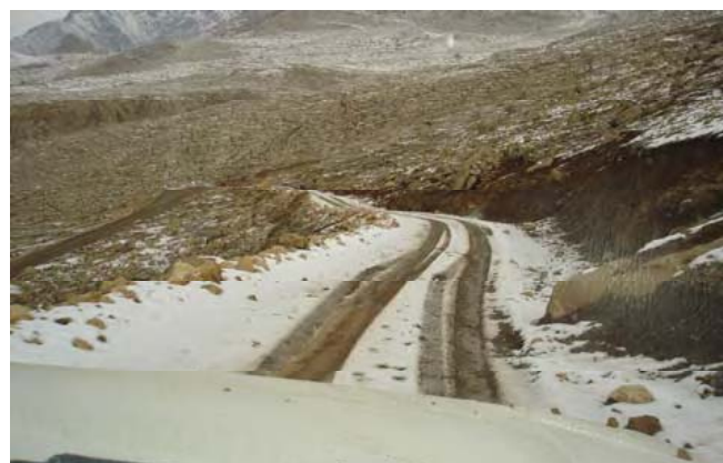
Site Photo 25: Access road (Project 12884)