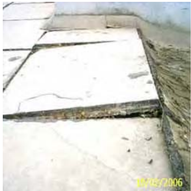
Site Photo 69: Damaged roof tiles (Project 19175)