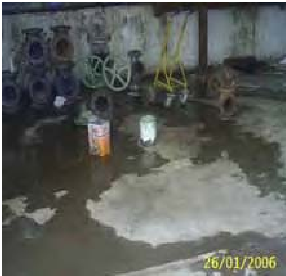
Site Photo 53: Water leaking in hospital basement (Project 16124)