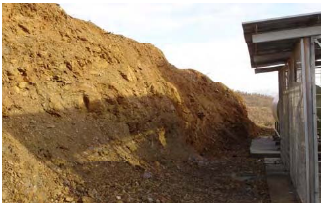
Site Photo 17: Cut bank behind generator without retaining wall (Project 12835)