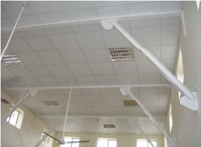
Site Photo 5: Completed structural retrofit (Project 12807)