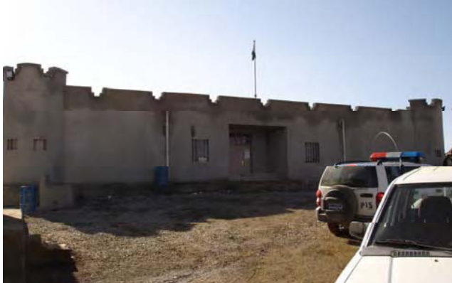
Site Photo 13: Front exterior view (Project 12831)