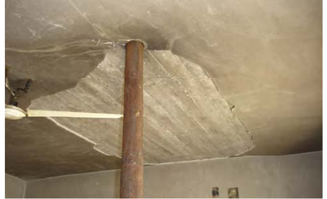
Site Photo 31: Deteriorating plaster ceiling (Project 20571)