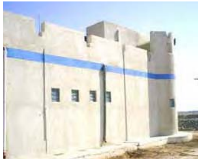
Site Photo 2: Exterior side of border post (Project 12826)