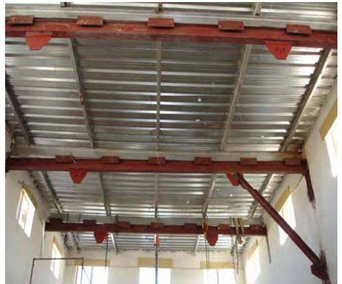
Site Photo 4: On-going structural retrofit (Project 12786)