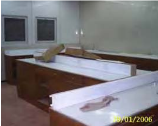
Site Photo 49: Renovated counter tops (Project 10309)