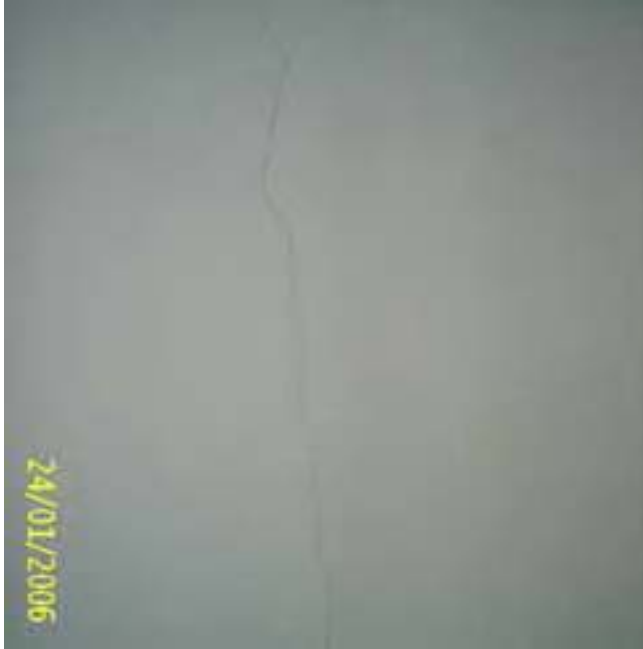
Site Photo 64: Cracks in interior wall (Project 19117)