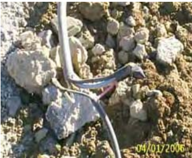
Site Photo 72: Exposed electrical wirings (Project 19179)