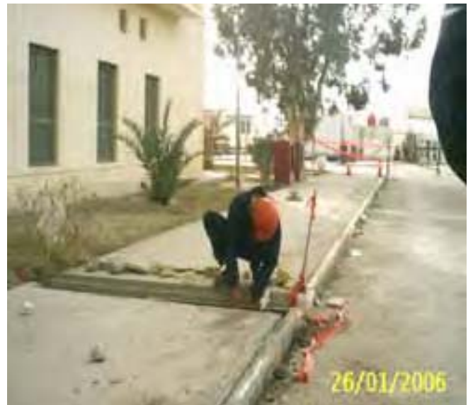
Site Photo 55: Sidewalk repairs (Project 19873)