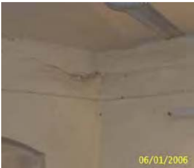
Site Photo 78: Cracks and peeling paint in walls and ceiling (Project 19227)