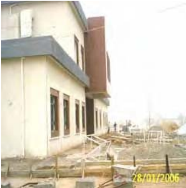
Site Photo 56: Exterior of Clinic (Project 11913)