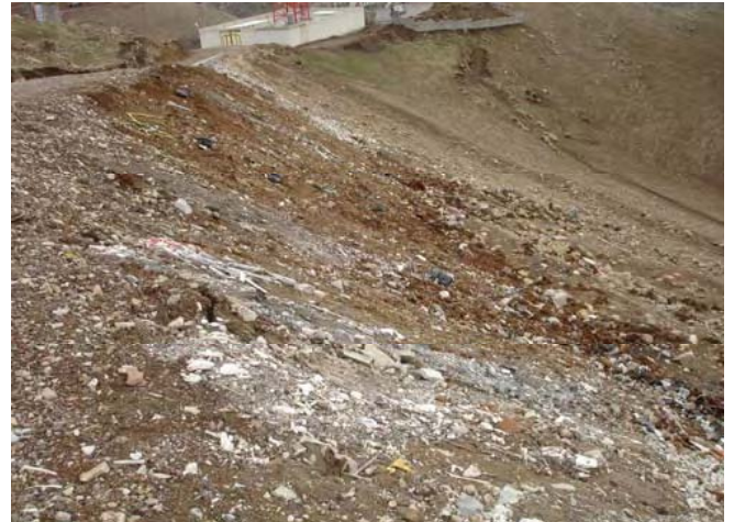
Site Photo 6: Down gradient slope with signs of lateral movement (Project 12807)