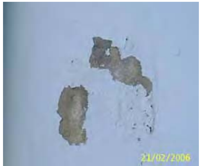
Site Photo 81: Peeling paint in interior walls (Project 19230)