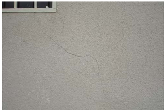
Site Photo 8: 45 degree crack in exterior walls (Project 12807)