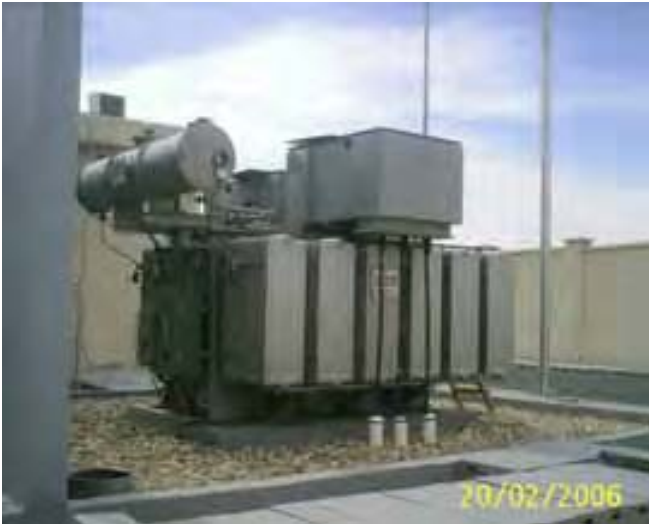
Site Photo 44: Transformer (Project 1861)