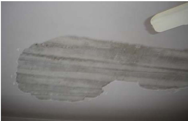
Site Photo 28: Damaged ceiling plaster (Project 20570)