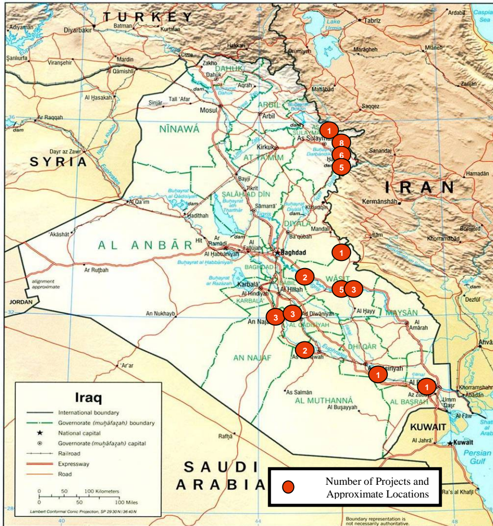
Figure 1: Iraq map indicating selected ground project survey sites