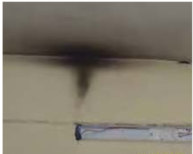
Site Photo 73: Interior electrical light with smoke damage (Project 19179)