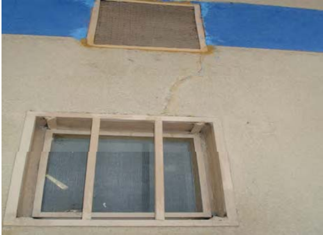
Site Photo 15: 45 degree cracks in exterior wall (Project 12834)