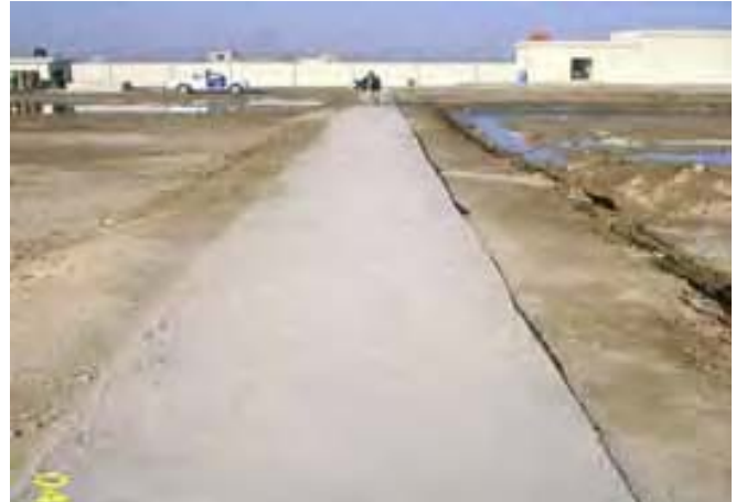
Site Photo 71: Concrete sidewalk (Project 19179)