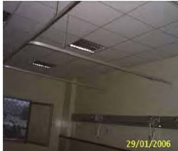
Site Photo 48: Suspended ceiling (Project 10309)