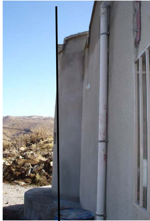
Site Photo 14: Front exterior view showing inward curvature of wall (Project 12831)