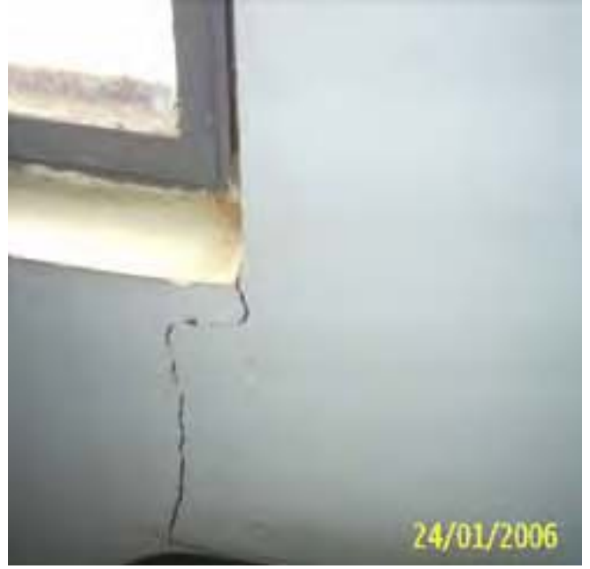
Site Photo 65: Wall cracks below window (Project 19117)