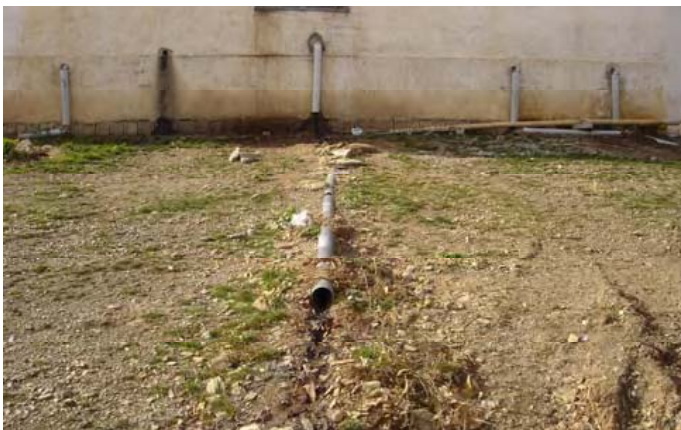
Site Photo 32: Sewer outfall behind border post (Project 20572)