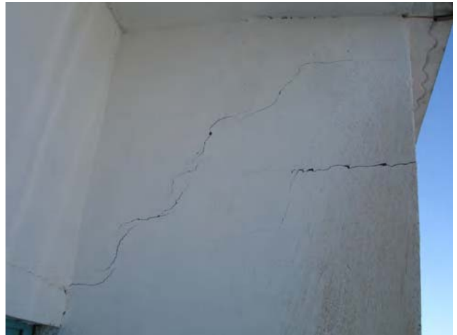
Site Photo 35: Cracks in exterior wall (Project 20573)