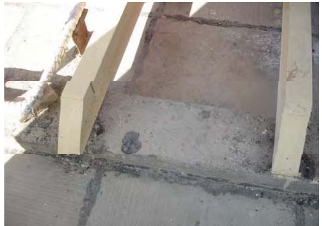
Site Photo 23: Roof mounted water tank base (Project 12855)