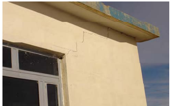
Site Photo 33: Cracks in exterior wall (Project 20572)