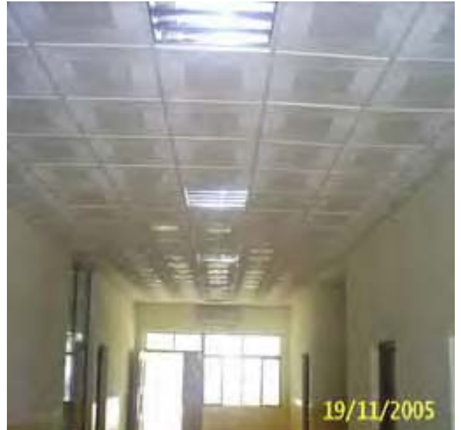
Site Photo 85: Interior hallway (Project 21263)