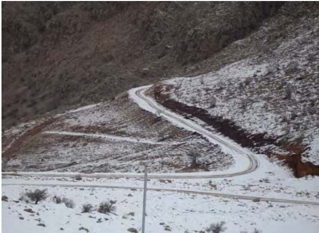
Site Photo 9: Access road (Project 12809)