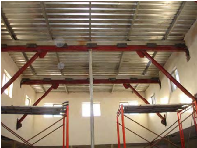
Site Photo 20: Steel retrofit in progress (Project 12850)