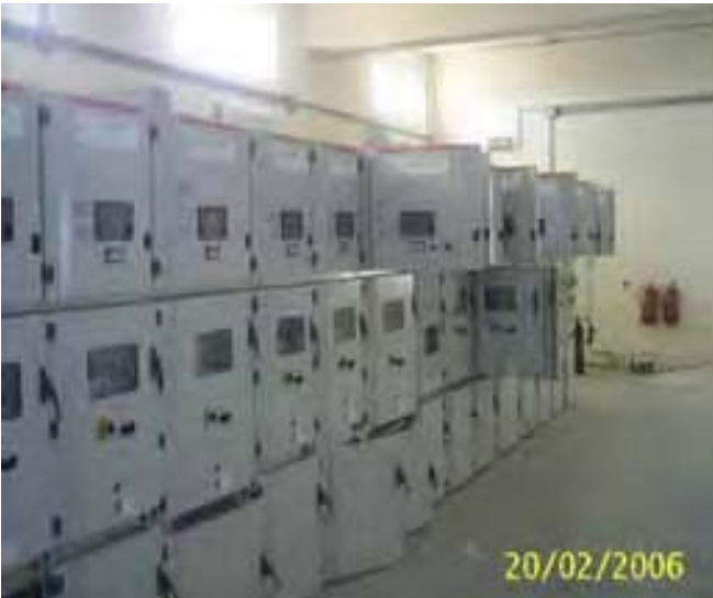
Site Photo 45: Switchgears (Project 1861)