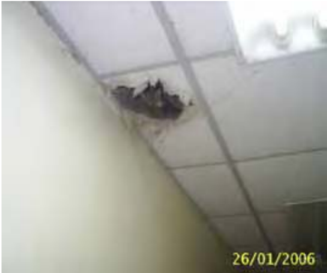
Site Photo 51: Water damaged suspended ceiling (Project 16124)