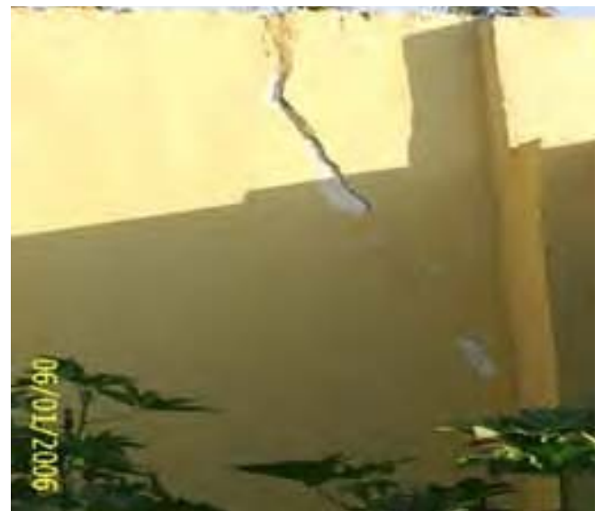
Site Photo 79: Crack in perimeter wall (Project 19227)