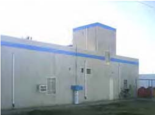
Site Photo 62: Exterior of Police Station building (Project 19111)

The IRMS database listed the project as 100 percent complete on 30 August - 2005. The project was new construction and included perimeter security walls, entrance gates, guard towers, and a nine-room building. Site Photo 62 shows the exterior of the building. A generator and covered parking area were also located within the perimeter walls. A crack was observed in the perimeter wall, although no other discrepancies were noted. Site Photo 63 shows the crack in the exterior perimeter wall.