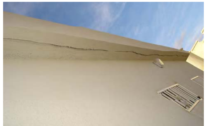
Site Photo 18: Cracks on exterior wall (Project 12835)