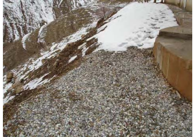
Site Photo 16: Steep down gradient bank within several feet of sidewalk (Project 12834)