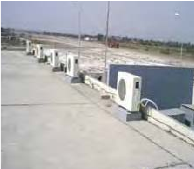
Site Photo 46: Roof mounted AC Units (Project 1861)