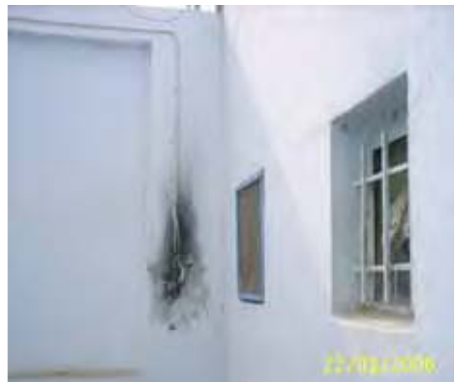
Site Photo 61: Fire damaged electrical outlet (Project 18334)