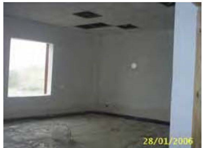
Site Photo 59: Interior room (Project 11913)