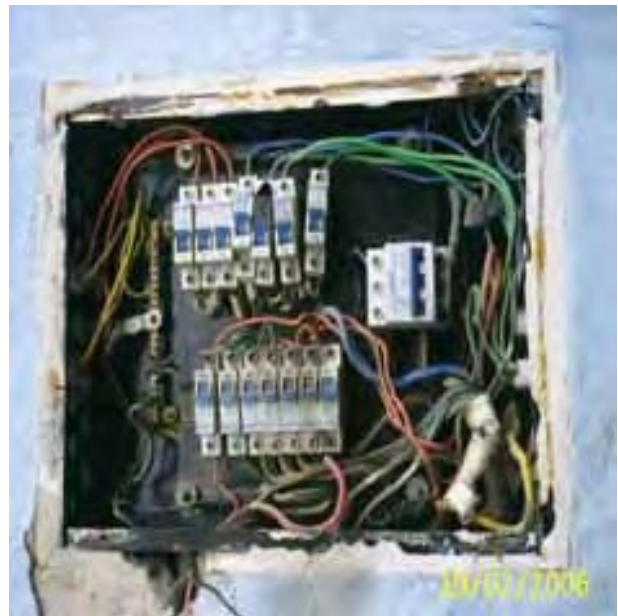
Site Photo 67: Electrical circuit breaker panel (Project 19175)