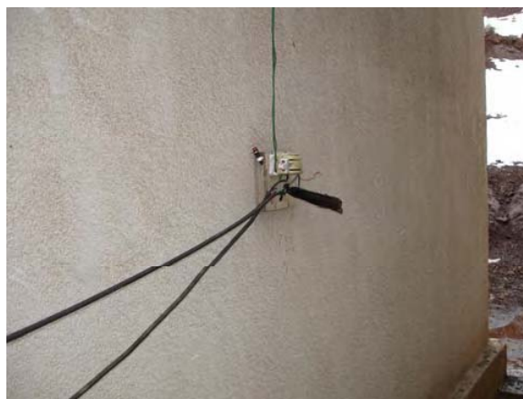
Site Photo 40: Exterior electrical wiring