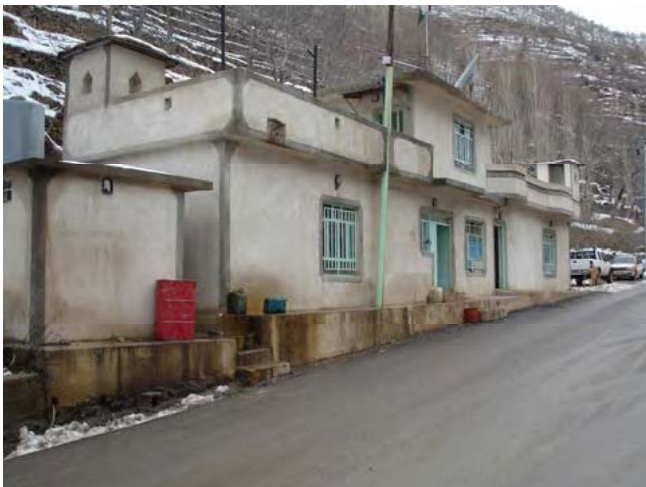
Site Photo 41: Exterior front of border post (Project 20577)