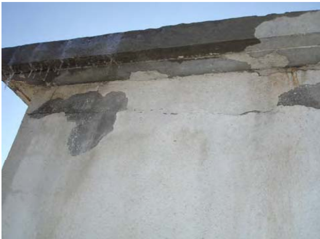
Site Photo 26: Cracks in exterior walls (Project 20558)