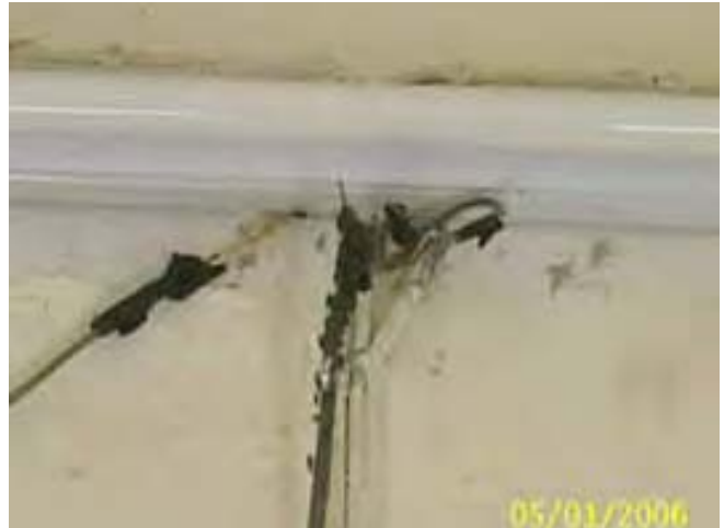
Site Photo 75: Interior electrical light with exposed wiring (Project 19181)