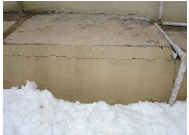
Site Photo 10: Cracks in sidewalks (Project 12809)