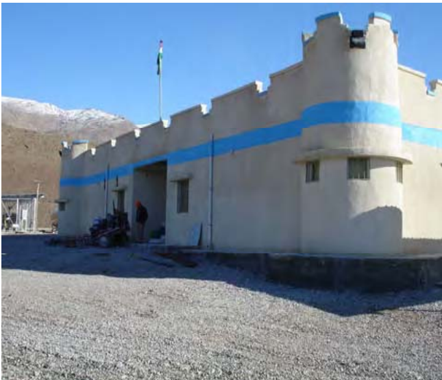
Site Photo 3: Front view of border post (Project 12786)