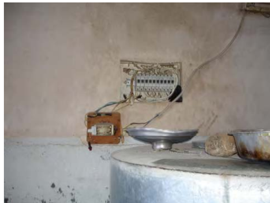
Site Photo 38: Electrical panel (Project 20575)