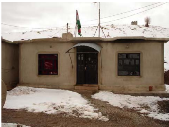
Site Photo 39: Exterior front of border post