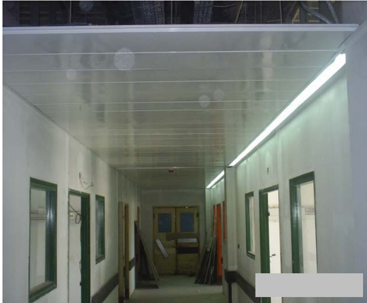
Site Photo 20: Renovated hallway at Project 10318

throughout the facility. Site Photo 20 shows a renovated hallway. Construction of a new sewer is underway; however, there were concerns about the elevated groundwater level and the direction of drainage relative to the road.