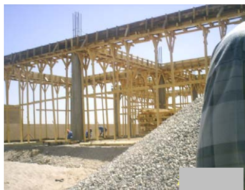
Site Photo 24: Aggregate stockpile at Project 11943