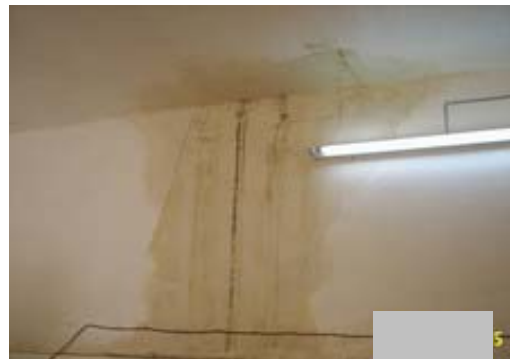
Site Photo 27: Interior staining due to roof leak at Project 18223