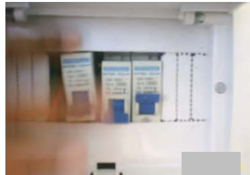
Site Photo 43: Circuit breakers at Project 19220