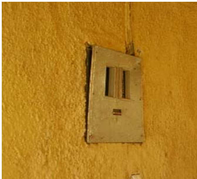
Site Photo 13: Electrical circuit breaker panel at Project 10588