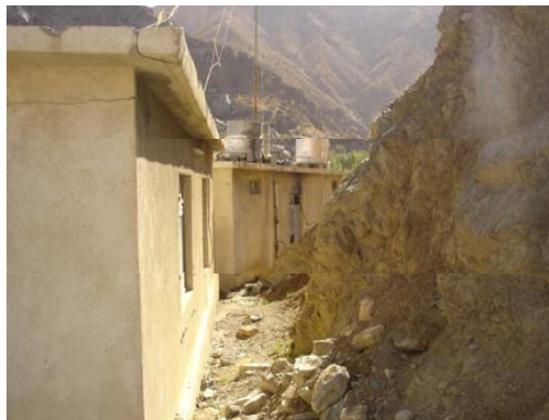
Site Photo 11: Behind border post at Project 20569