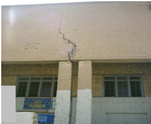
Site Photo 17: Crack in outer wall of Project 10630