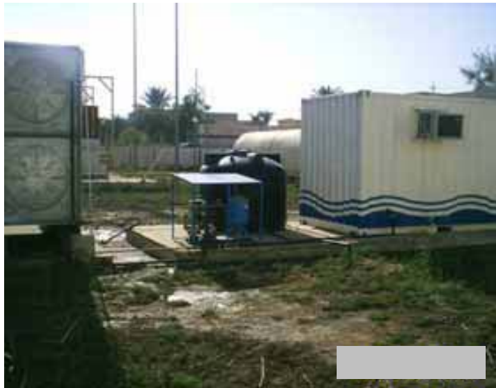
Site Photo 19: Containerized reverse osmosis unit with exterior pumps and storage tanks at Project 1270