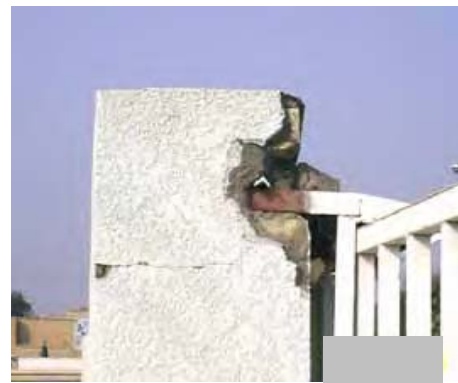
Site Photo 47: Wall damage at Project 19222