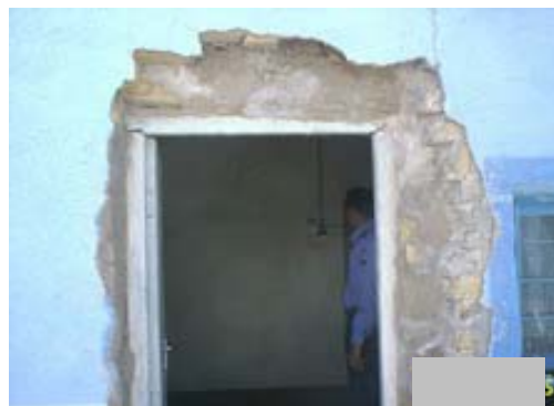
Site Photo 33: Exterior doorway with incomplete finishing work at Project 18248