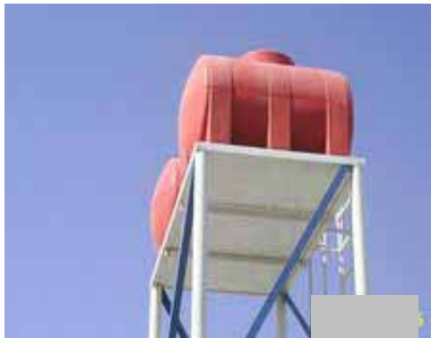
Site Photo 30: Water tanks installed on tower at Project 18243

The IRMS database listed the project as 100 percent complete on 3 May 2005. The site contained a perimeter security wall and gates, along with a generator with what appeared to be a correctly installed modern circuit breaker box and system. The site also contained a completed steel frame constructed parking area with a corrugated roof and elevated water tanks located on the roof on top of a tower. We observed some deterioration of plastering on exterior surfaces of the facility but did not note any significant deficiencies. Site Photo 30 shows water tanks installed on towers and Site Photo 31 shows the generator electrical panel at Project 18243.