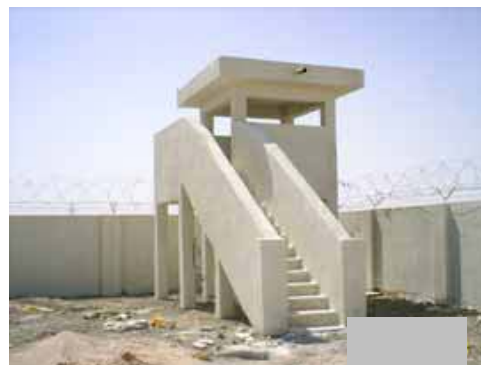
Site Photo 53: Perimeter security wall and guard tower at Project 20347