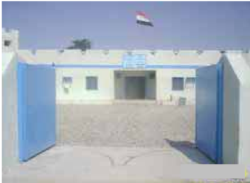
Site Photo 3: Front entrance gate and border post Project 12161

A review of the report and photos provided by the QCQA teams determined that overall, the site associated with Task Order 0034, Project 12161, appeared to be complete and consistent with contract requirements. A perimeter wall surrounded the post, containing the parking area and above ground fuel tank. In addition, there were security bars on the first floor windows and a security cage enclosed the generators. The site also contained above ground water tanks, set on a concrete base, with additional water tanks located on the roof. A septic tank appeared to be located between the berm and outer wall of the post. Site Photo 3 shows the front gate and border post.