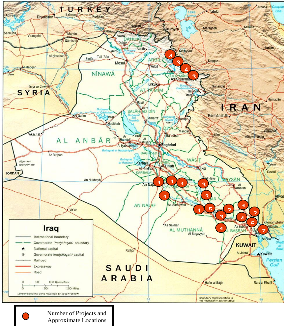
Figure 1: Iraq map indicating selected Ground Project Survey sites