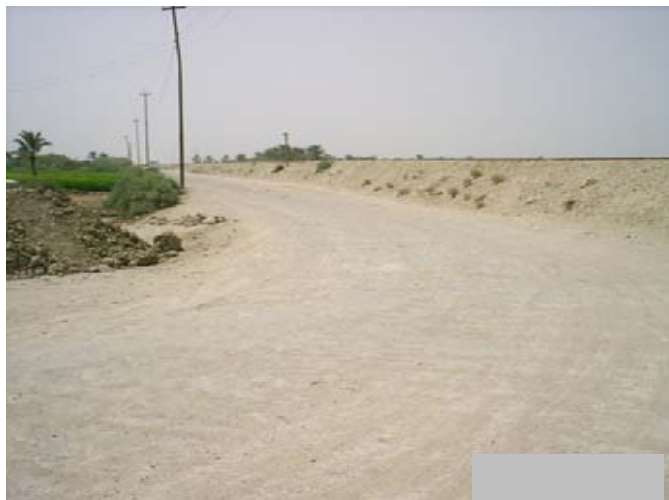
Site Photo 55: Road surface at the location of Project 17867

Although the IRMS database listed the project as 100 percent complete, the site visited by the survey team was not a completed road. The site visited was within 725 m from the reported location and intersected the location of the road as shown in the contract. The site visited consisted of 3.5 km of road, with recent sub base installed and no culverts or shoulders. No section of road contained any asphalt pavement. Site Photo 55 shows new road base at the location of Project 17867.