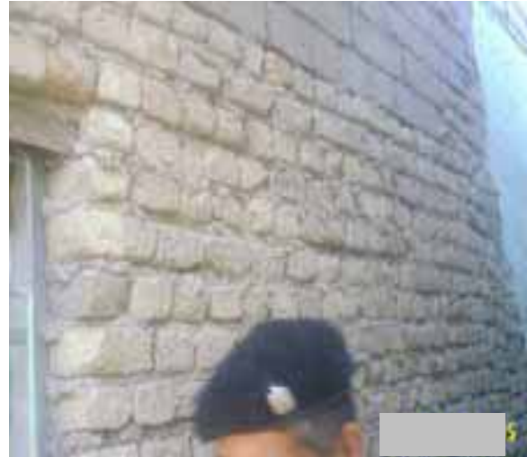
Site Photo 29: Unfinished exterior wall at Project 18223