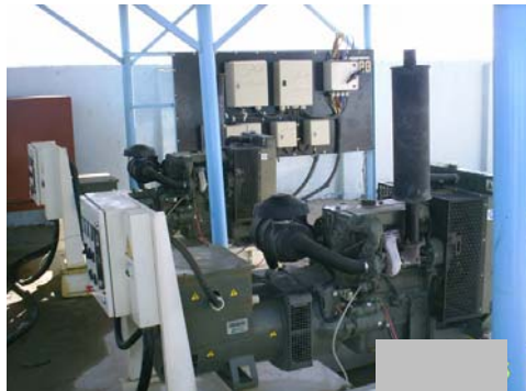
Site Photo 42: Two 30 kVA generators at Project 19220