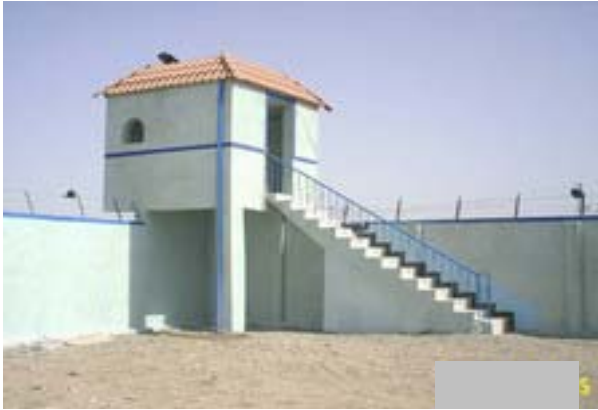
Site Photo 34: Perimeter Security wall with concertina wire and guard post at Project 18268