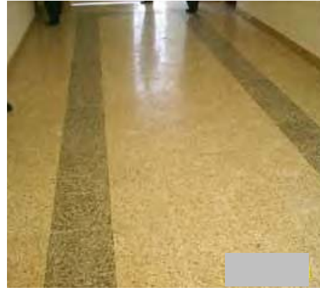
Site Photo 45: Interior tiles at Project 19221