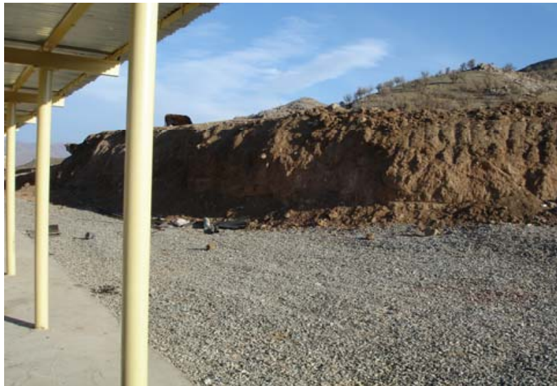
Site Photo 4: Cut bank with no stabilization Project 12787