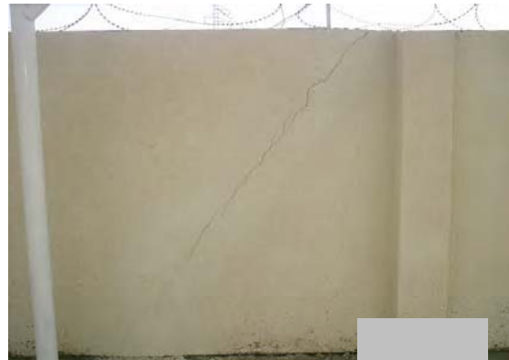
Site Photo 39: Cracks in perimeter security wall at Project 19217