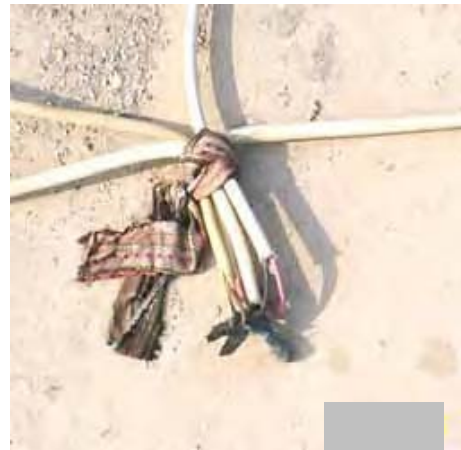
Site Photo 49: Electrical wires without proper connections at Project 19223