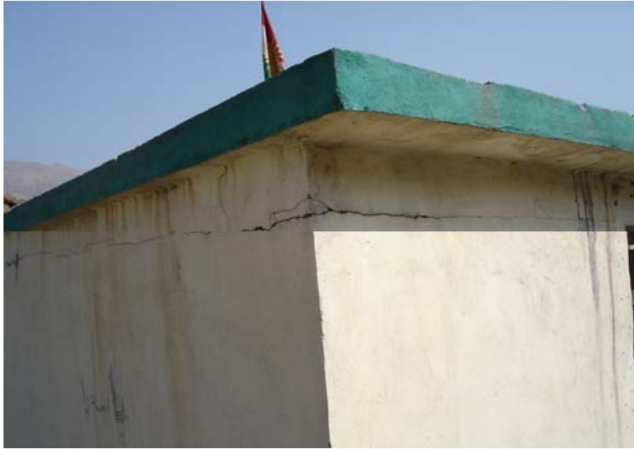
Site Photo 8: Cracks in exterior wall at Project 20565