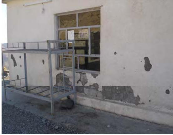
Site Photo 9: Exterior wall at project at Project 20568