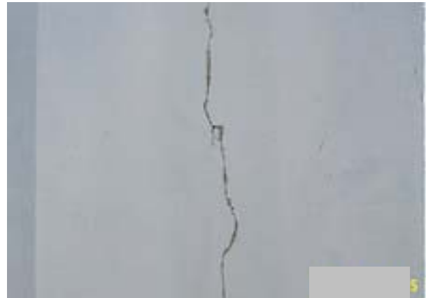
Site Photo 37: Cracks in exterior wall at Project 18273