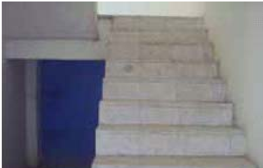
Site Photo 2: Interior stairwell without handrails at Project 12144