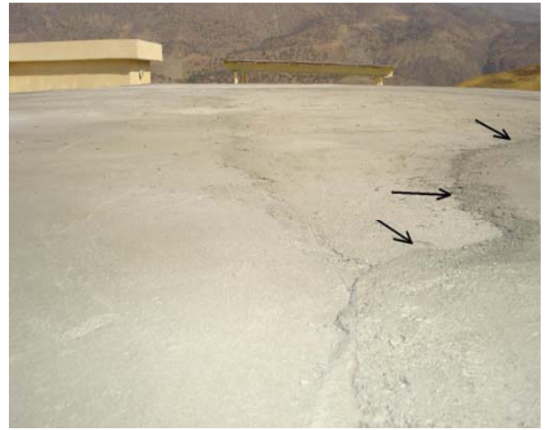
Site Photo 7: Concrete atrium roof showing uneven texture at Project 12840