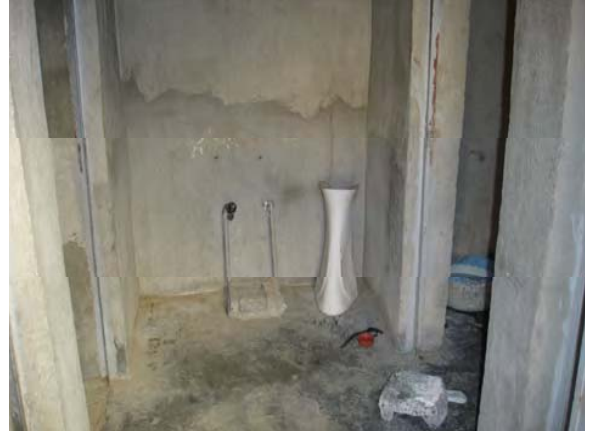
Site Photo 10: Bathroom fixtures at Project 20568