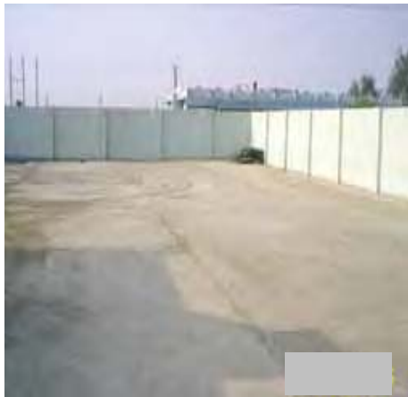
Site Photo 48: Perimeter security wall and concrete pad at Project 19223