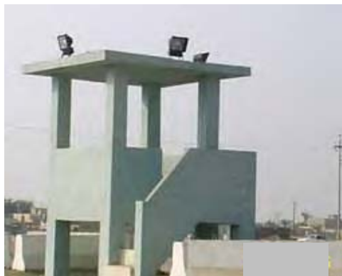
Site Photo 46: Checkpoint at Project 19222