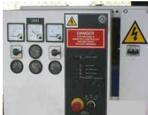
Site Photo 31: Generator electrical panel at Project 18243