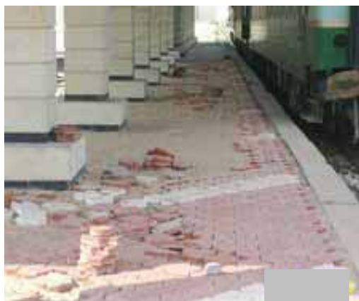
Site Photo 56: Installation of brickwork at Project 21251