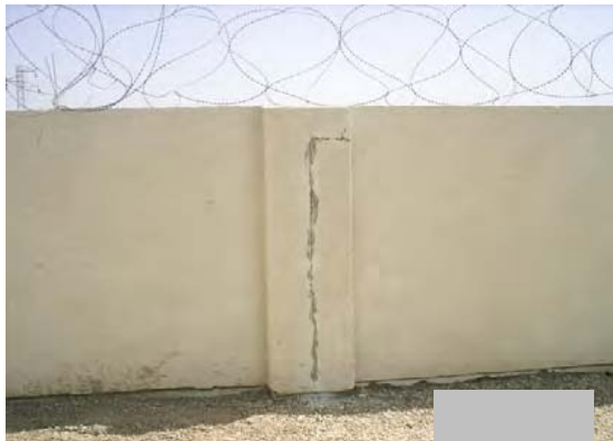
Site Photo 38: Cracks in perimeter security wall at Project 19217