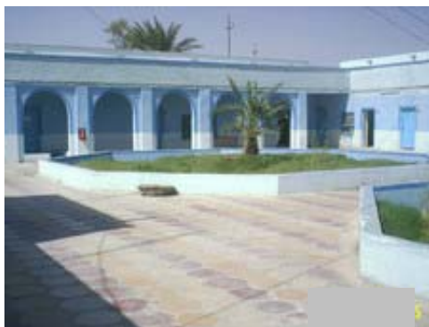
Site Photo 32: Courtyard at Project 18248