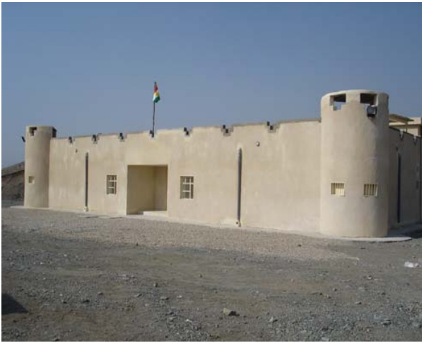
Site Photo 6: Front view of Project 12840