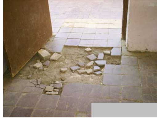
Site Photo 16: Broken tiles at Project 10630