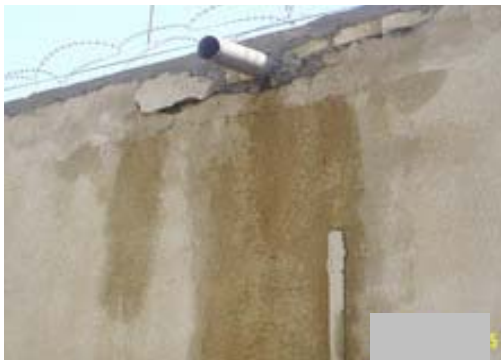
Site Photo 26: Exterior roof drain and deteriorated parapet at Project 18223