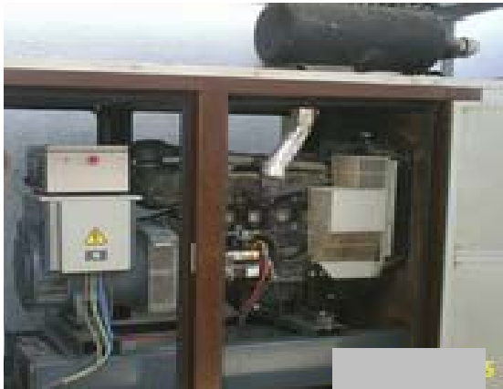
Site Photo 36: Generator at Project 18273