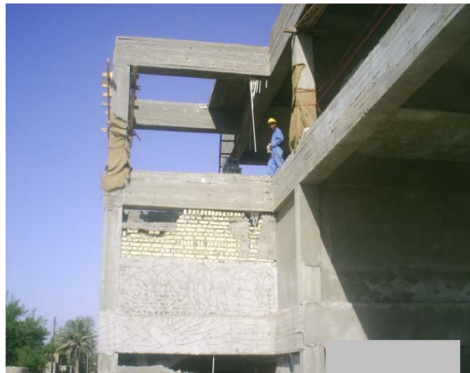
Site Photo 25: Project 10072 under construction

Construction of the facility was on-going at the time of the site visit. The QCQA team observed constructed structural concrete columns, beams, and elevated slabs on the ground, first, and second floor. Several columns were wrapped with burlap, presumably for curing purposes. Review of photos showed no areas of segregation, although we did not document the entire facility. Interior and exterior block walls were partially complete with external plastering in progress. Installation of window frames on the first floor rear of the building was on-going. We noted no discrepancies. Site Photo 25 shows Project 10072 under construction.