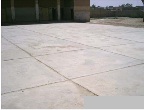
Site Photo 15: Concrete courtyard at Project 10630