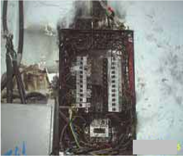
Site Photo 28: Electrical circuit breaker panel at Project 18223