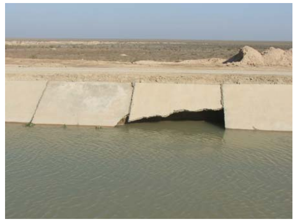
Site Photo 12. Example of under-cutting of canal sidewall in vicinity of km 168