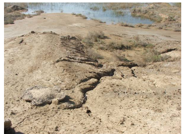
Site Photo 16. Surface erosion of canal banks at km 188 repair area