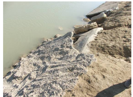
Site Photo 14. Repair of concrete liner with concrete slurry at km 168 repair area