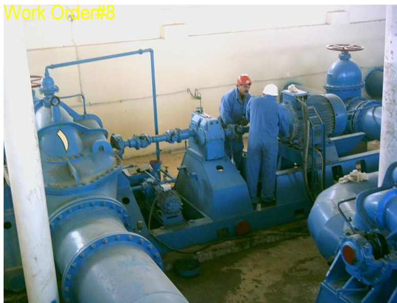
Site Photo 3. Pumps located at Pump Station #2