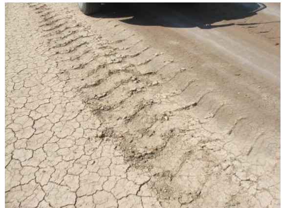
Site Photo 19. Recent tire tracks from heavy equipment vehicle