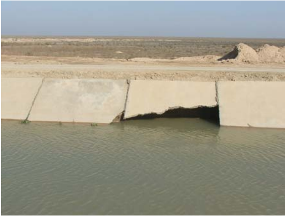
Site Photo 7. Example of under-cutting of canal