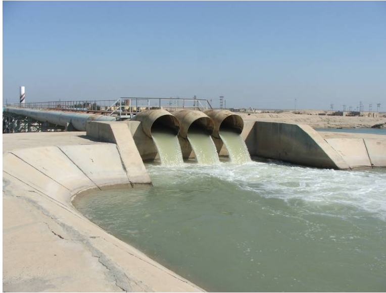
Site Photo 4. Water flowing out of all three pipelines from Pump Station #2 into the Sweetwater Canal