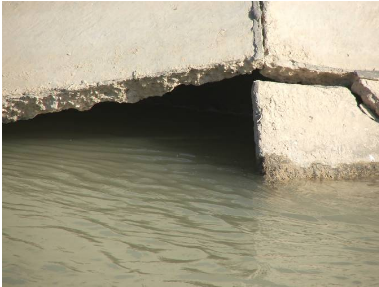
Site Photo 17. Example of under-cutting of canal sidewall in vicinity of km 188