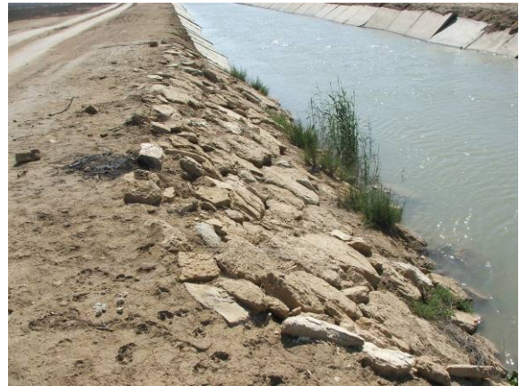
Site Photo 10. Repair of concrete liner

Two locations in the vicinity of km marker 168 and km marker 188 required emergency repairs. The contract included emergency repairs of these sections. The procedures required identification and removal of appropriate borrow material, excavation of the deteriorated canal section to firm soil or rock, and placement of appropriate borrow material in lifts with compaction. The emergency repairs of the lined portion of the canal were completed prior to the site visit. Review of USACE photos of the repairs show heavy equipment removing soil and new soils being hauled in and compacted in place.