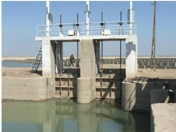
Site Photo 21. Slice gates controlling water from SWC to settling basins