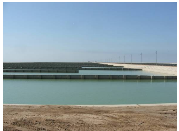
Site Photo 22. Settling basins