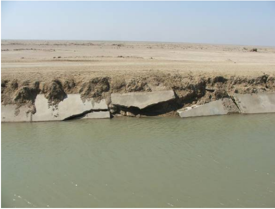
Site Photo 9. Example of concrete liner failure