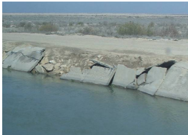
Site Photo 6. Example of concrete liner failure