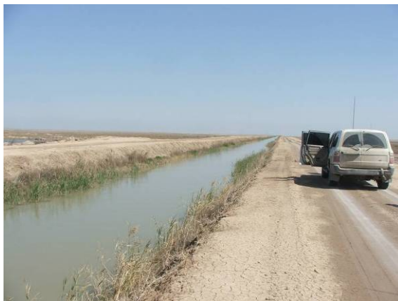
Site Photo 18. Unlined portion of SWC

Site Photo 18 shows an example of the unlined section of the SWC, Site Photo 19 shows recent tire prints from a heavy equipment vehicle, and Site Photo 20 shows dredge spoils located parallel to the canal. Site Photo 21 shows sluice gates used to control water at the entrance of the settling basin and Site Photo 22 shows the settling basin.