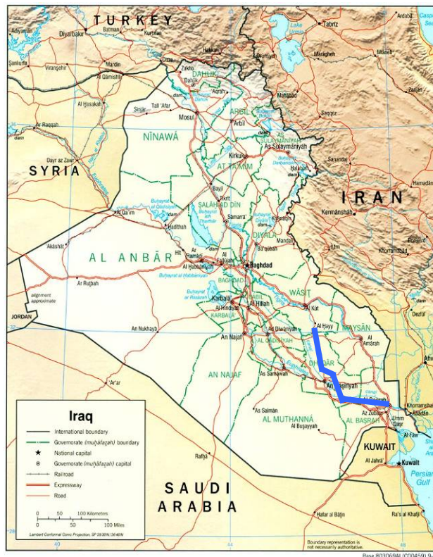
Figure 1. General location map of the Sweetwater Canal