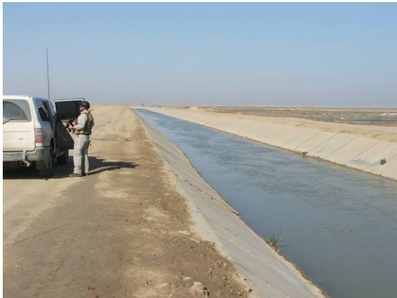
Site Photo 5. Undamaged section of canal

Site Photo 5 shows an example of the SWC with undamaged embankment and concrete liners. Site Photos 6 through 9 show examples of areas along the lined section of the canal where repairs and maintenance are required. Site Photo 10 shows an area where native rock instead of concrete panels was used for repair.