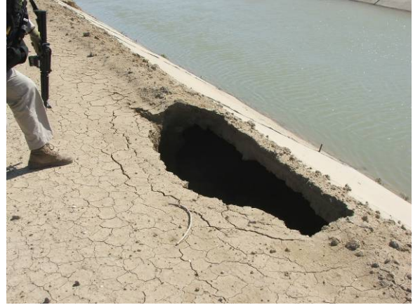
Site Photo 8. Example of under-cutting of canal