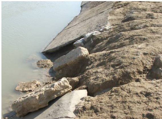
Site Photo 13. Example of concrete liner failure at km 168 repair area