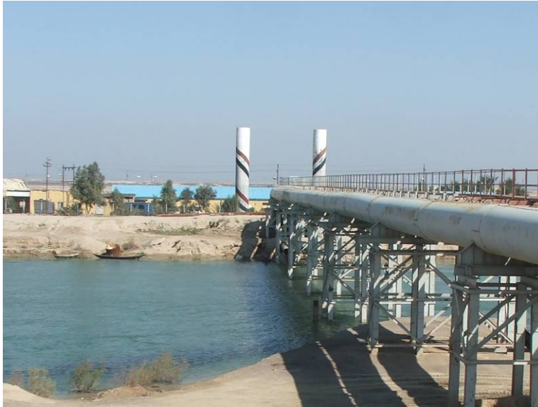
Site Photo 2. Pump Station #2