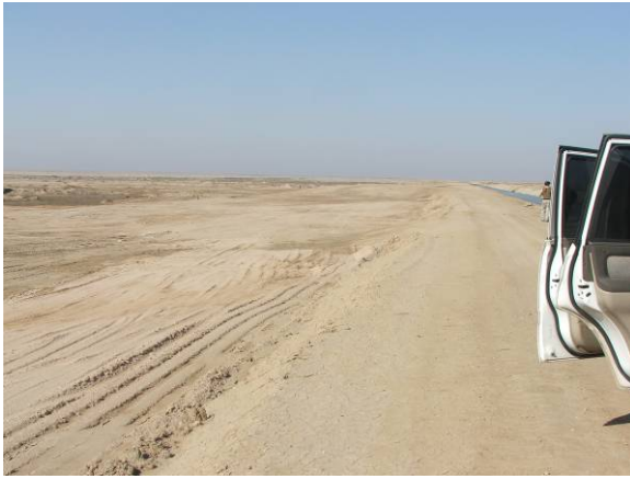
Site Photo 11. km 168 repair area

Site Photos 11 through 14 show the condition of the canal in the vicinity of the km 168 repairs and Site Photos 15 through 17 show the condition of the canal in the vicinity of the km 188 repairs.