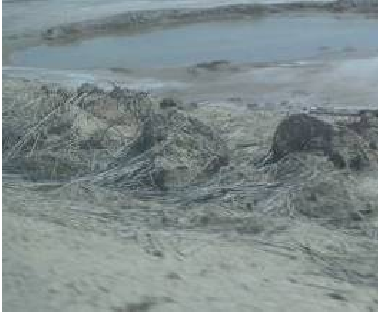
Site Photo 20. Dredge spoils located parallel to unlined section of SWC