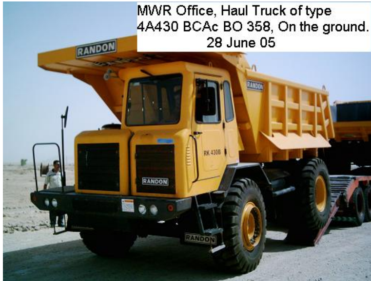
Site Photo 1. Haul truck purchased through PCO