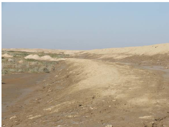
Site Photo 15. km 188 repair area