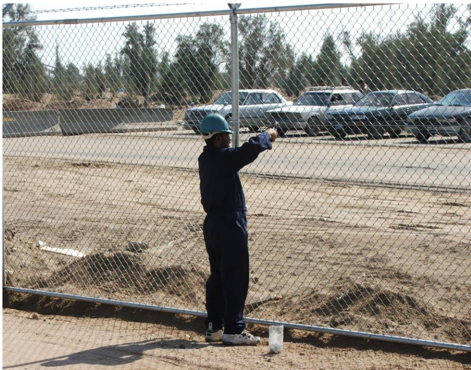
Site Photo 3. Worker Securing the Fence