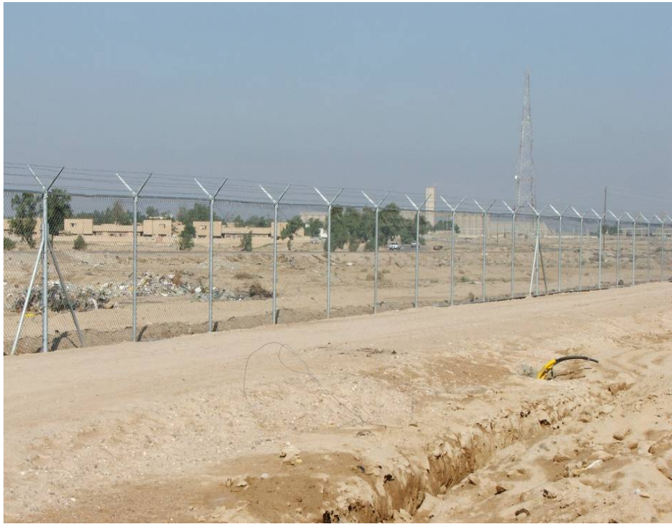
Site Photo 2. Nearly Completed Portion of Fence