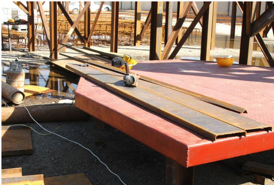
Site Photo 7. Platform Pedestal