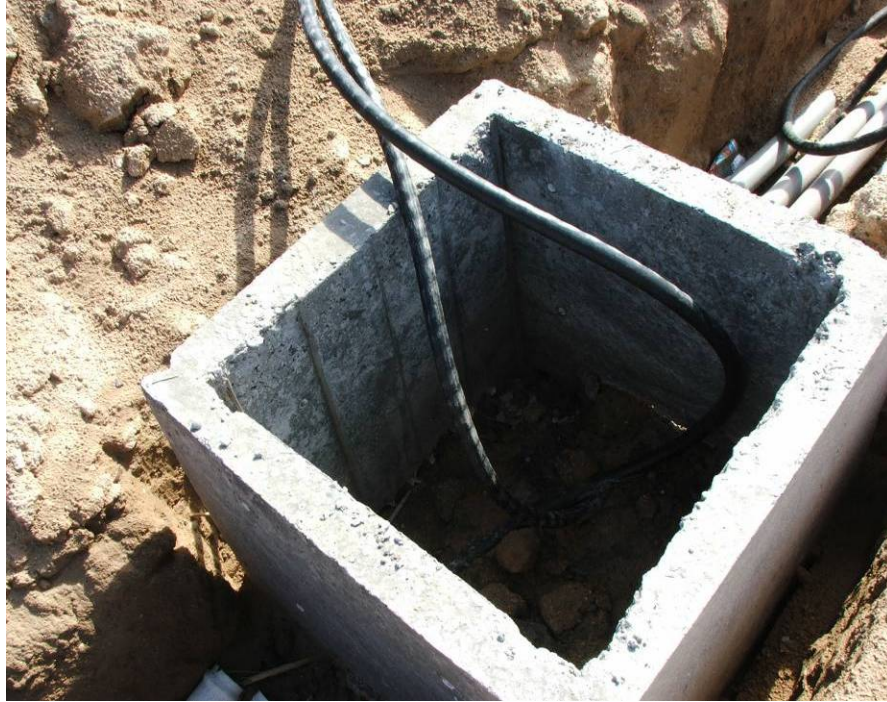
Site Photo 10. Utility Access Box