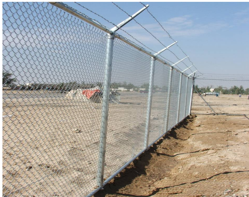
Site Photo 1. Corner near the South End of Port