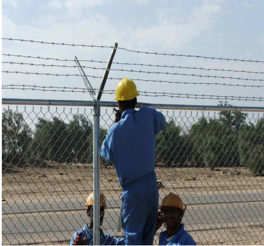
Site Photo 4. Workers Securing the Fence