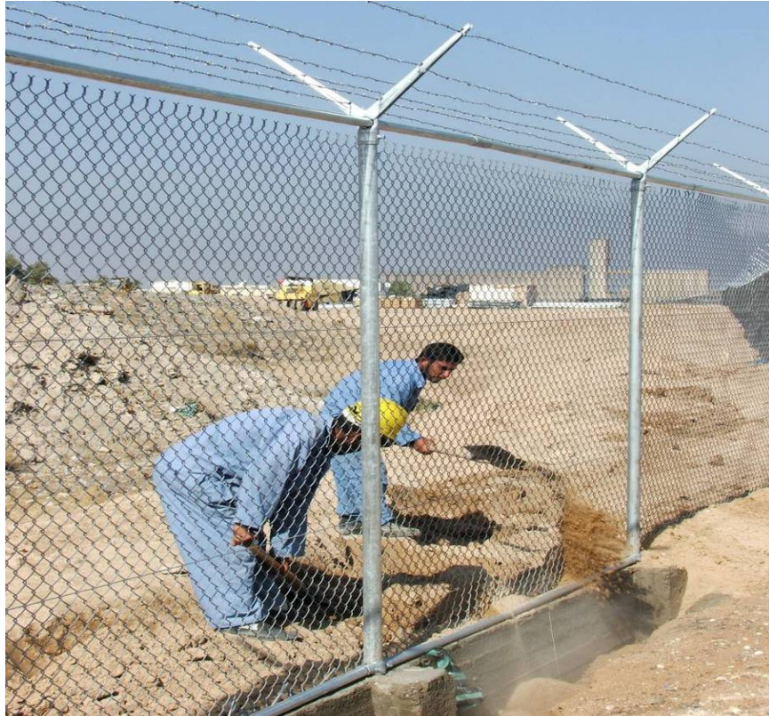
Site Photo 5. Workers Shoveling Dirt over the Concrete Foundation