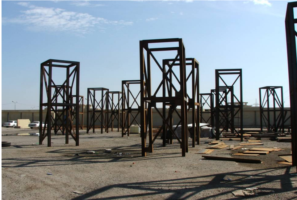
Site Photo 6. OP Towers