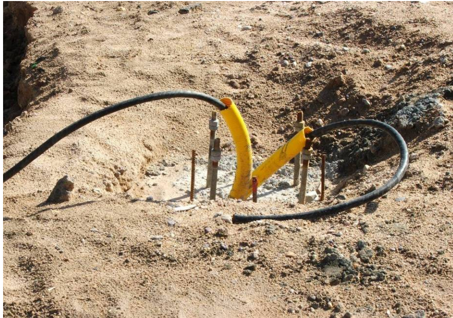
Site Photo 8. Concrete Footers for Perimeter Lighting