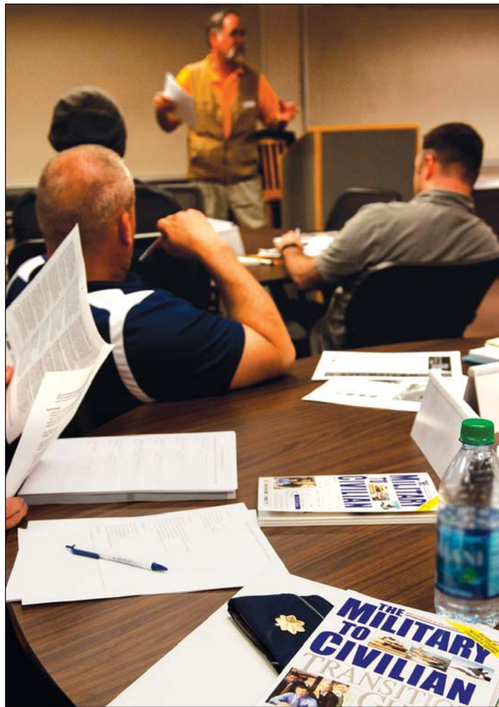
A variety of informational material is made available to Airmen attending a Transition Assistance Program class in the Airmen and Family Readiness Center on Ellsworth Air Force Base, S.D., March 26. Airmen preparing to separate from the Air Force are given various guides and information to assist them during their transition to civilian life.