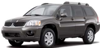
2011 Mitsubishi Endeavor AWD $17,981 Compare around at $21,000 stk # sc6246