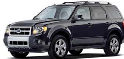
2011 Ford Escape Limited 4wd $22,981 Compare around at $26,000 stk # sc6277