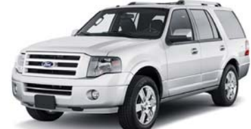
2011 Ford Expedition EL XLT 4WD $27,981 Compare around at $32,000 stk # sc6222