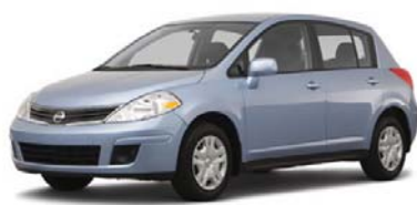
2011 Nissan Versa S $12,981 Compare around at $15,000 stk # sc1371