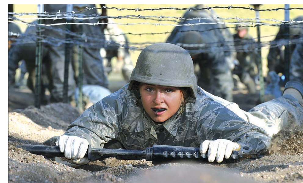
Basic cadets take on the assault course during the second phase of Basic Cadet Training in Jacks Valley. "Second Beast" focuses on physical conditioning as well as surviving and operating in a field environment.