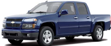
2011 Chevy Colorado LT C/C 4wd $21,981 Compare around at $25,000 stk # sc6218