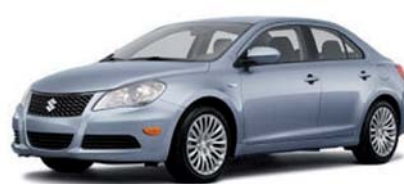
2011 Suzuki Kisashi SE $16,981 Compare around at $19,000 stk # sc1272