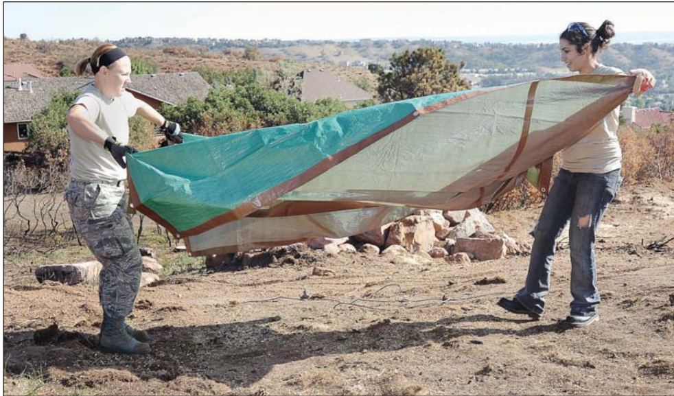
Cadet volunteers spread out a tarp on the ground to place debris collected during fire mitigation efforts Sunday.

The Colorado Springs Fire Department followed Monday by chipping the material and using it for erosion control and landscape recovery efforts within and around the Mountain Shadows burn areas.