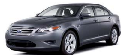
2011 Taurus Limited $20,981 Compare around at $25,000 stk # sc1136