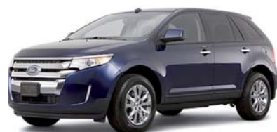
2011 Ford Edge SEL AWD $25,981 Compare around at $30,000 stk # sc6262