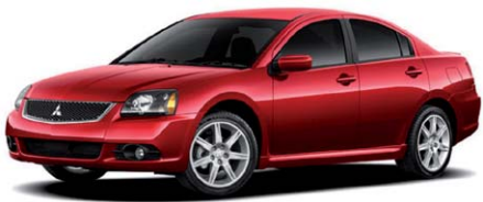
2011 Mitsubishi Galant FE $13,981 Compare around at $15,500 stk # sc1268