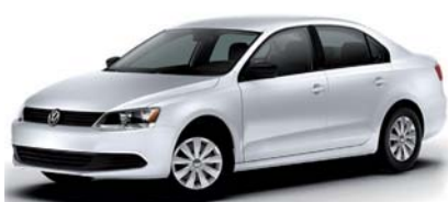
2011 VW Jetta $16,981 Compare around at $18,000 stk # sc1318