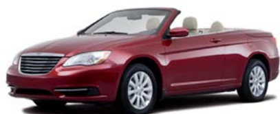
2011 Chrysler 200 Touring Convertible $18,481 Compare around at $21,000 stk # sc1355