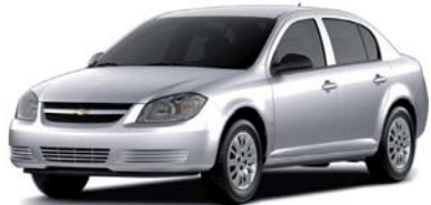
2010 Chevy Cobalt 2LT $11,981 Compare around at $14,000 stk # sc1129

Twice a year we clear out our remaining fleet to make room for the hundreds and hundreds of inbound vehicles with pricing that crushes the competition!