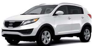
2011 Kia Sportage LX AWD $20,981 Compare around at $22,000 stk # sc6248