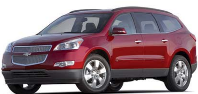
2011 Chevy Traverse LT AWD $23,981 Compare around at $28,000 stk # sc6209