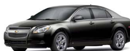
2011 Chevy Malibu LTZ $18,981 Compare around at $22,000 stk # sc1206