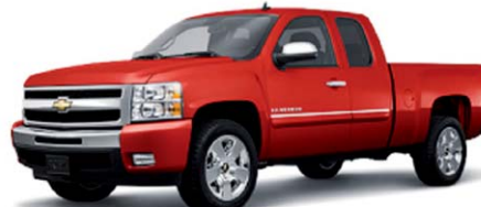
2011 Chevy Silverado Ext cab LT 4x4 $25,981 Compare around at $30,000 stk # sc6233