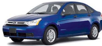
2010 Ford Focus SE $12,981 Compare around at $15,000 stk # sc1367