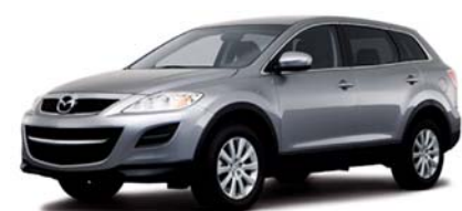
2011 Mazda CX9 Sport AWD $23,981 Compare around at $27,000 stk # sc6242