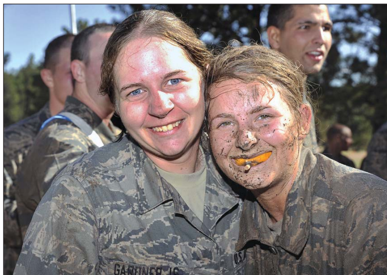
Basic cadets celebrate completion of the assault course during Basic Cadet Training in Jacks Valley.

* If graduation is held after Memorial Day