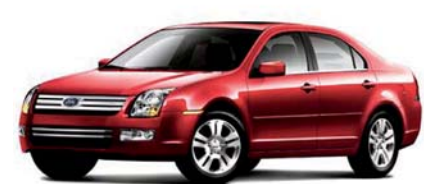
2011 Ford Fusion SE $16,981 Compare around at $20,000 stk # sc1193