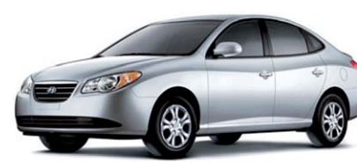
2010 Hyundai Elantra GLS $13,981 Compare around at $15,000 stk # sc1329