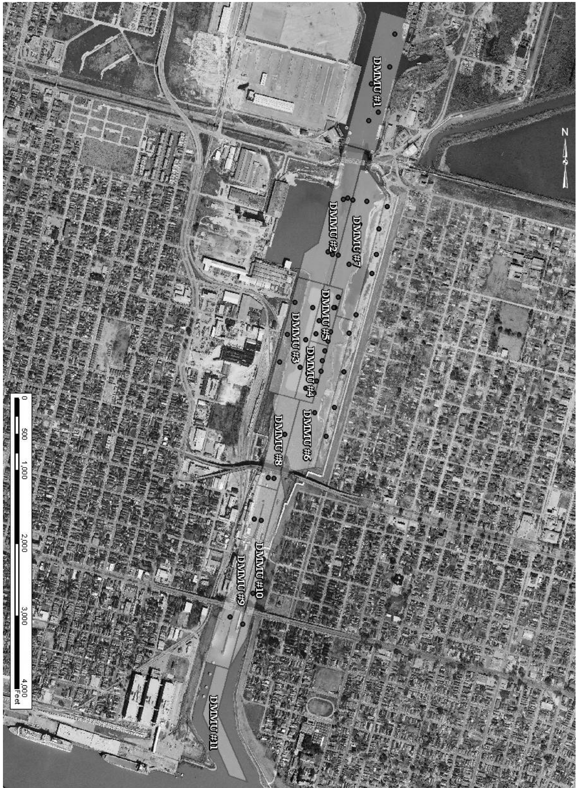
Figure2: DMMU Locations