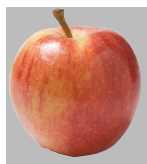
Gala apple 1 small (counts as 1 cup fruit)