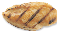
Chicken breast 1 small breast half, cooked (3-ounce equivalent of meat and beans)