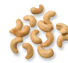
Cashews 1 ounce, about 13 cashews (2-ounce equivalent of meat and beans + 2 tsp oil)