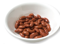
Cooked kidney beans ½ cup (2-ounce equivalent of meat and beans)