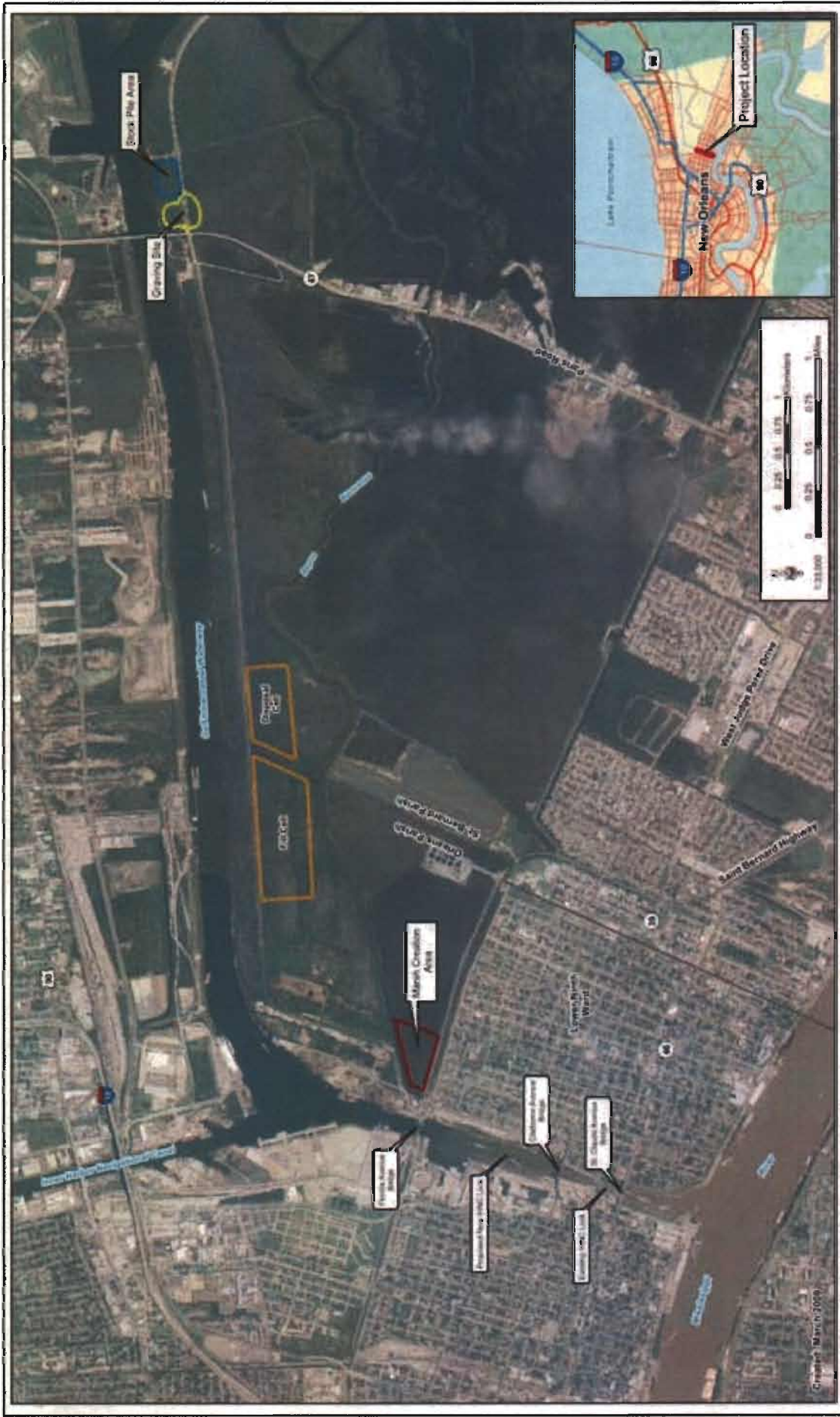
Project Location Map