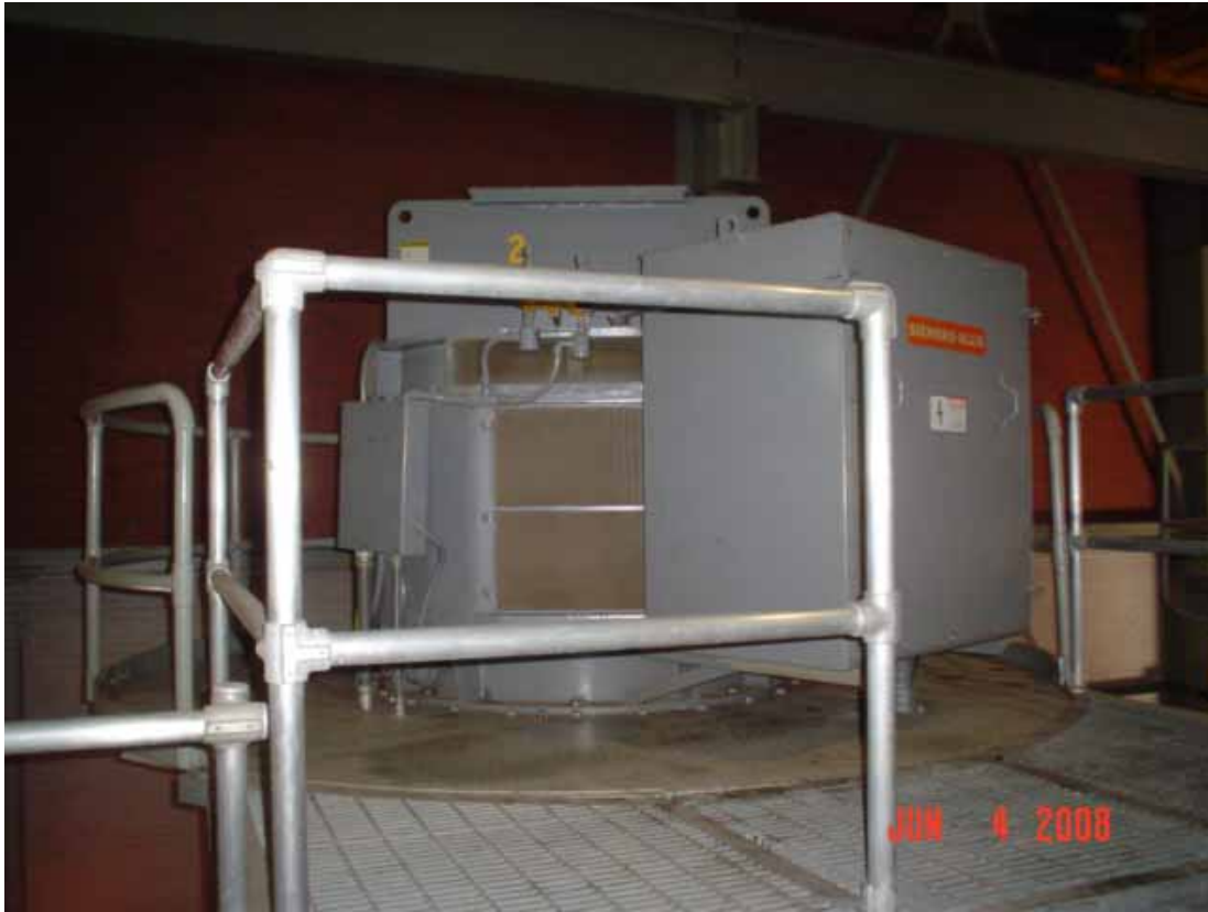
17. Pump motor.