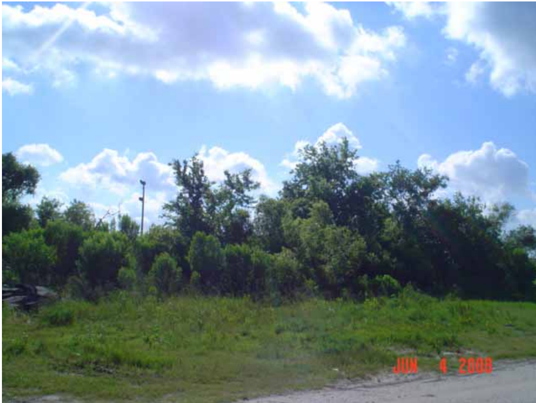
7. View of east area adjacent to the site, southeast corner.