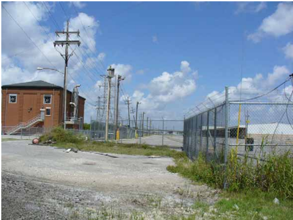
14. View of west area adjacent to the site, including generator building.