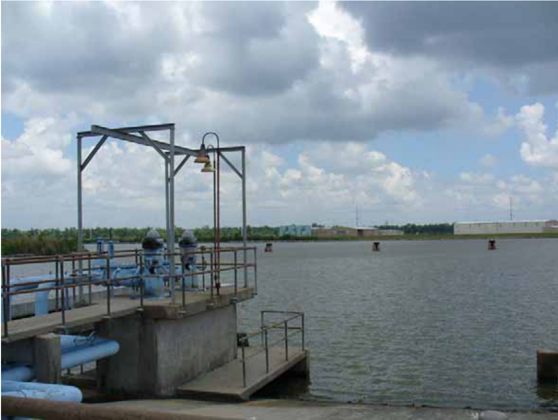
3. View of northeast area adjacent to the site.