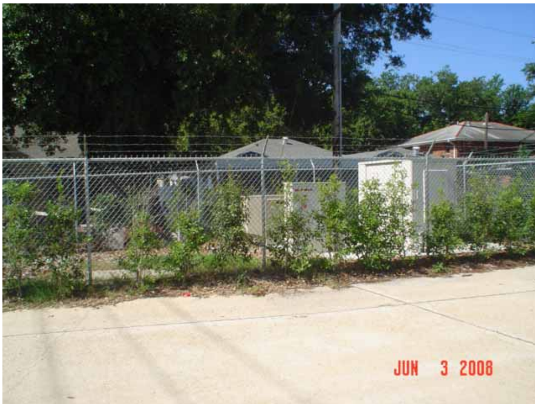
12. Transformers, southwest corner across road.