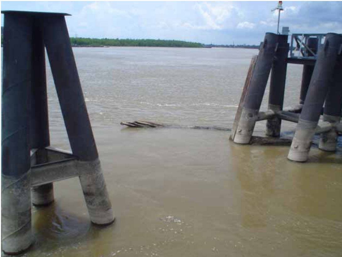
18. Mississippi River at end of pier.