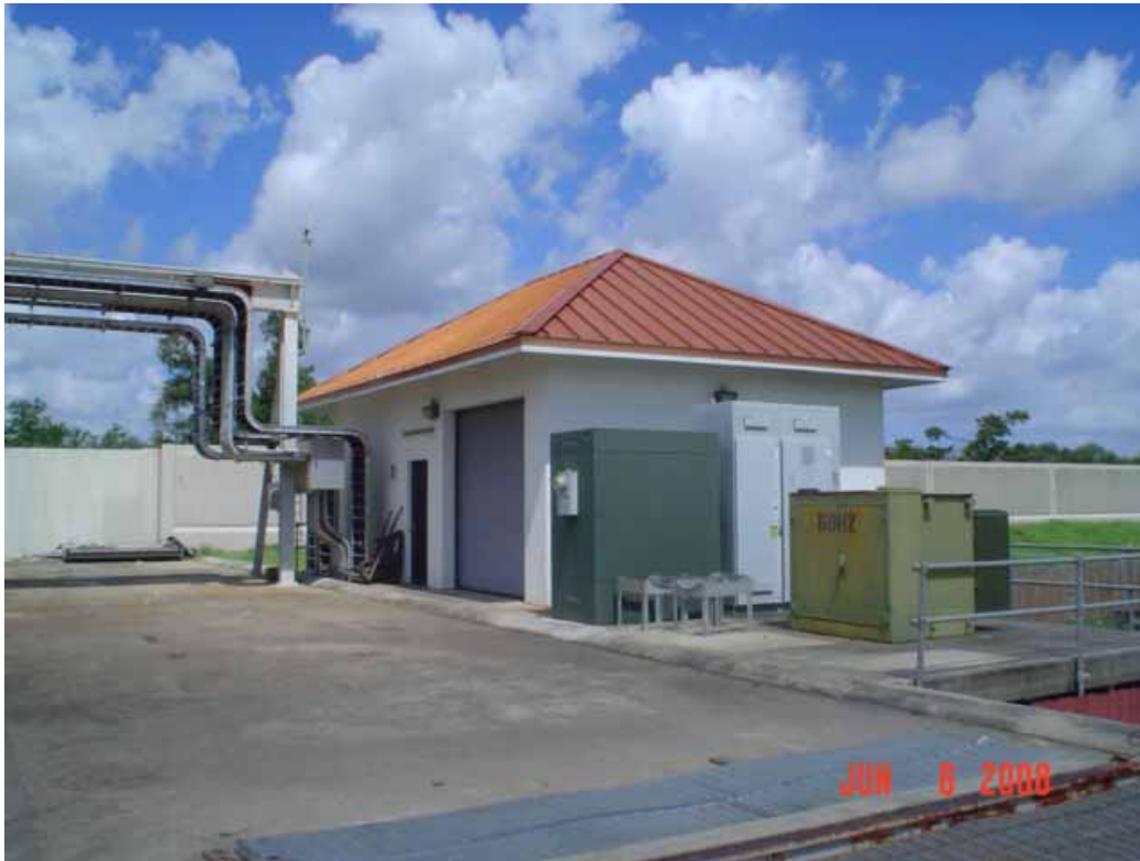
13. Transformers and small building on property.