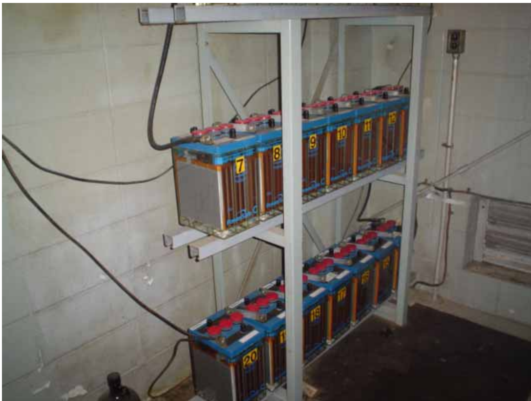
18. Battery banks in main building.