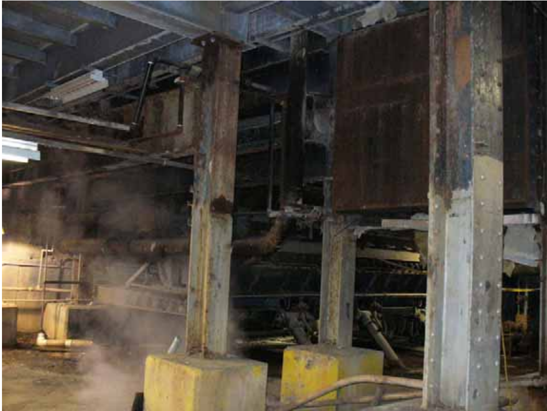
60. Basement of boiler house.