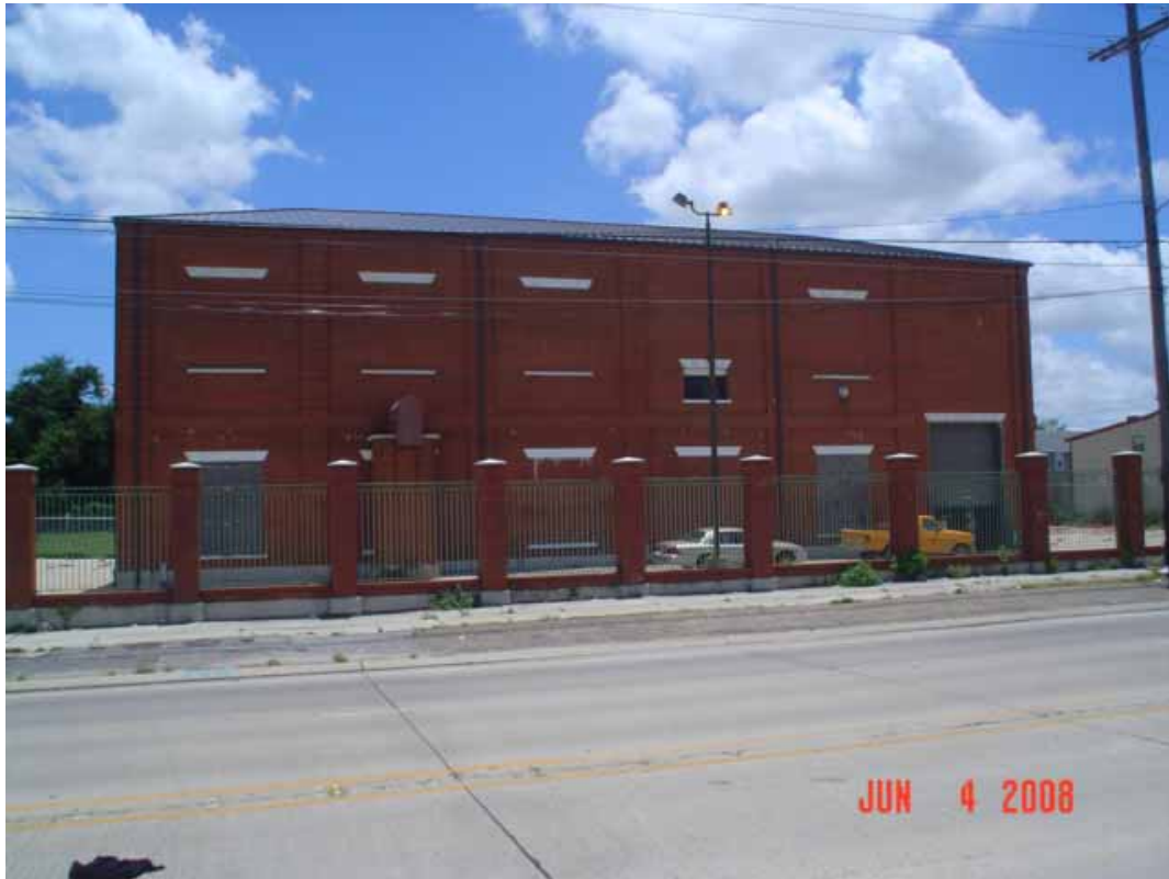
1. View of site as seen from the north direction.