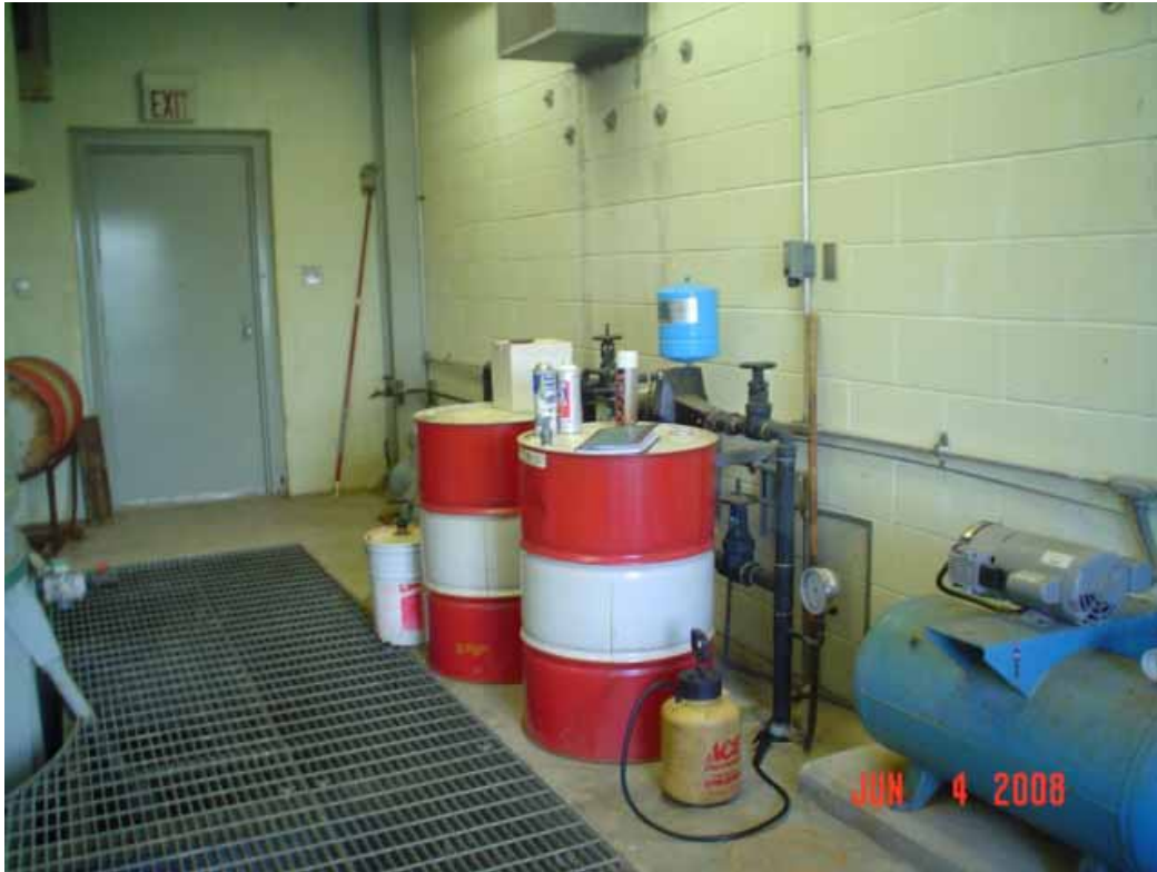
15. Drums inside levee