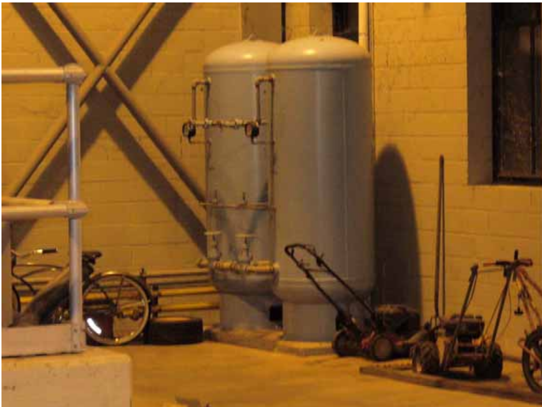
14. Air compressor tanks and mowers located inside building in southeast area.