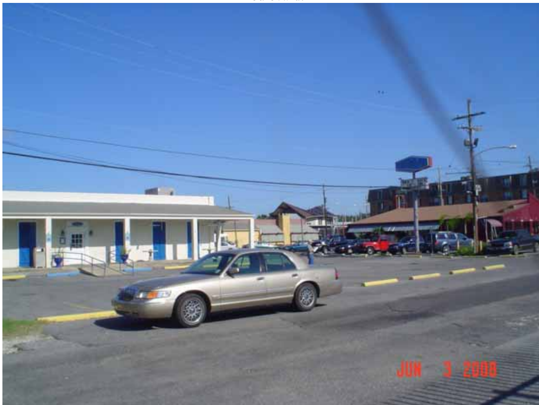
10. View of west area adjacent to the site. Observe transformers on poles in northwest area.