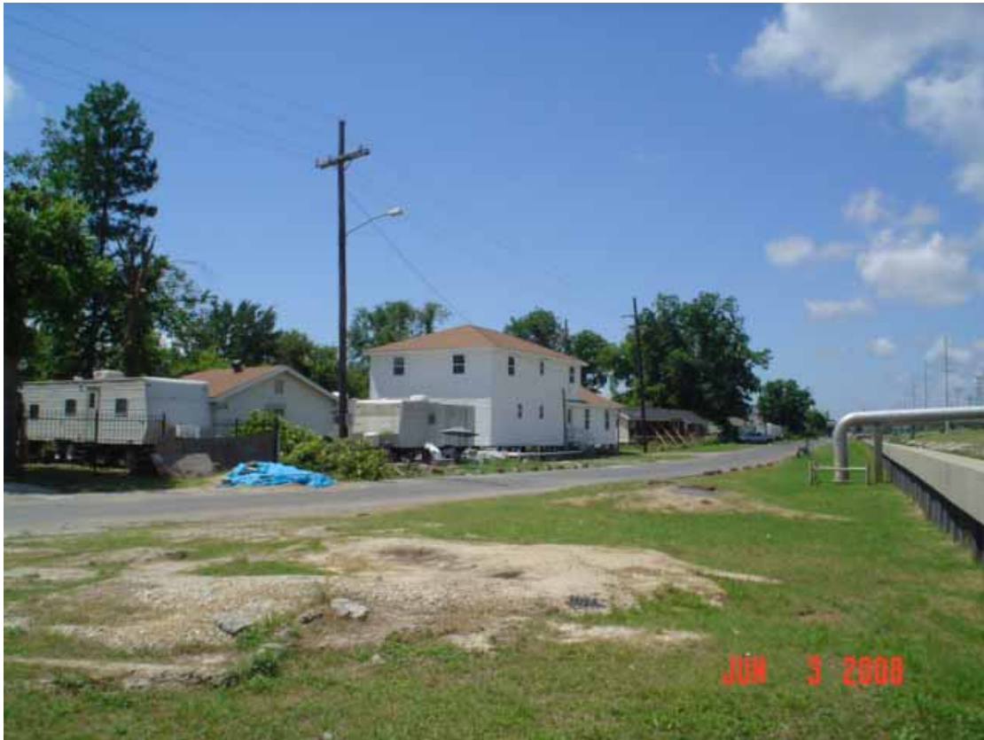
9. View of south area adjacent to the site, southeast corner, along canal.