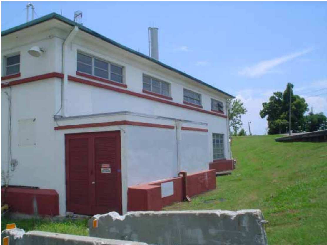
12. View of site as seen from the west direction.