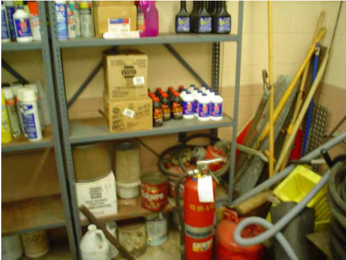
100. Gas station supply room.