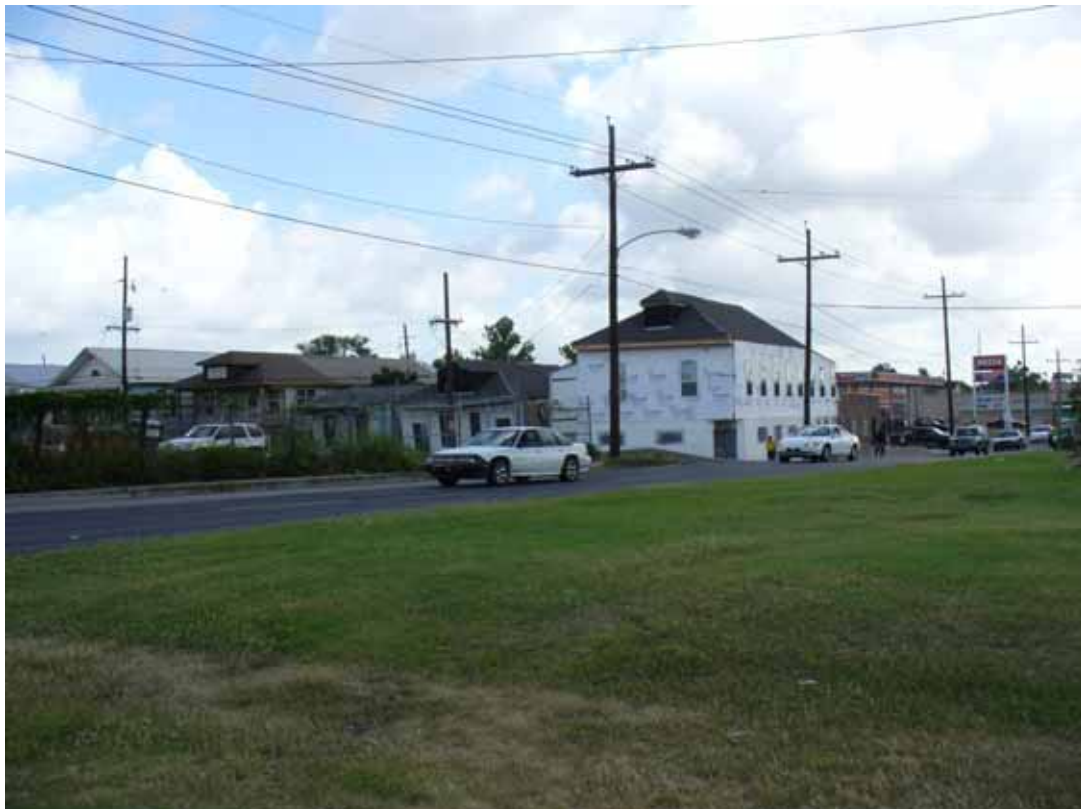
8. View of east area adjacent to the site, northeast side of North Broad, with Delta gas station 2 blocks away.