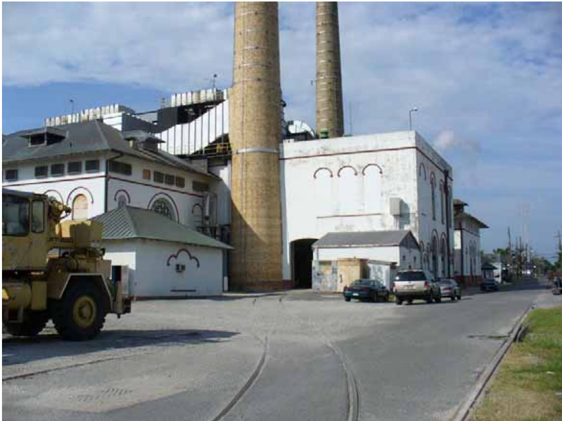
30. Power house and boiler room building on Eagle Street located in south area of site.