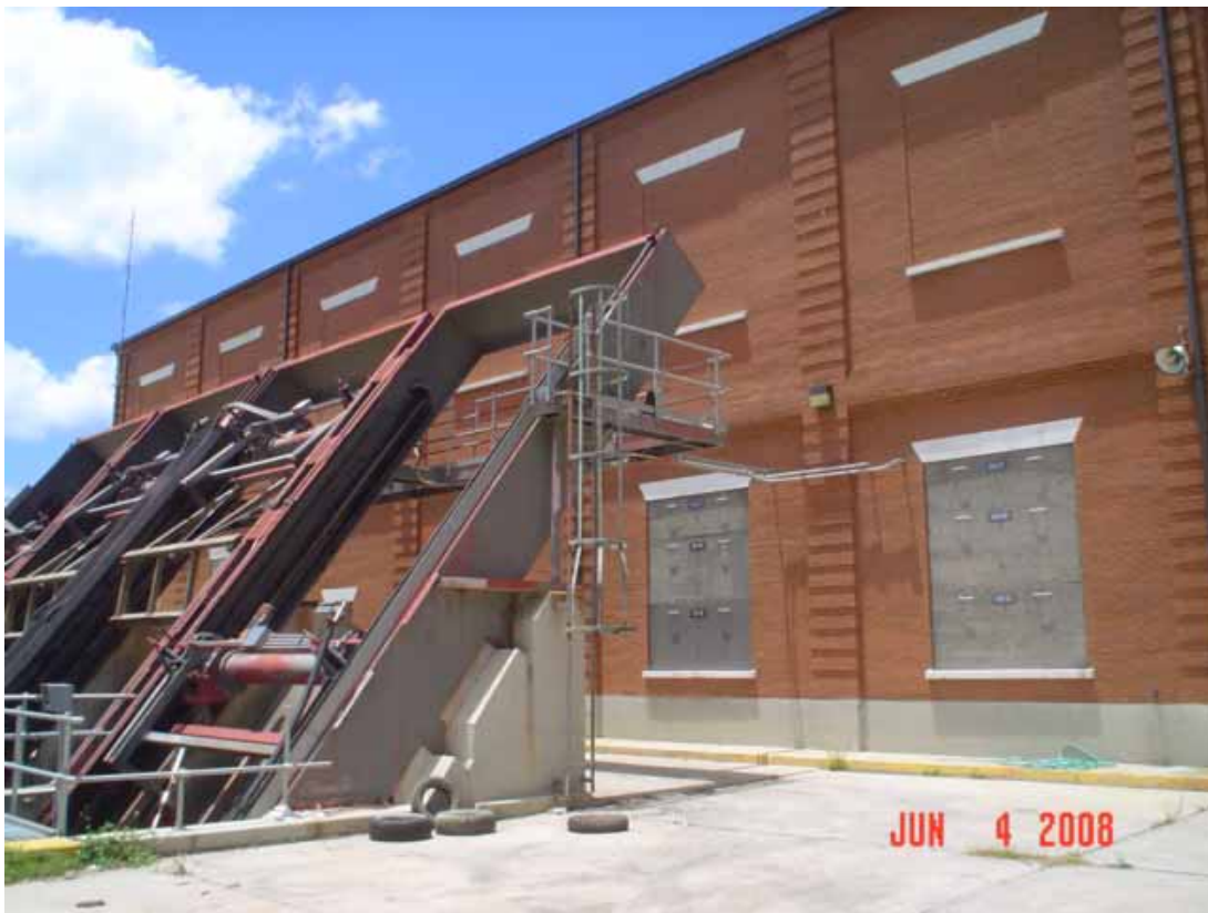
6. View of site as seen from the south direction, including screens.