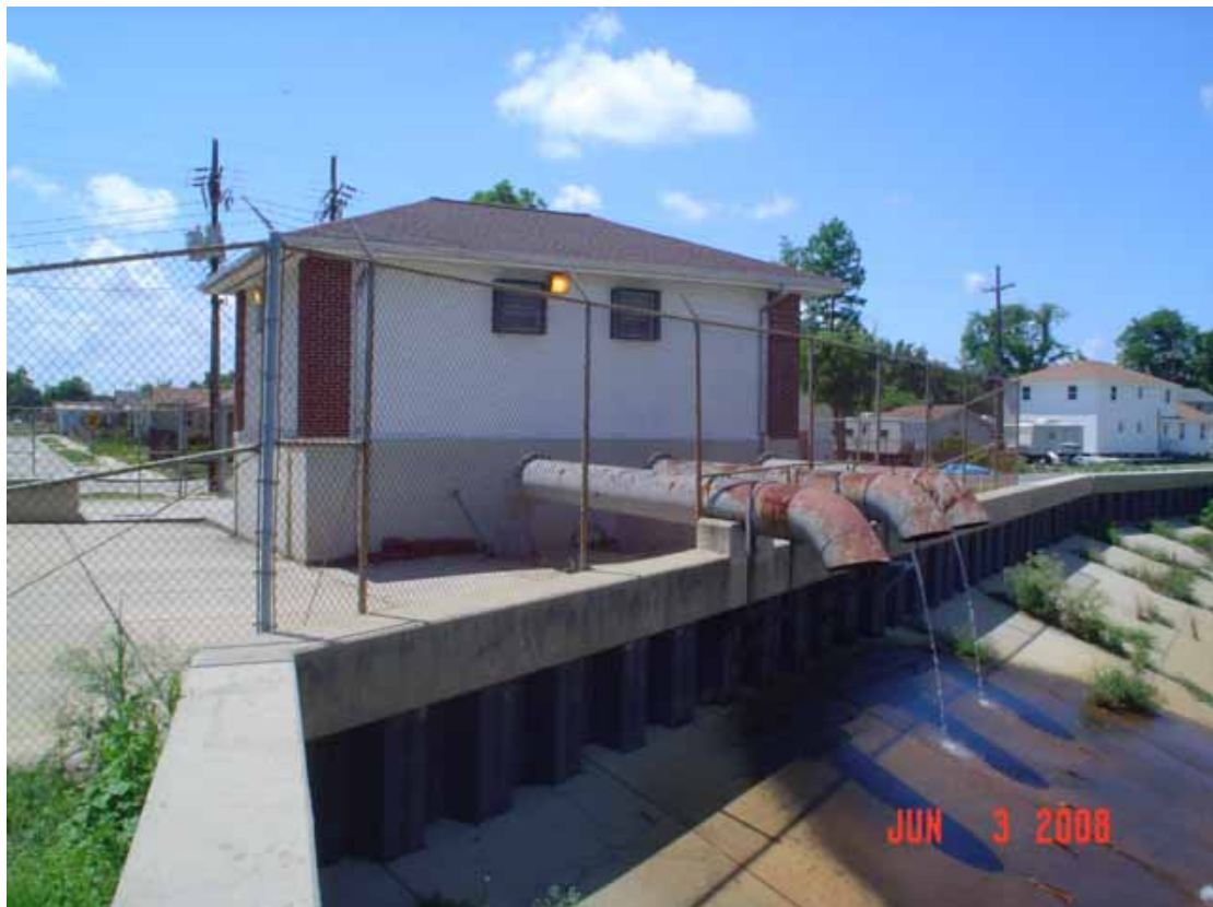
10. View of site as seen from the west direction.