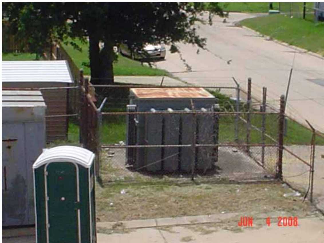
12. Additional transformer in northwest corner, owned by Entergy.