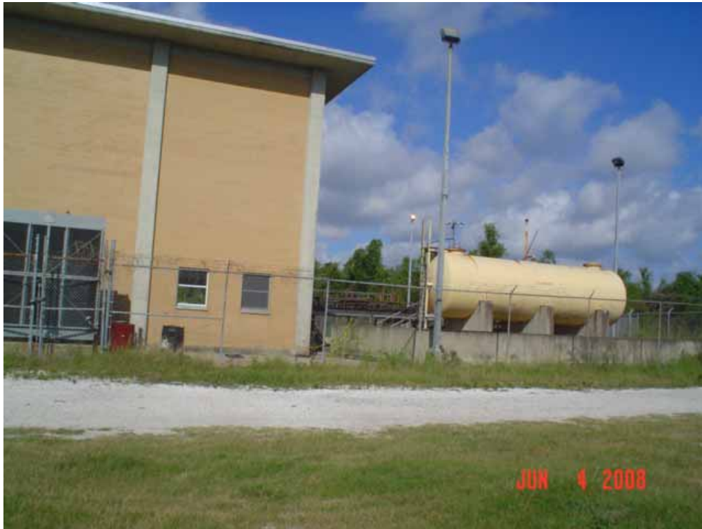
5. View of site as seen from the east direction, northeast corner.