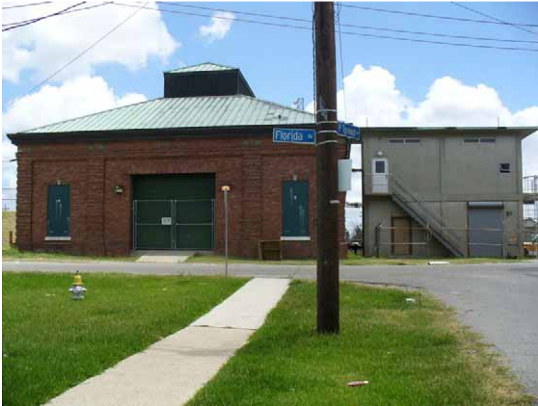
13. View of site as seen from the west direction, observe Generator Building to the right.