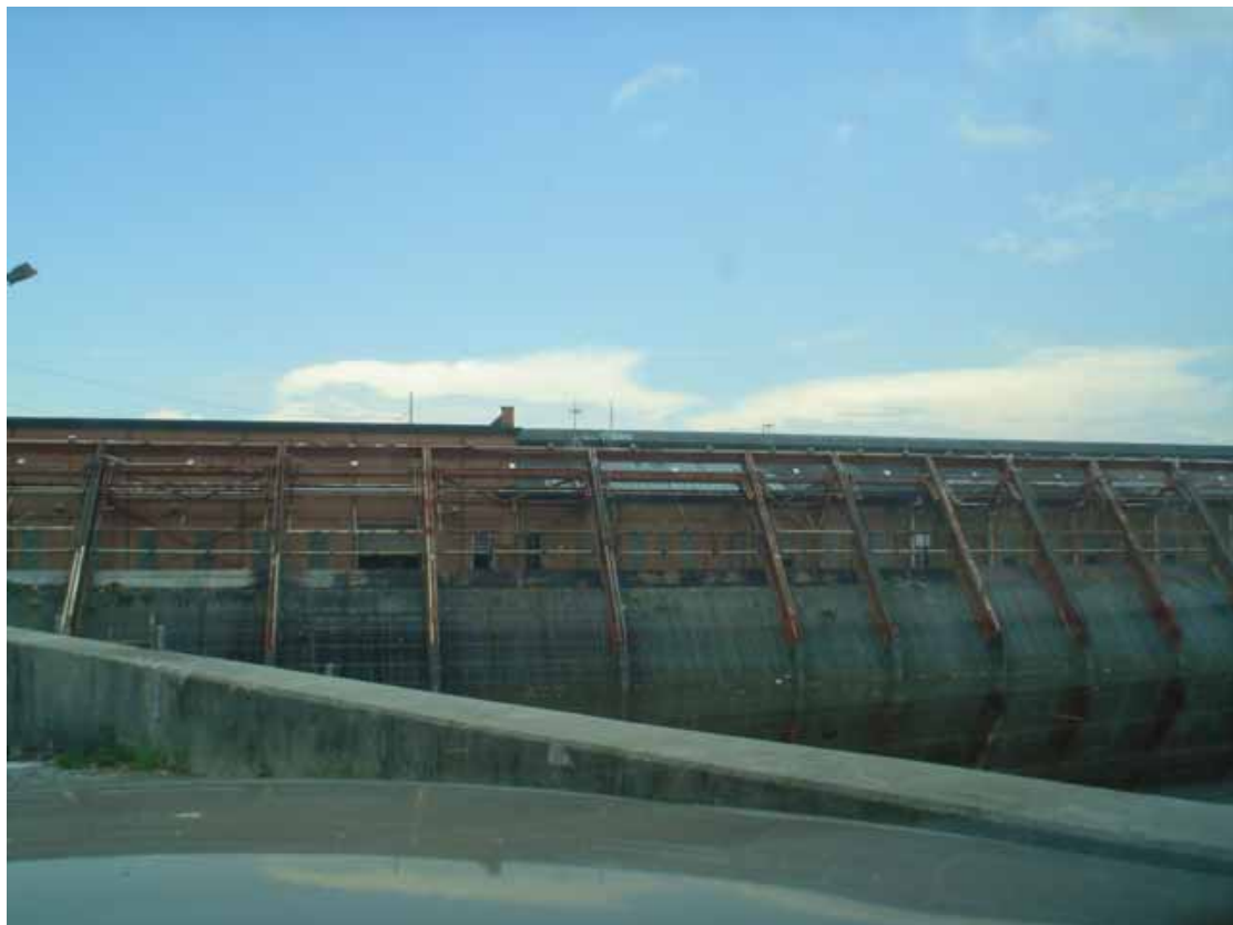
10. View of site as seen from the south direction.