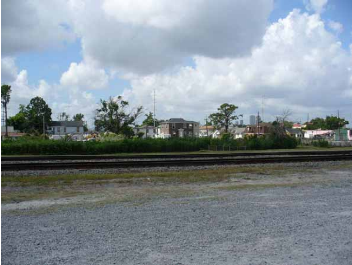
9. View of south area adjacent to the site, showing residential area.