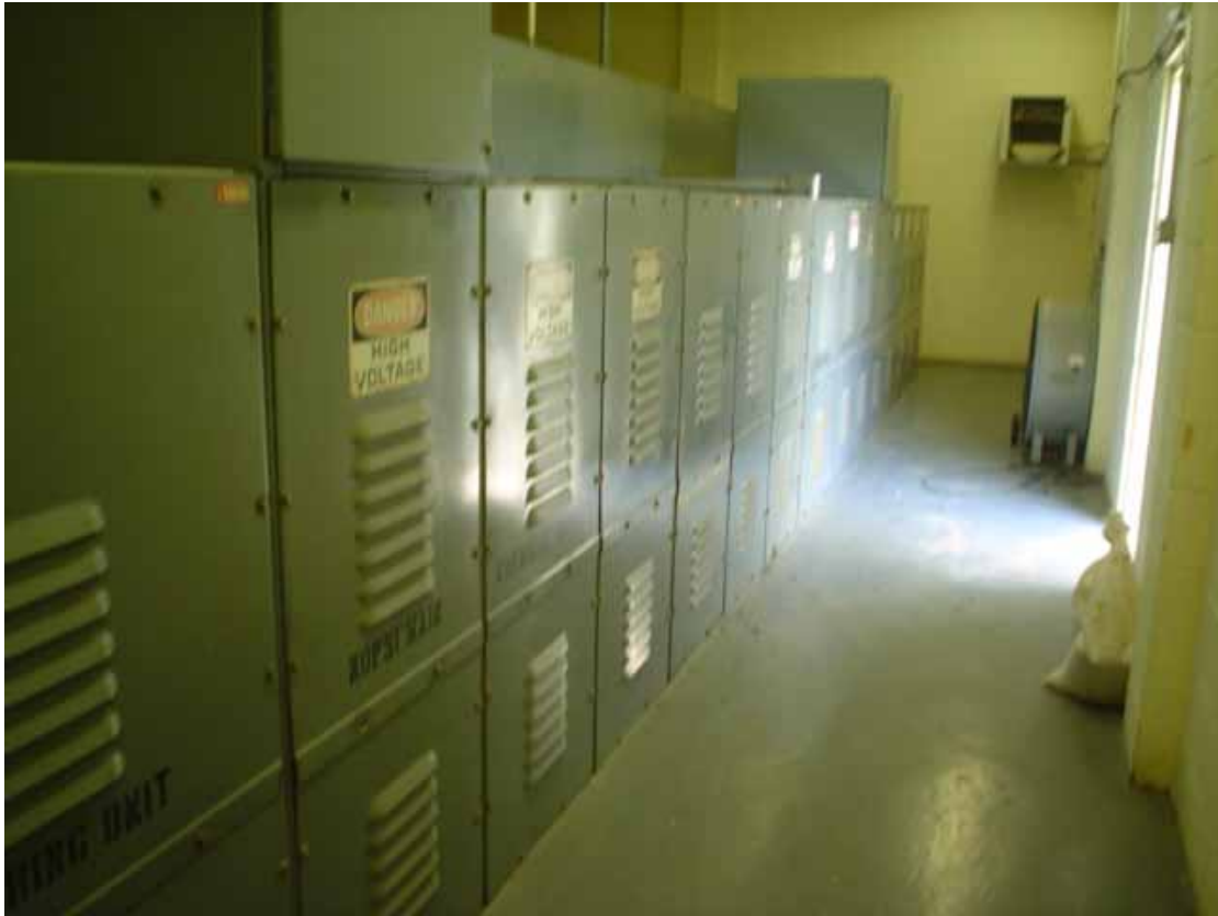
110. Breakers and switches inside Hamilton Street substation.