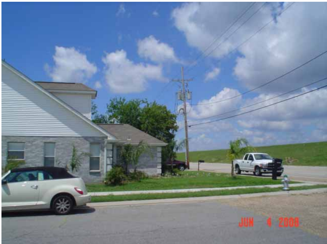
10. View of west area adjacent to the site.