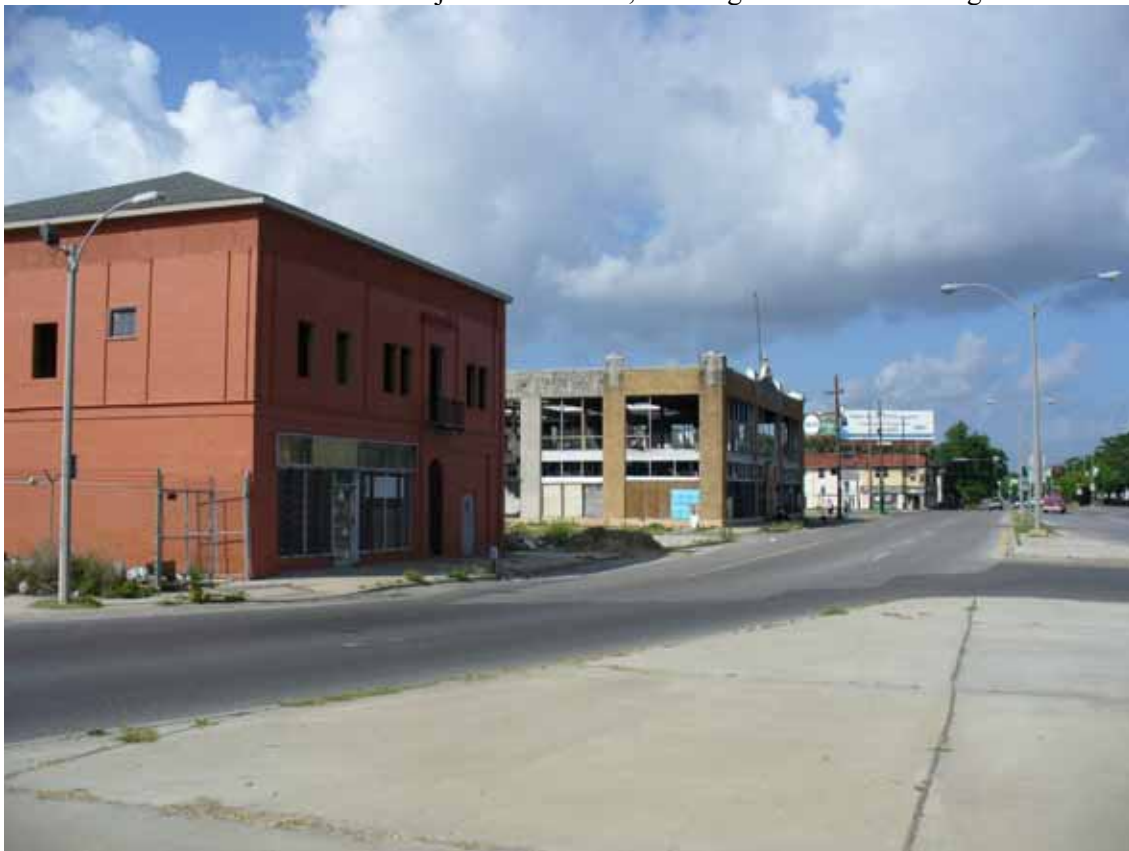
14. View of west area adjacent to the site, showing abandoned buildings.