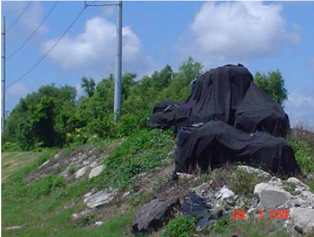
15. Unknown refuse along railroad tracks.