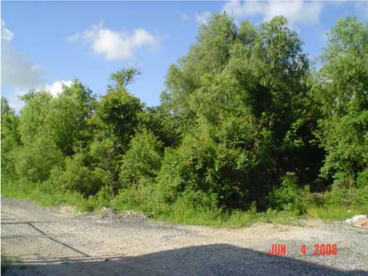
13. View of west area adjacent to the site.