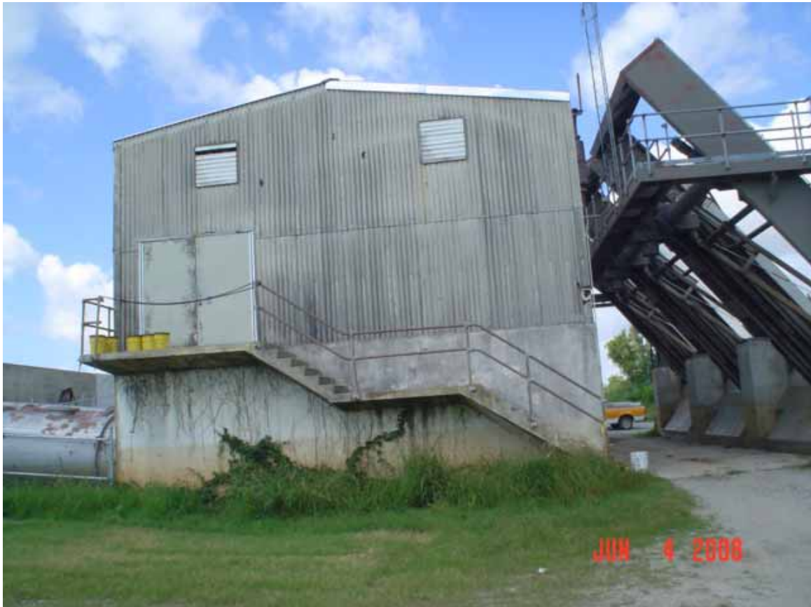
3. View of site as seen from the east direction.