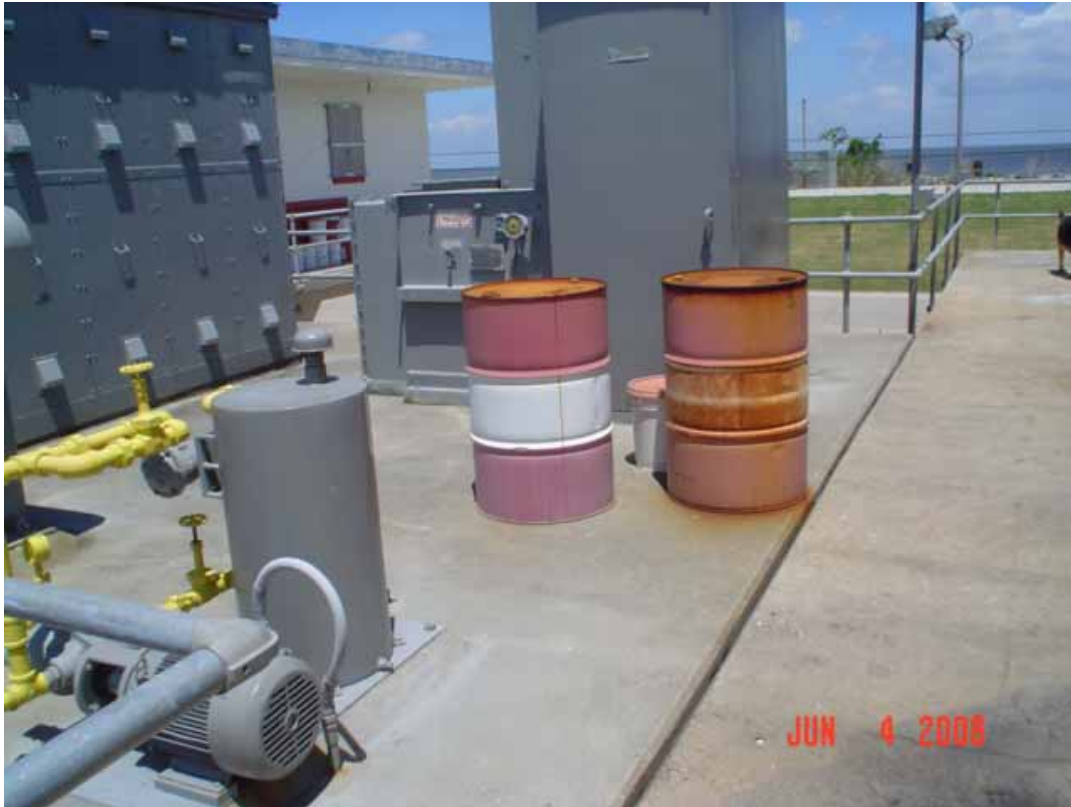
11. 55 gallon drums stored on top of the station building.