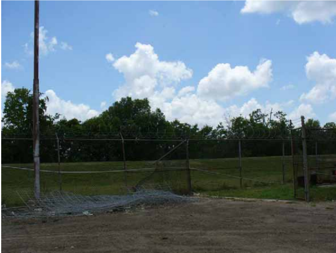
11. View of south area adjacent to the site.