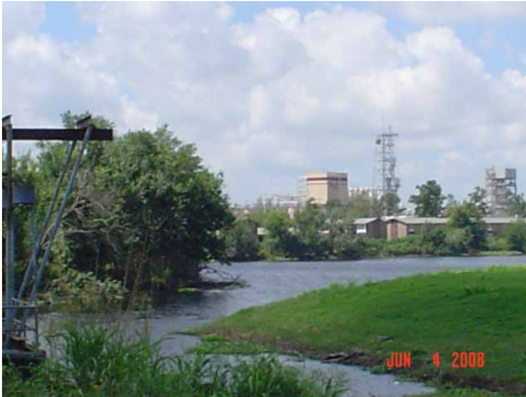
13. Industrial area southeaset of station and canal.