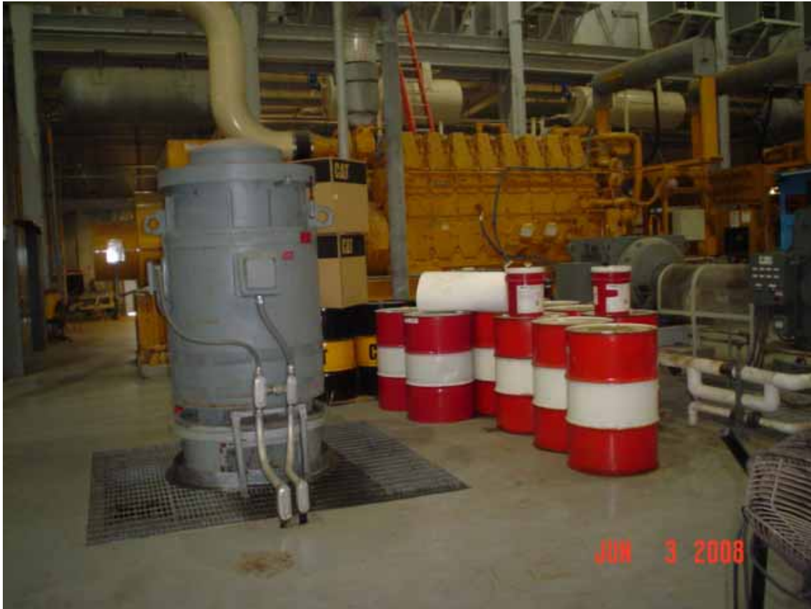
17. Diesel engine, pump motor and various drums inside building.