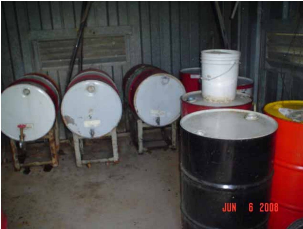
20. 55 gallon drums inside building.