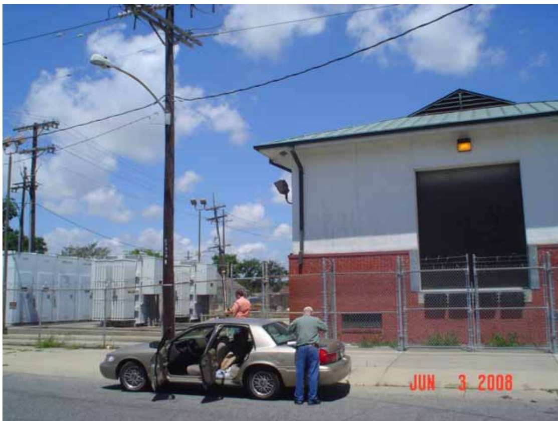
6. View of site as seen from the east direction, left side.