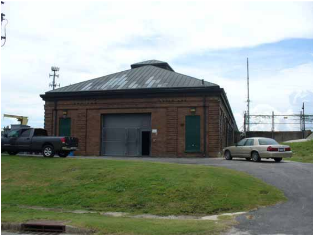
4. View of site as seen from the east direction.