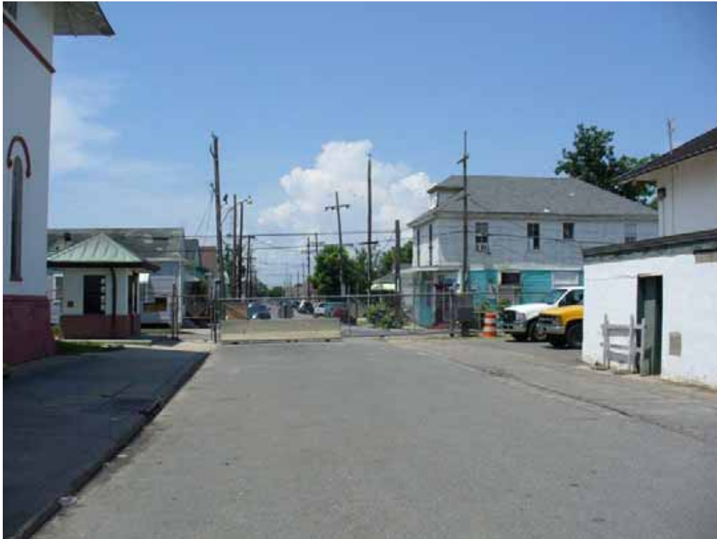
68. View south on Eagle Street.