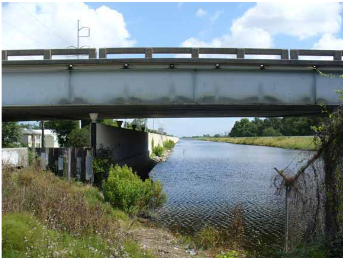
2. View of north area adjacent to the site, canal.