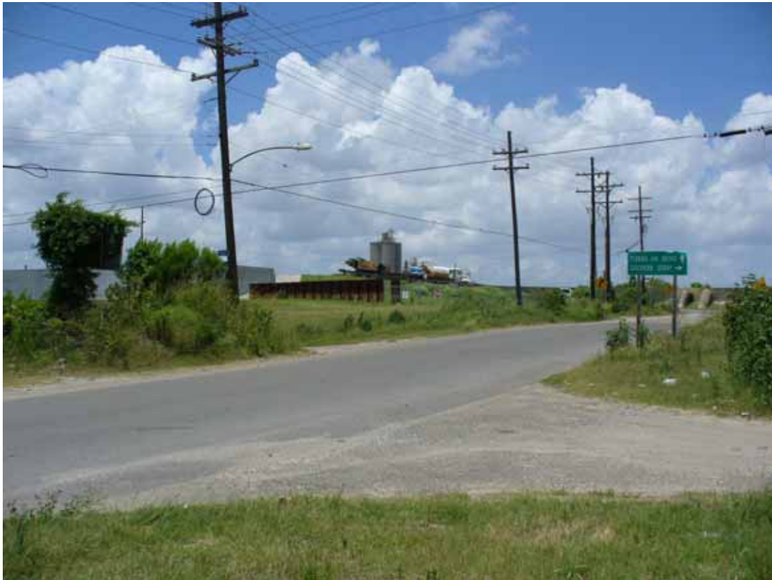
9. View of south area adjacent to the site including Southern Scrap, southwest corner.