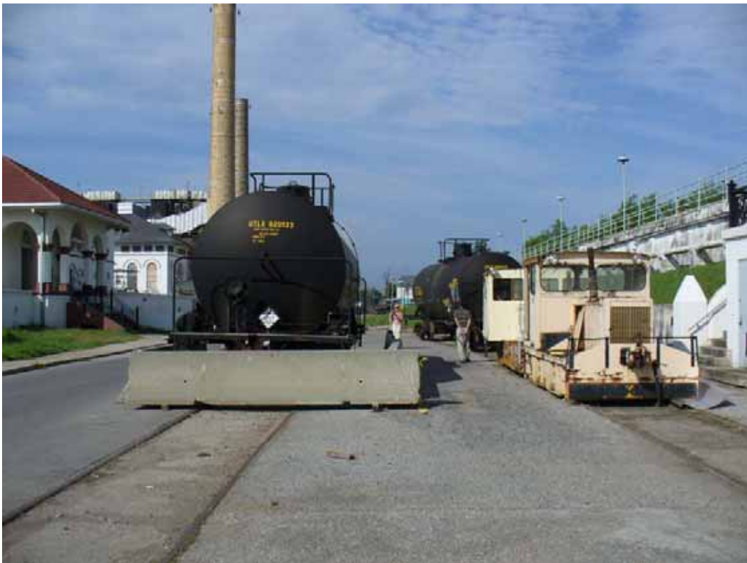
29. Chlorine railcars on Eagle Street in the middle of the site.