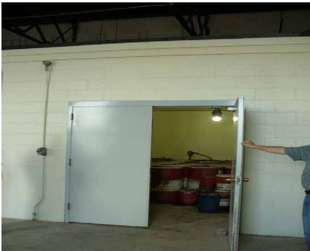
16. Fire proof storage room located in northwest area.