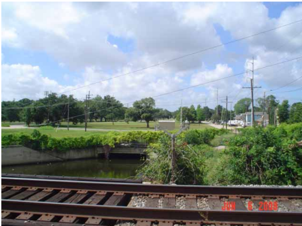
8. View of south area adjacent to the site, including air monitoring station in far center.