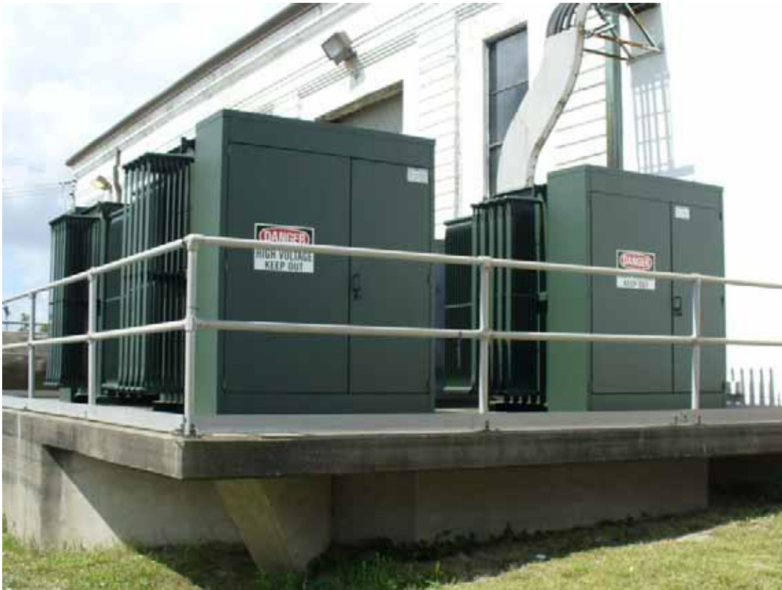
13. View of transformers in east area.