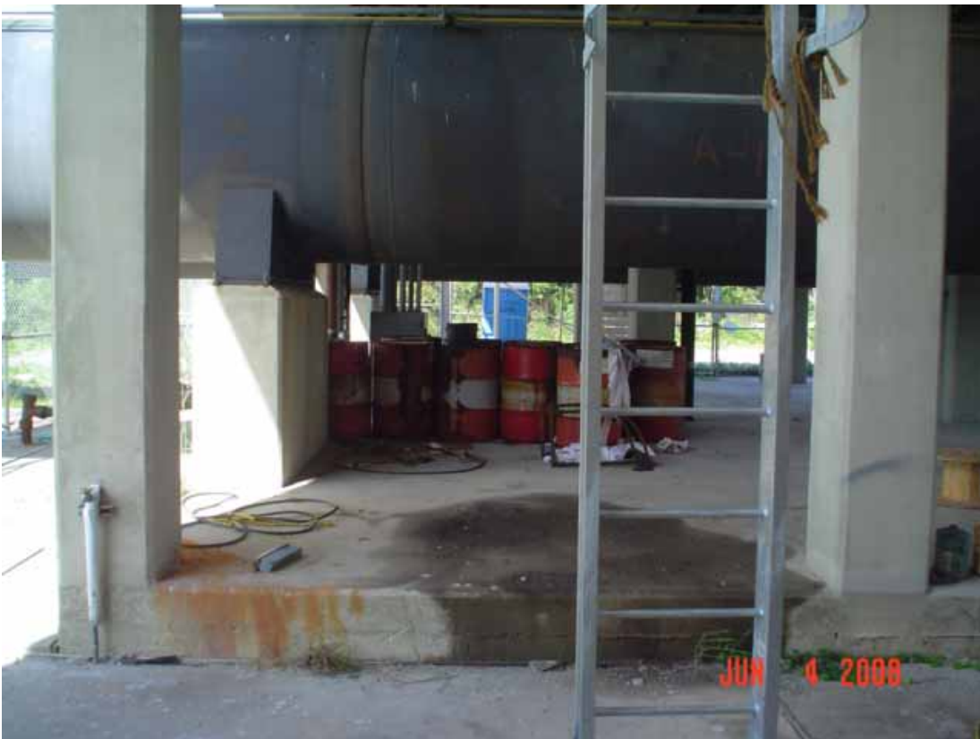
18. 55 gallon drums under pipeline.