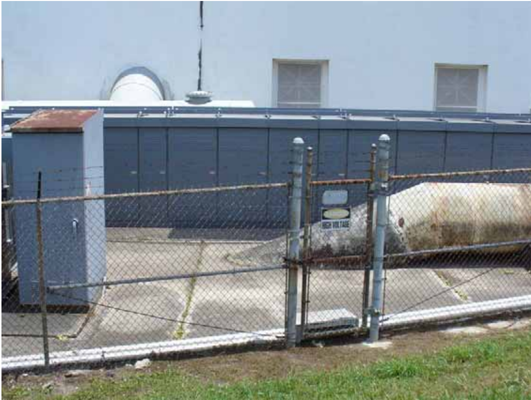
19. Switches on property south of building.