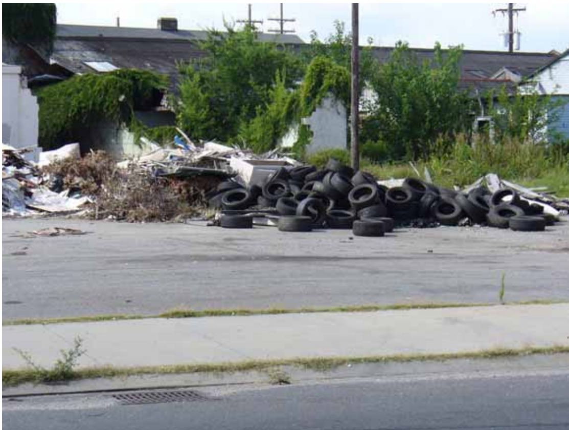
20. Refuse piles on an adjacent parcel.