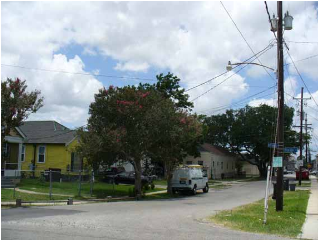
15. View of west area adjacent to the site, showing the residential area across from Florida Avenue and AP Tureau Street, observe the transformers located at corner.