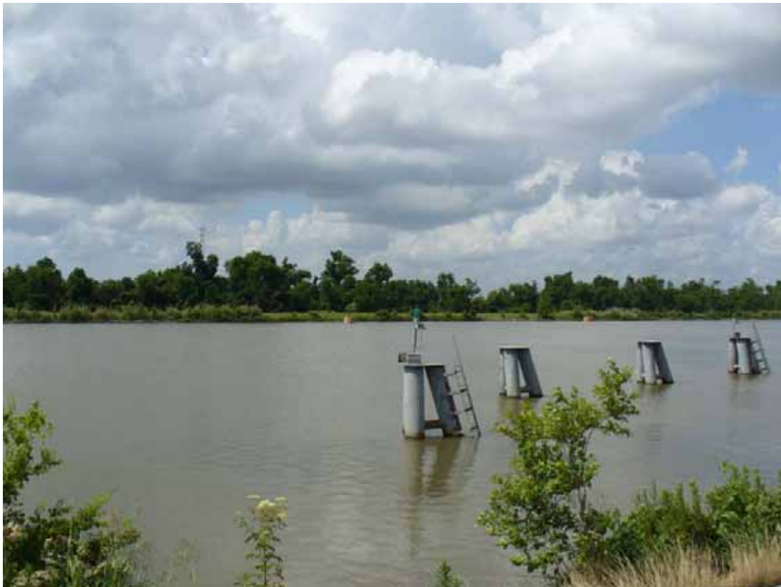
2. View of north area adjacent to the site.