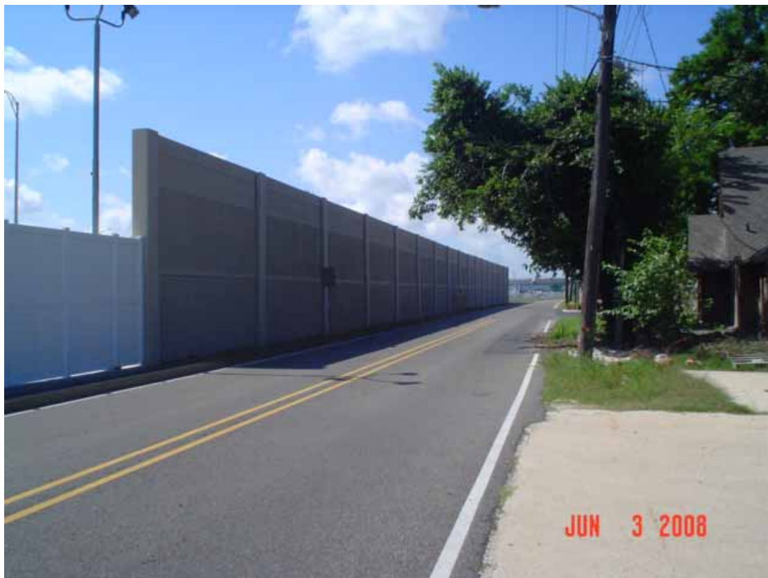
8. View of south area adjacent to the site along road.