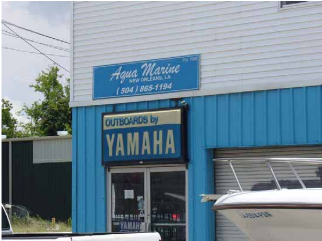
6. View of east area adjacent to the site, boat shop.