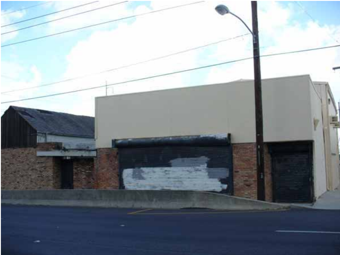
5. View of north area adjacent to the site, observe abandoned buildings on road next to canal.