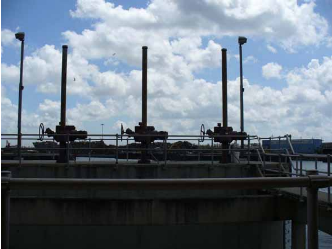
3. View of site as seen from the north direction, building is located to left of picture.