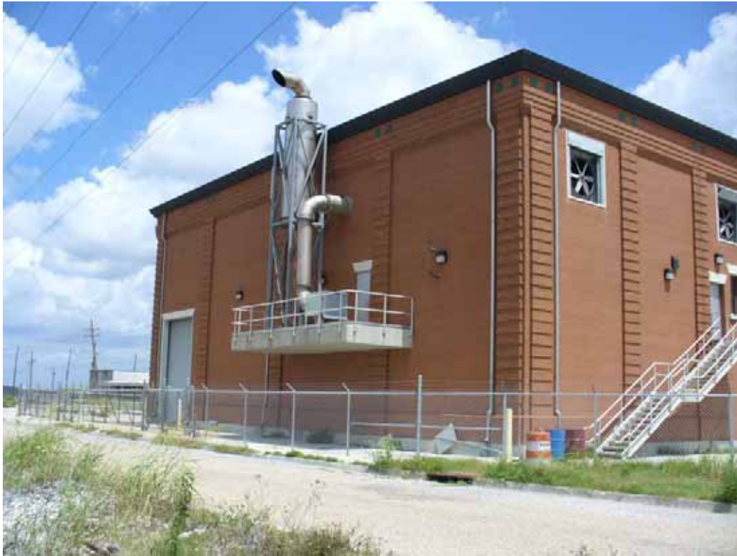
19. Generator building, south side.