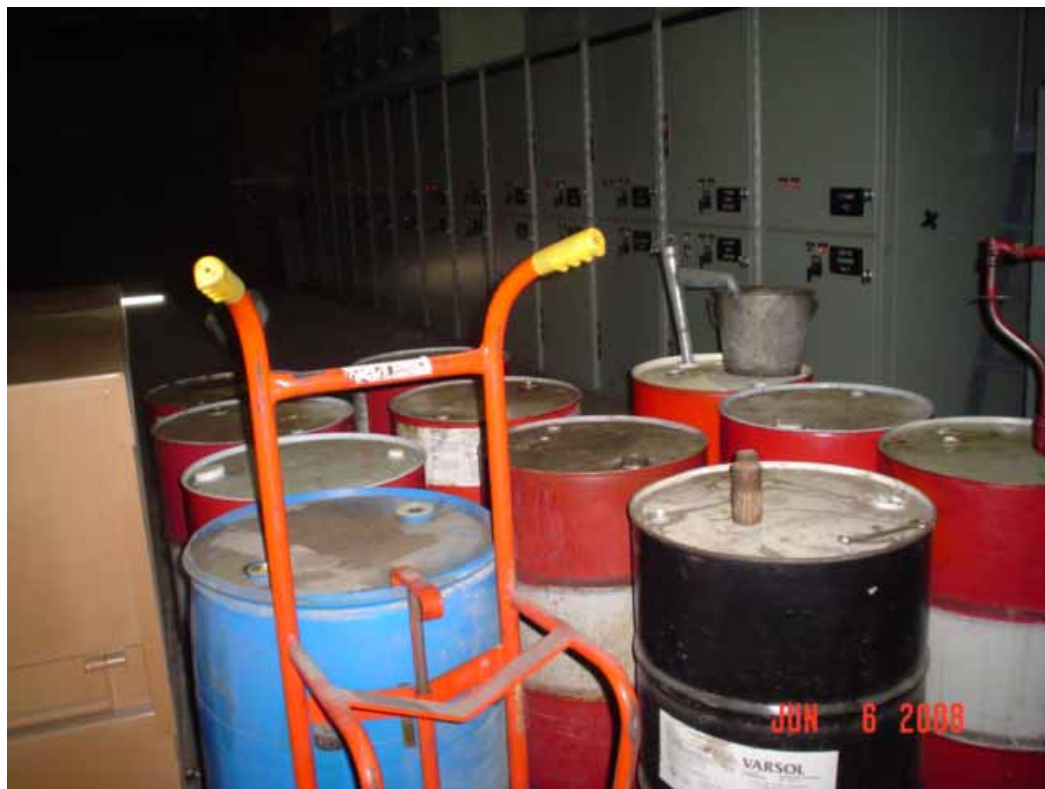
20. View of 55 gallon drums located inside pump building.