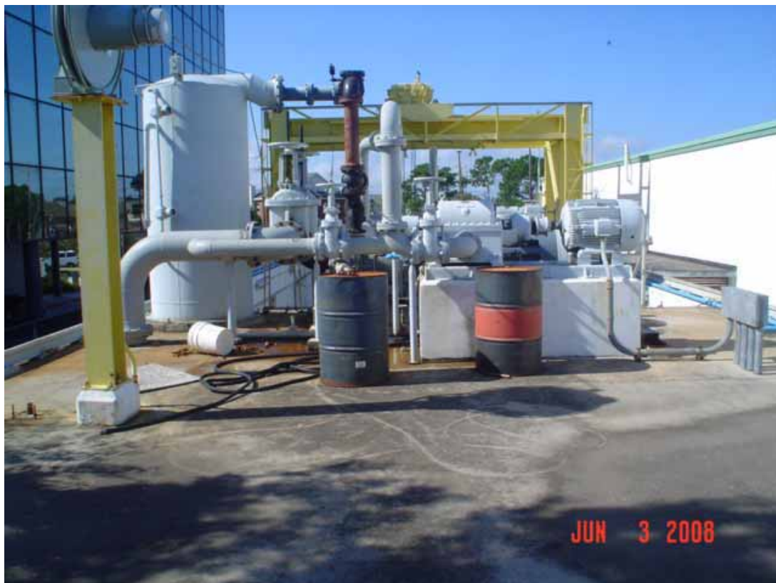
16. Observe pumps and rusting 55 gallon drums located on roof in northeast area.