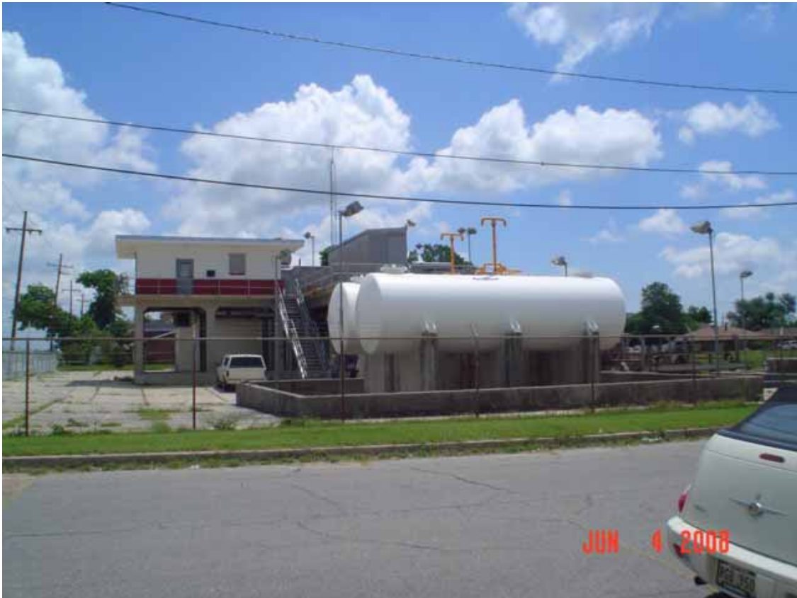
9. View of site as seen from the west direction, showing 20,000 gallon diesel tanks.