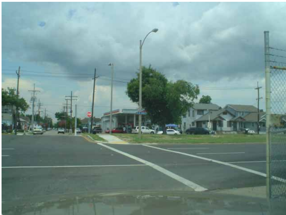
2. View of north area adjacent to the site, gas station on South Claiborne Avenue.