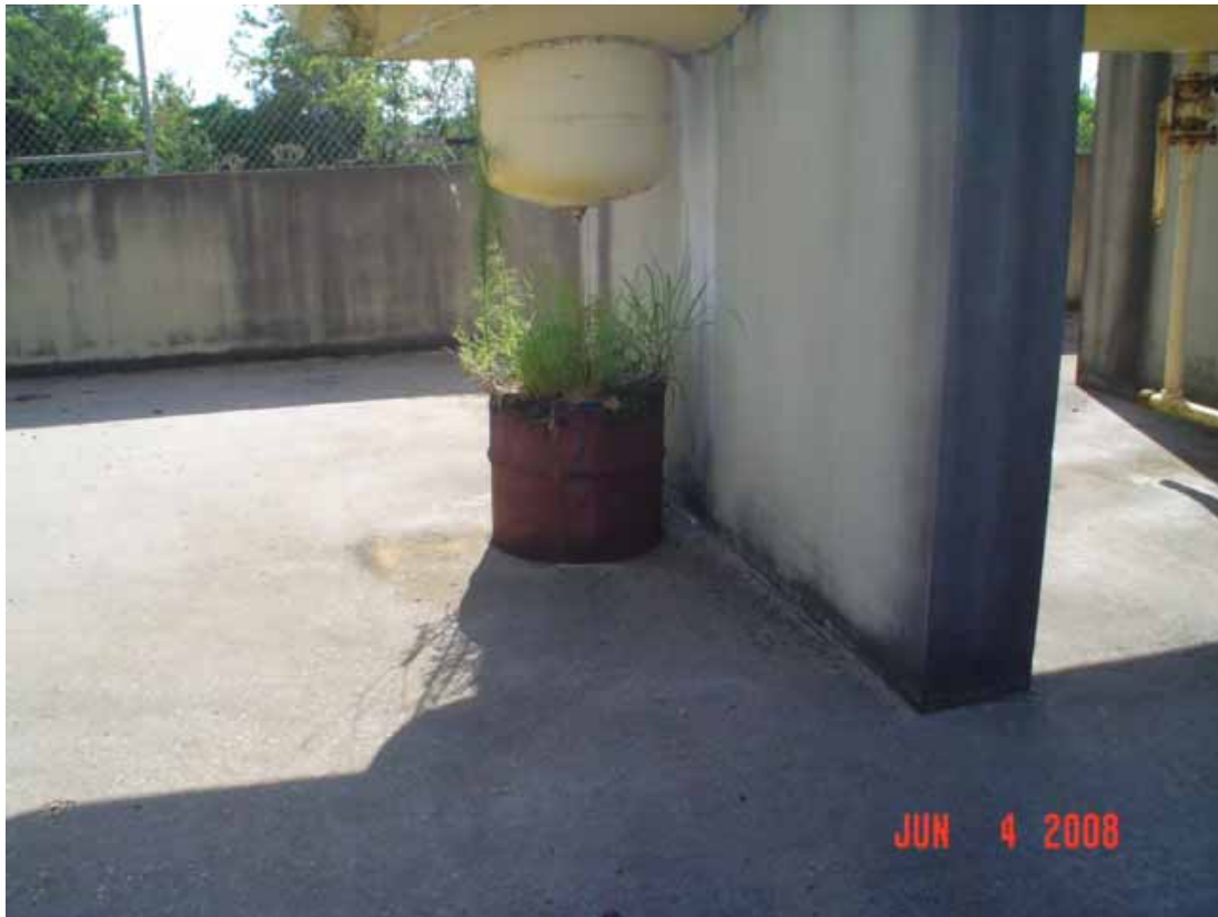
15. Plants growing under fuel tank.