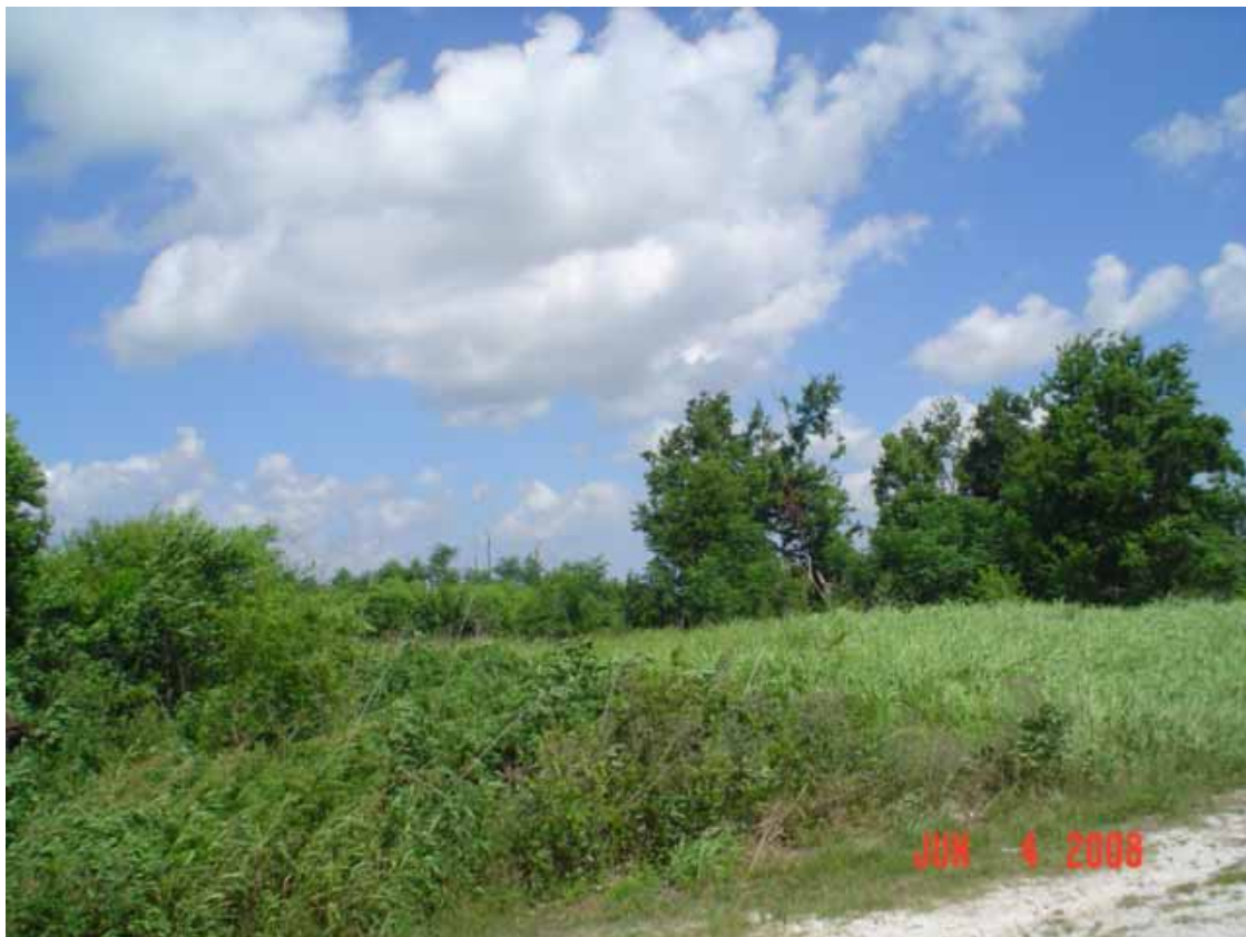
2. View of north area adjacent to the site, northwest corner.