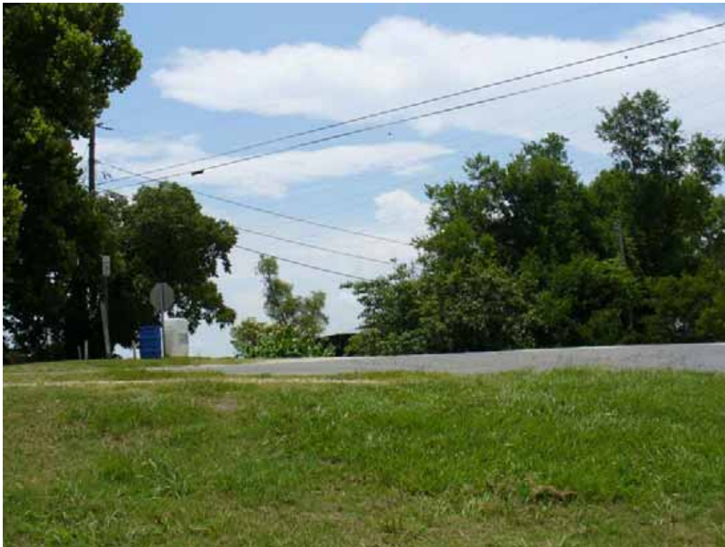
10. View of south area adjacent to the site, top of levee, northwest.