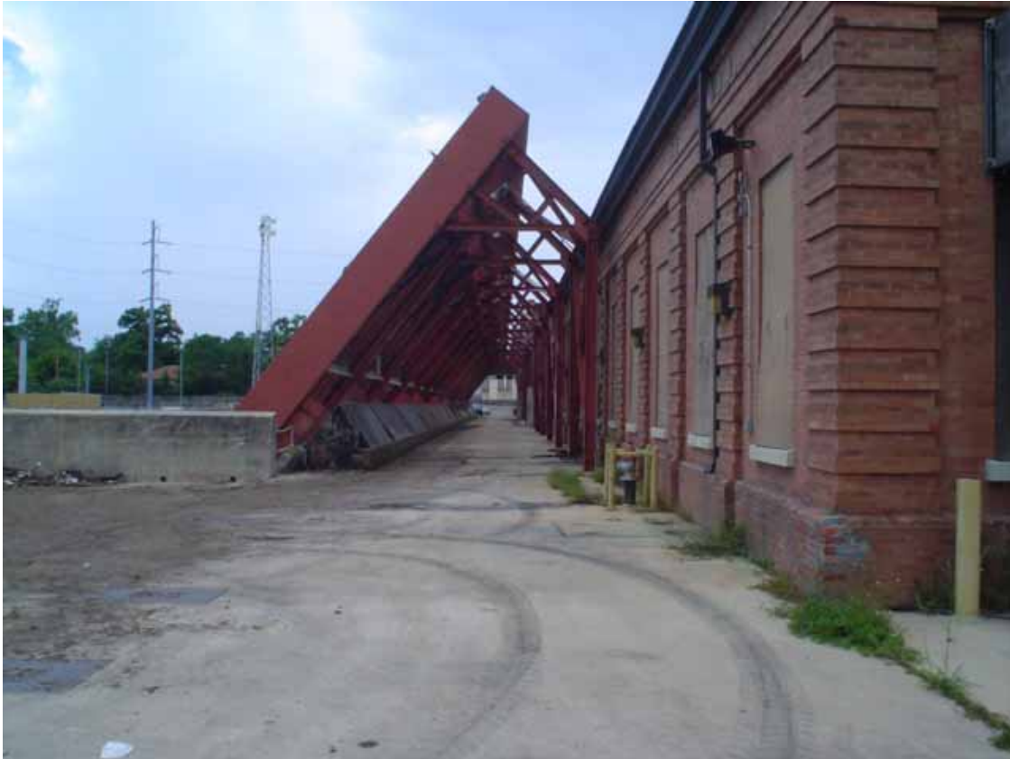
13. View of south area adjacent to the site, canal screens.