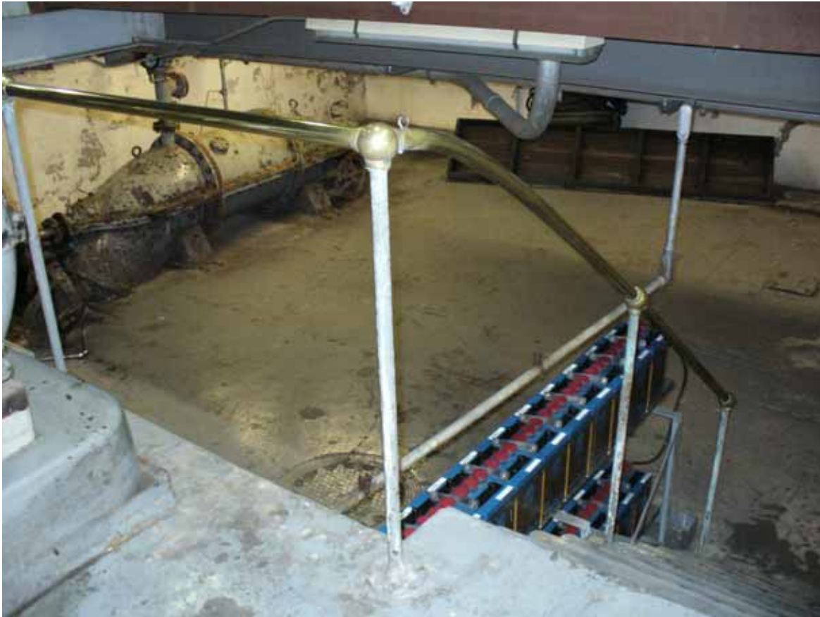
17. Battery banks inside pump house