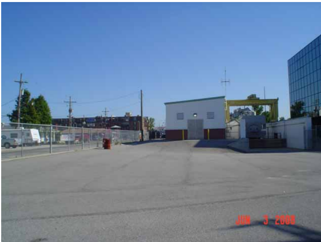
6. View of site as seen from the south direction. Observe transformers on poles located west of the site.