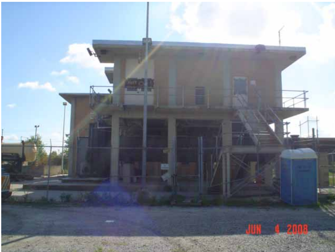
12. View of site as seen from the west direction.