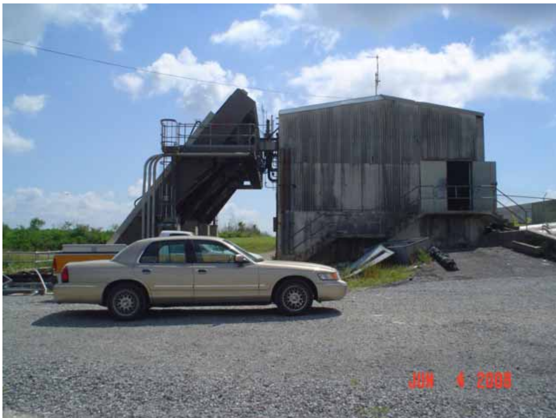
8. View of site as seen from the west direction.