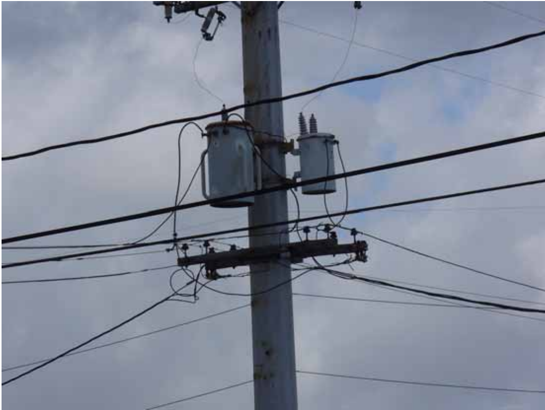
17. View of transformers located outside on west side of property. Several others were observed in the area.