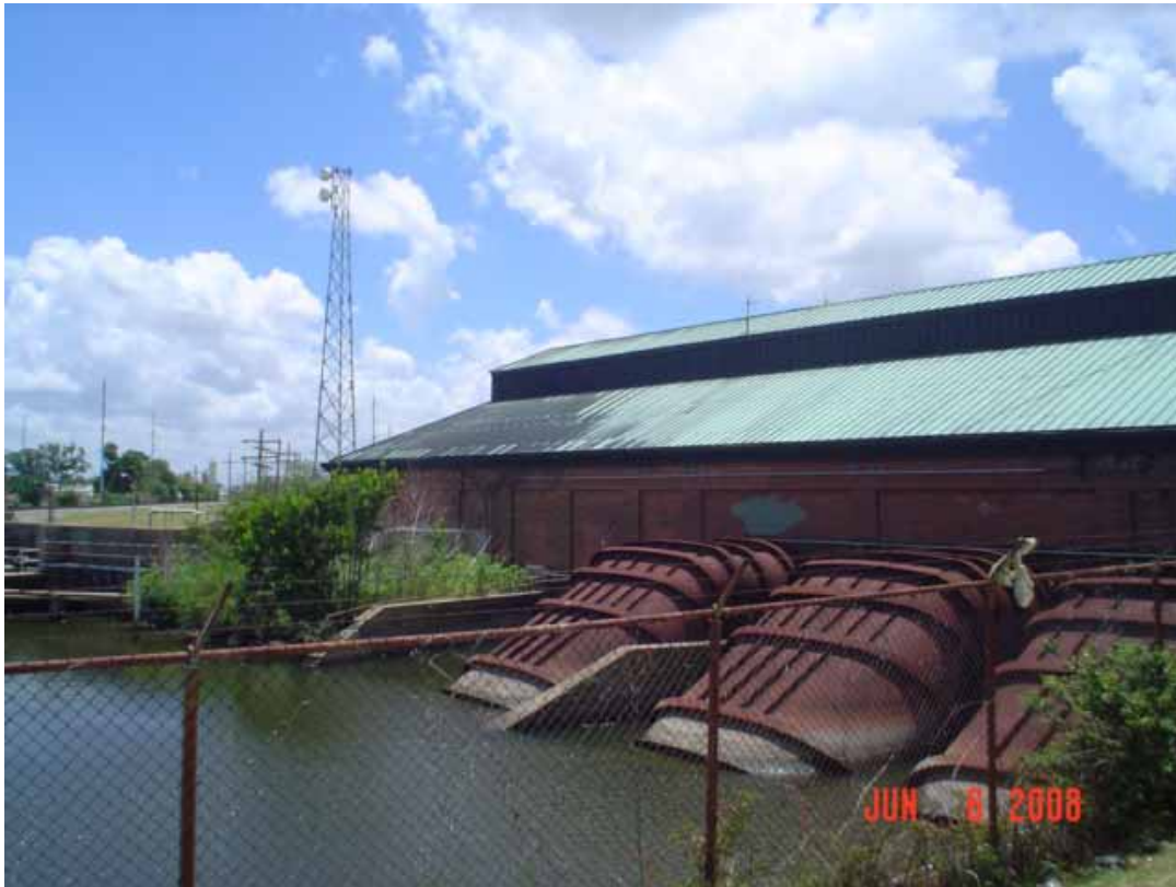
1. View of site as seen from the north direction, northeast side.