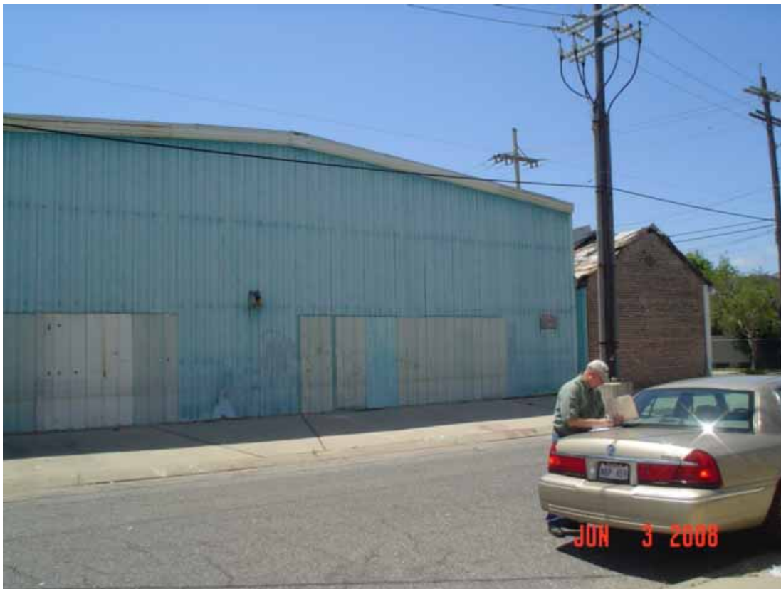
8. View of east area adjacent to the site