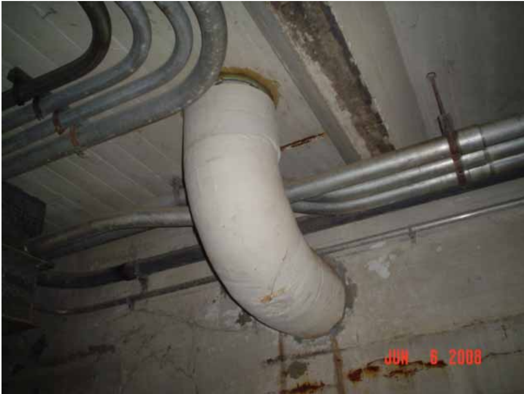
19. Insulated pipeline inside building.