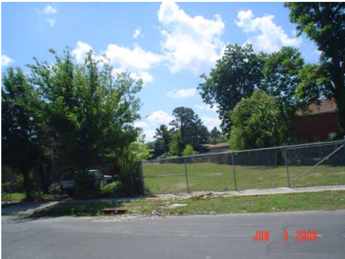
4. View of east area adjacent to the site, including right of way across street.