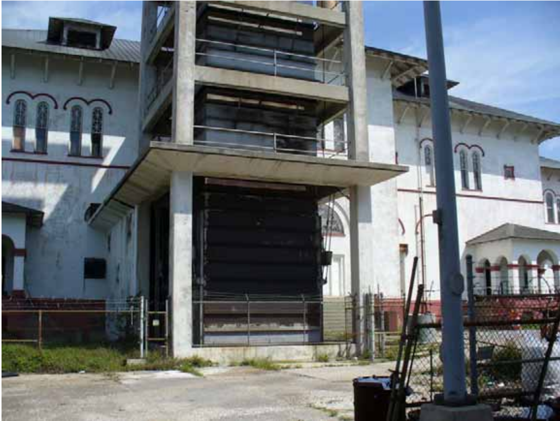
52. East side of high-lift building.