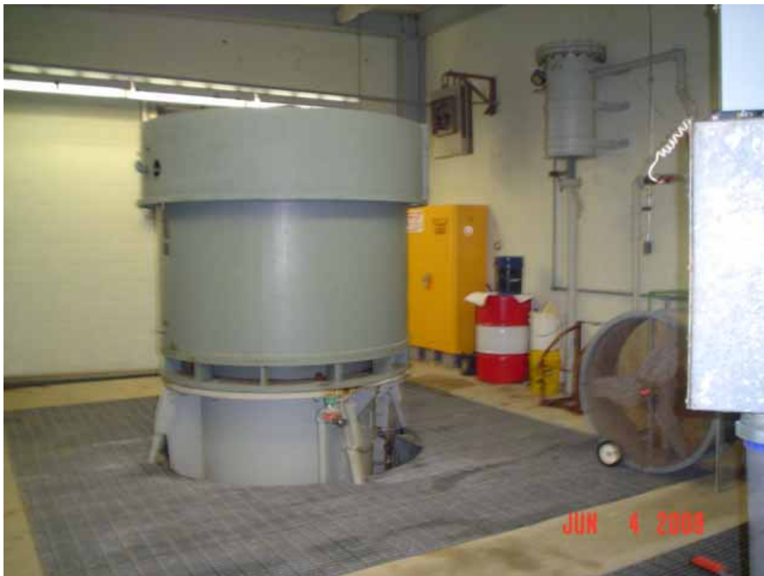
16. Pump motor inside building