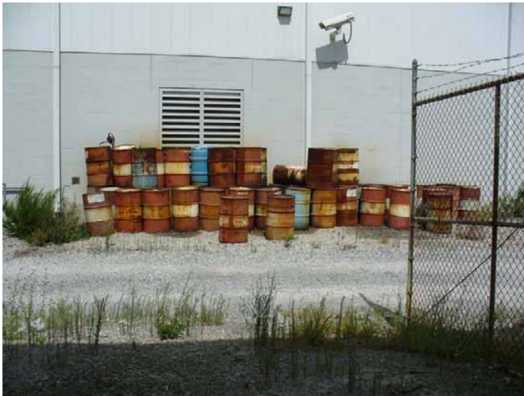
12. View of 55 gallon drums stored outside storage building.