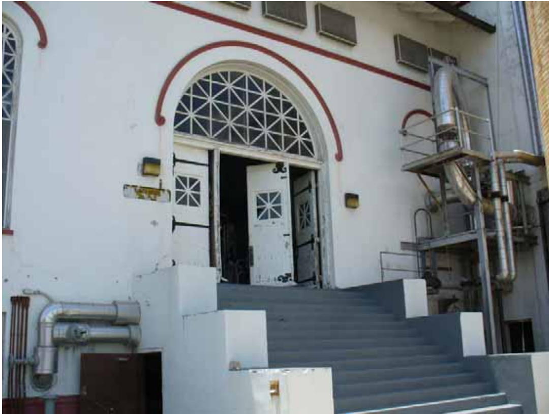
76. West entrance to power house.