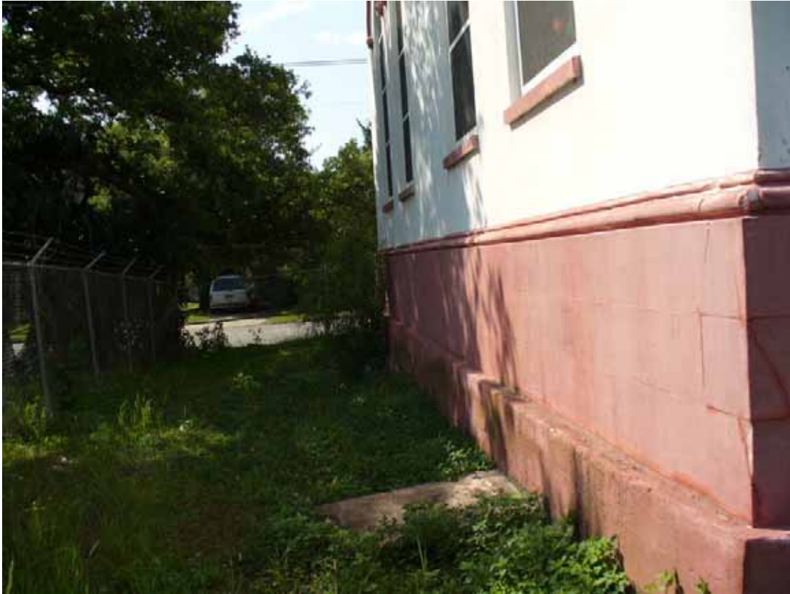
40. Observed standing water in large hole at corner of building.