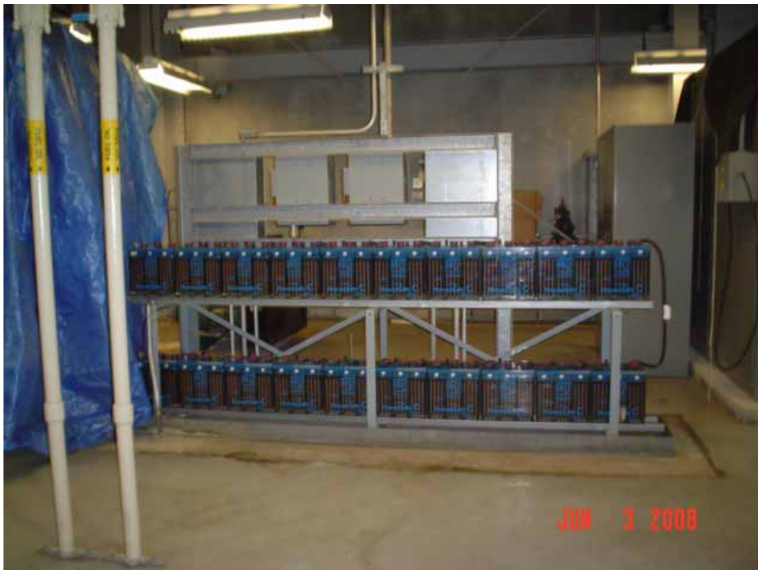
18. Battery bank and switch boxes inside building.