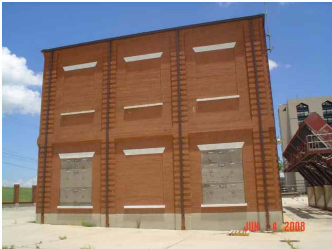
8. View of site as seen from the west direction.