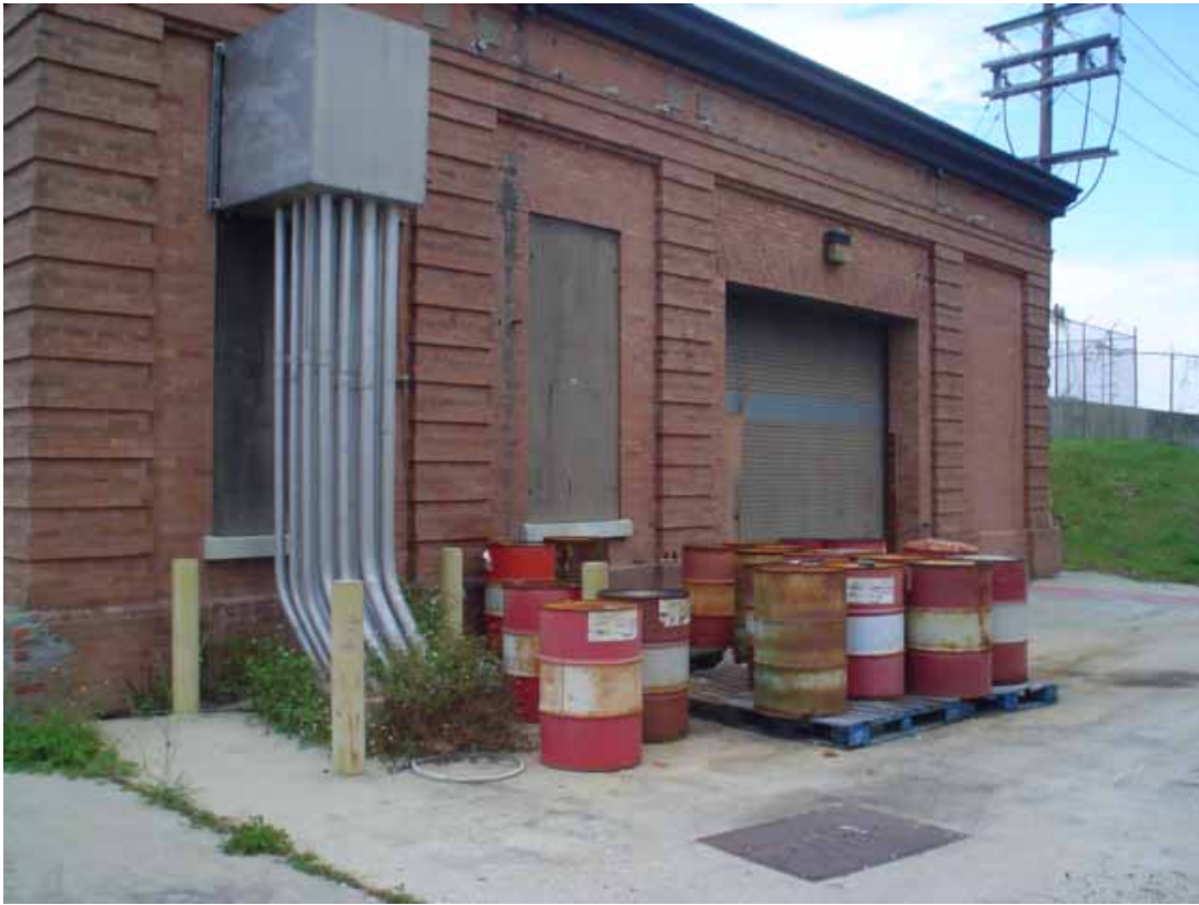
7. View of site as seen from the east direction. Observe 55 gallon drums stored outside.