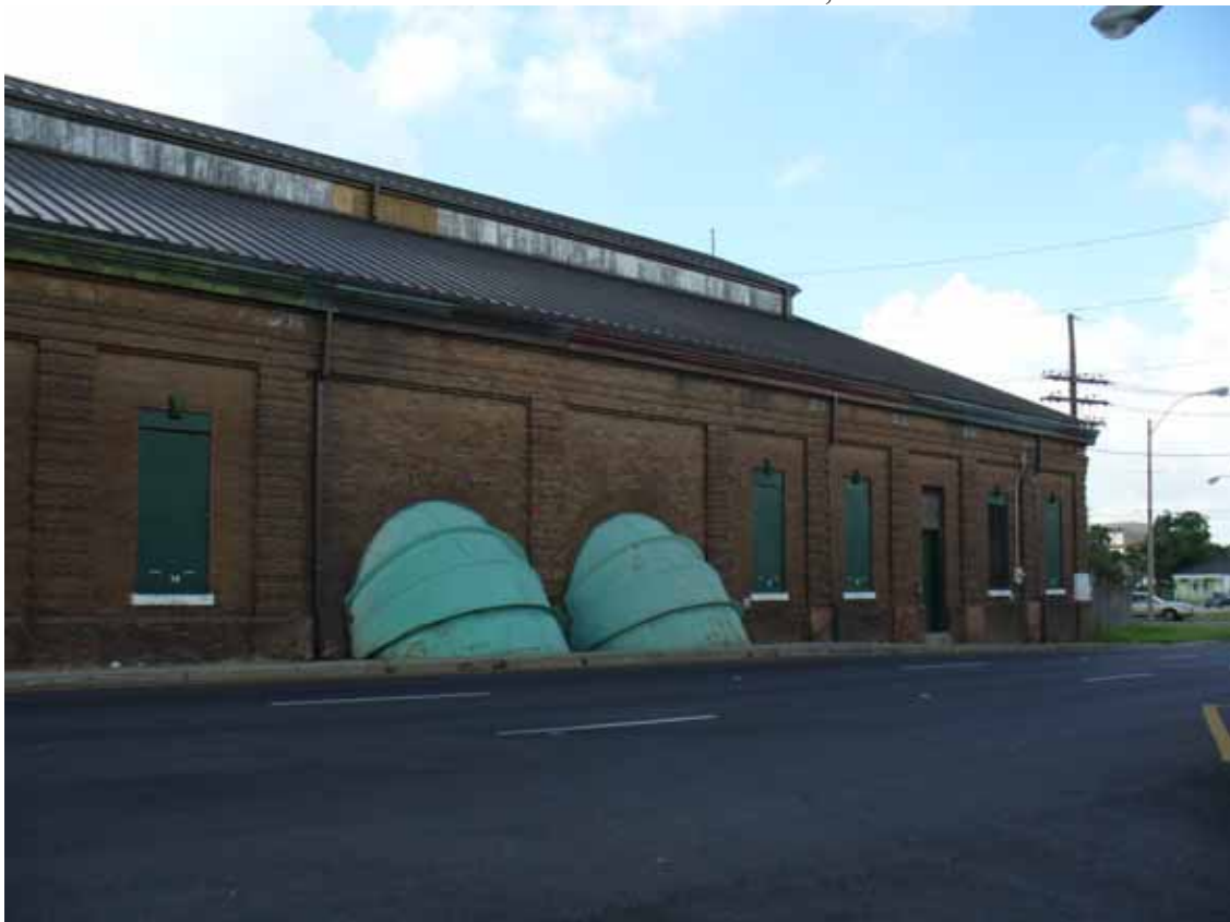
2. View of site as seen from the north direction, northwest half.