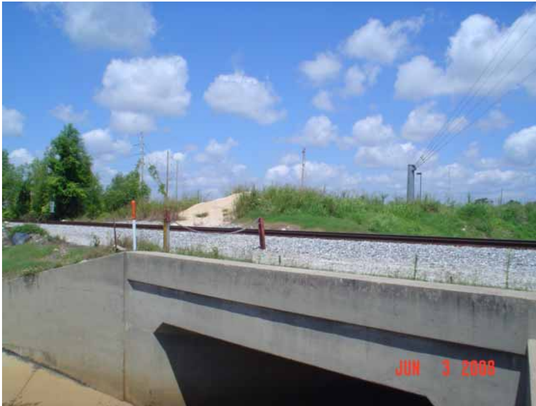
11. View of west area adjacent to the site, southwest corner, showing railroad and buried fiber optic cable.