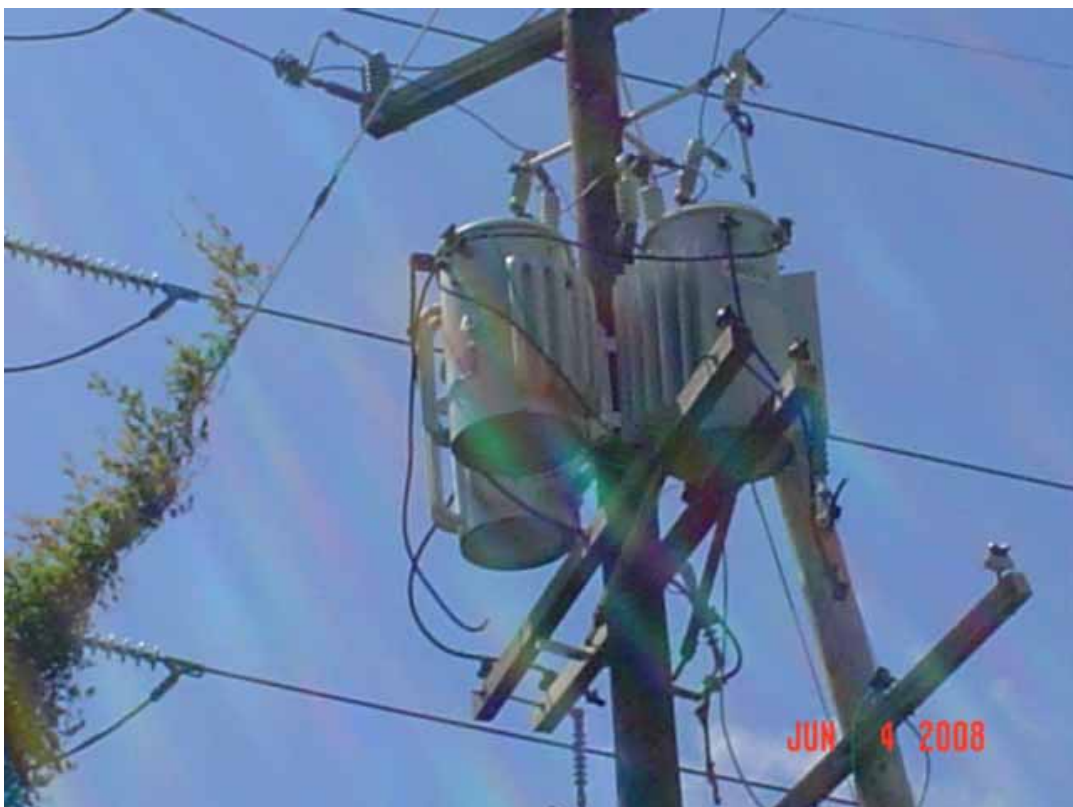
12. Transformers on the northeast corner.