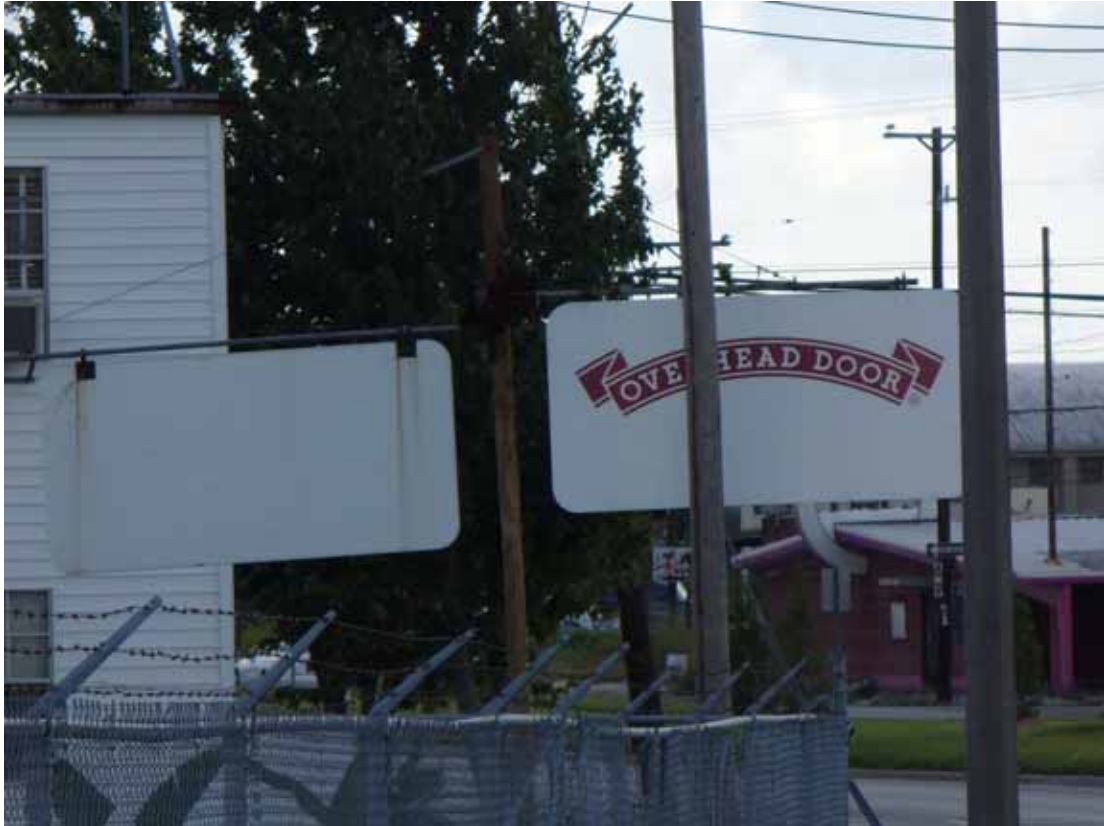
3. Close-up view of north area adjacent to the site, showing Overhead Door property.