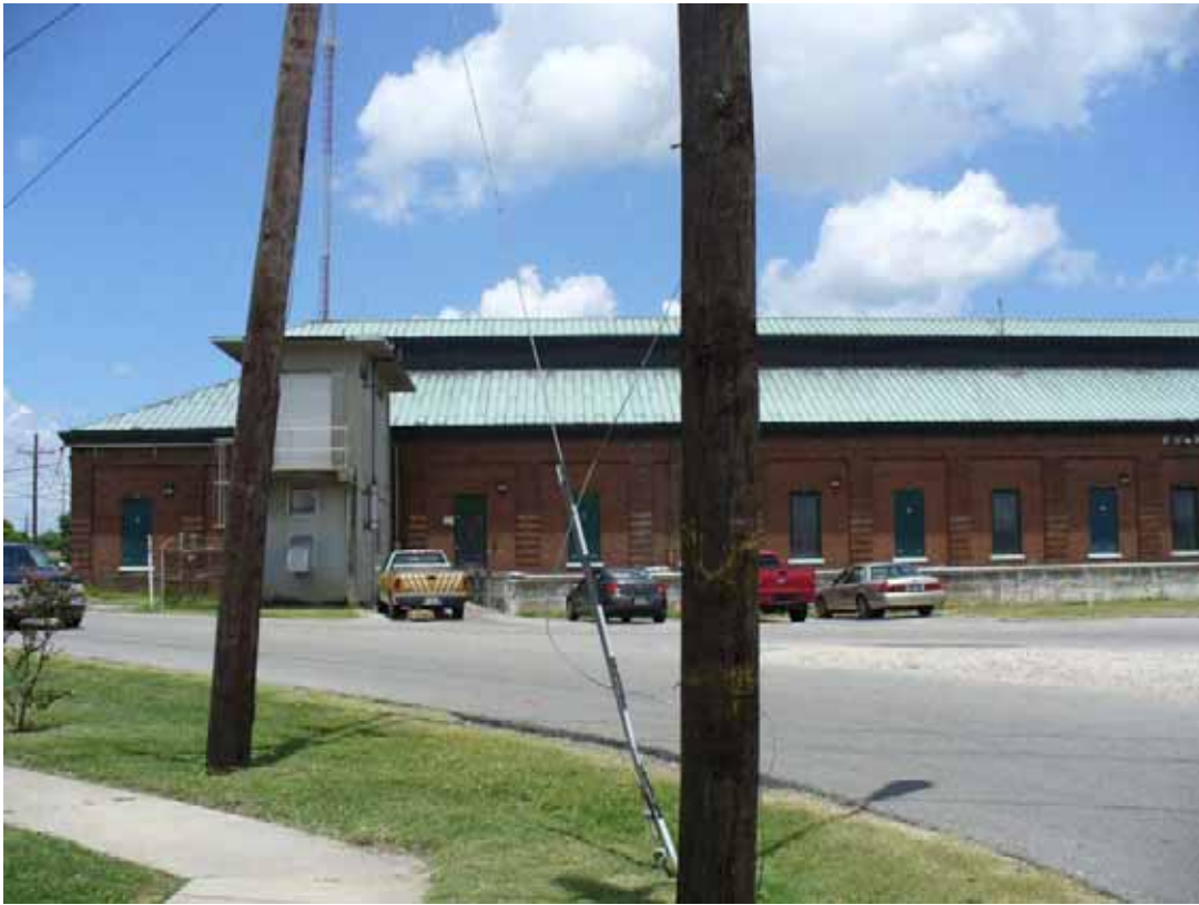
9. View of site as seen from the south direction, in southwest area. Generator Building is located on left side.