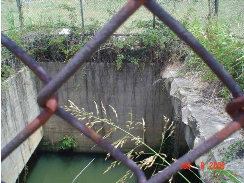
19. Another view of fenced-in pit adjacent to railroad tracks in northwest area.