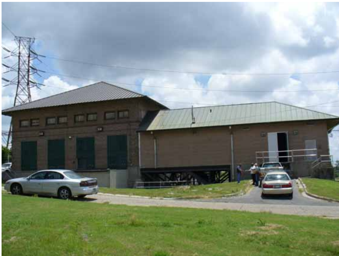
10. View of site as seen from the west direction.