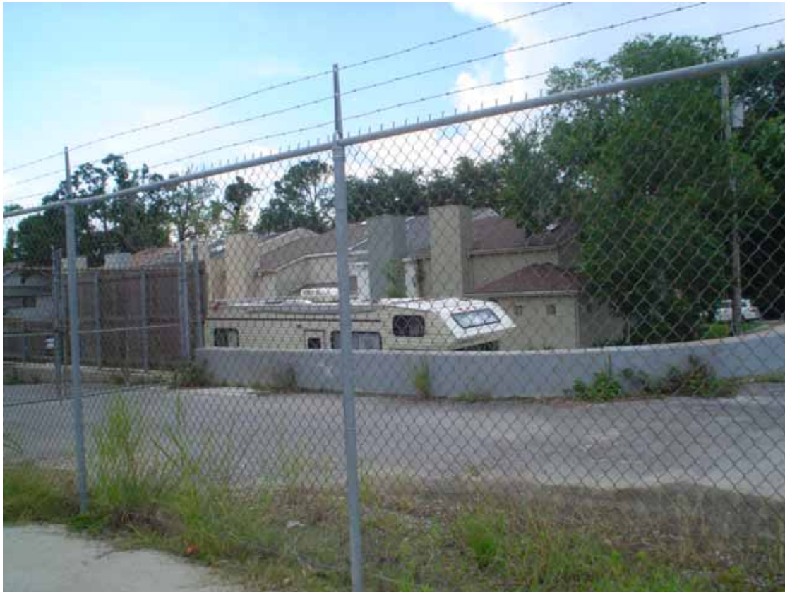
15. View of west area adjacent to the site, residential area, southwest corner.