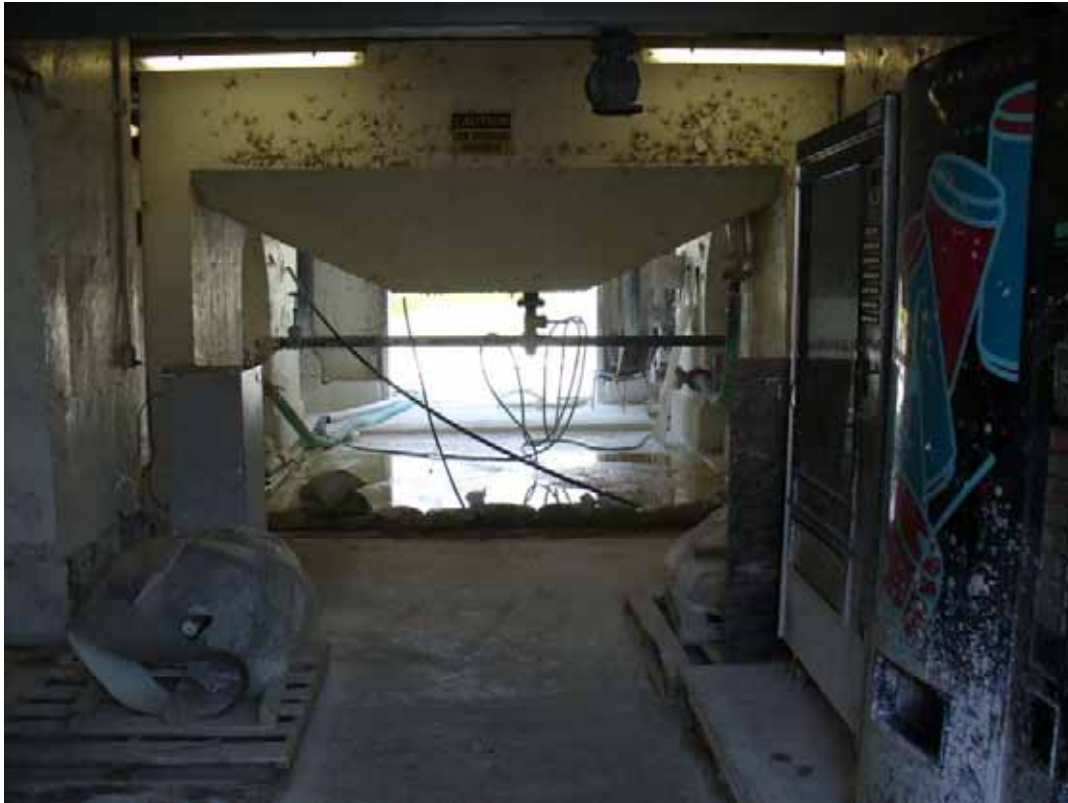
86. Lime storage dumpster in the chemical house.