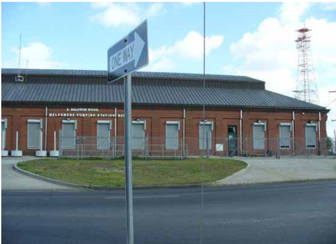
8. View of site as seen from the south direction.