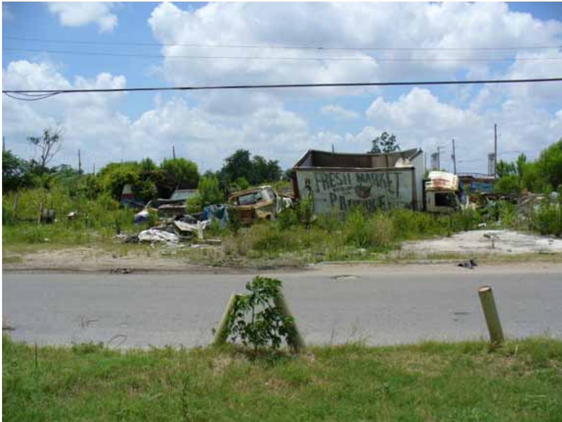
7. View of south area adjacent to the site.