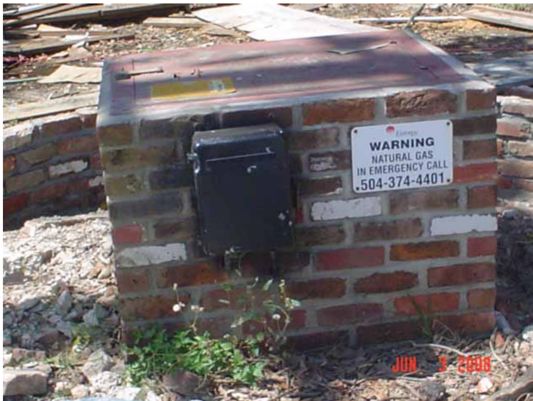
14. Gas line, residential area, southwest corner.