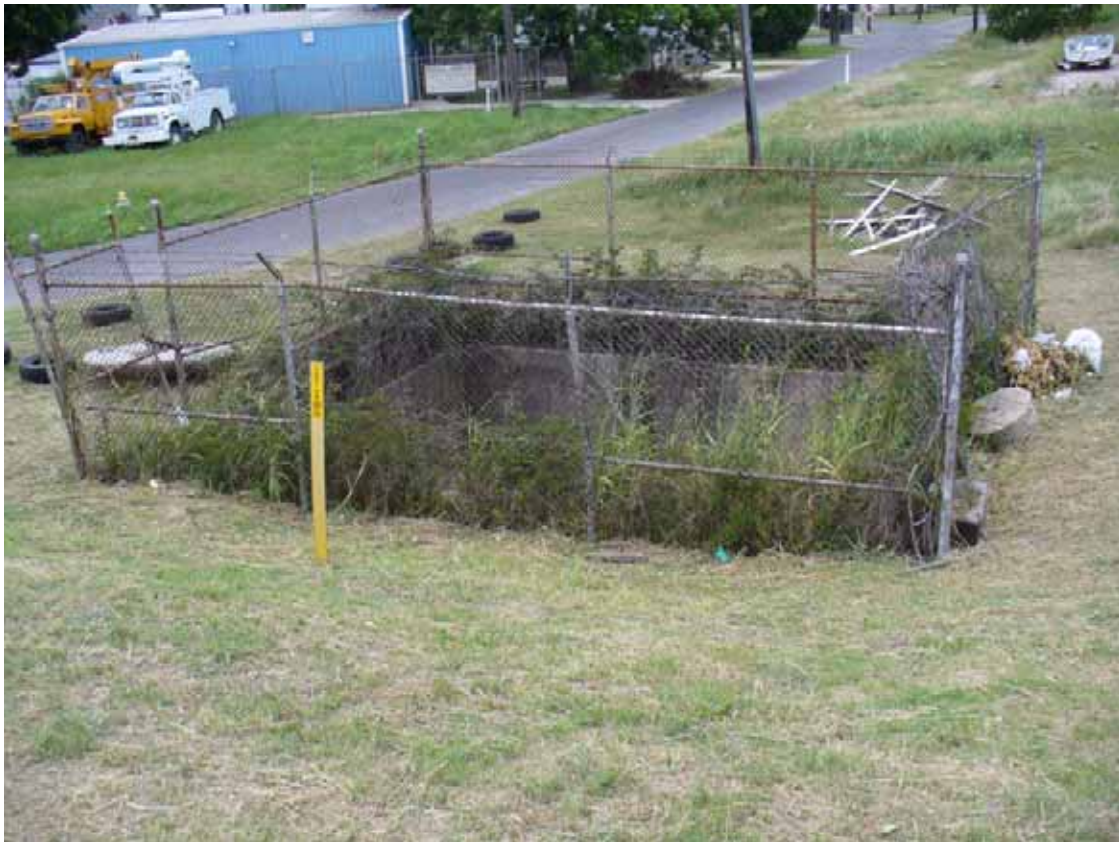
4. View of fenced-in pit open to drainage canal and Real Wood Company, located in northwest area.