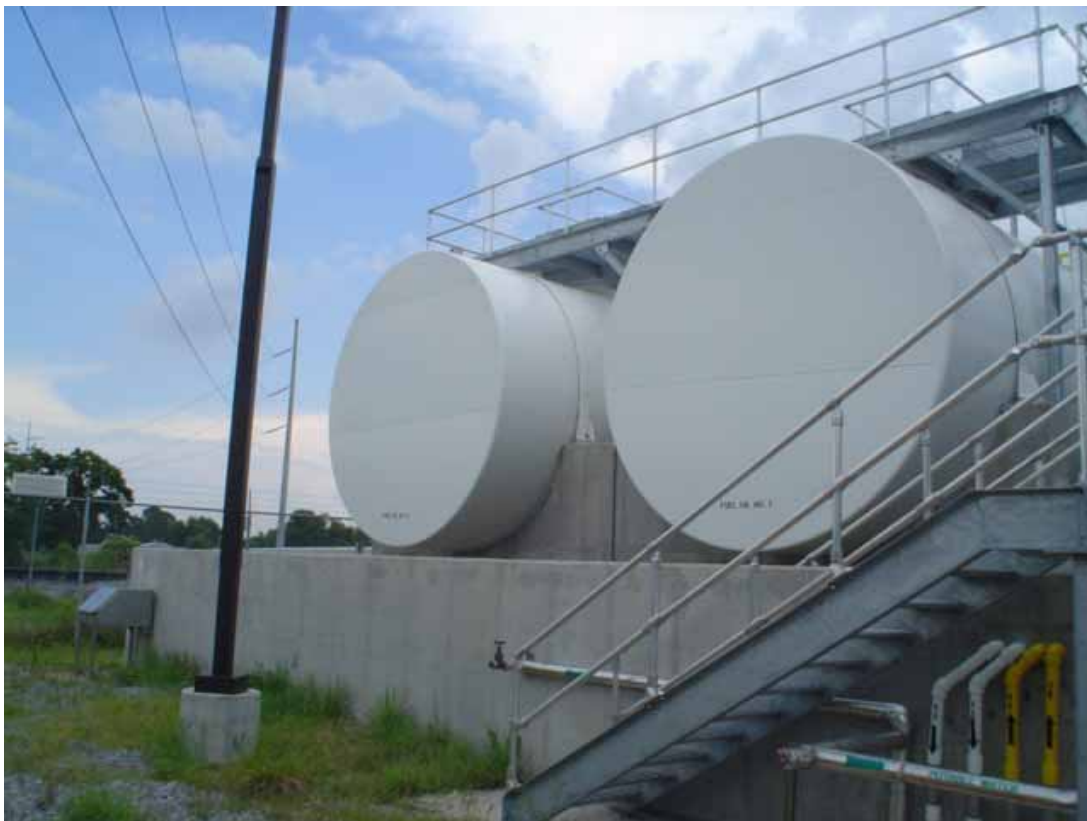
18. Diesel tanks, northwest corner of property.