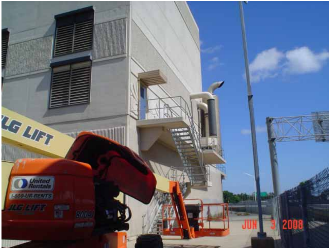
5. View of site as seen from the east direction.