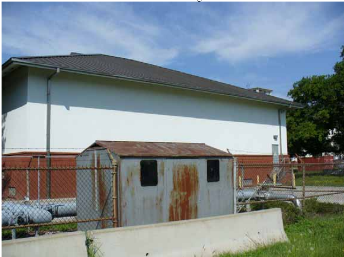
43. Meter building north of frequency changer building.