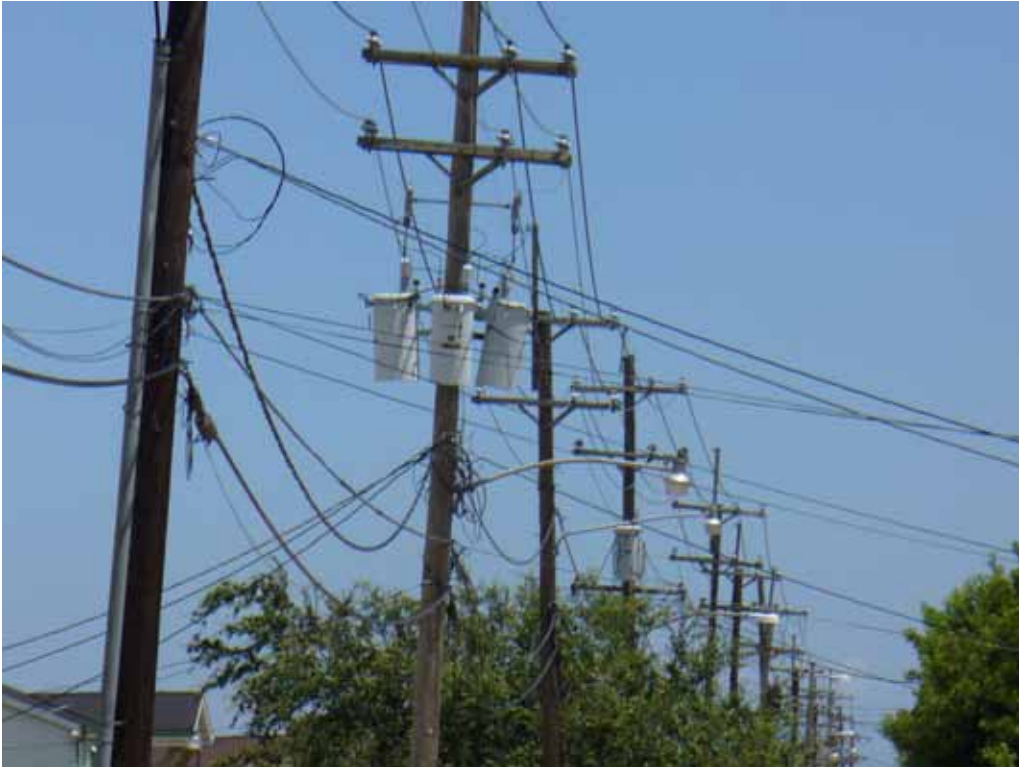
15. Transformers on Warrington Drive, south.