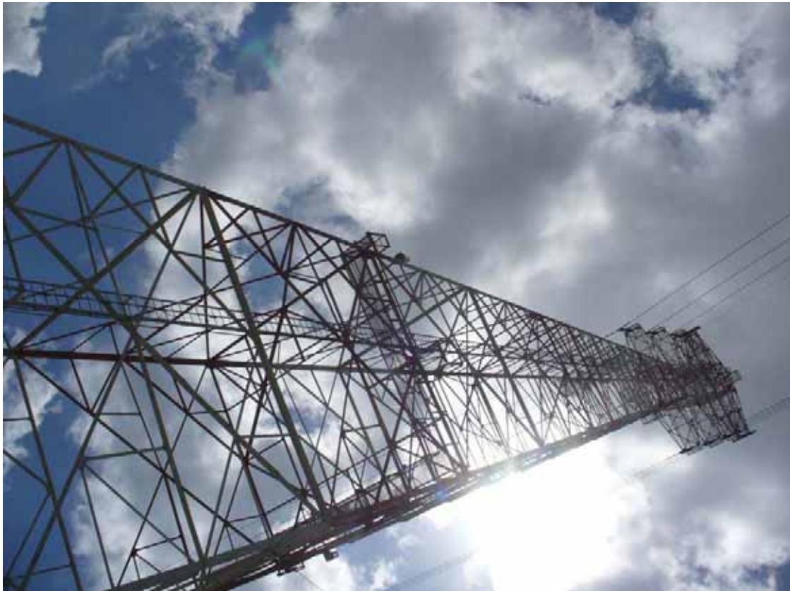
16. Tower south east of building.