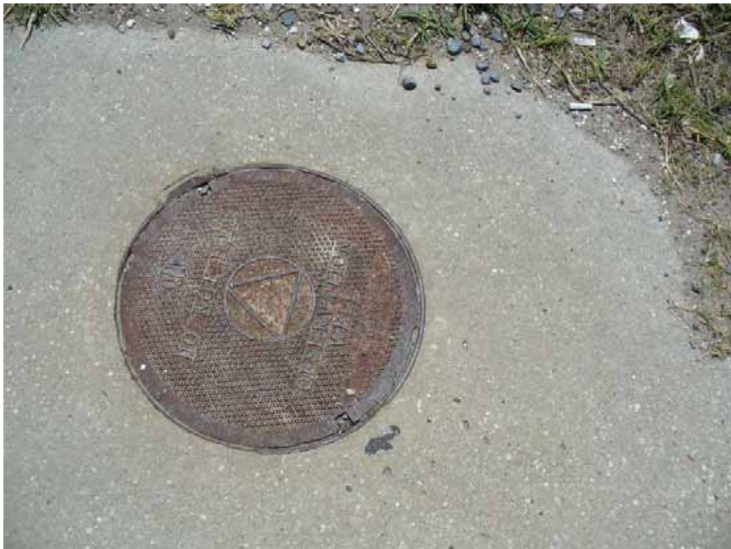
73. Monitoring well for underground storage tank.