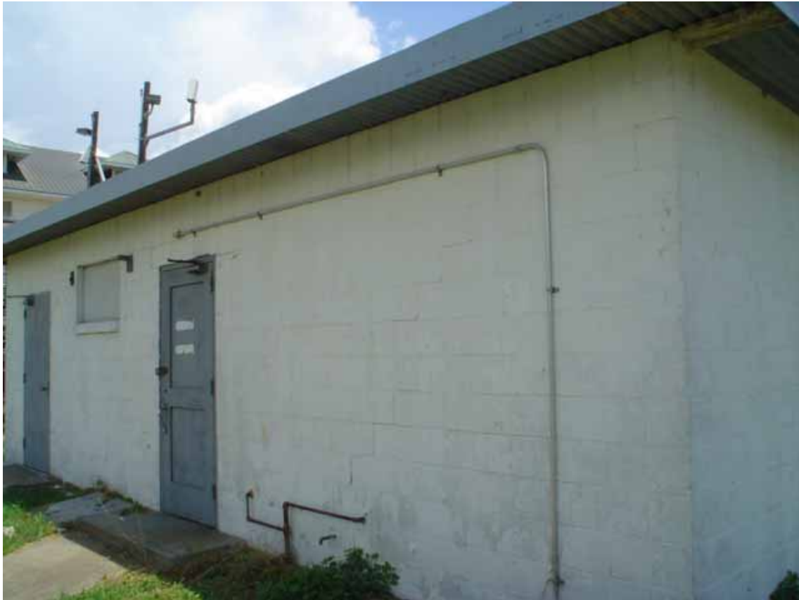
90. Laborers' shack southwest of chemical house.