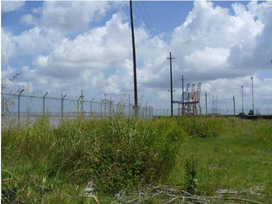
13. View of west area adjacent to the site in northwest corner.