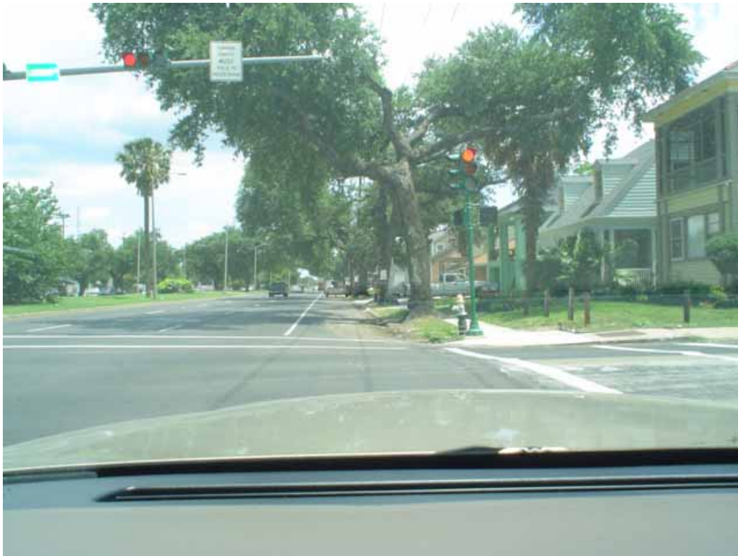
4. South Claiborne Avenue looking east from north east corner of site.