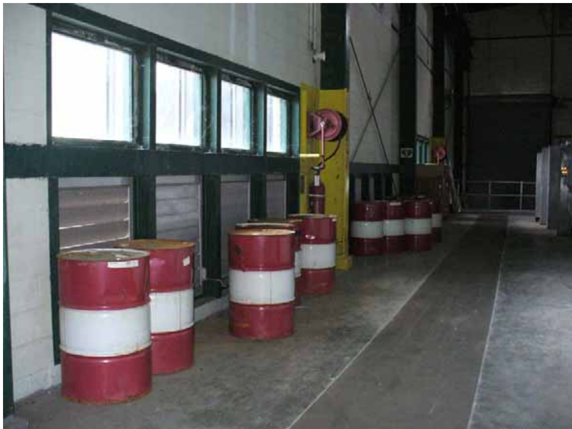
18. View of drums stored inside building.