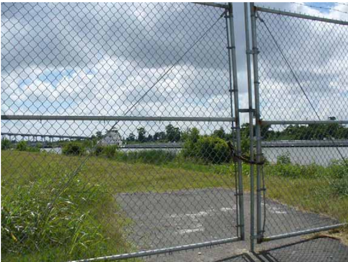
10. View of west area adjacent to the site, including Intracoastal Waterway.