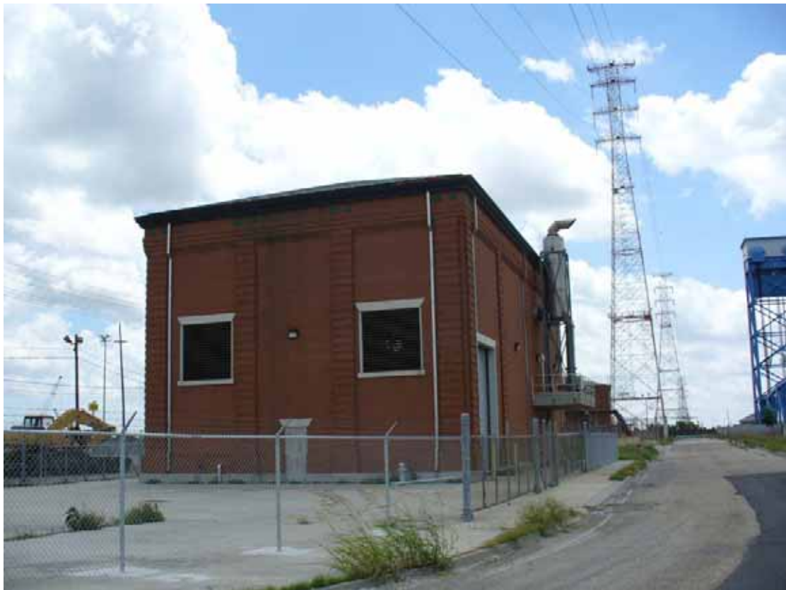
20. Generator building, west side.