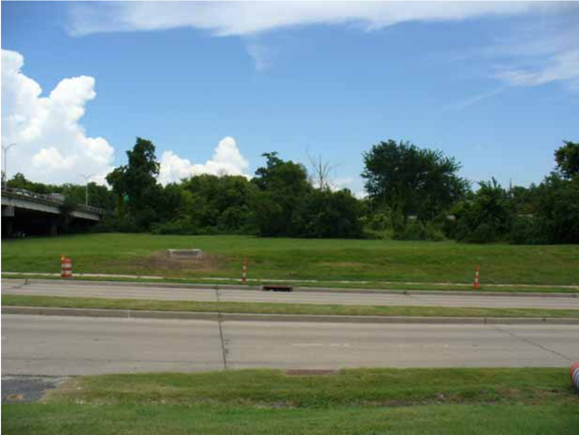
5. View of east area adjacent to the site, showing I-610.