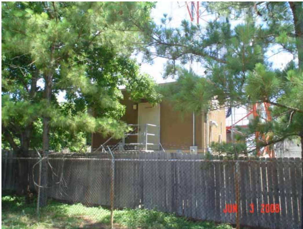
2. View of north area adjacent to the site, showing bottom of radio tower.