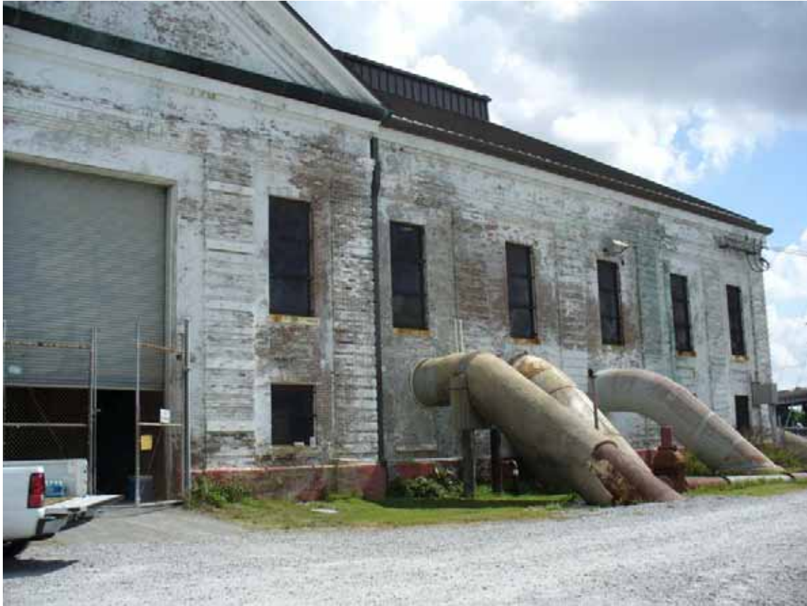
7. View of site as seen from the south direction, southeast area.