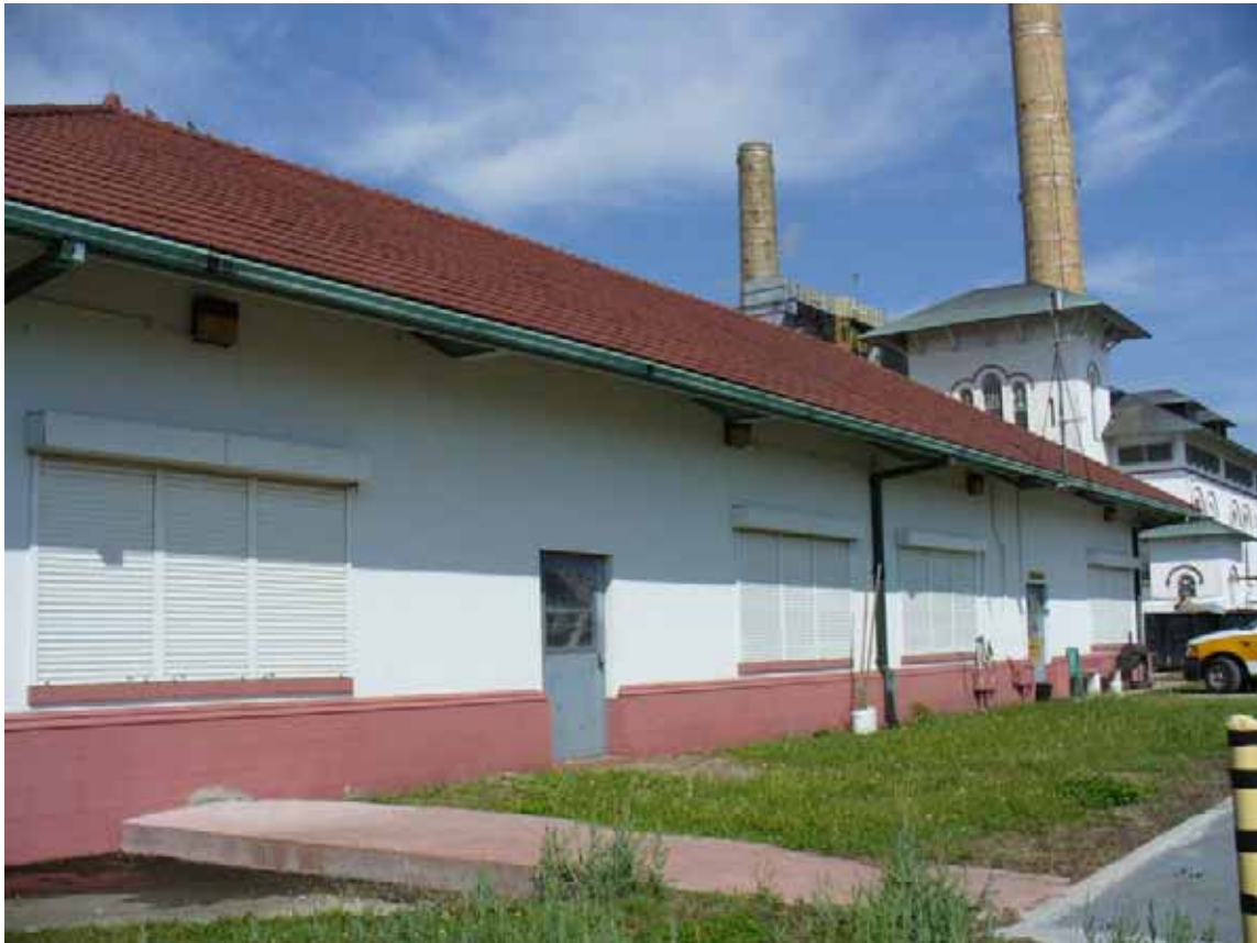
46. North side of central control building, entrance located near truck in right of picture.