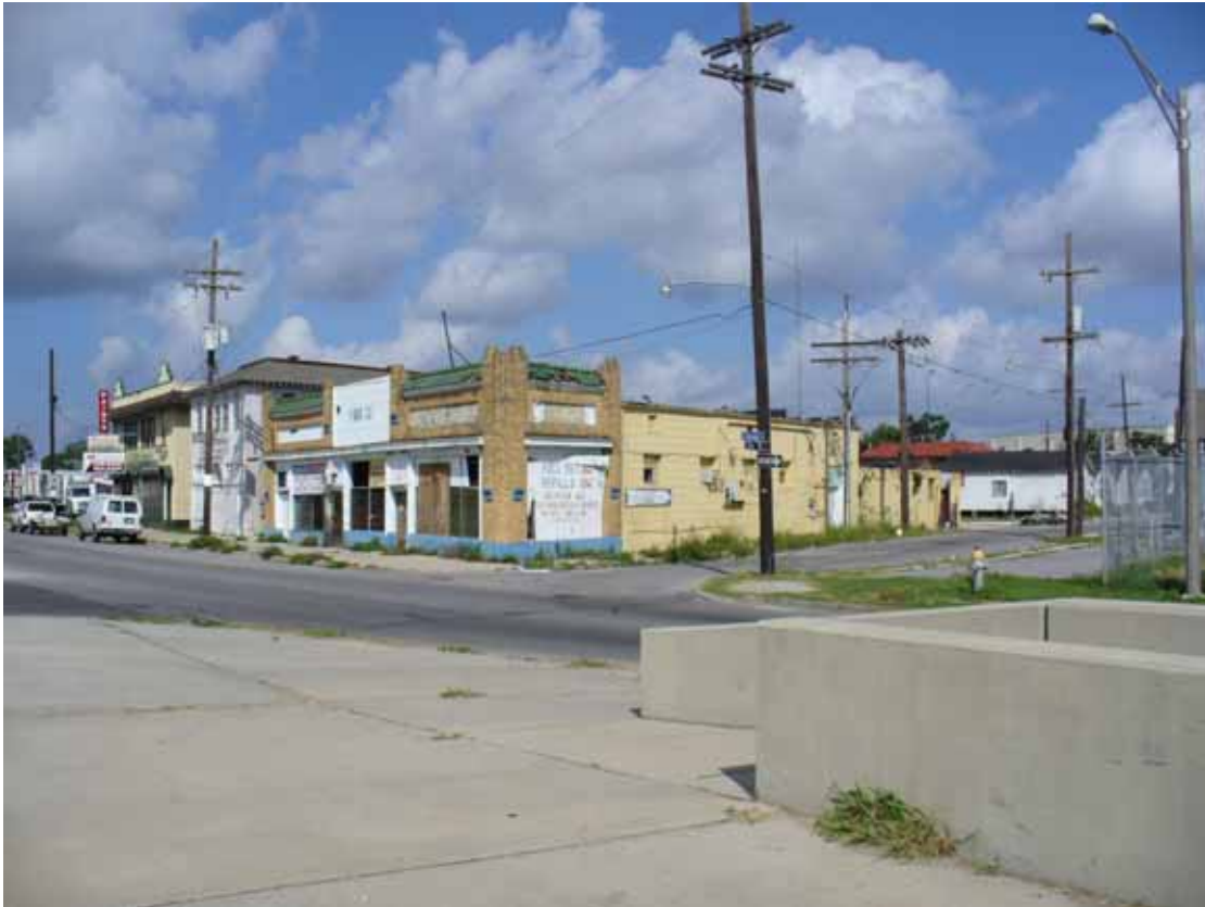
13. View of west area adjacent to the site, showing abandoned buildings.