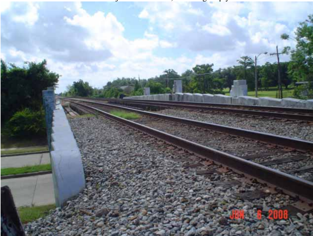
10. View of south area adjacent to the site, railroad bridge, southeast corner.