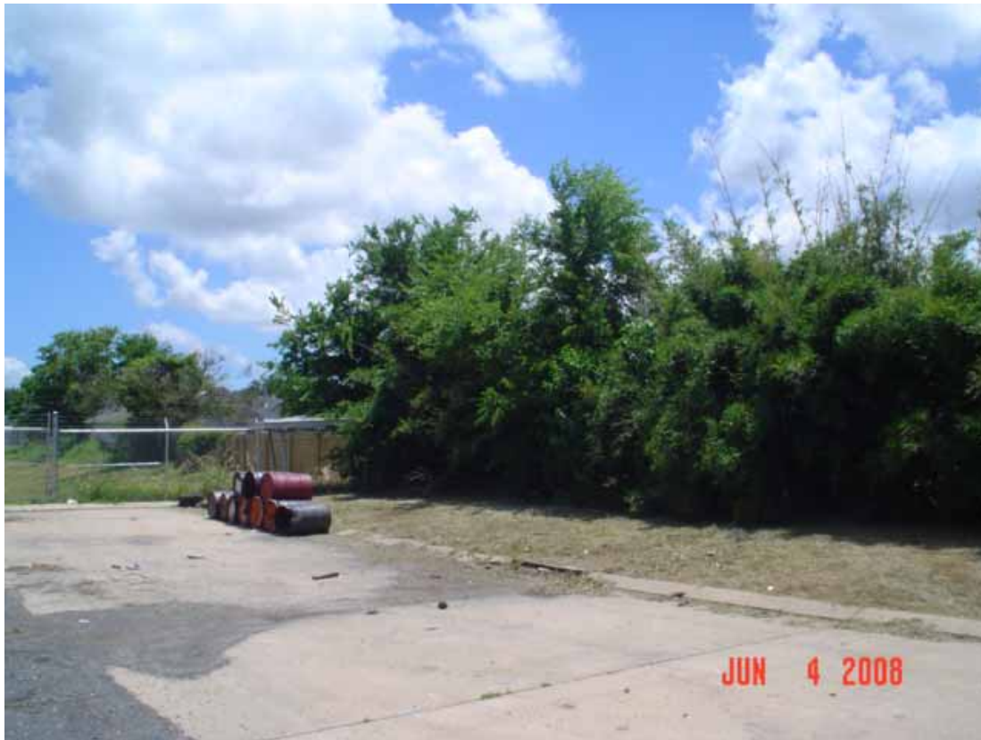
11. View of west area adjacent to the site, showing empty 55 gallon drums in southwest corner.