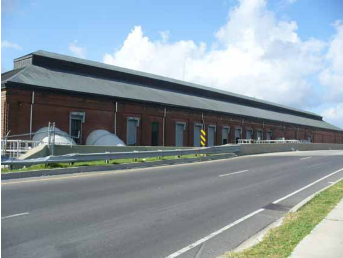
1. View of site as seen from the north direction.