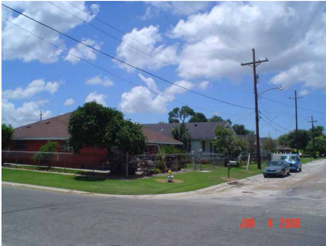
3. View of north area adjacent to the site, in northwest corner.