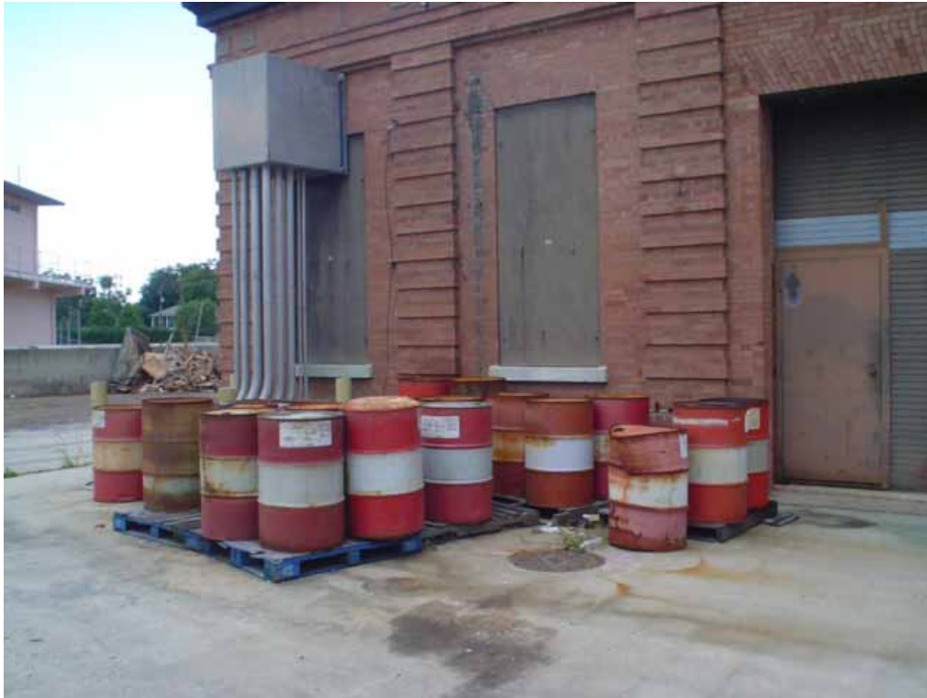
21. Example of 55 gallon drums outside building.