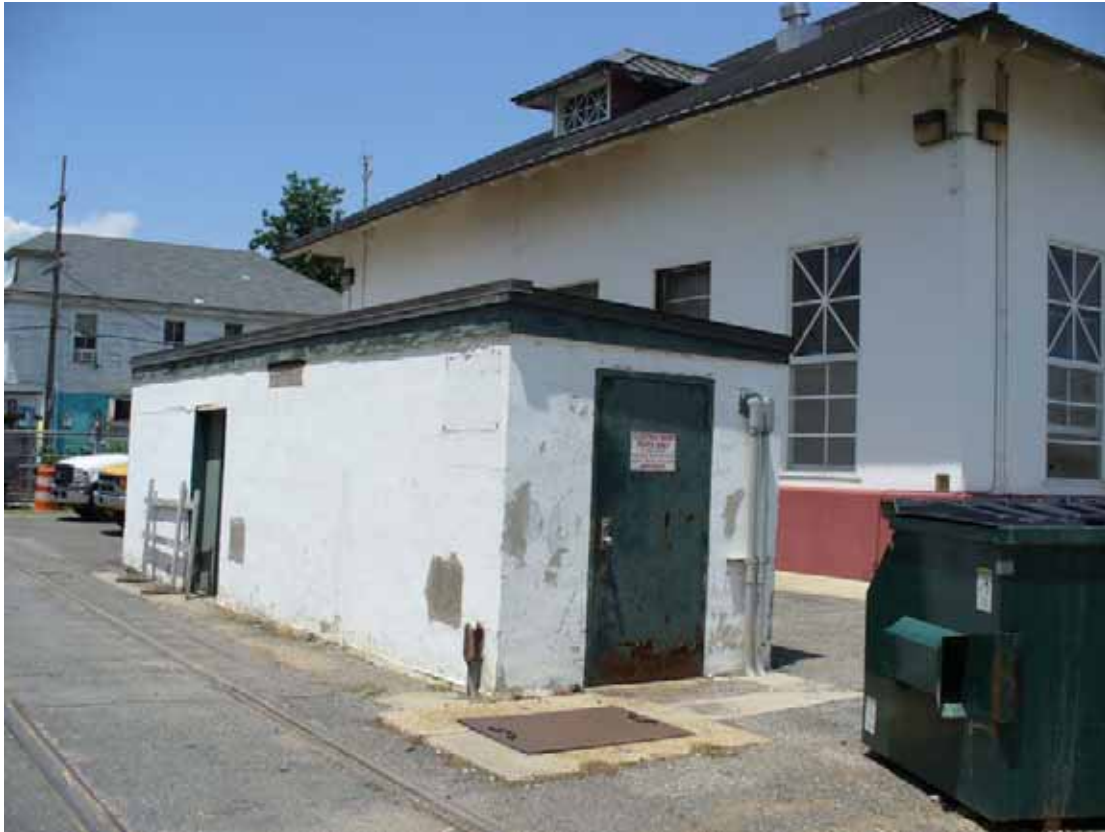
70. Electric parts storage house.