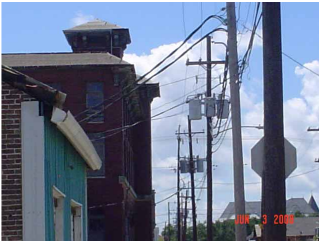
14. View of west area adjacent to the site, transformers.