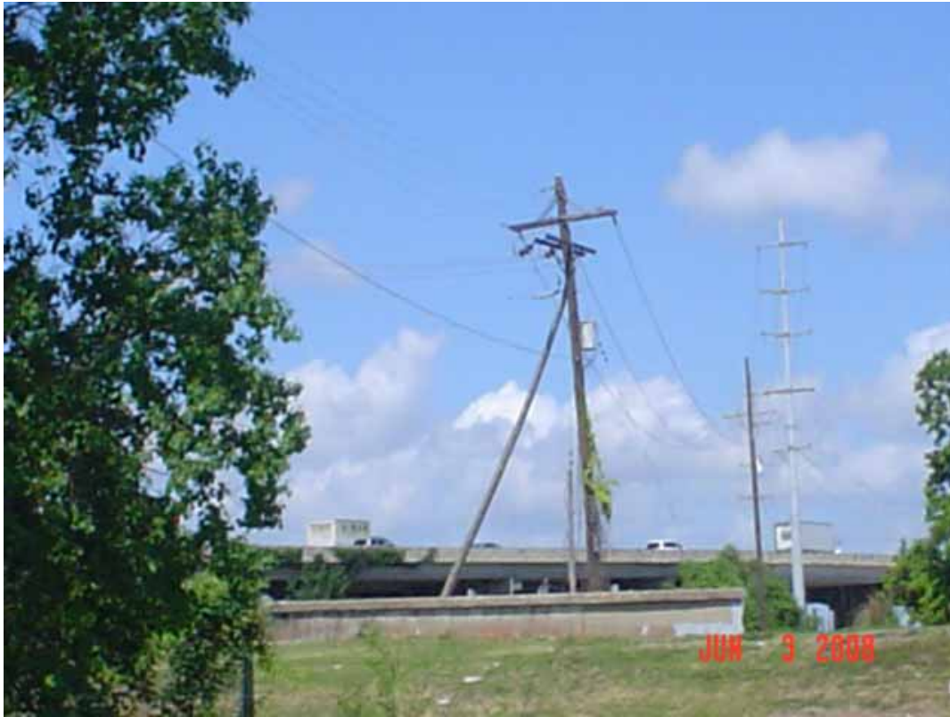
11. Example of transformers in the area, North side.