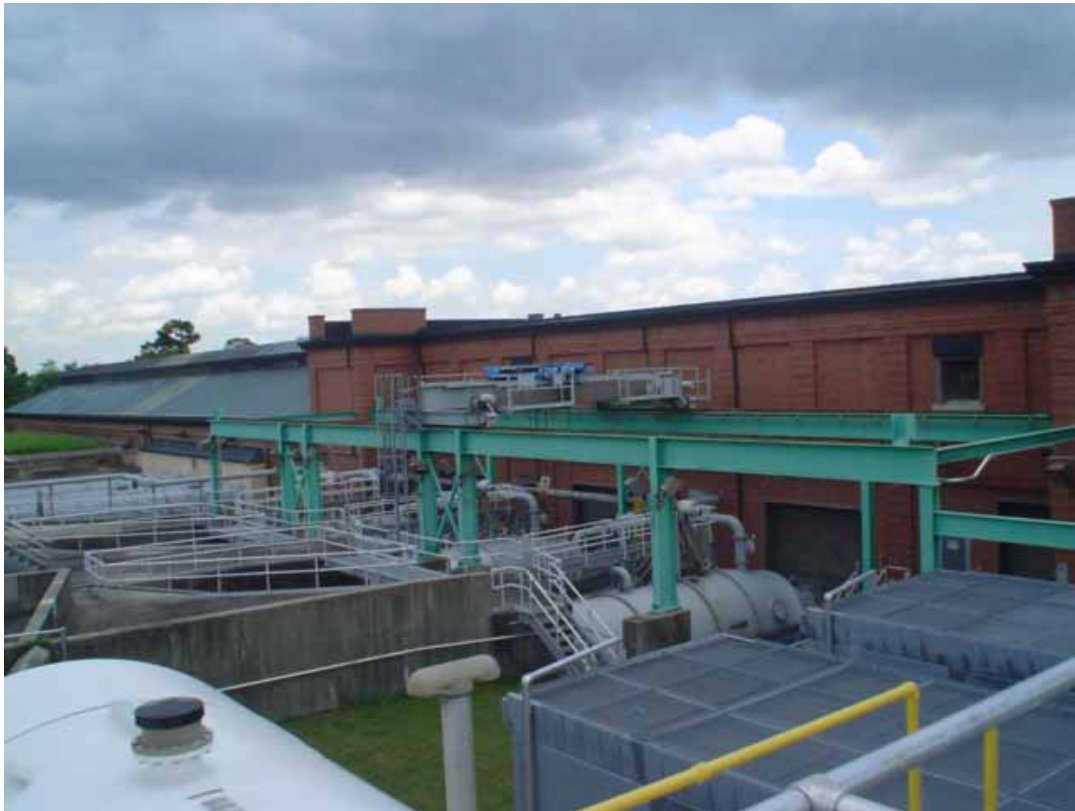
1. View of site as seen from the north direction.