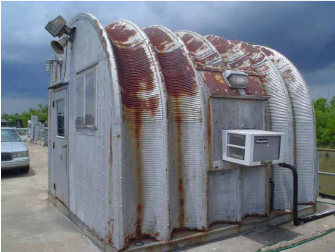
17. Office at end of pier.