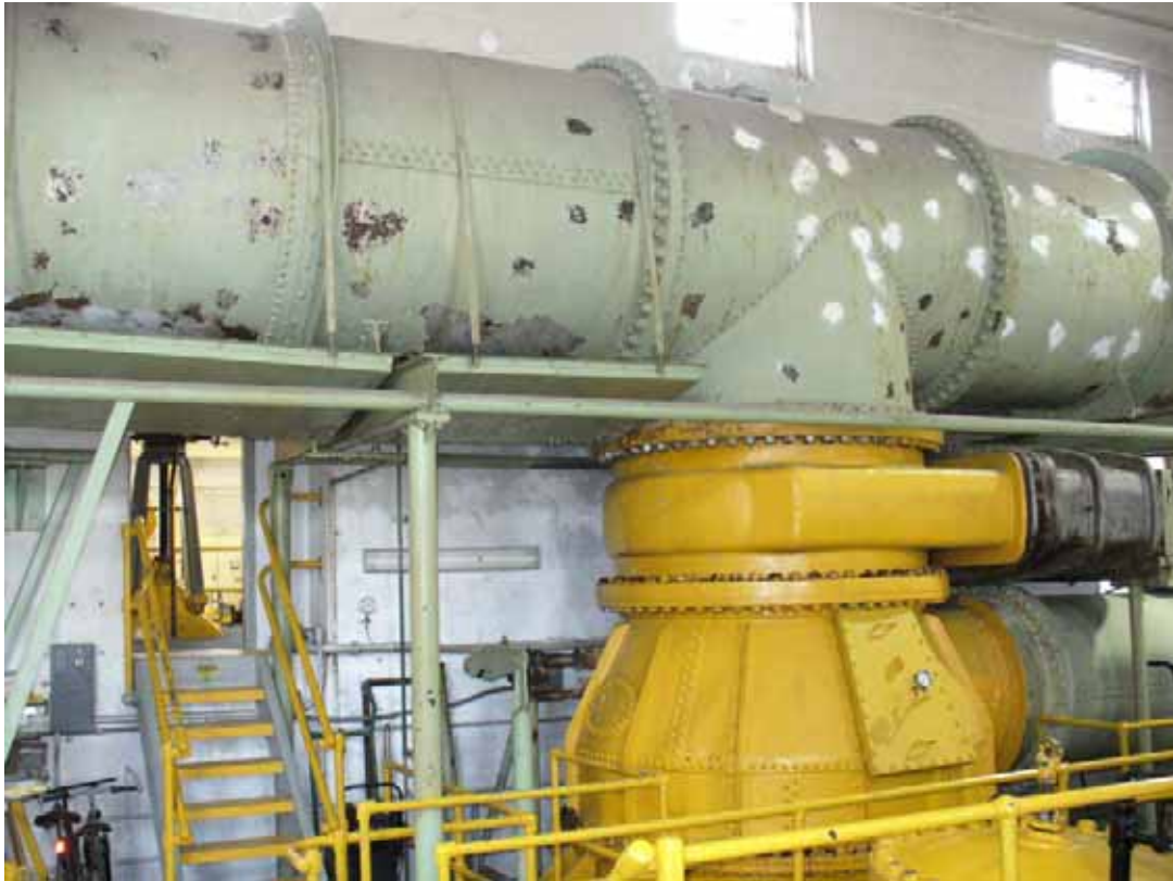
21. Intake pipe inside building.