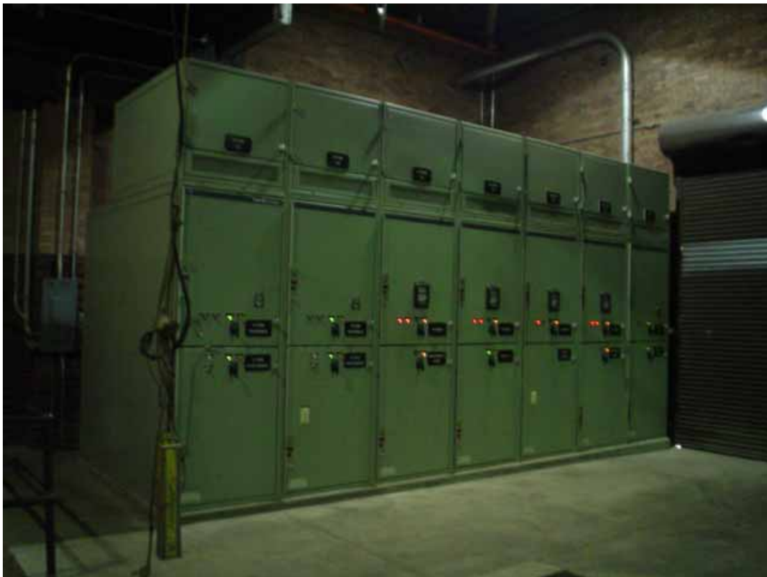
26. Switches inside building.