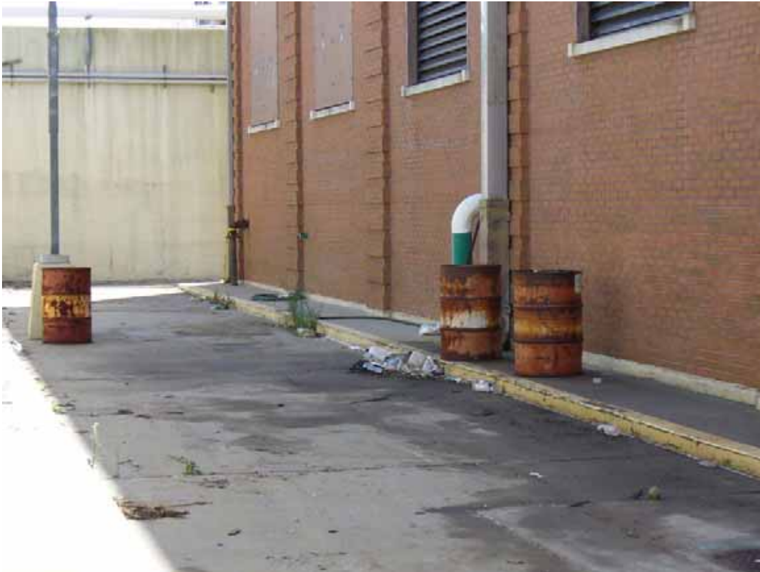
17. Drums located outside OP-19 building in west area.