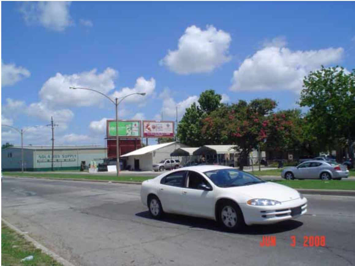
3. View of north area adjacent to the site, Earhart Boulevard, showing self carwash in background.