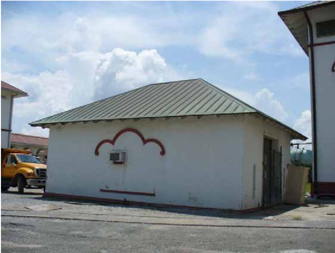
74. Old chlorine building, now used for pipe storage.