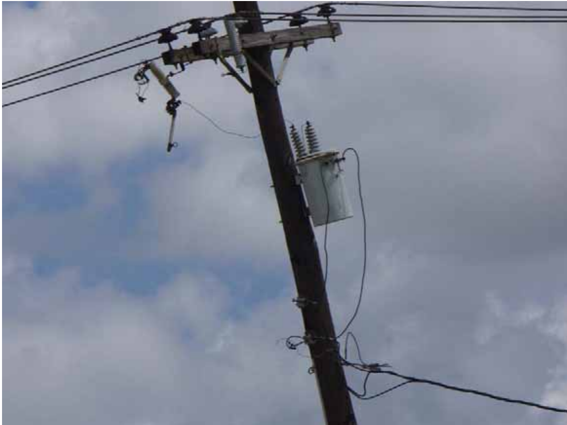
23. Transformer observed on south of property.