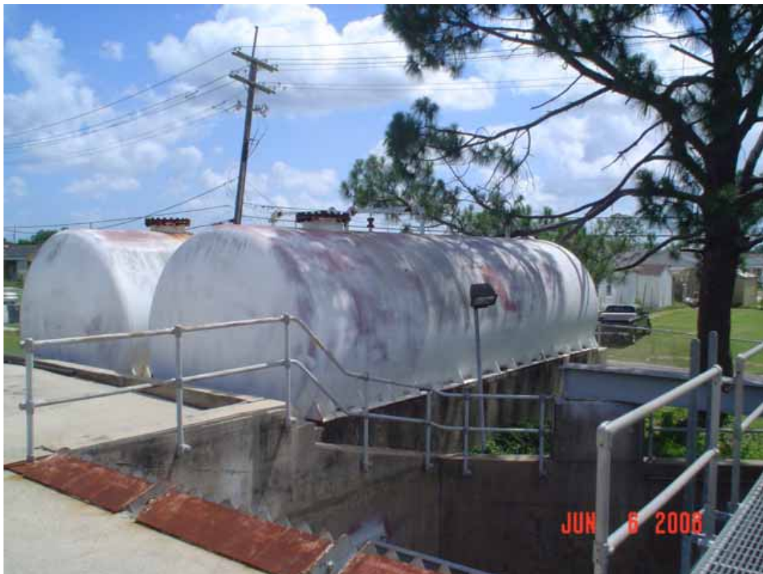
12. Abandoned chlorine storage tanks in northeast area.