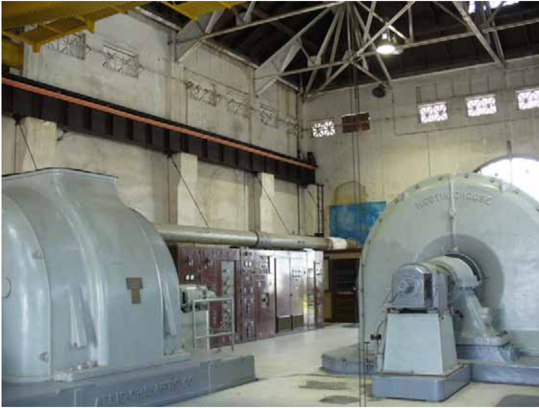
78. Pumps in power house.