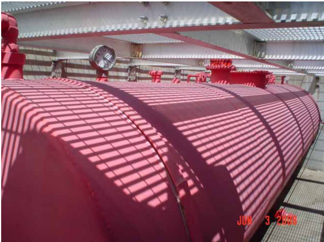
10. Fuel storage tank under grating on north side of building.