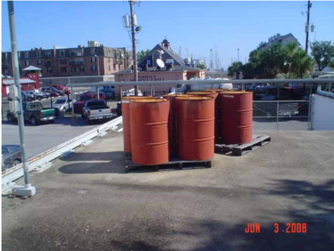
15. View of rusting 55 gallon drums located on roof in northeast area.