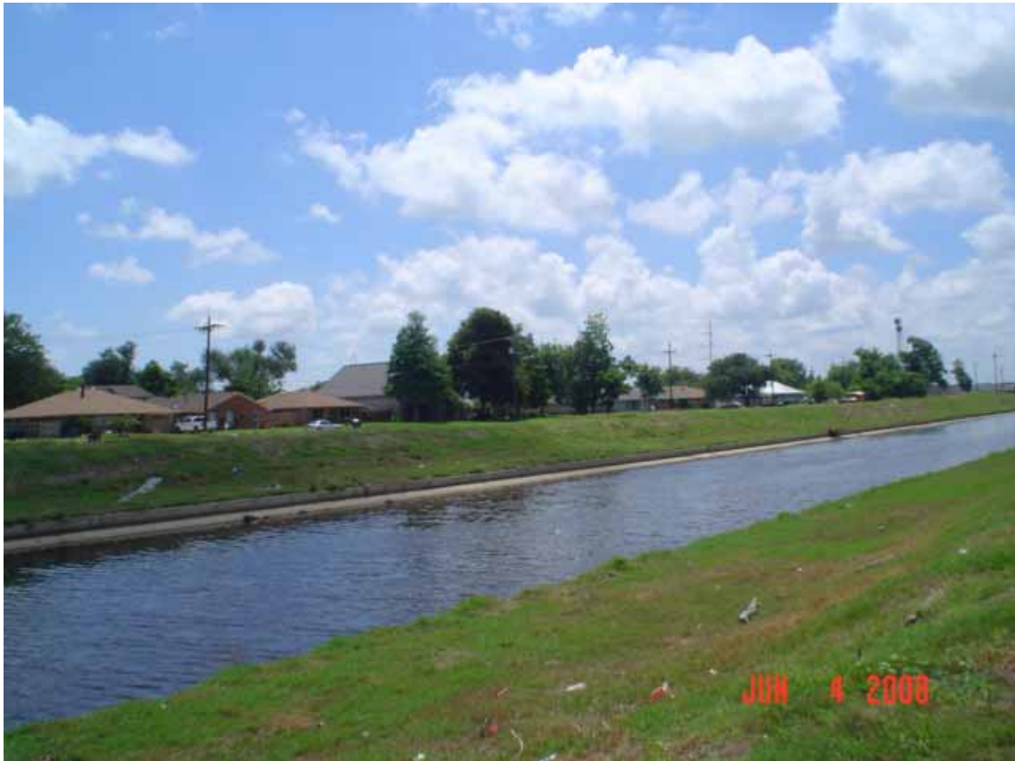
7. View of south area adjacent to the site in southeast direction.