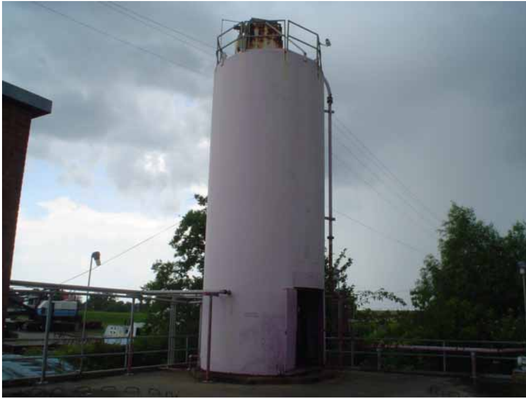
13. Potassium permanganate tank.