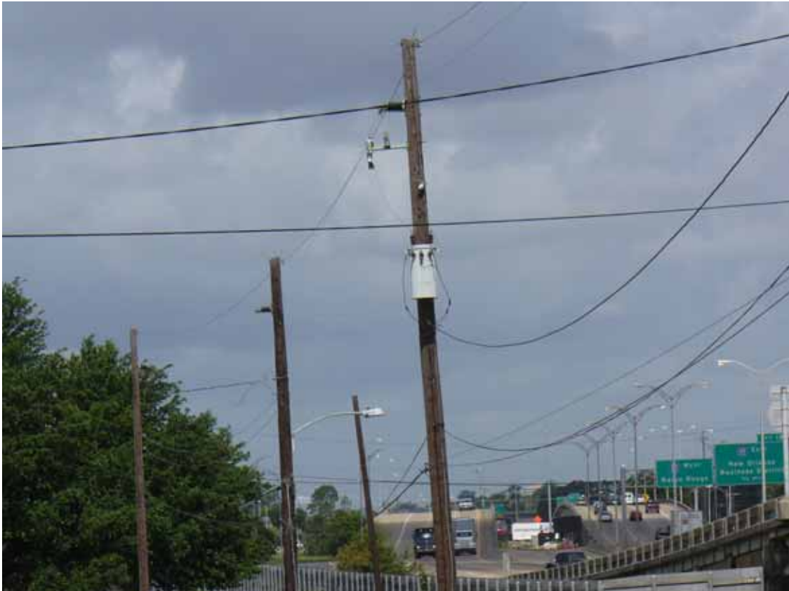
17. Example of transformer, northwest corner, showing I-10.