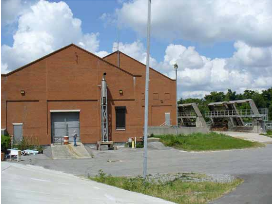
9. View of site as seen from the west direction.