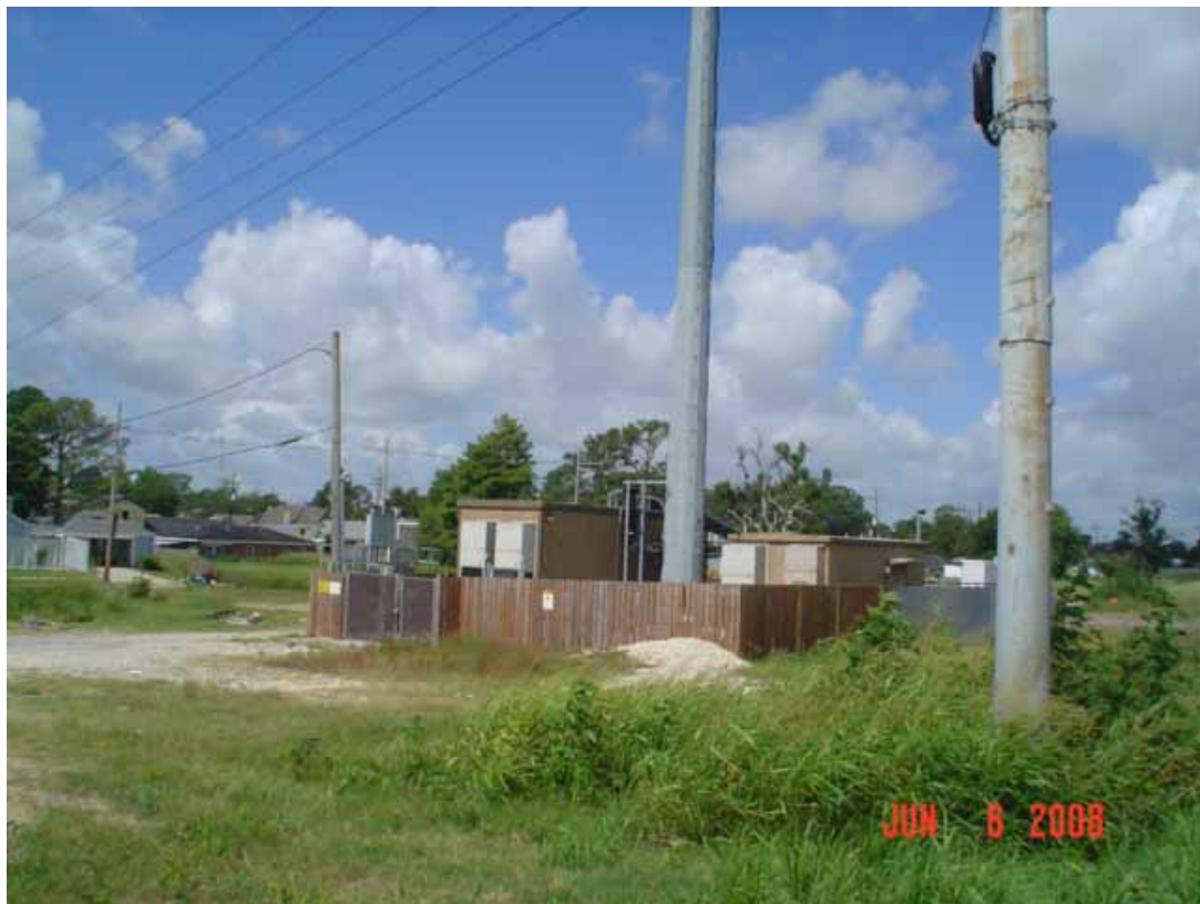
16. Cell relay station and tower, southwest corner.