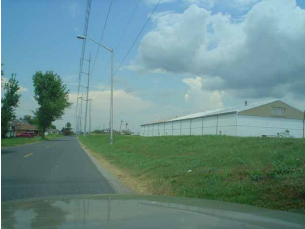
22. View of southwest corner of site looking north along Monticello Avenue.