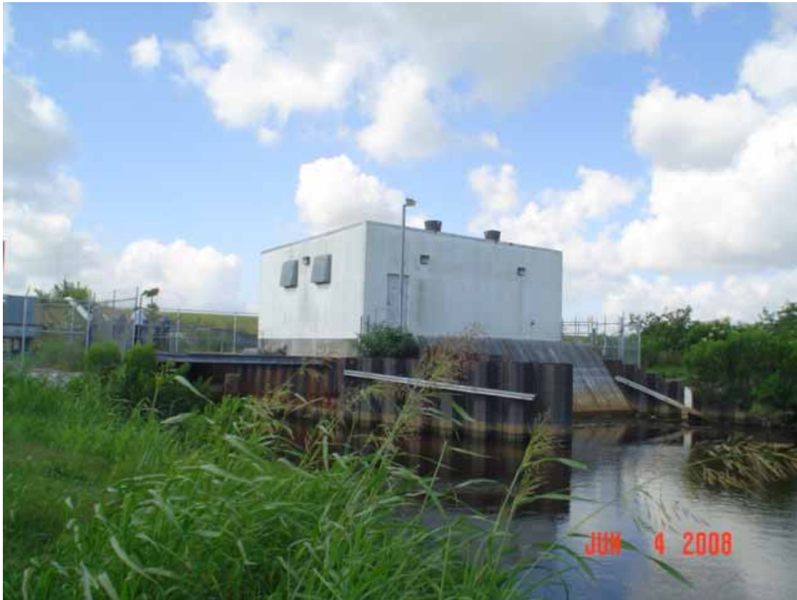
1. View of site as seen from the north direction.