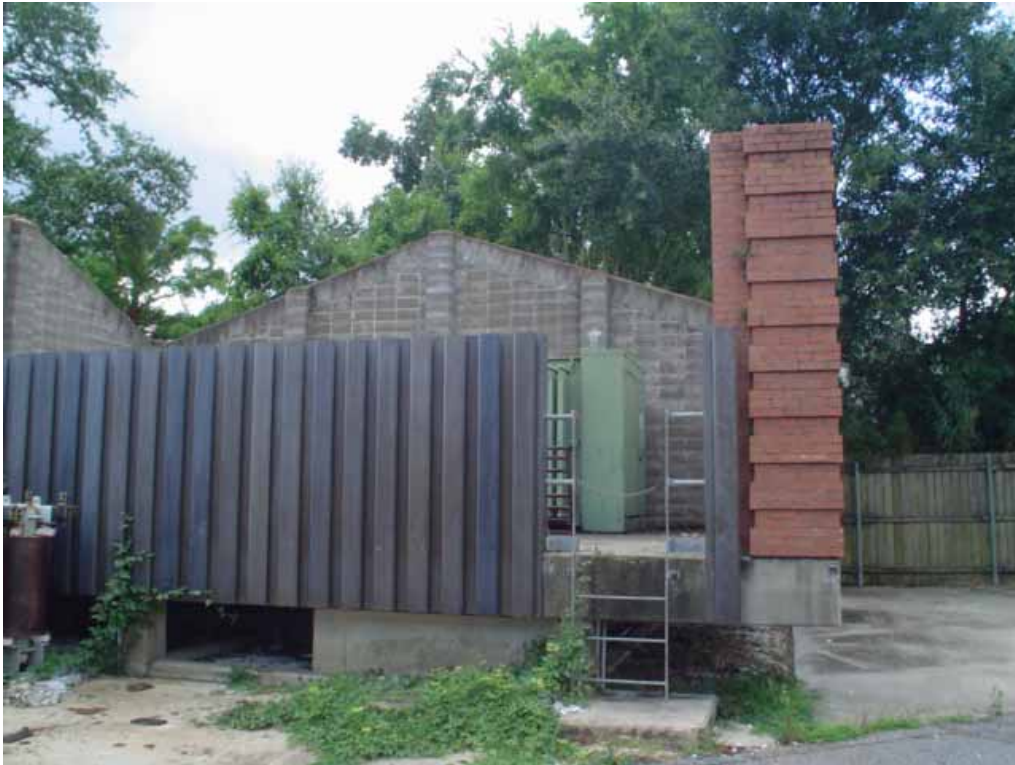
19. Transformer 'building', raised approximately two feet.