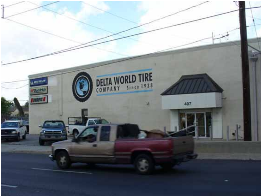
3. View of north area adjacent to the site, Delta Tire Company, in northwest corner.