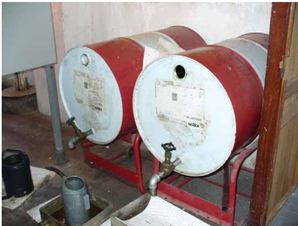
39. Oil lubricants located inside Panola Street station, observed open container.