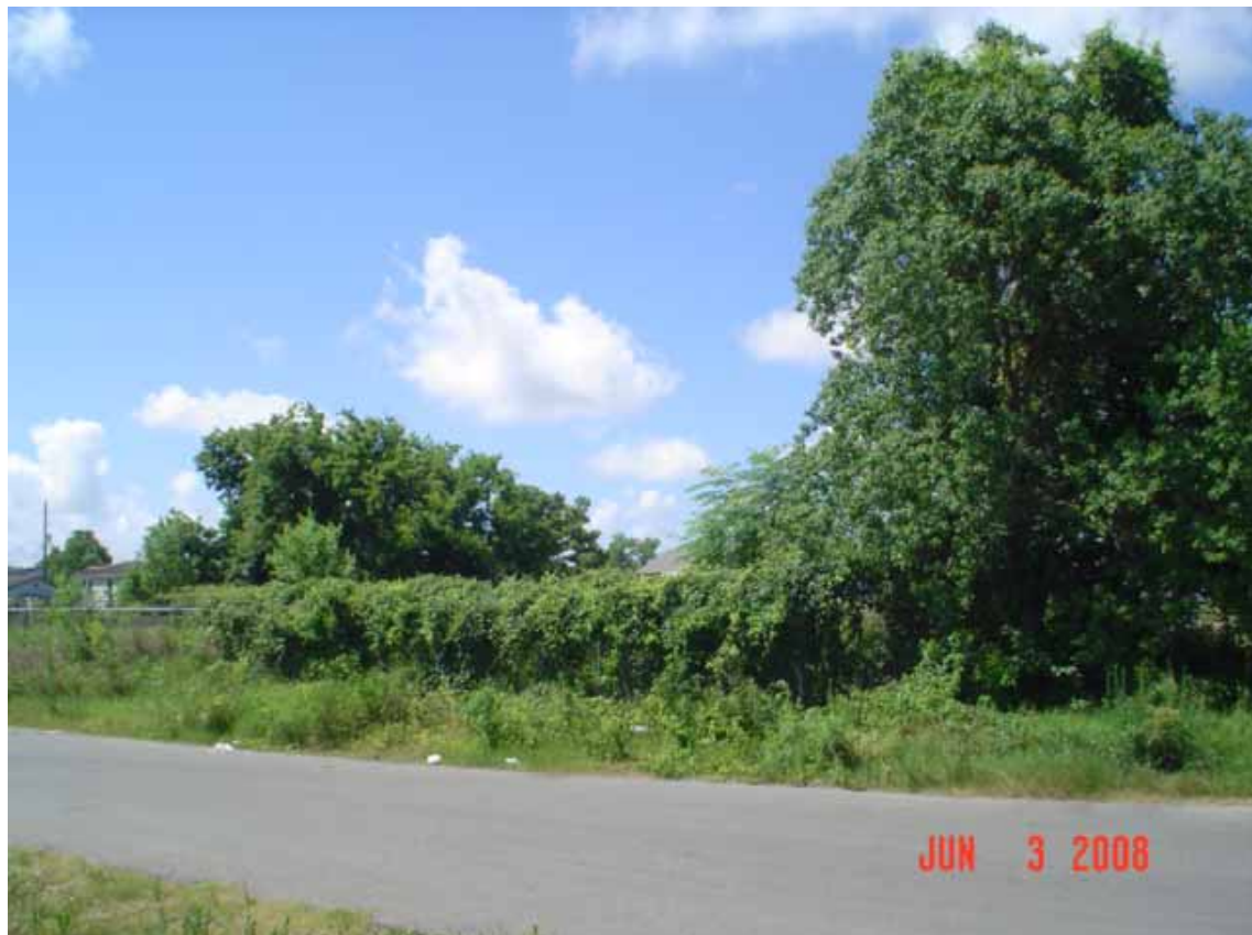
6. View of south area adjacent to the site, southwest corner.