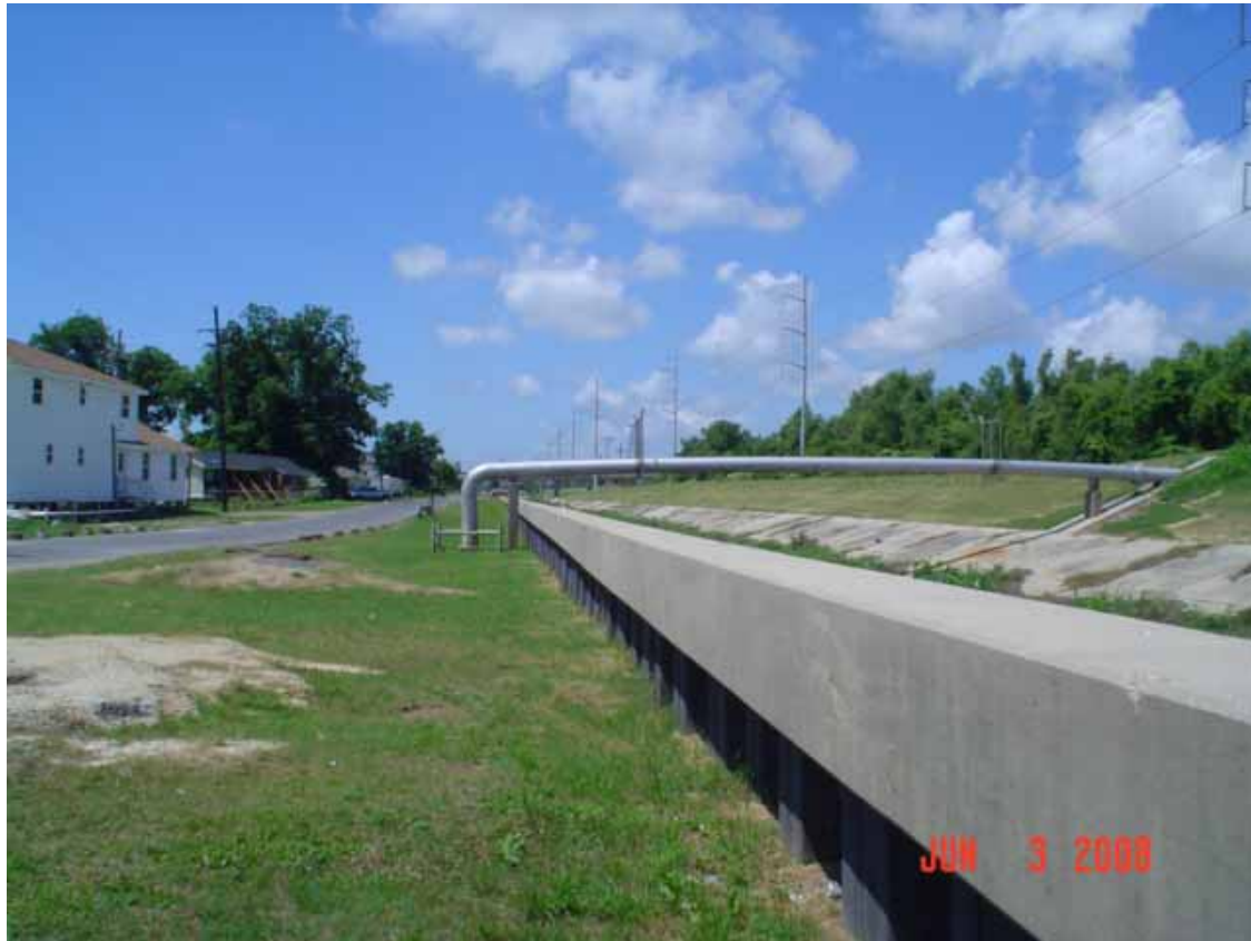
8. View of south area adjacent to the site, along canal.