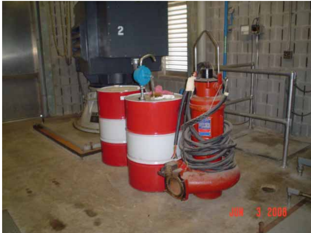
14. 55 gallon drums and pump motor inside building.