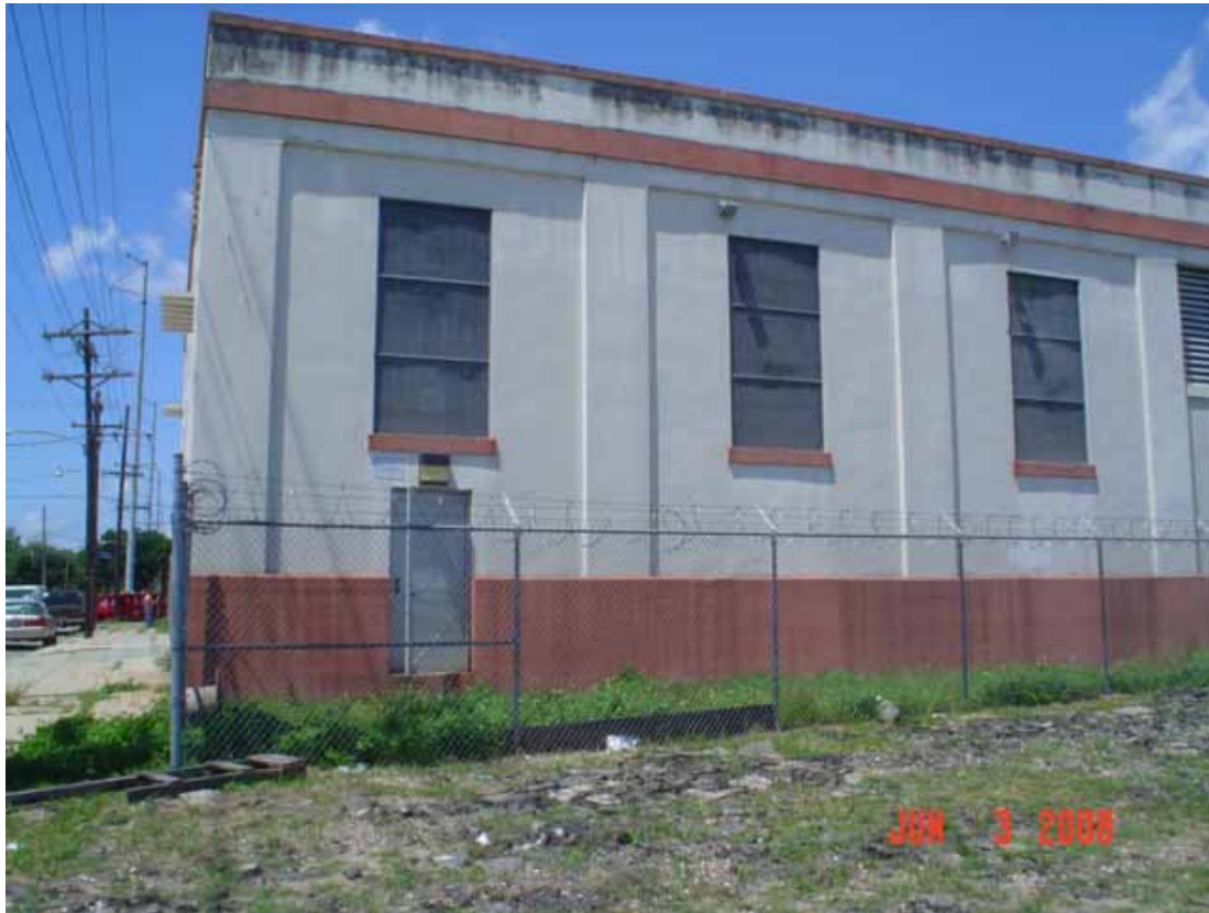
1. View of site as seen from the north direction, left side.