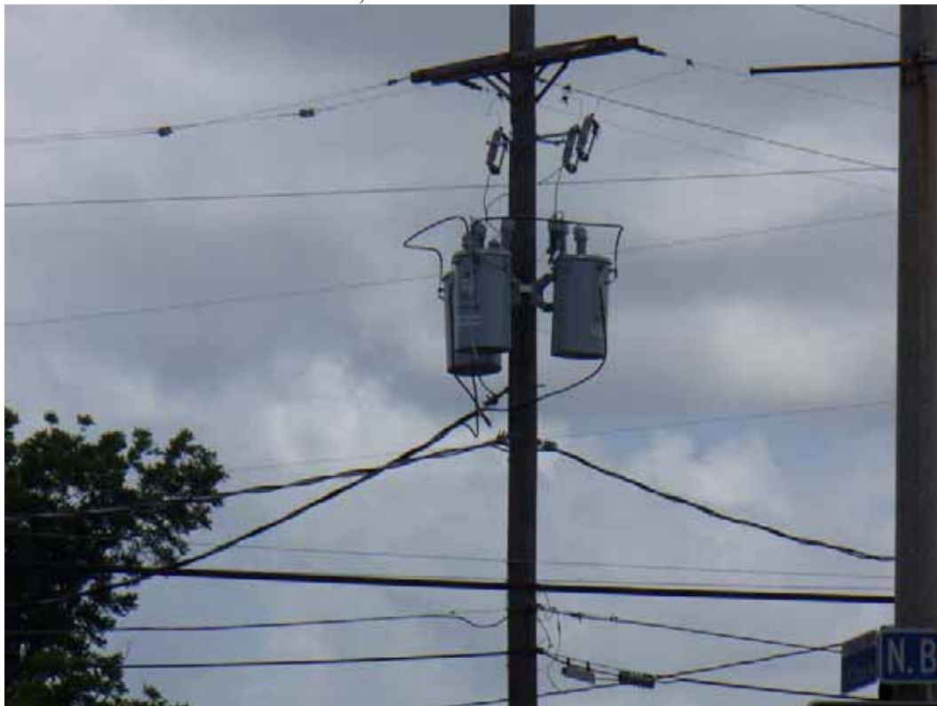
16. View of transformers located in southeast direction from building, across AP Tureau Street.