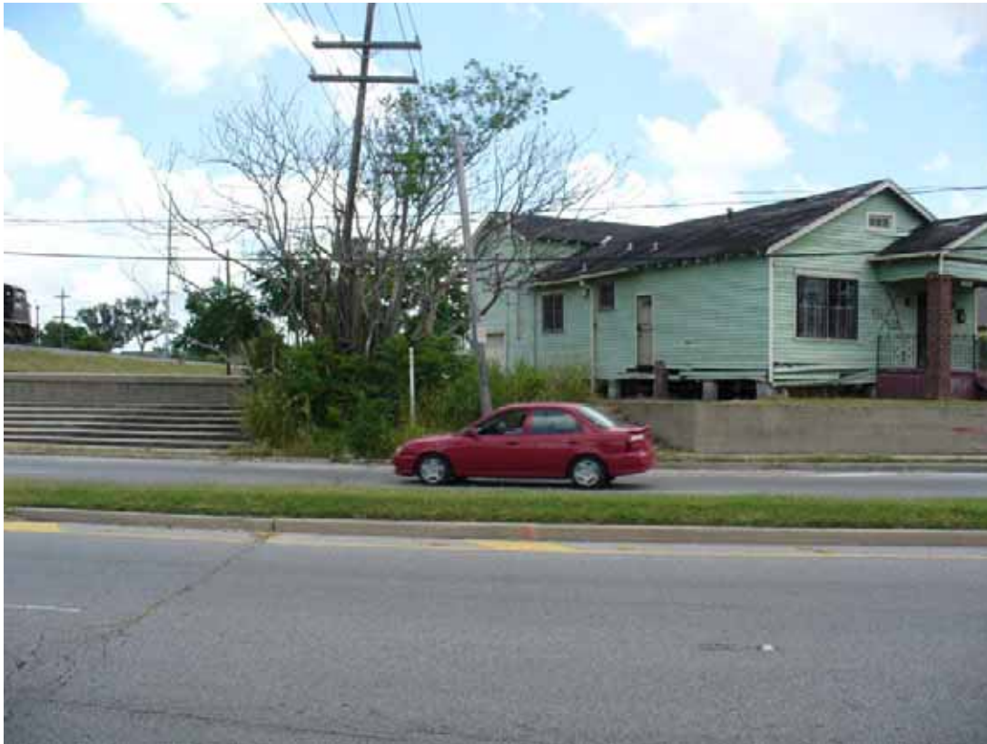
7. View of east area adjacent to the site, across North Broad.