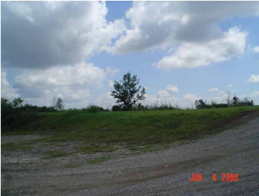
5. View of east area adjacent to the site.