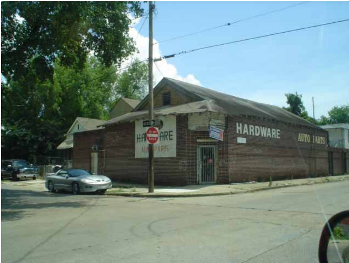
7. View of east area adjacent to the site, hardware store on corner of Leonidas and Spruce Streets.