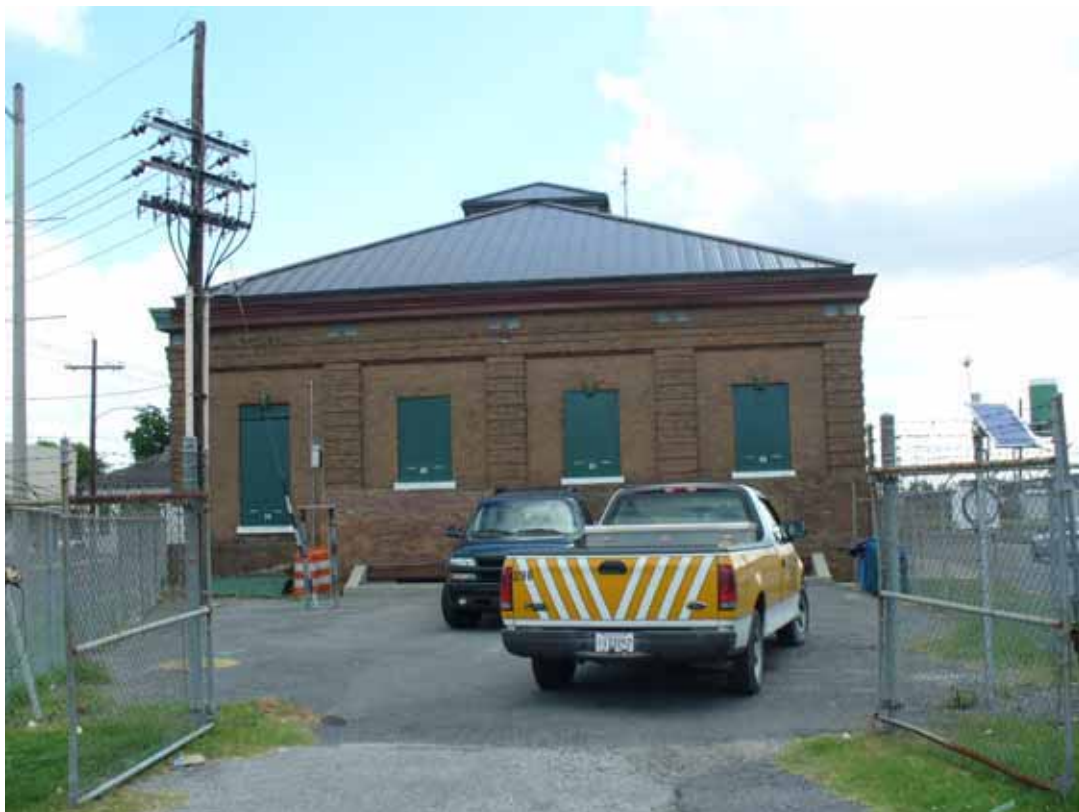
12. View of site as seen from the west direction.