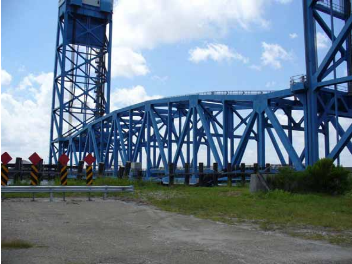
7. View of east area adjacent to the site, with Florida Avenue Bridge further east.