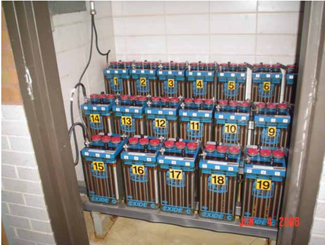
15. Battery bank.