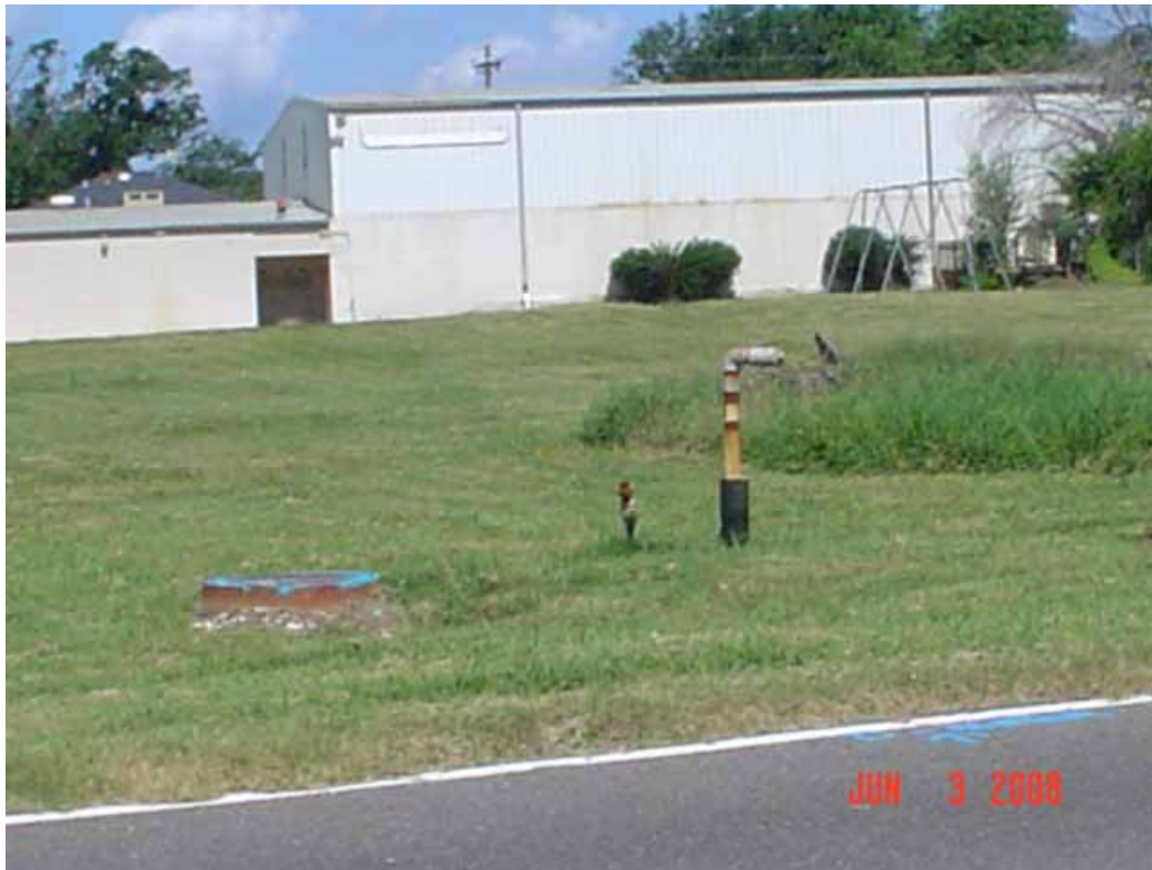
15. Unknown pipeline and man hole, west side, across road.