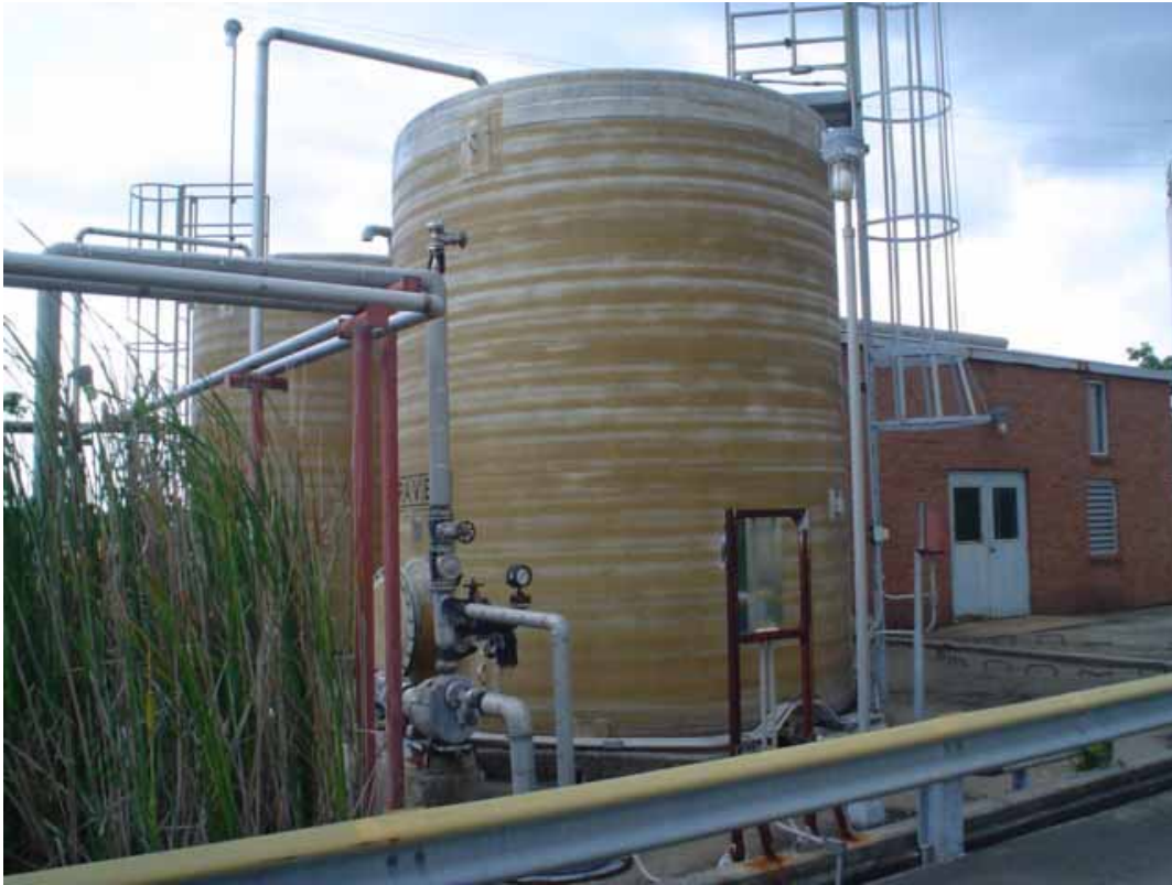
11. Additional building on access road, showing tanks formerly containing poly-electrolytes.