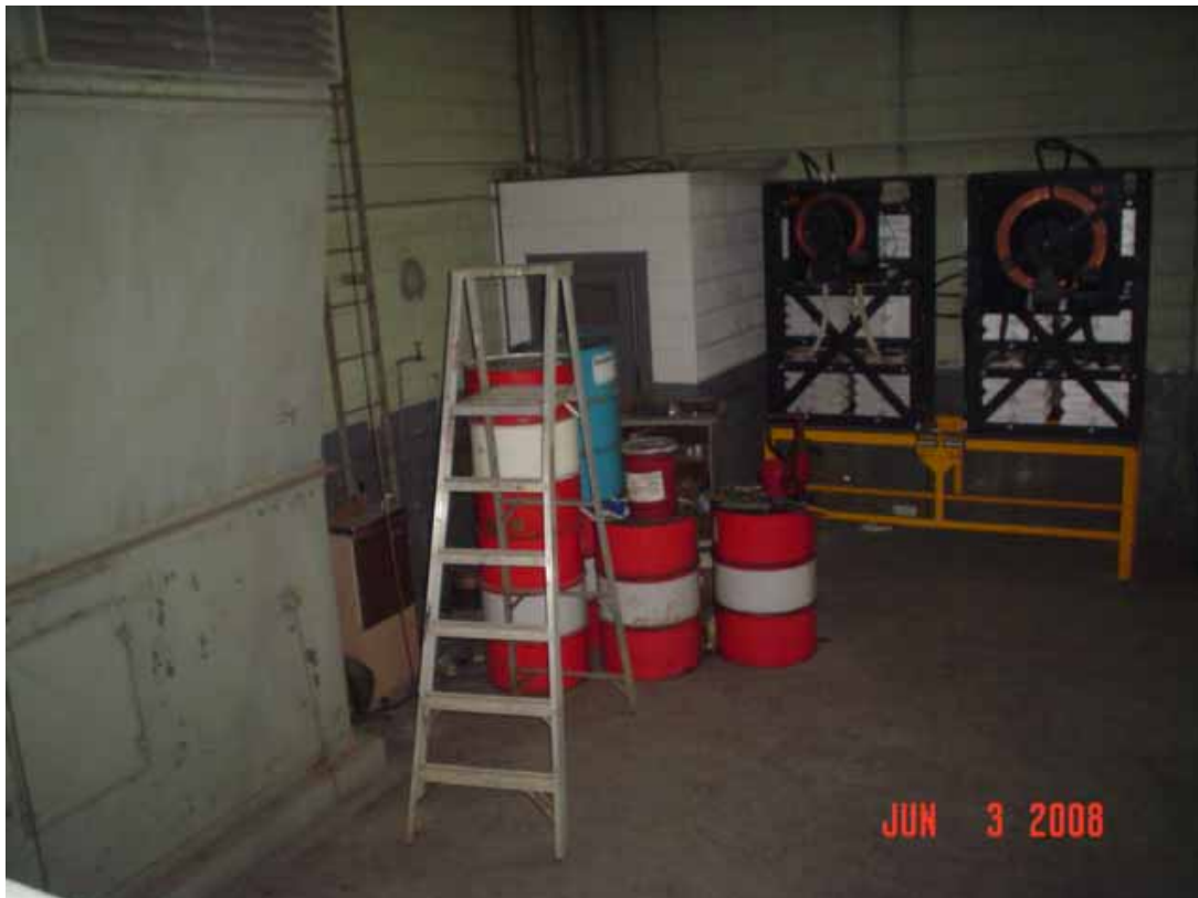
16. Drums and equipment inside building.