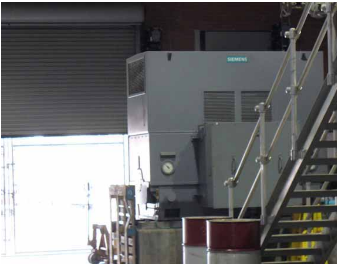
16. View of power transformer inside pump house.