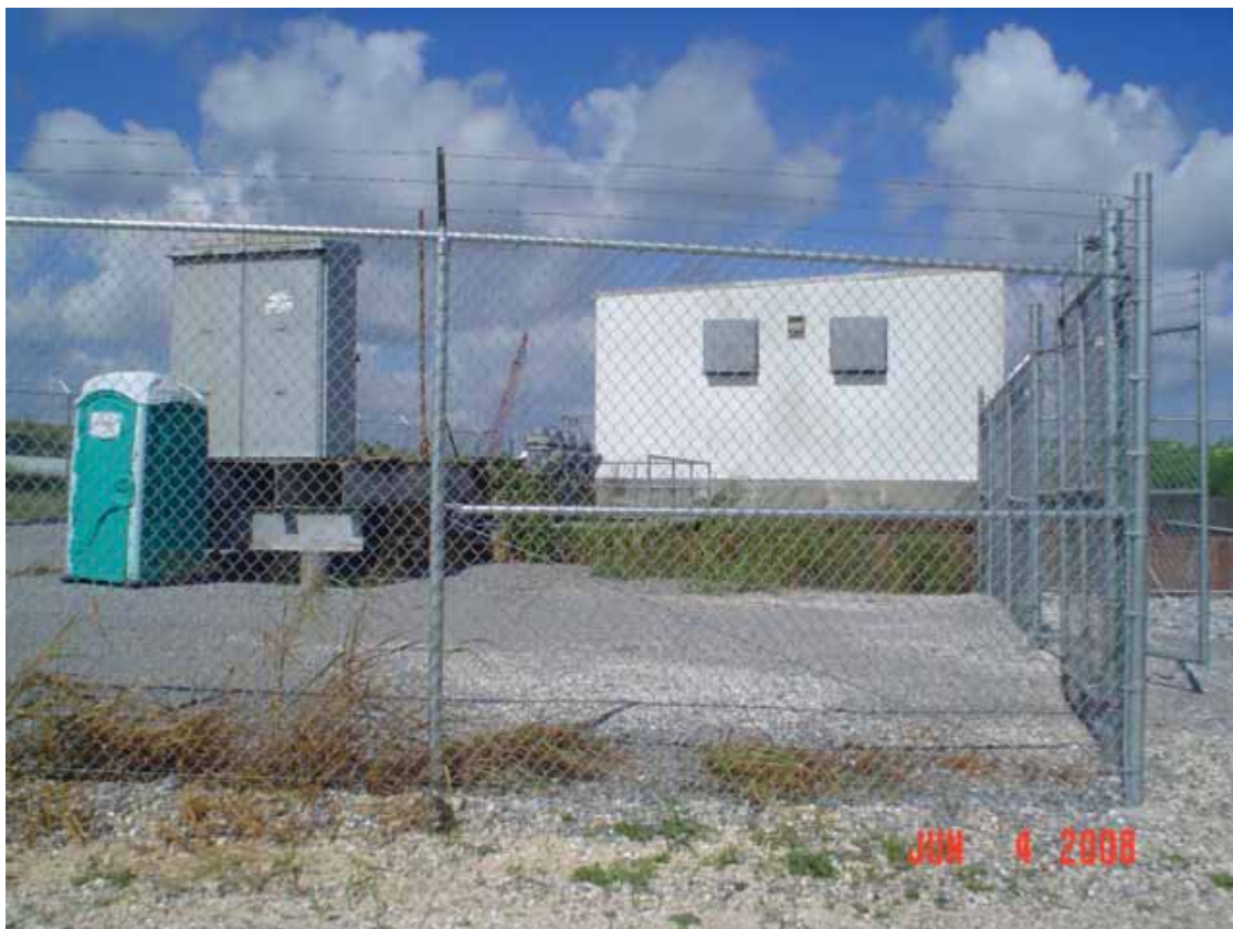
4. View of site as seen from the east direction.