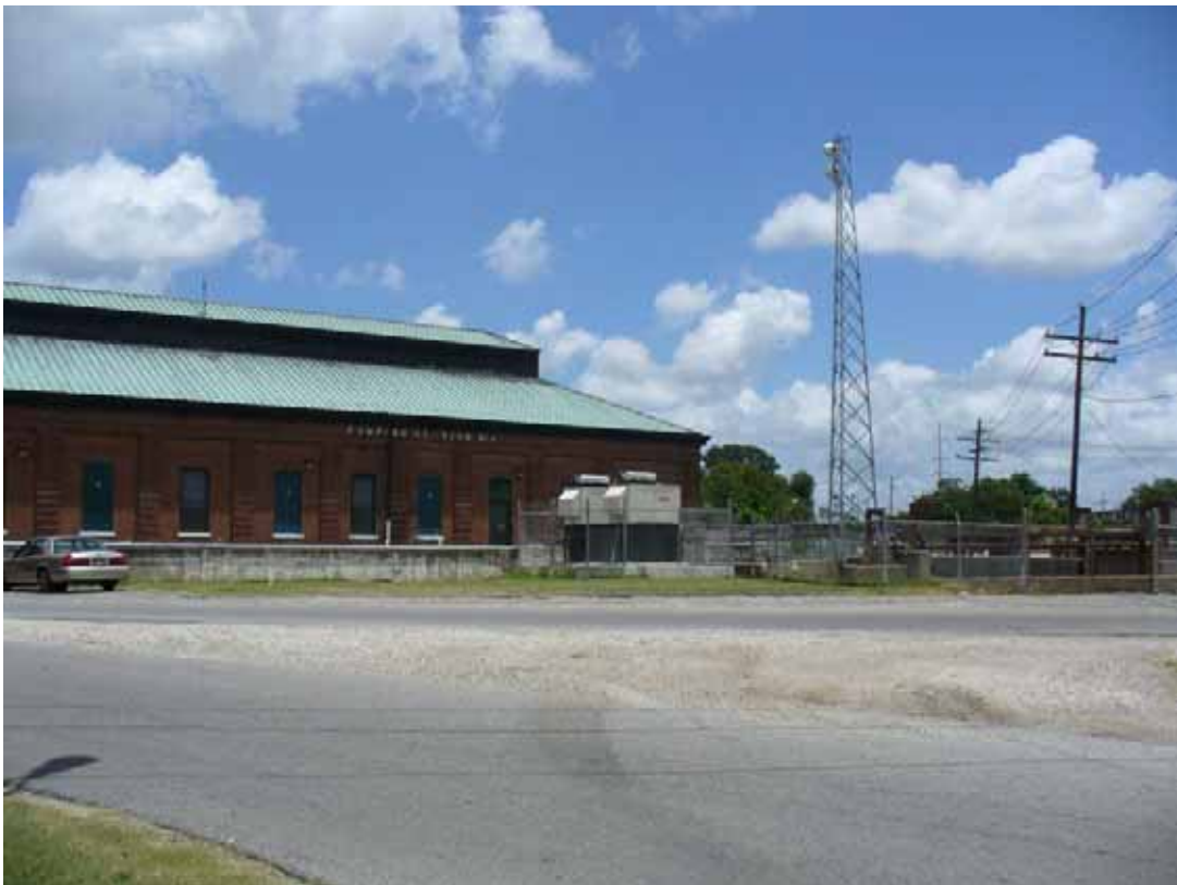
10. View of site as seen from the south direction, in southeast area.