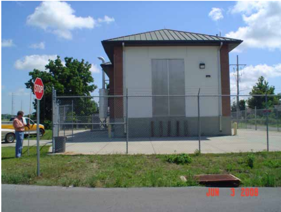
5. View of site as seen from the south direction.