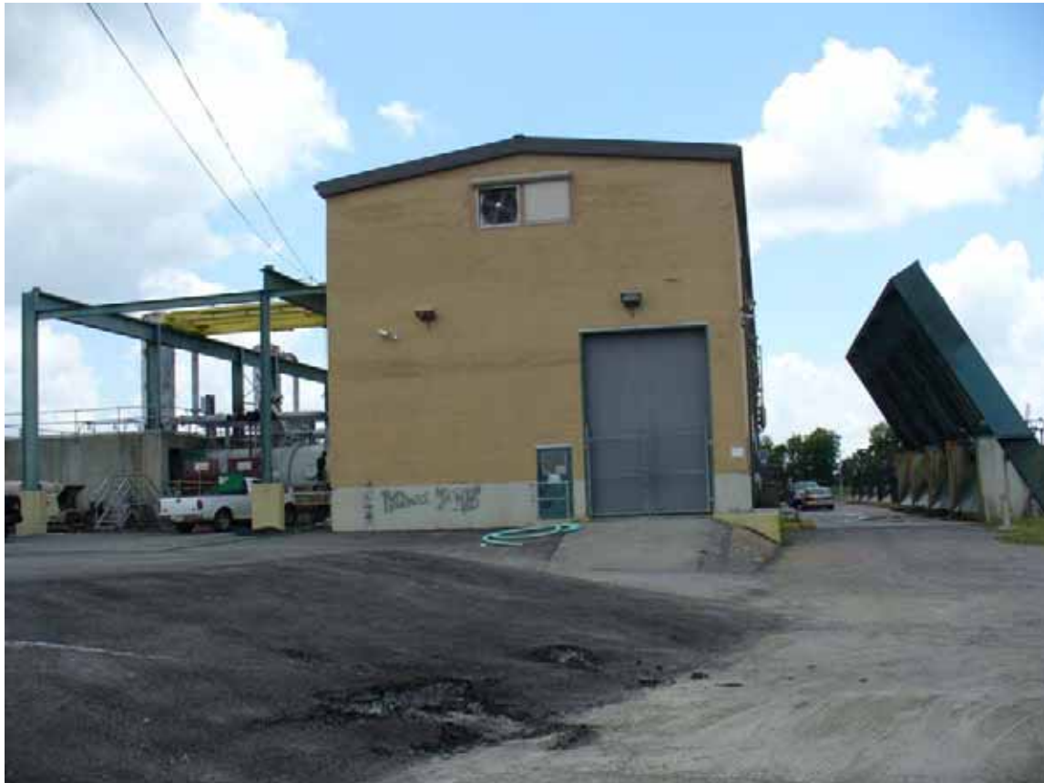
5. View of site as seen from the north direction.