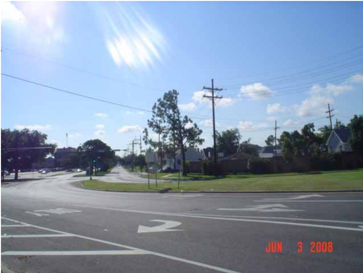
5. View of southeast area adjacent to the site.