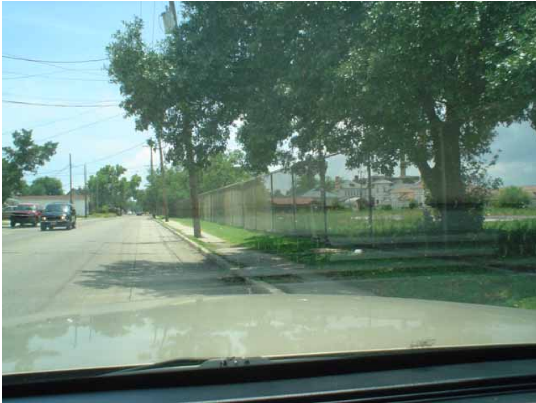
5. View of east side of site as seen from the north east corner looking south.