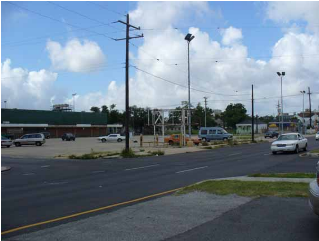
13. View of west area adjacent to the site, with abandoned Robert's Fresh Market, in southwest area.