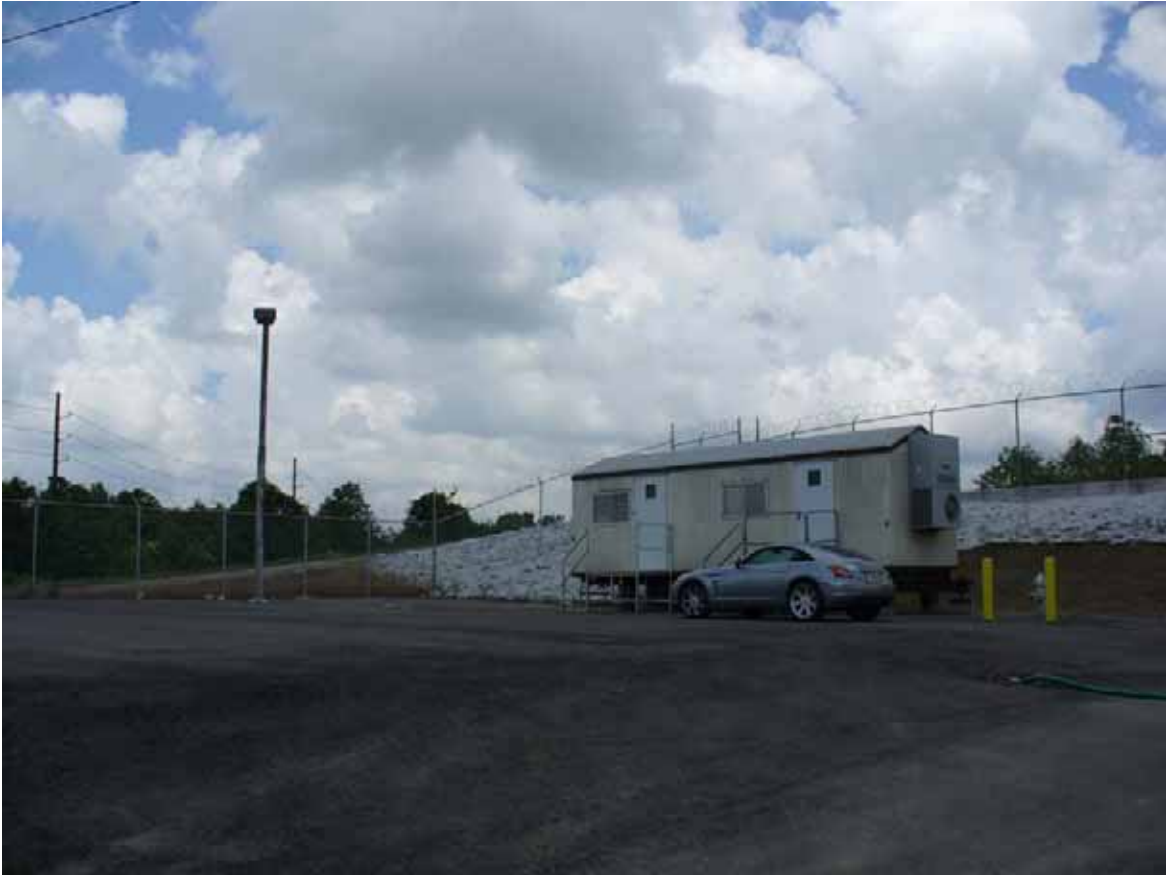
7. View of northeast area adjacent to the site.