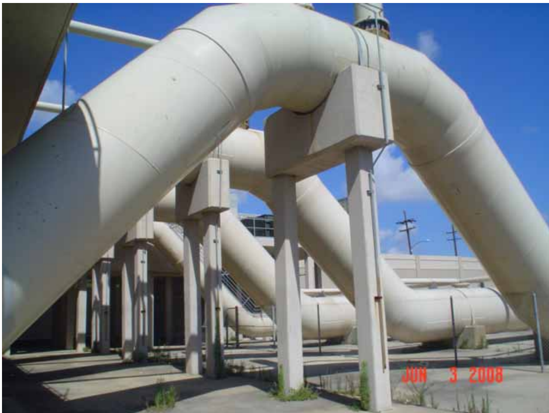
2. View of north side of site north from inside walls, showing pipelines.