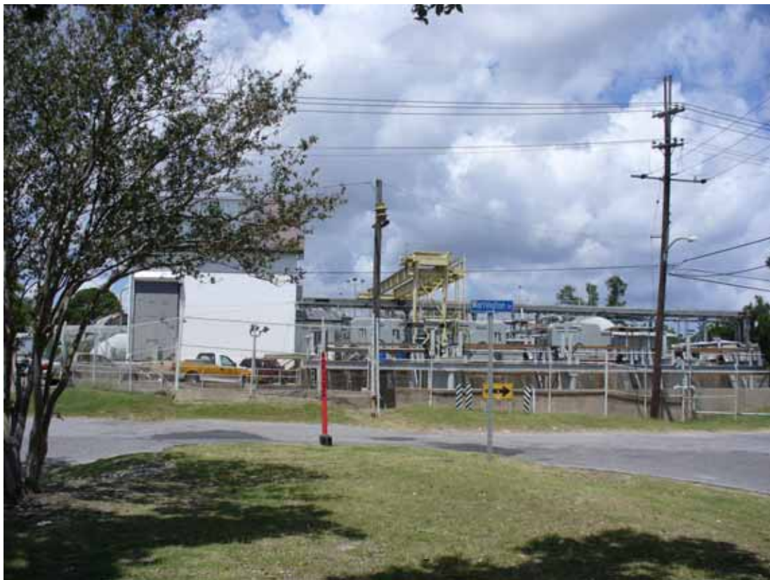
4. View of site as seen from the east direction.