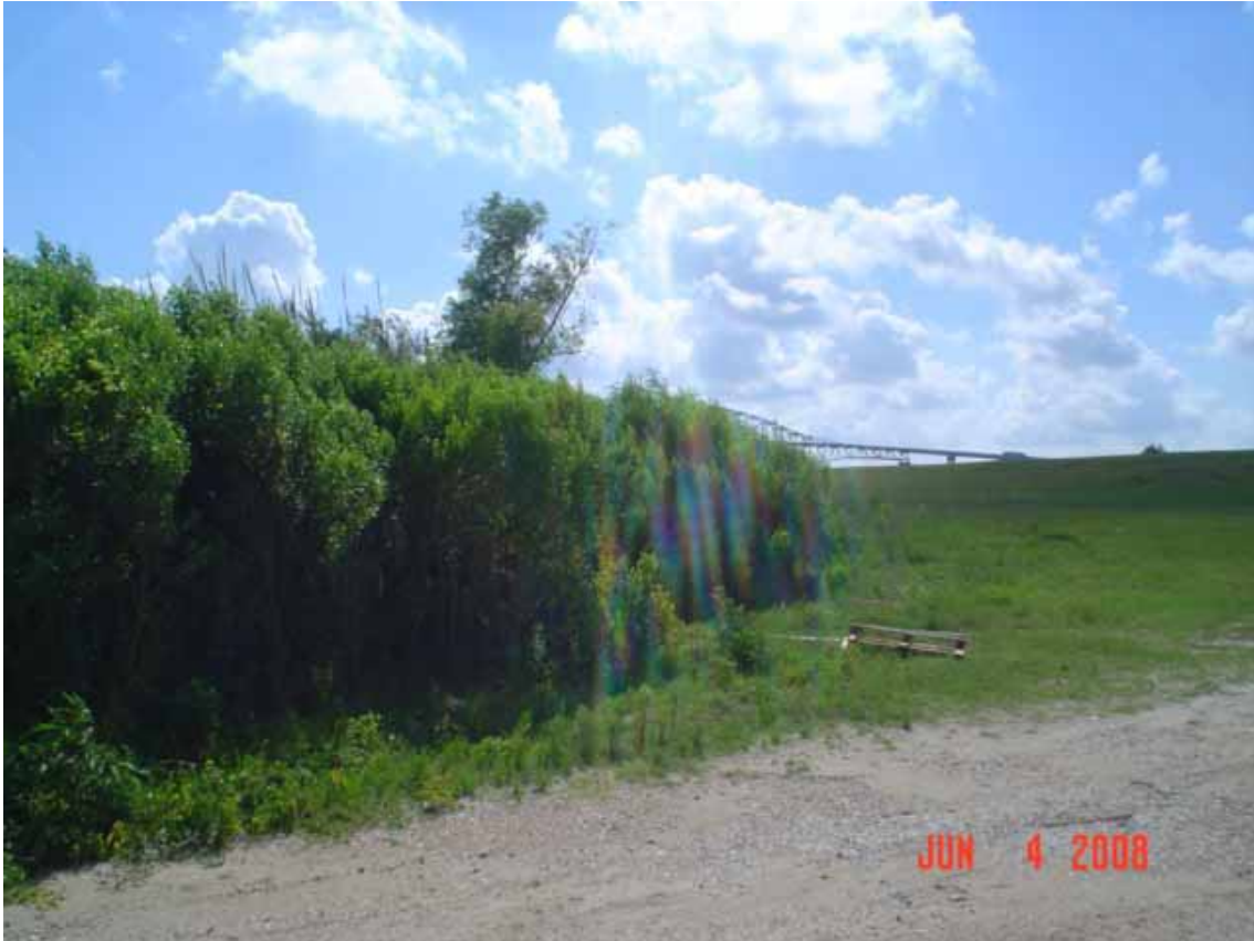
5. View of east area adjacent to the site, including levee.