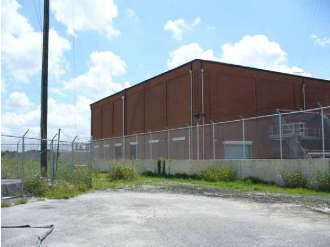
11. View of site as seen from the west direction.