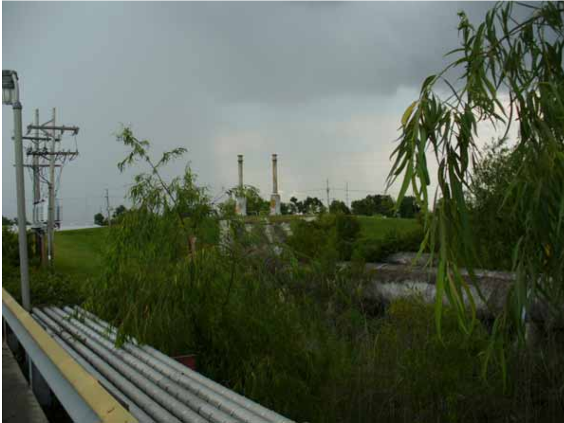
3. View of north area adjacent to the site, showing transformers, stacks and pipes.