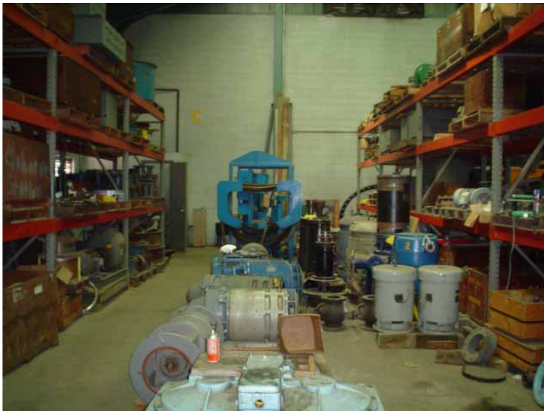
113. Metal parts stored in Hamilton Street warehouse.