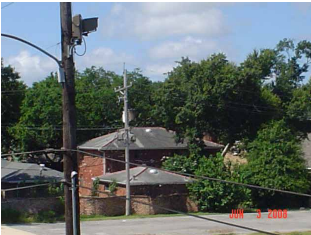
16. Transformers on poles, southwest corner.