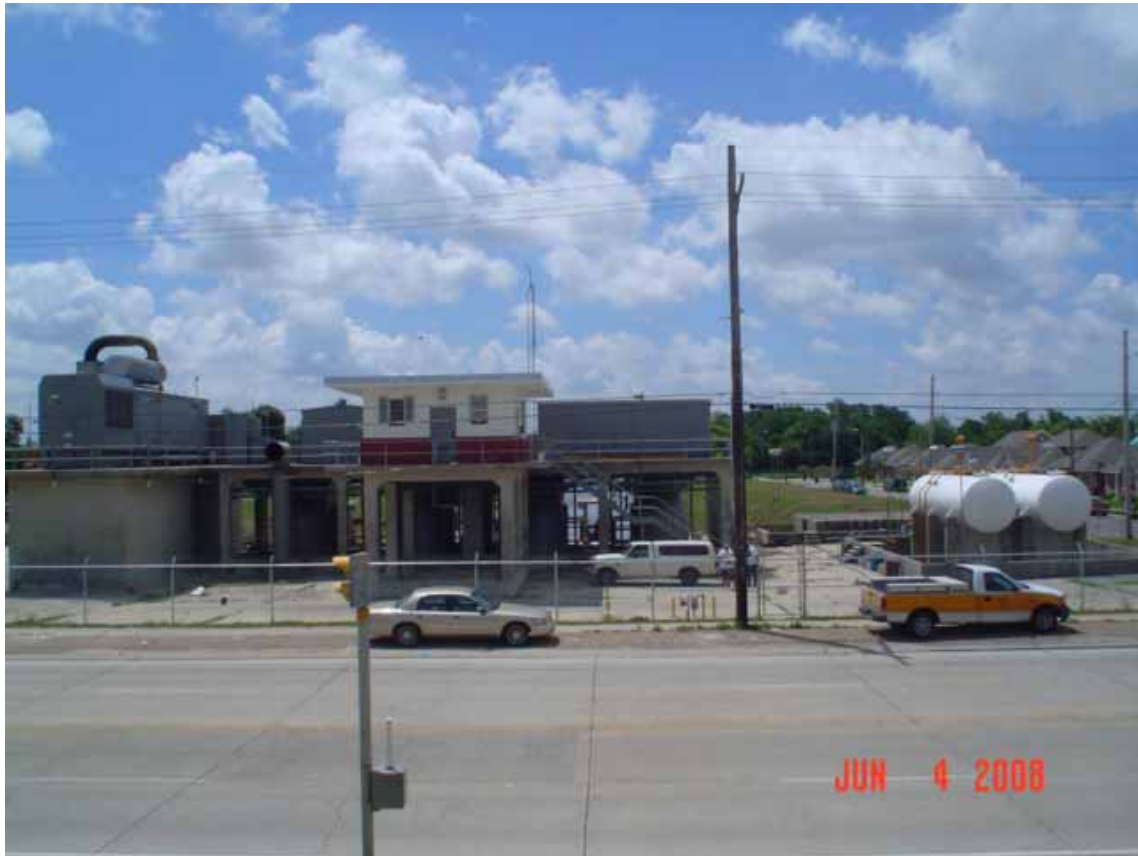
1. View of site as seen from the north direction.