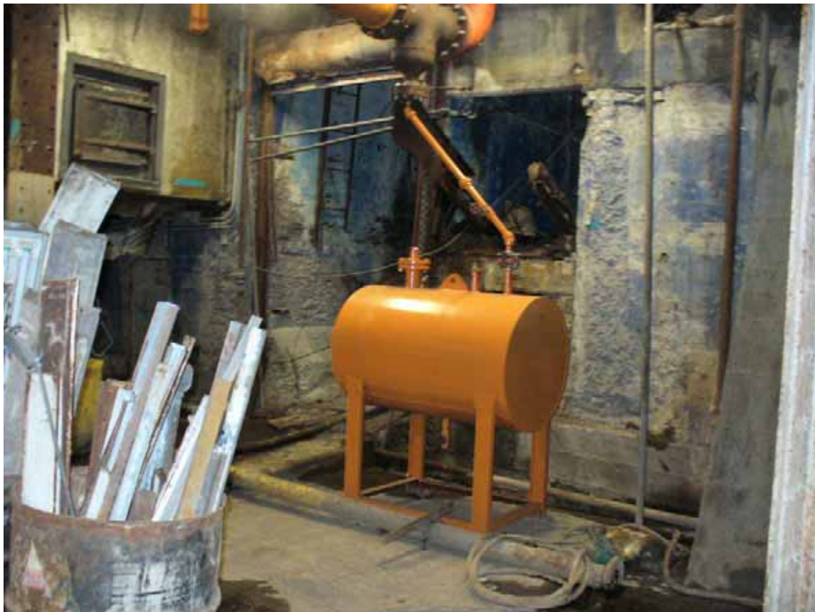
61. Diesel storage tank in basement.