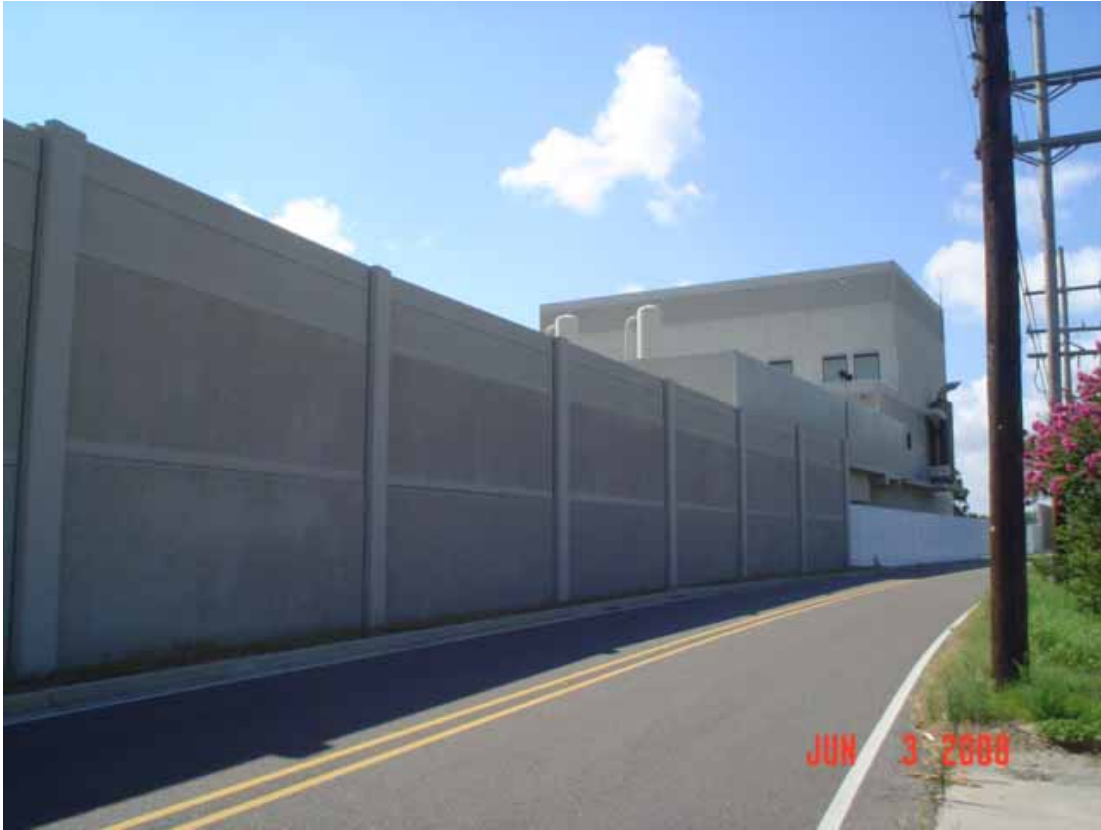
1. View of site as seen from the north direction.