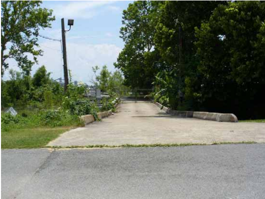
15. Entrance to intake pier.