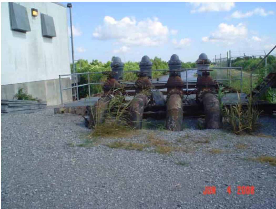
14. Pumps on canal