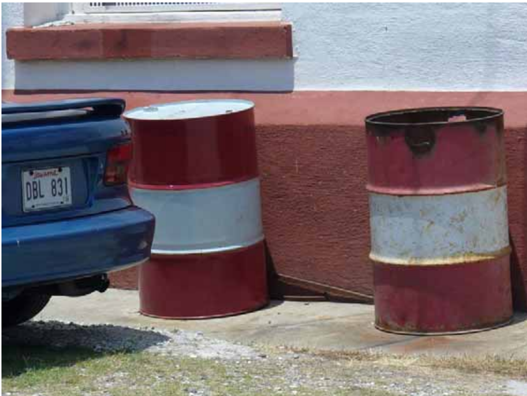
24. Drums outside building.