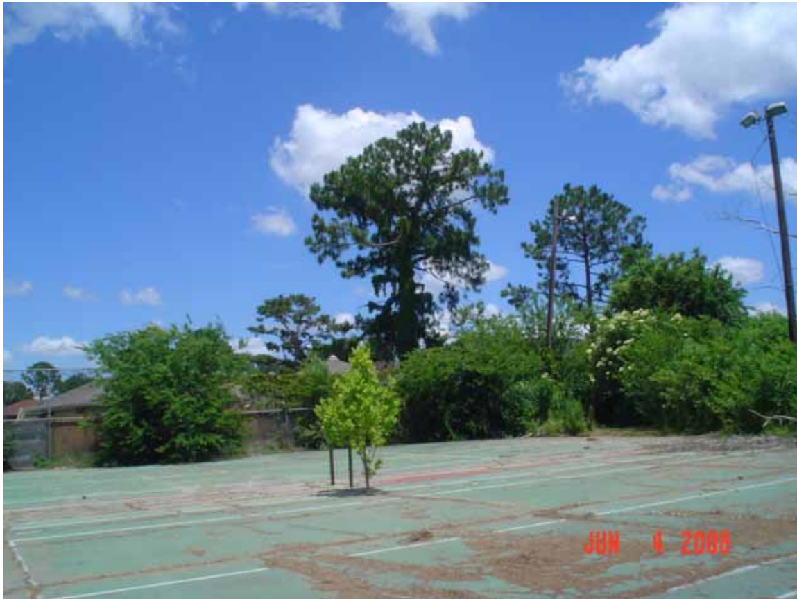
5. View of east area adjacent to the site.