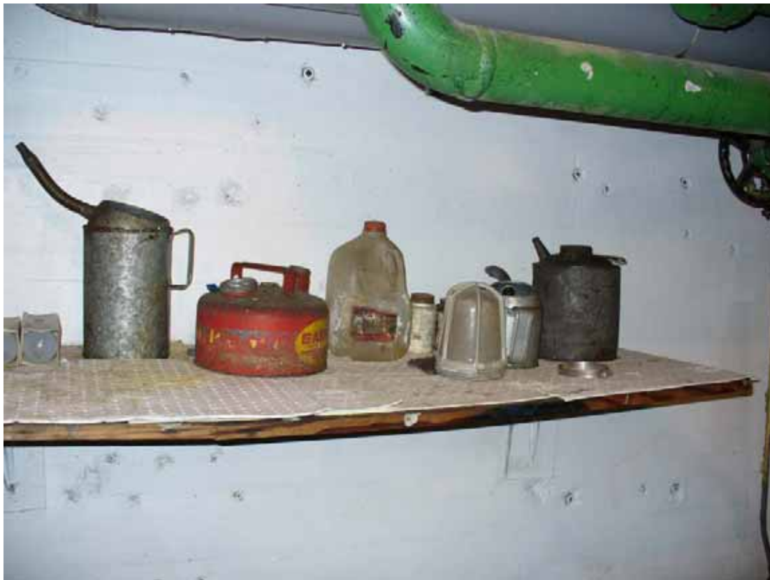
65. Miscellaneous containers storing petroleum products.