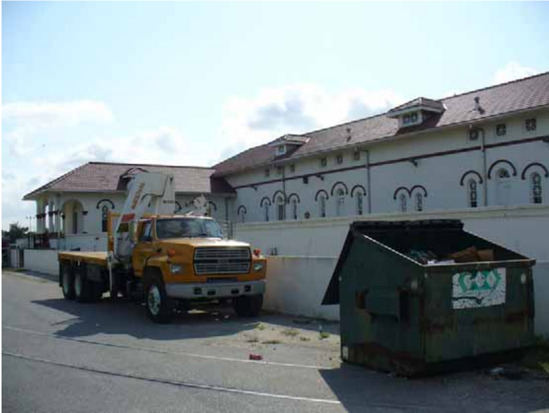
32. West side of old filter gallery building.