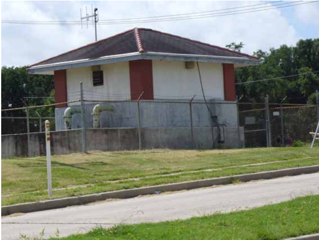
15. Sewage pump across street, southeast corner.