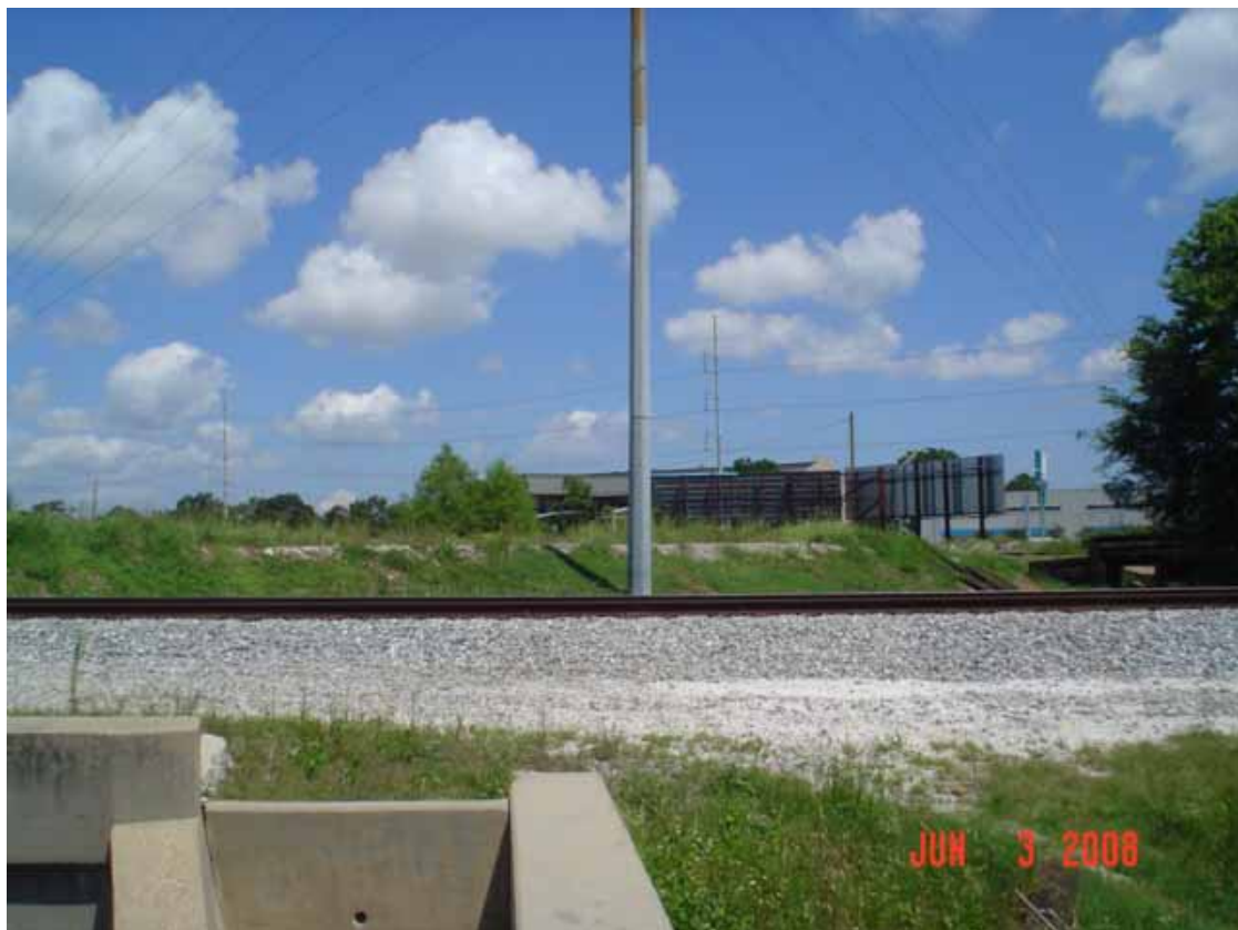
12. View of west area adjacent to the site, southwest corner, showing railroad and Airline Highway.