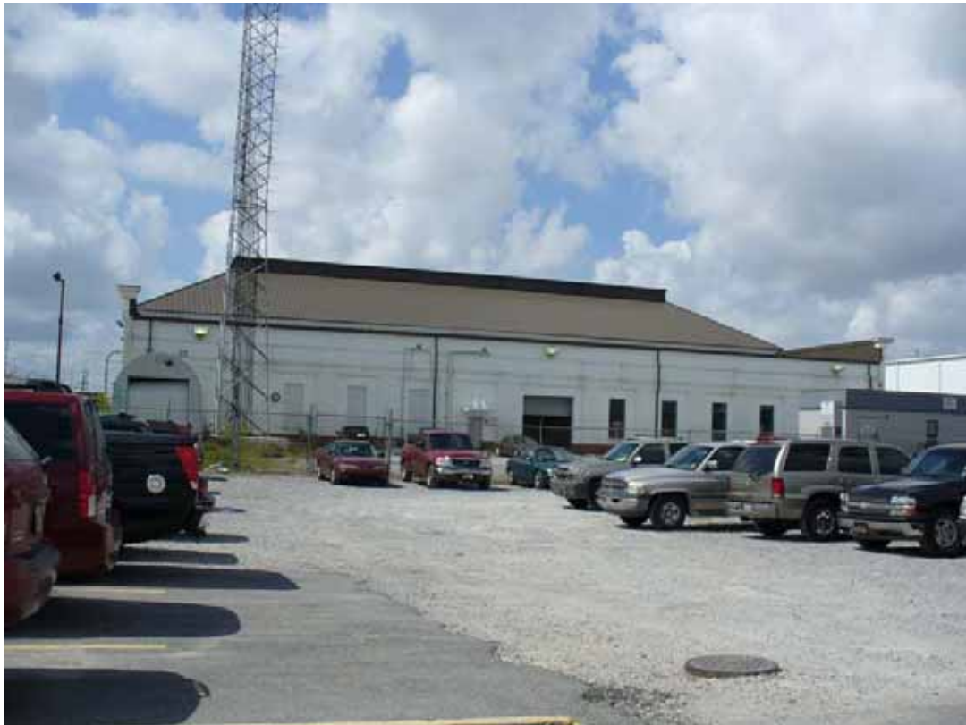
1. View of site as seen from the north direction.