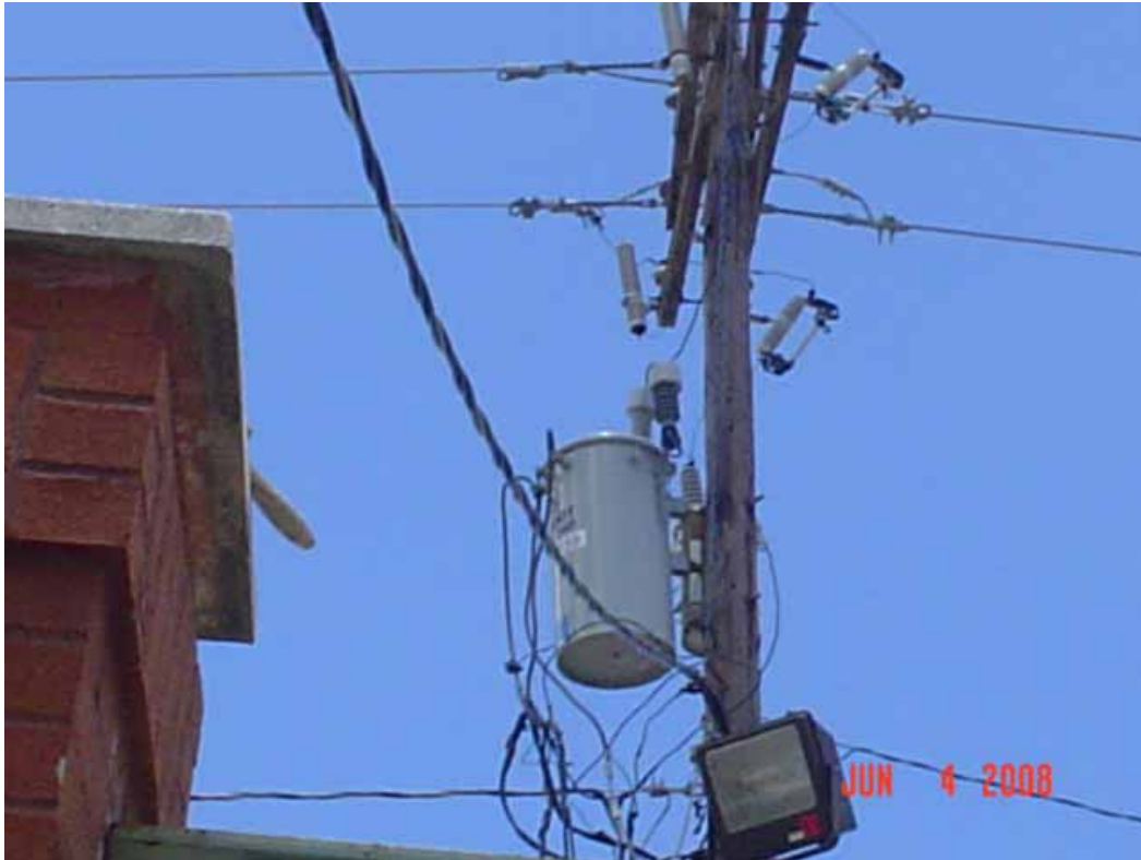
13. Transformer west of building.