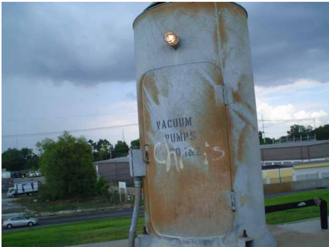
16. Stacks on top of levee, vacuum pumps.