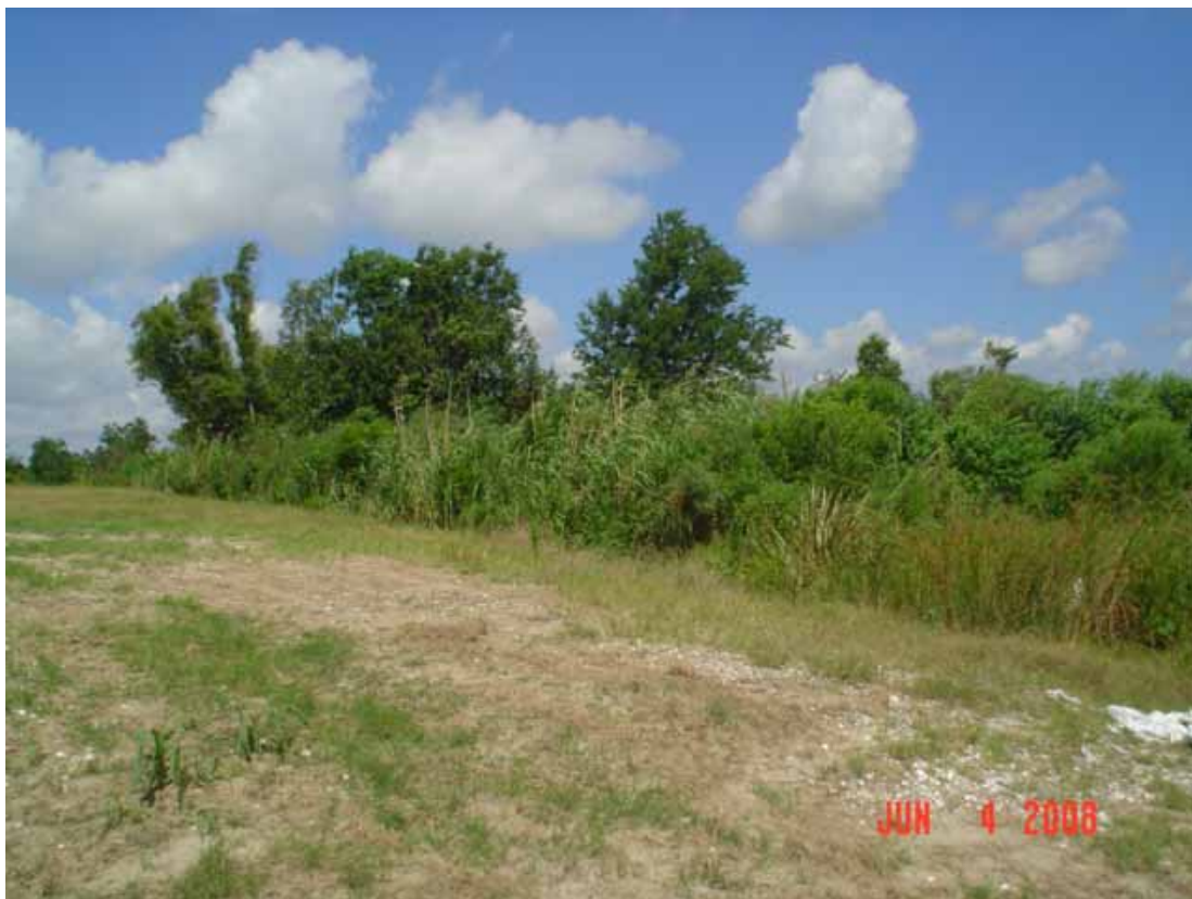
10. View of west area adjacent to the site, northwest corner.