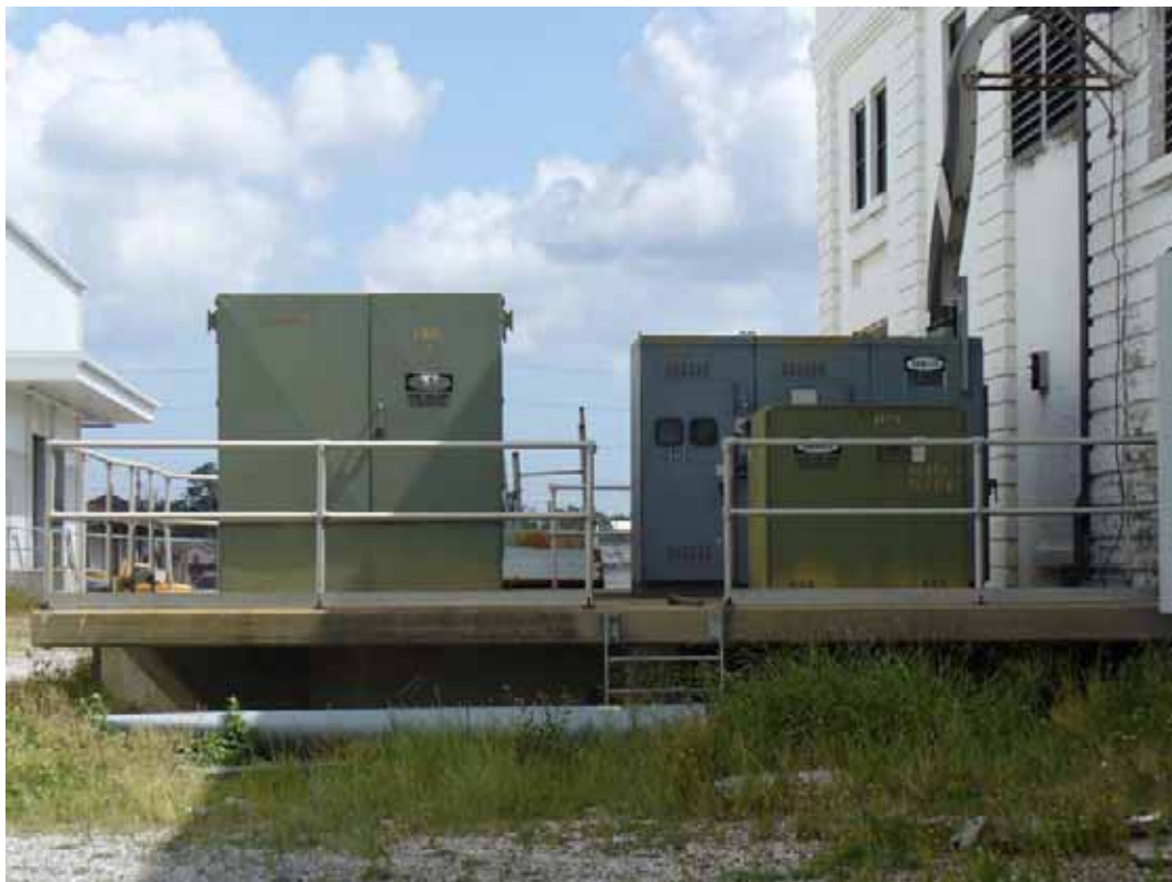
14. View of transformers in west area.