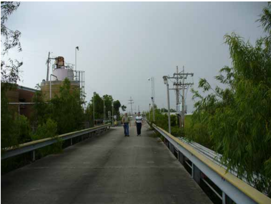
2. View of north area adjacent to the site, showing access road, transformers and additional building.