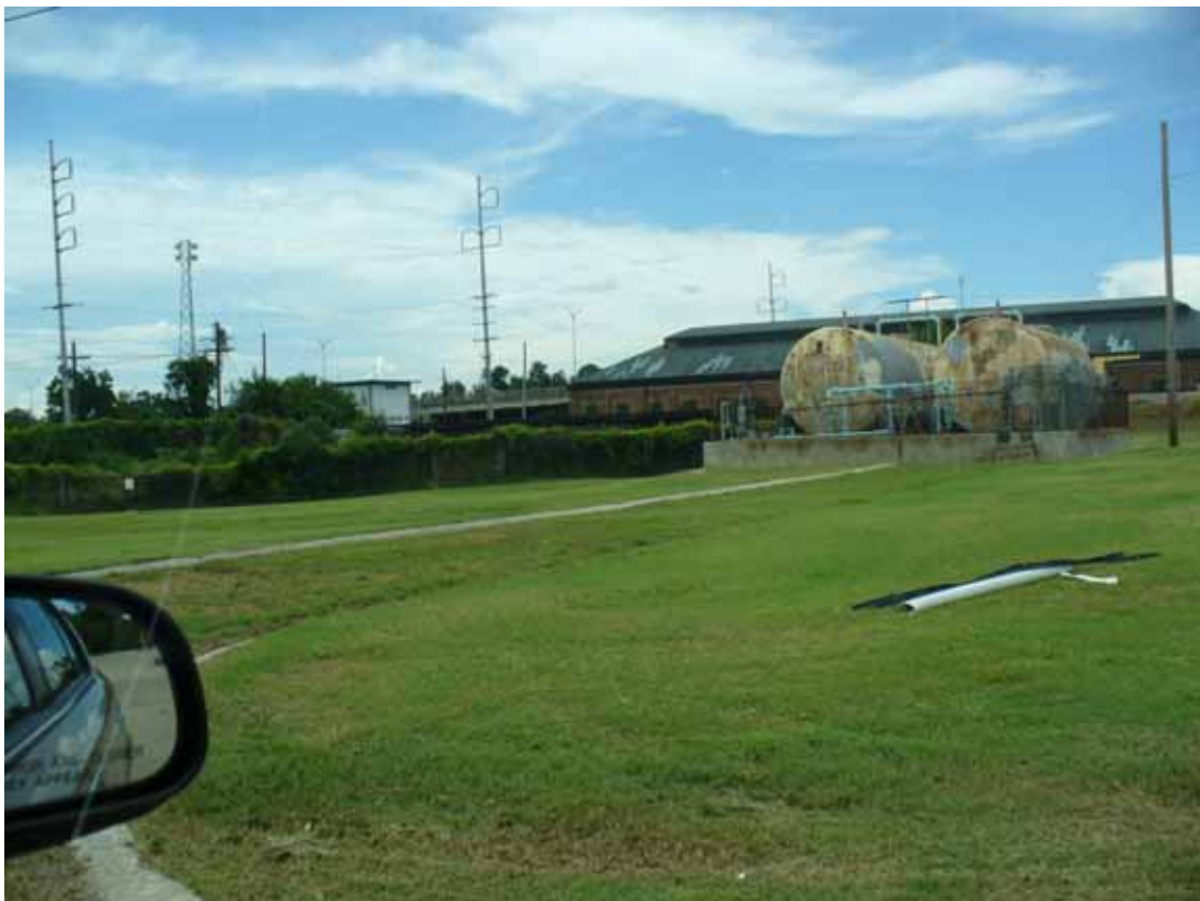
24. South side of station, showing tanks and air monitoring station.