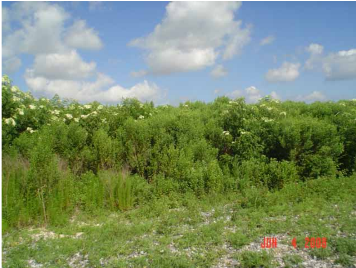
11. View of west area adjacent to the site, northwest corner.