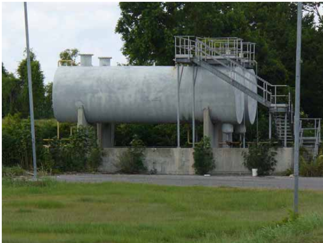
4. View of east area adjacent to the site, where 2 - 30,000 diesel AST's are located.