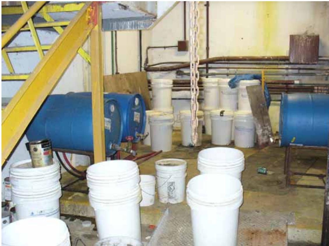
59. Chemicals stored in barrels used for water treatment.