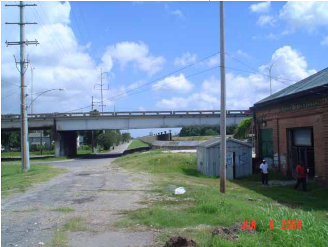
12. View of west area adjacent to the site, road over canal.