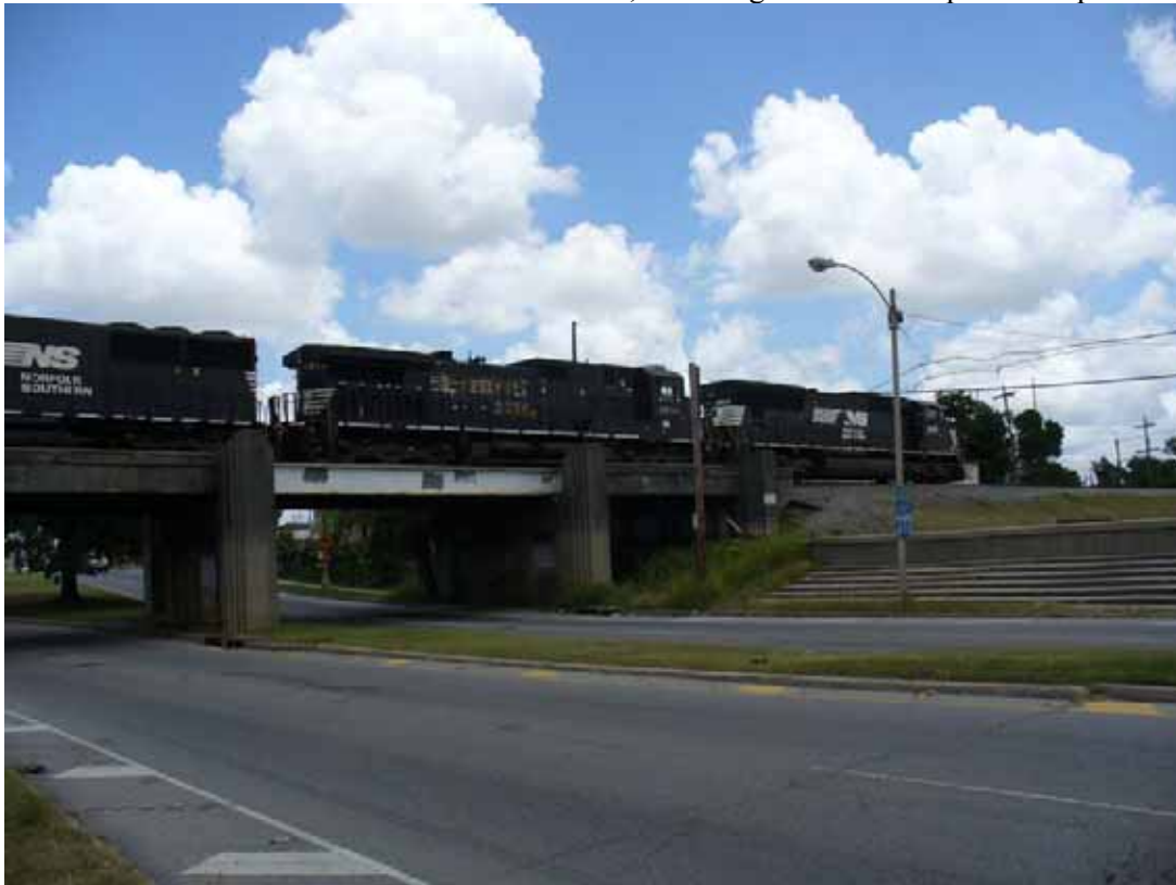
6. View of east area adjacent to the site, observe railroad over pass.