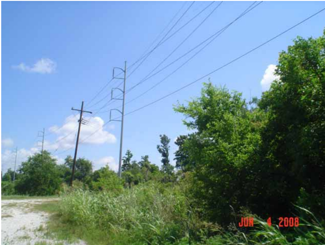
3. View of north area adjacent to the site, northeast corner, including levee.