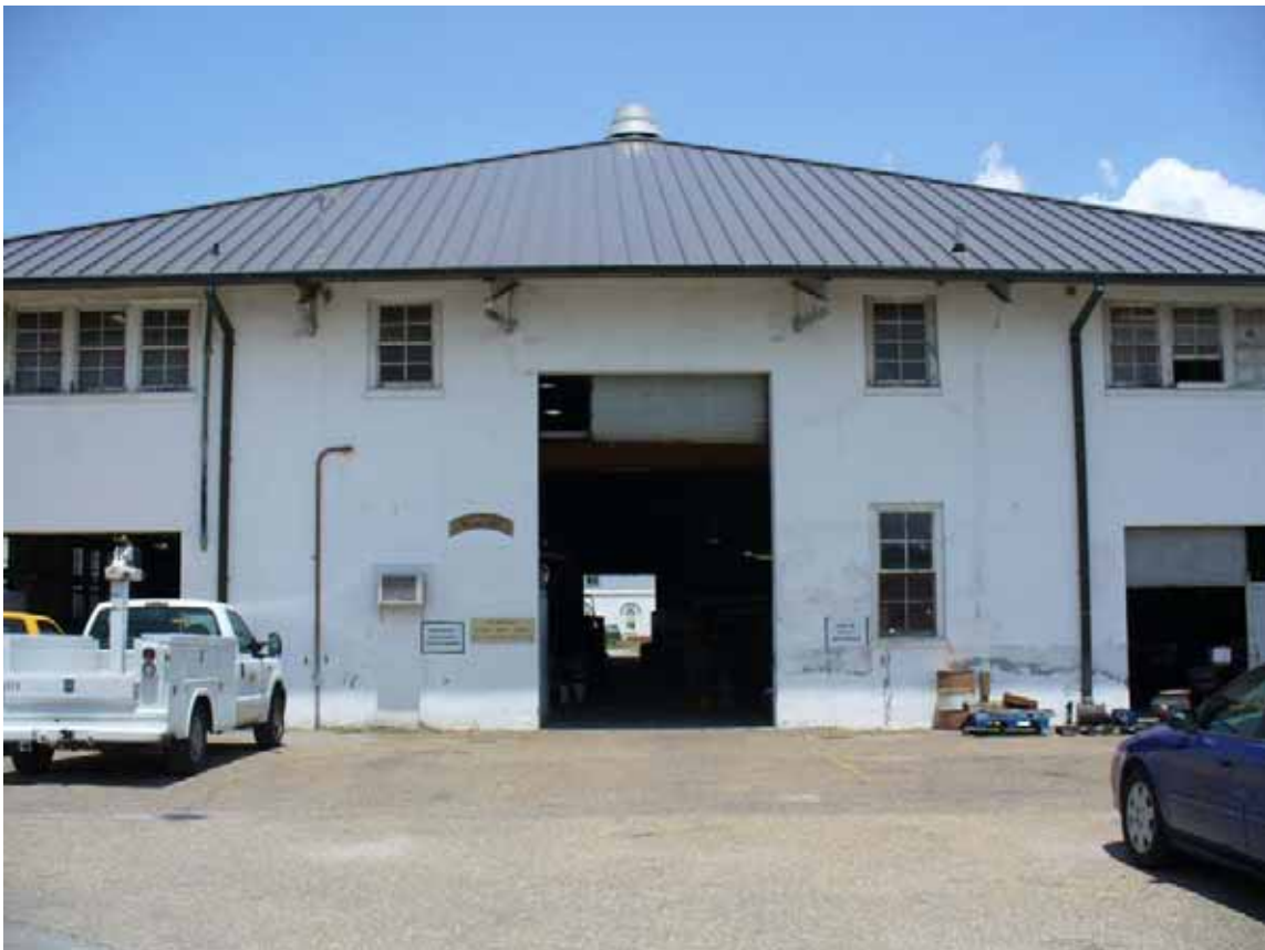
79. East side of machine shop building.