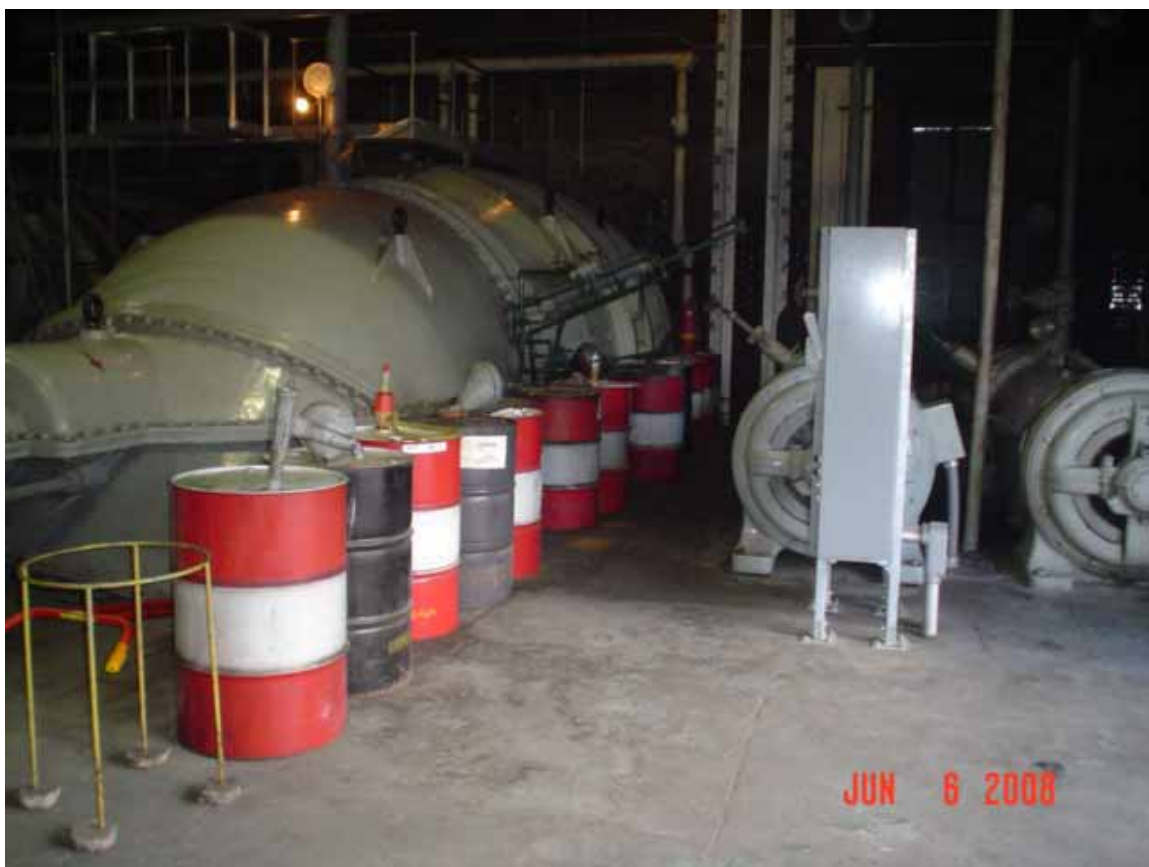
16. View of miscellaneous 55 gallon drums alongside pump inside station building.