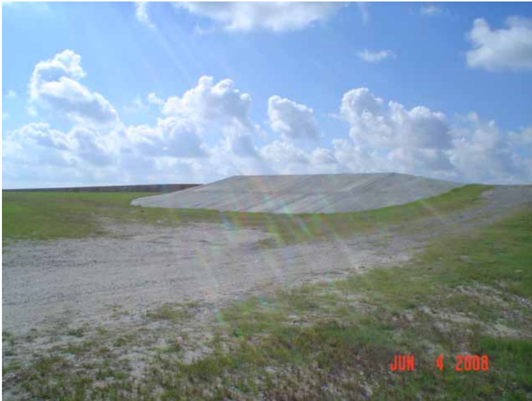
9. View of south area adjacent to the site, new levee section.