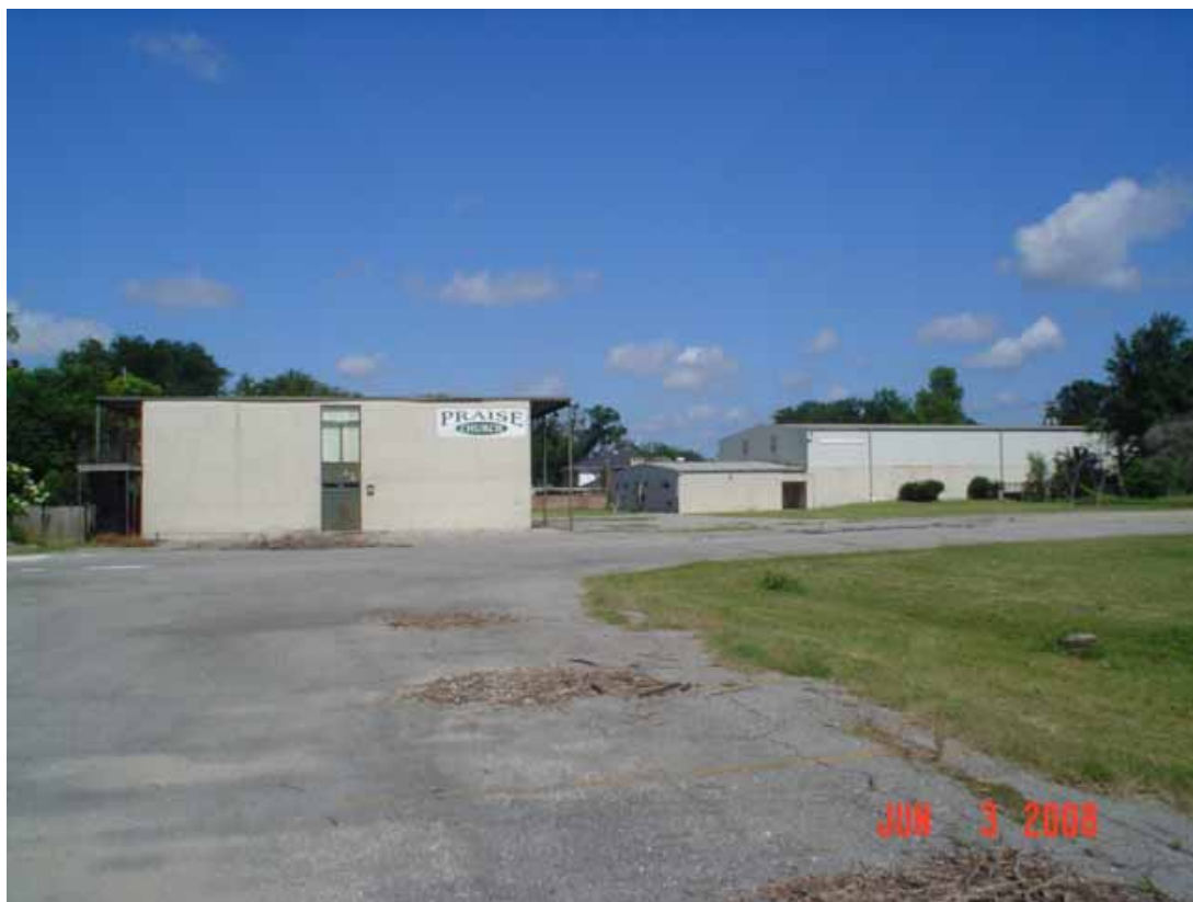
10. View of west area adjacent to the site.