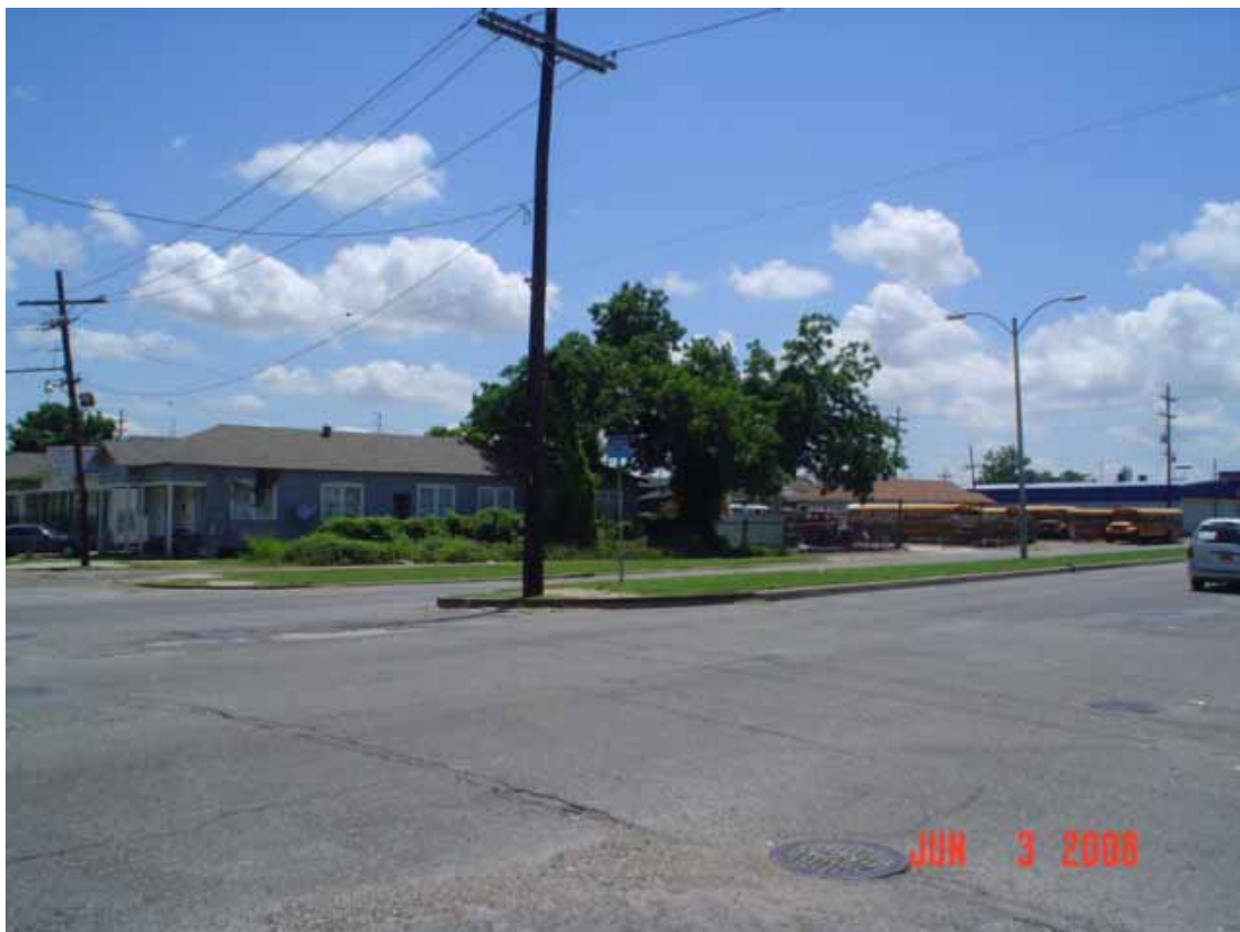
4. View of north area adjacent to the site, across Earhart Boulevard, showing school buses.