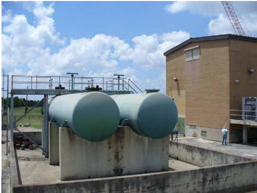
14. View of fuel tanks stored in southwest corner.