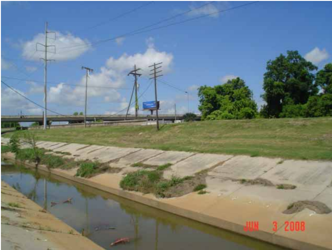
9. View of west area adjacent to the site, including Airline Highway.