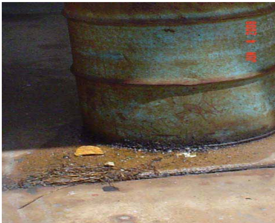
12. View of rusting, leaking 55 gallon drum located outside in southeast area.