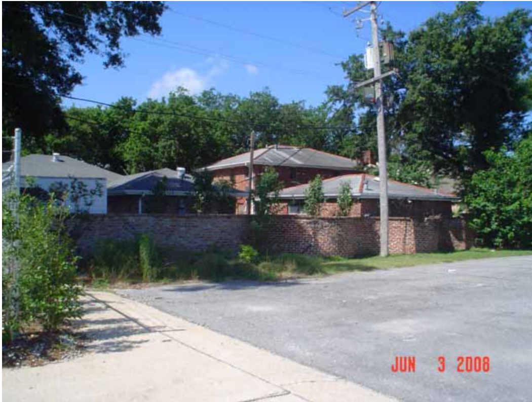
11. View of west area adjacent to the site, southwest corner.