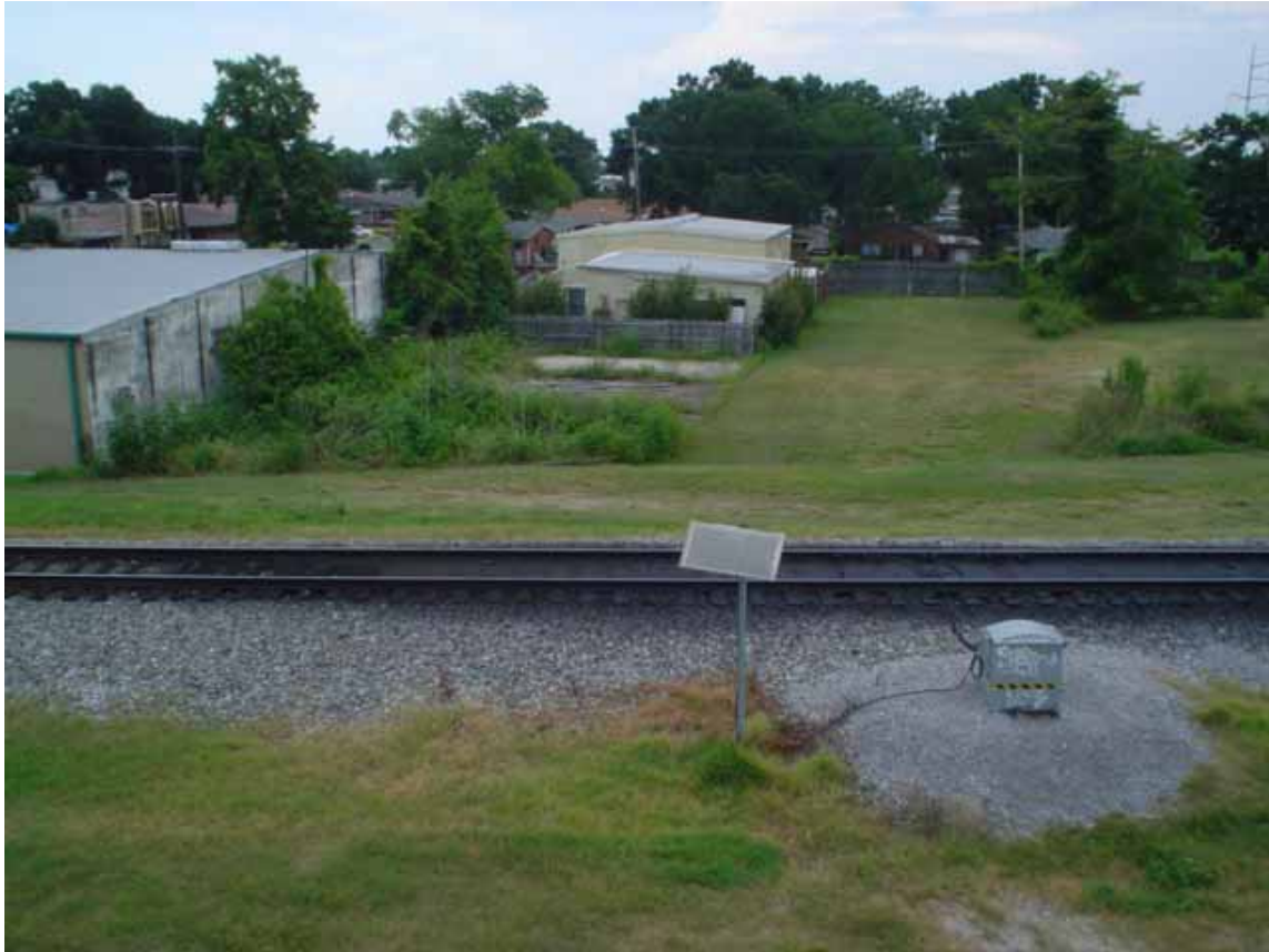
3. View of north area adjacent to the site, west side of canal.