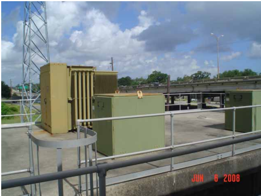
18. Transformers on property.