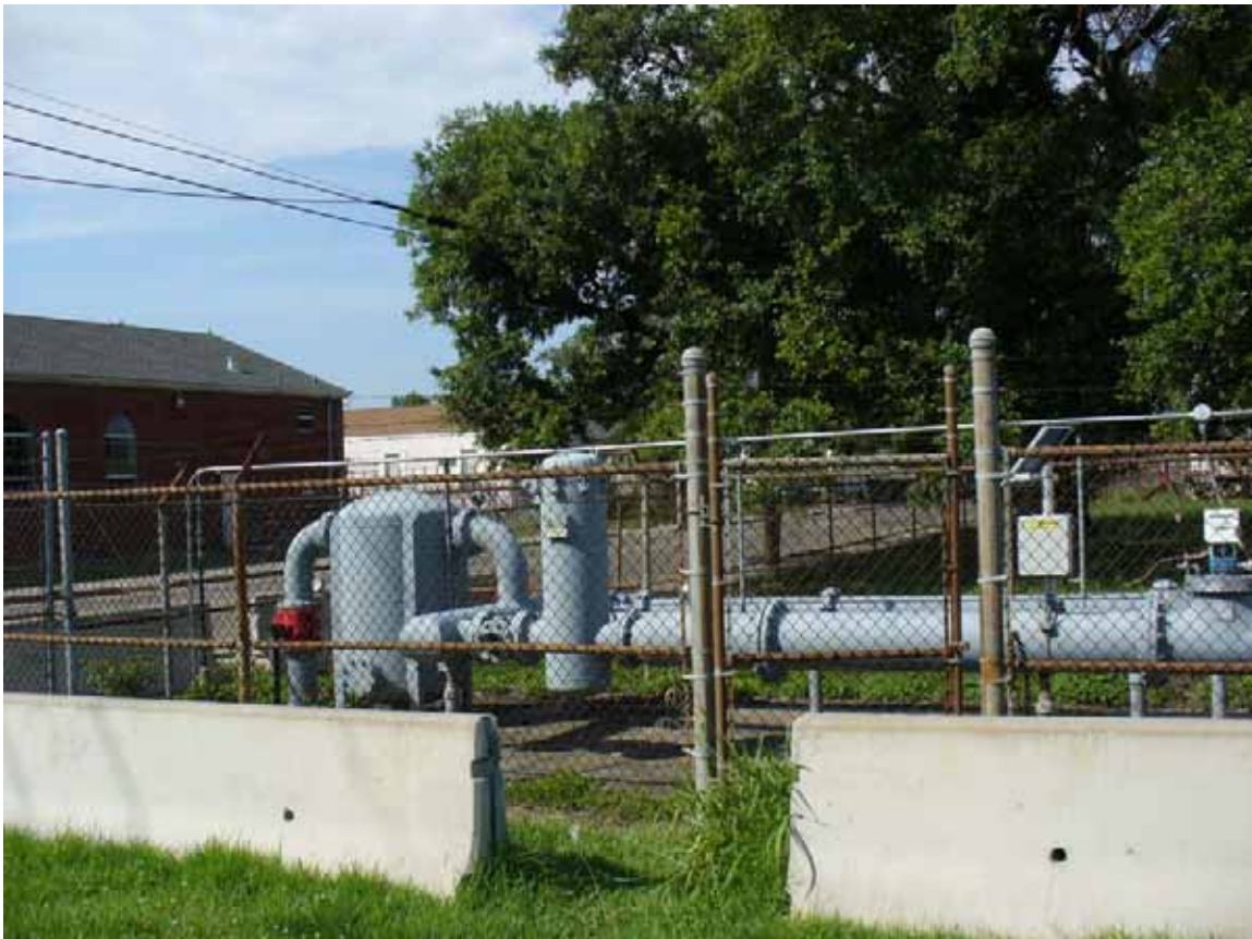
41. Gas line and meter on Leonidas Street on S&WB property.