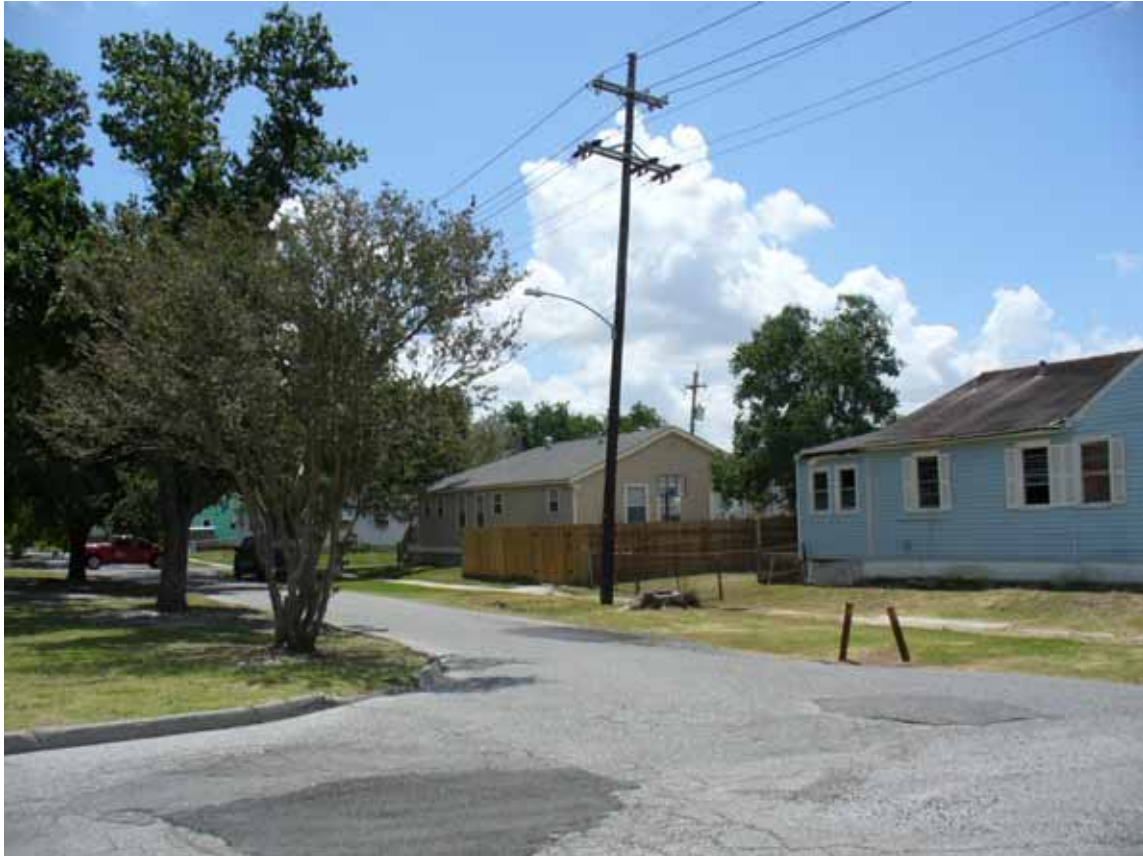
5. View of east area adjacent to the site, Warrington Drive.