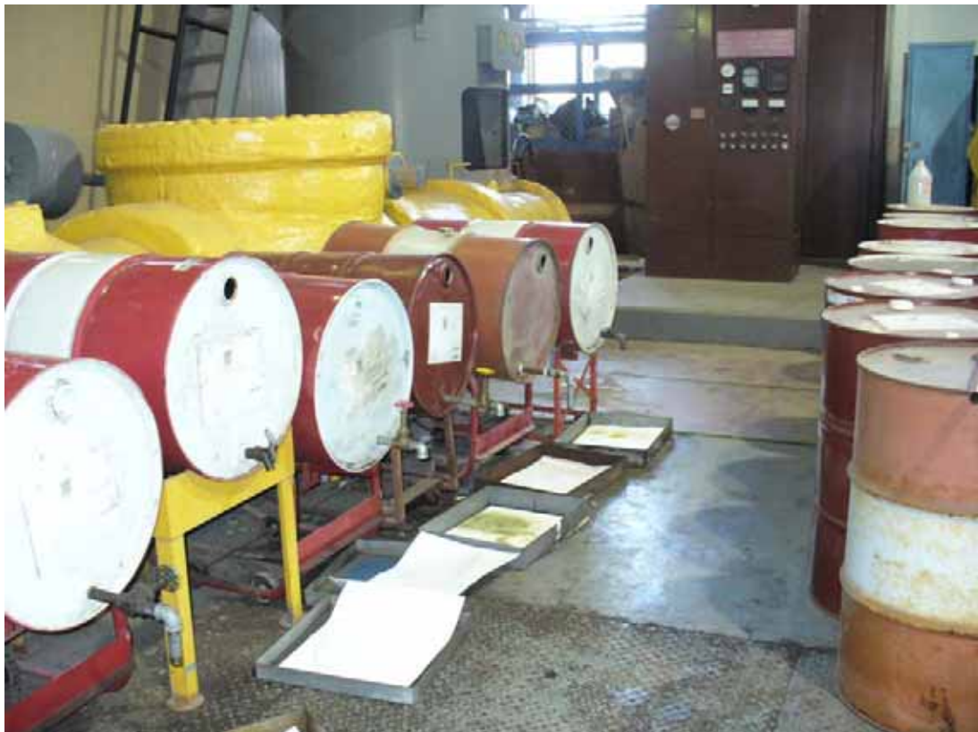
67. Drums containing petroleum products in low-lift building, observed open containers.