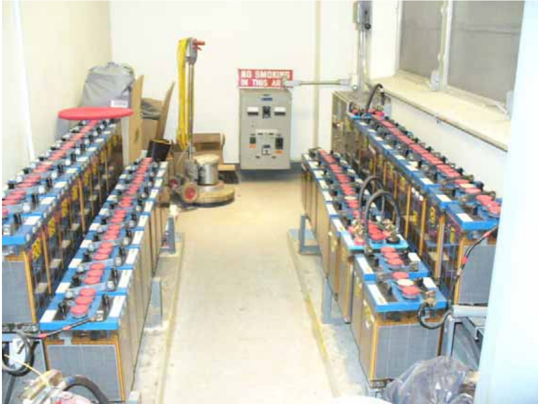
48. 40 Batteries located in central control battery room.