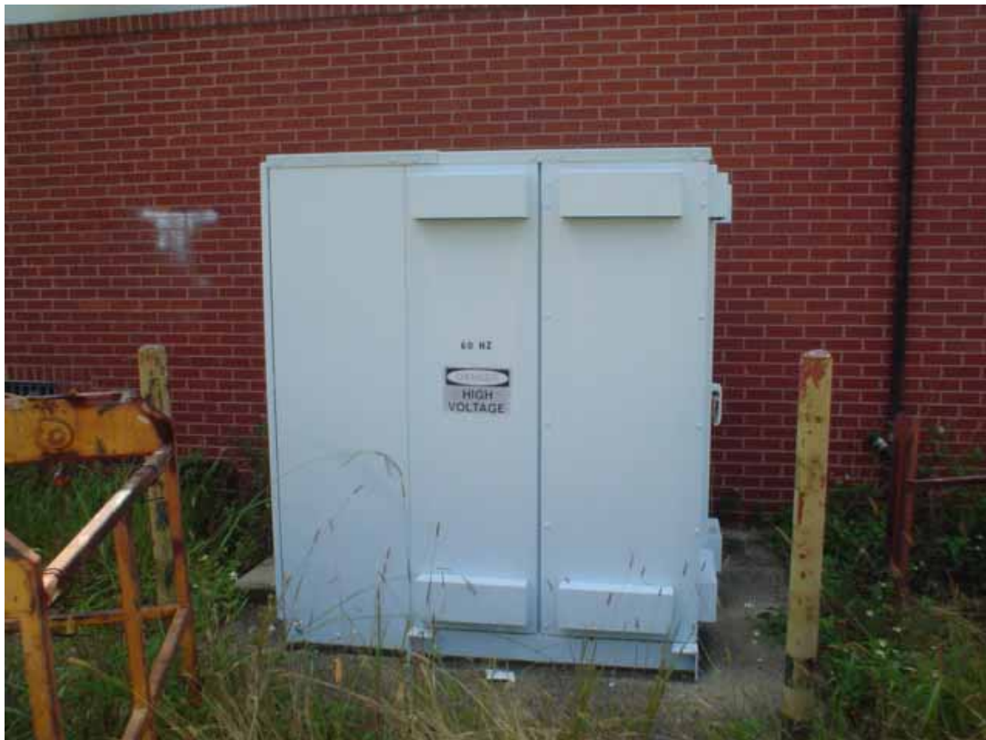
111. Transformer on west side of Hamilton Street substation.