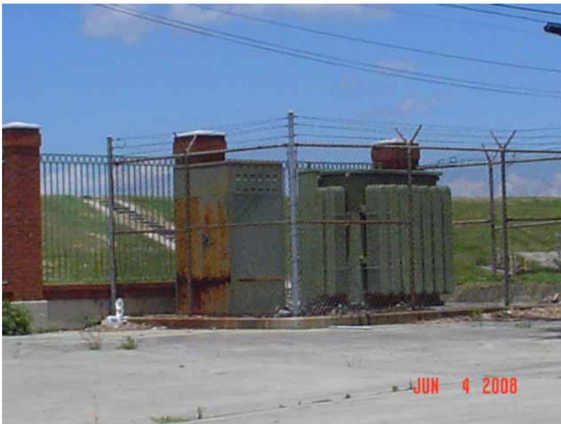
12. Entergy transformer, northeast corner.