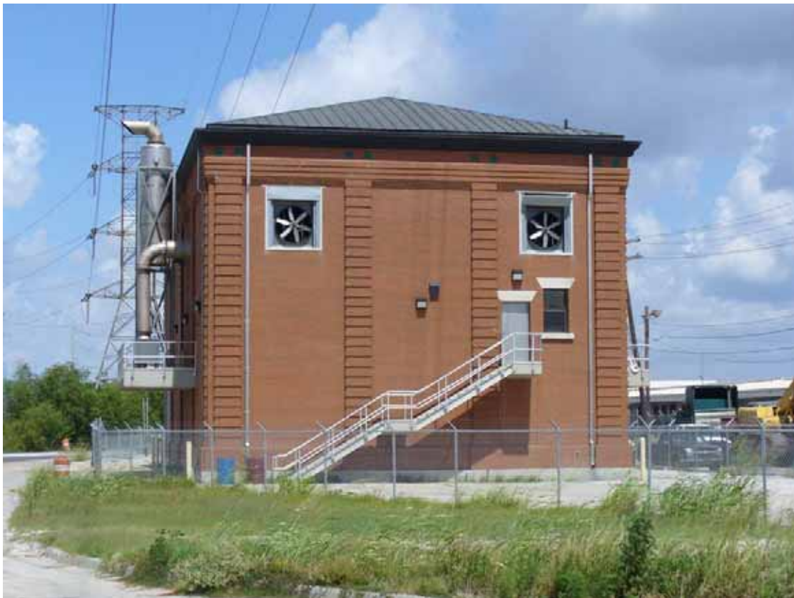
18. Generator building, east side.