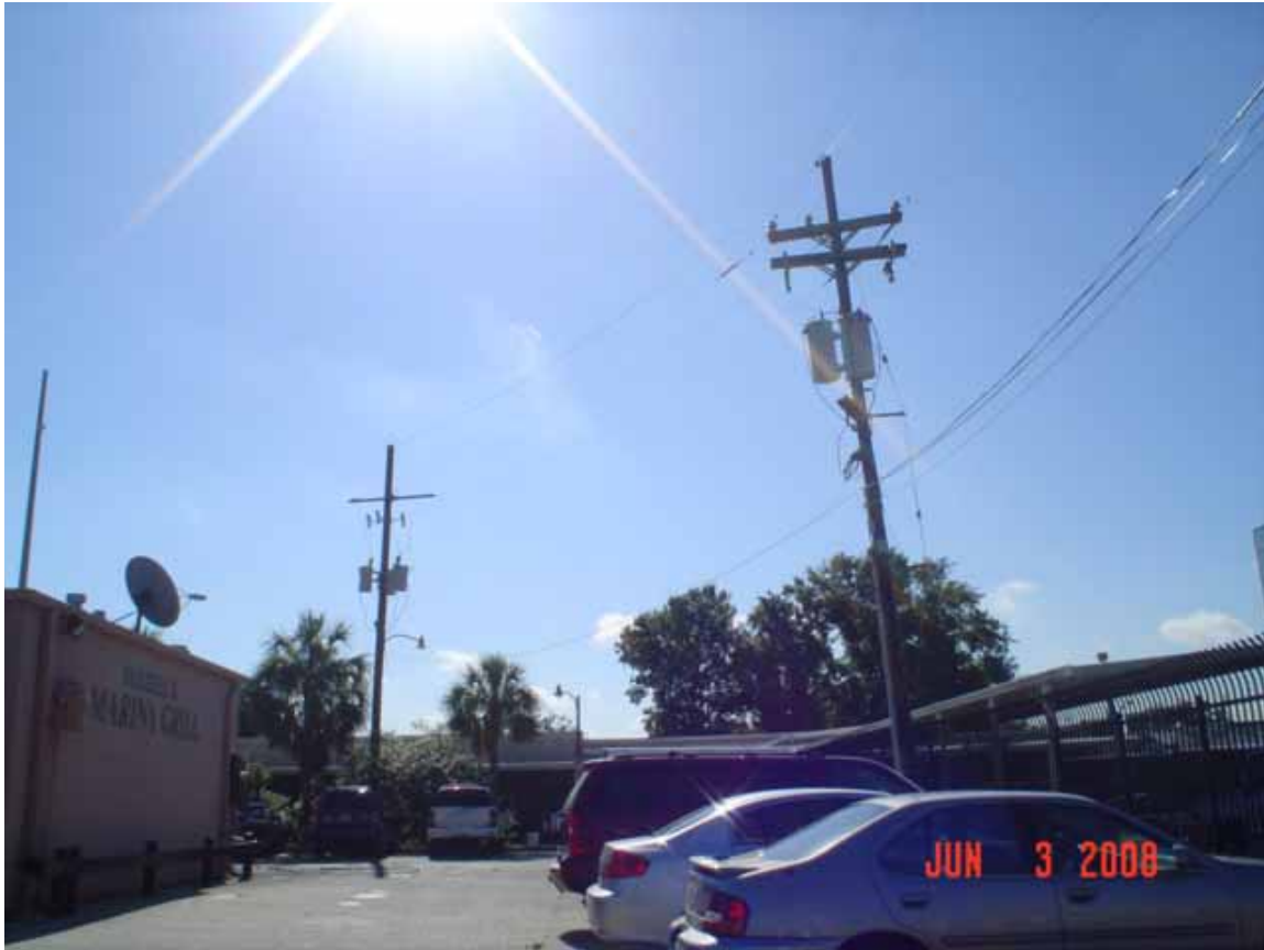
13. Observe transformers northwest of site.