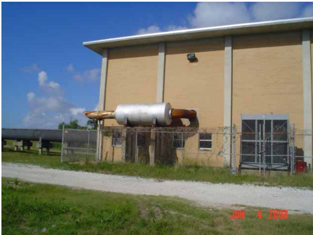
4. View of site as seen from the east direction, southeast corner.