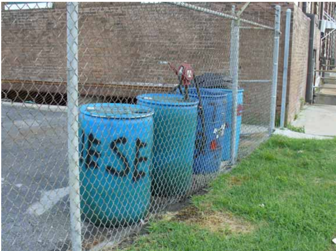
18. View of 55 gallon drums stored outside the building, on the property.