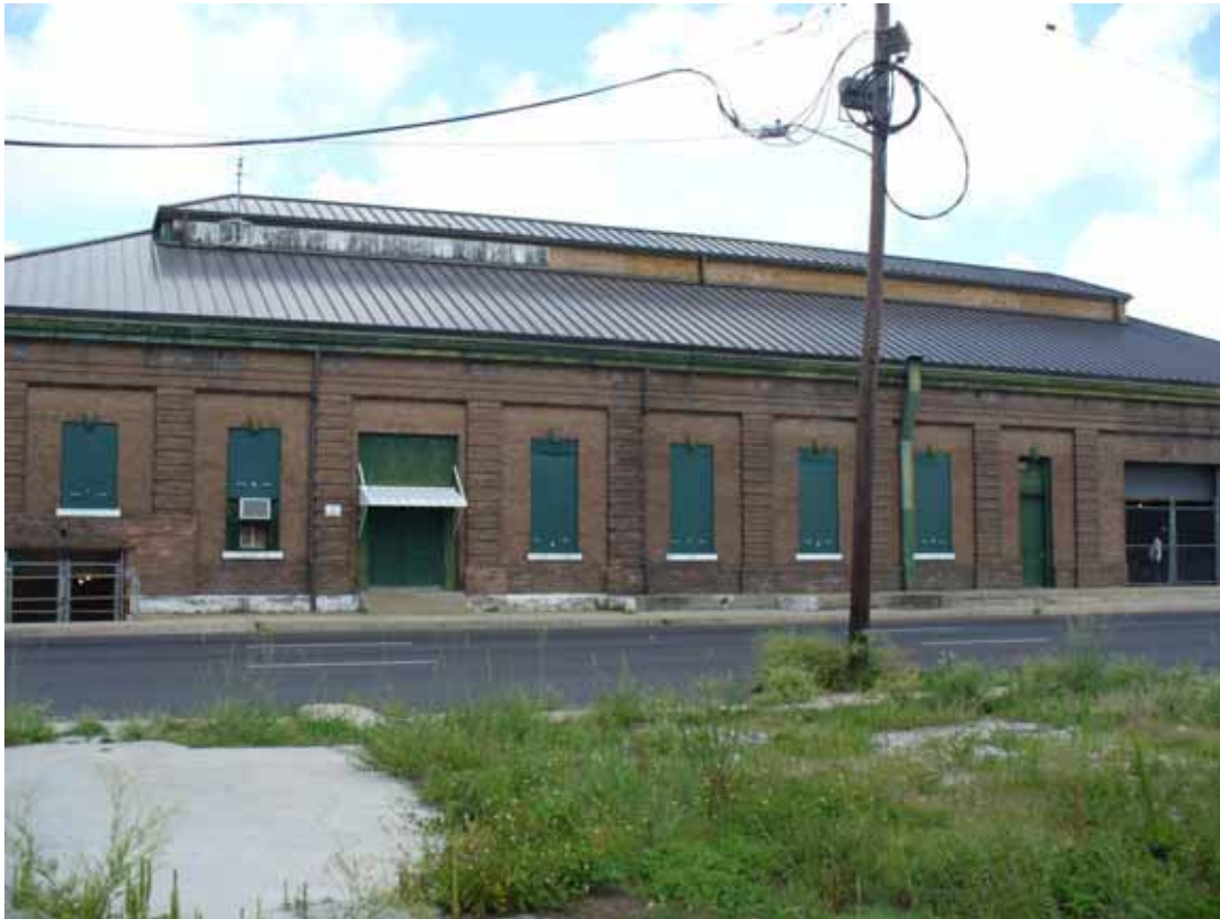
9. View of site as seen from the south direction.