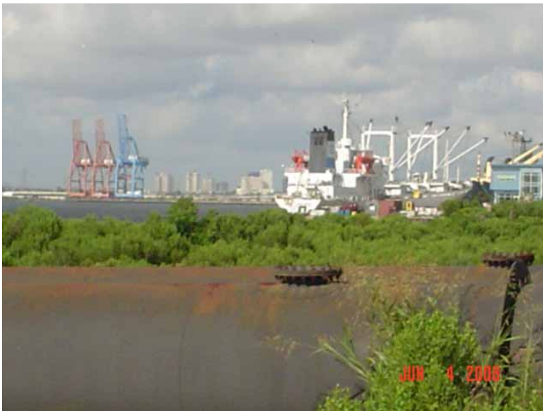
16. Industrial area over levee, southwest corner.