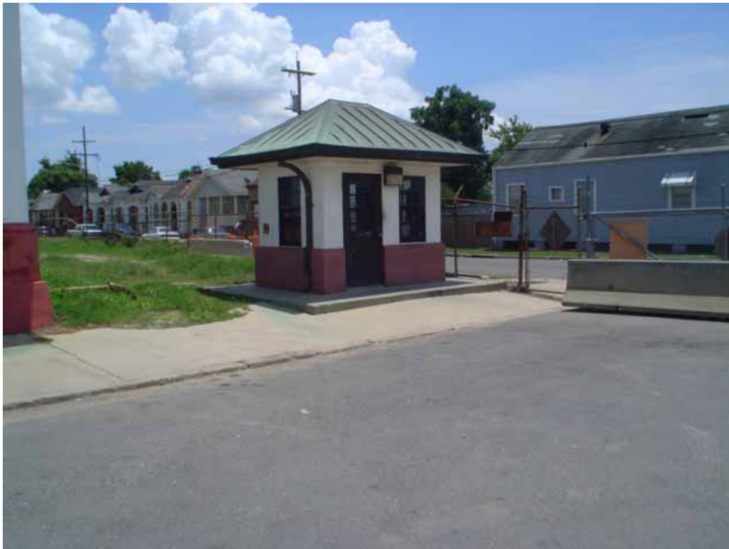
105. Guard house located at south gate on Eagle Street and Spruce Street.