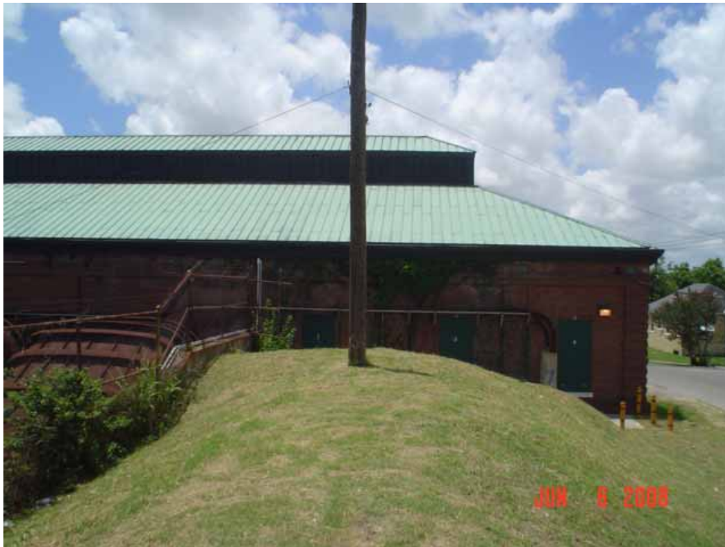
2. View of site as seen from the north direction, in northwest area.