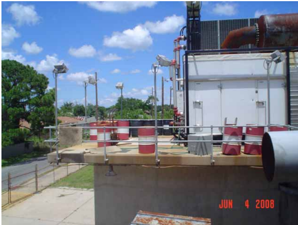
13. Observe drums of stored petroleum on second floor.