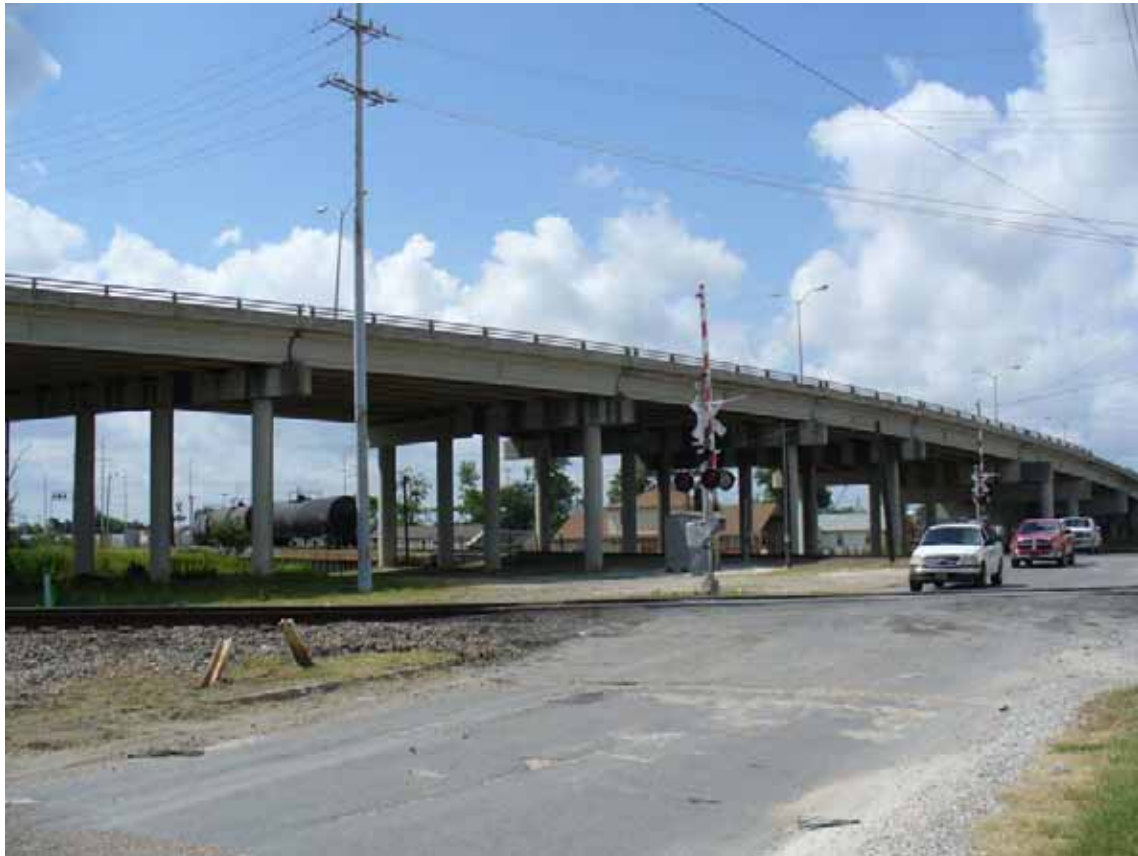
5. View of east area adjacent to the site, southeast area.