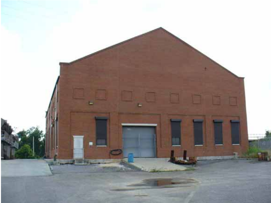
3. View of site as seen from the east direction. Observe leaking drums to right of picture.