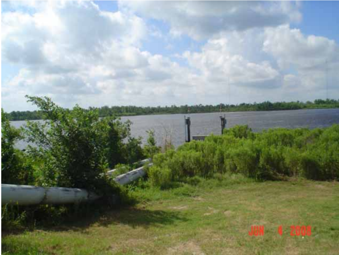
13. South view over levee