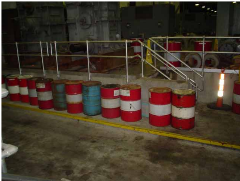
24. Example of 55 gallon drums inside building. Observe discoloration to concrete floor, some from transfer spillage.