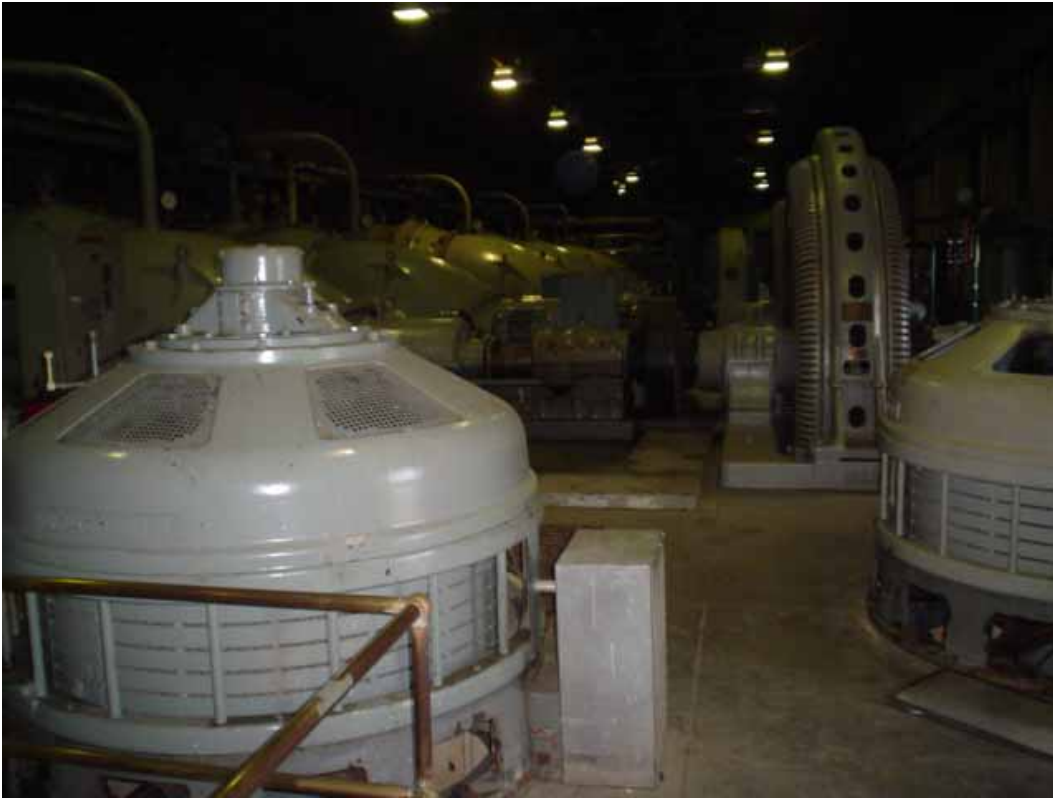
25. Pumps inside building.