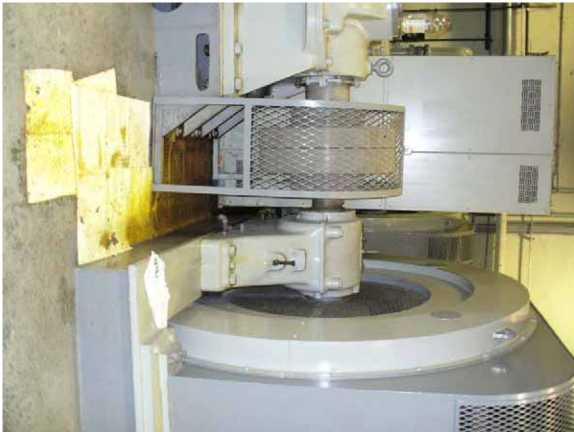
16. Oil leak from pump on floor. Observe oil pads used to soak up liquid.