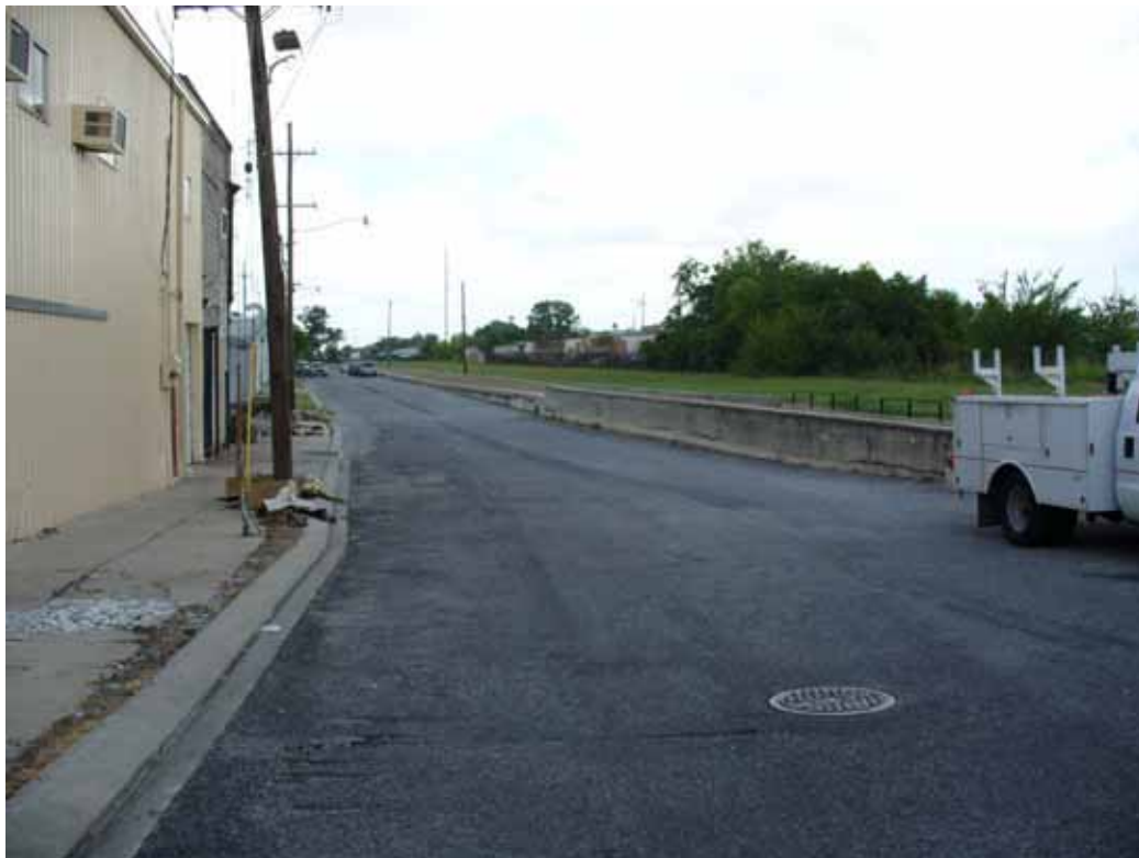
4. View of north area adjacent to the site, road next to canal, in northeast corner.