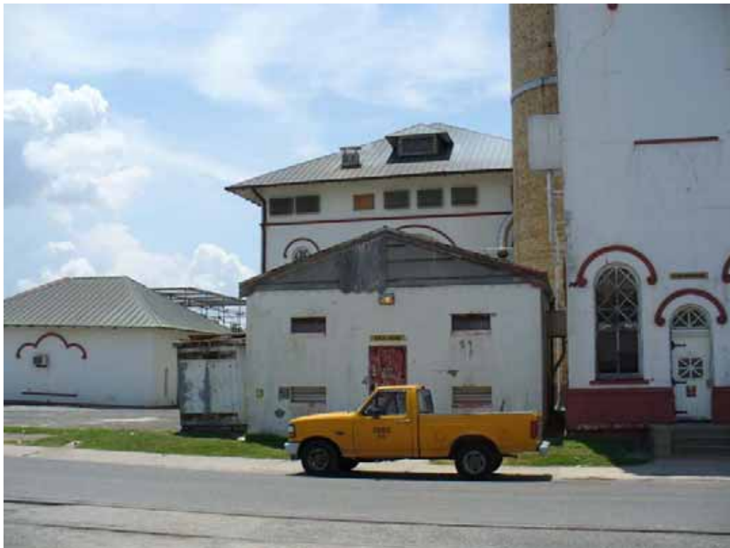
75. West side of 5 K. V. Building with breakers and switches located inside.