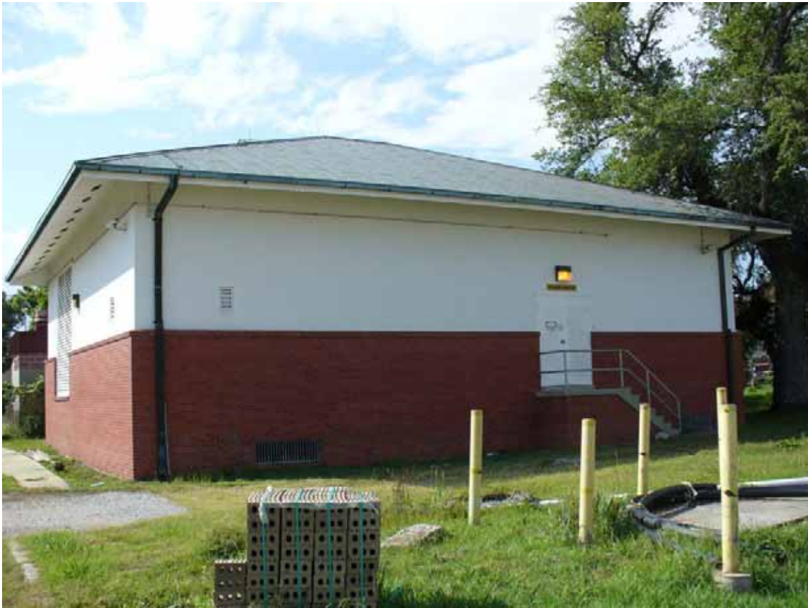
34. South side of Sycamore substation building.