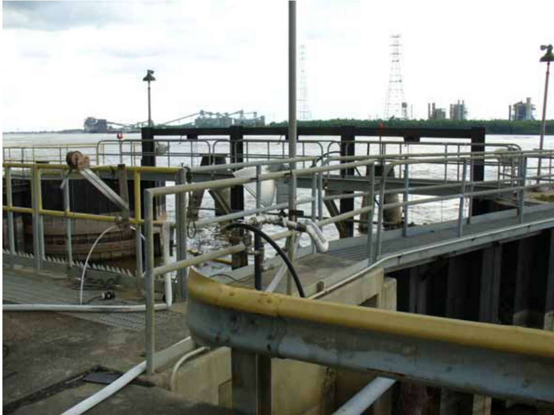
5. View of south area adjacent to the site.