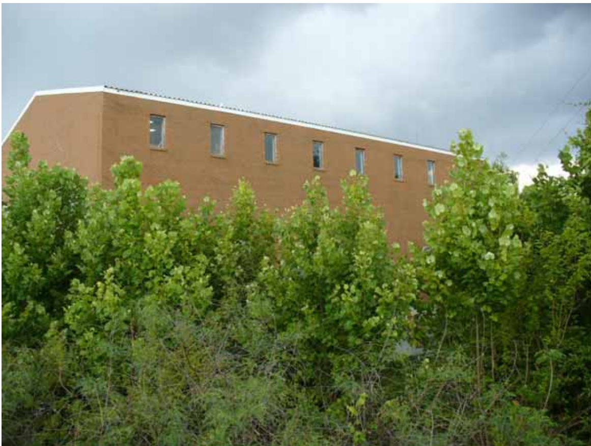
4. View of site as seen from the south direction.