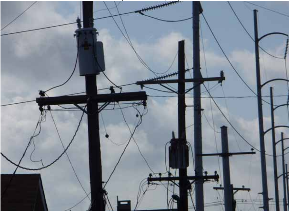
18. Transformers on street - south side of building