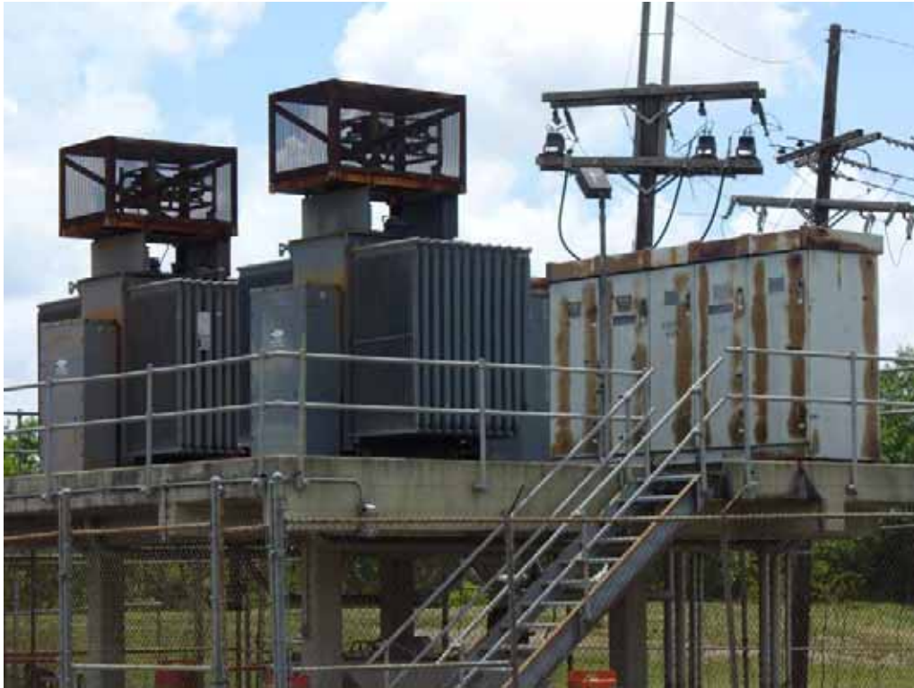
15. View of transformers and switchgear located southwest of site.