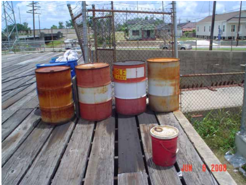
17. 55 gallon drums outside pump building on deck in southeast area.