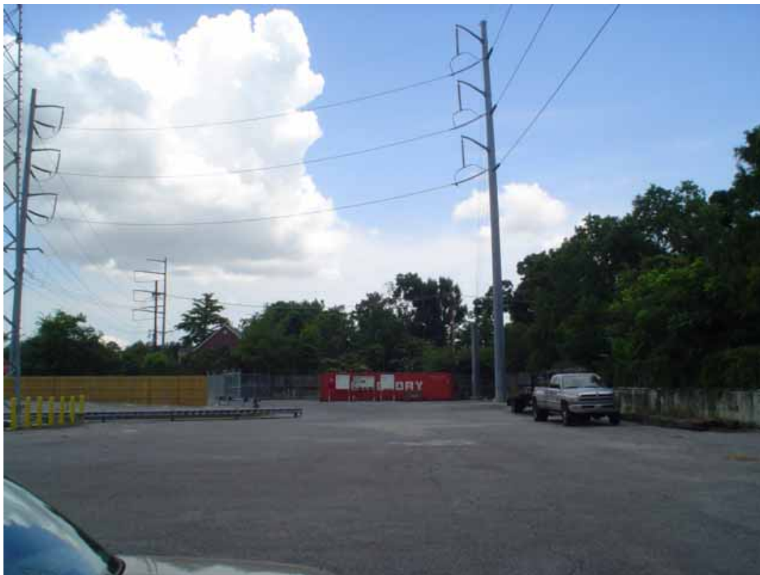
12. View of south area adjacent to the site, parking lot and residential area behind fence, southwest corner.