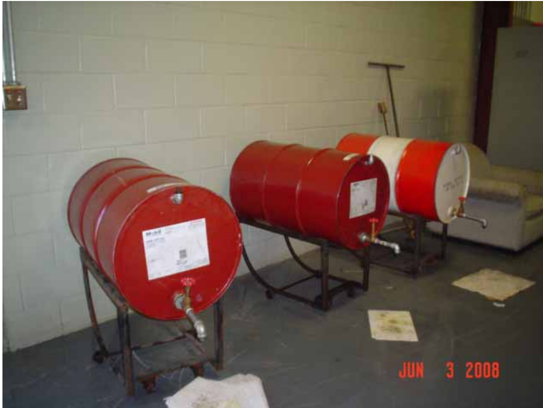
17. View of drums observed inside of building against west wall.