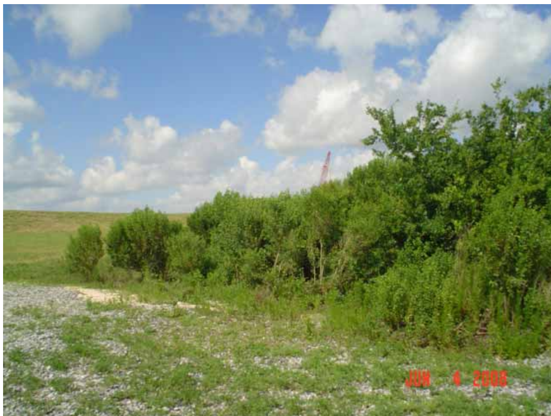
12. View of west area adjacent to the site, southwest corner.