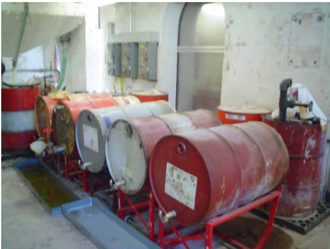
87. Oil drum storage in chemical house, observe standing liquid in spill tray, stains on concrete, open containers.