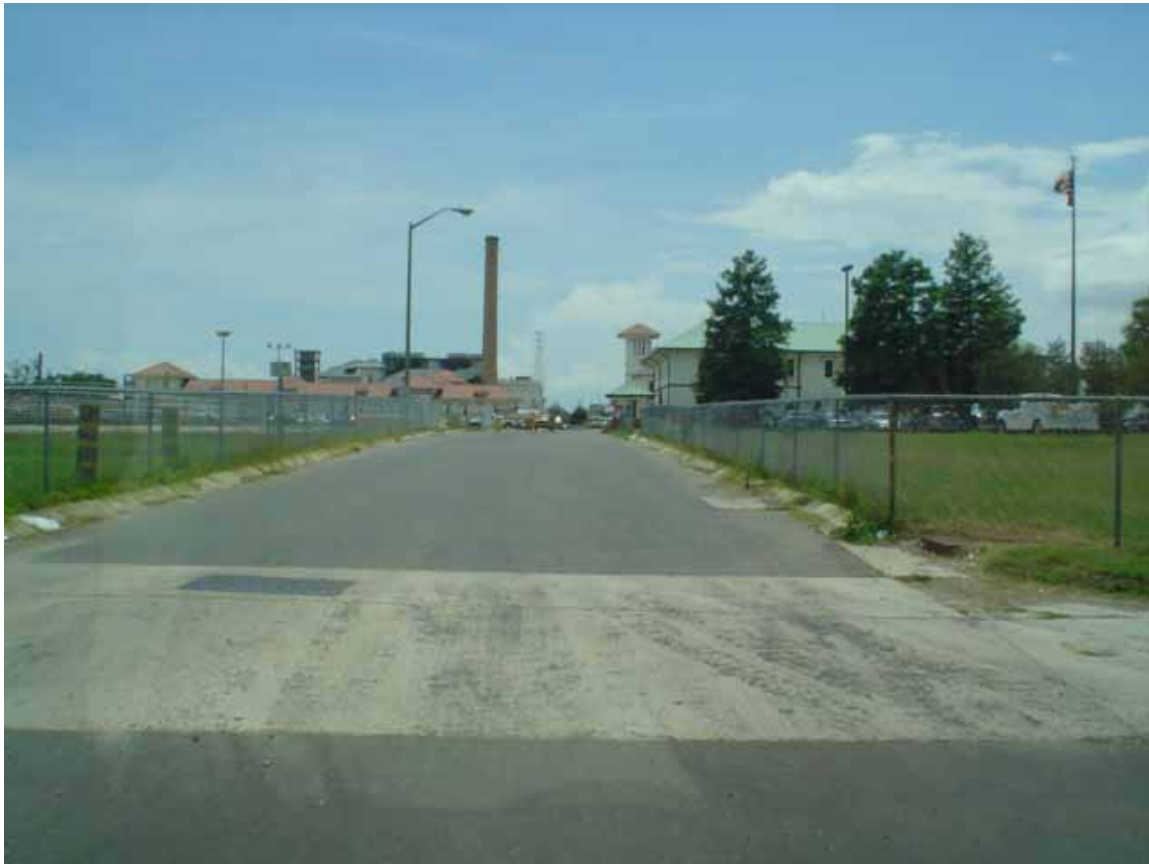
1. View of site as seen from the north direction, entrance on Eagle Street.