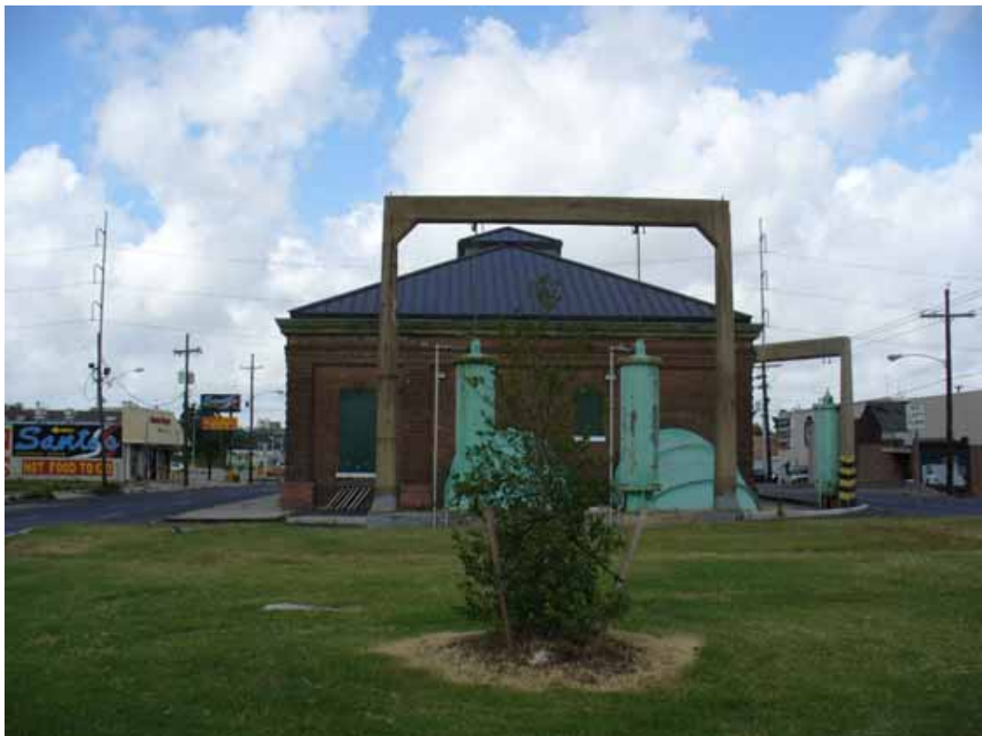
6. View of site as seen from the east direction.