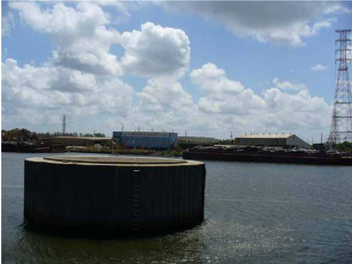
5. View of north area adjacent to the site in southeast area.