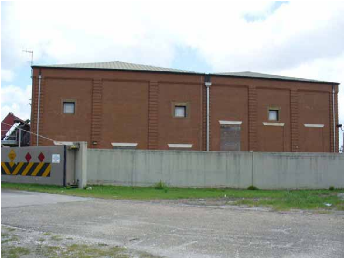
6. View of site as seen from the east direction.