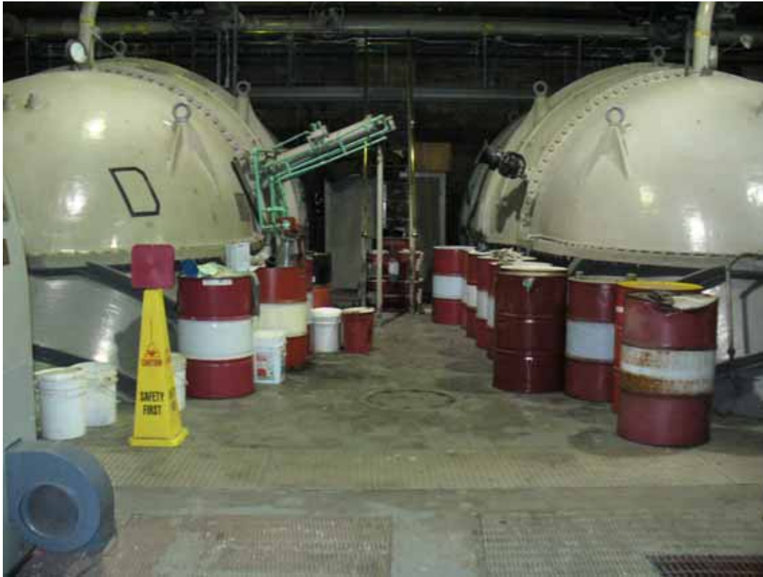
15. View of fifty gallon drums stored alongside pumps inside pump house.