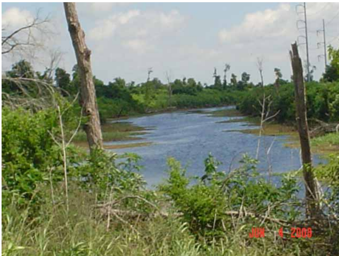
4. View of north area adjacent to the site, canal on other side of levee.