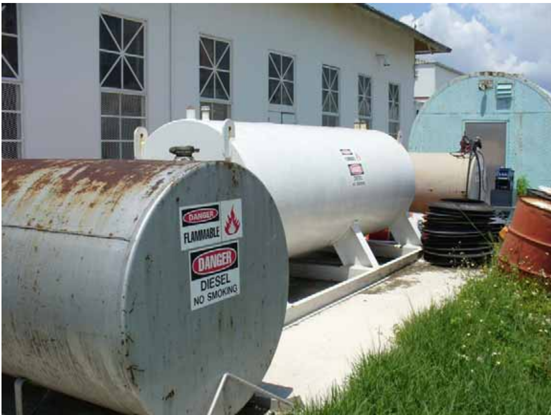
71. Above ground storage tanks located north of meter building.