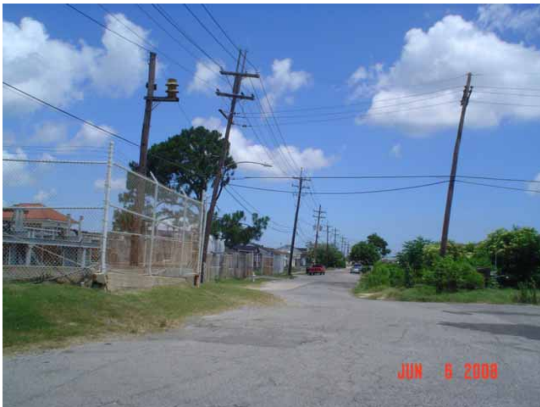
14. Transformers on Warrington Drive, north.