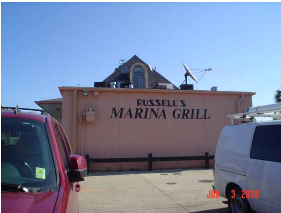
2. View of north area adjacent to the site, Russell's Marina Grill.