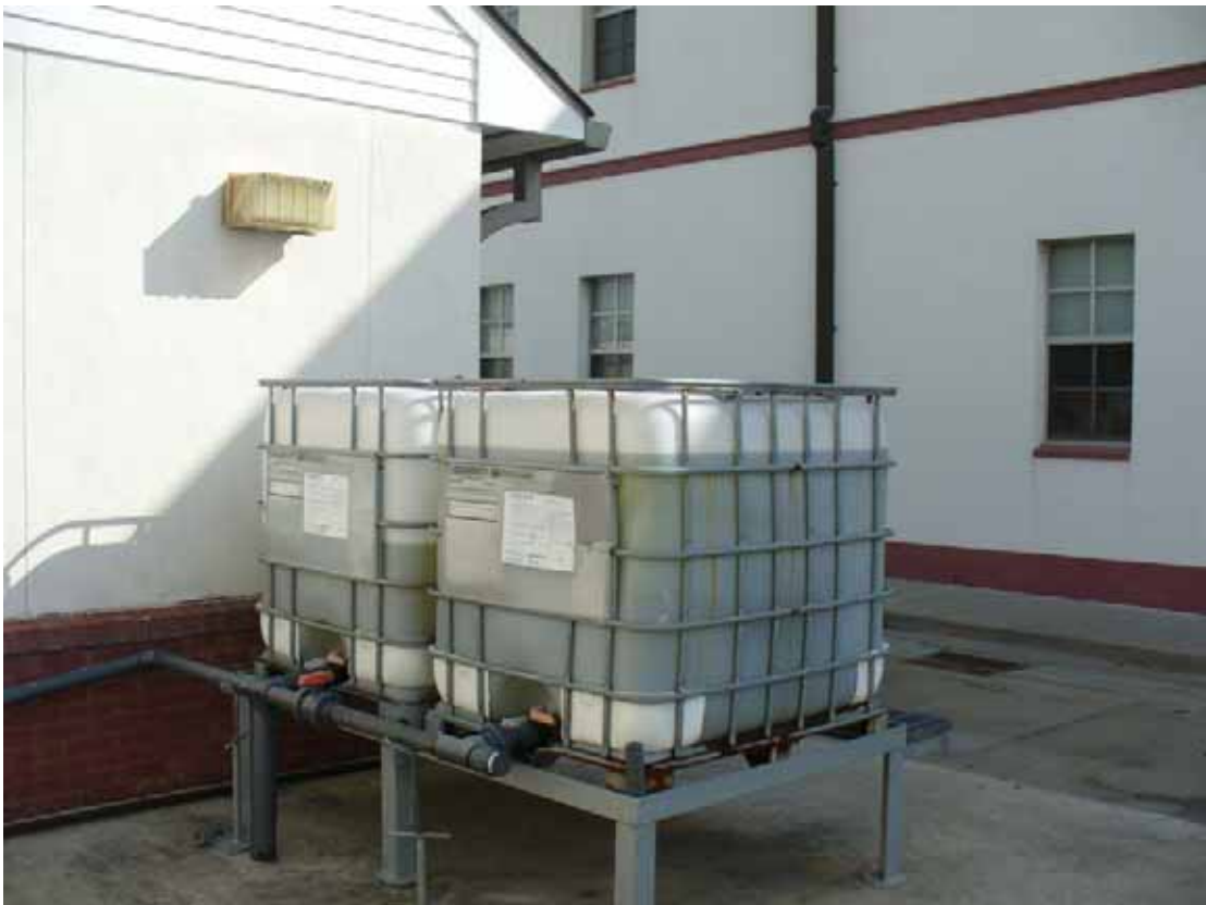
27. Clarifloc tanks next to ammonia tanks.