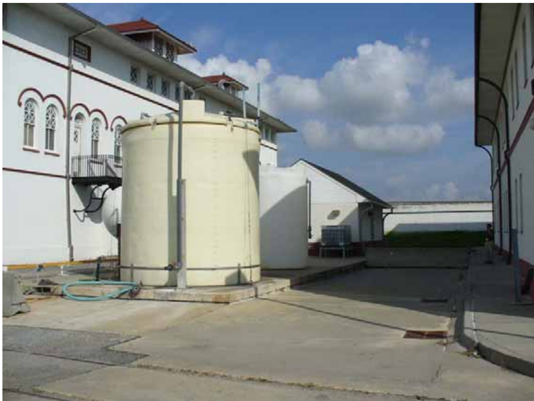
25. Ammonia tanks behind main building at entrance.