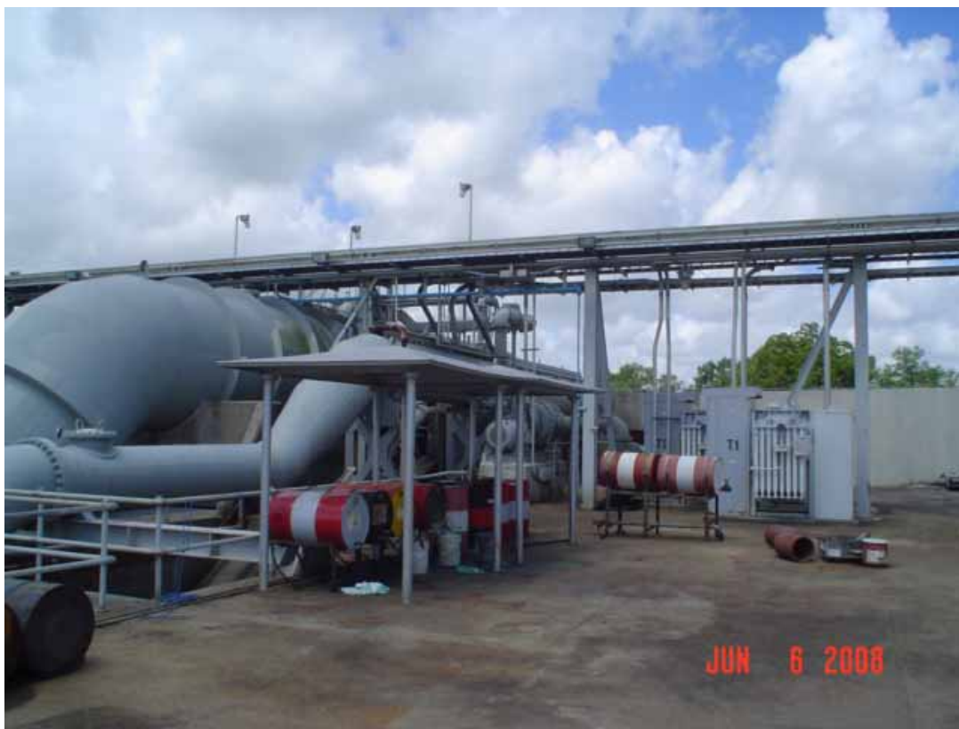
18. 55 gallon drums and pipeline on property, transformers in rear.