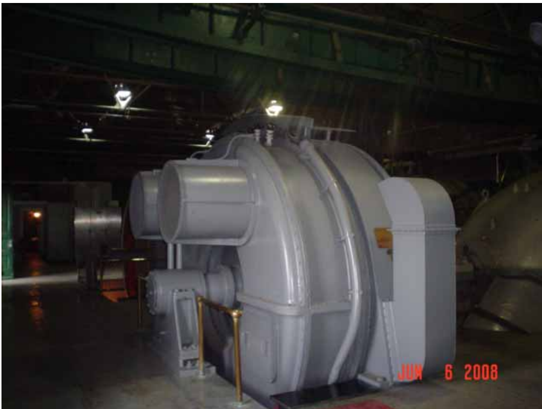
22. View of fully enclosed pump.