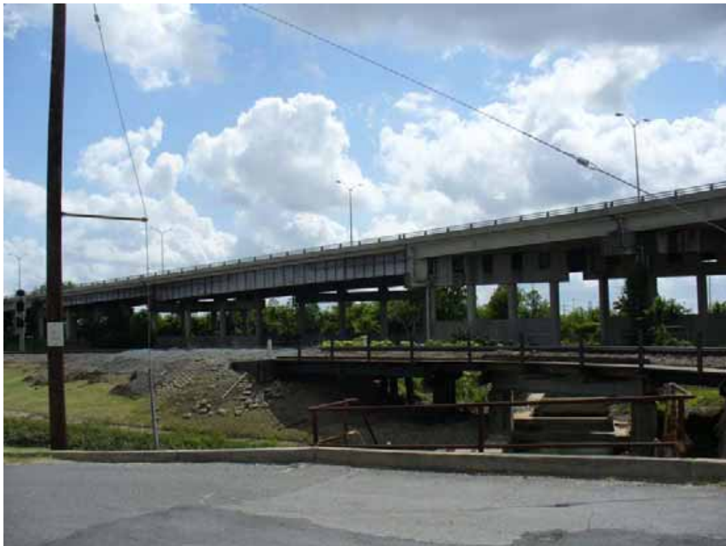
4. View of east area adjacent to the site, northeast area.