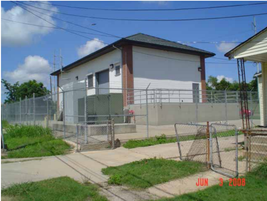
1. View of site as seen from the north direction.