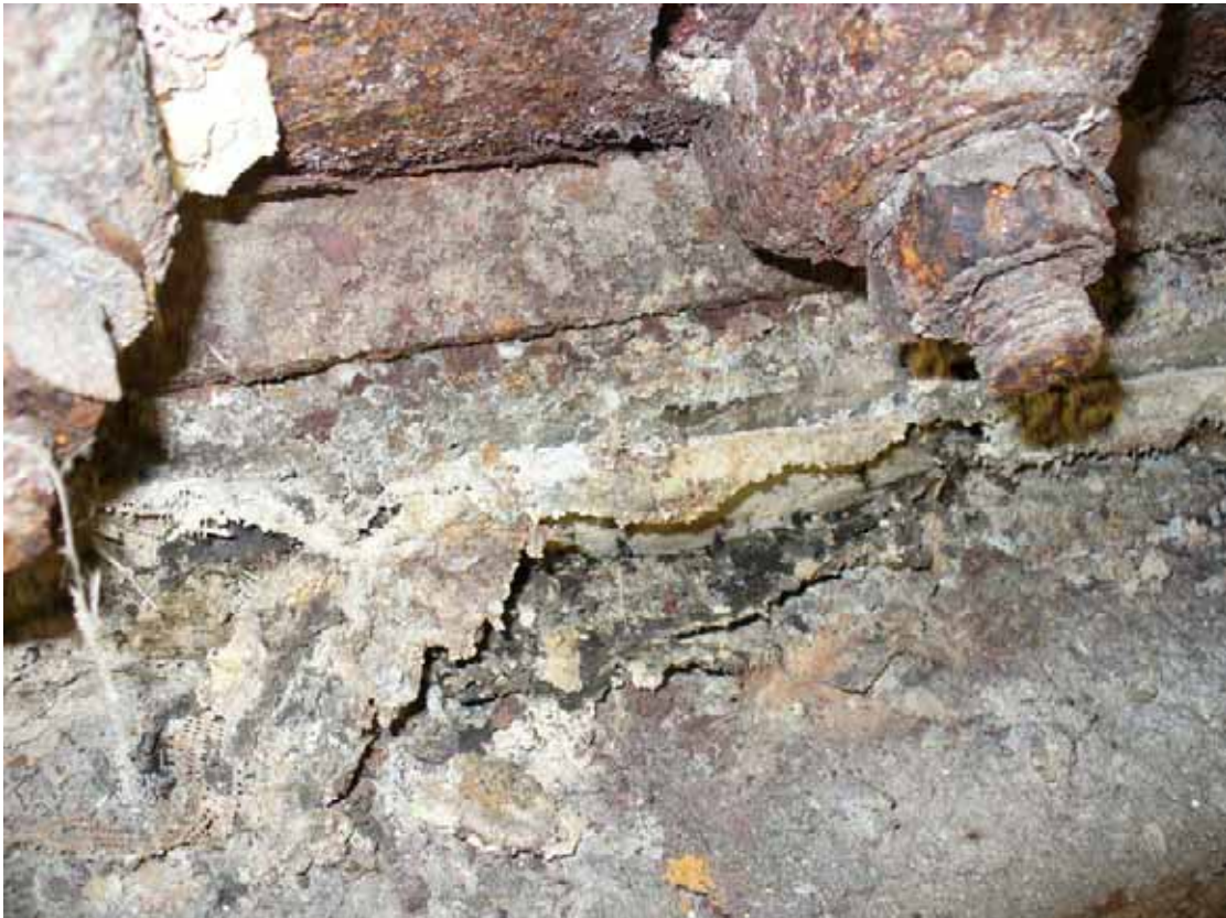
63. Boiler insulation that may contain asbestos.