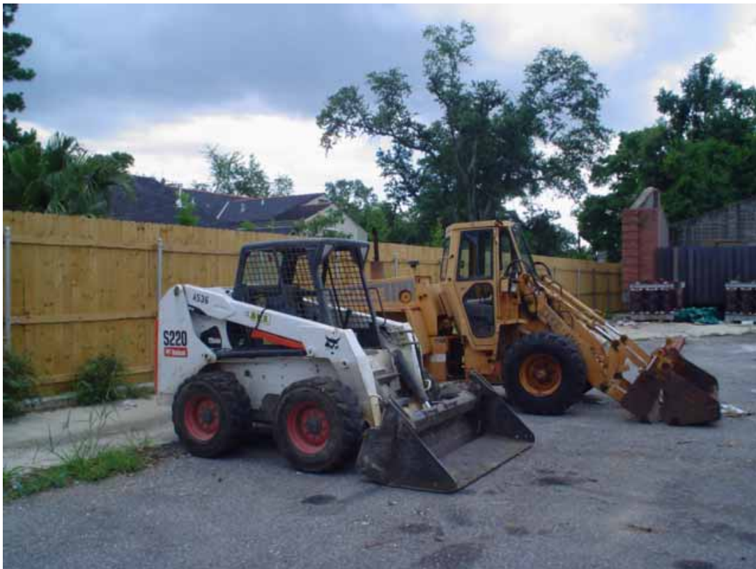
8. View of east area adjacent to the site, residential area over fence, southeast corner.