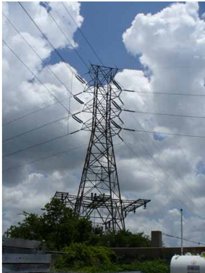
14. Tower, northwest corner.