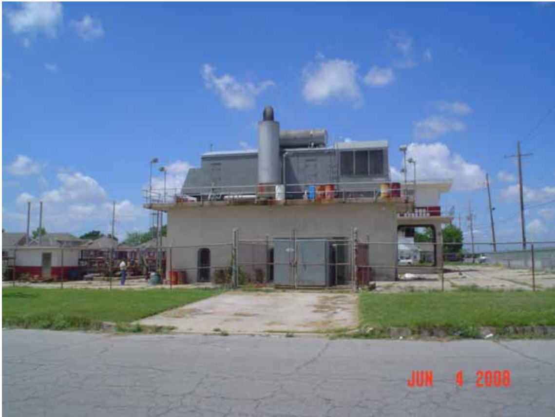
3. View of site as seen from the east direction. Observe 55 gallon drums in southeast area and on roof.