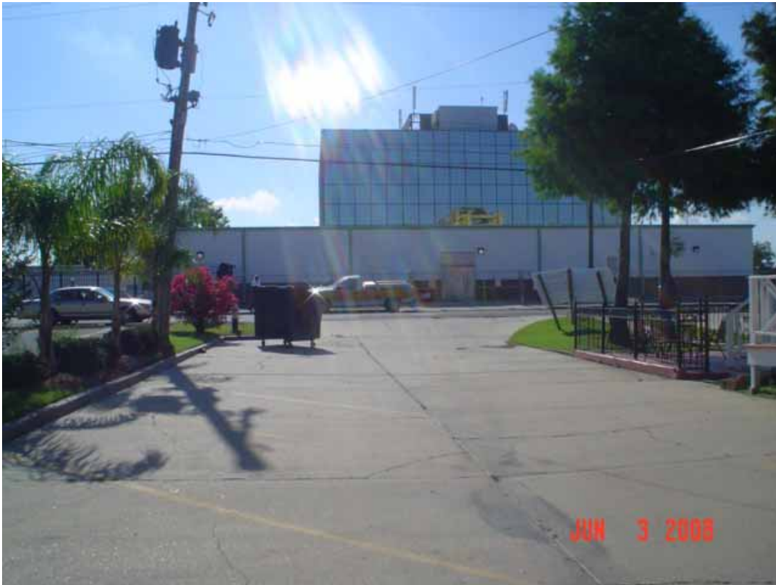
9. View of site as seen from the west direction. Observe transformer on pole west of Pontchartrain Boulevard.