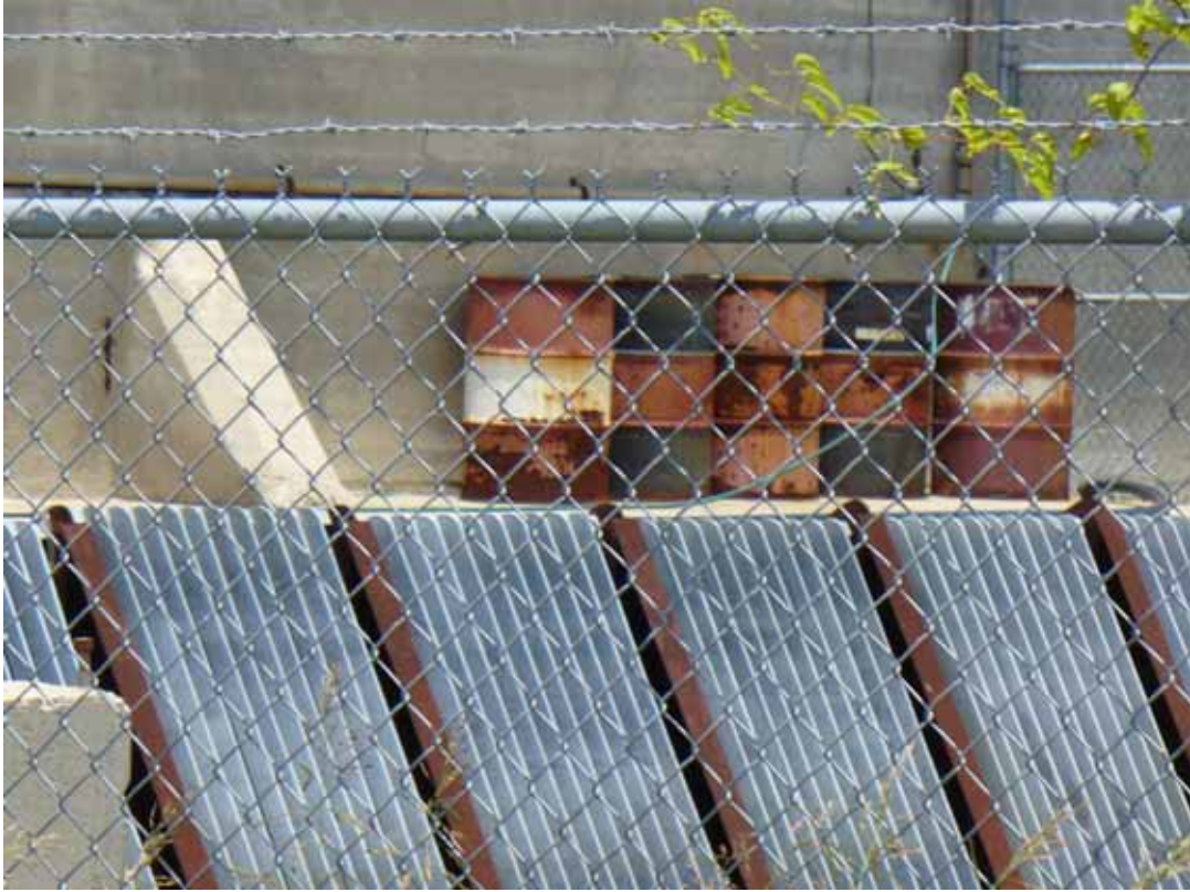
13. 55 gallon drums next to screens, east side of building.