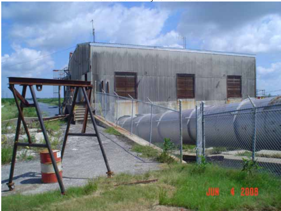
6. View of site as seen from the south direction.