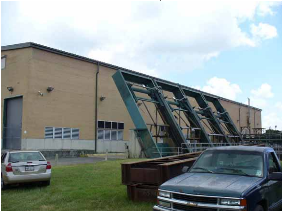
8. View of site as seen from the west direction.