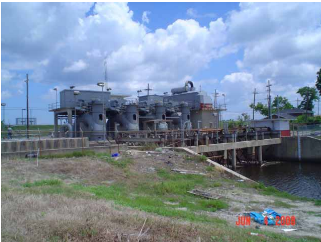
6. View of site as seen from the south direction.