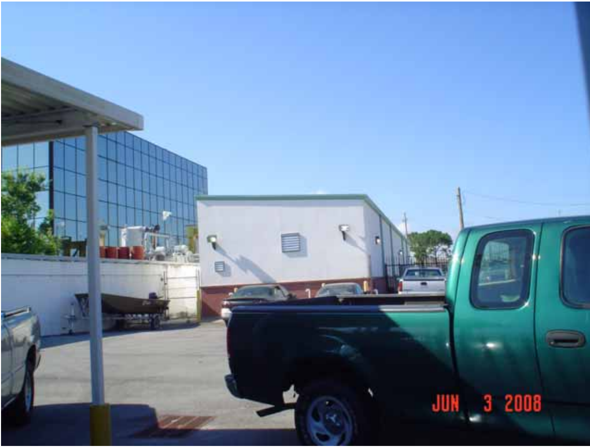
1. View of site as seen from the north direction.