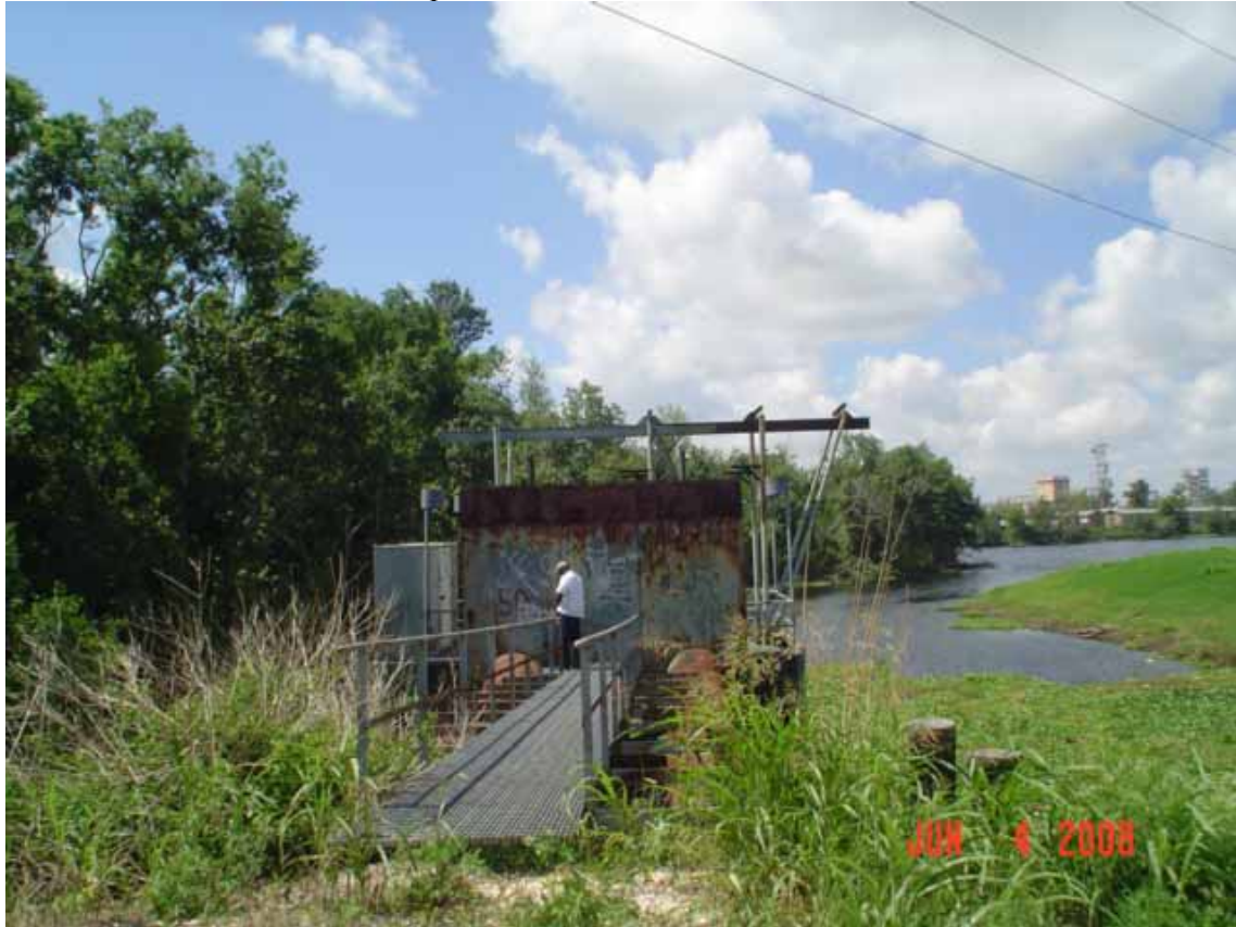
1. View of site as seen from the north direction.

**No photos from east side – inaccessible.