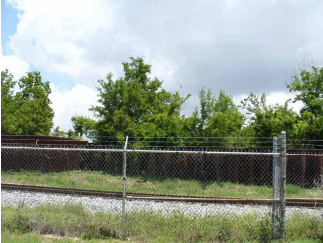
3. View of north area adjacent to the site, railroad tracks