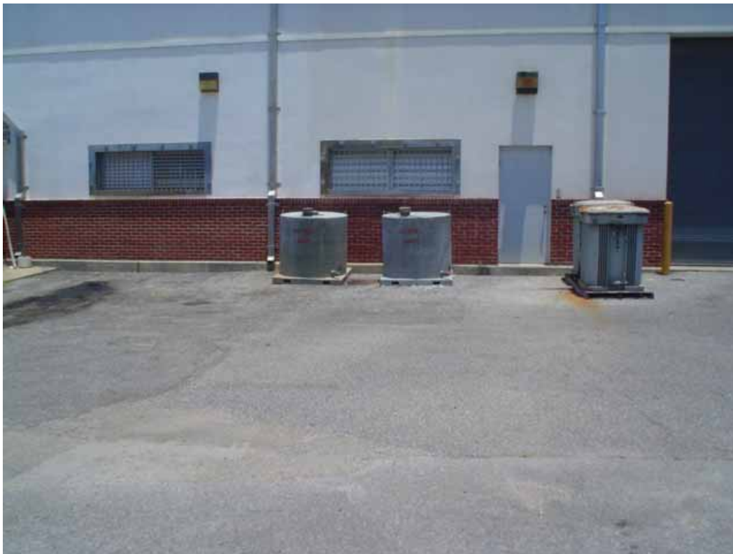
99. Waste storage tanks and transformer south of Spruce Street warehouse.