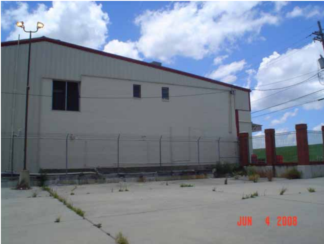
9. View of west area adjacent to the site, northwest corner.