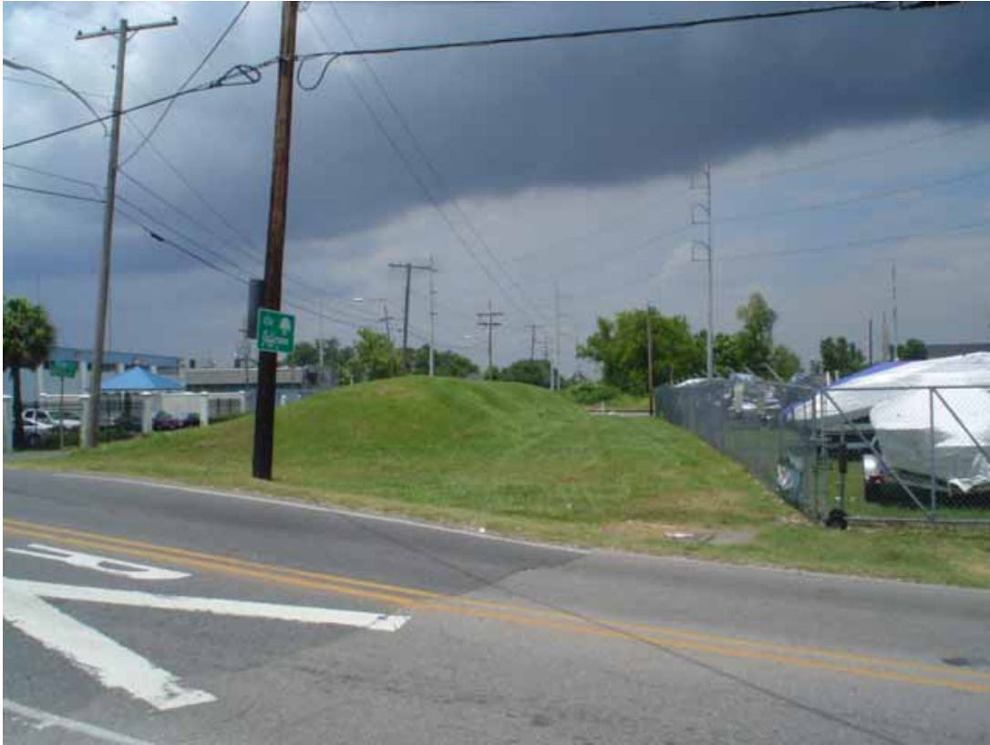
3. View of north area adjacent to the site, boat yard, shopping area and levee.