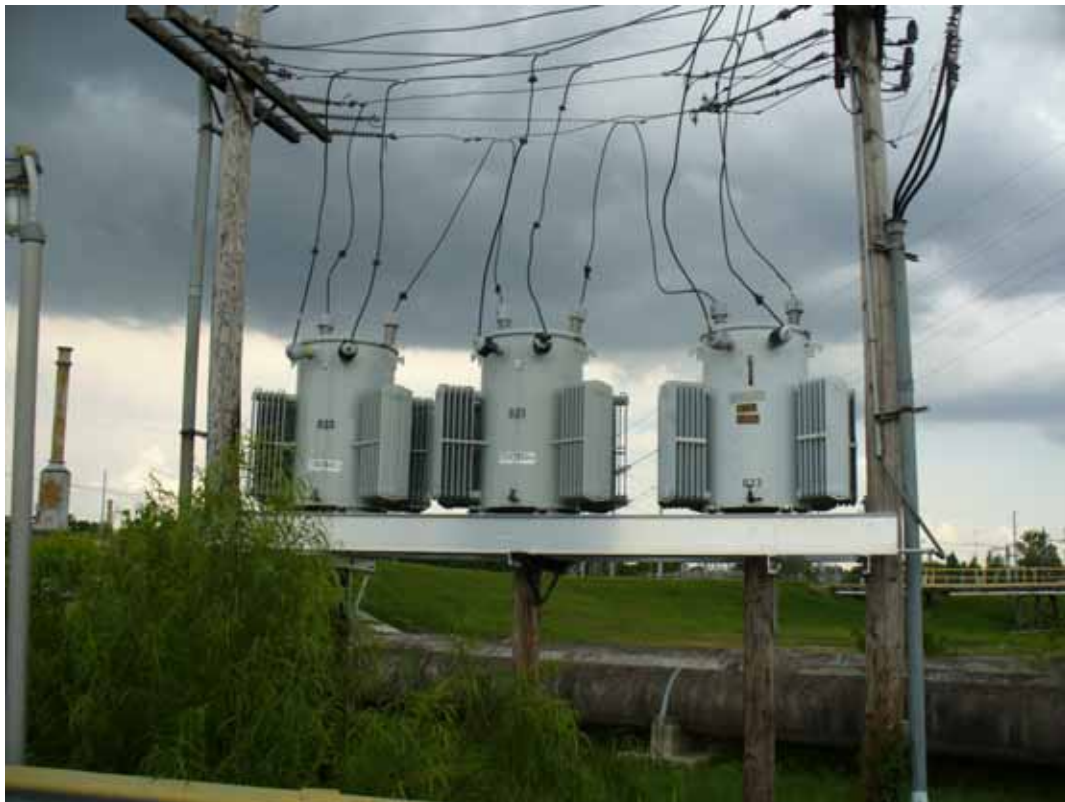
14. Transformers on access road.