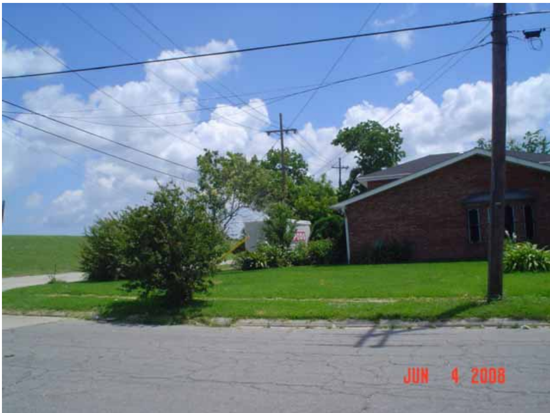
4. View of east area adjacent to the site, north east corner.