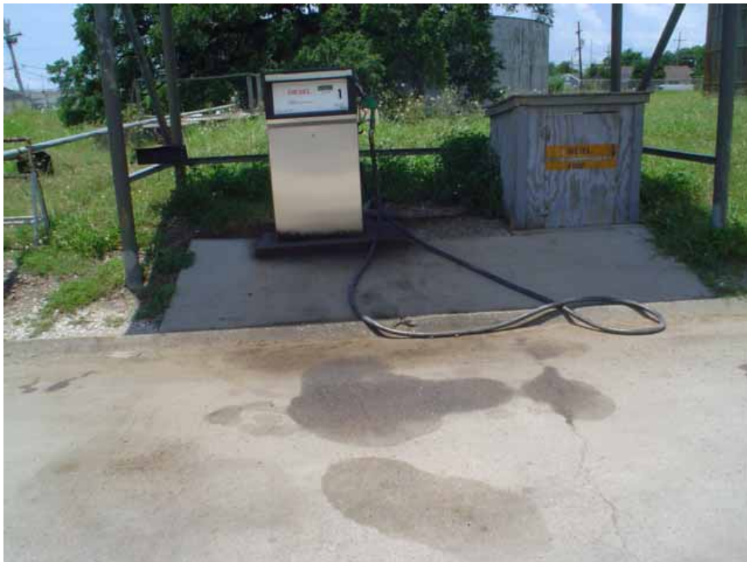
95. Diesel pump observe stains on concrete and surrounding dirt.