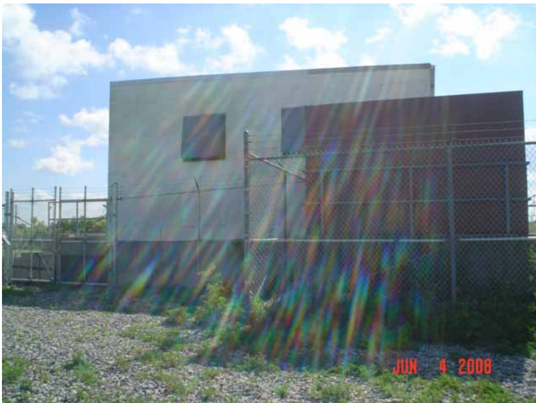
10. View of site as seen from the west direction.