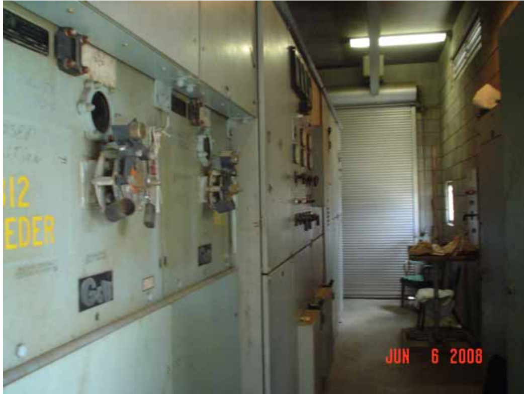
23. View of breakers.