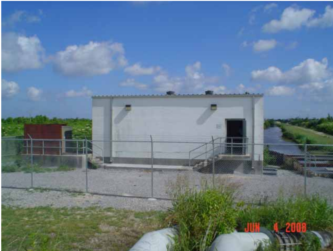
7. View of site as seen from the south direction.