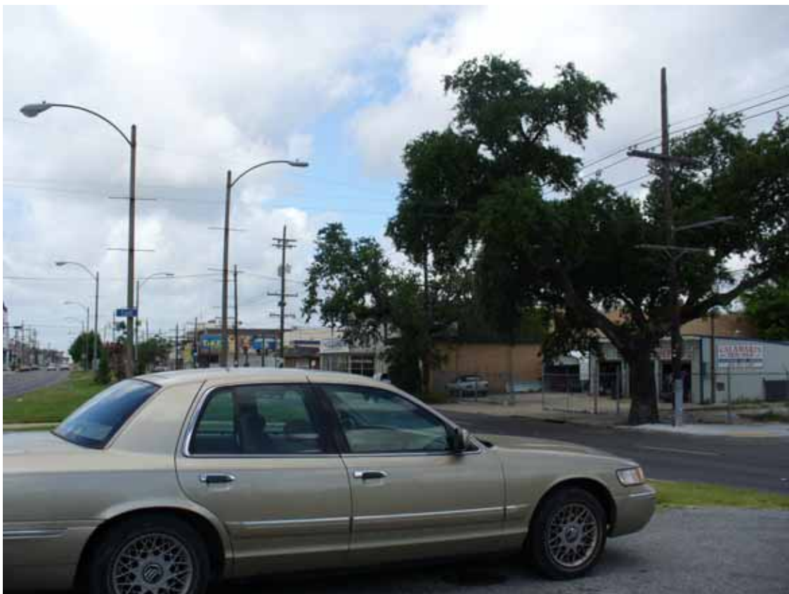
14. View of west area adjacent to the site, with Calamari's Trim Shop and abandoned City's Cleaner's, in northwest area.