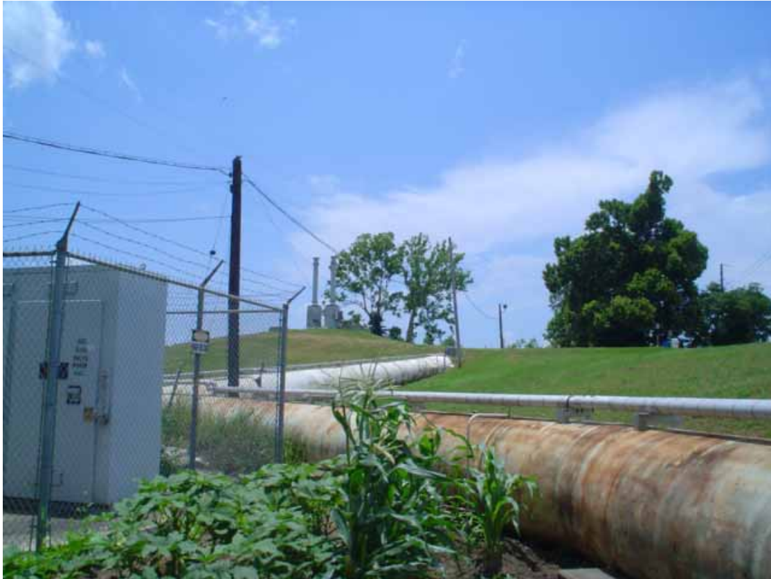
9. View of south area adjacent to the site, showing pipeline and stacks.