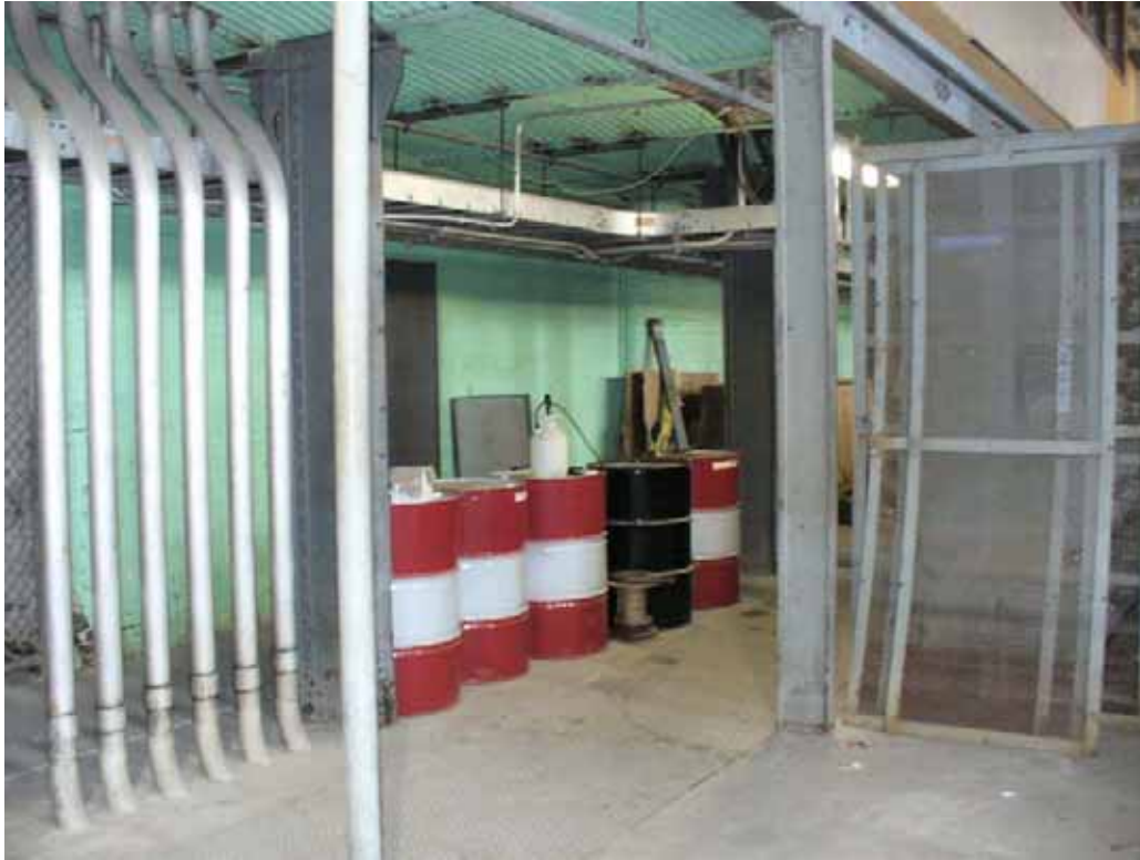
19. Drums and resistors located inside building.