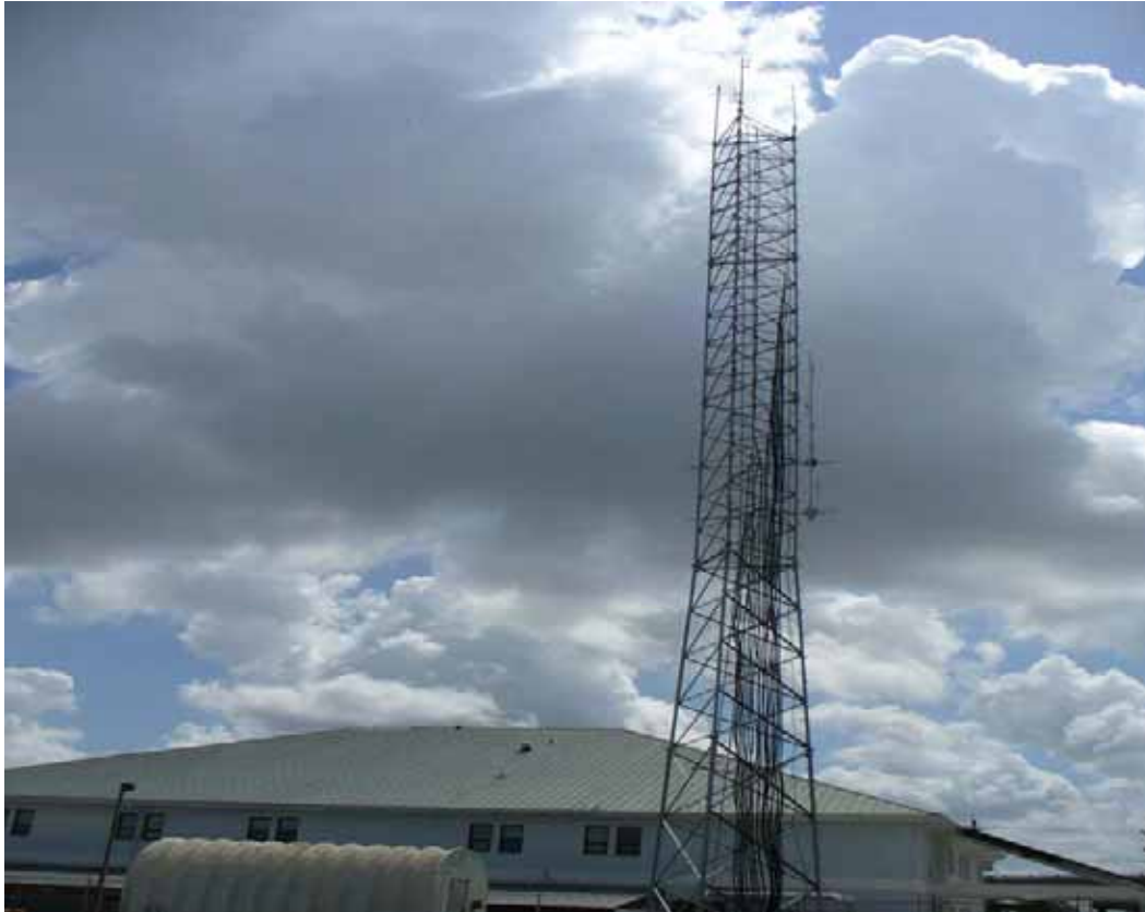
15. Radio tower located on north side.