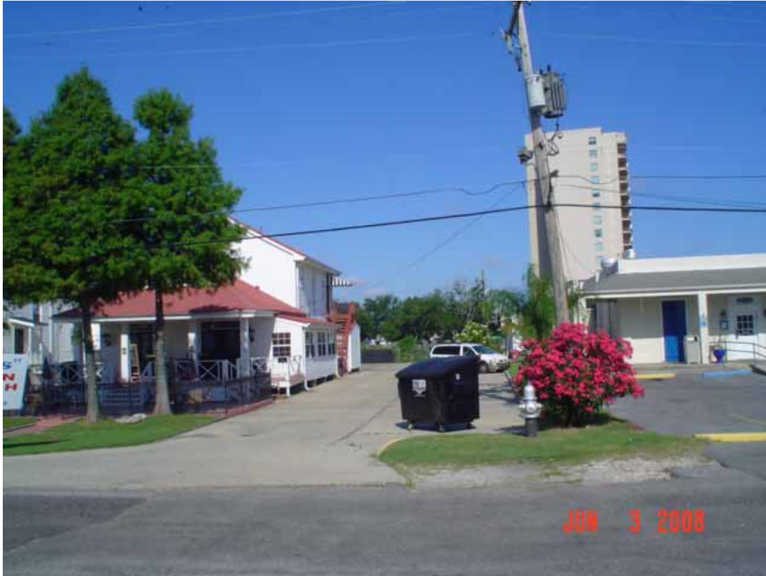
11. View of west area adjacent to the site, two restaurants. Observe transformers on pole west of Pontchartrain Boulevard.