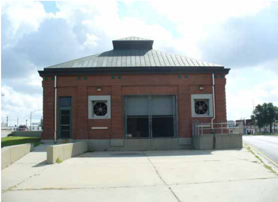
12. View of site as seen from the west direction.