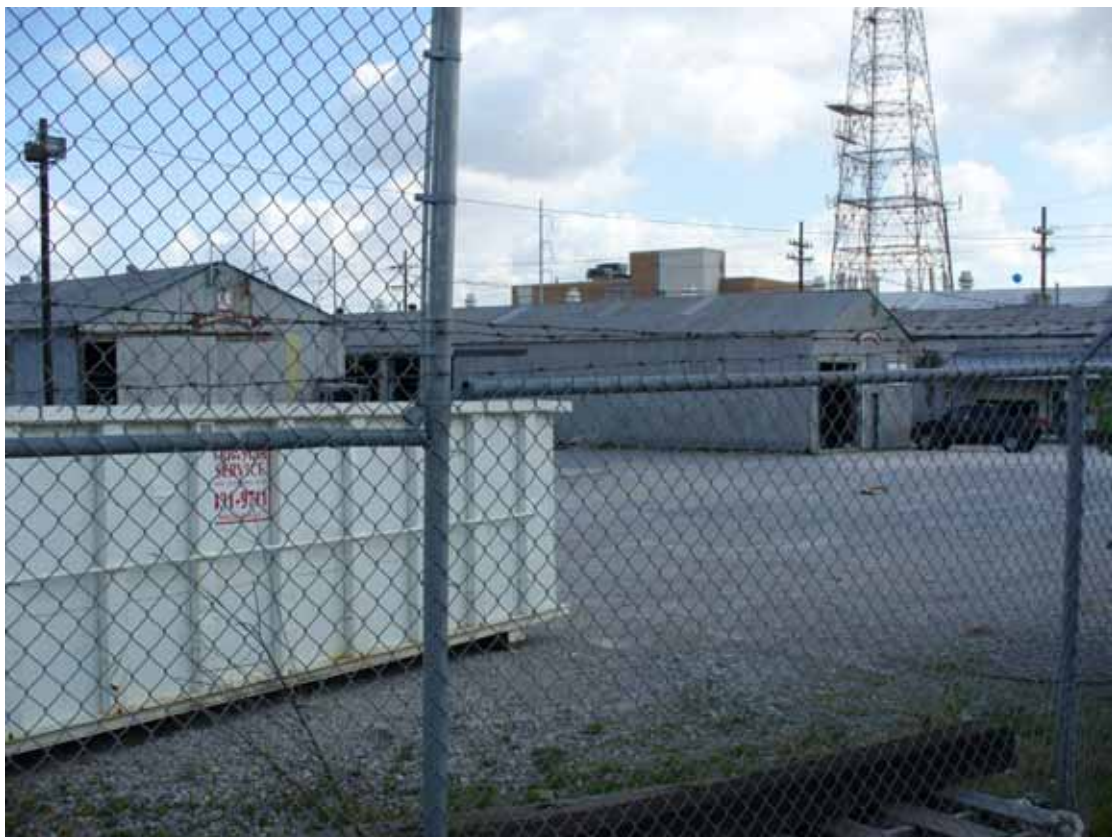
2. View of north area adjacent to the site, showing Overhead Door property.