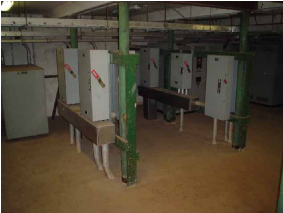
27. Electrical panels in the basement.