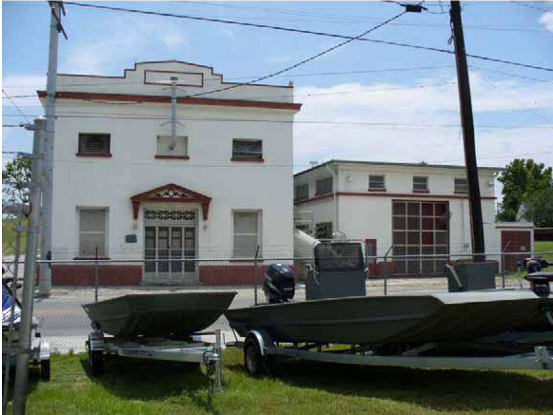
1. View of site as seen from the north direction, left side.