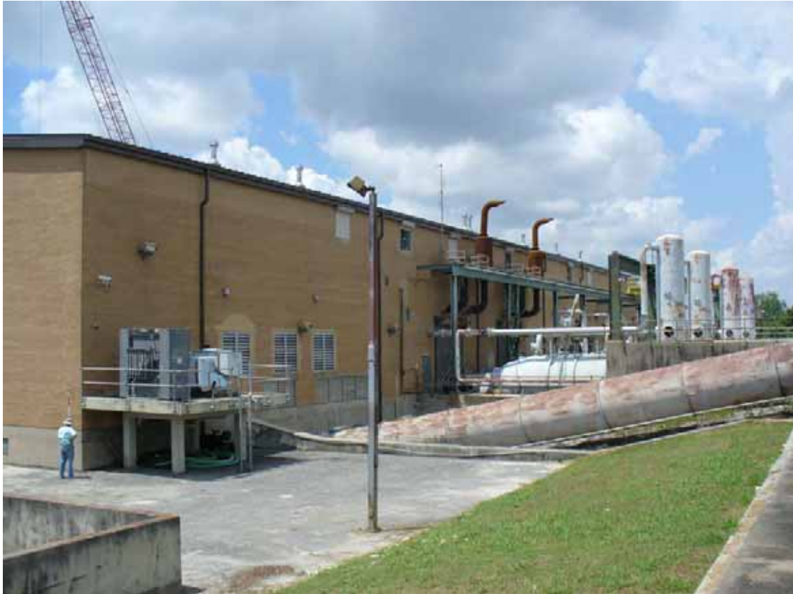
1. View of site as seen from the east direction. Observe two transformers at southeast corner of building.