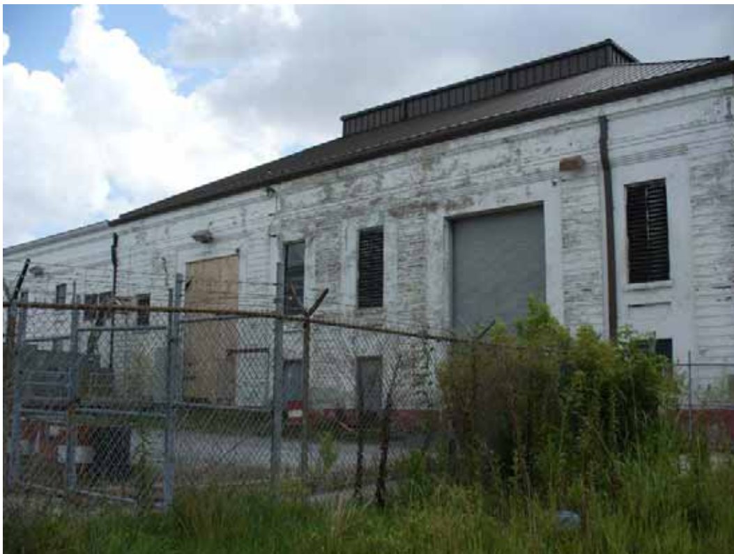
10. View of site as seen from the west direction.