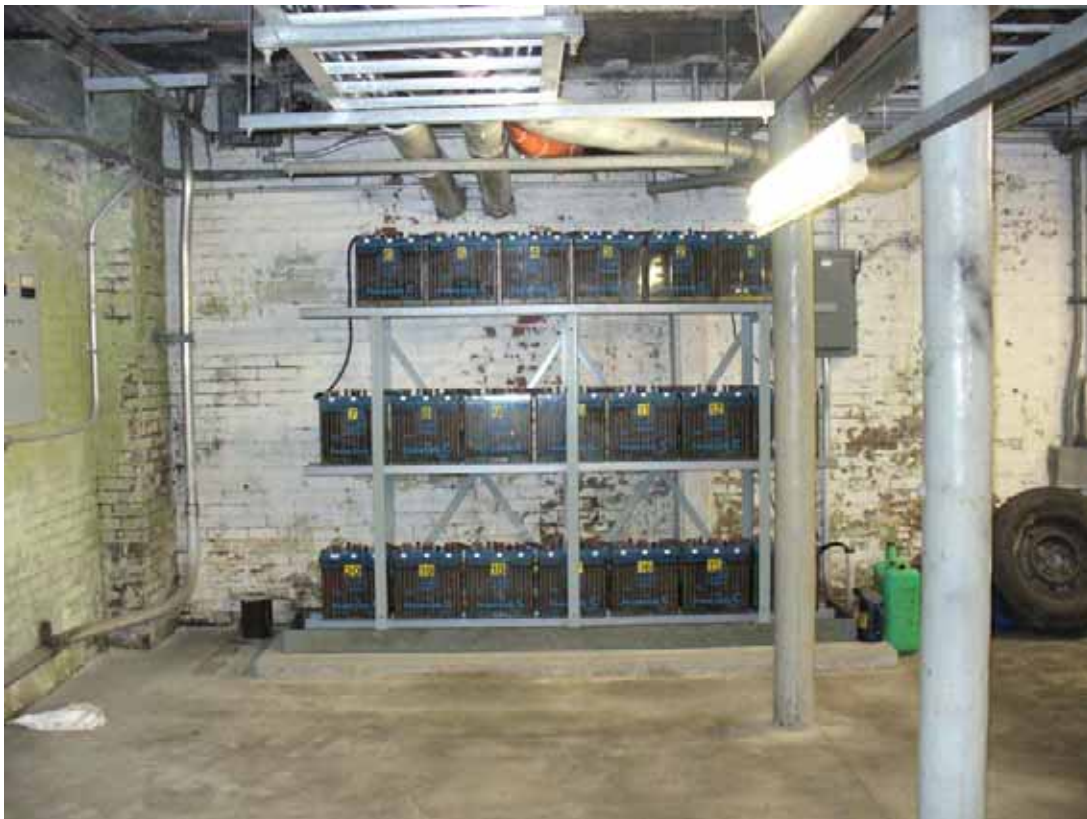
20. Battery bank located against north wall.