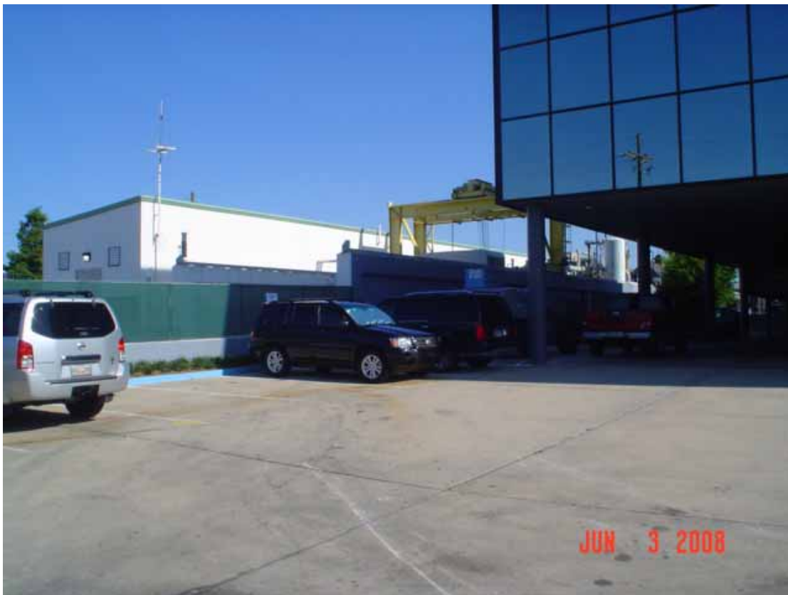
4. View of site as seen from the east direction, showing bank next door.