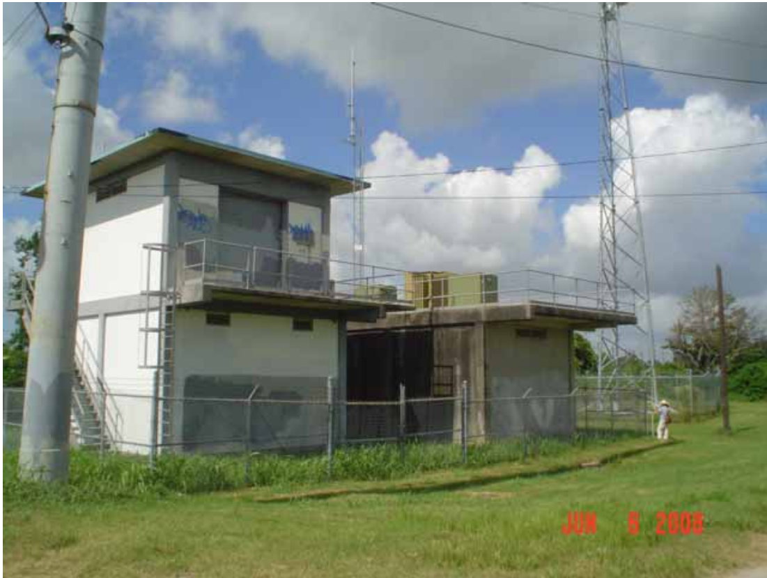
13. View of west area adjacent to the site, annex building and transfer building.