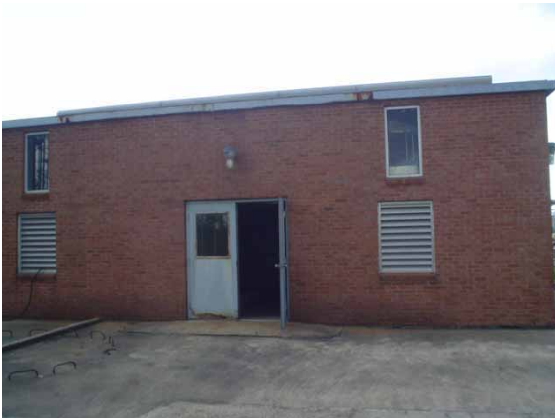
12. Additional building on access road.