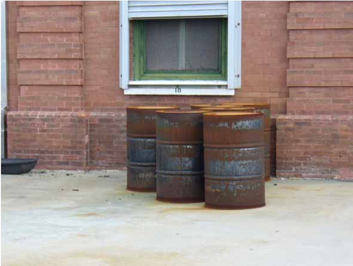
19. Miscellaneous drums out side pump house on property.