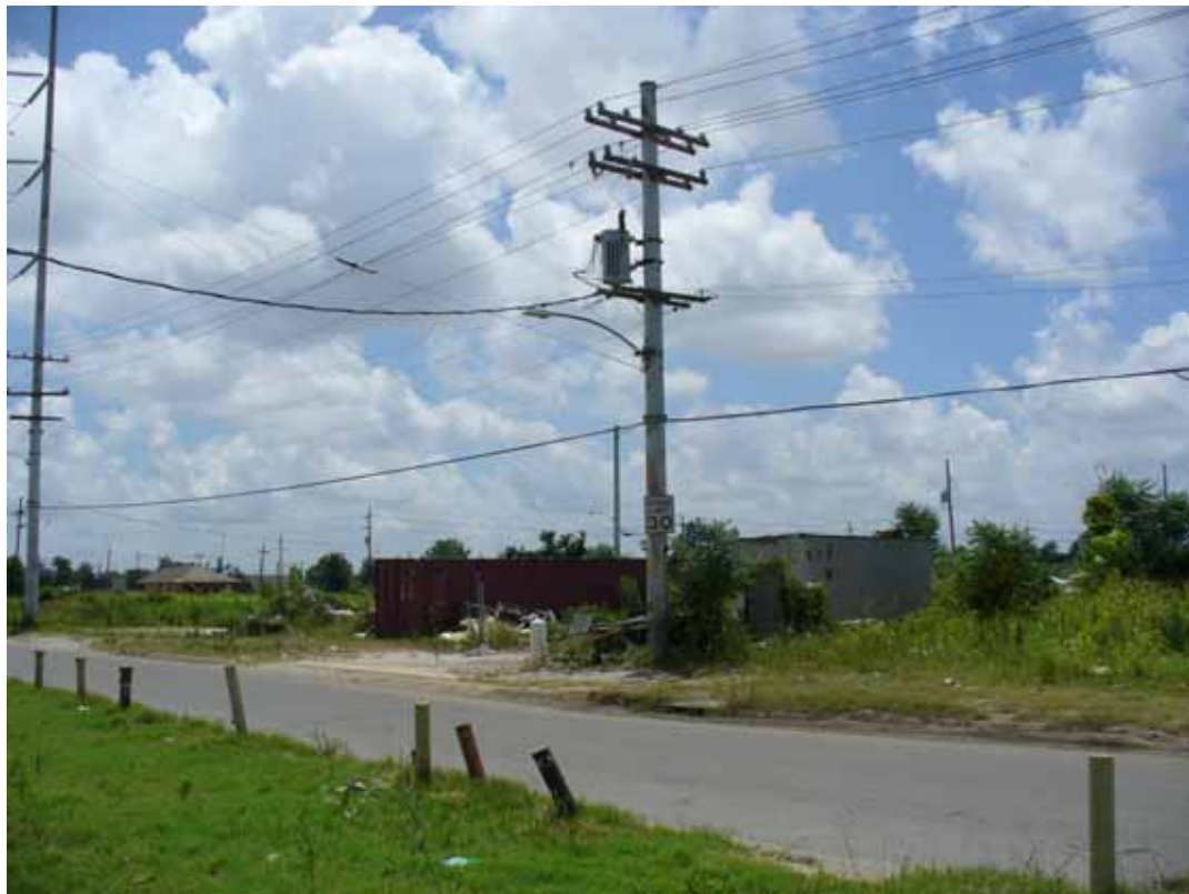
8. View of south area adjacent to the site including transformer, southeast corner.