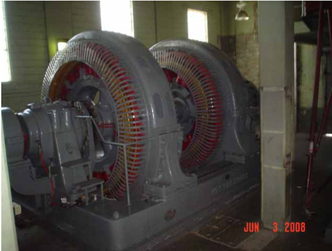
17. Frequency changer.