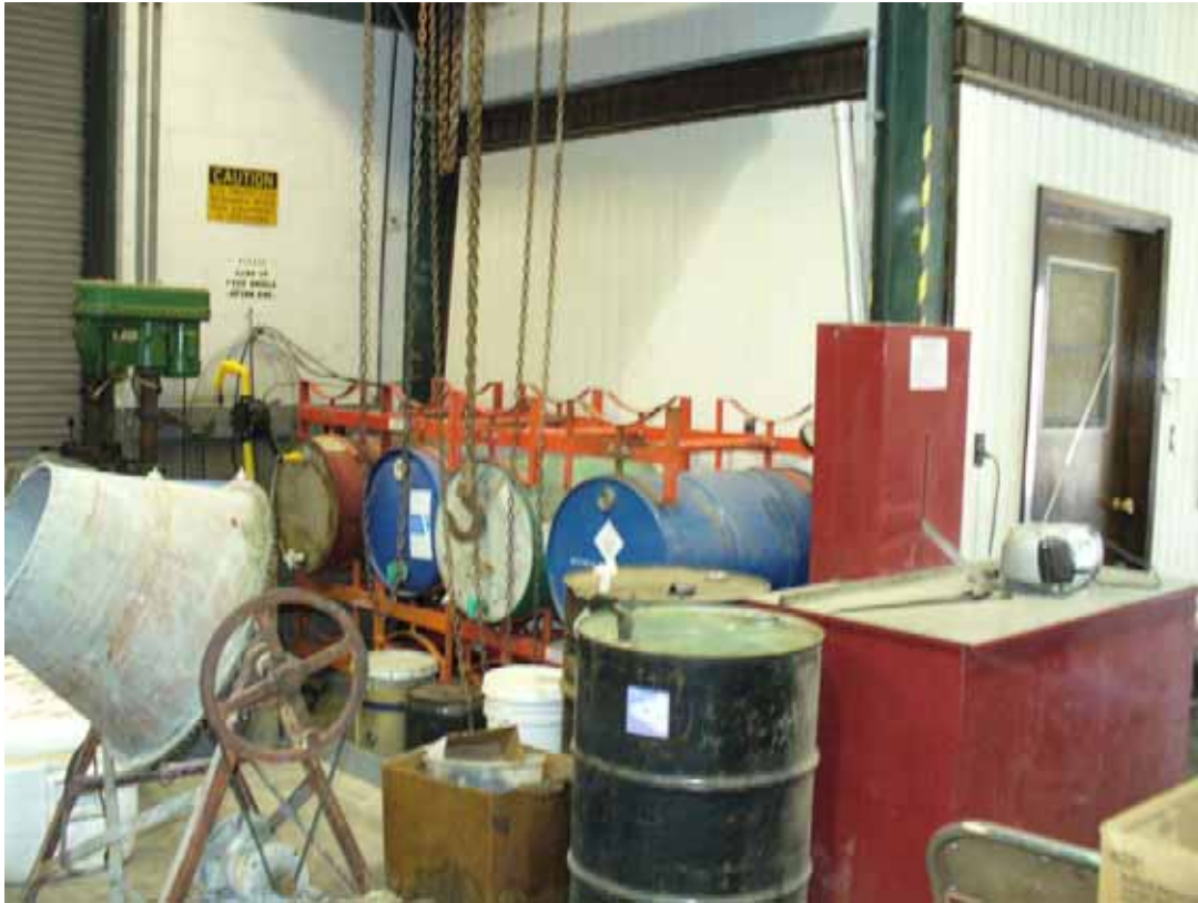
82. 55 gallon drums inside electrical shop.