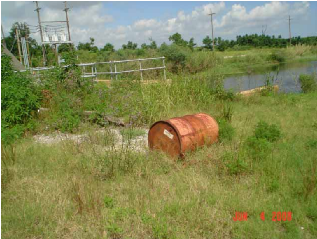
13. View of empty, abandoned 55 gallon drum located north of site.