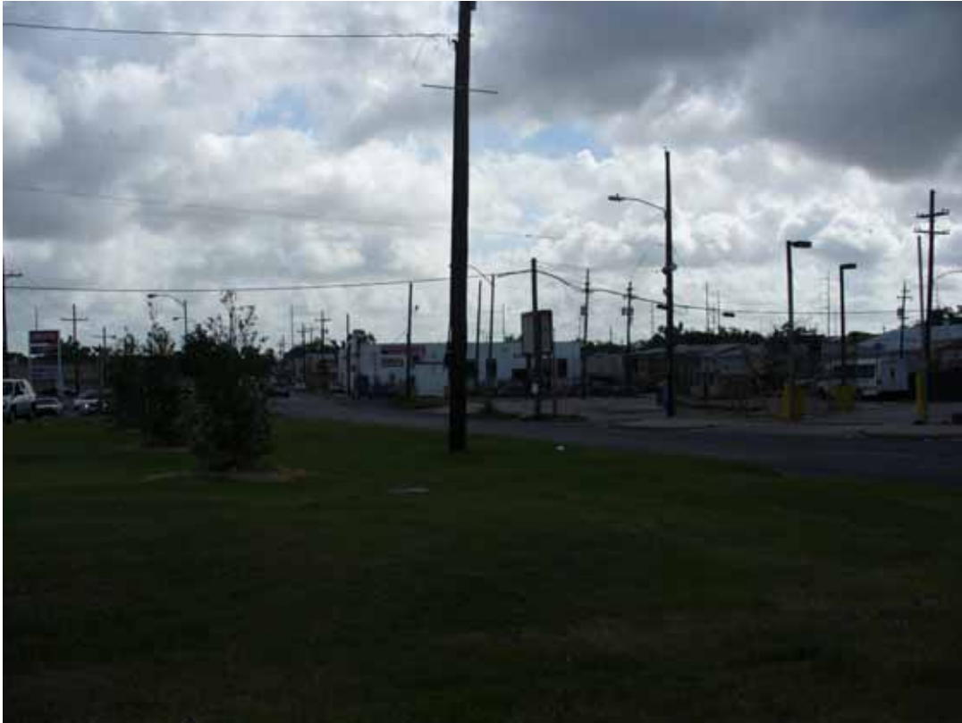
7. View of east area adjacent to the site, in southeast side of North Broad, with fueling station in background.