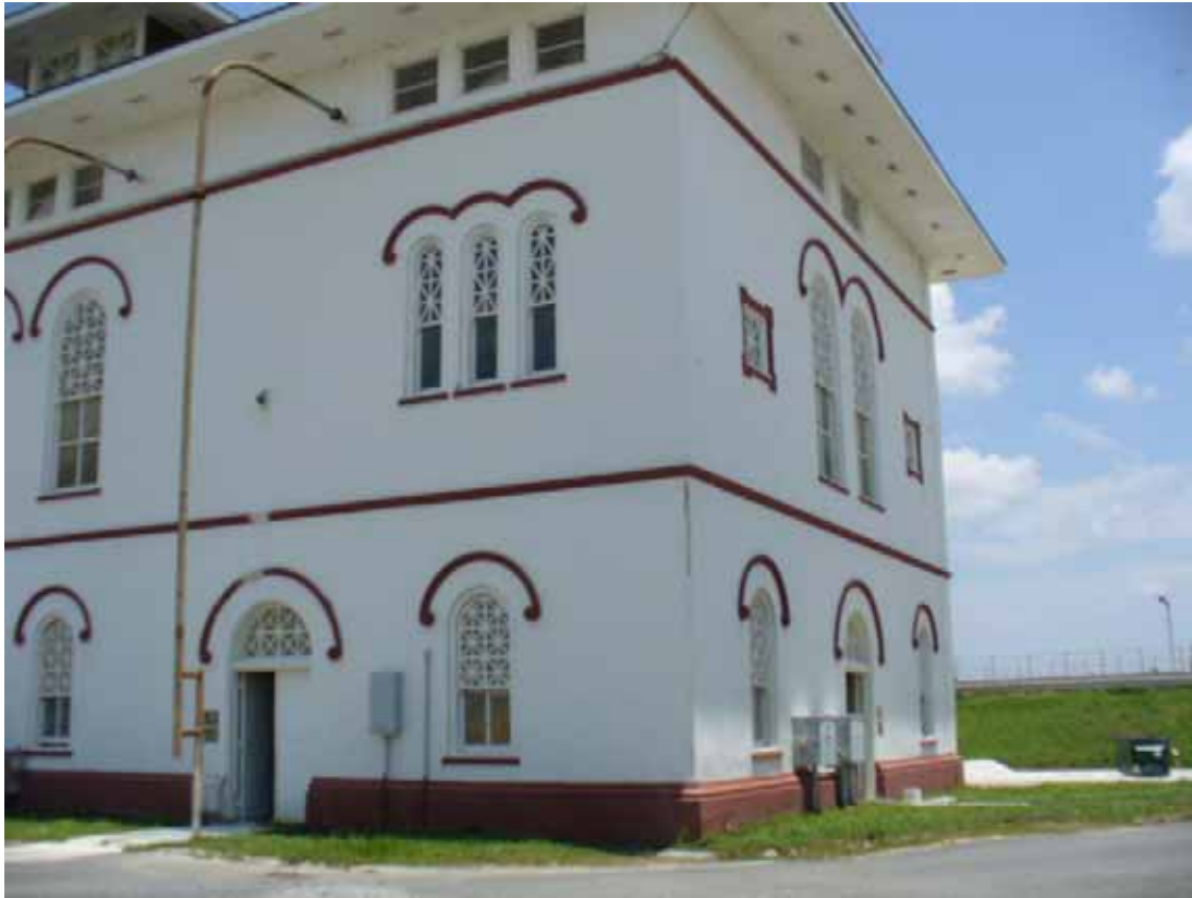
84. Southeast corner of chemical house.