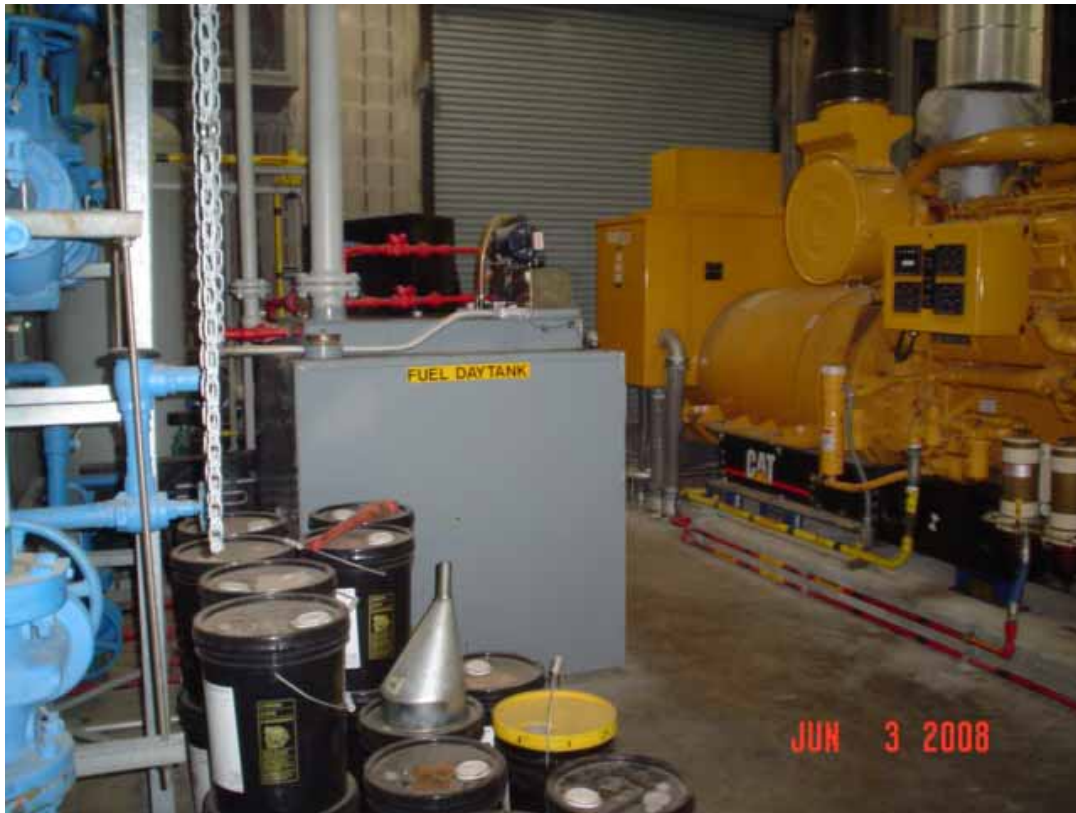
13. Diesel engine, lubricants and fuel tank inside building.