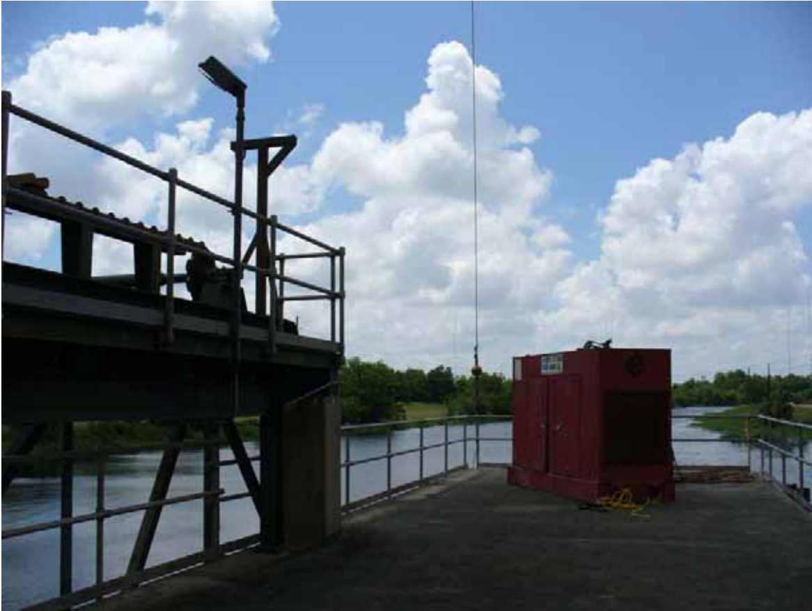
9. View of west area adjacent to the site.