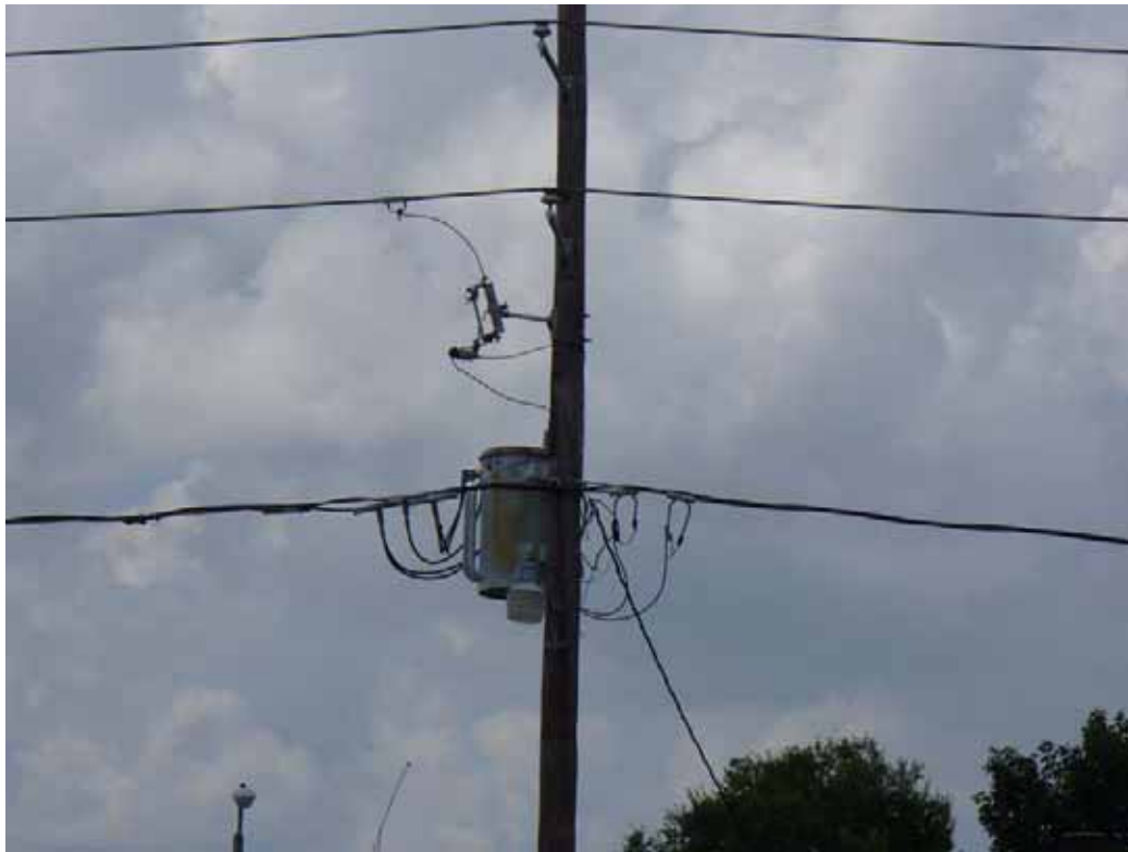
16. View of transformer north of property.