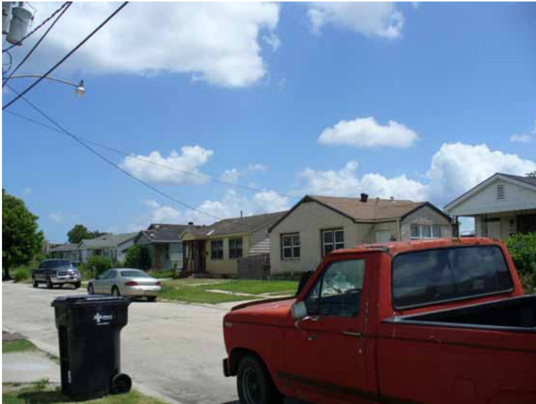
3. View of north area adjacent to the site, Warrington Drive, east side.