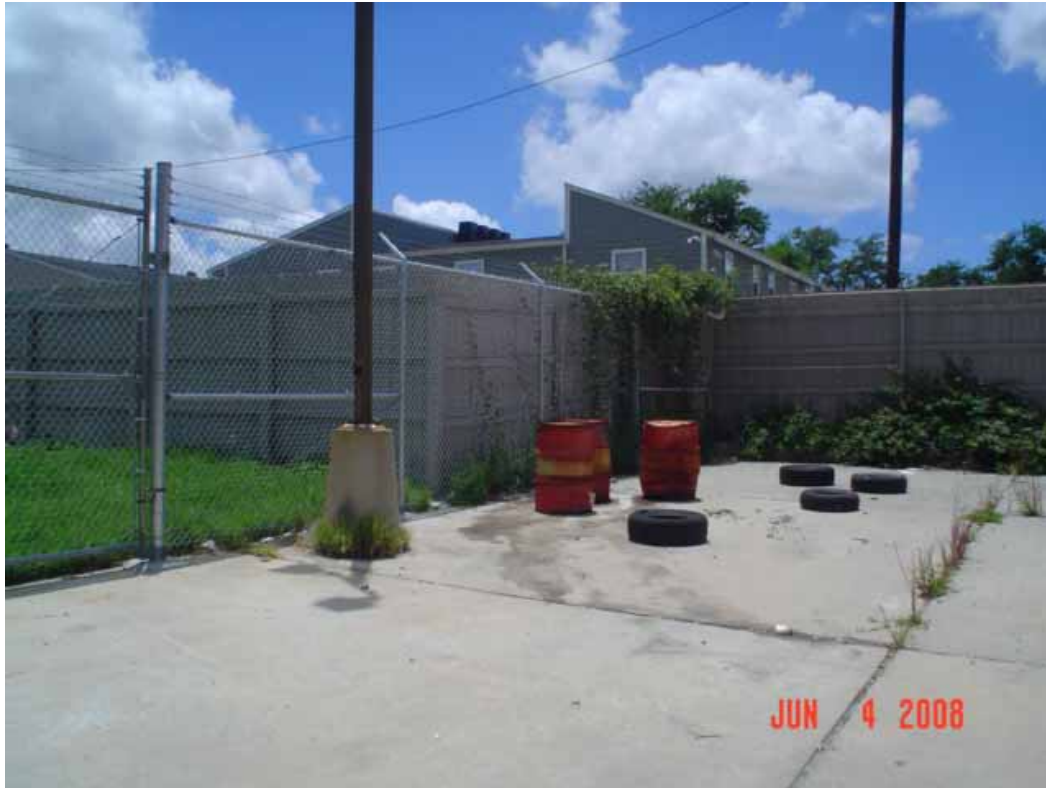
11. 55 gallon drums outside building, southeast corner.