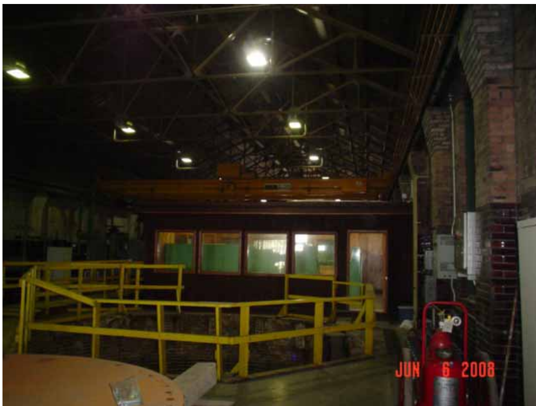
22. Large open hole filled with water.