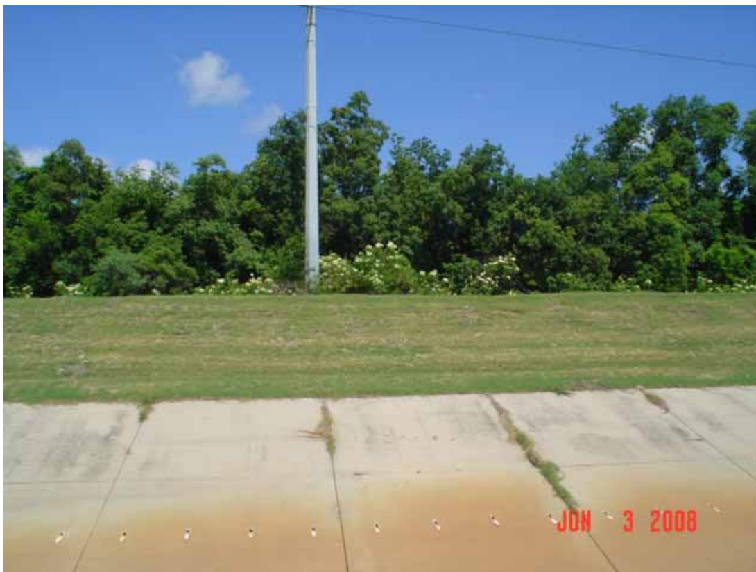
8. View of west area adjacent to the site, across canal.