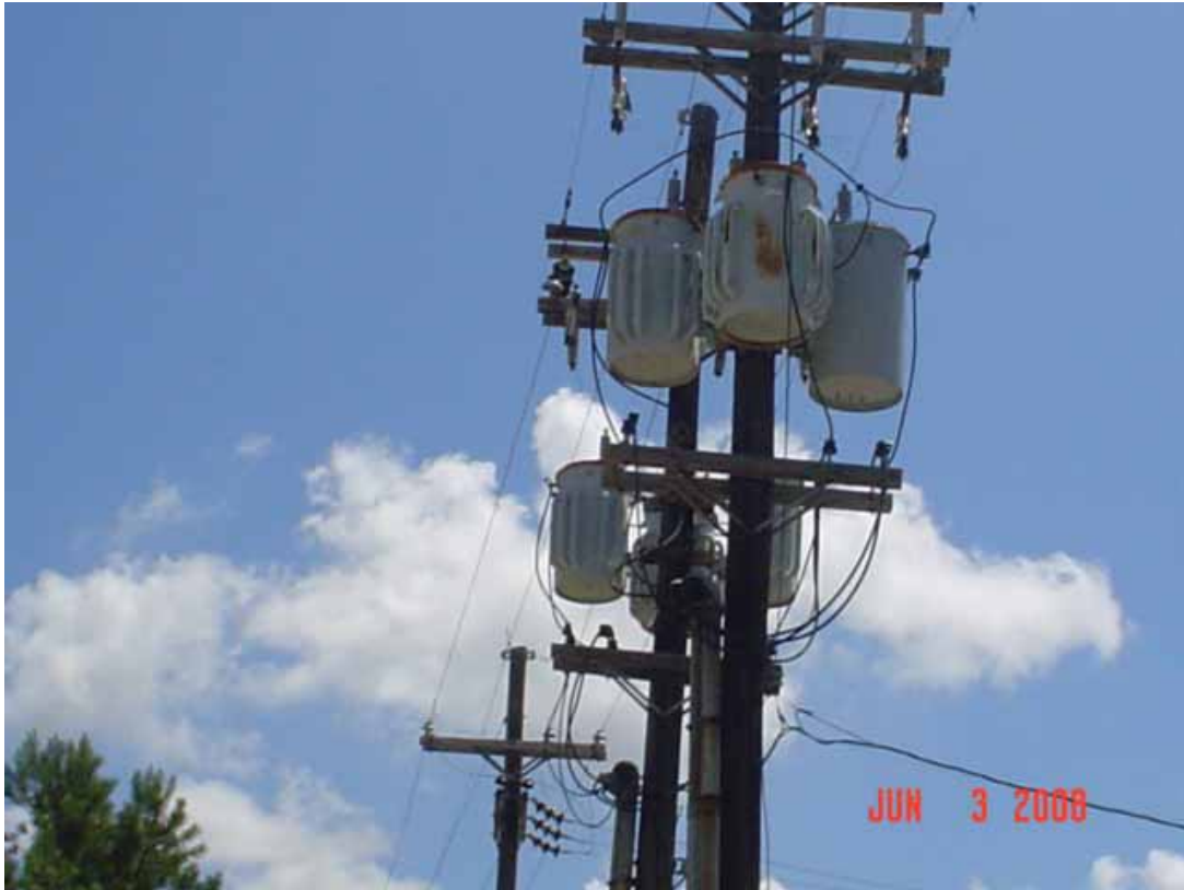
13. Six transformers located east of property. Three of the six had rust, but containment was not compromised.