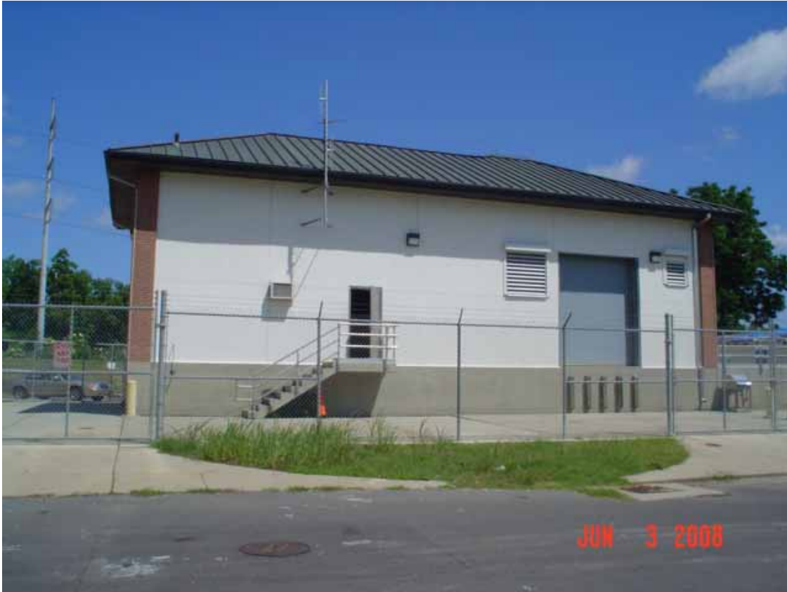
3. View of site as seen from the east direction.