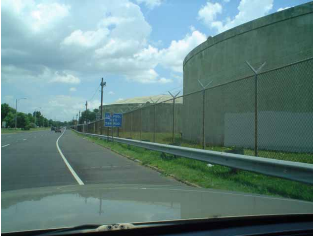
3. Water tanks in northwest corner of site.