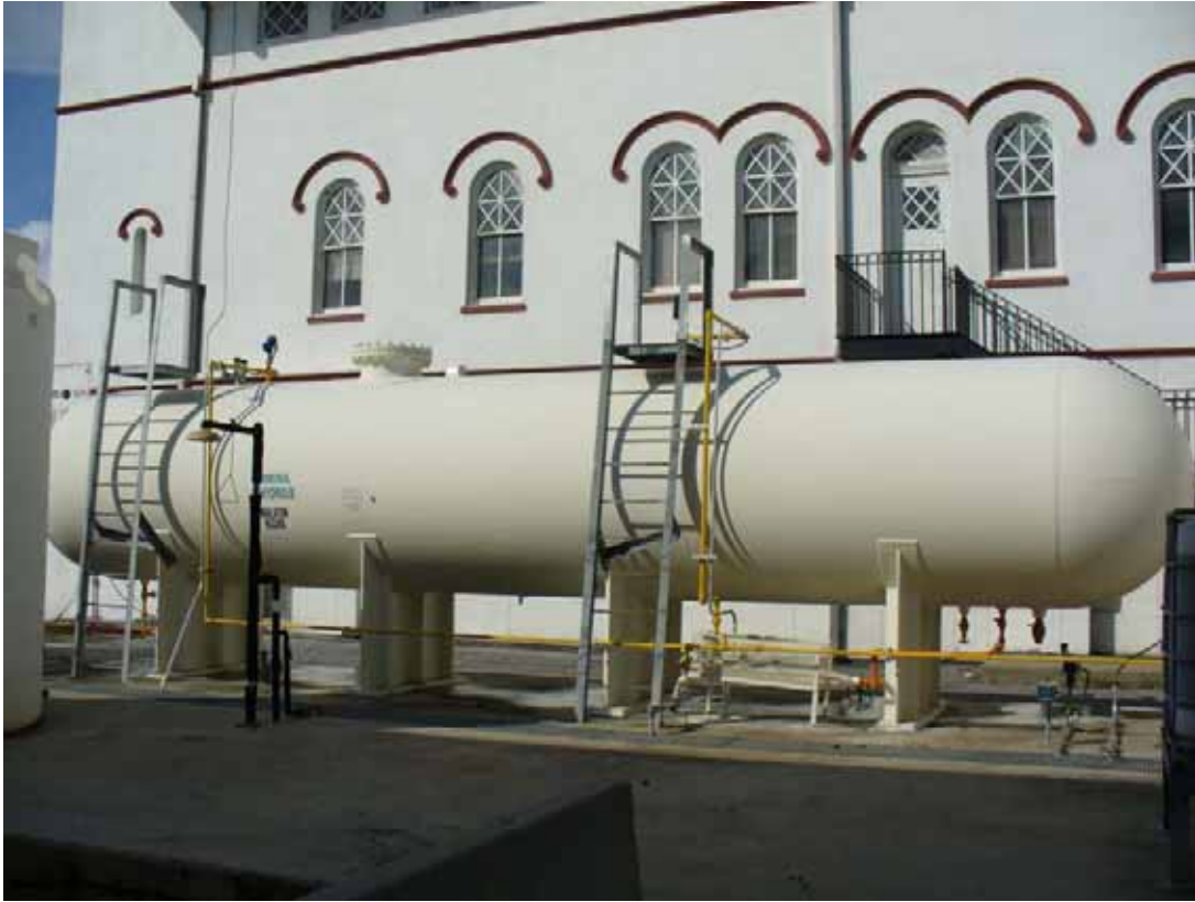
26. Ammonia tanks behind main building at entrance.