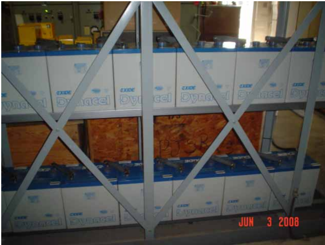
15. Battery bank.