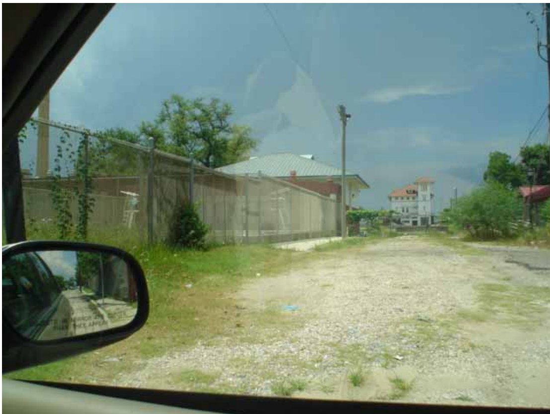
6. View of center of site from east side.