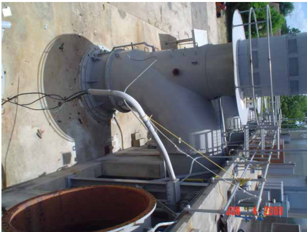
14. Loose electrical wiring from pump being repaired.