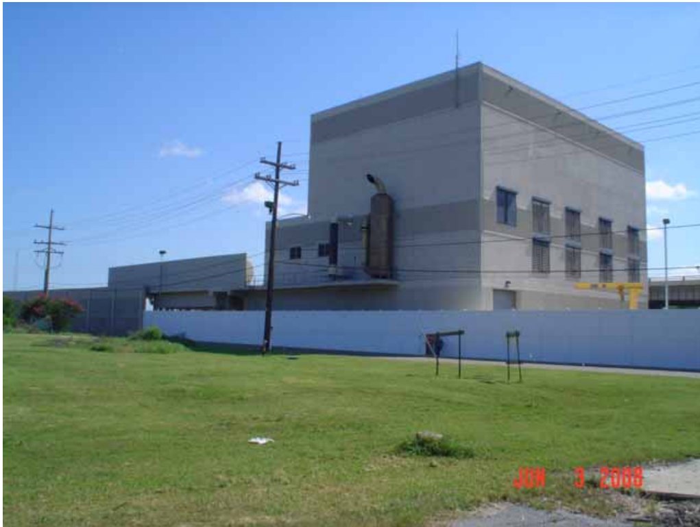
9. View of site as seen from the west direction.