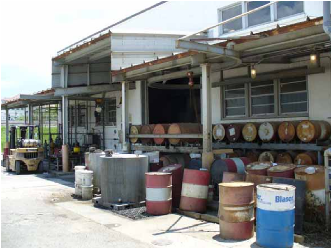
80. View of 55 gallon drums, waste oil tanks, 5 gallon, acetylene tanks and oxygen tanks stored on west side of machine shop.