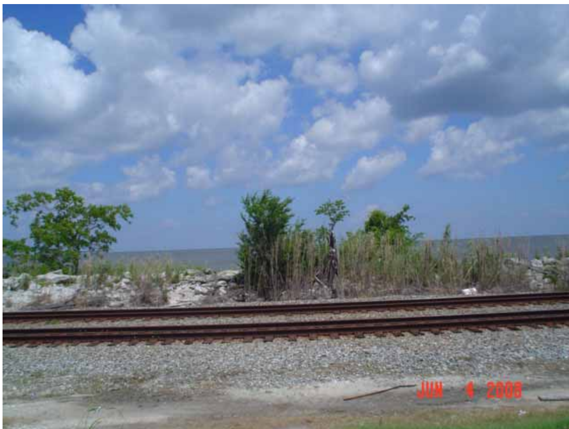
2. View of north area adjacent to the site with railroad tracks in foreground and Lake Pontchartrain in background.