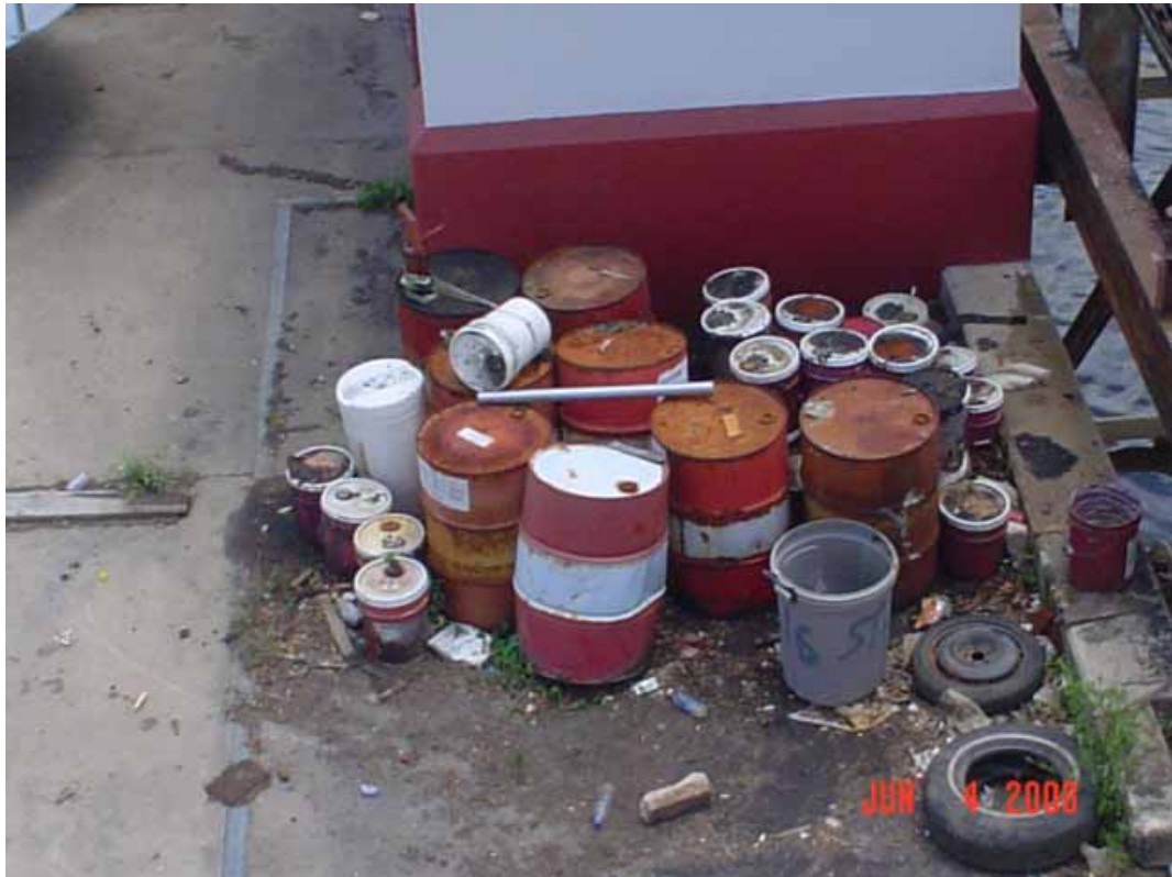
16. View of oil and lubricant containers stored near canal. Tires are part of debris removed from canal.