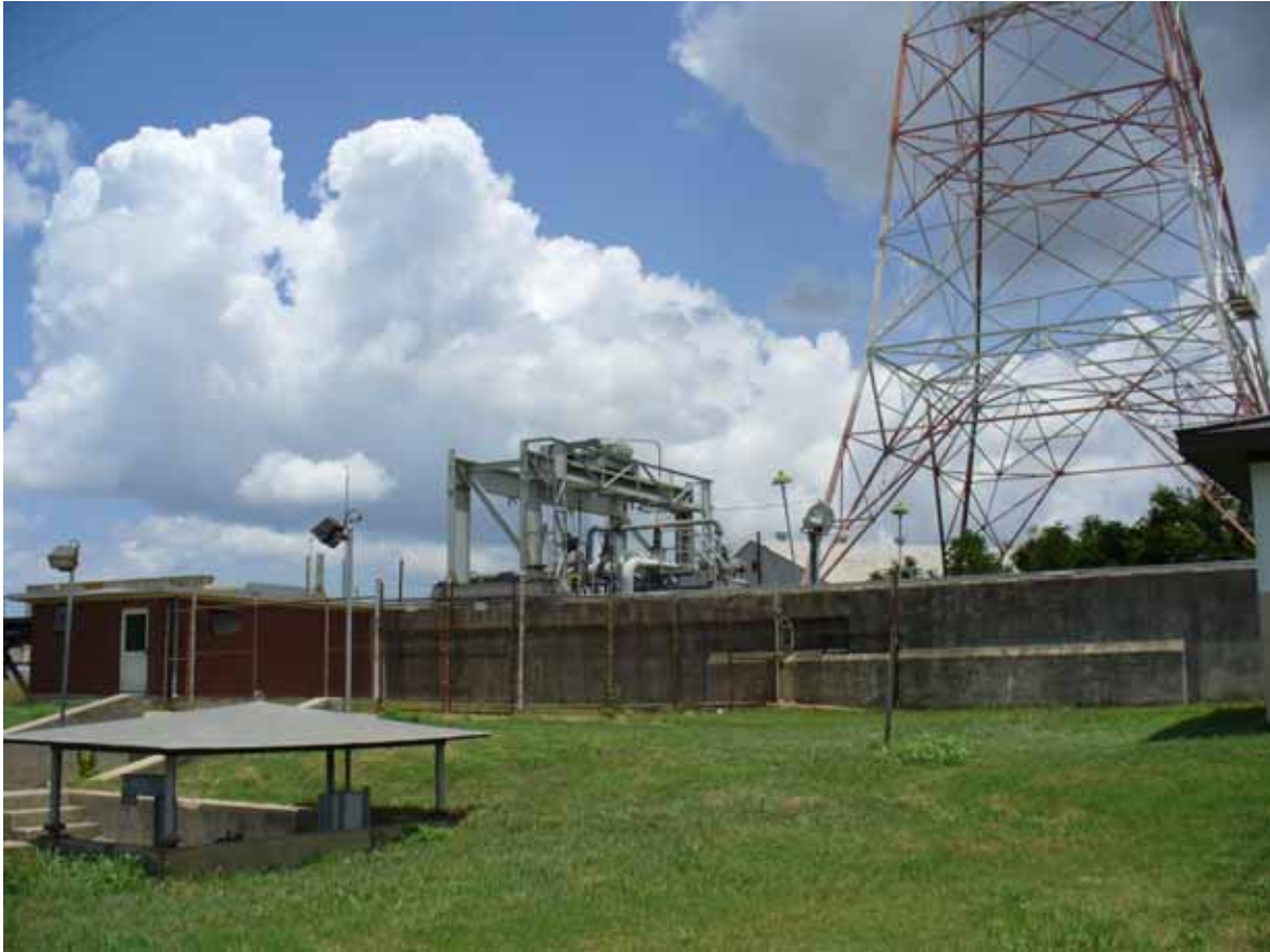
11. View of west area adjacent to the site, additional building and tower, northwest corner.