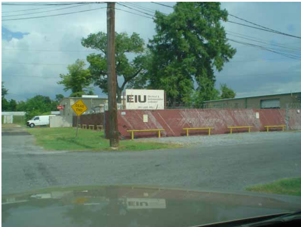
6. Electrical business, across levee, northwest corner.