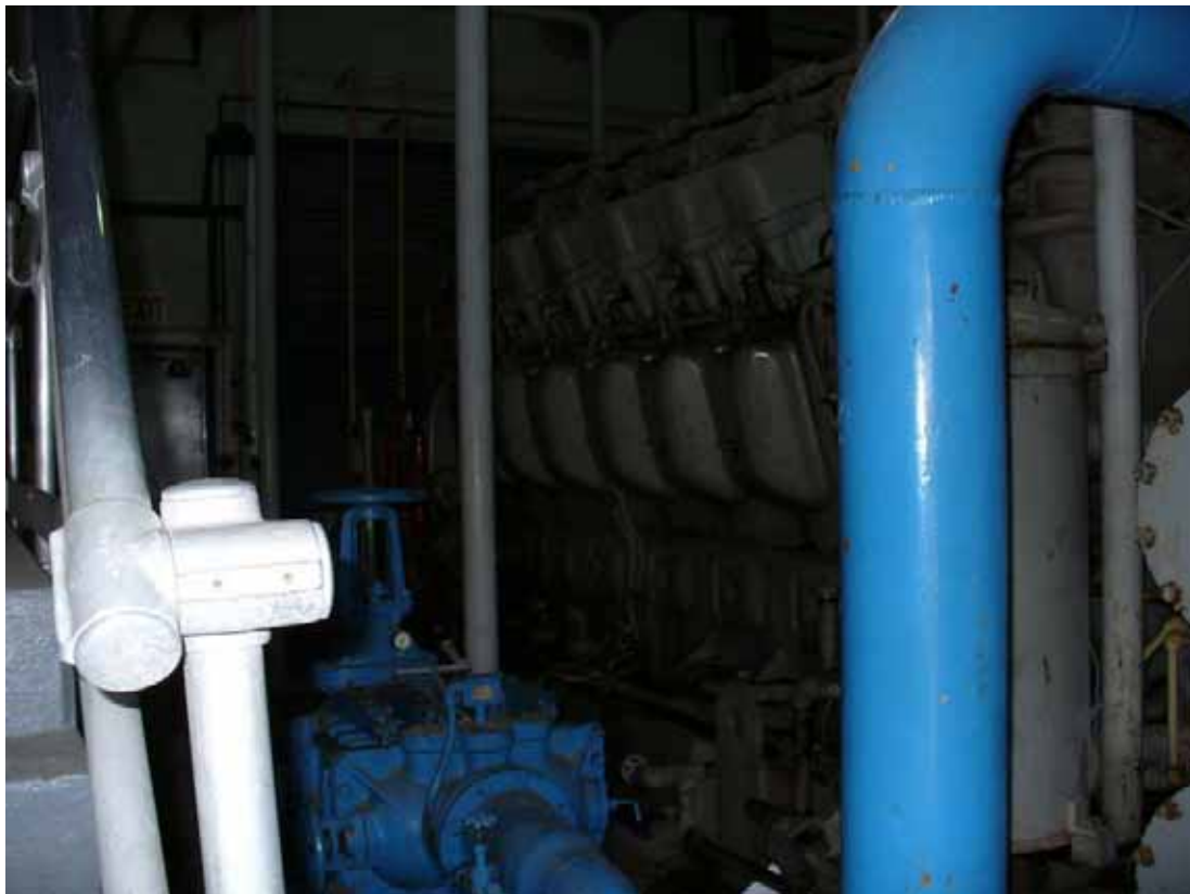
20. Diesel engine.