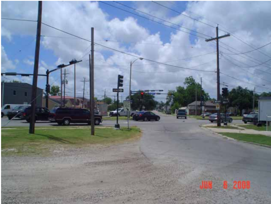
11. View of south area adjacent to the site, AP Tureau Street, in east area.