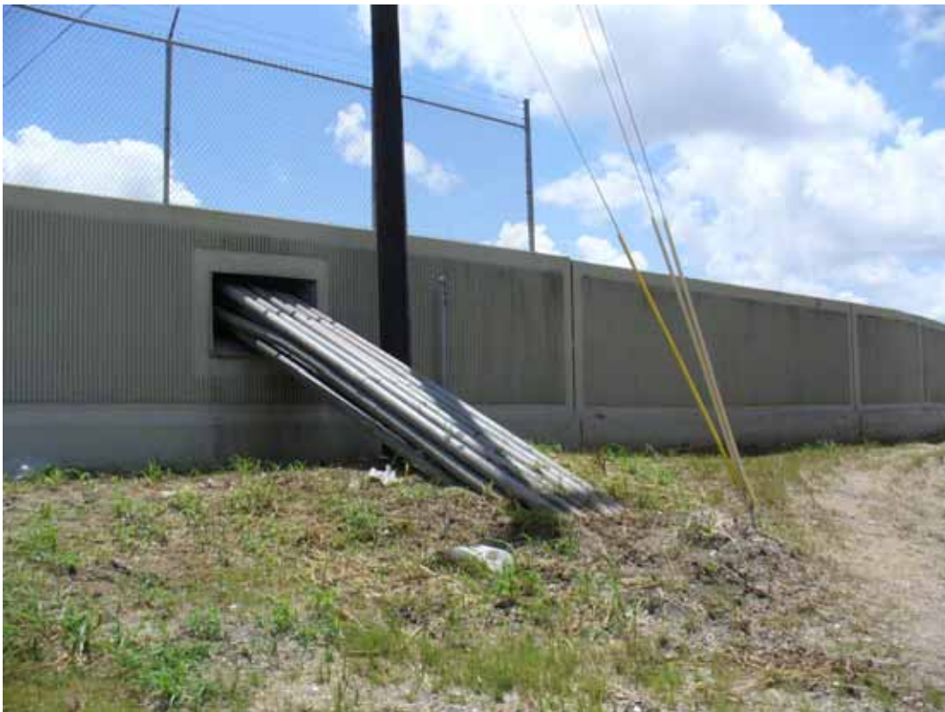
16. Electrical connections across canal, adjacent to Pratt Park.