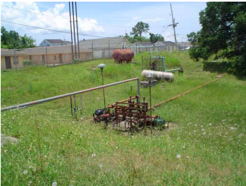
97. Pumps in foreground for UST located north of meter shop, orange tank in background for fire suppression system and abandoned fiberglass tank.