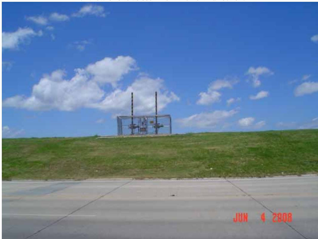
2. View of north area adjacent to the site, including gate indicator.