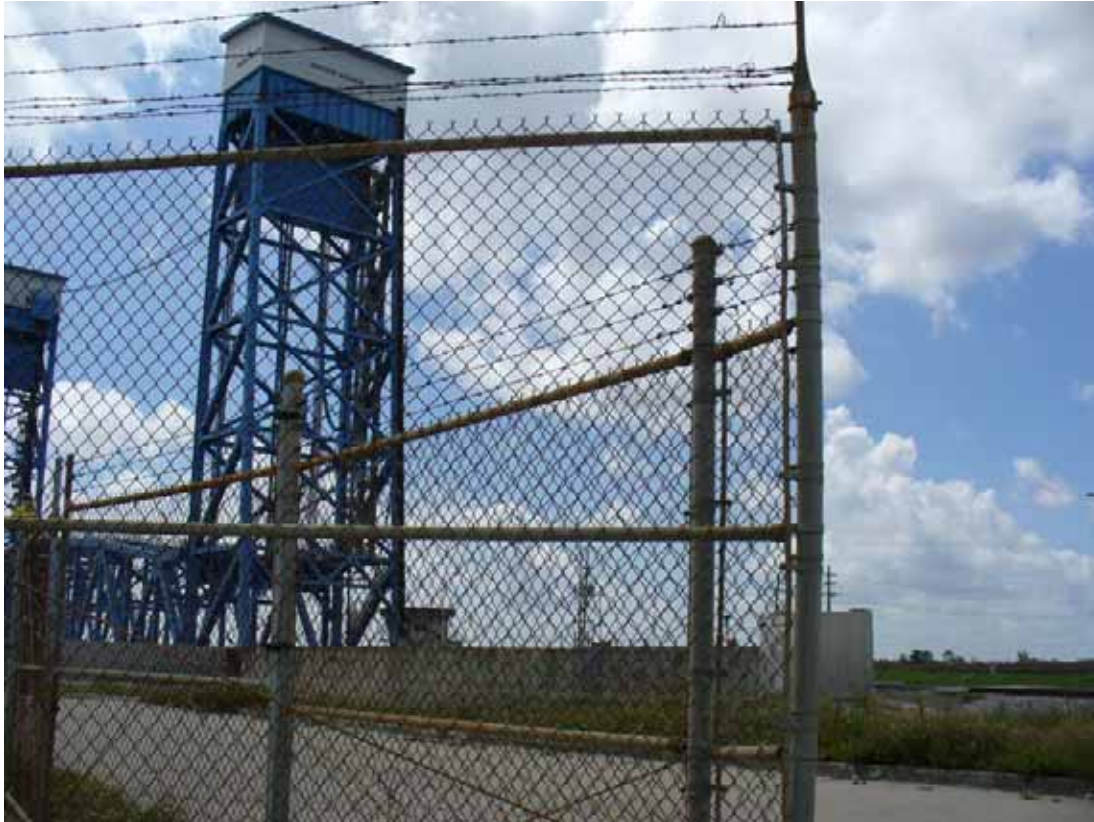
9. View of south area adjacent to the site in southeast area.