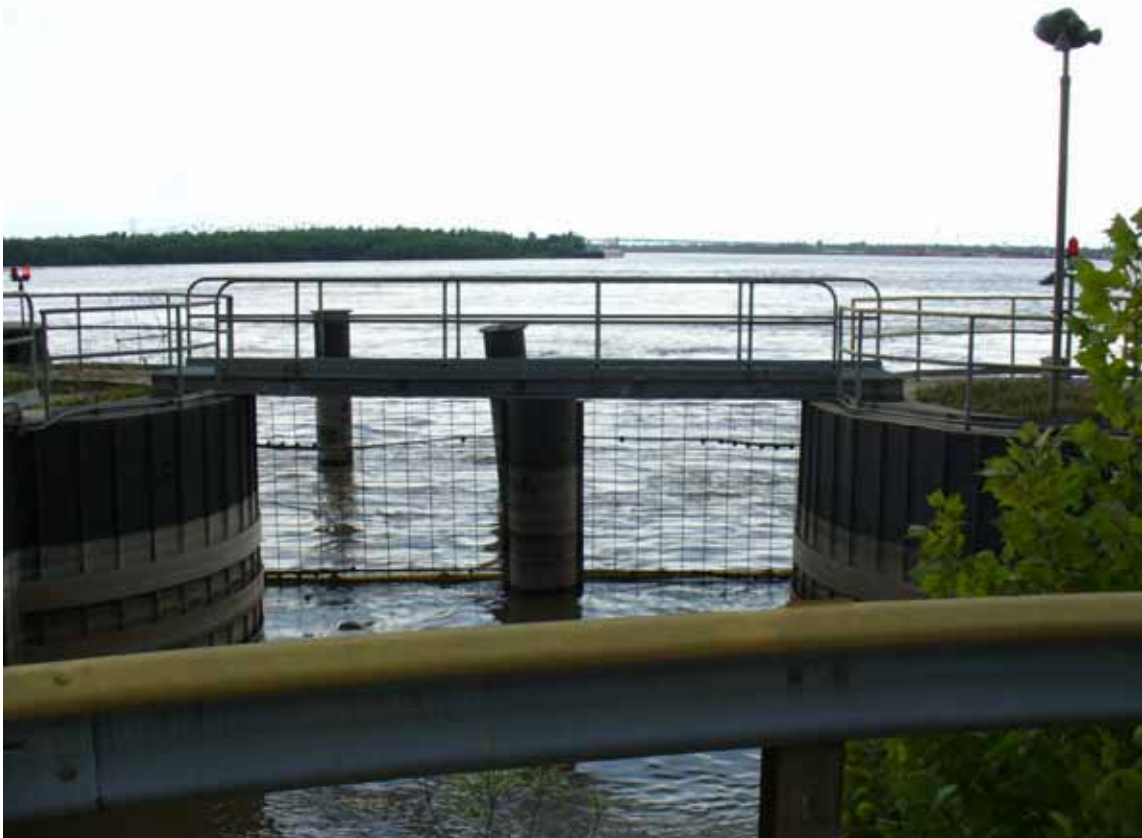
6. View of south area adjacent to the site.