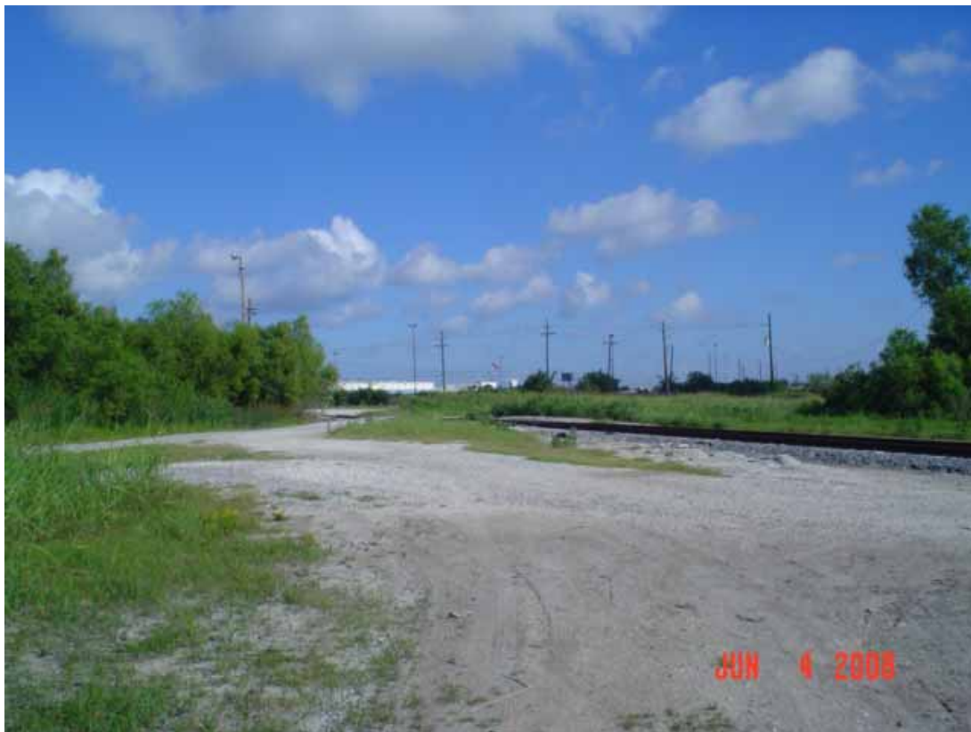
2. View of north area adjacent to the site, showing railroad tracks.