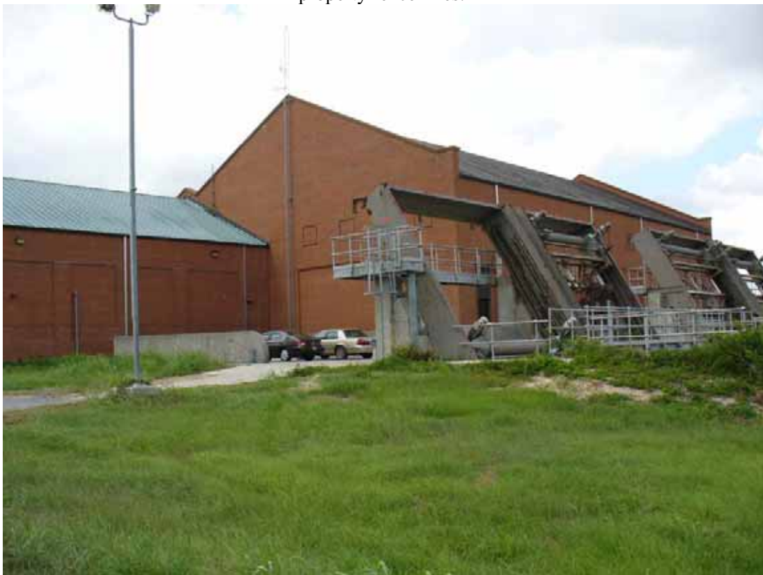
6. View of site as seen from the south direction.