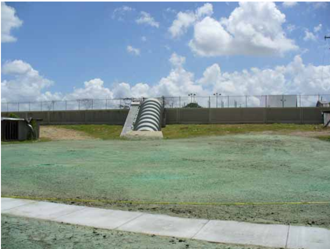
10. View of site as seen from the west direction, across canal.