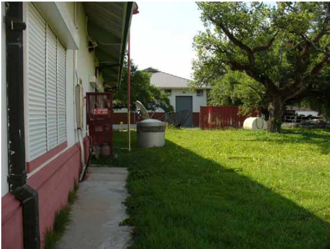
49. Vent and diesel AST located south of central control building.