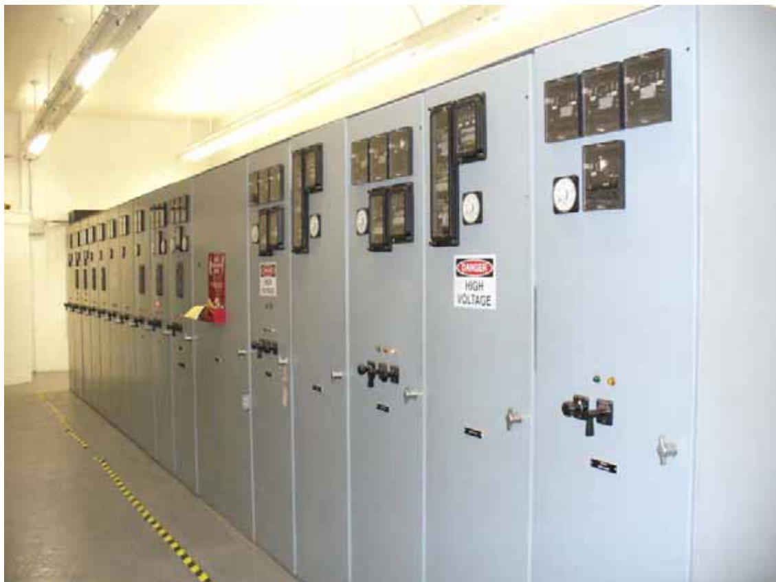
35. Switches and transformers located inside Sycamore substation.