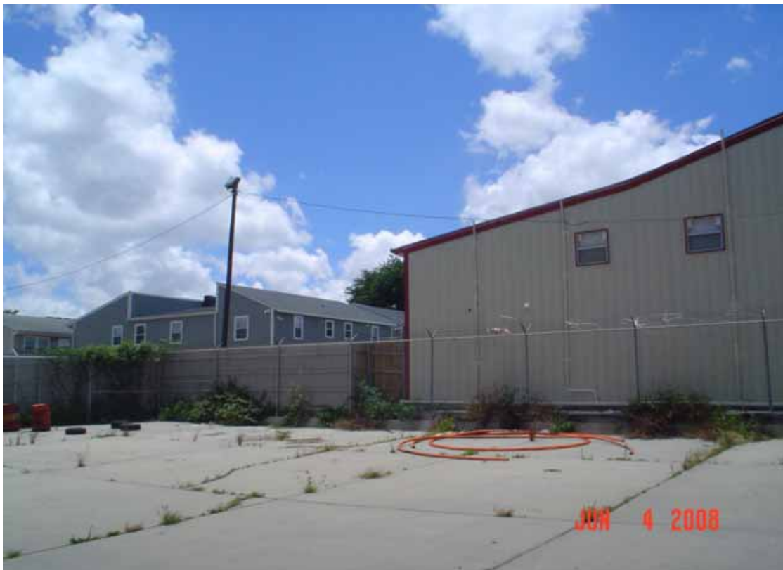
10. View of west area adjacent to the site, southwest corner.