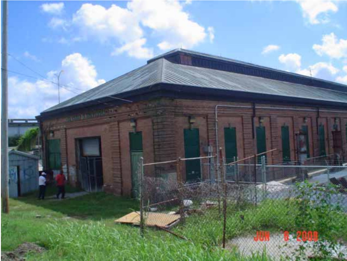
11. View of site as seen from the (south) west direction.