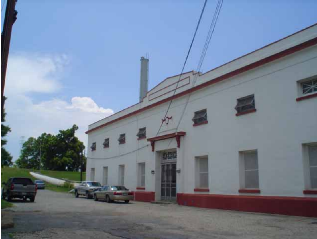
5. View of site as seen from the east direction.