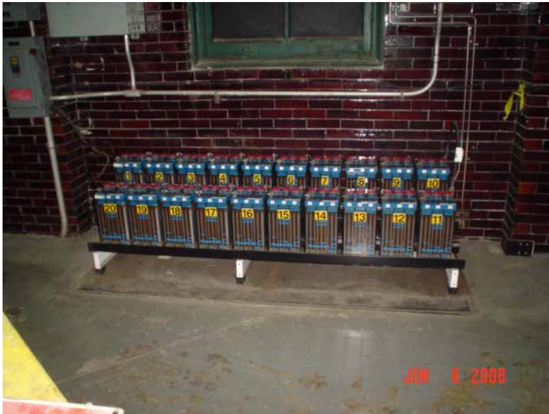
21. Battery bank inside building.