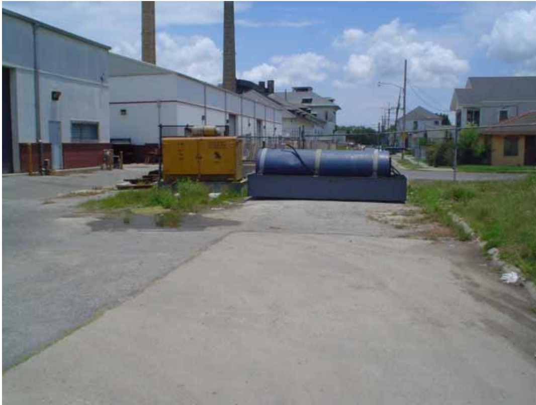
98. Generator for the electrical shop and large blue diesel tank.