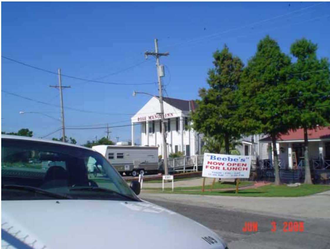
12. View of west area adjacent to the site, bed and breakfast. Observe pole transformer located southwest of site across Pontchartrain Boulevard.