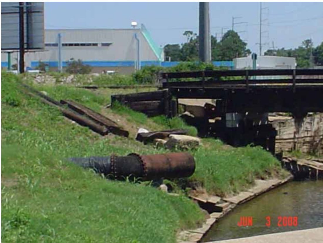
14. Pipes and railroad tracks across canal, northwest corner.