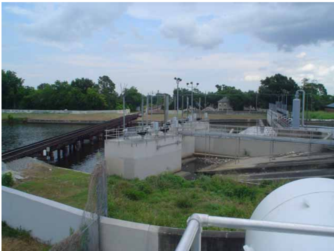
4. View of north area adjacent to the site, east side of canal.