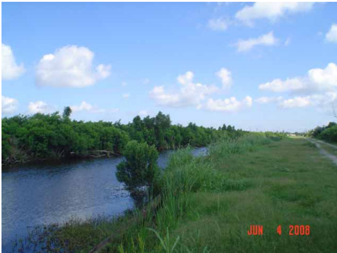
2. View of north area adjacent to the site, canal.