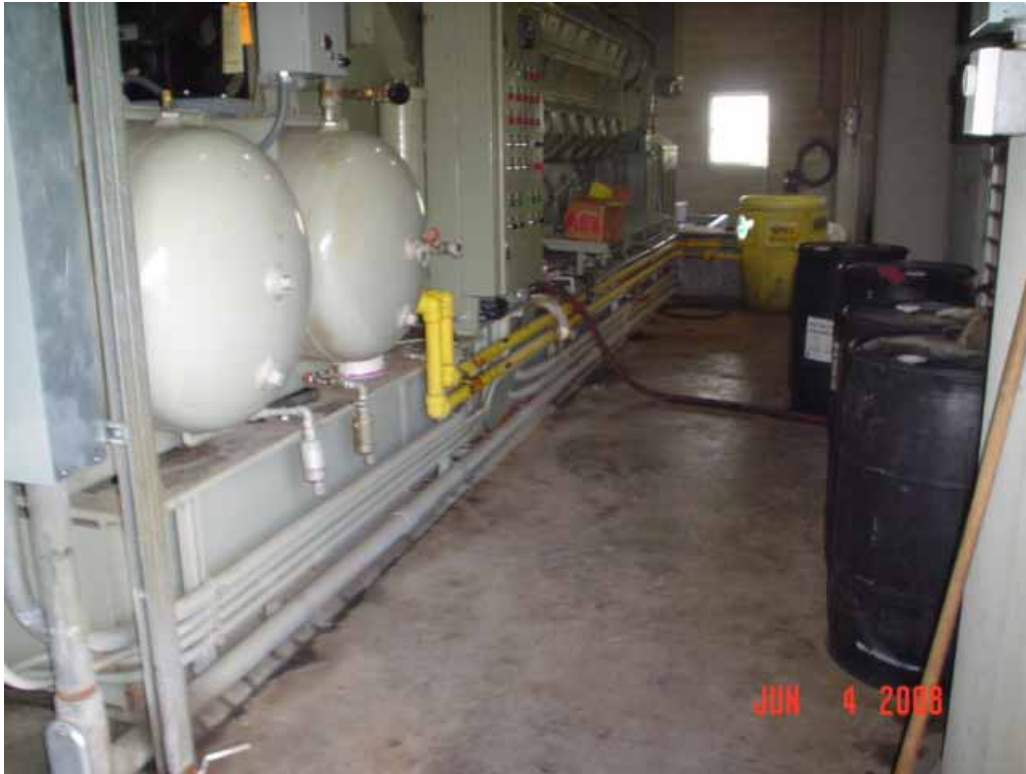
19. Tanks, drums, and switches inside building.