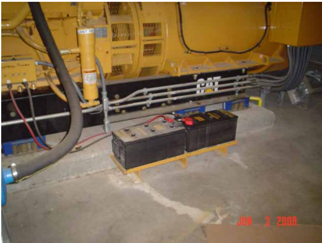
16. Batteries for diesel engine.