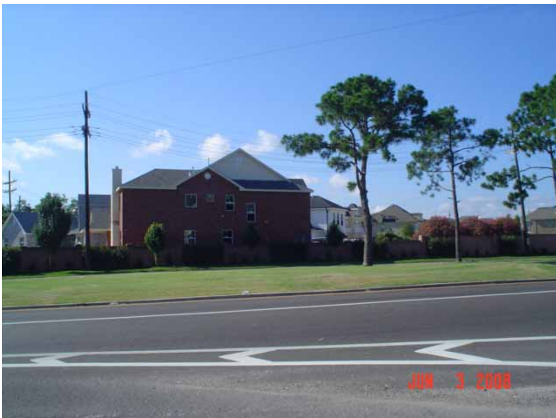
8. View of south area adjacent to the site.