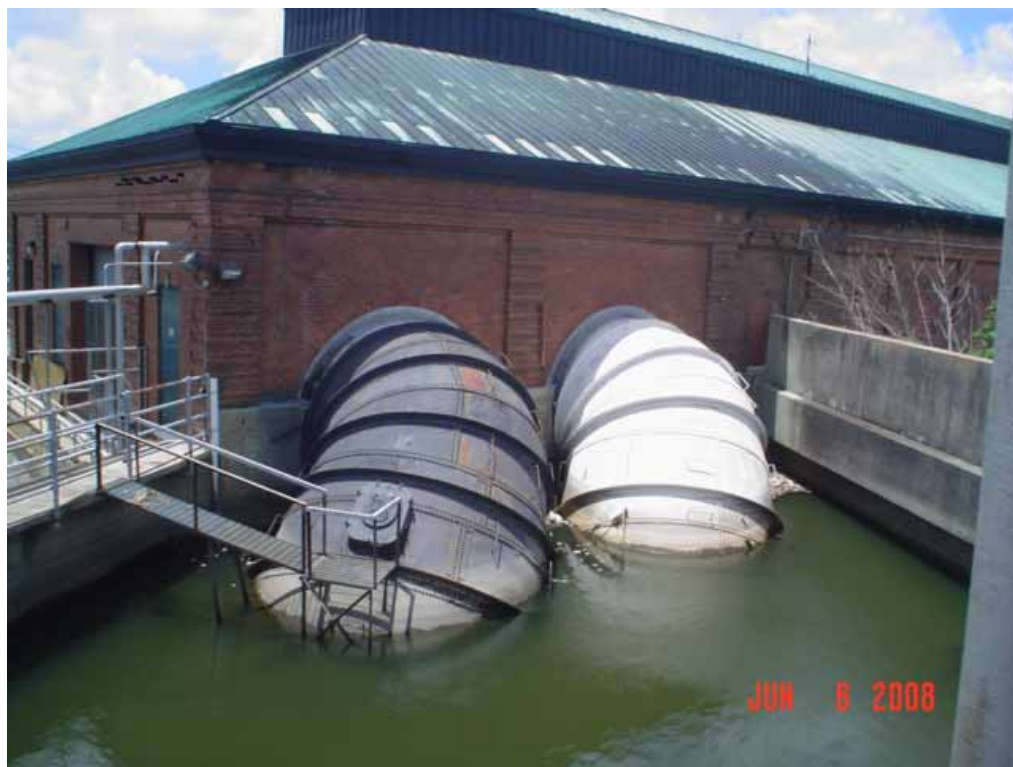
18. View of pump lines in northeast corner.