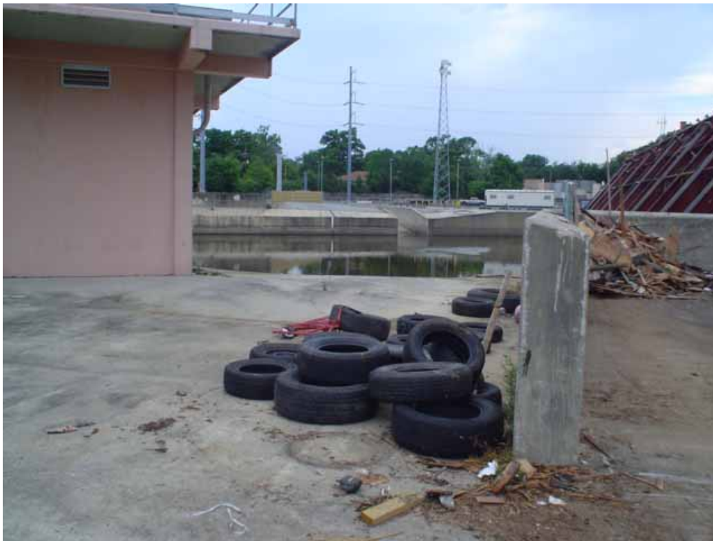
22. Refuse from the canal.