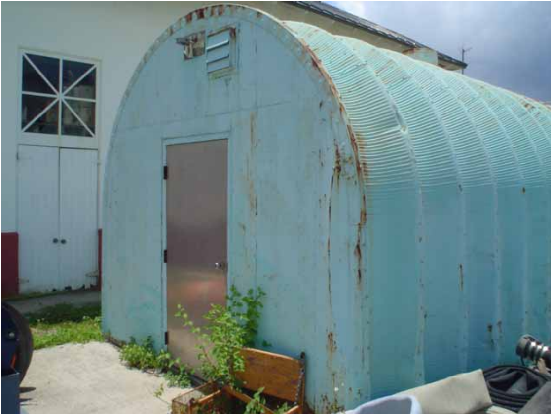
104. Boat house located north of meter shop.