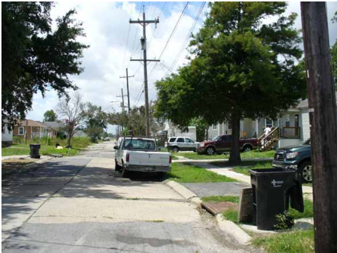
8. View of south area adjacent to the site, Warrington Drive, west side.