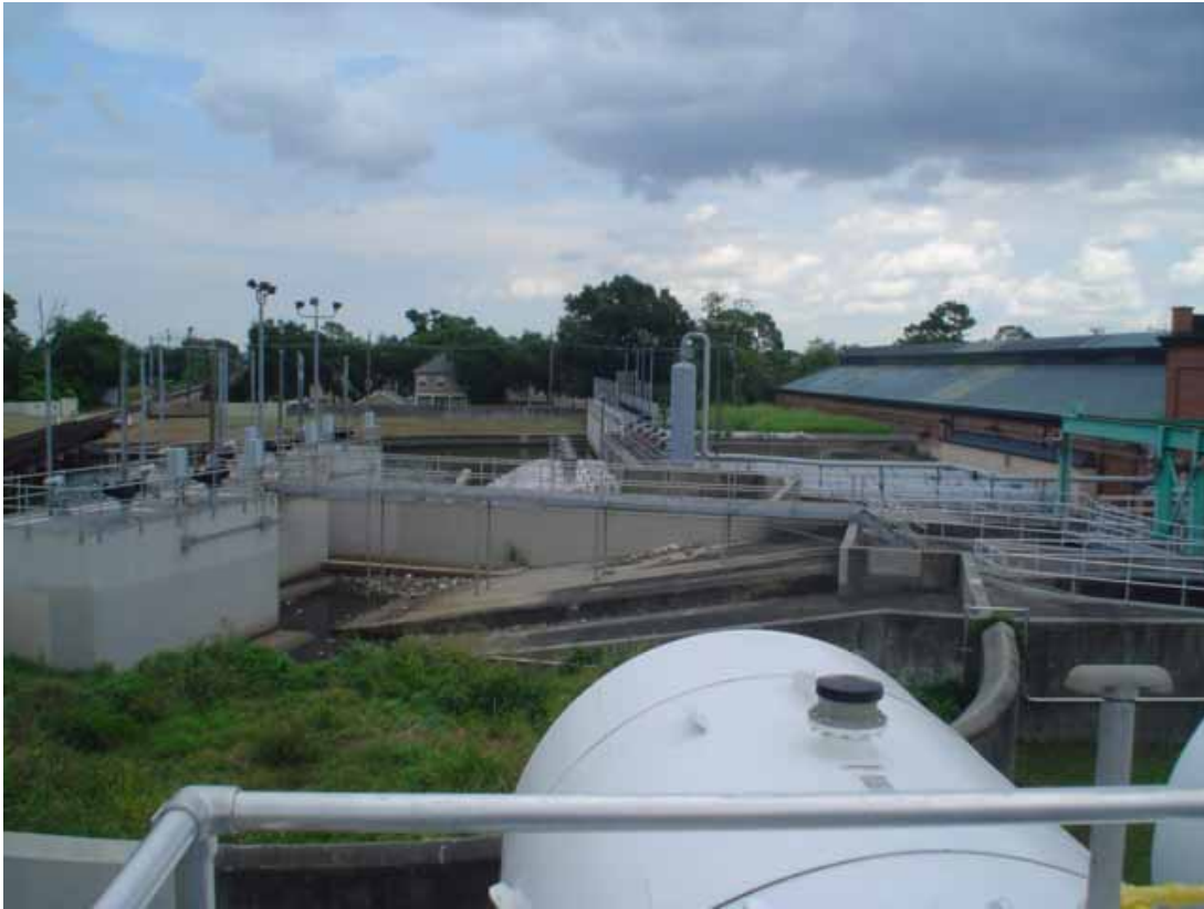
23. Pipelines and machinery, north side.