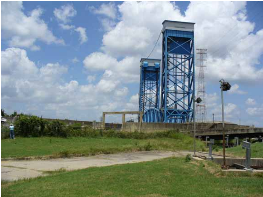
12. View of west area adjacent to the site, Florida Avenue Bridge, southwest corner.