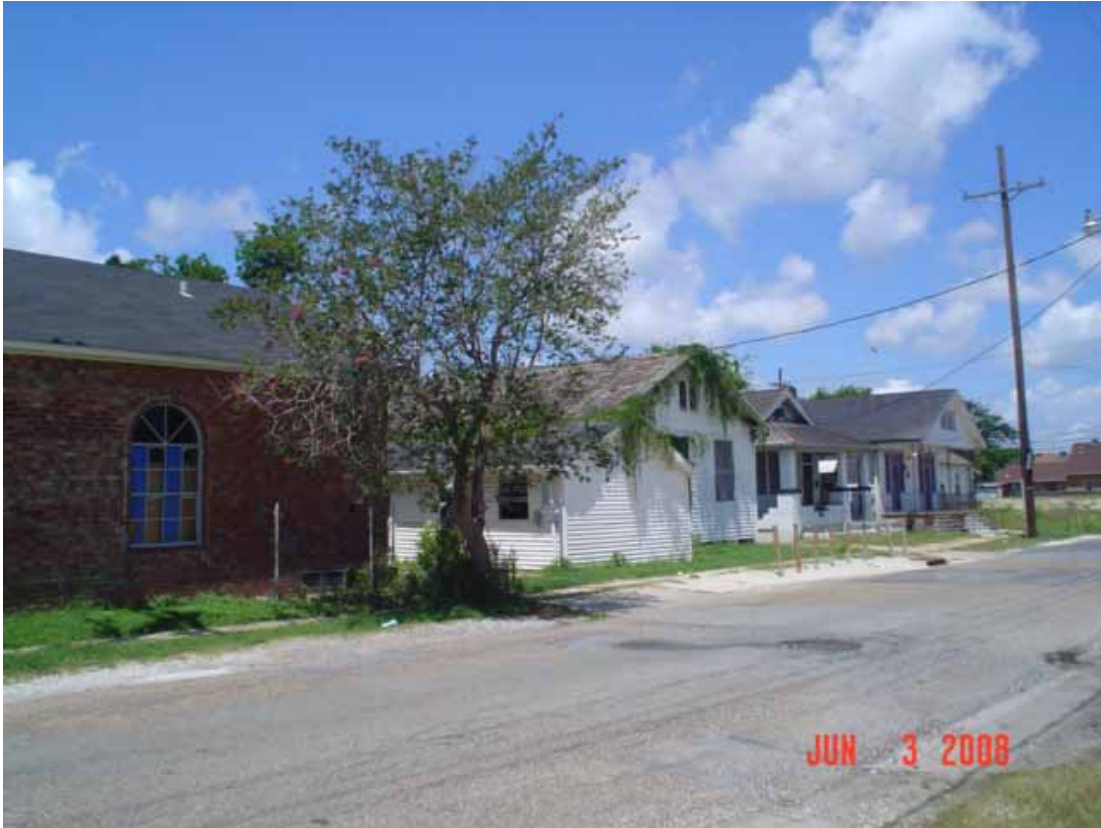
11. View of south area adjacent to the site.