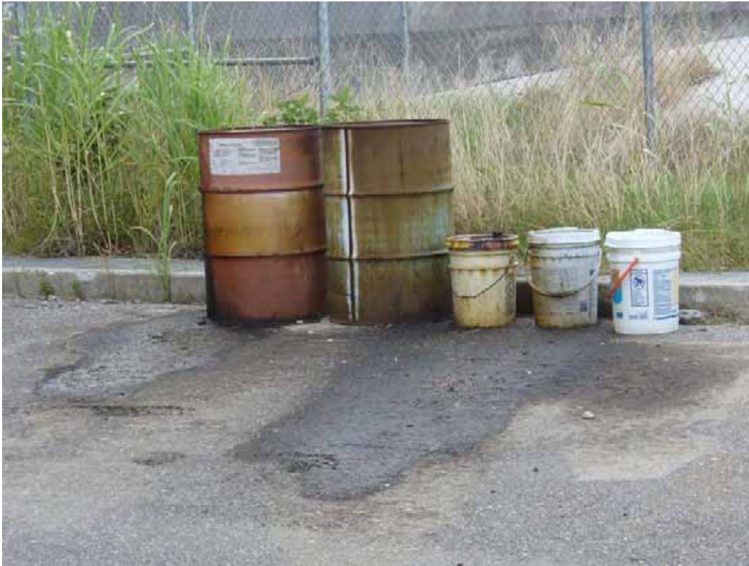
11. View of leaking 55 gallon drums and 5 gallon containers stored in northeast corner of site.