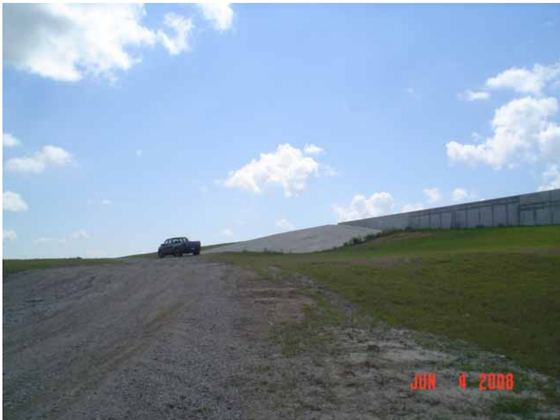
4. View of east area adjacent to the site.