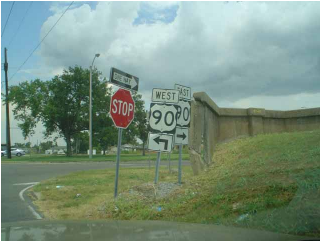
24. View of northwest corner of site looking north.