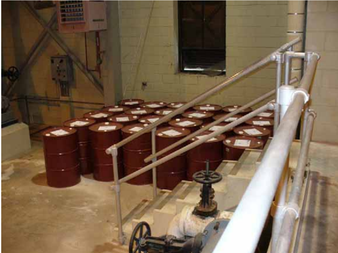
12. View of 55 gallon drums of petroleum product stored inside building.