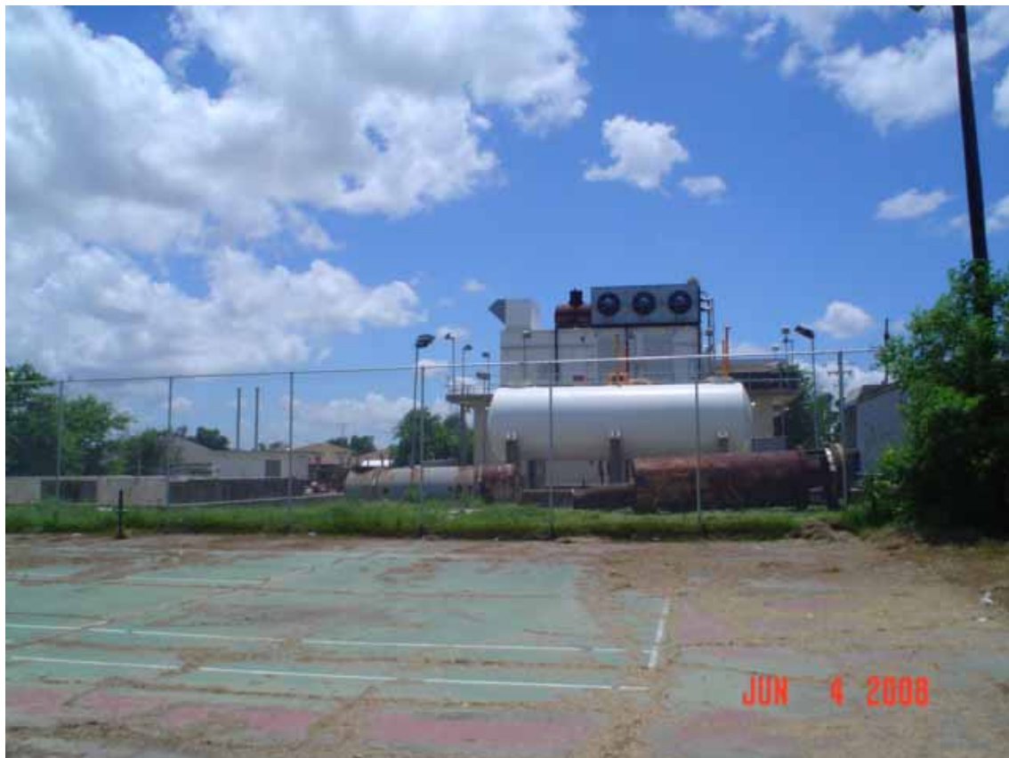
4. View of site as seen from the east direction.