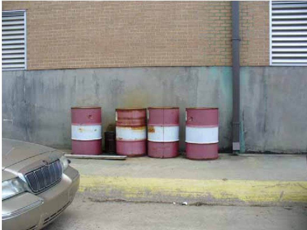
13. View of 55 gallon drums stored outside of east side of building.