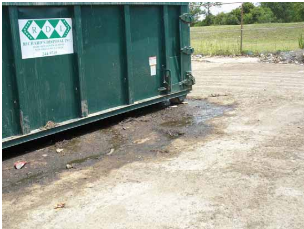
12. View of leaky dumpster observed in northwest corner of site.