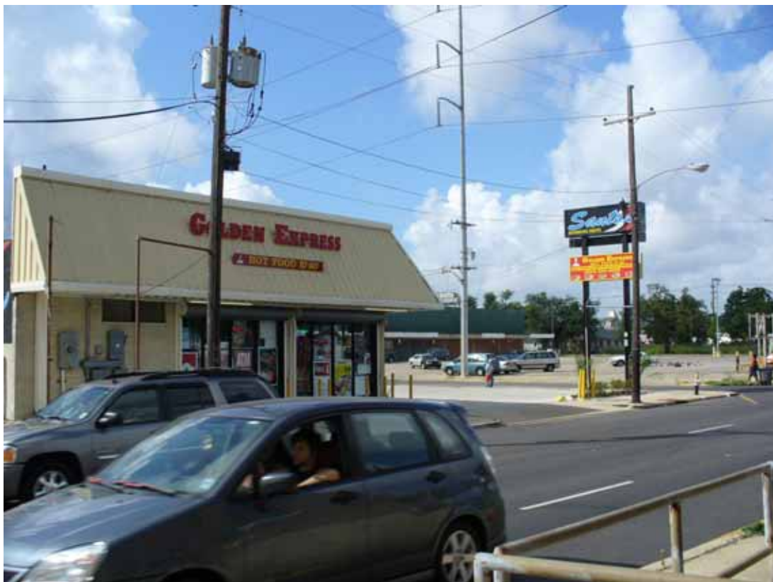
10. View of south area adjacent to the site, with Golden Express Market, and Santa's Auto Repair, in southwest area.