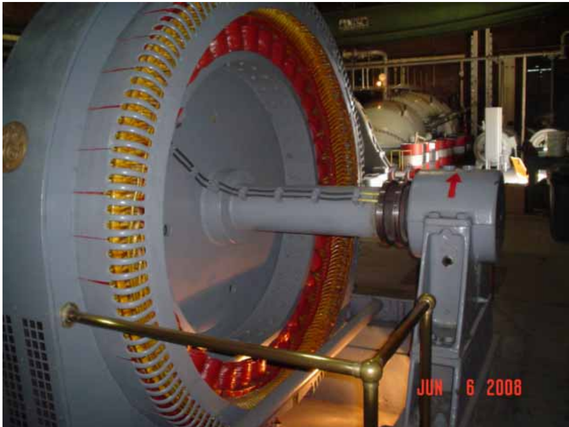
15. View of refurbished pump inside building.