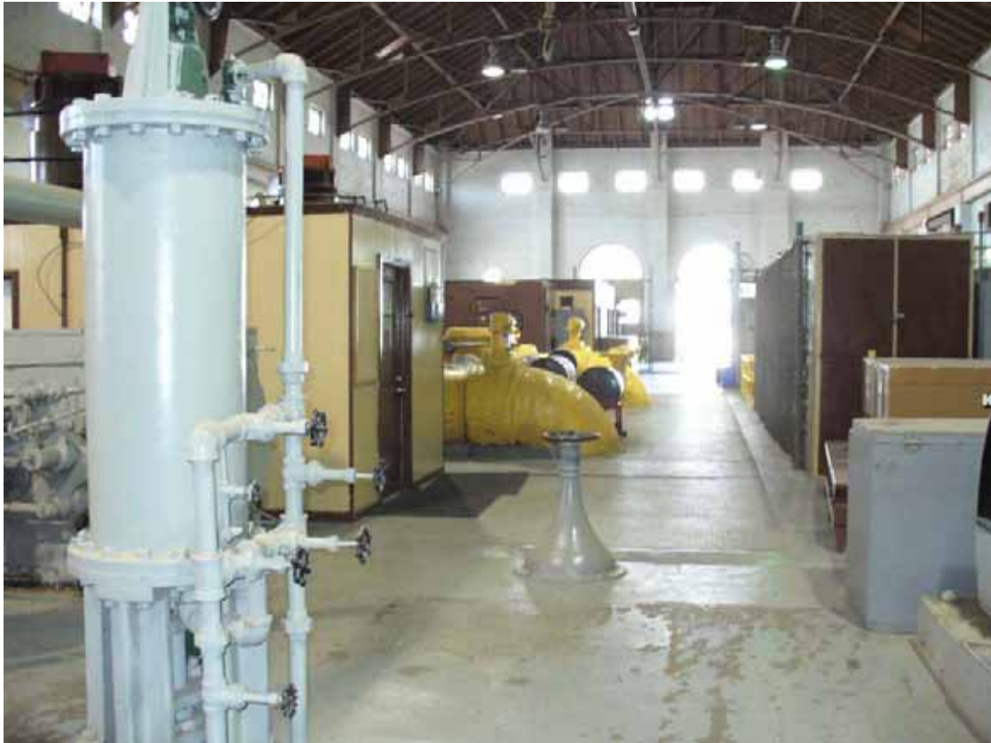
66. Pumps in the low-lift building.