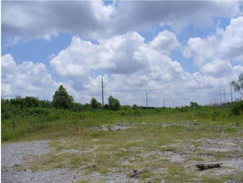
5. View of east area adjacent to the site, railroad tracks follow power poles on left of picture.