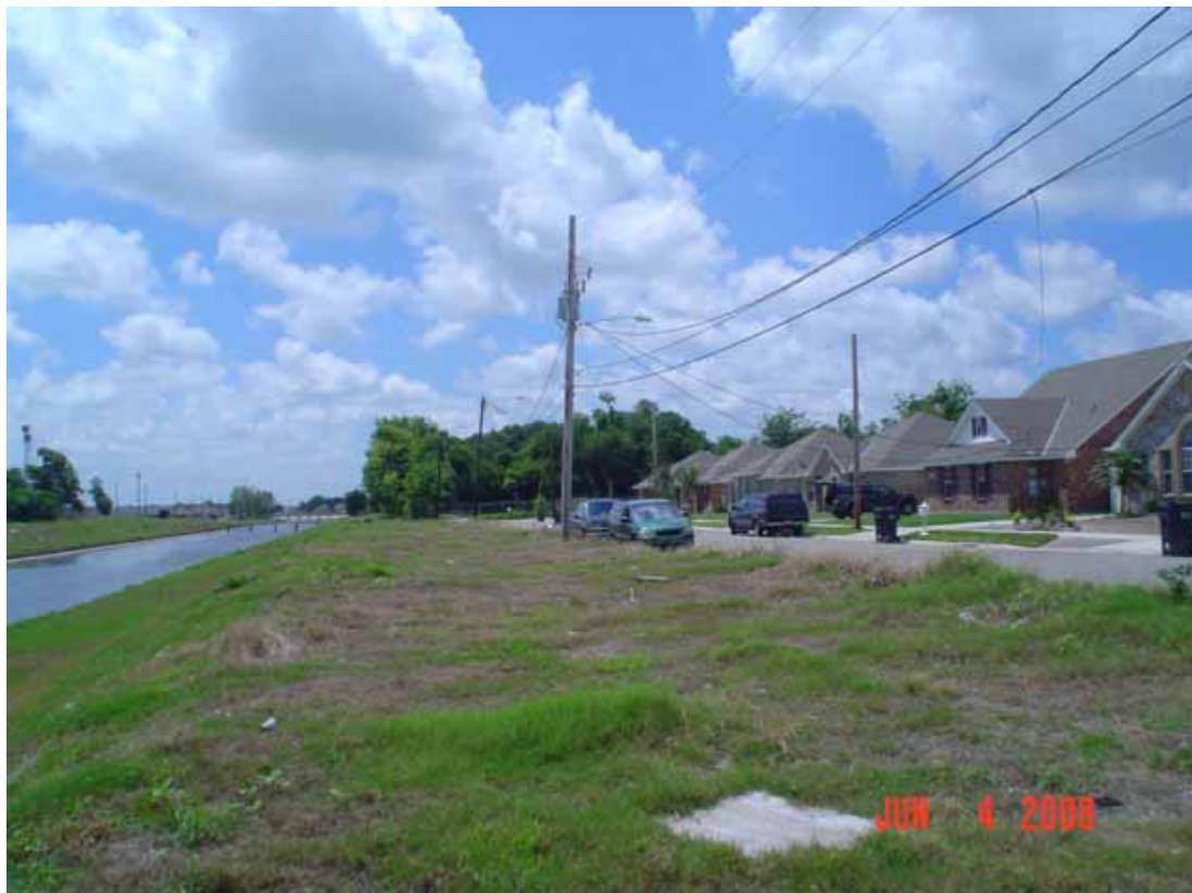
8. View of south area adjacent to the site in southwest direction.