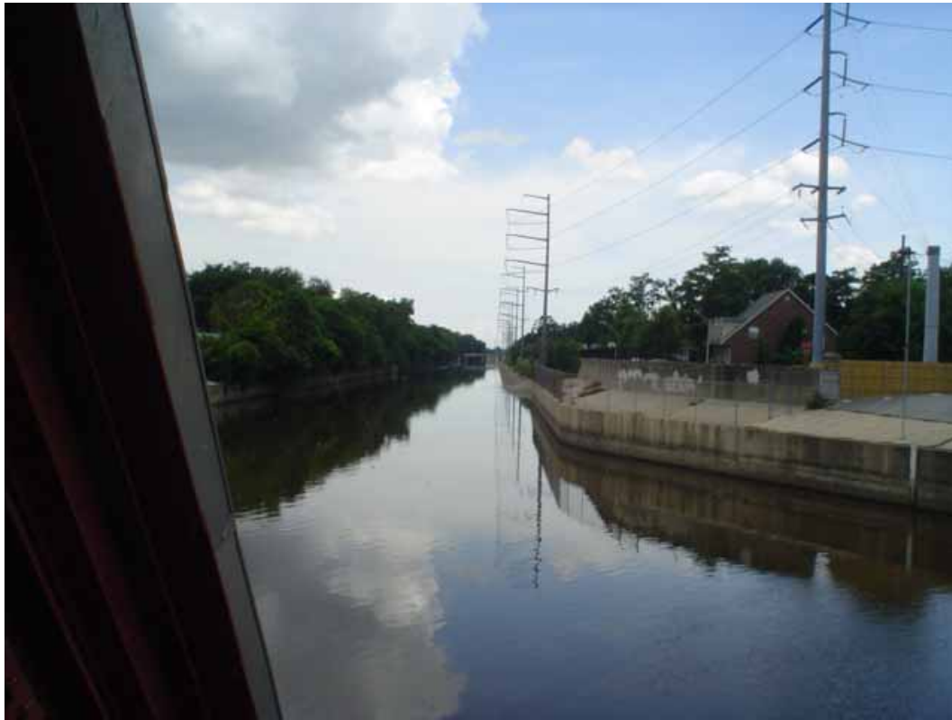
11. View of south area adjacent to the site, 17 th Street canal.