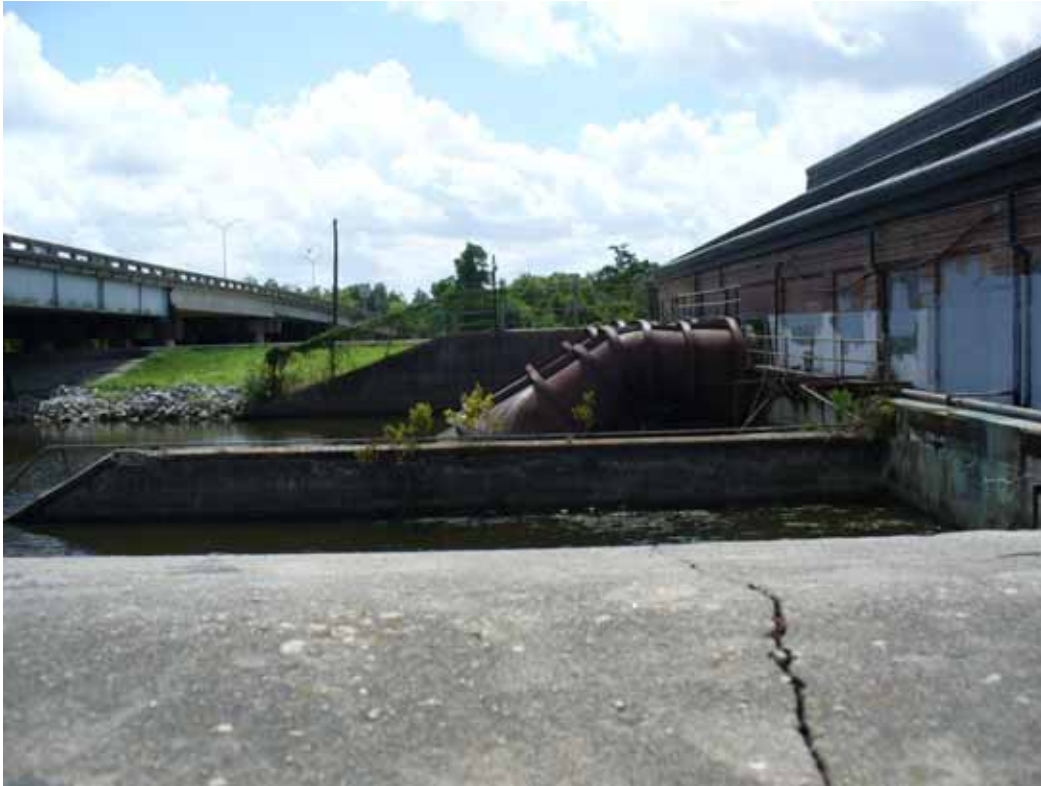
3. View of north area adjacent to the site, pipes