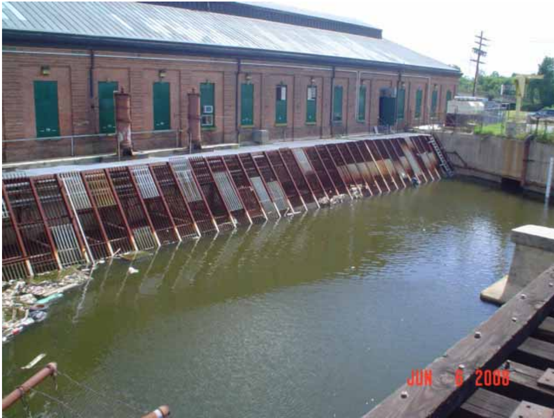
7. View of site as seen from the south direction.