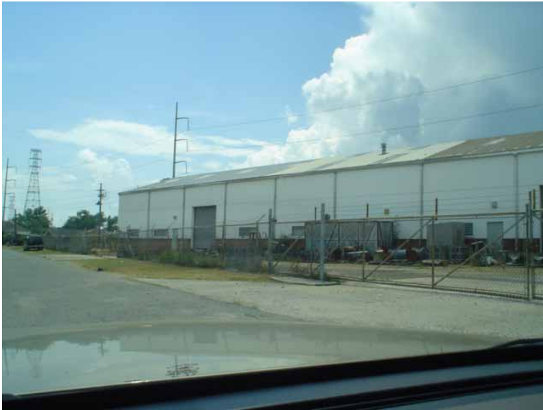
20. View of south of site from end of Hamilton Street looking south.