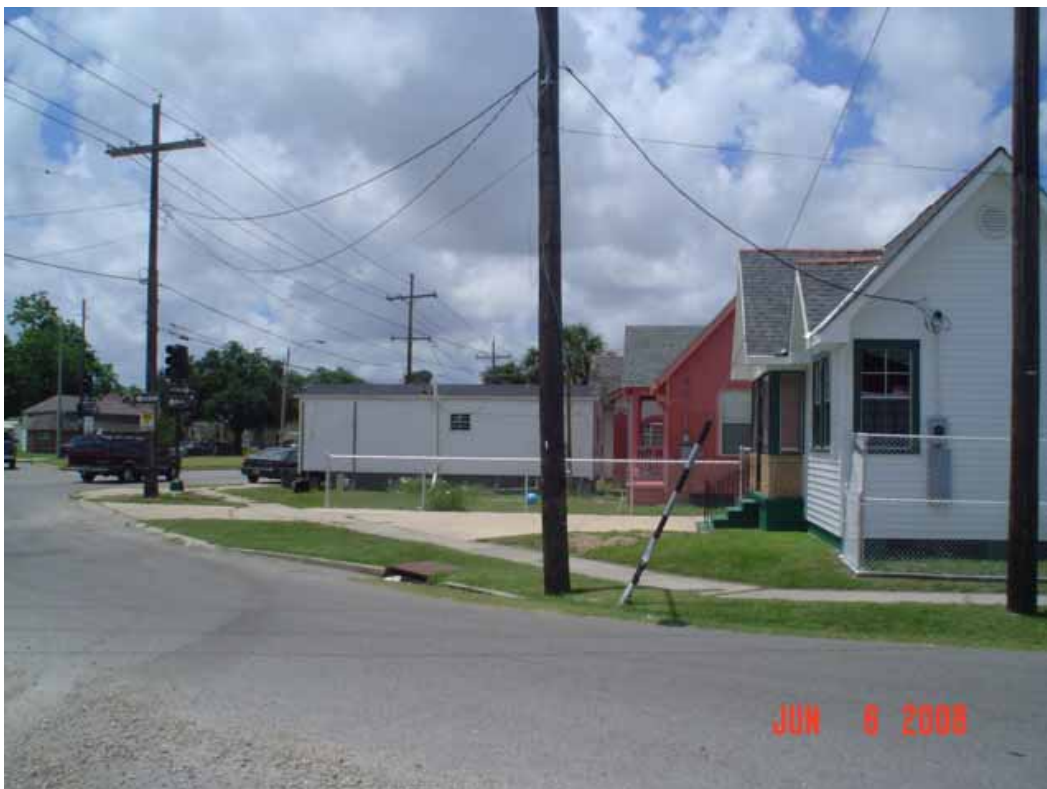
12. View of south area adjacent to the site, AP Tureau Street, in west area.