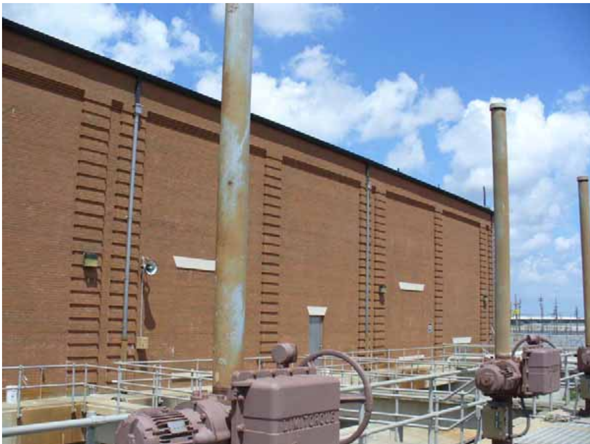
2. View of site as seen from the north direction, right side.