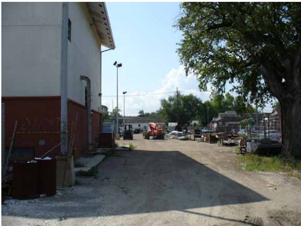
51. View of storage yard in south east corner where oil-stained pavement was observed.