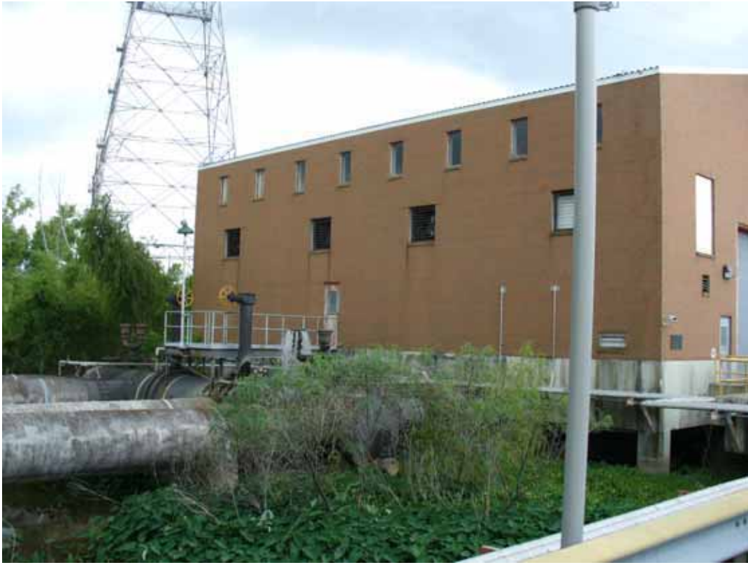
1. View of site as seen from the north direction.