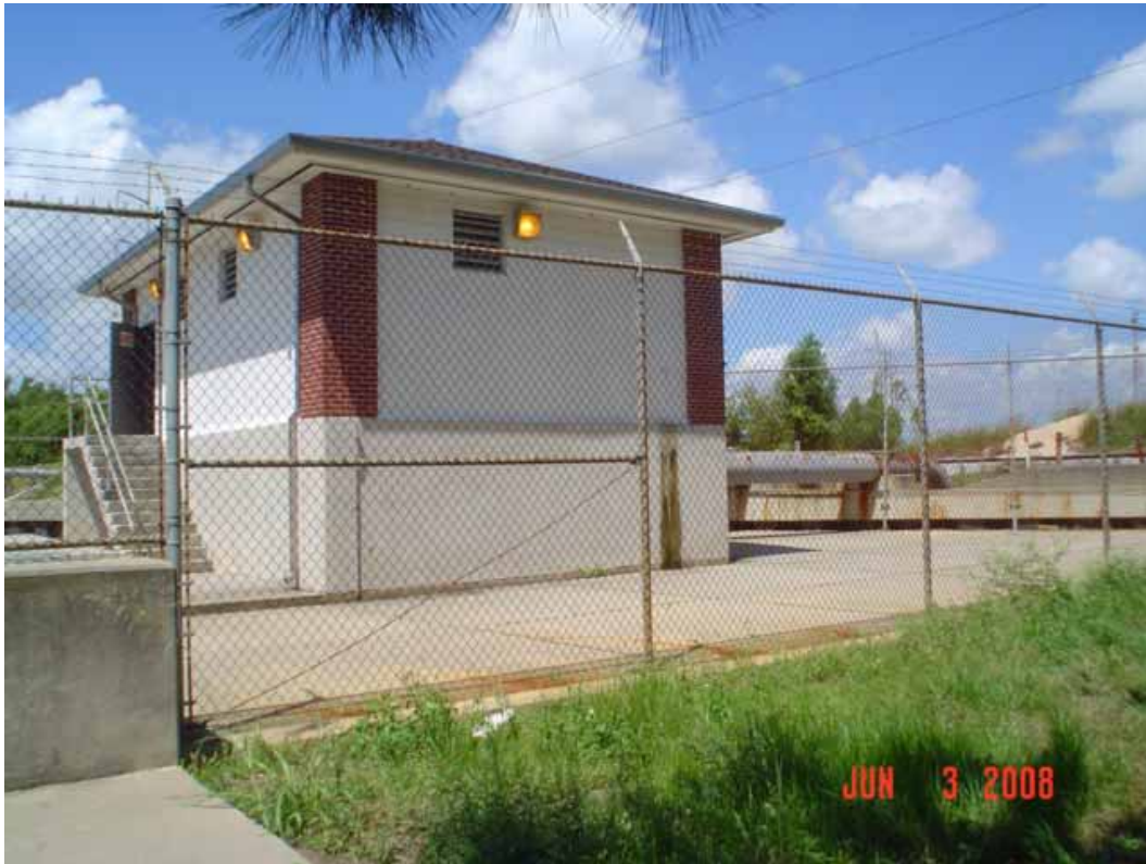
1. View of site as seen from the north direction.