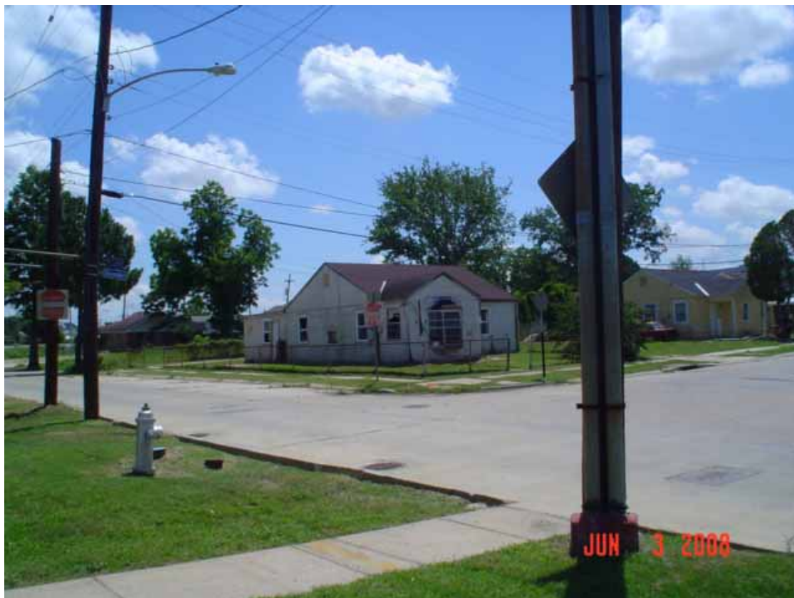
6. View of east area adjacent to the site, northeast corner.