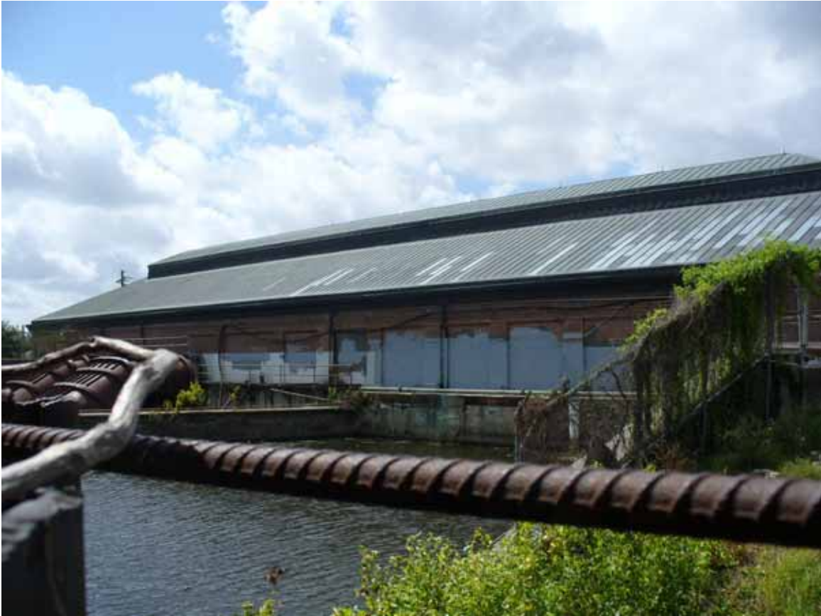
1. View of site as seen from the north direction.