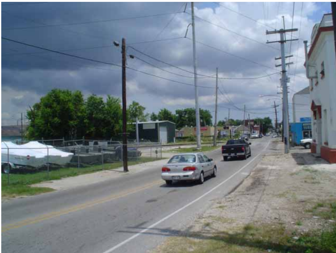
4. View of north area adjacent to the site, boat yard and transformer.