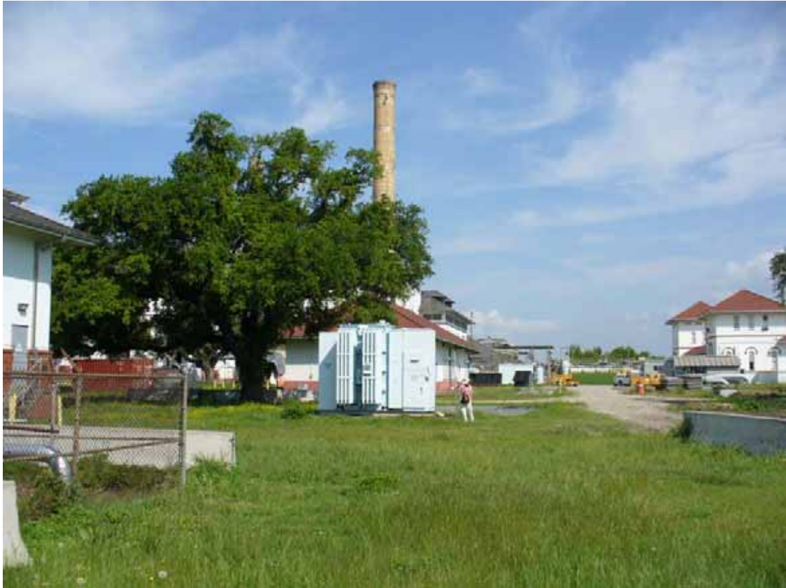
42. Transformer near gas line.