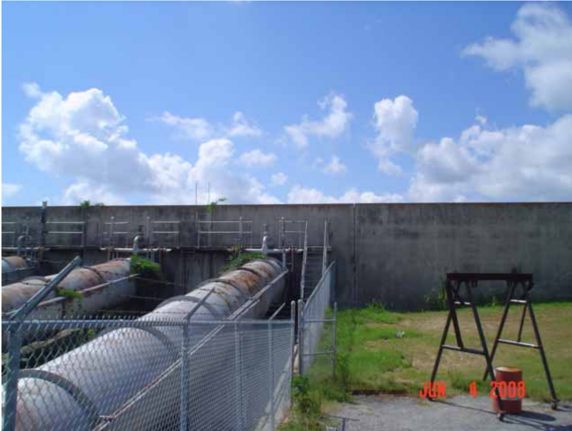
7. View of south area adjacent to the site.