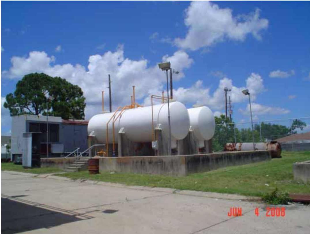
15. View of diesel fuel tanks in northwest area.