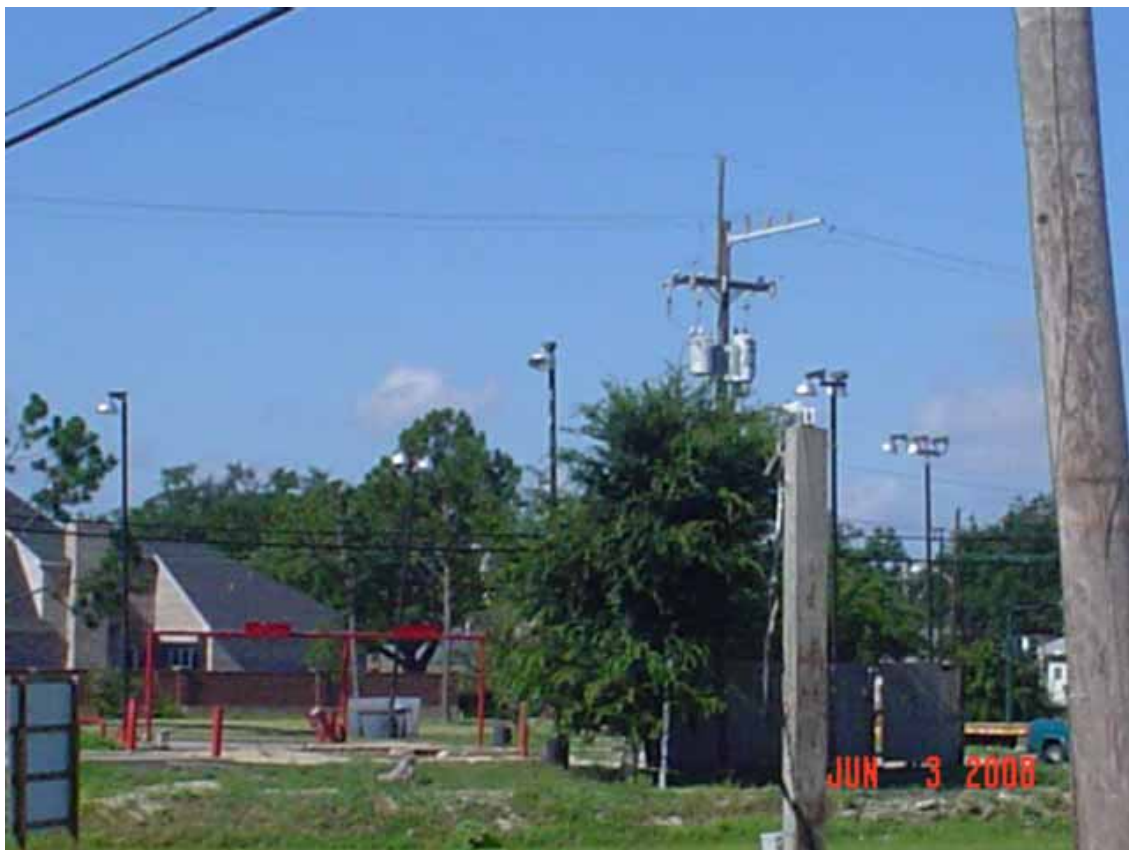
14. Partially demolished Rally's, in southwest area from site. Observe pole transformers in background.