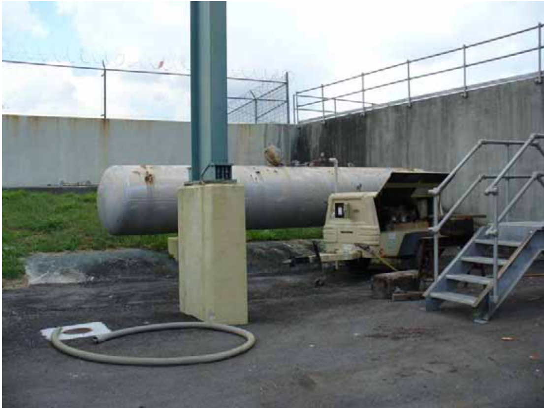
17. Empty propane storage tank observed in northeast area.