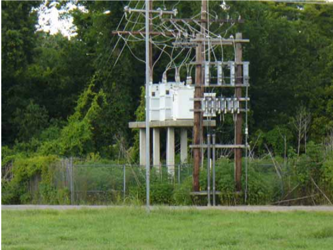
5. View of east area adjacent to the site. Observe transformers in southeast corner past property fence lines.