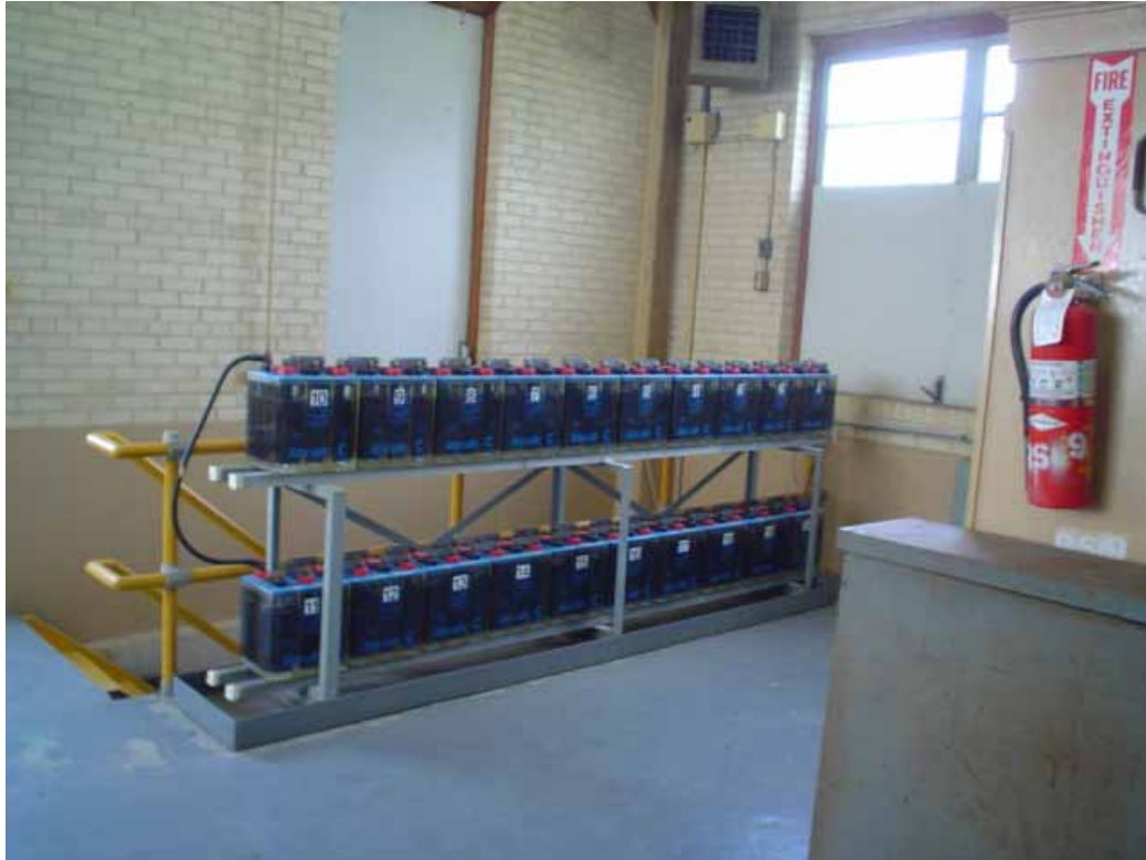
22. Battery bank.