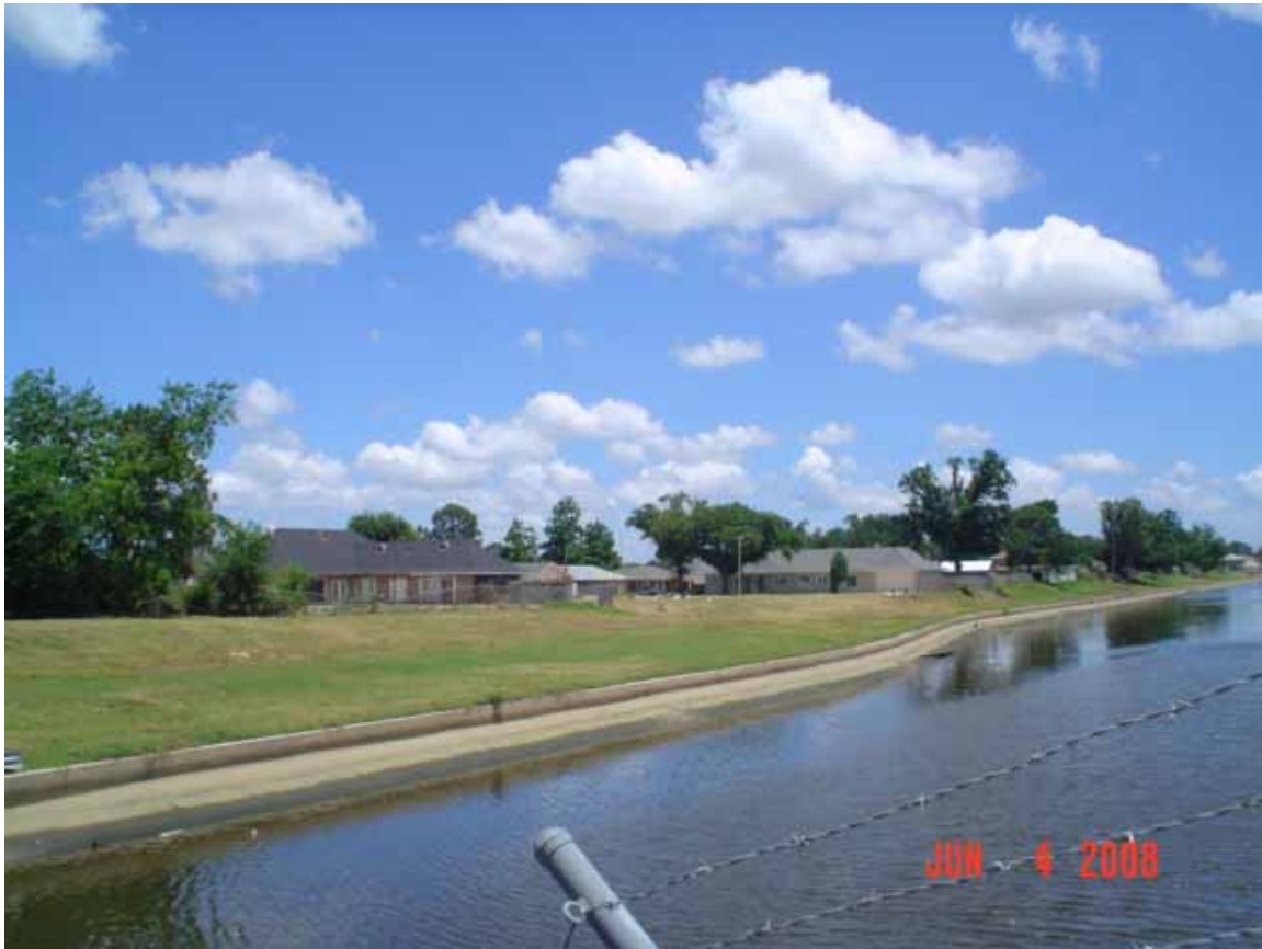
7. View of south area adjacent to the site, canal in southeast direction.