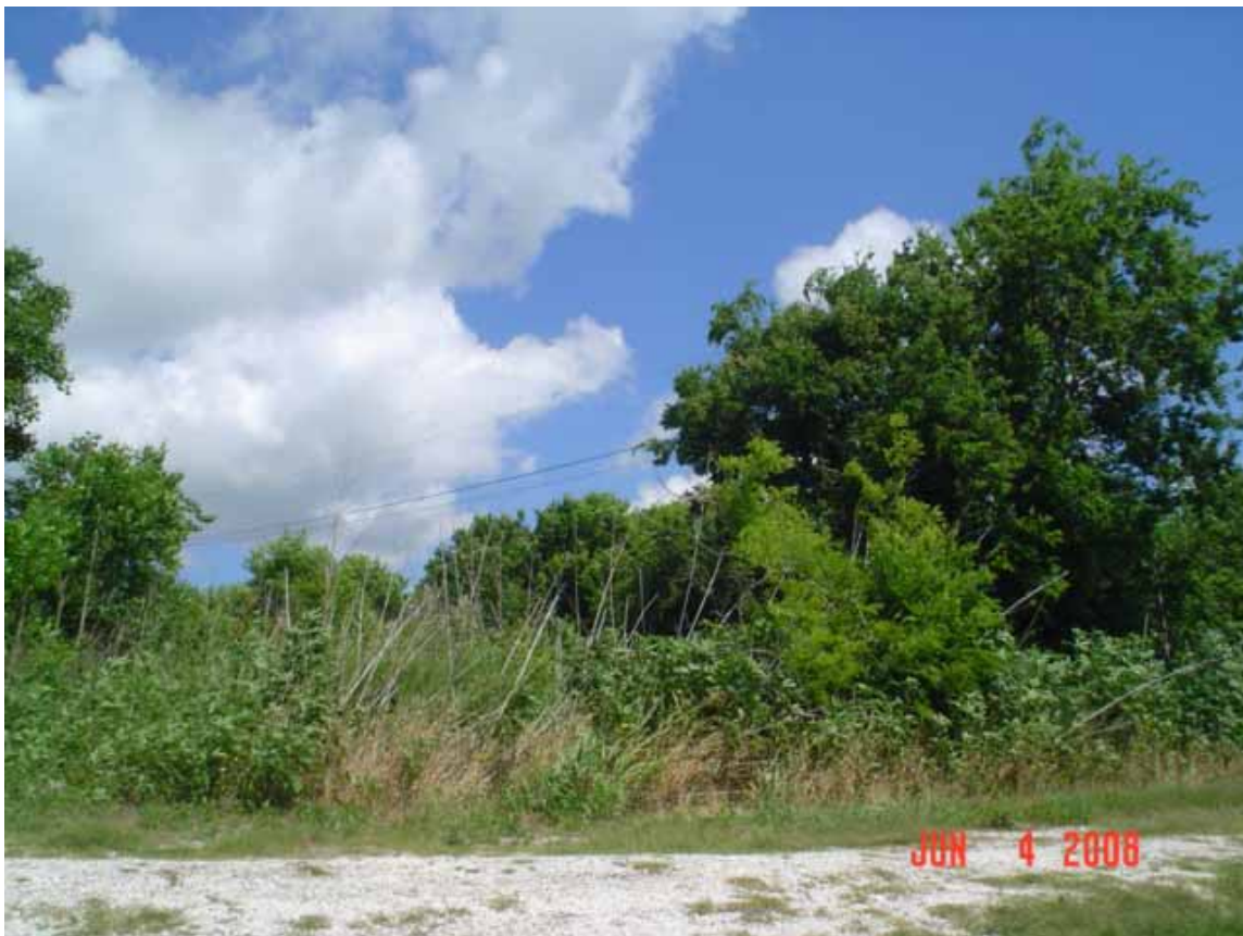
10. View of west area adjacent to the site.