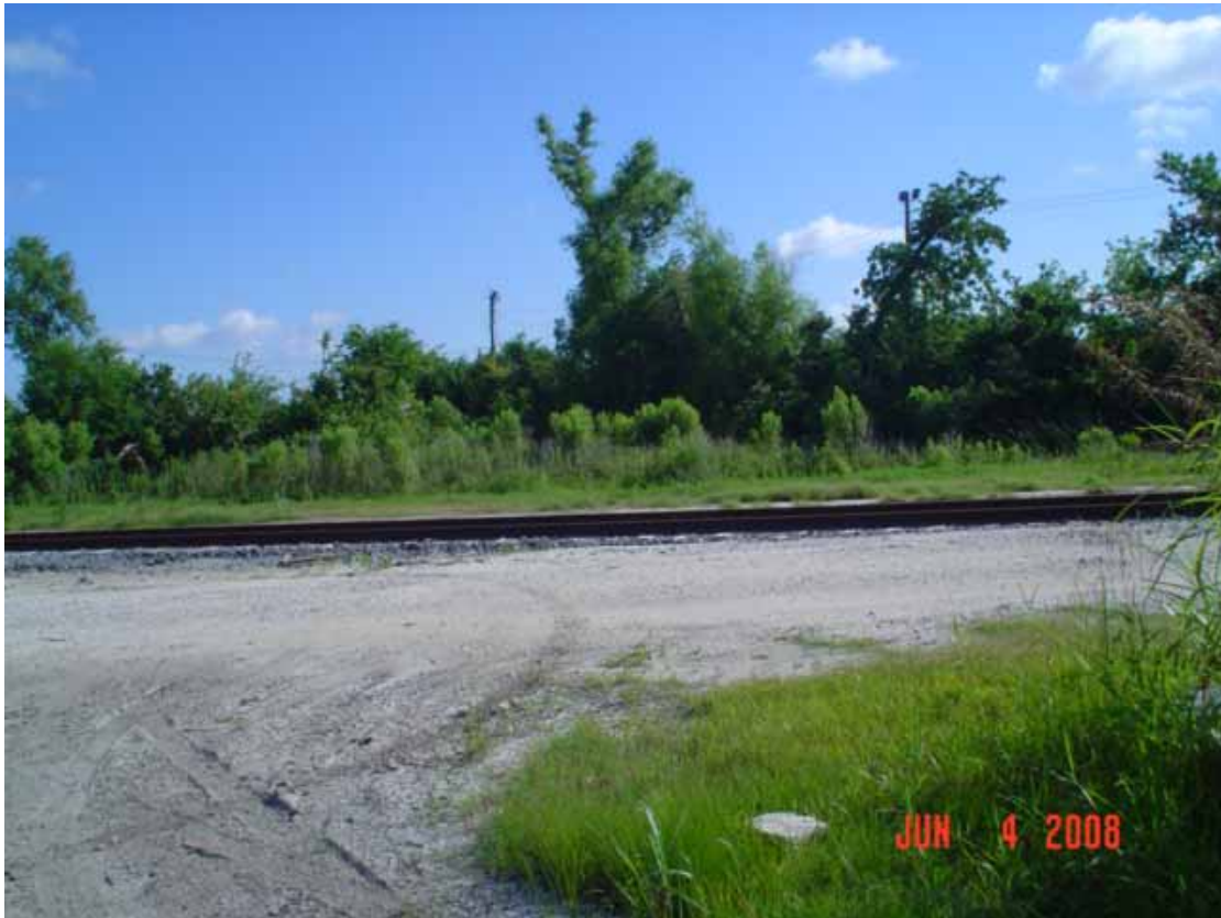
3. View of north area adjacent to the site, showing railroad tracks, northeast corner.