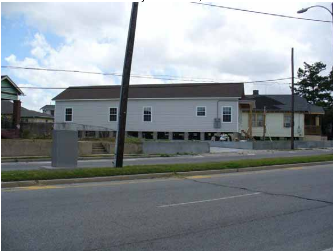
8. View of east area adjacent to the site, across North Broad, in southeast area.