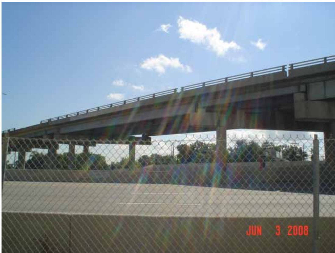
6. View of east area adjacent to the site.