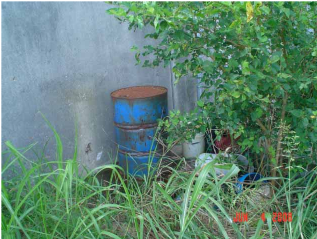
14. Drum and refuse at flood wall.