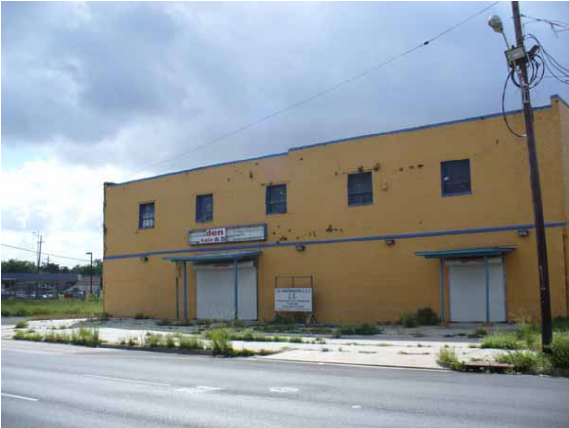
11. View of south area adjacent to the site, abandoned building in southeast corner.