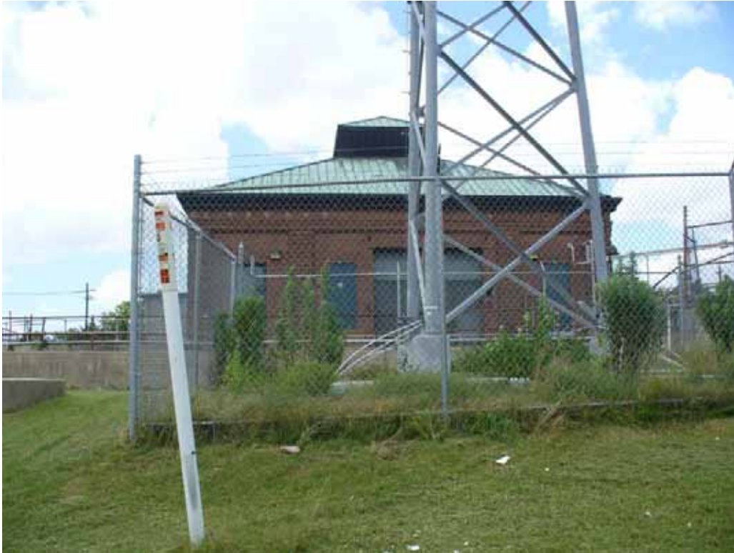
5. View of site as seen from the east direction, including buried fiber optic cable post.