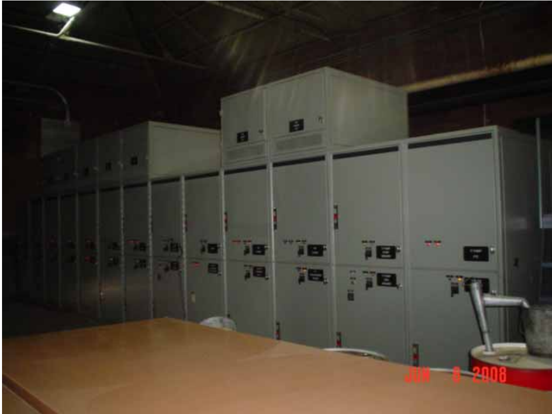
21. View of switches inside building.