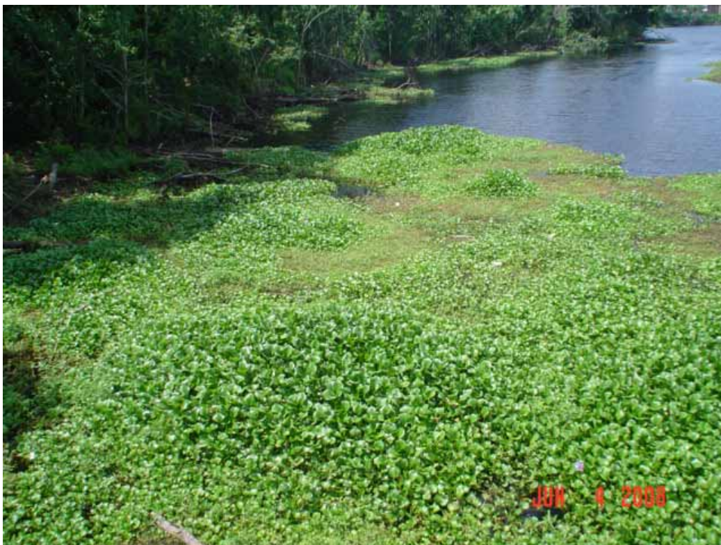
14. Aquatic plants growing next to station.