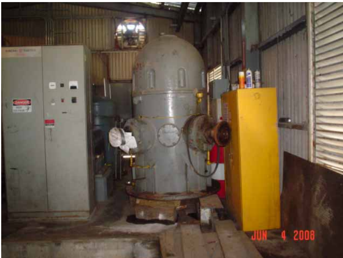
16. Various equipment inside building. Shows vertical pump that had been removed for repairs. Observe stains to concrete floor.