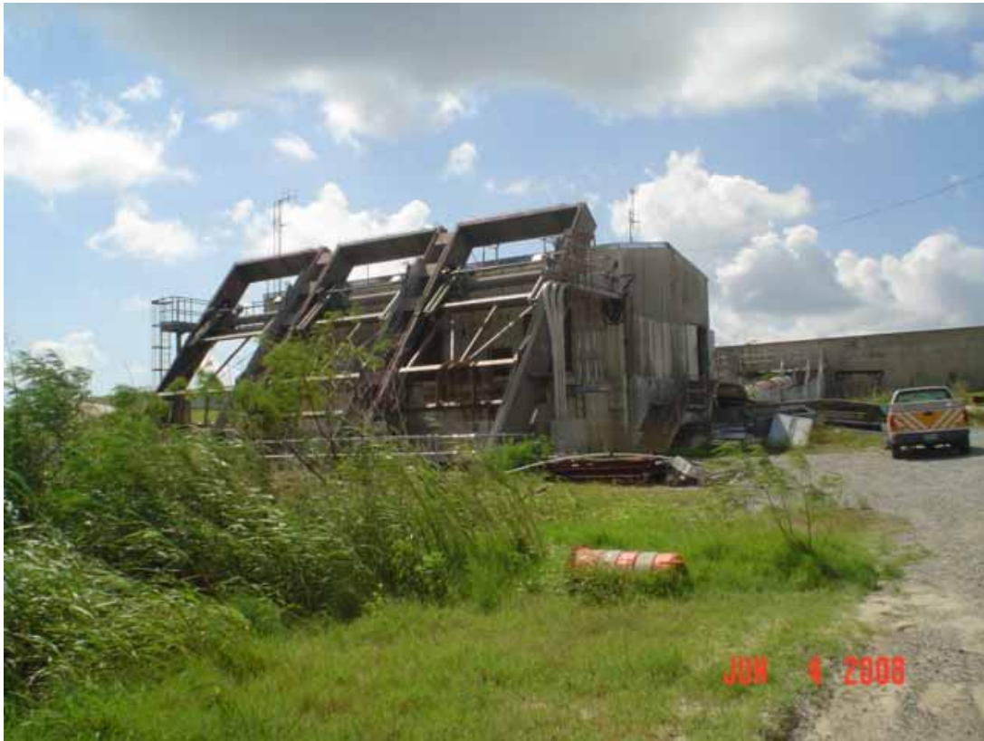
1. View of site as seen from the north direction.