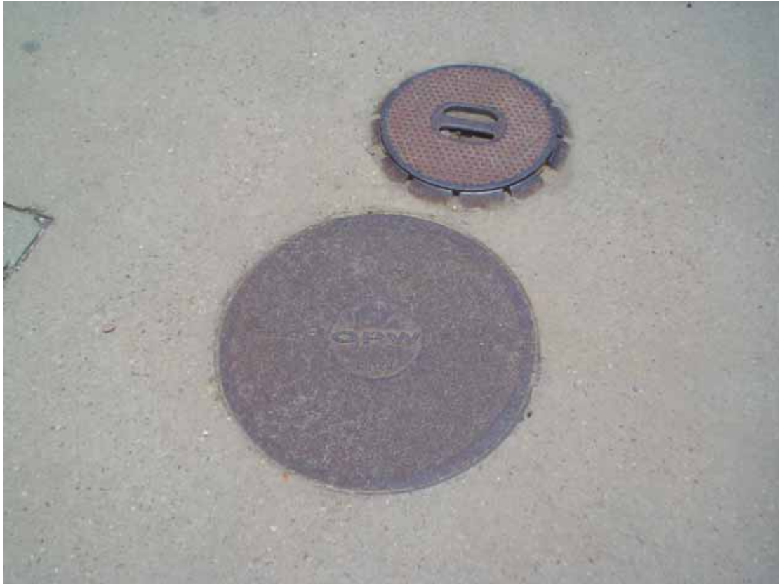
94. Close up of UST cover plates.