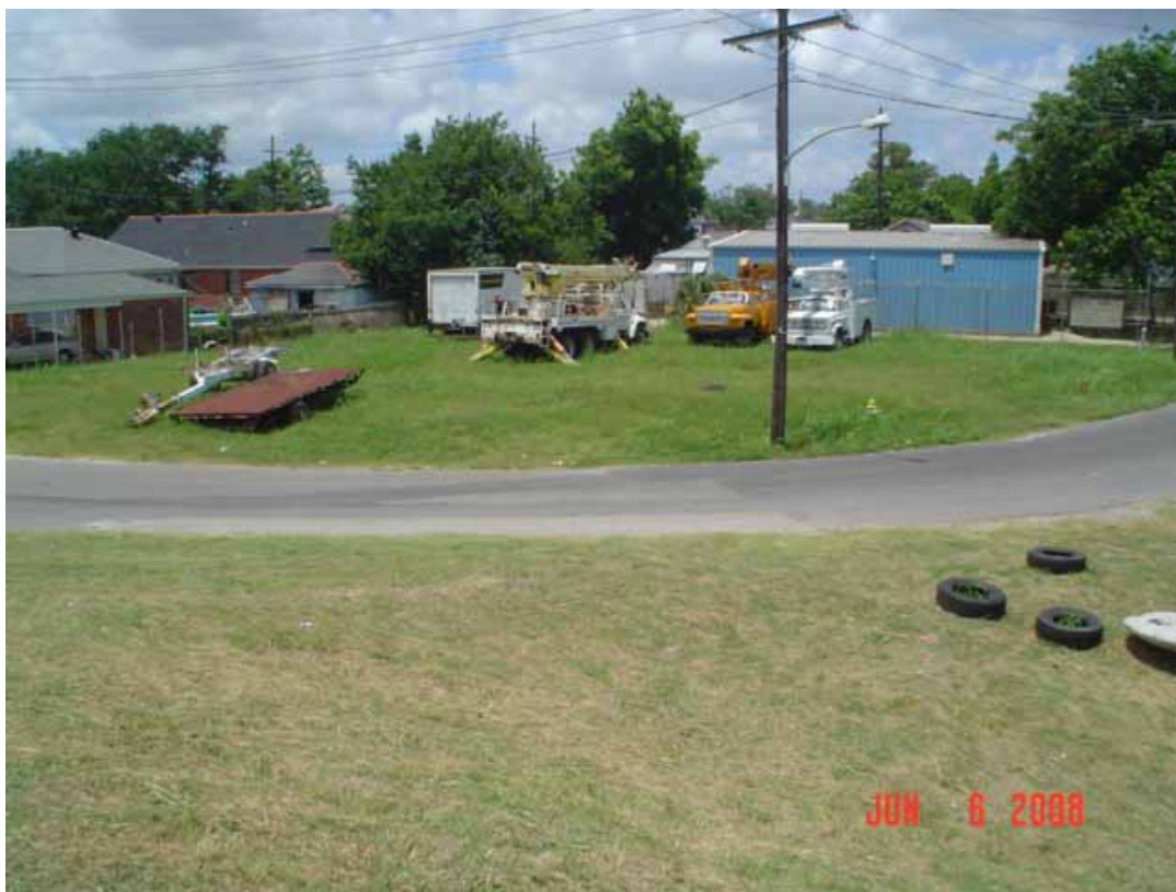
14. View of west area adjacent to the site, showing Real Wood Company and empty lot locations. Observe abandoned tires in north area.