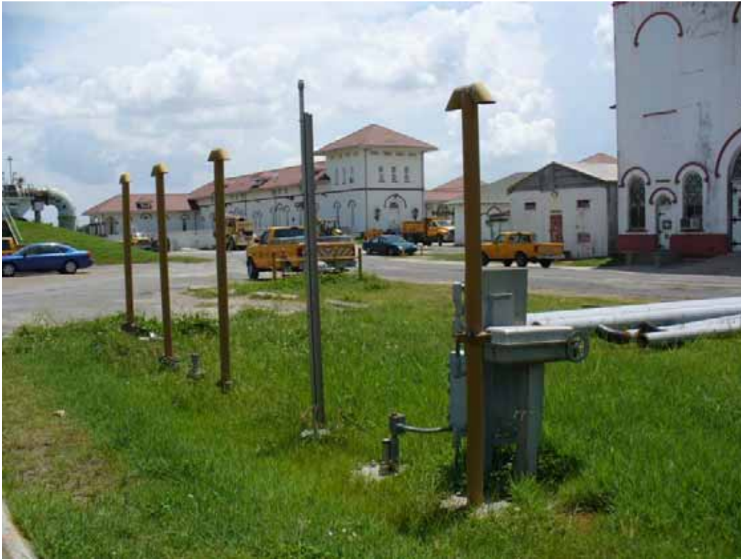
72. Location of underground storage tank with four vents.