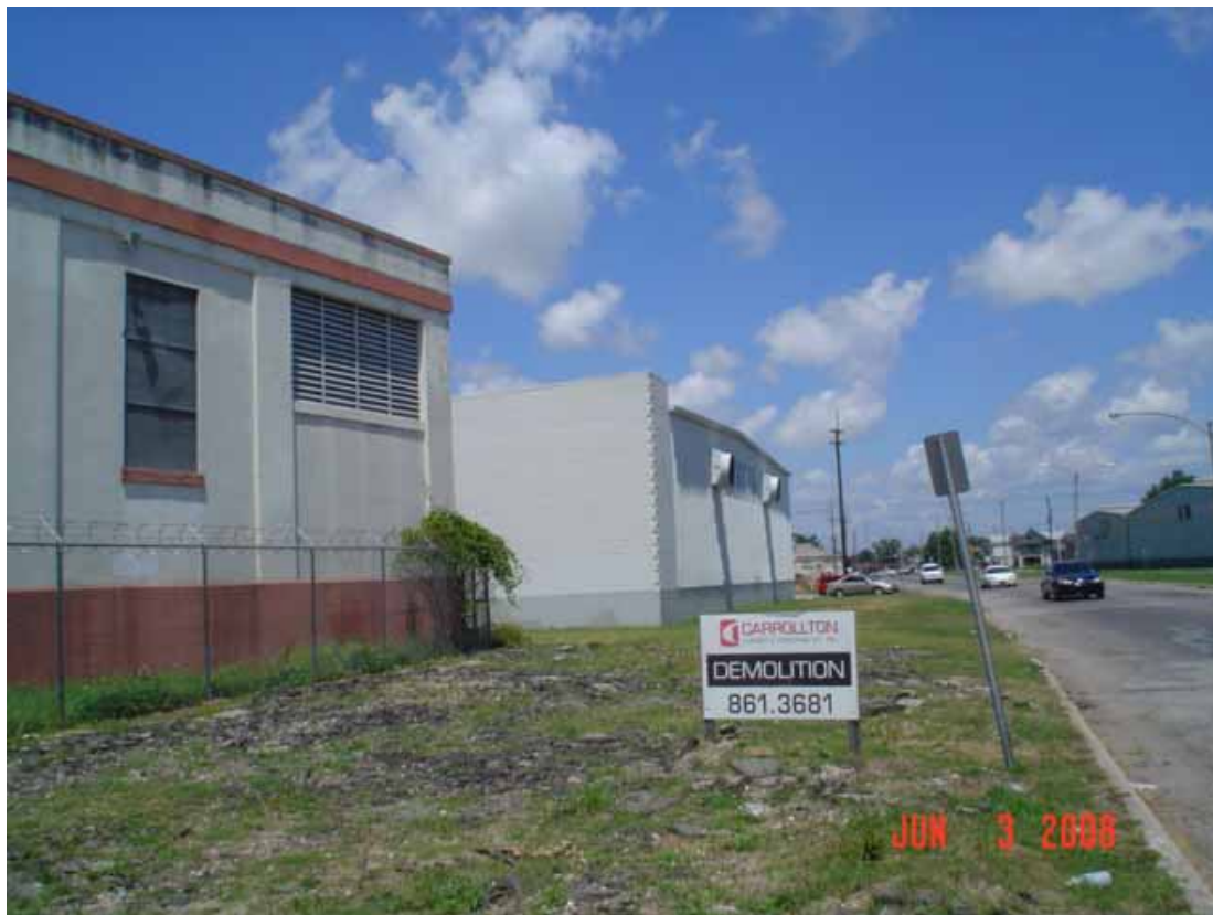
2. View of site as seen from the north direction, right side.