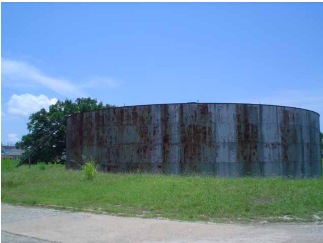
91. One and a half-million gallon diesel tanks on site in southwest area, one empty.