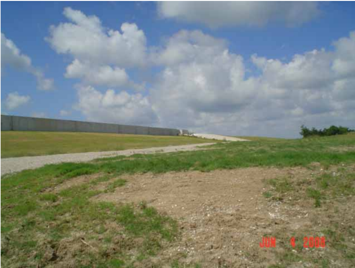
9. View of west area adjacent to the site, southwest corner.