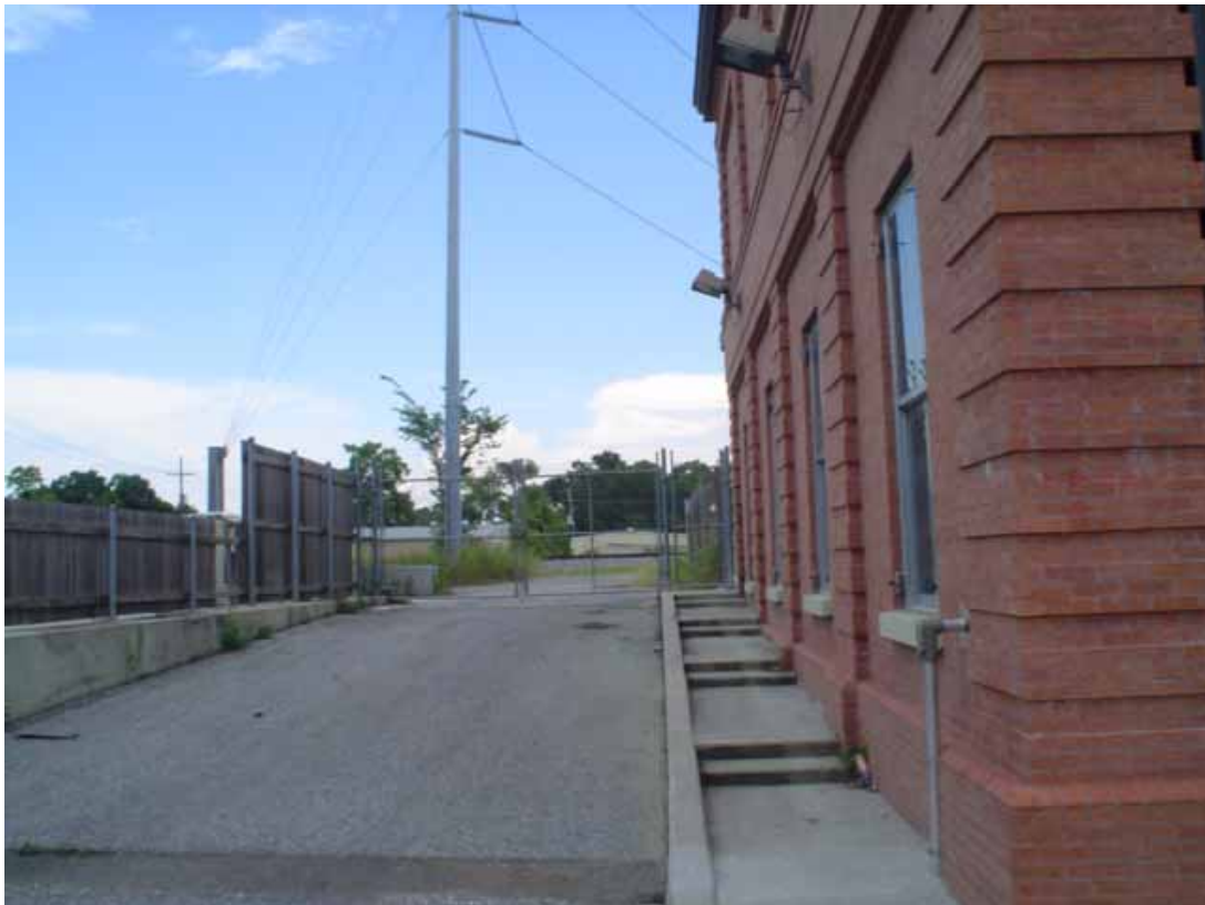
14. View of site as seen from the west direction.