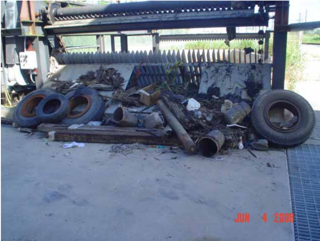
17. Refuse from canal.