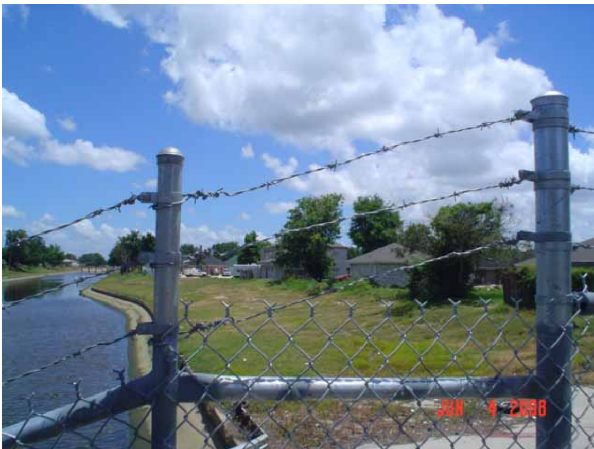
8. View of south area adjacent to the site, canal in southwest direction.