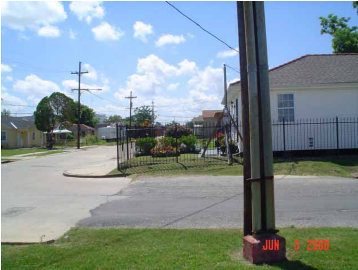
5. View of east area adjacent to the site, southeast corner.