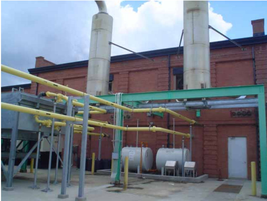
17. Oil and lubricant tanks, northwest corner of building.