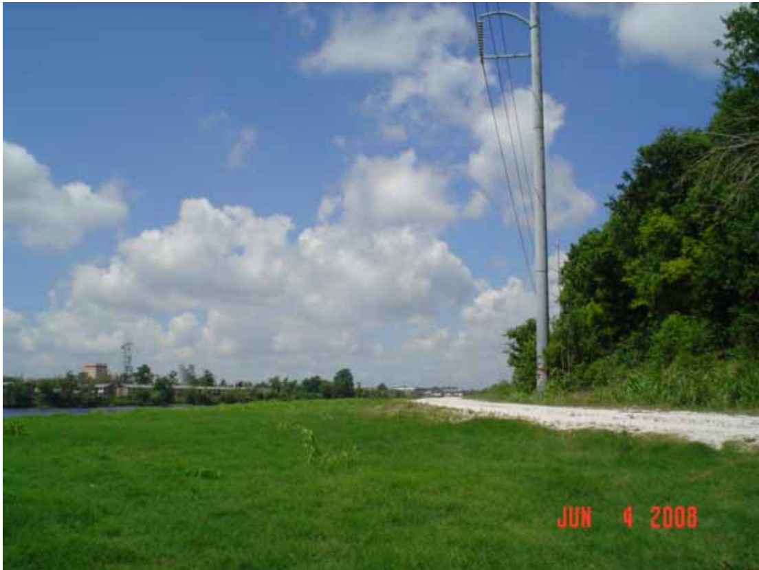
7. View of south area adjacent to the site, west.