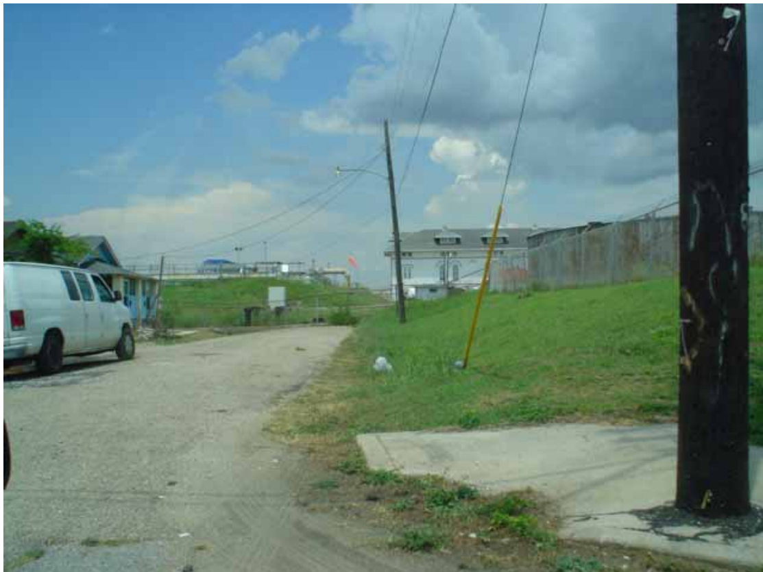
17. View of south of site from intersection of Cohn and Hollygrove Streets.