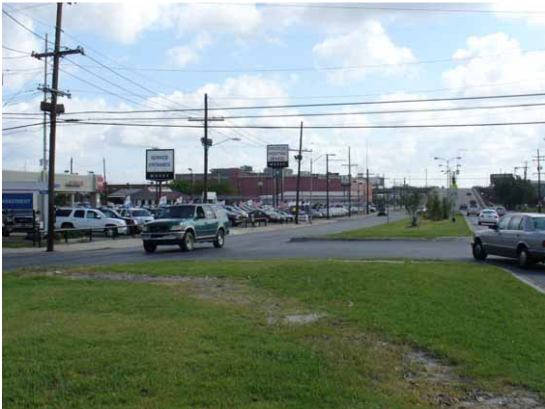
6. View of east area adjacent to the site, with car dealership in background.