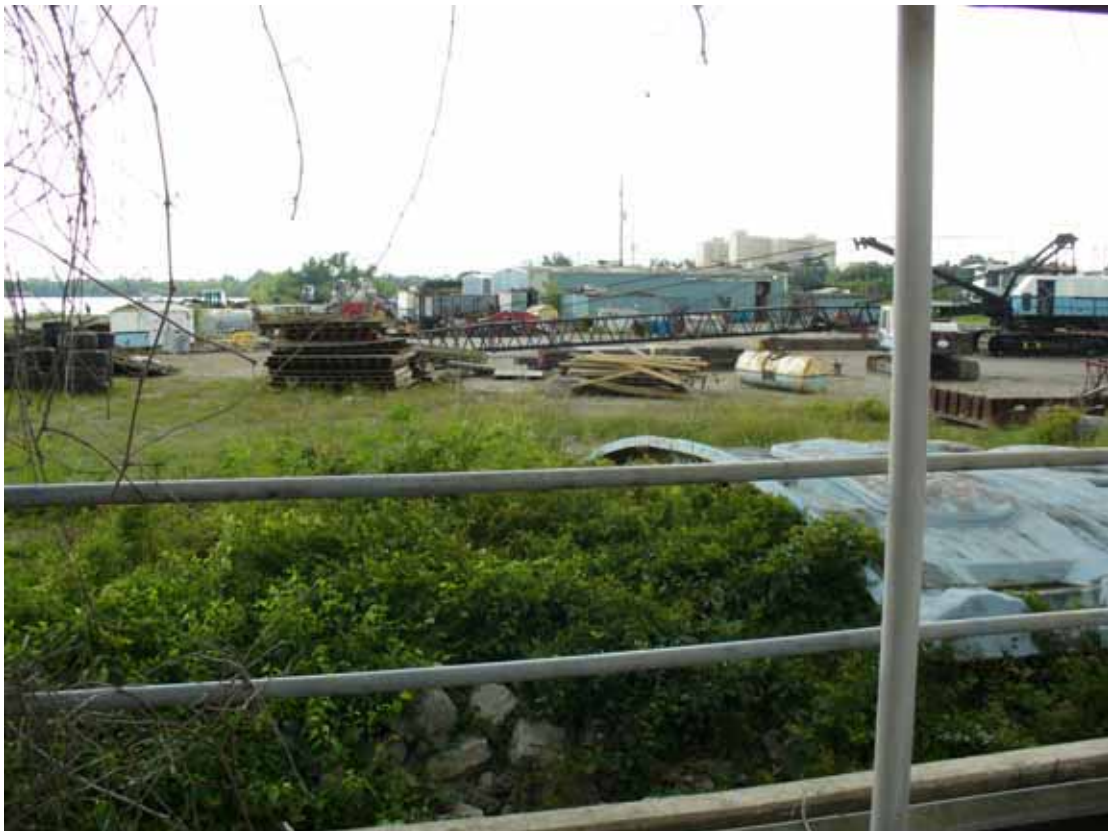
10. View of west area adjacent to the site, adjacent industrial area.