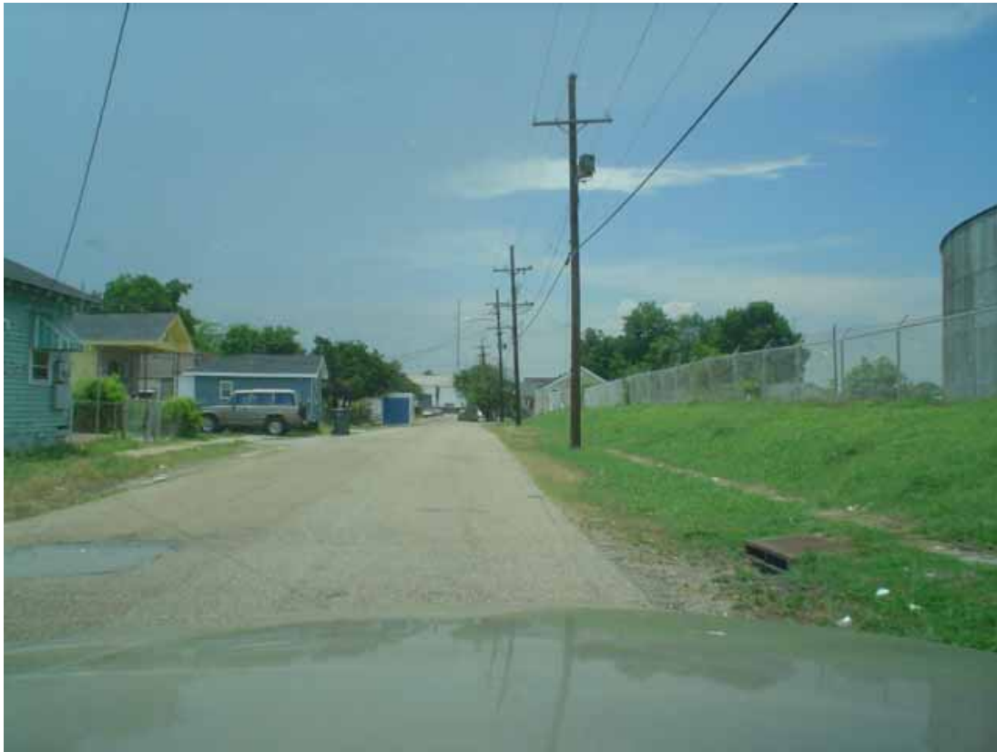
16. View of site and Cohn Street looking from east to west.