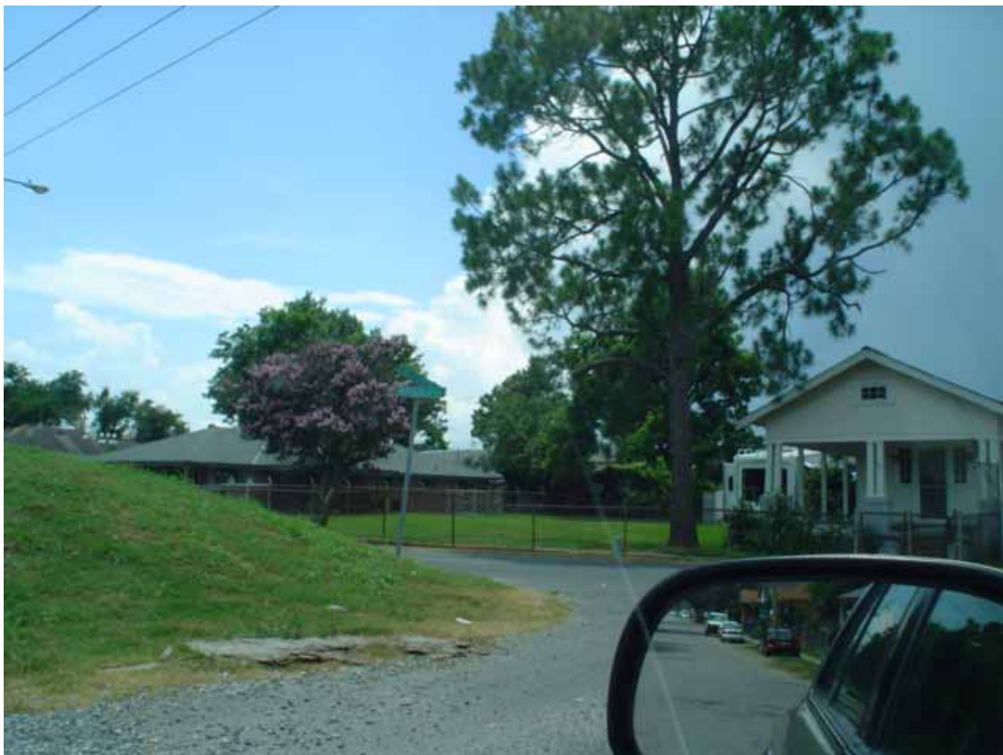
21. View of Monticello Avenue from southwest corner of site looking southwest.