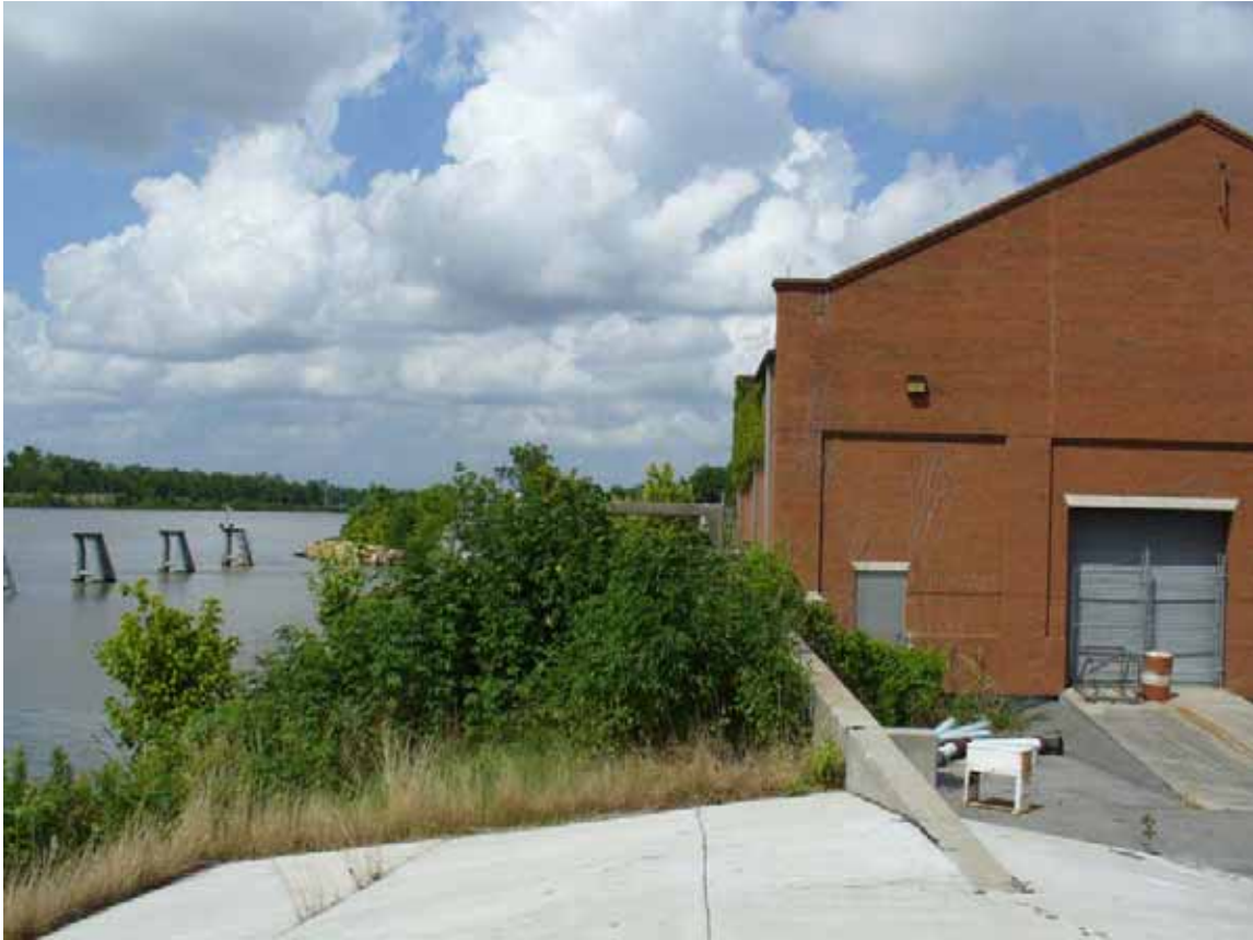
1. View of north area of site as seen from the west direction.