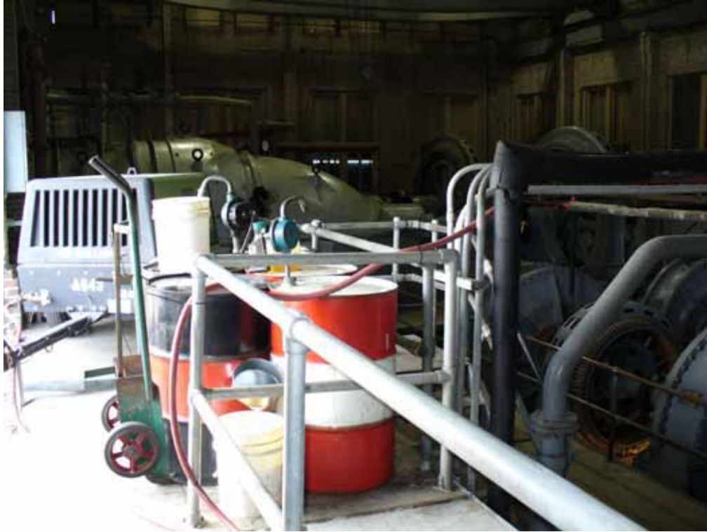
15. Drums and pumps inside building.