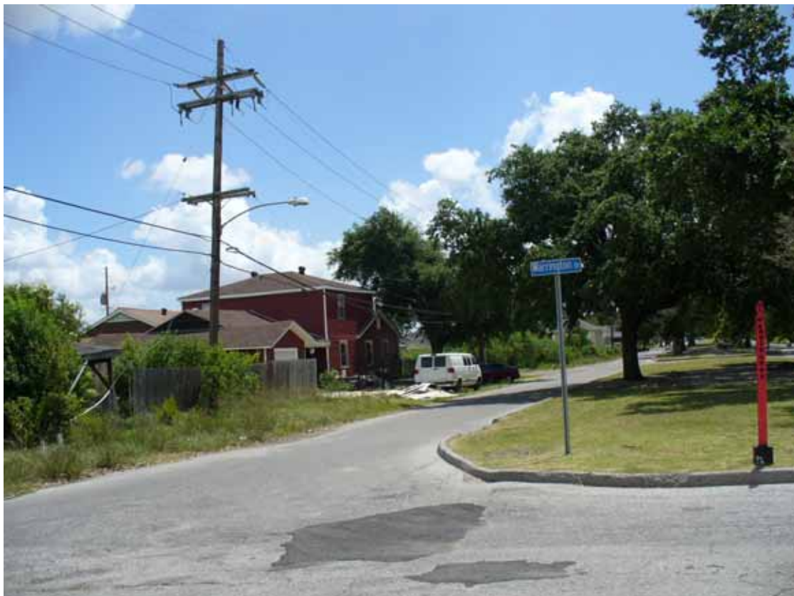
6. View of east area adjacent to the site, Prentiss Avenue.