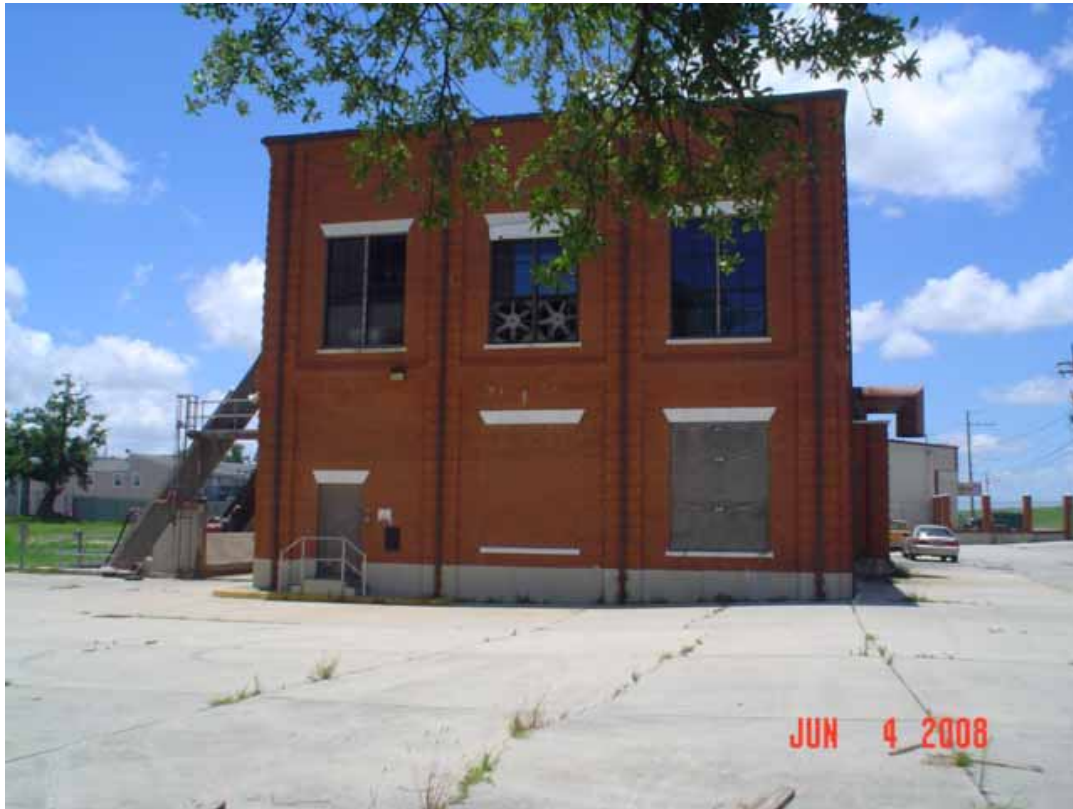
3. View of site as seen from the east direction.