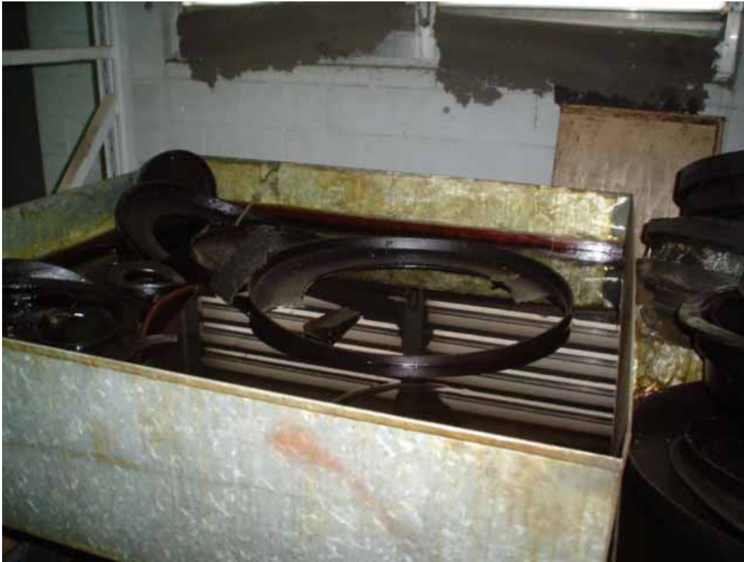
114. Open metal container with gaskets soaking in oil.