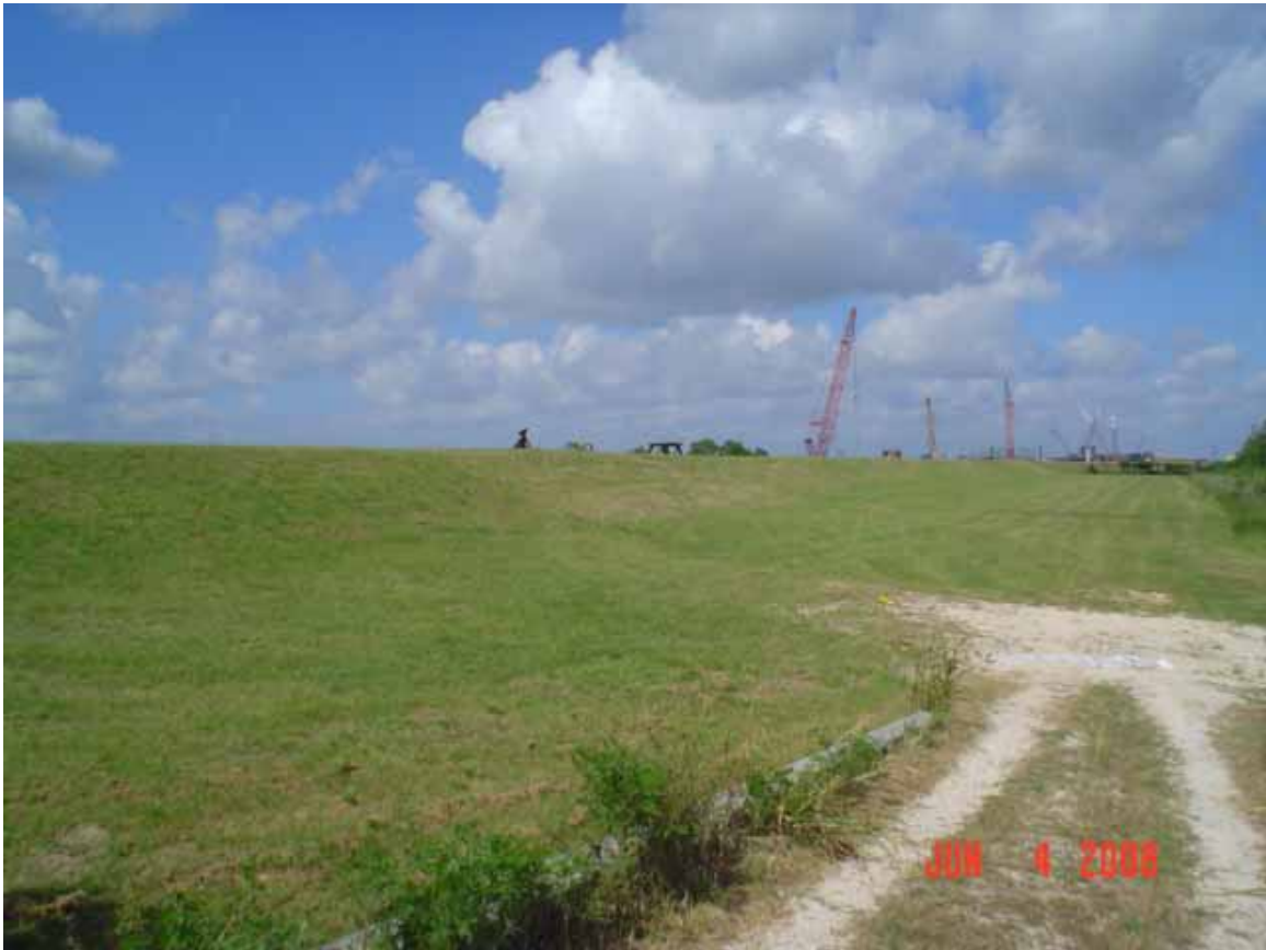
9. View of south area adjacent to the site, southwest corner.