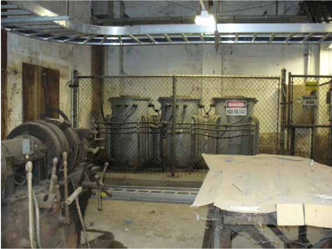
62. Transformers in basement of boiler room.