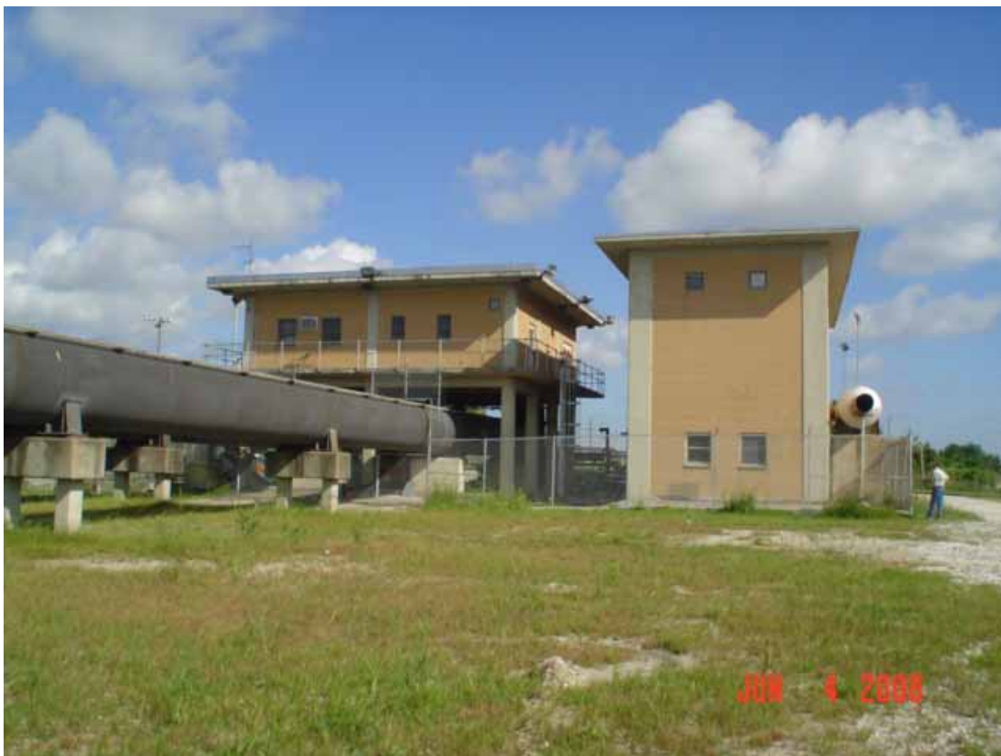
8. View of site as seen from the south direction.