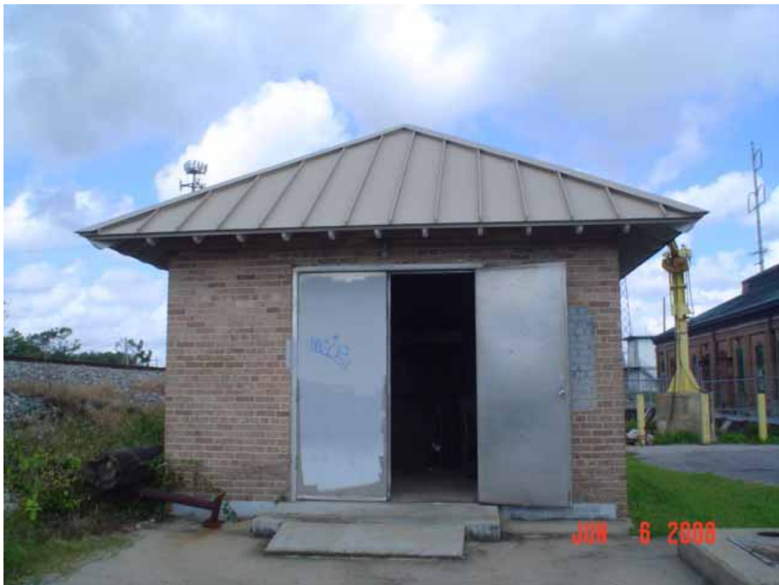
14. Underpass pumping station