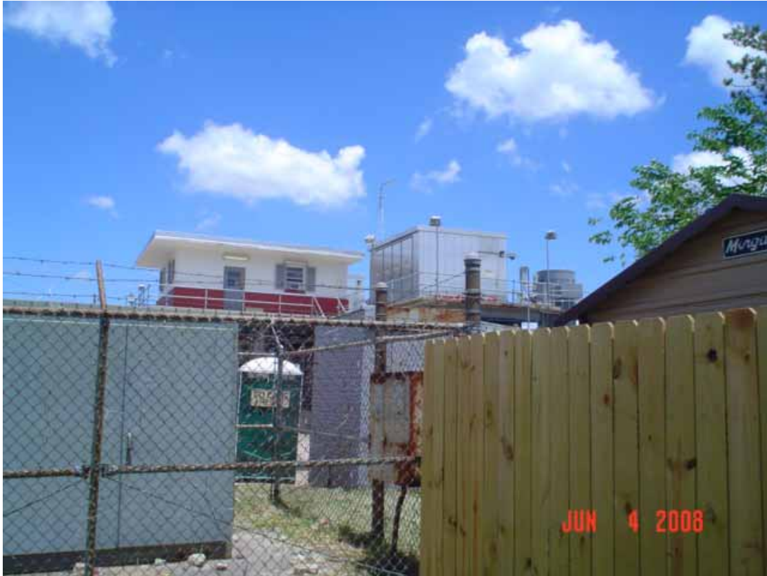
9. View of site as seen from the west direction.