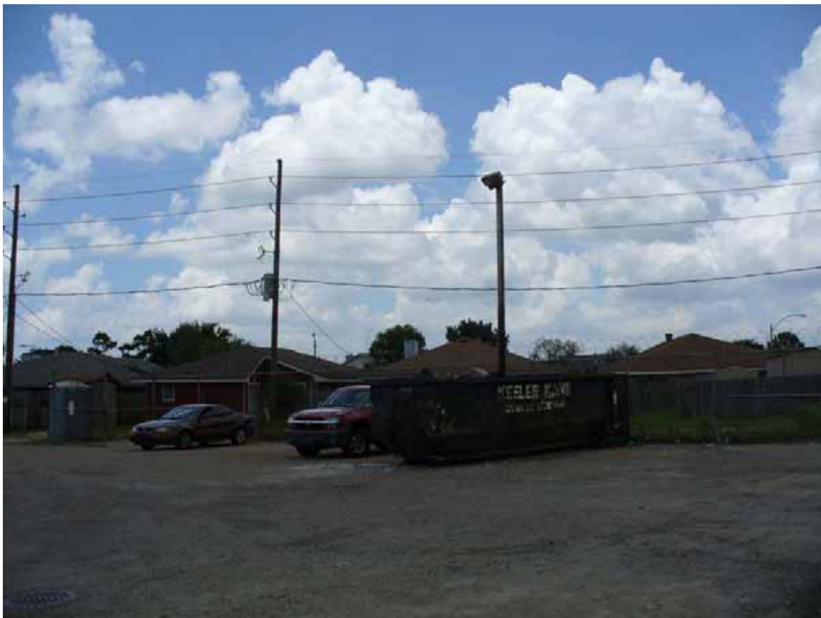
6. View of northwest area adjacent to the site. Reportedly, a septic tank is located near gate entrance.