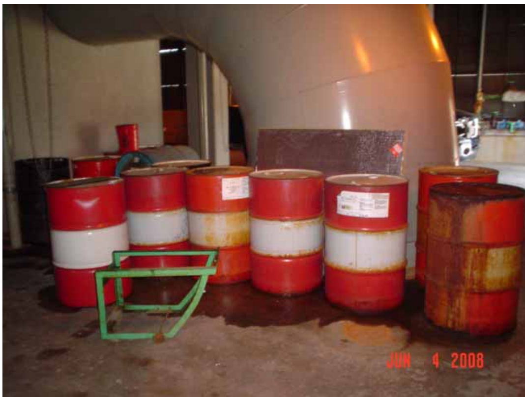
14. Leaky 55 gallon drums inside building.