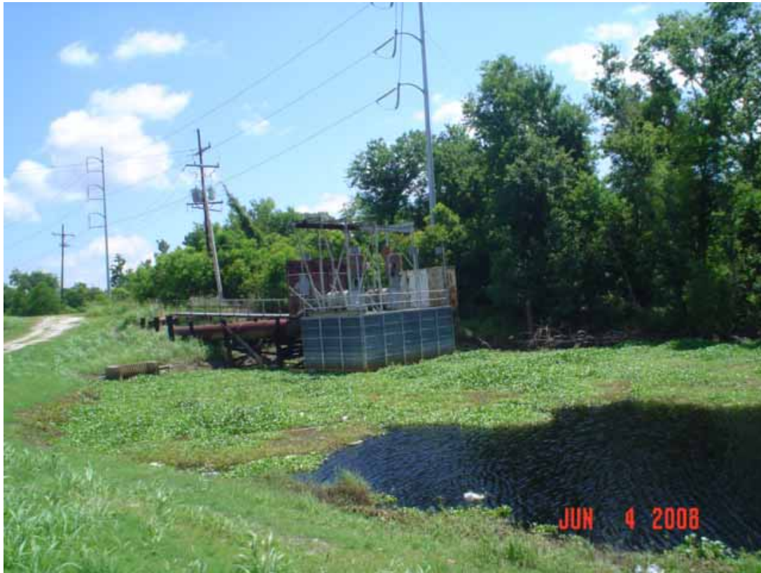
5. View of site as seen from the south direction.