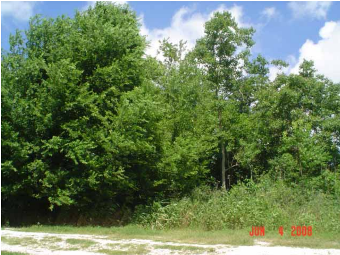
9. View of west area adjacent to the site, southwest corner.