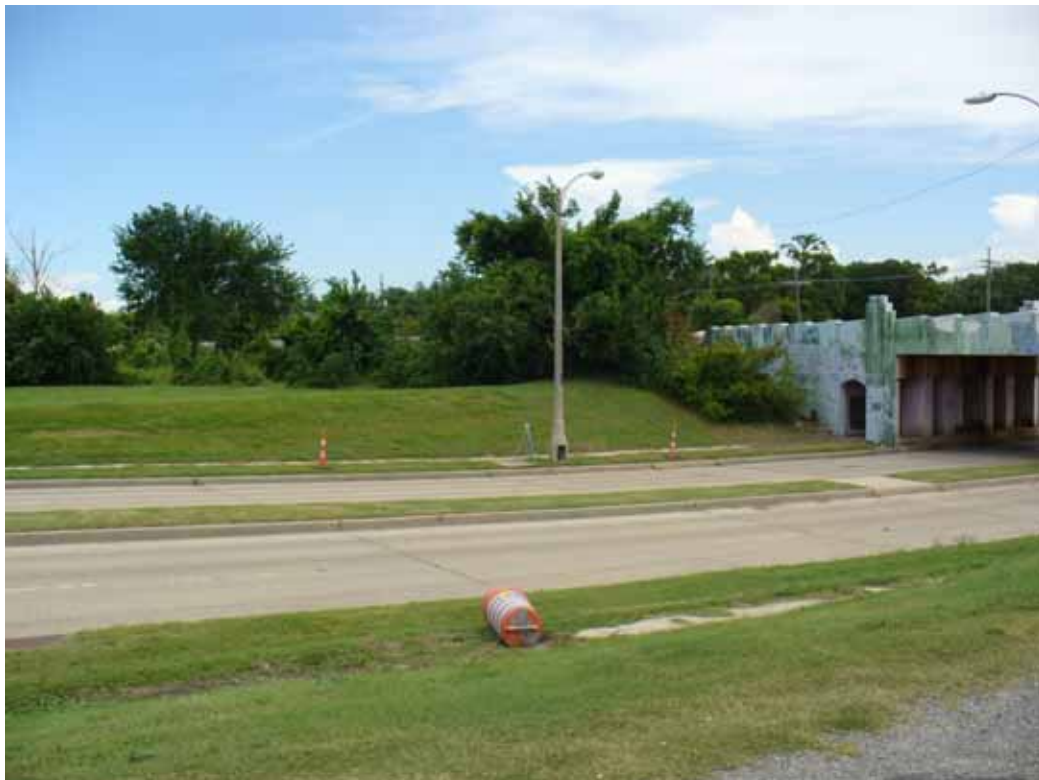
6. View of east area adjacent to the site, railroad bridge.