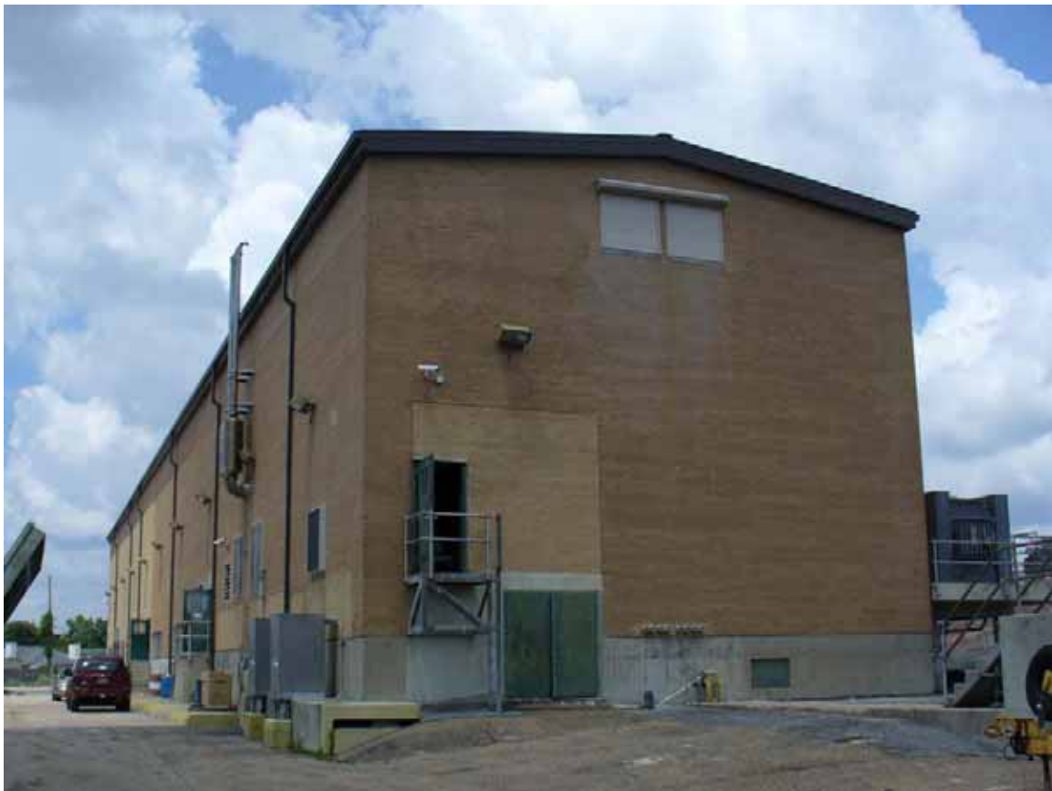
10. View of site as seen from the south direction.