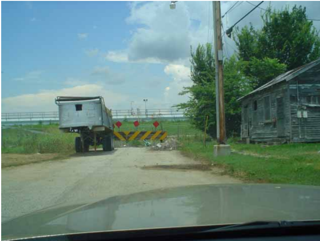
18. View of south of site from intersection of Cohn and Hamilton Streets.