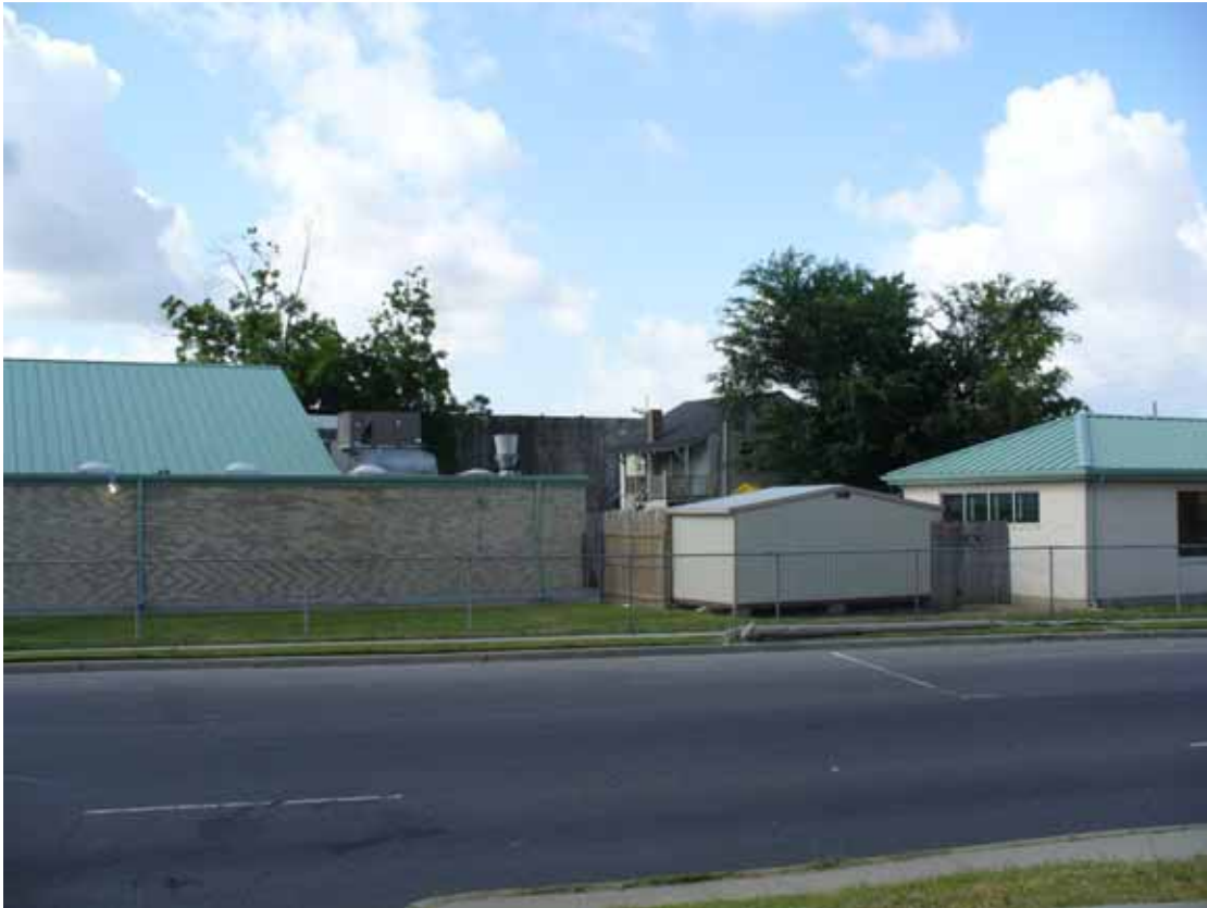
9. View of south area adjacent to the site, showing residential and commercial buildings.