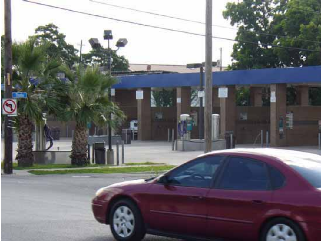
7. View of east area adjacent to the site, showing self carwash.