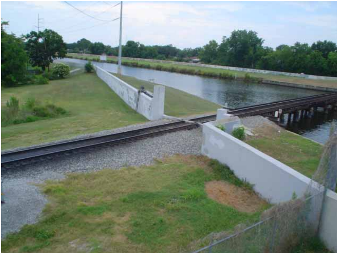
2. View of north area adjacent to the site, 17 th Street canal.