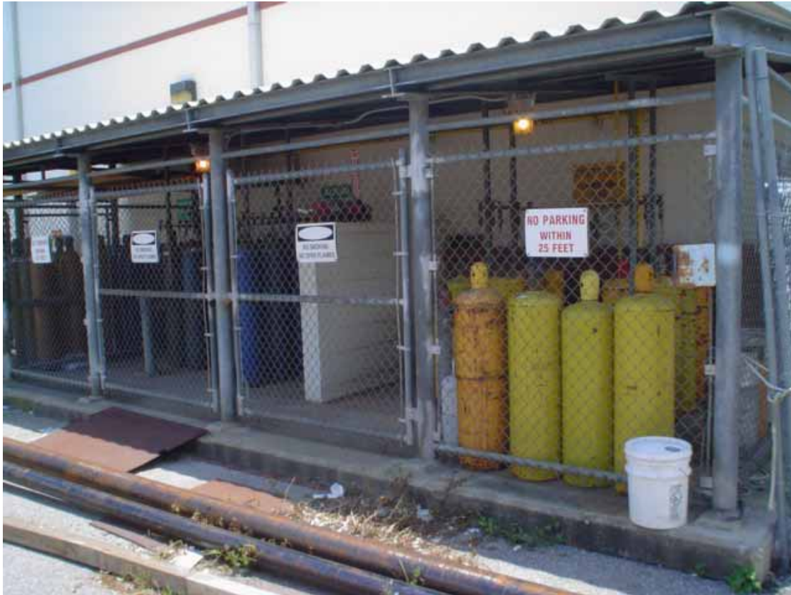
102. Welding tanks located at northwest corner of the welding and fabrication shop.