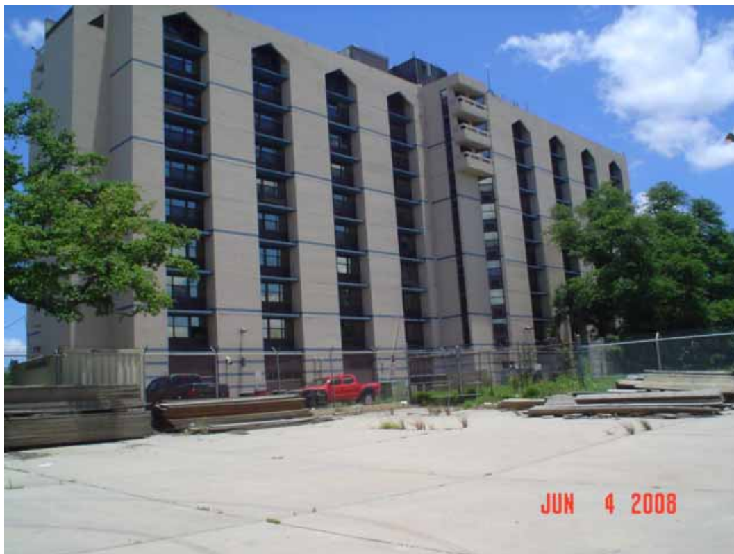
4. View of east area adjacent to the site, southeast corner.