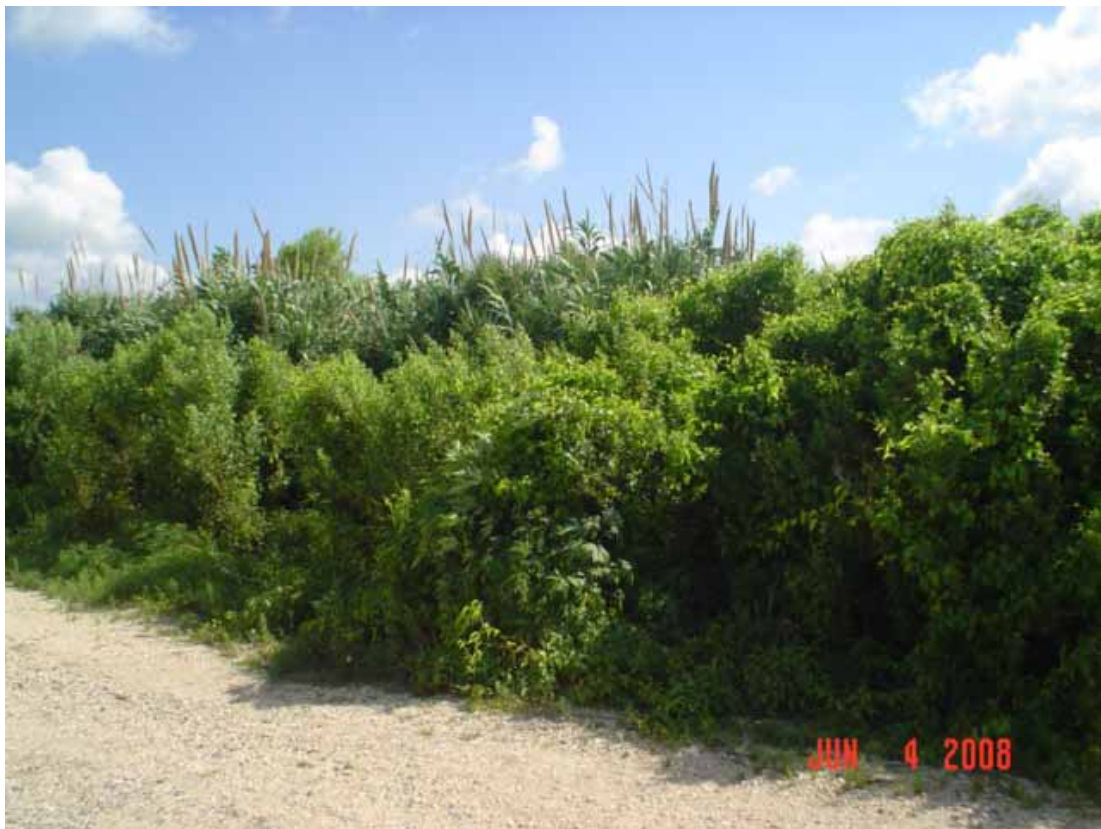
6. View of east area adjacent to the site, northeast corner.