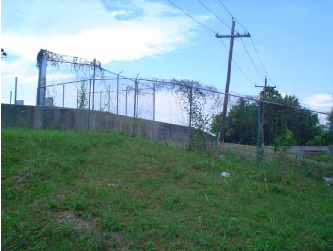
9. View of east area adjacent to the site, levee and flood wall, northeast corner.