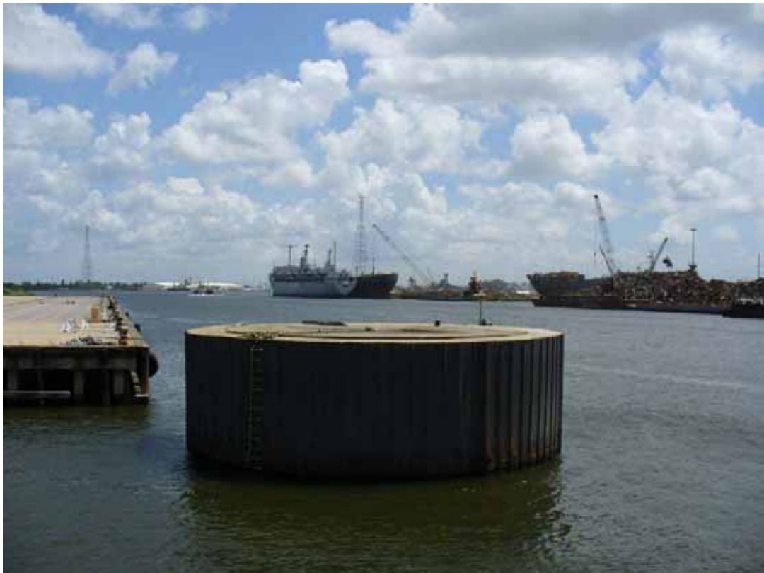
4. View of Dolphin located in north area adjacent to the site.