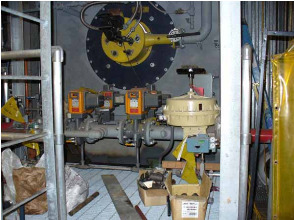
56. New pump in boiler building.