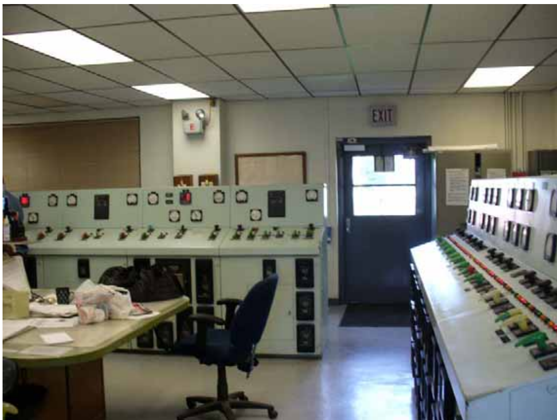
47. Controls inside central control building.