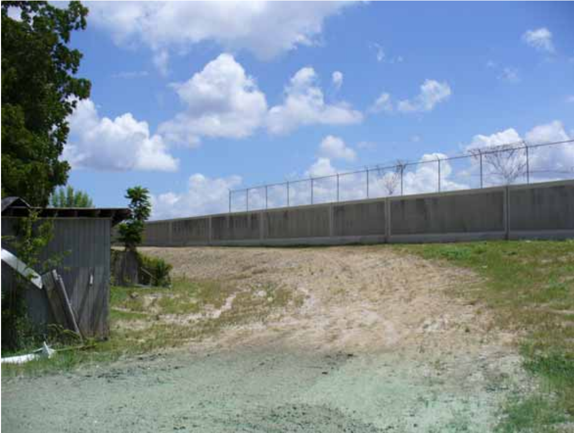
11. View of west area adjacent to the site.