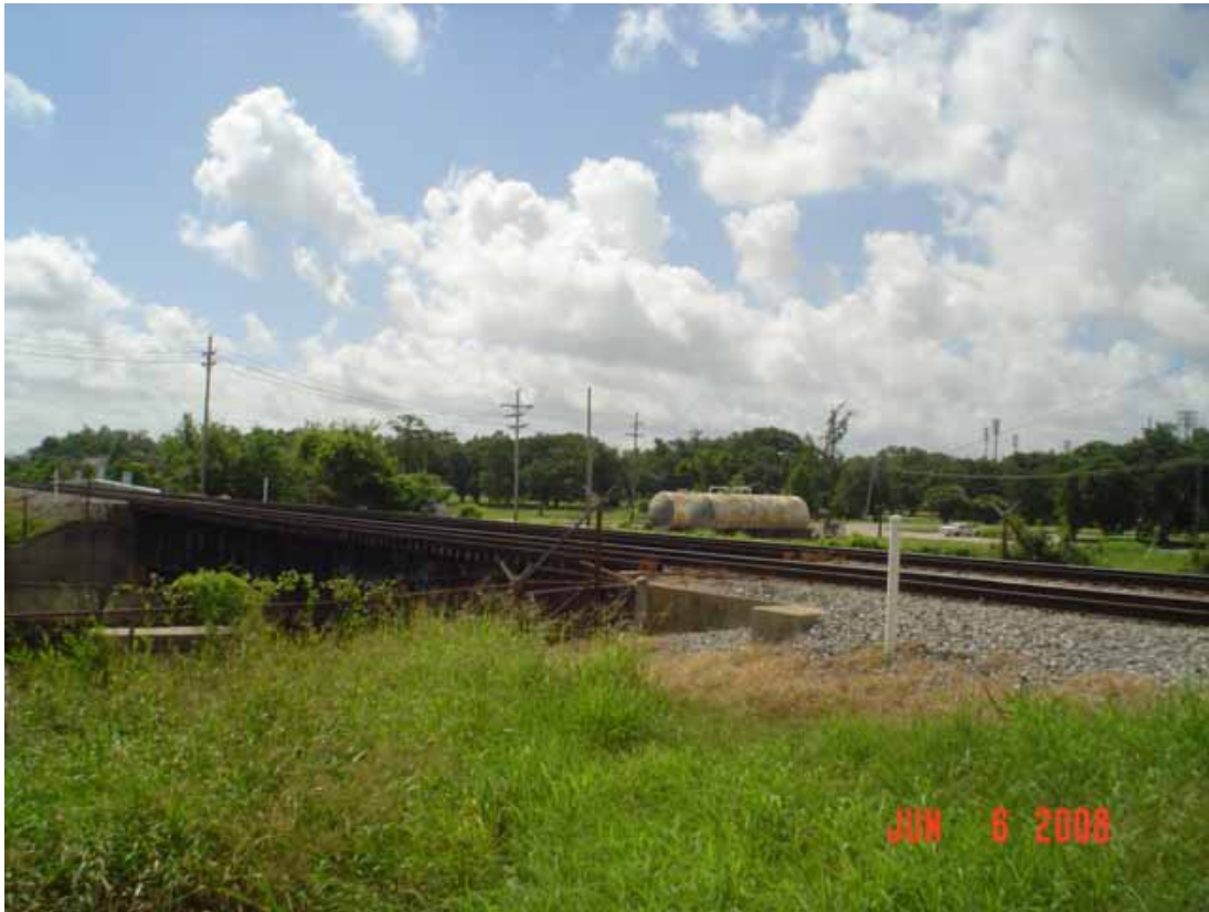
9. View of south area adjacent to the site, including empty chlorine tanks.