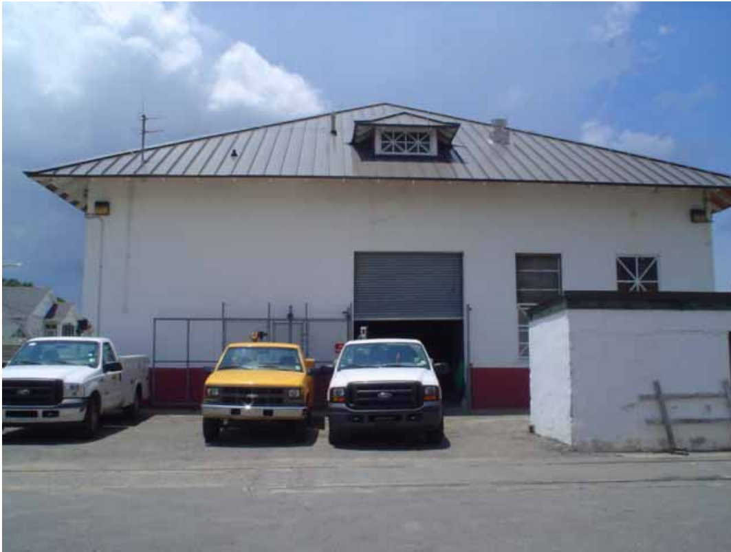
106. East side of meter shop.