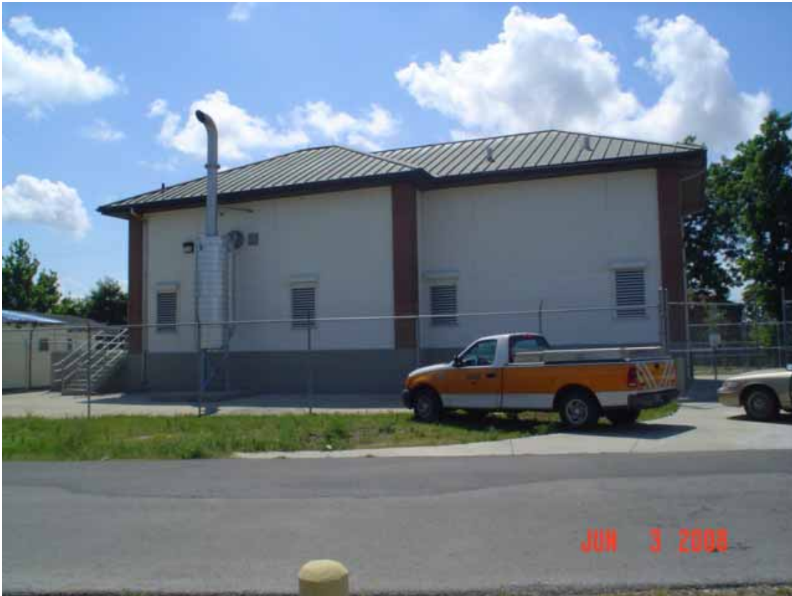
7. View of site as seen from the west direction.