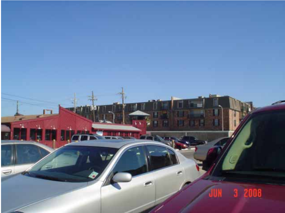
3. View of northwest area adjacent to the site, with apartments and restaurant. Observe transformers on poles in background across street.