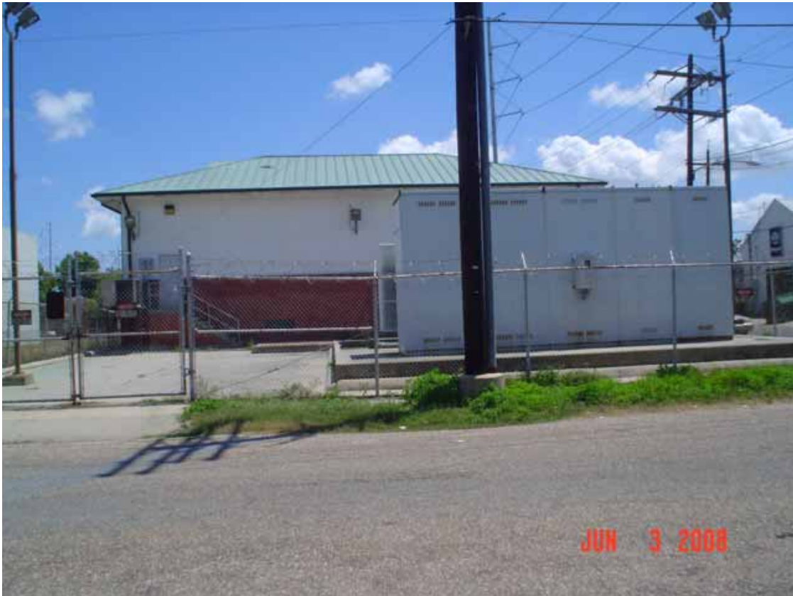
9. View of site as seen from the south direction, including transformers.