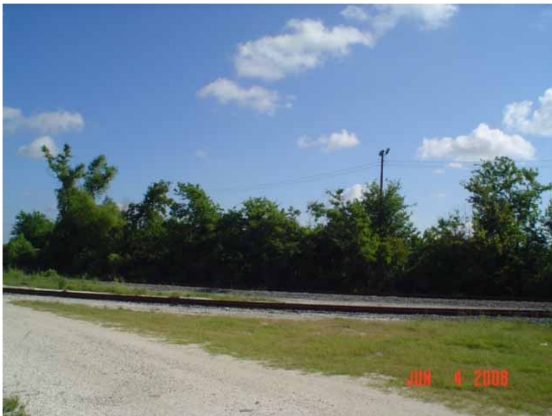
6. View of east area adjacent to the site, railroad tracks.