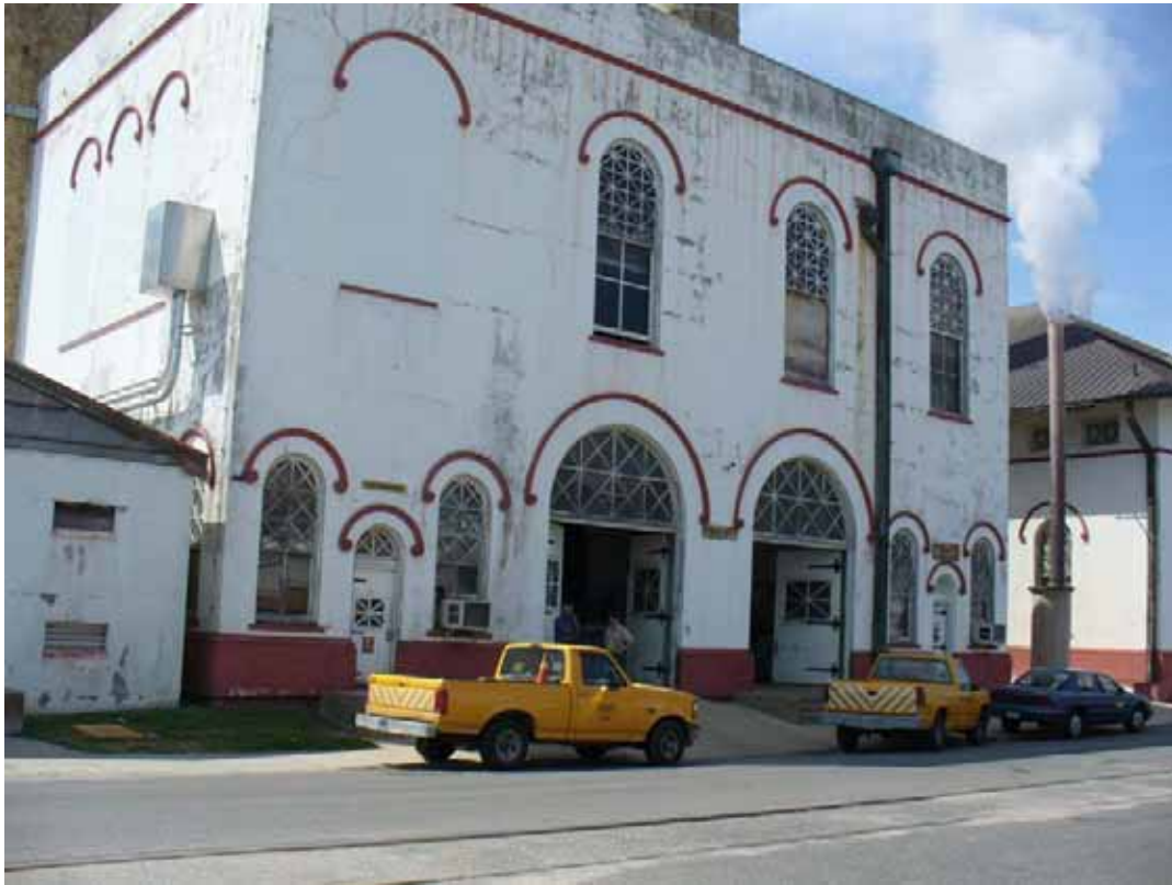
54. West side of Boiler room.