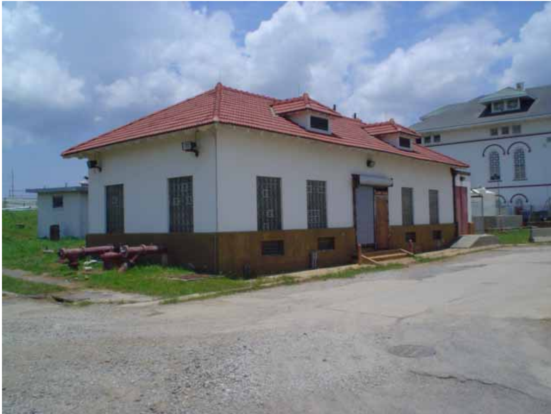
92. Sludge pump house southwest of chemical house visible in background.