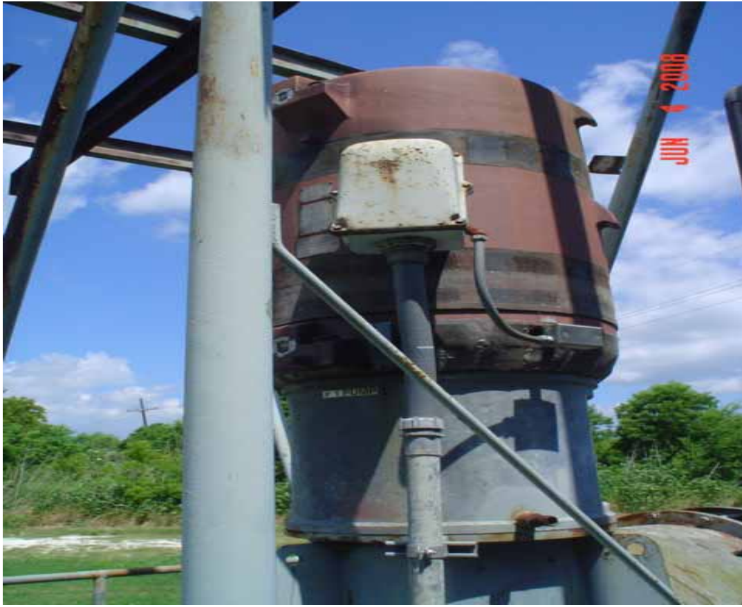
11. Vertical pump motor