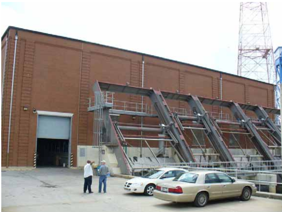
8. View of site as seen from the south direction.