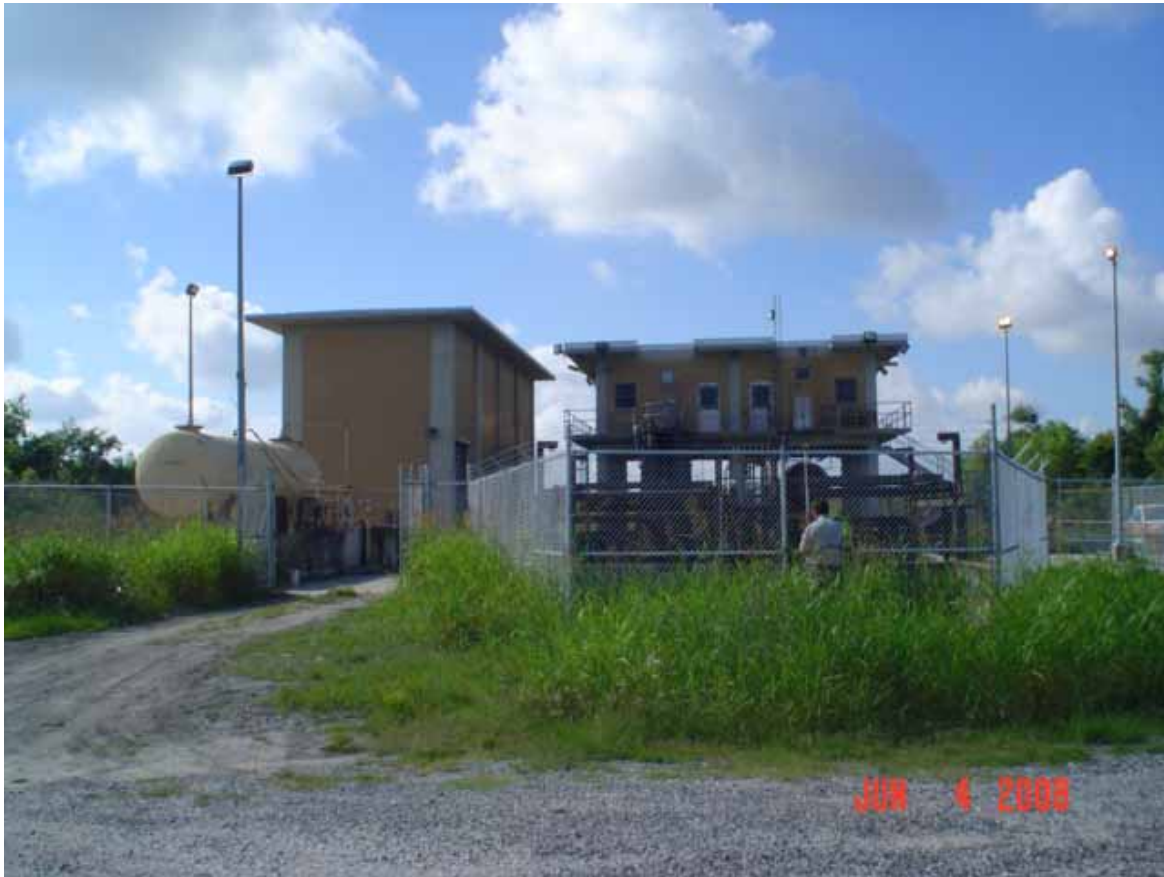
1. View of site as seen from the north direction.