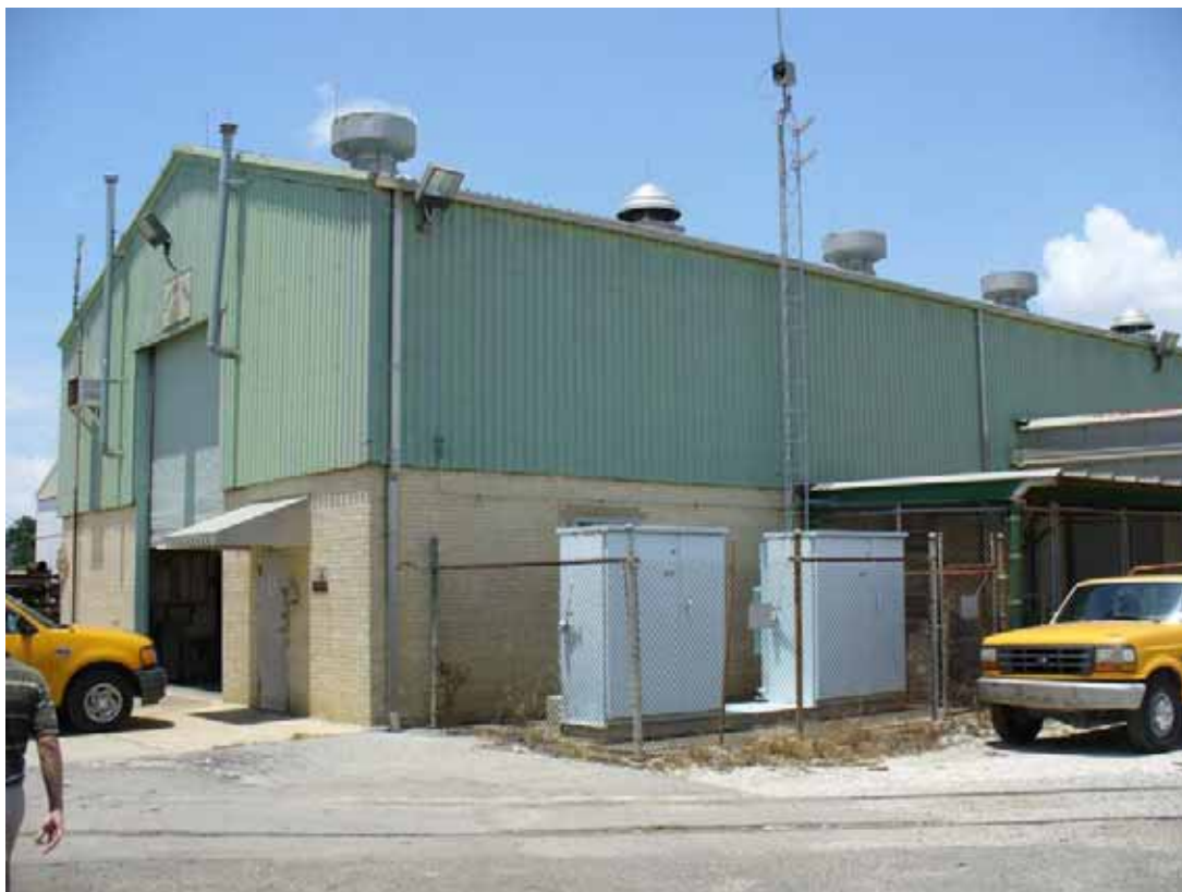
81. North and east side of electrical shop building.