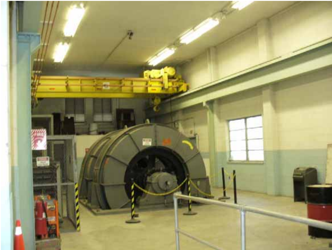
44. Frequency Changer located inside frequency changer building.