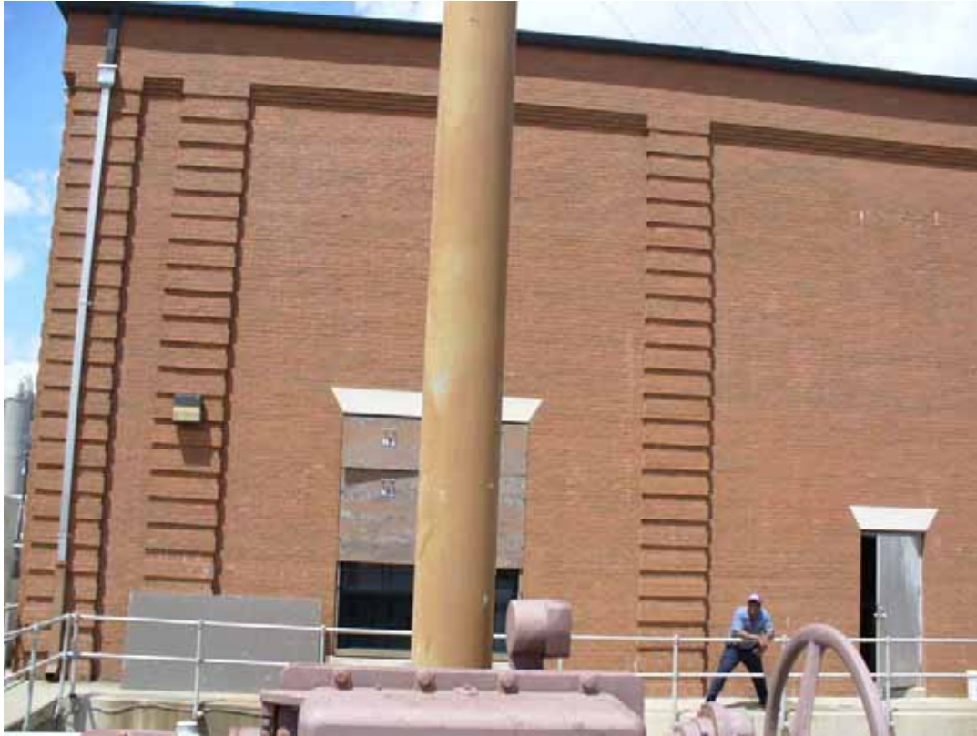
1. View of site as seen from the north direction, left side.