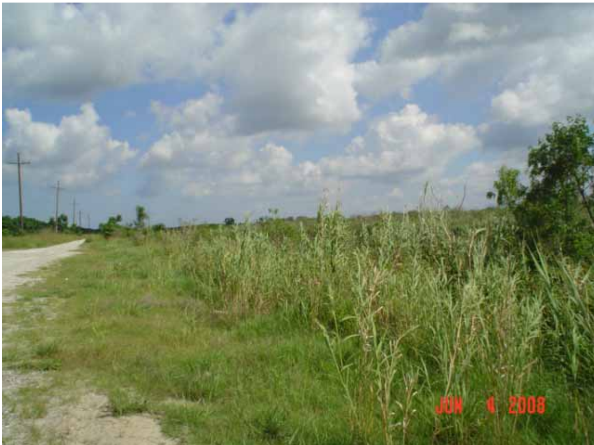
2. View of north area adjacent to the site, left of canal.