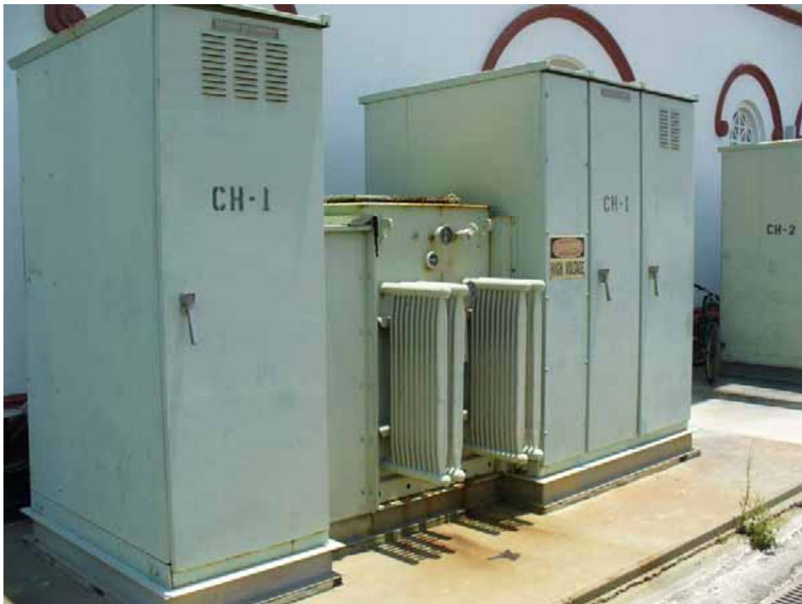
85. Transformers on south side of chemical house.