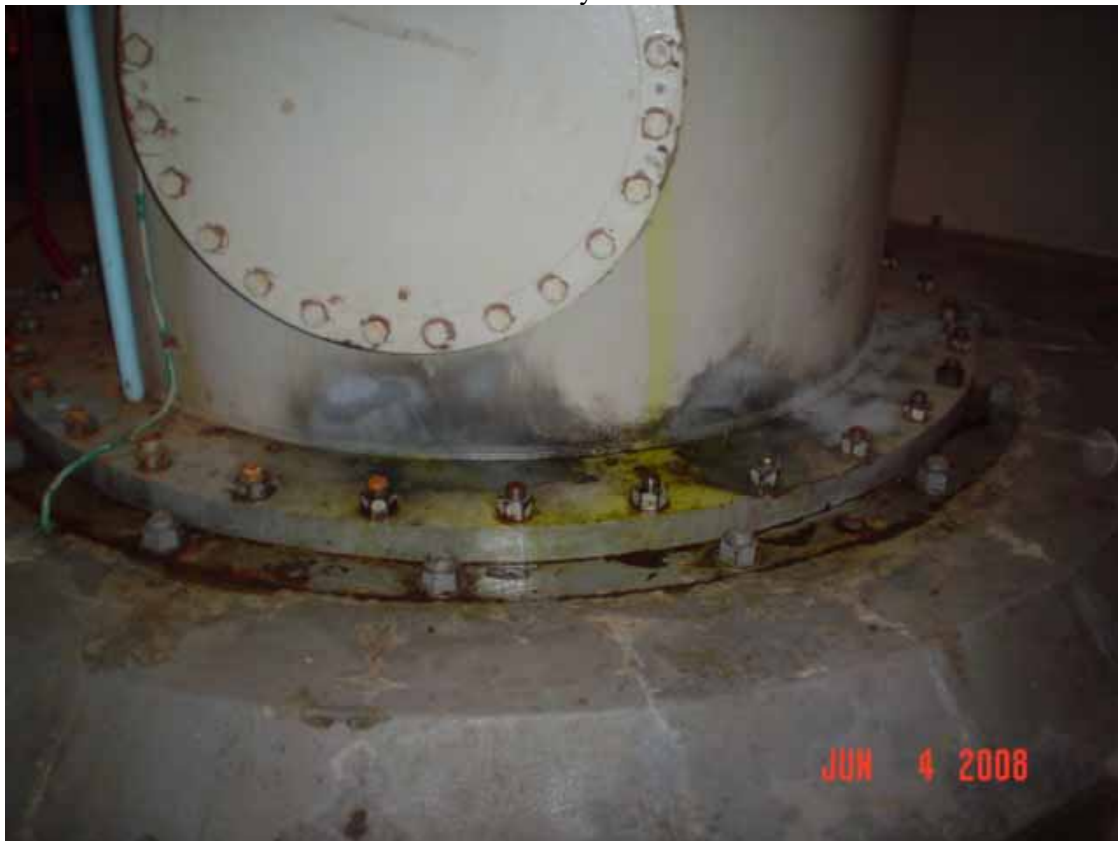
16. Antifreeze leak.