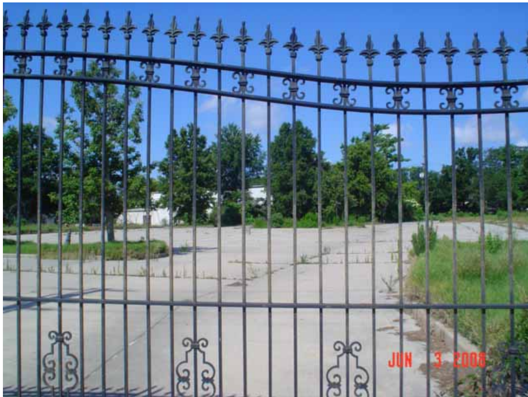
4. View of north area adjacent to the site.