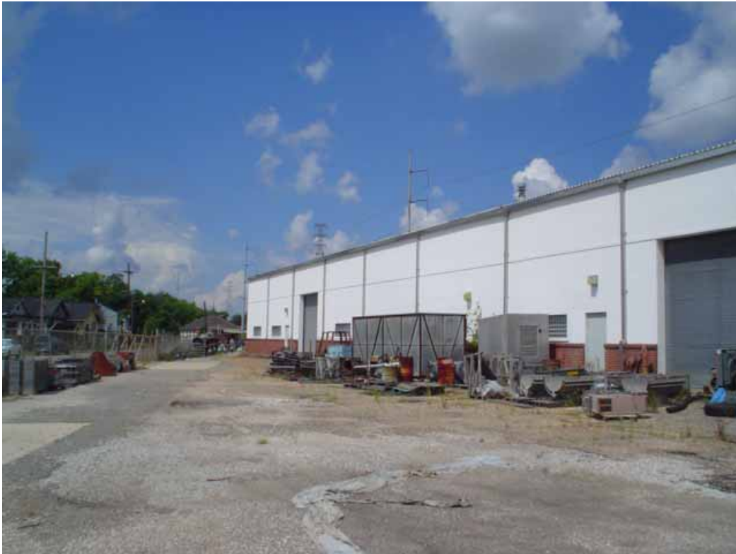
112. East side of Hamilton Street warehouse.