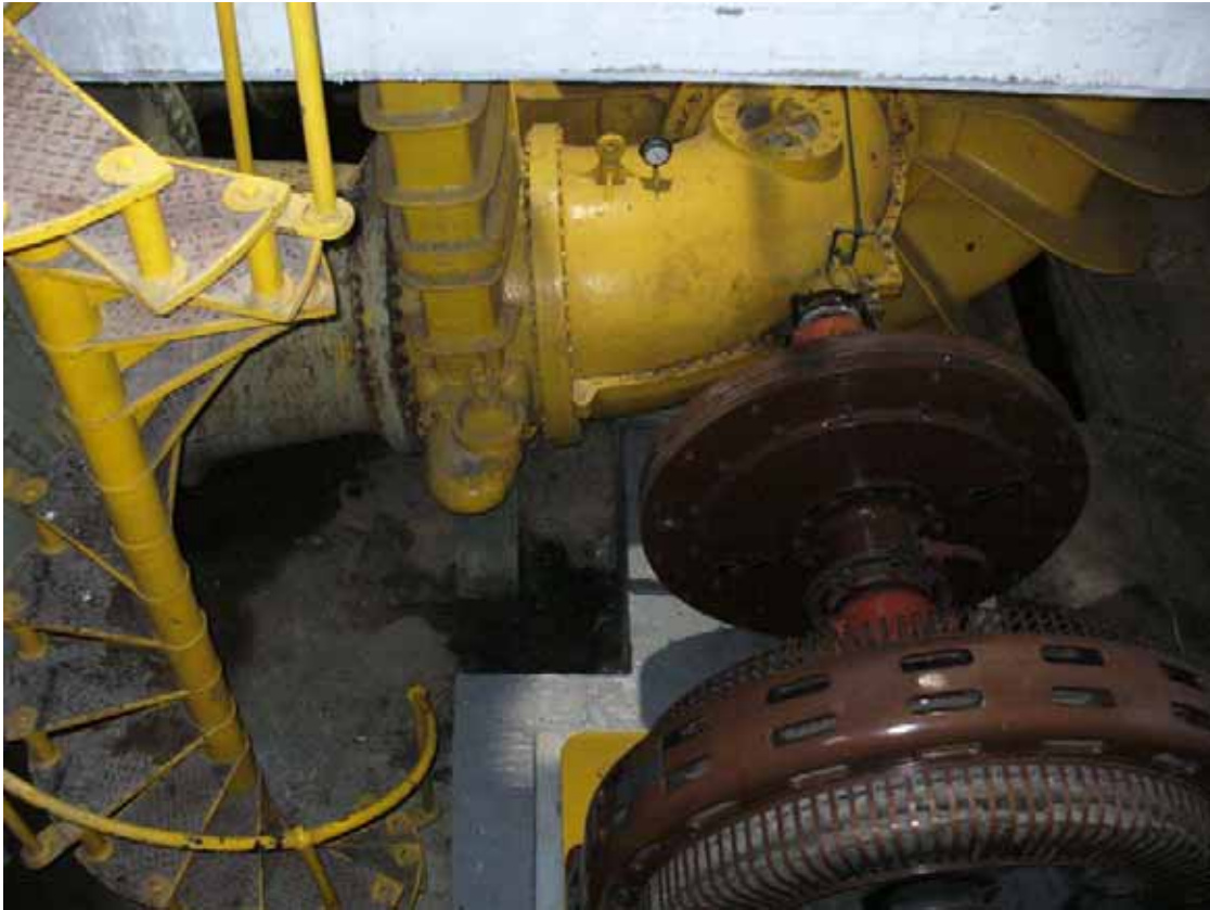
23. Pumps and piping inside building.