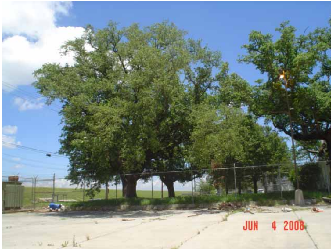
5. View of east area adjacent to the site, northeast corner.