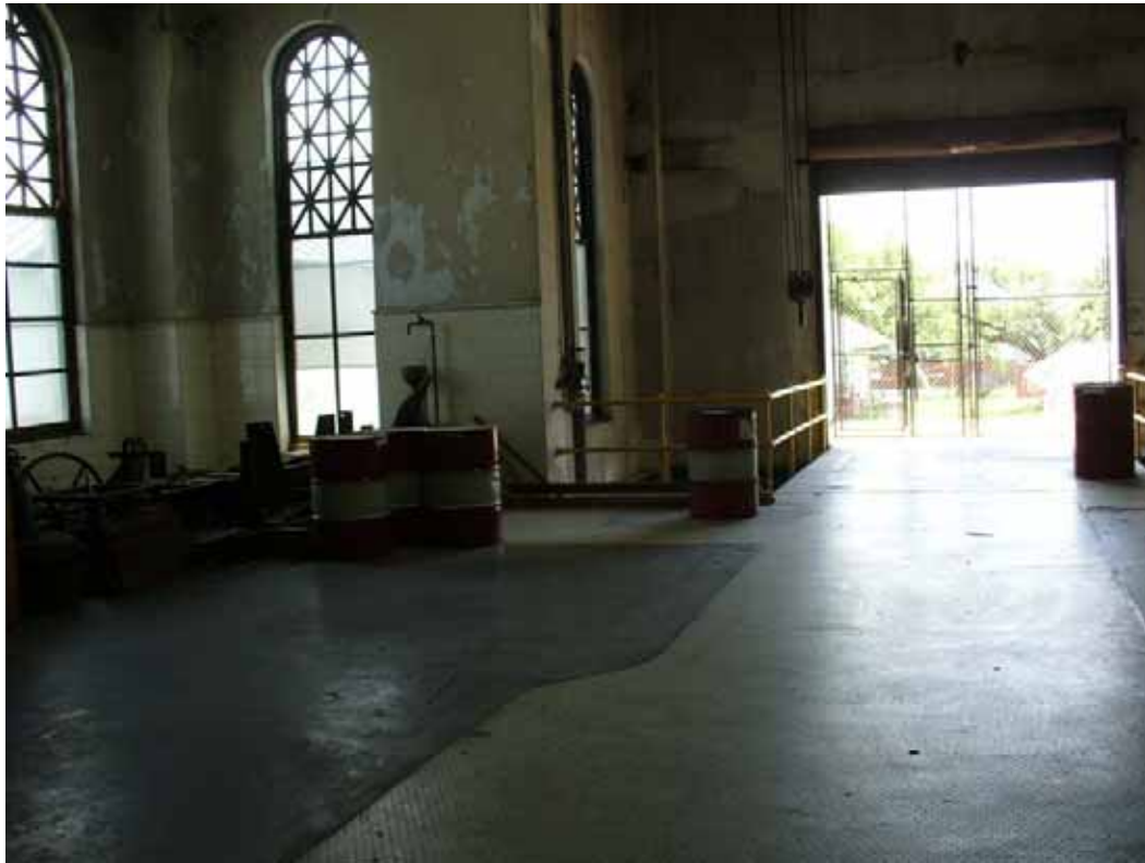
77. Stored 55 gallon drums in building.