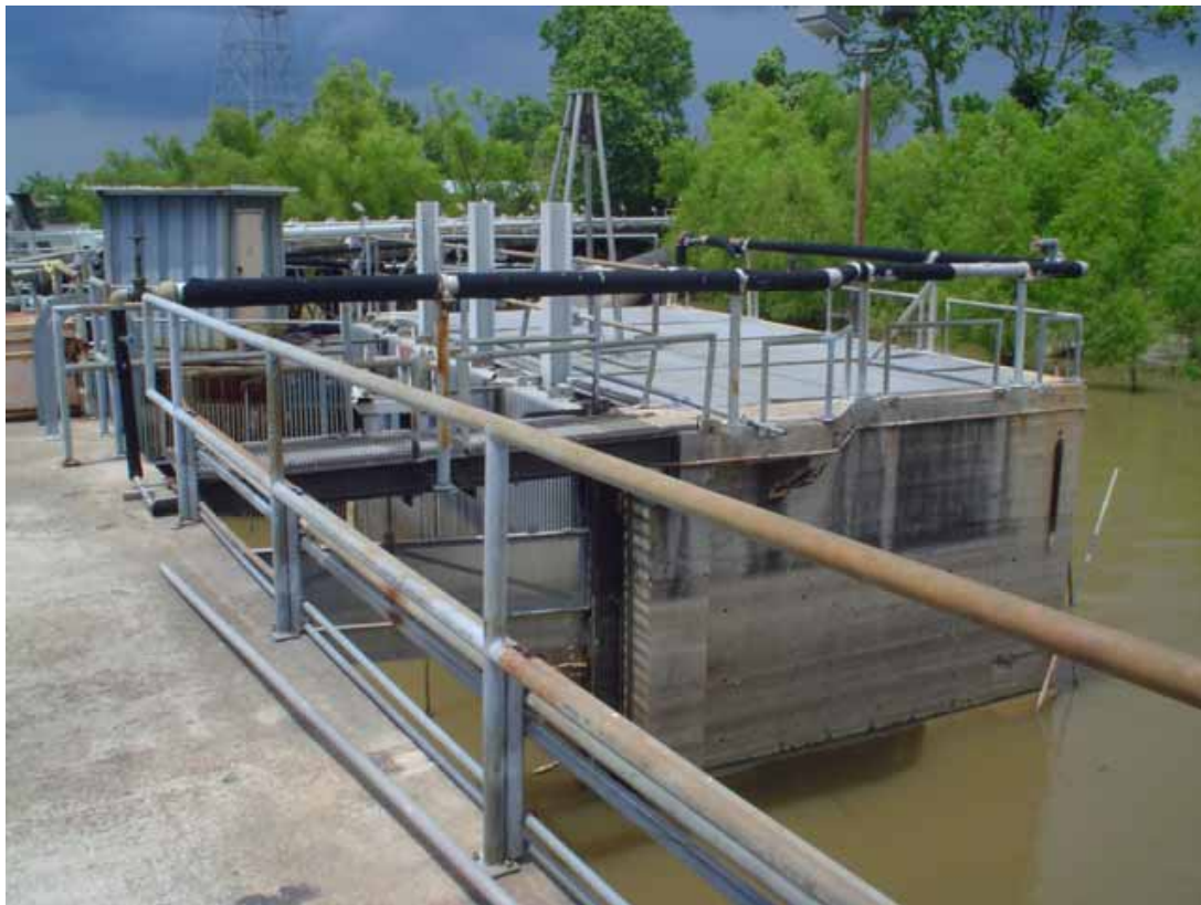
16. Screens around intake.