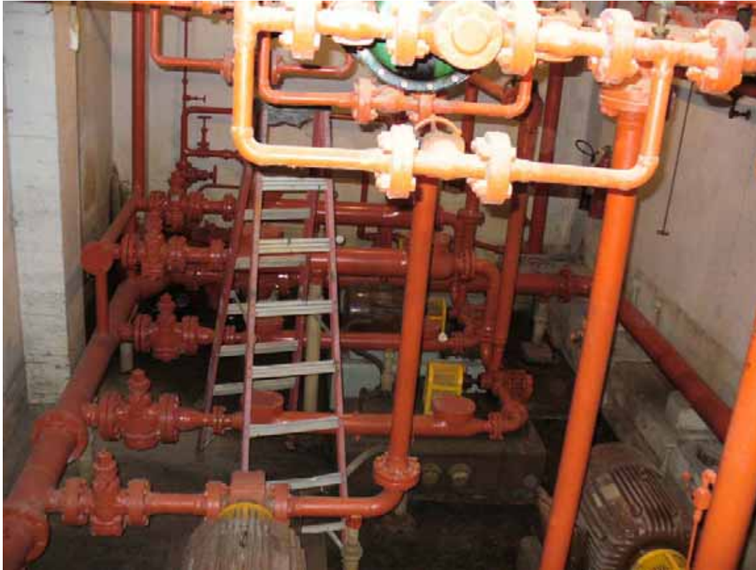
58. Diesel pump room in boiler house.