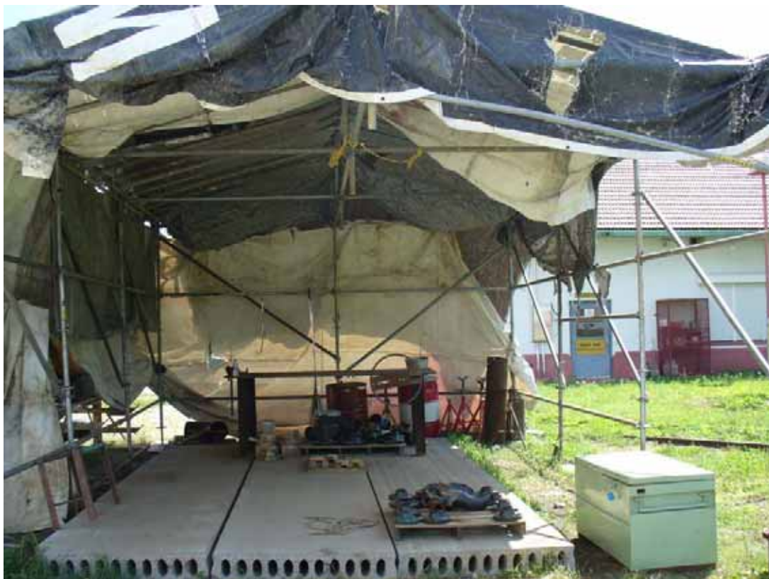
53. Welding station in southeast area of site.