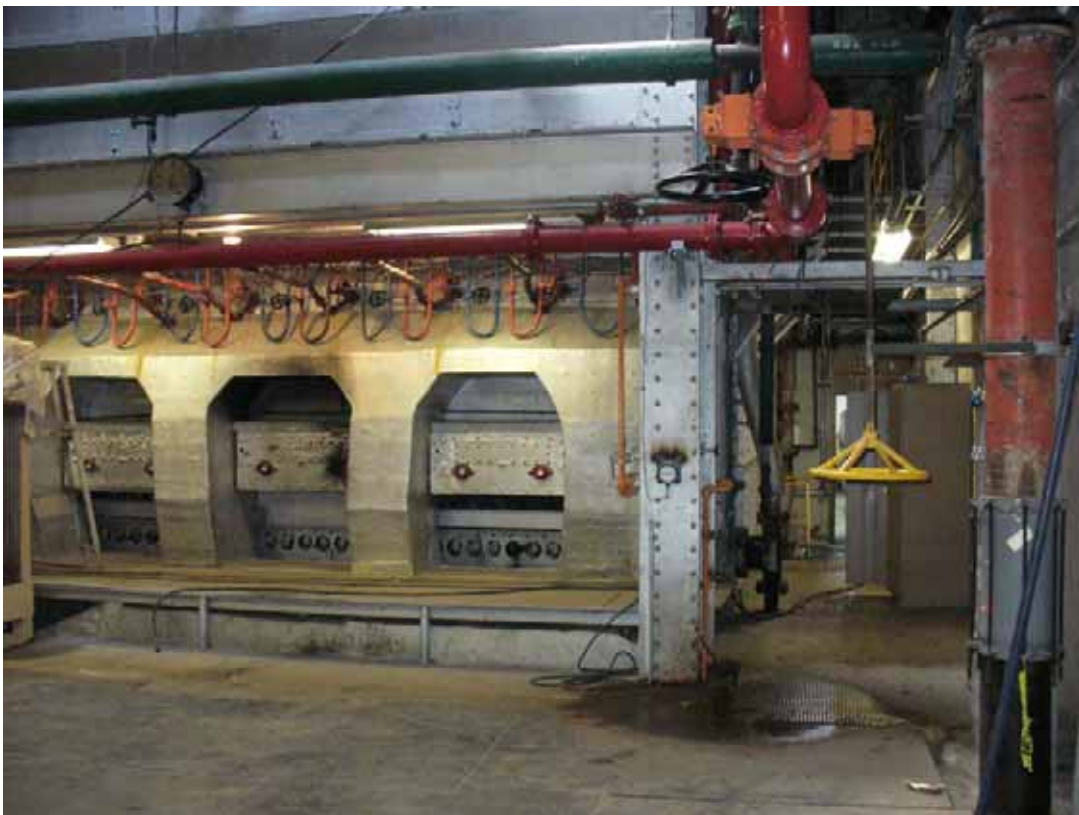
55. Boiler in boiler building.