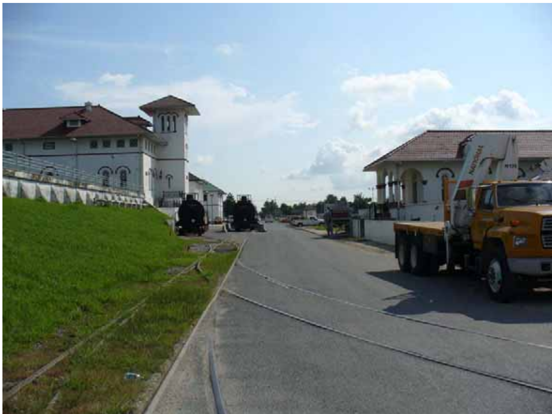
31. Looking in north direction along Eagle Street from middle of site.