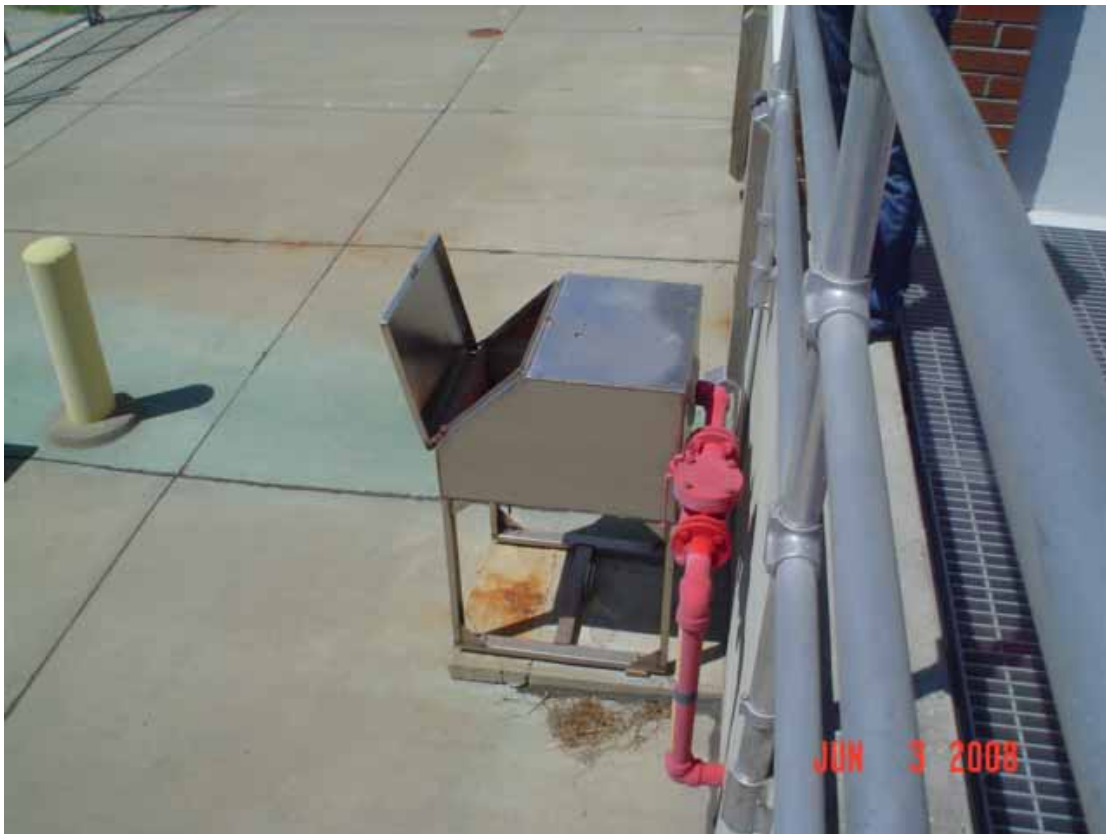
12. Fuel transfer box, southwest corner.