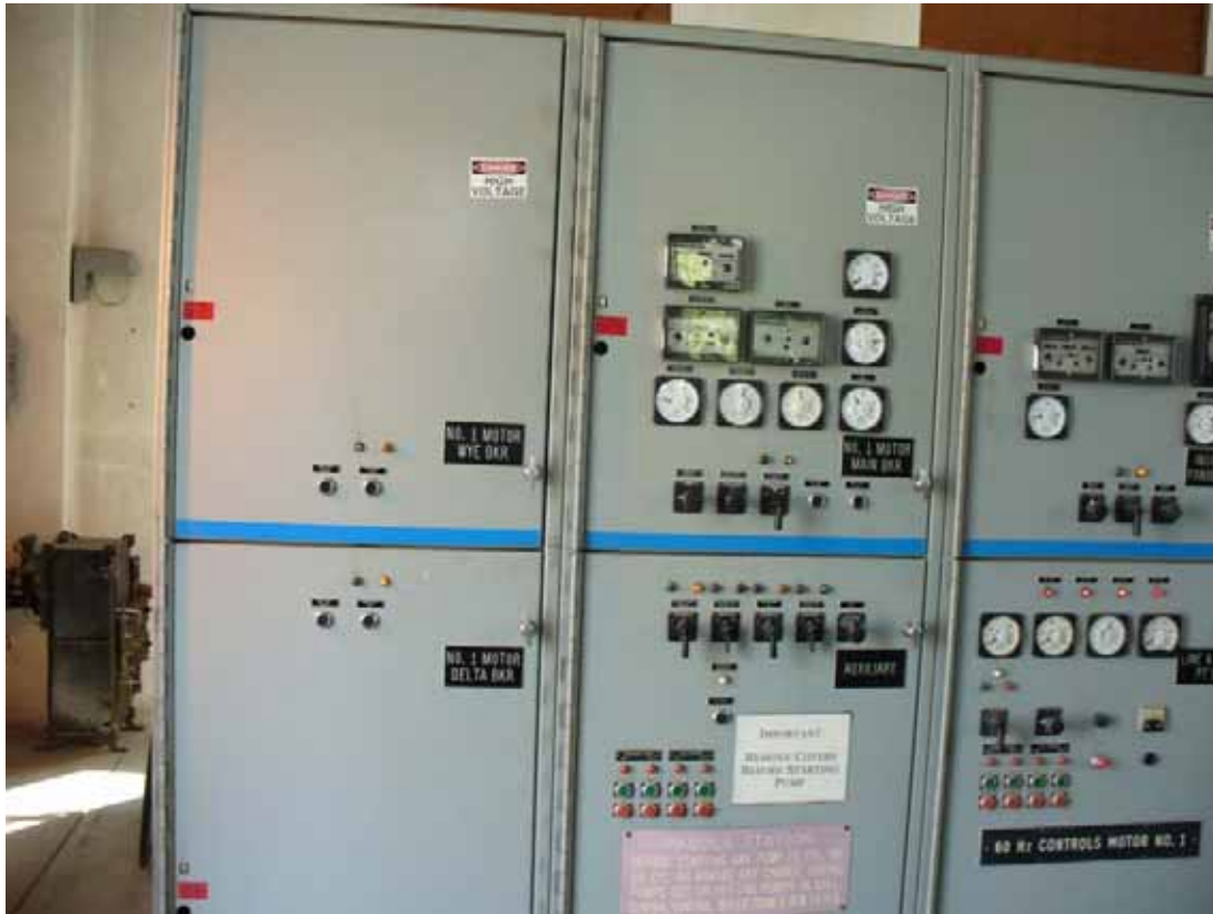
38. Breakers located inside Panola Street station.