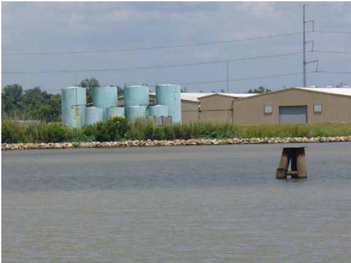
4. View of east area adjacent to the site. Observe industrial buildings across Intracoastal Waterway from site.