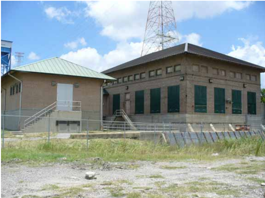
4. View of site as seen from the east direction.