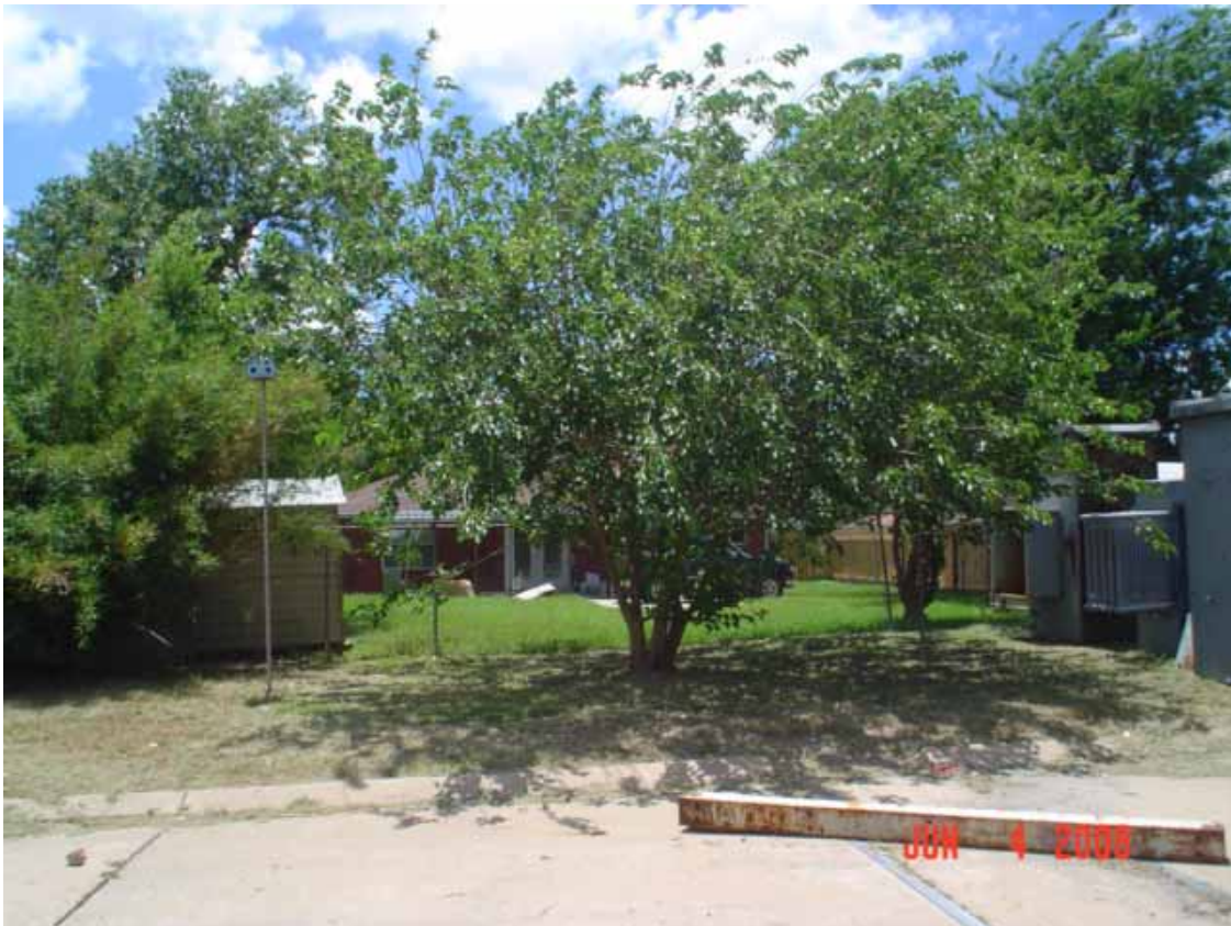
10. View of west area adjacent to the site, showing transformers on property in northwest direction.