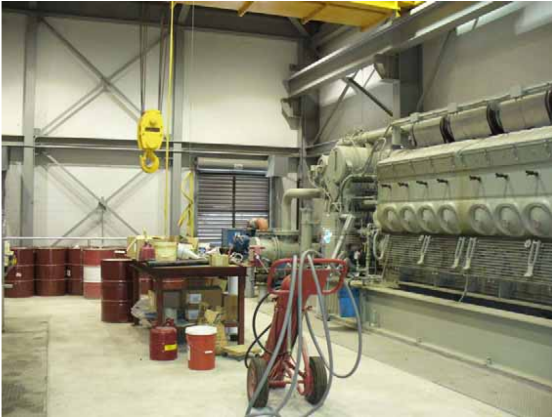
21. Engines and drums inside generator building.