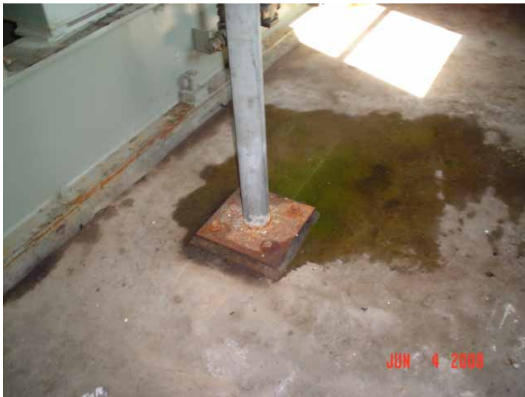
20. Antifreeze puddle near engine.