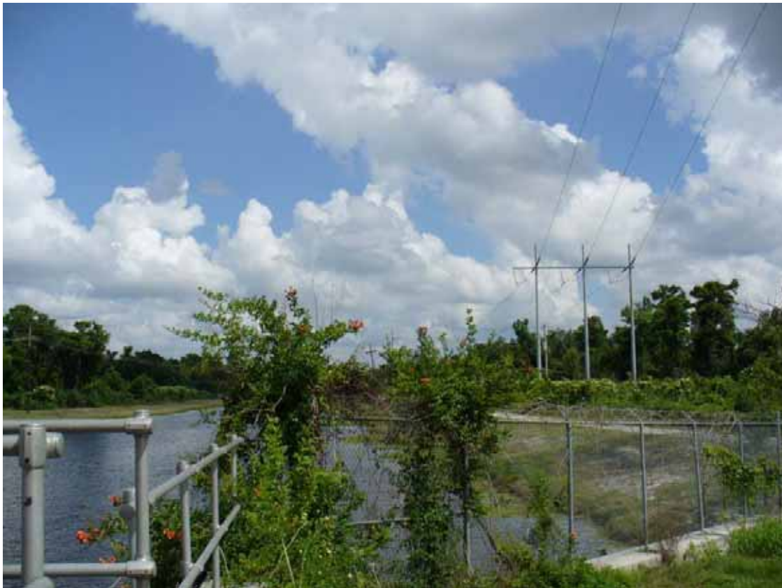
8. View of south area adjacent to the site, canal showing power lines.