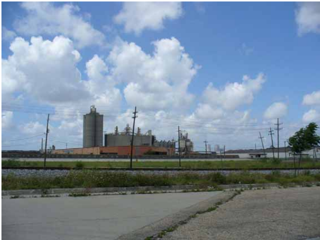
10. View of south area adjacent to the site.