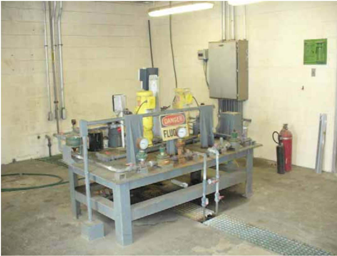
28. Equipment inside ammonia building.