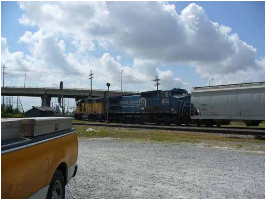
8. View of south area adjacent to the site, showing rail traffic.