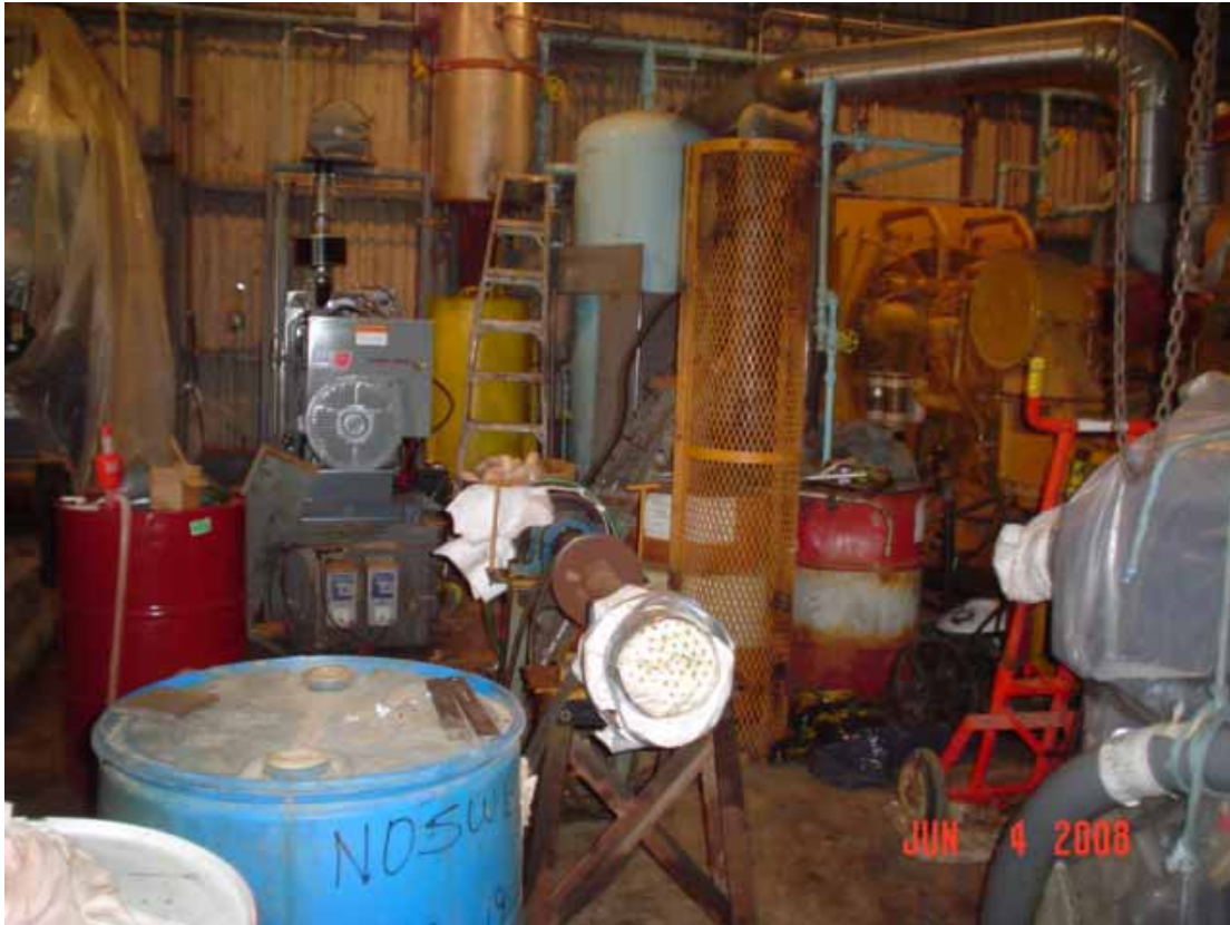
15. Various oils and lubricants inside building. Observe stains to concrete floor.