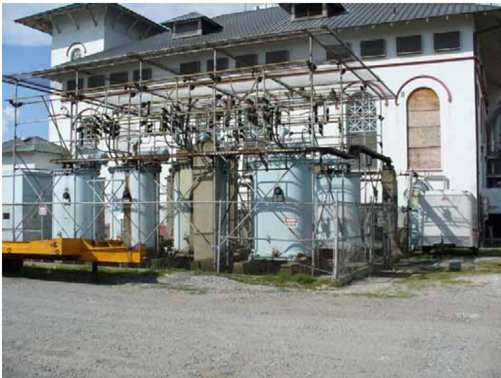
33. Observed stains on transformers located on north side of power house.