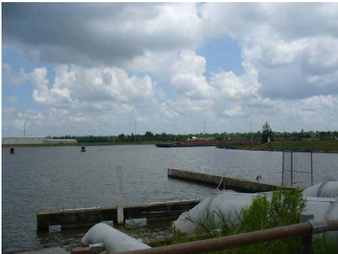
2. View of east area adjacent to the site, showing barge traffic.