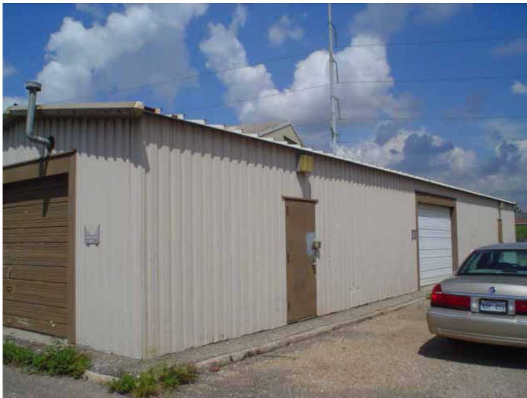
107. Carpenter building southwest area of site.