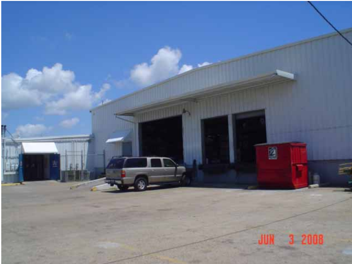
13. View of west area adjacent to the site, adjacent warehouse.