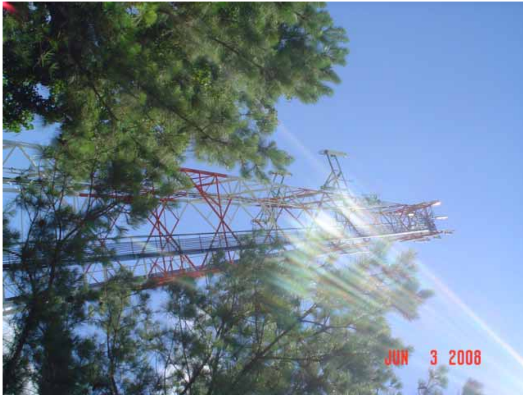
3. View of north area adjacent to the site, showing top of radio tower.