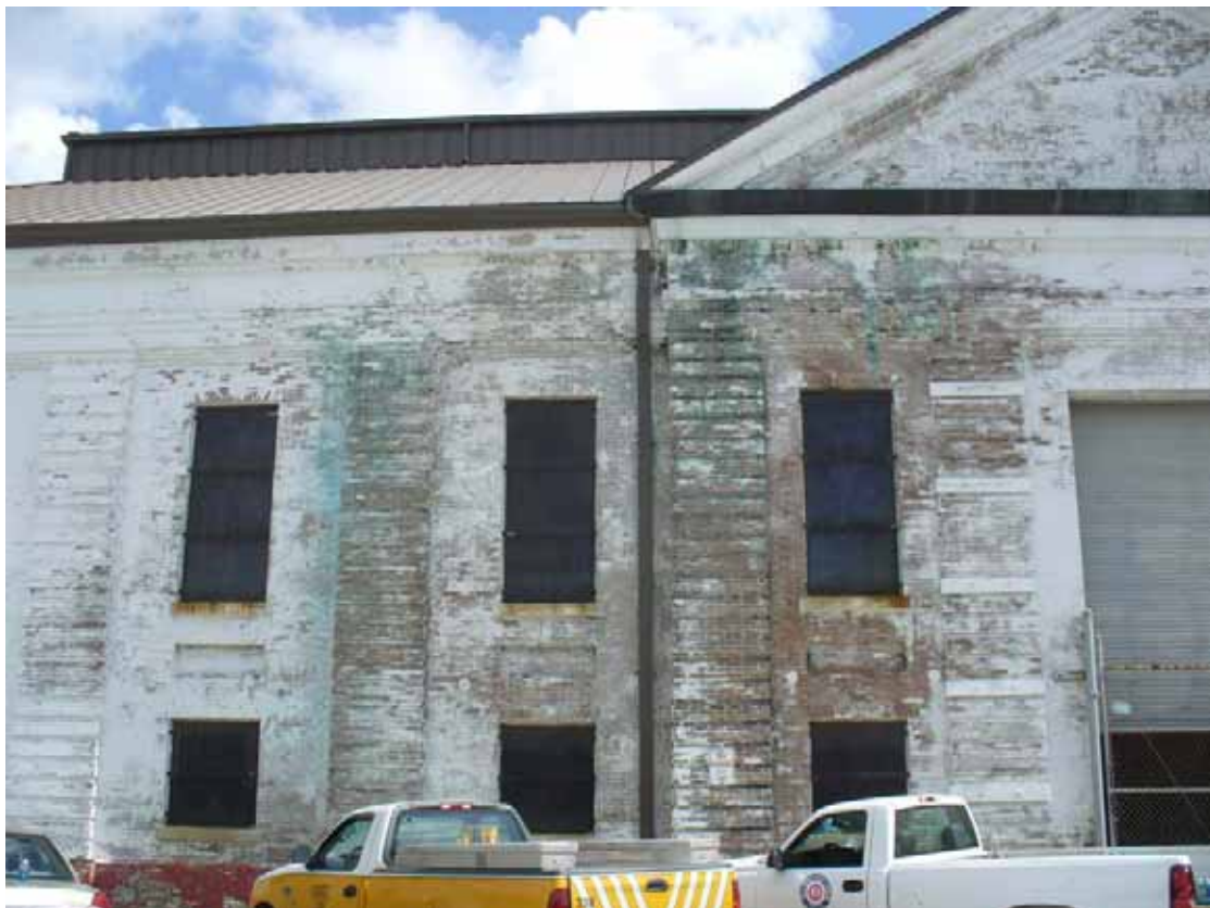
6. View of site as seen from the south direction, southwest area.