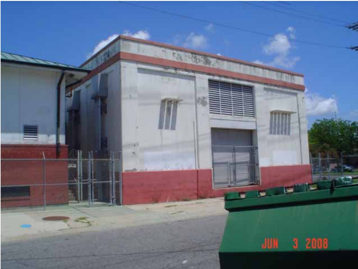
5. View of site as seen from the east direction, right side.