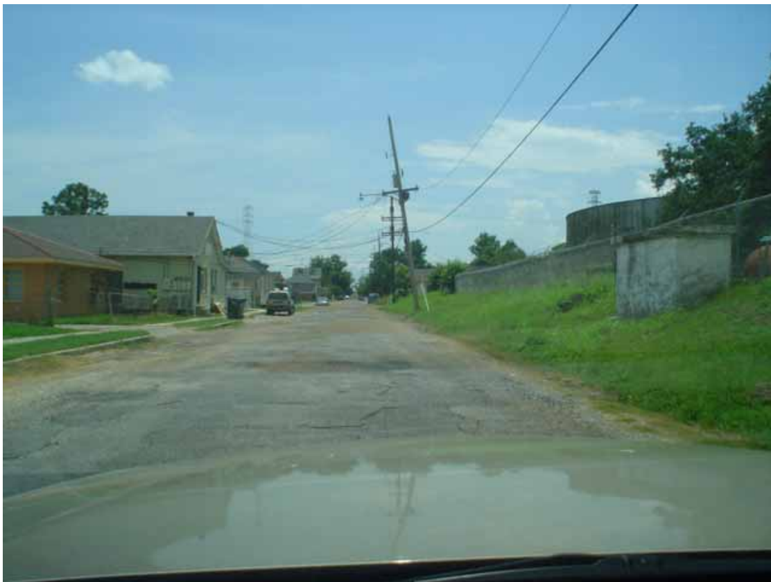
15. View of large diesel tank on General Ogden Street looking from north to south.