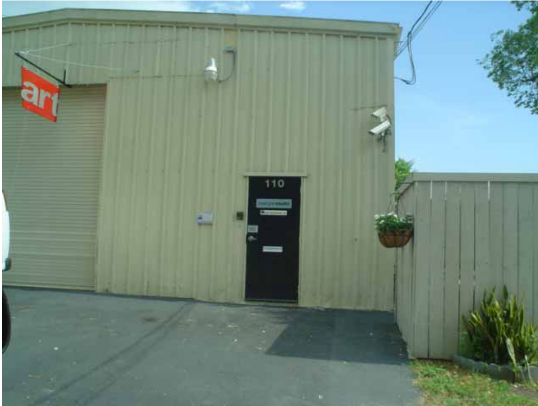
5. Art studio across levee, northwest corner.