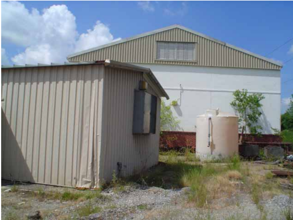
108. Empty tank southwest of carpenter building.