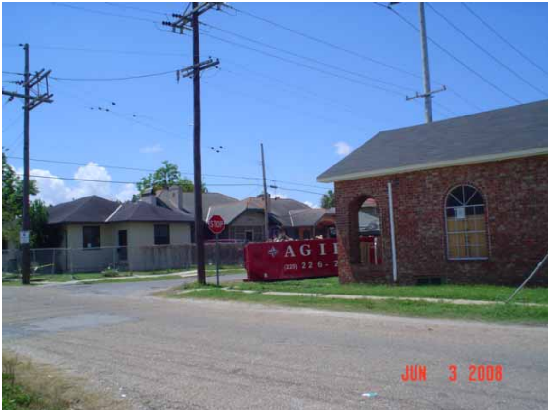
10. View of south area adjacent to the site.