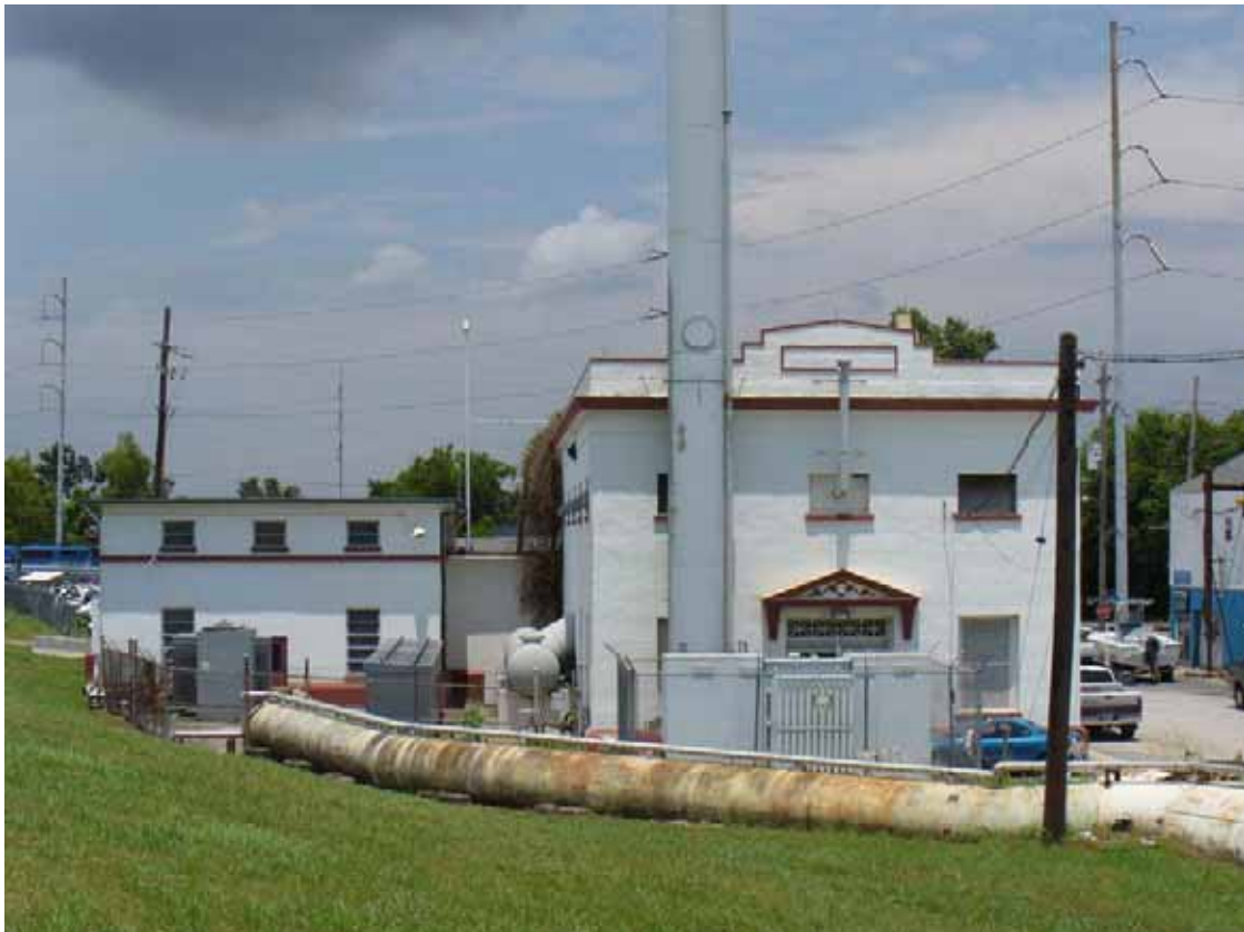
8. View of site as seen from the south direction, including transformers and pipeline.