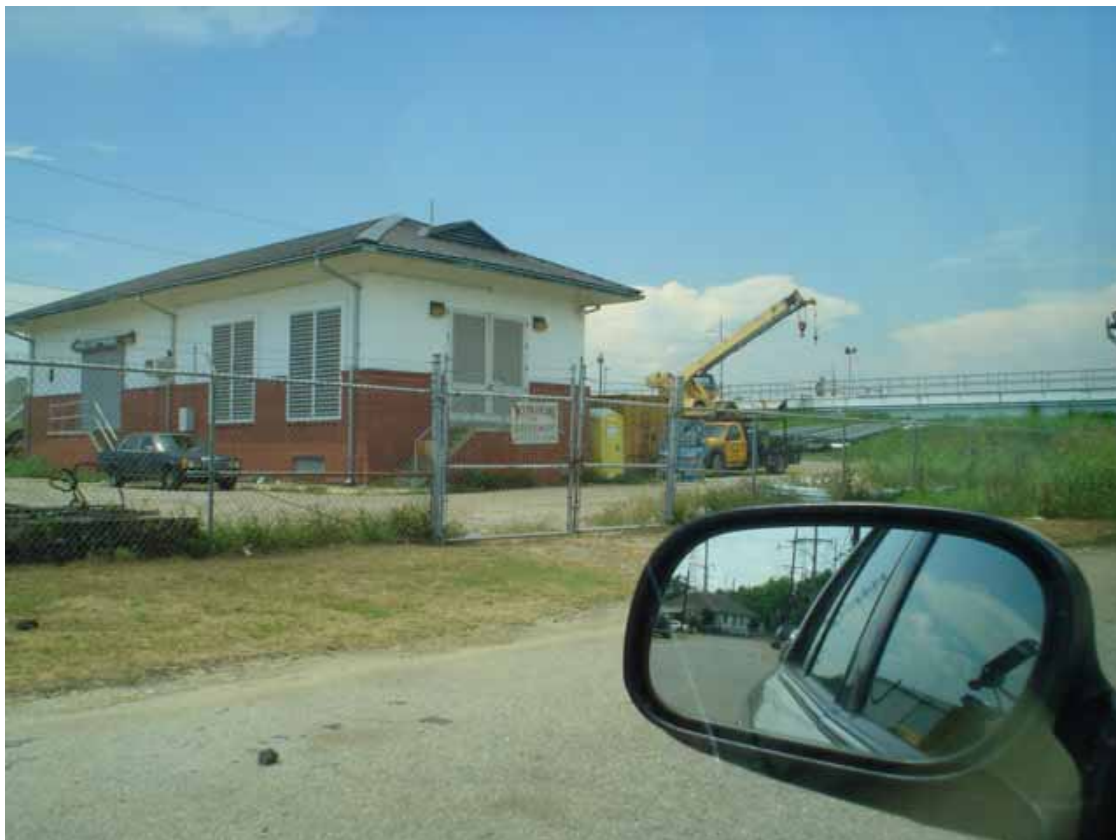
19. View of south of site from end of Hamilton Street looking west.