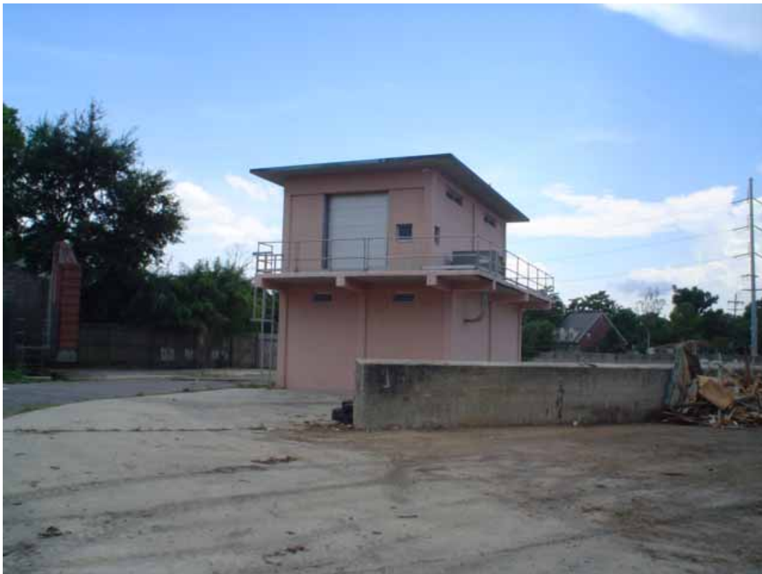
20. Transfer tower, electrical materials, southeast corner of property.