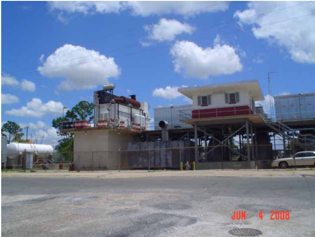
1. View of site as seen from the north direction.