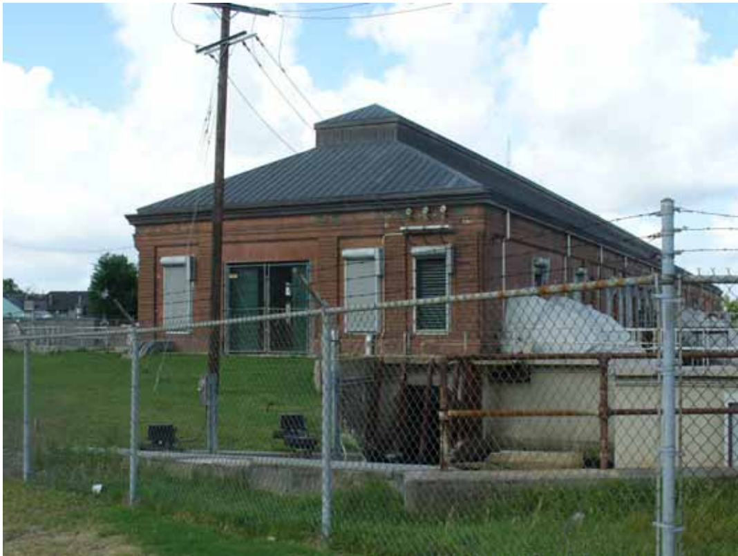
5. View of site as seen from the east direction.