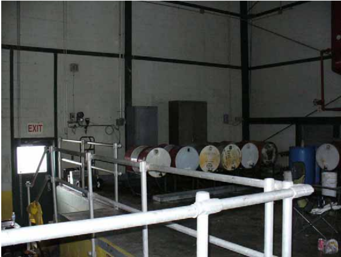
19. Drums in use inside building.