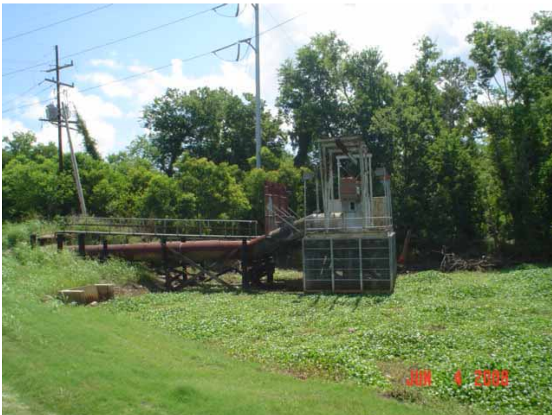
8. View of site as seen from the west direction, including transformers on the northeast corner.