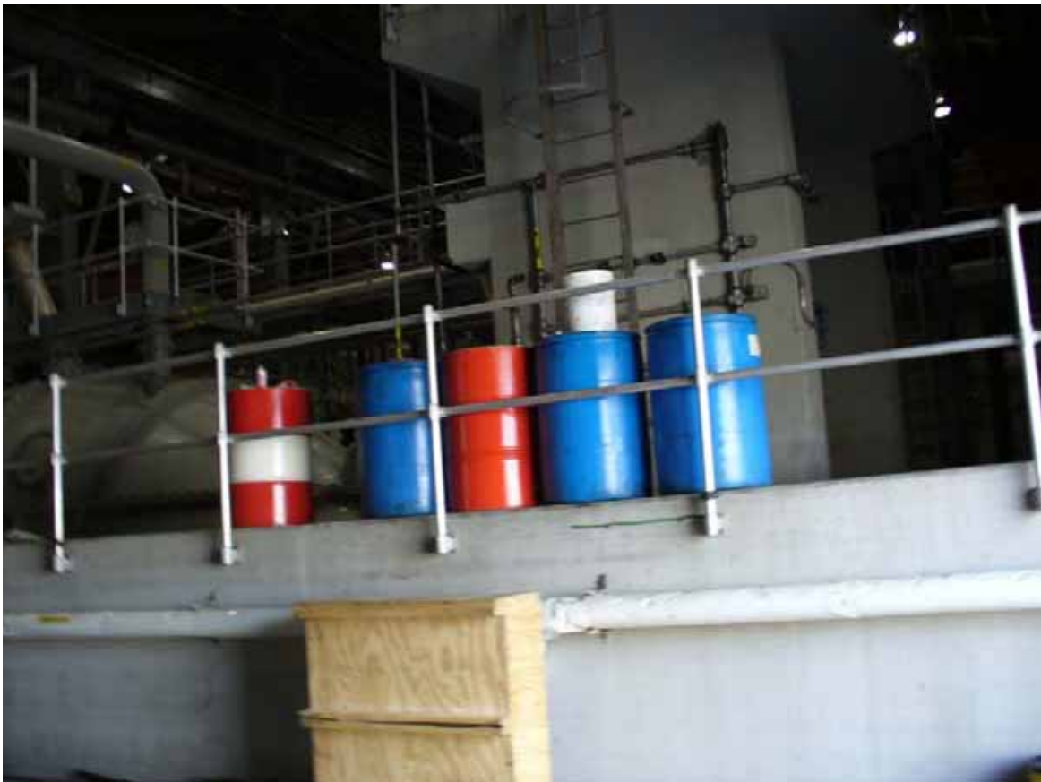
24. Drums observed inside OP-19 building.