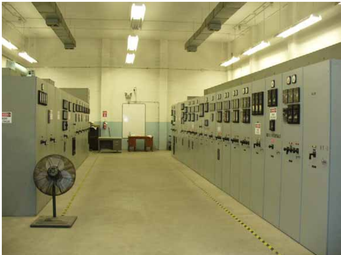
45. Breaker and switches inside frequency changer building.