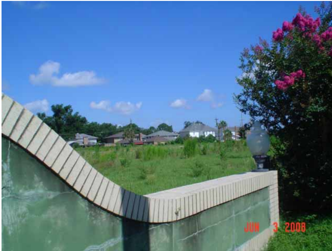
3. View of north area adjacent to the site, northeast corner.