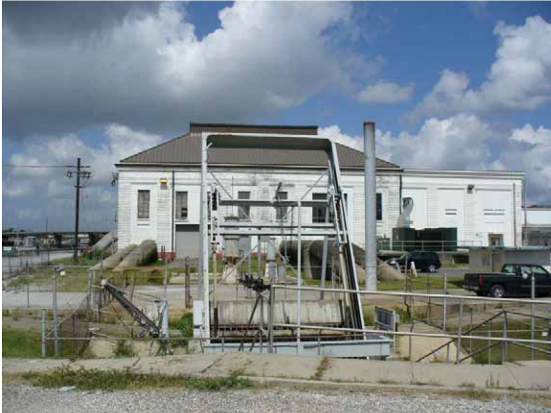
3. View of site as seen from the east direction.