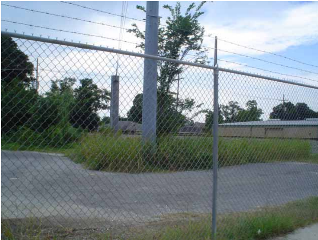
16. View of west area adjacent to the site, railroad tracks, and residential area, northwest corner.