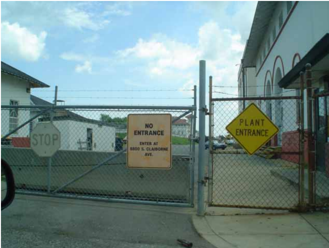
14. South entrance to plant on Eagle Street.