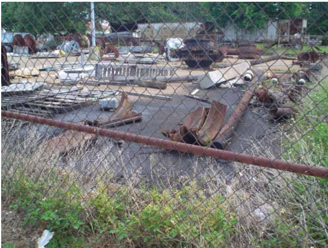
8. View of oil stained pavement and machine parts in south east corner of site at Spruce and Leonidas Streets.