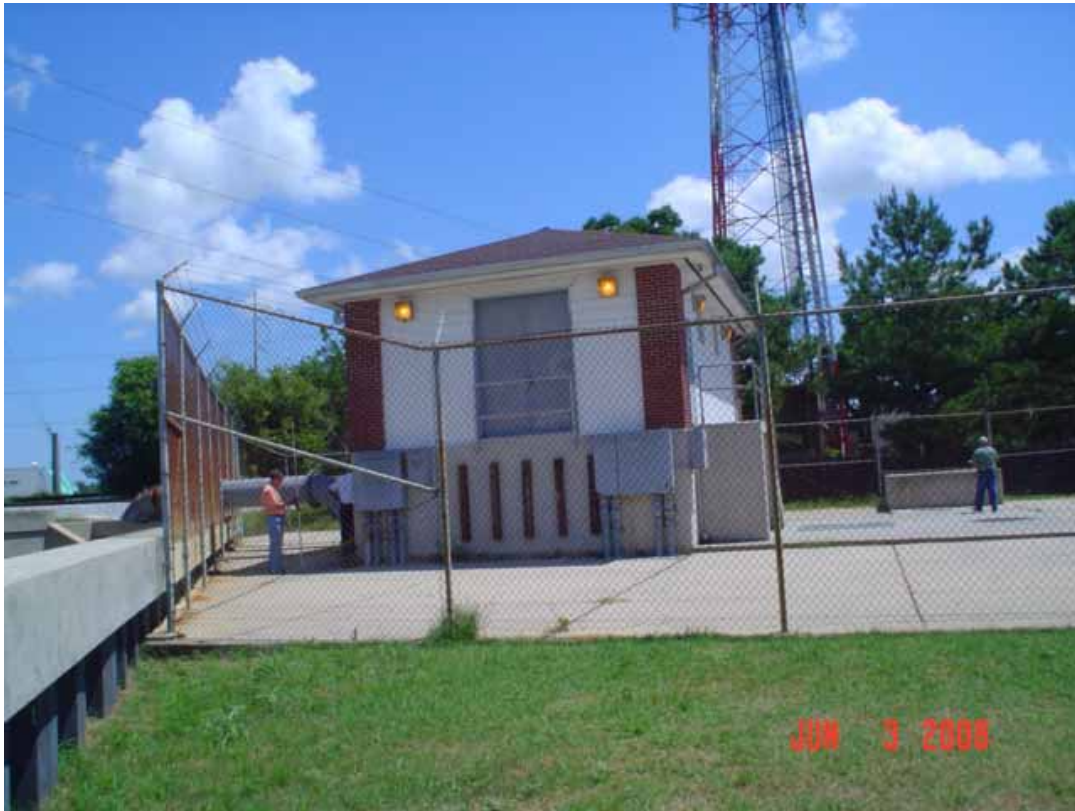
7. View of site as seen from the south direction.