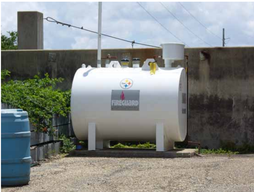
2. View of north area adjacent to the site, fuel tank, northeast corner on property.