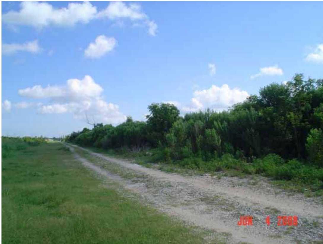
3. View of north area adjacent to the site, road.