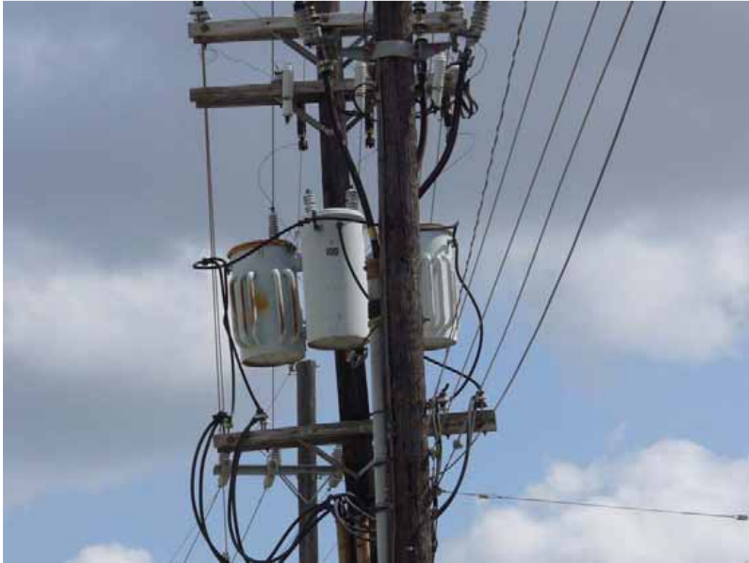
17. View of transformers located east of property.