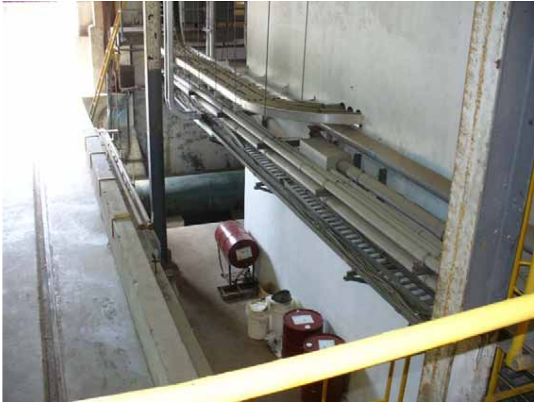
64. 55 gallon drums stored in basement of high-lift building.