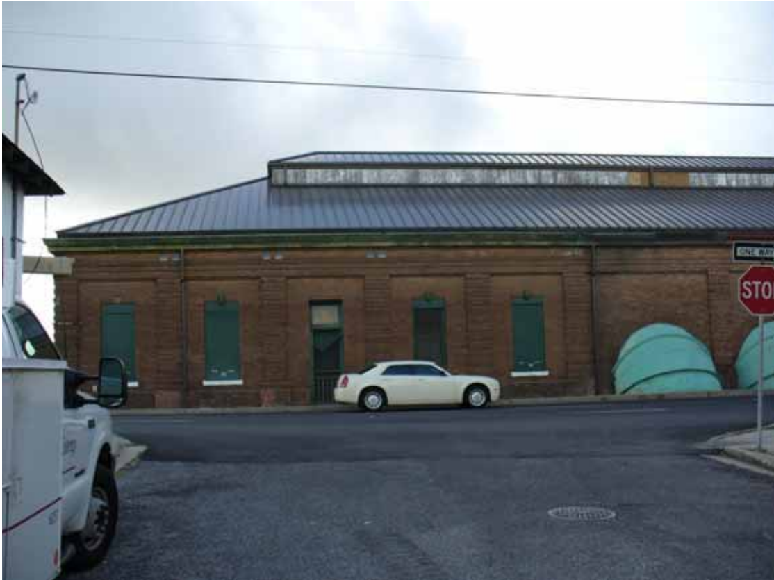
1. View of site as seen from the north direction, northeast half.