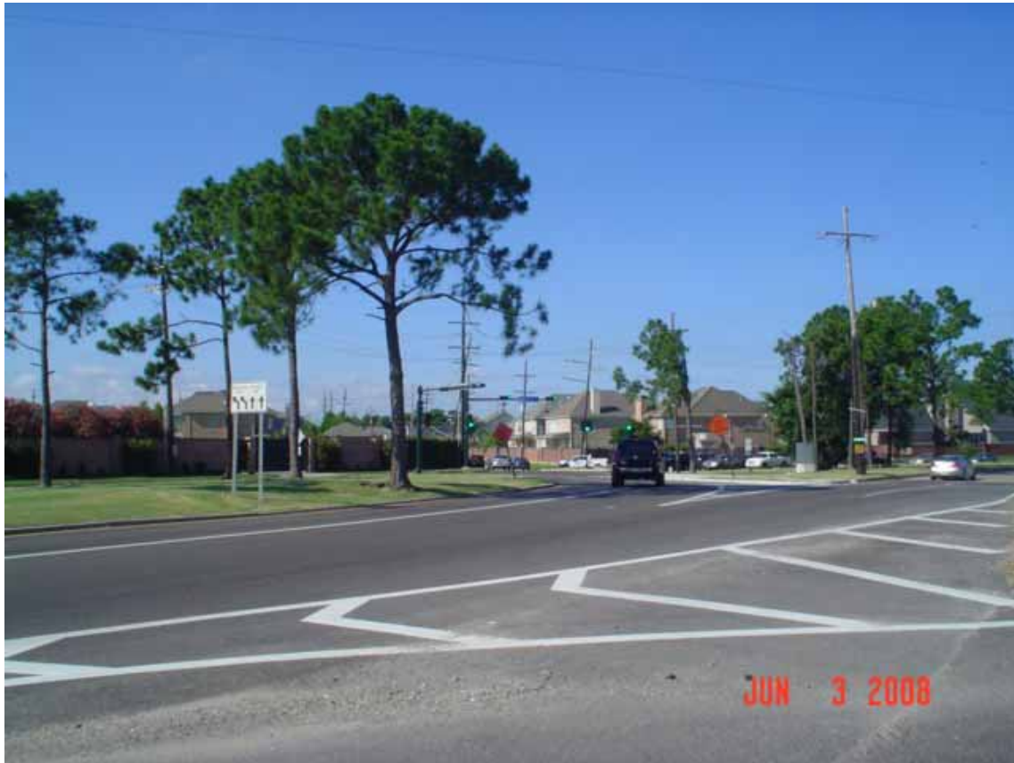
7. View of southwest area adjacent to the site.