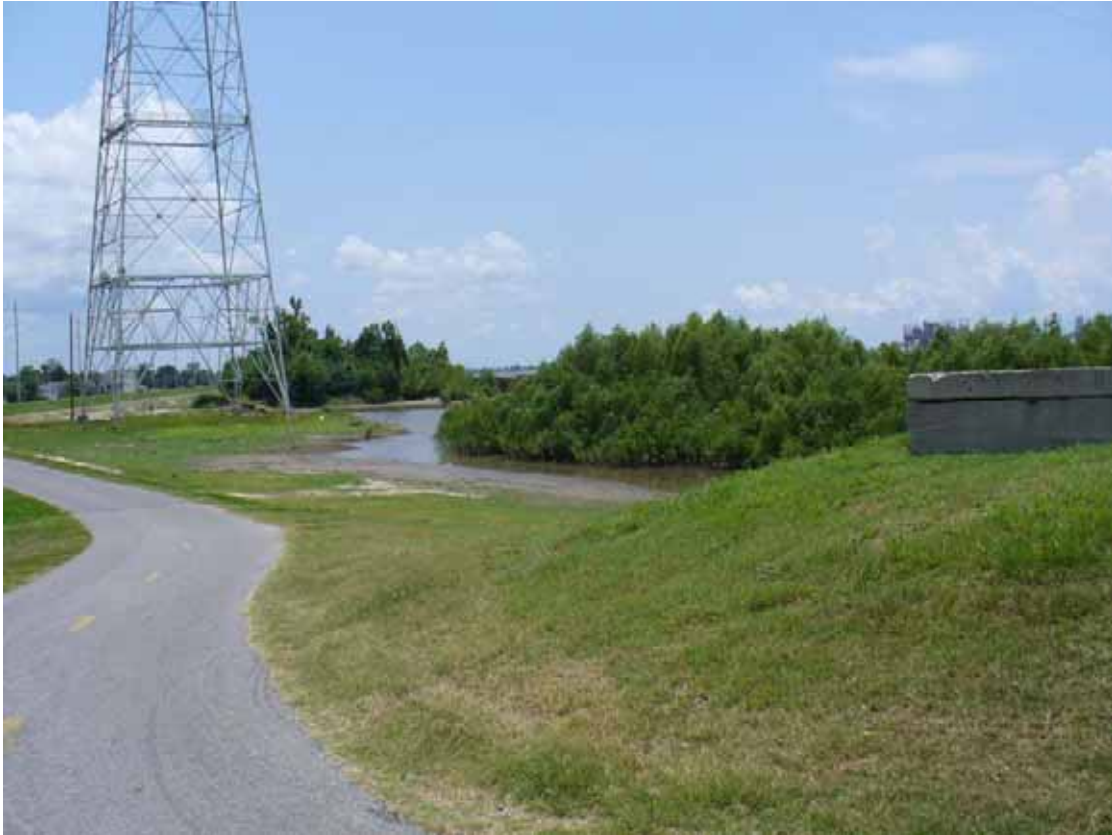
11. View of south area adjacent to the site, top of levee, southwest, with radio tower.