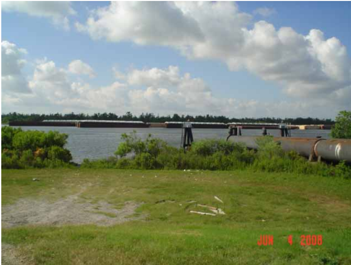
11. View of south area adjacent to the site, across levee.