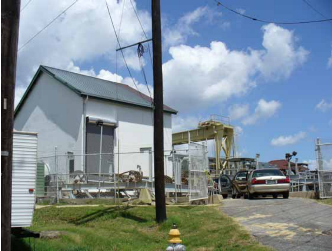
7. View of site as seen from the south direction.