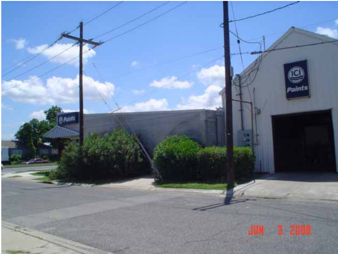
7. View of east area adjacent to the site, showing paint store and warehouse.