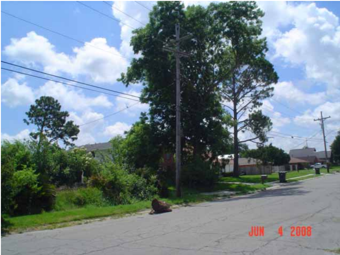
5. View of east area adjacent to the site in southeast direction.