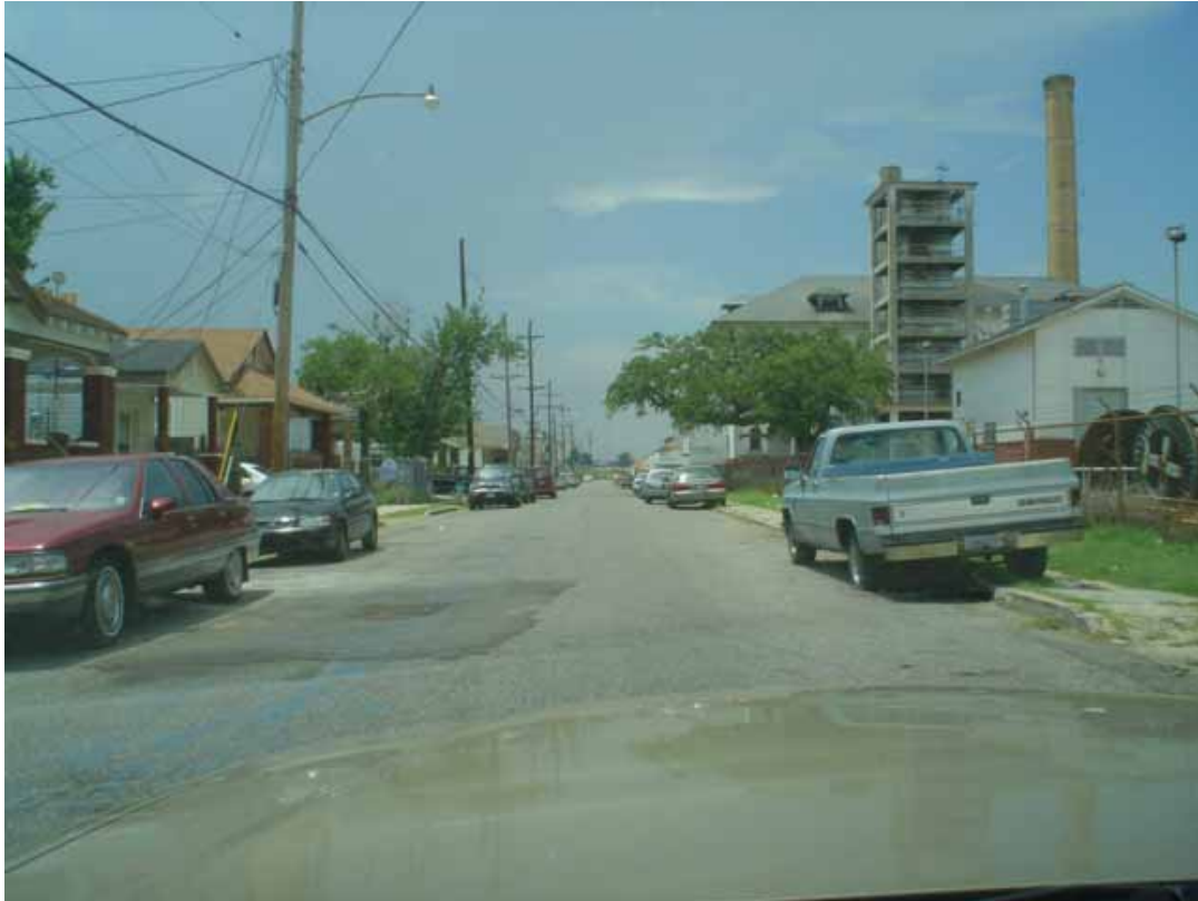
10. View along Spruce street on south side of site looking west.