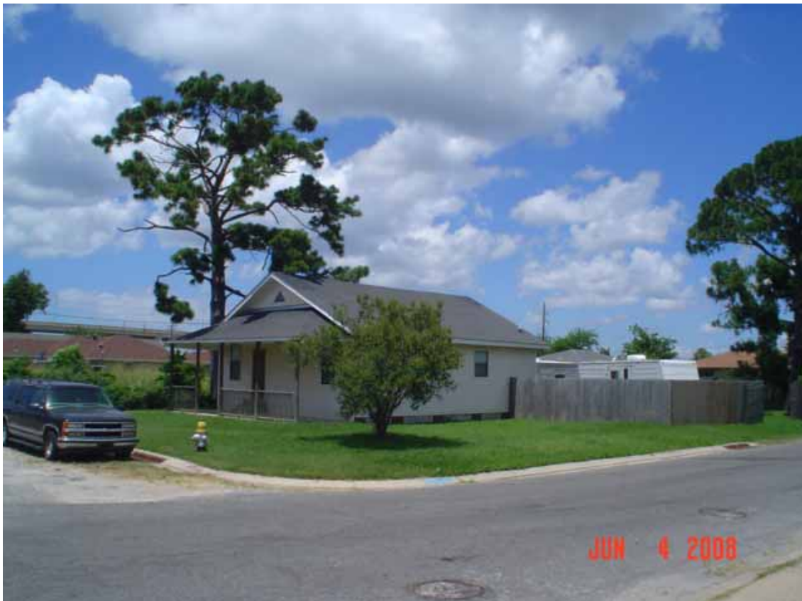
2. View of north area adjacent to the site, in northeast direction.