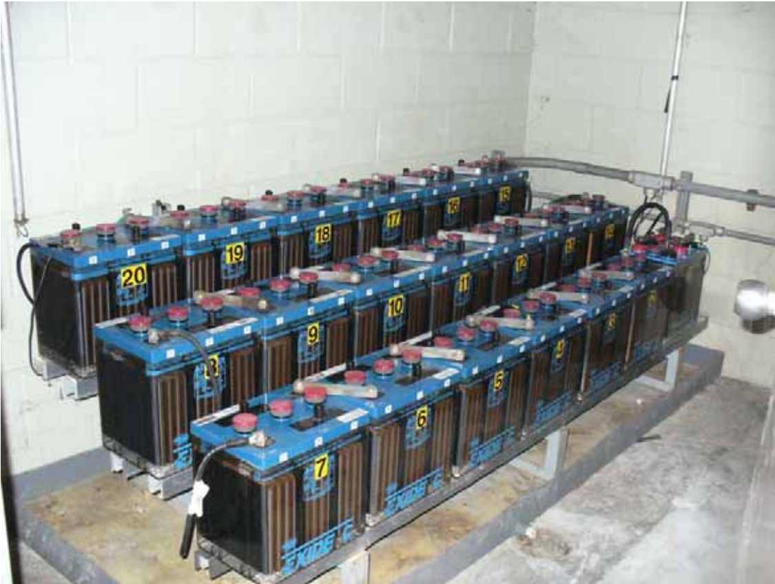
13. View of typical battery bank found at pump stations.