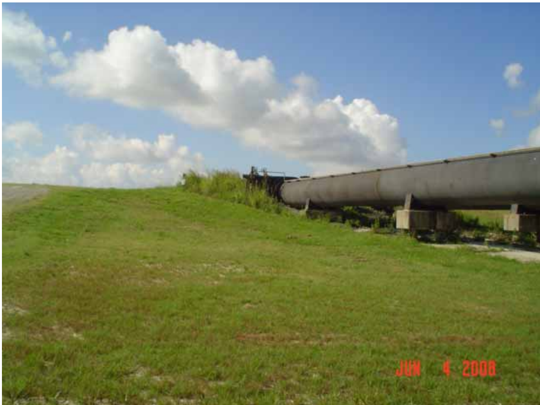
10. View of south area adjacent to the site, pipelines over levee.