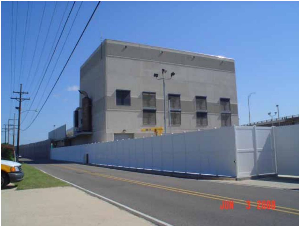
7. View of site as seen from the south direction.