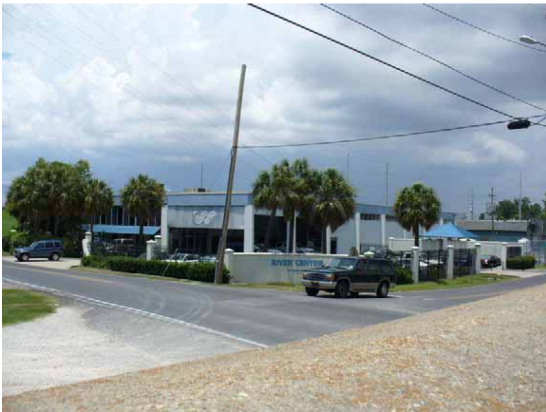
14. View of west area adjacent to the site, across wall, shopping area.