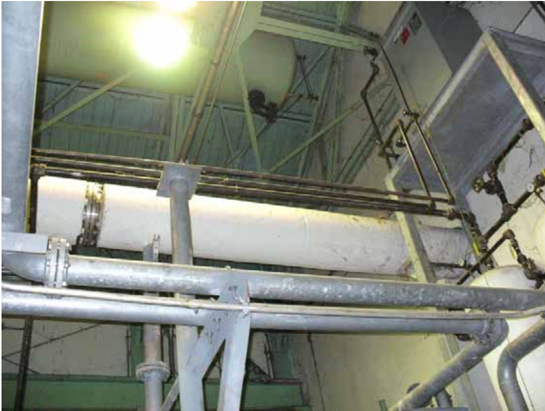
15 Pipe with suspect insulation.