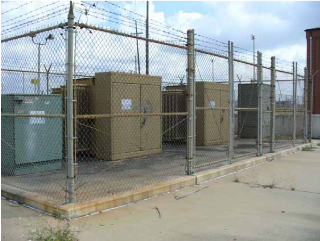
15. View of transformers, located on south side.