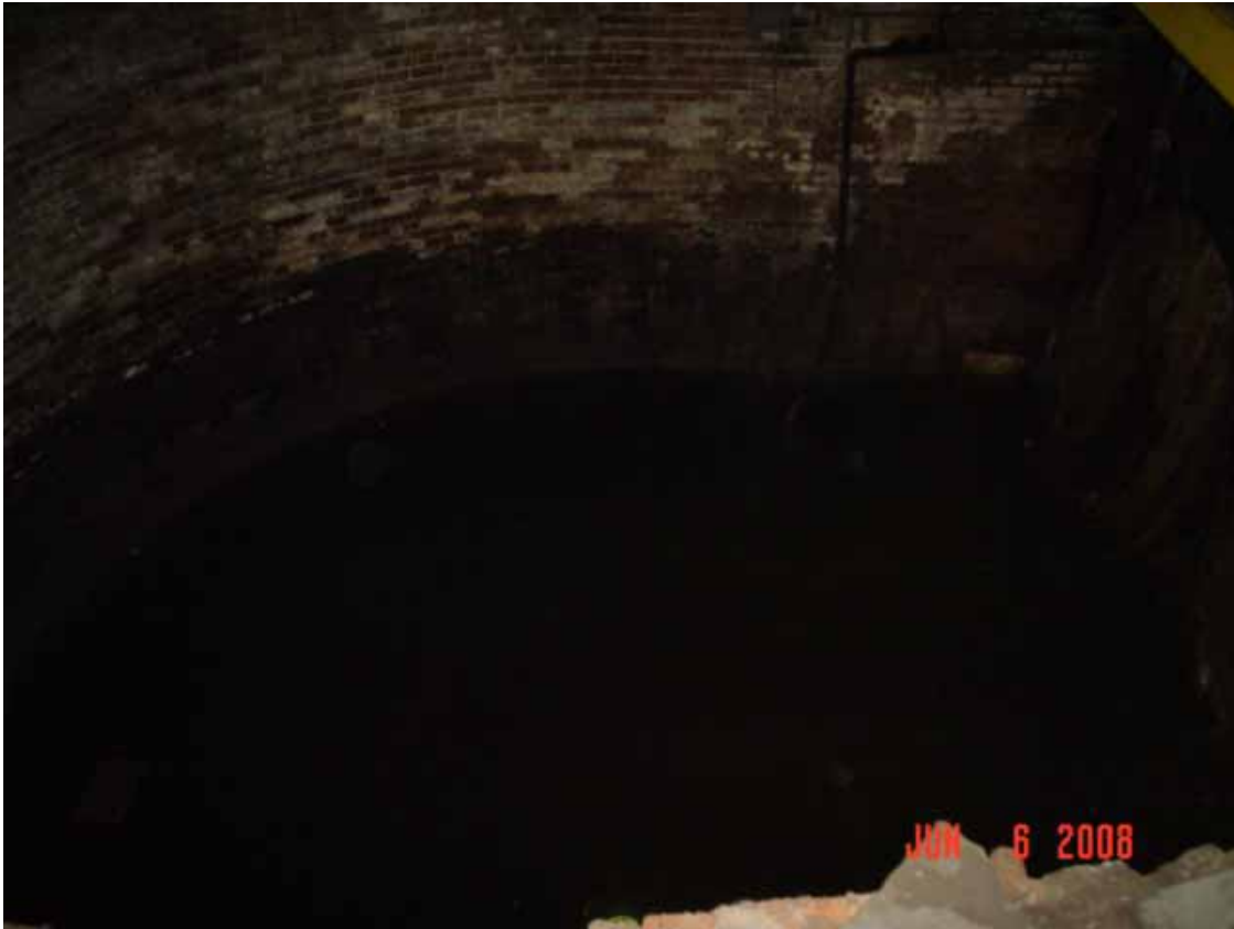
23. Bottom of hole.