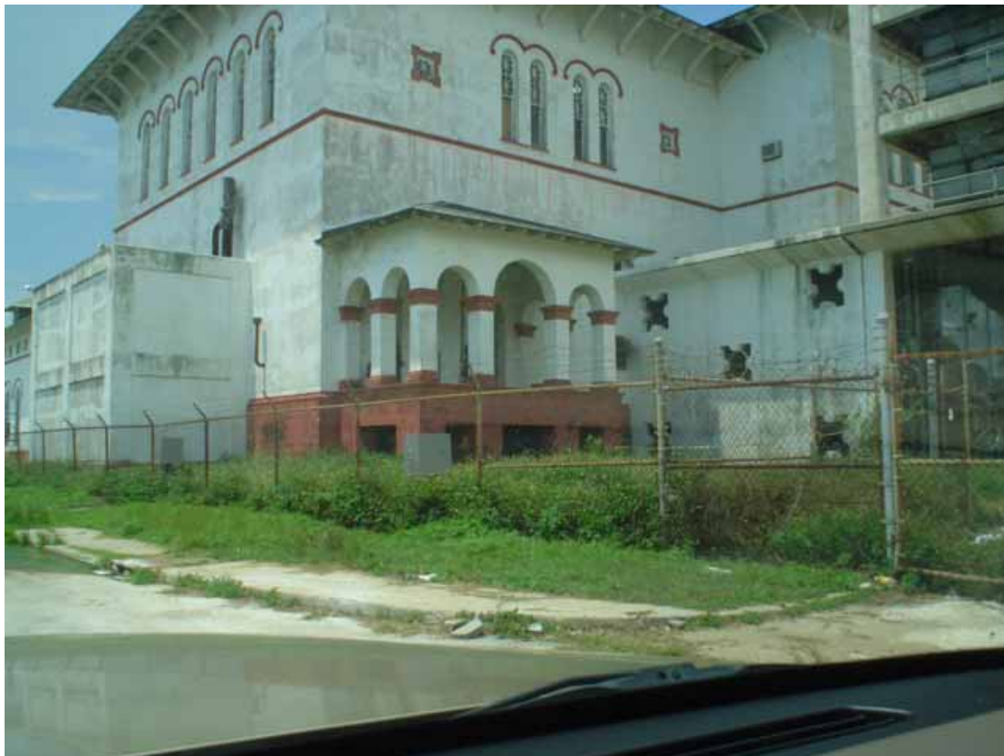
11. View of south side of low-lift building as seen from the south looking northwest.