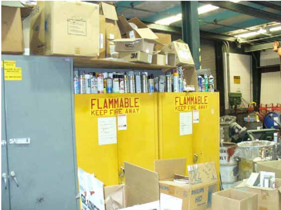
83. Flammable cabinet inside machine shop with flammables on top.