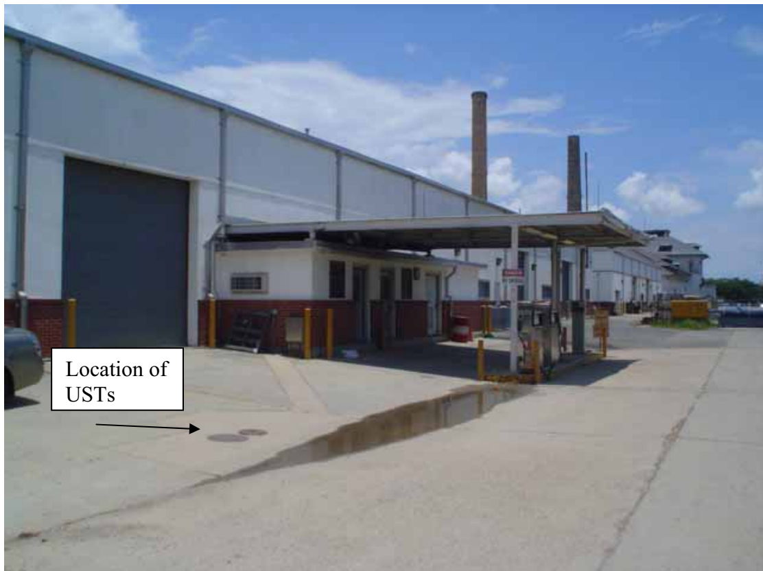
93. Gas station on south side of Spruce Street Warehouse, includes gas dispensers.