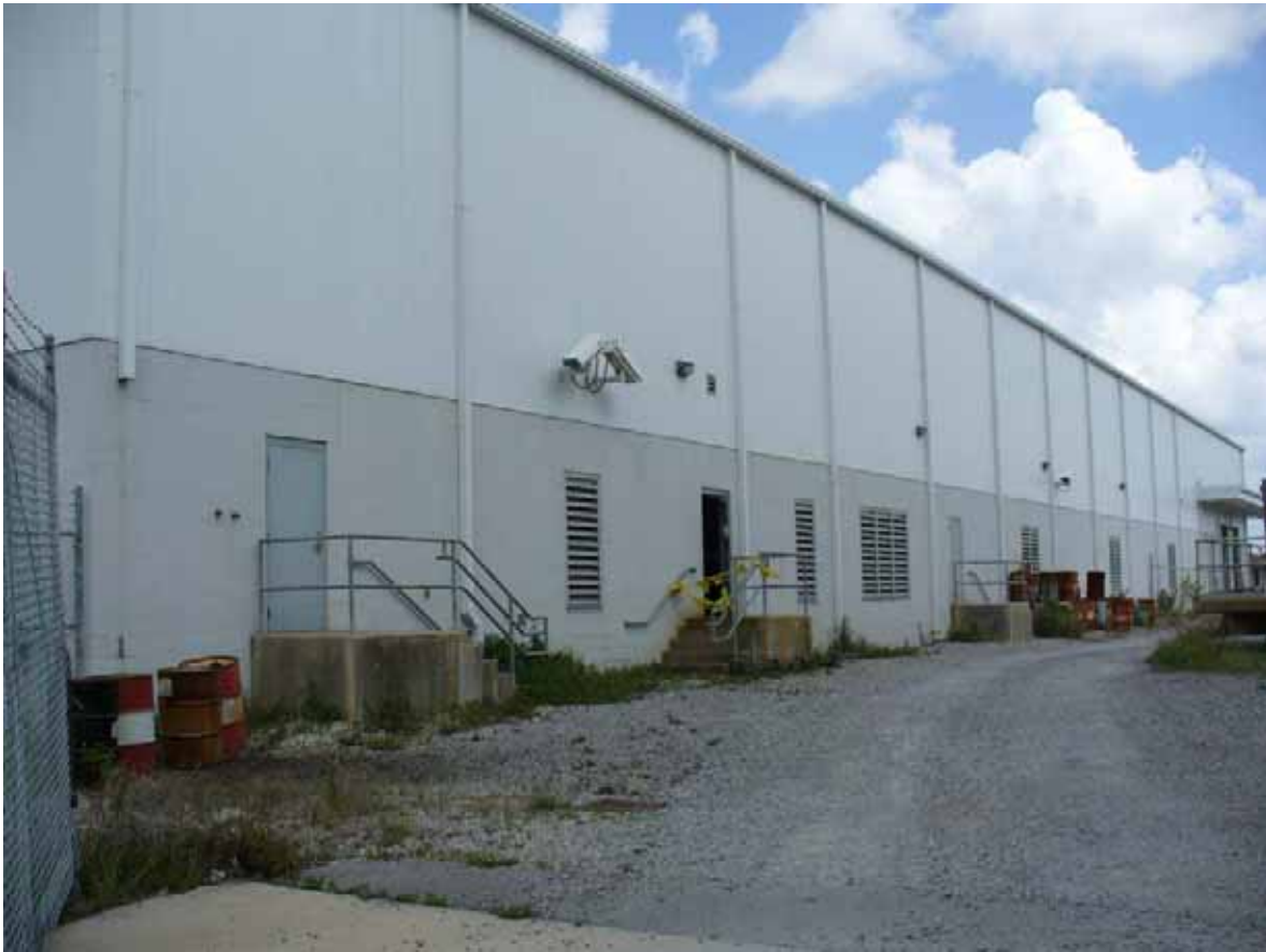
11. View of storage building, located in the west area adjacent to the site.