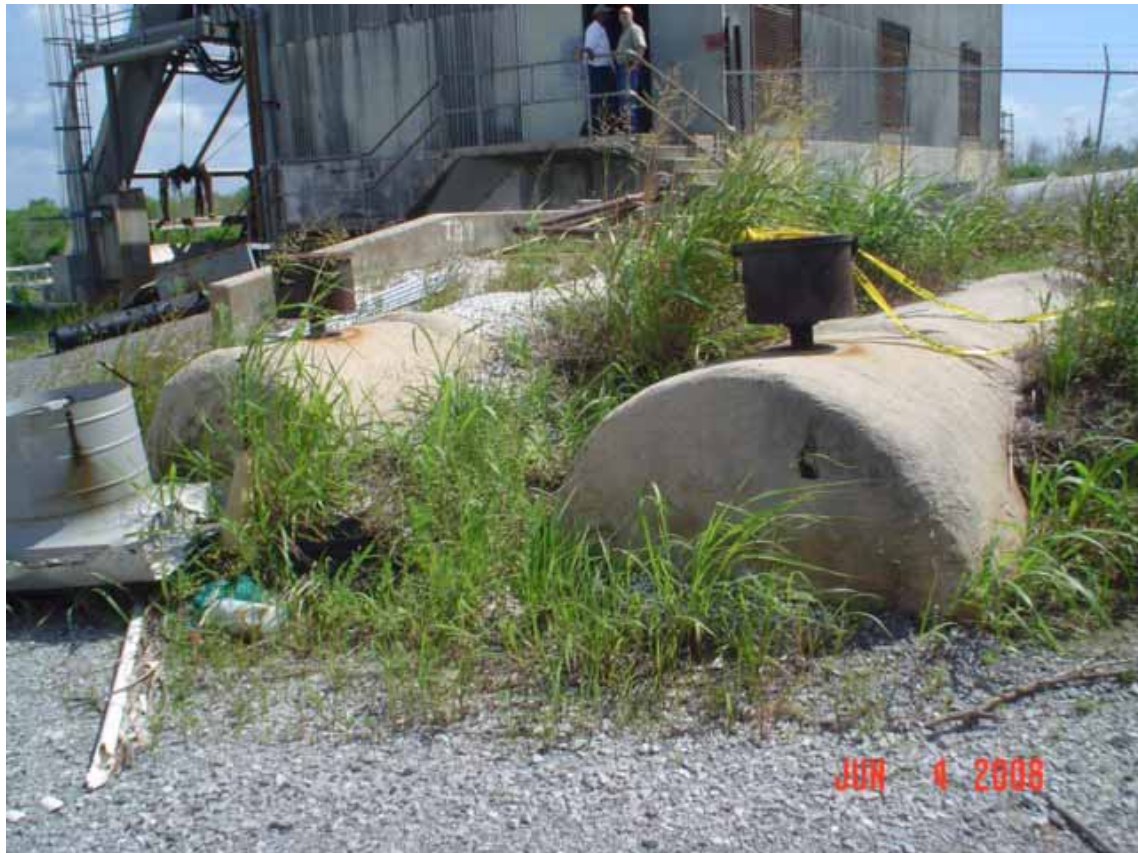
11. Partially buried UST diesel tanks in southwest area.