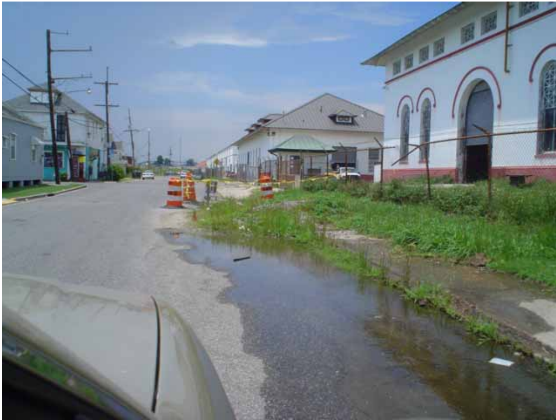
12. View of leak from low-lift building onto Spruce Street.