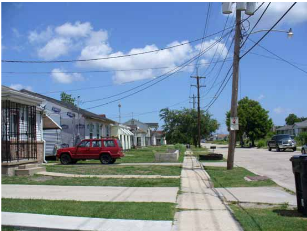
2. View of north area adjacent to the site, Warrington Drive, west side.