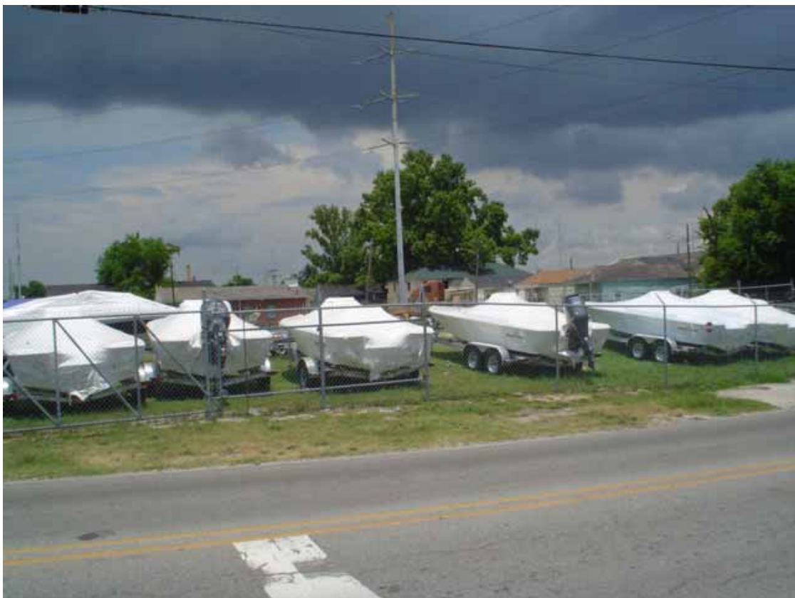
2. View of north area adjacent to the site, boat yard.