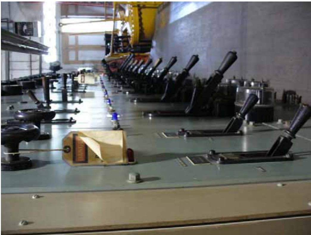
20. Switches inside building.