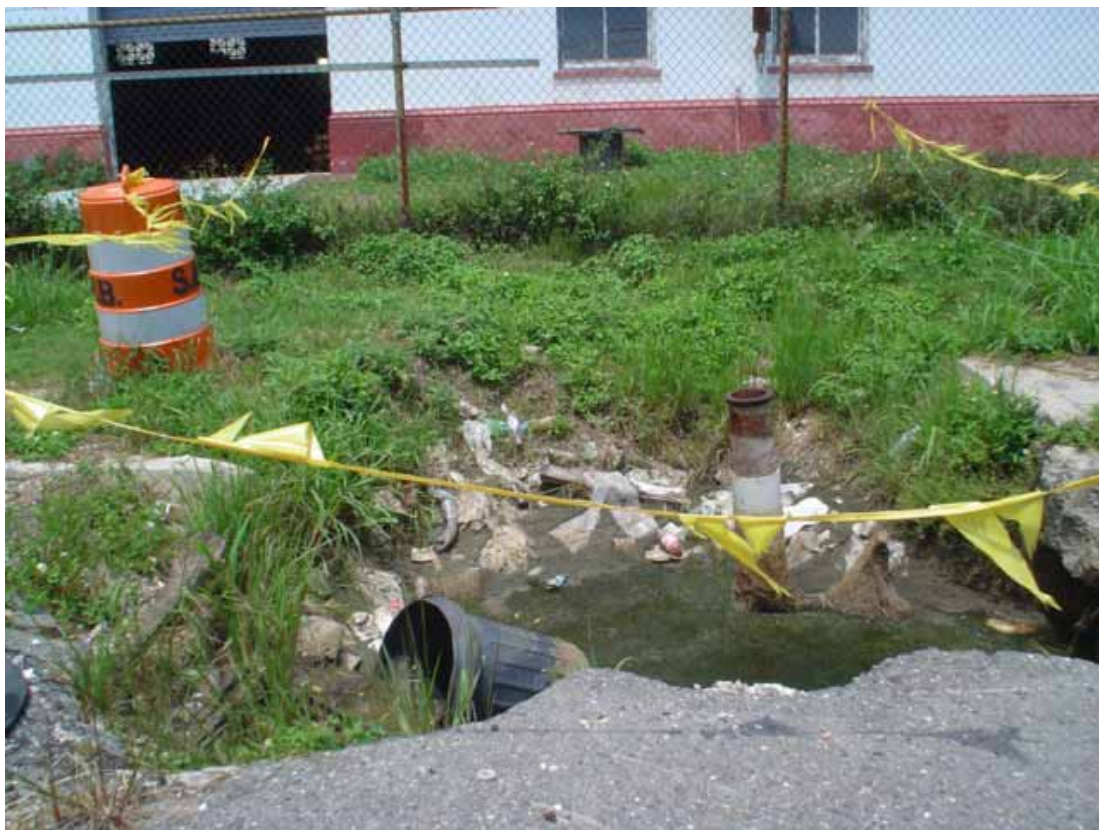
13. Close up view of damage due to leak from low-lift building.