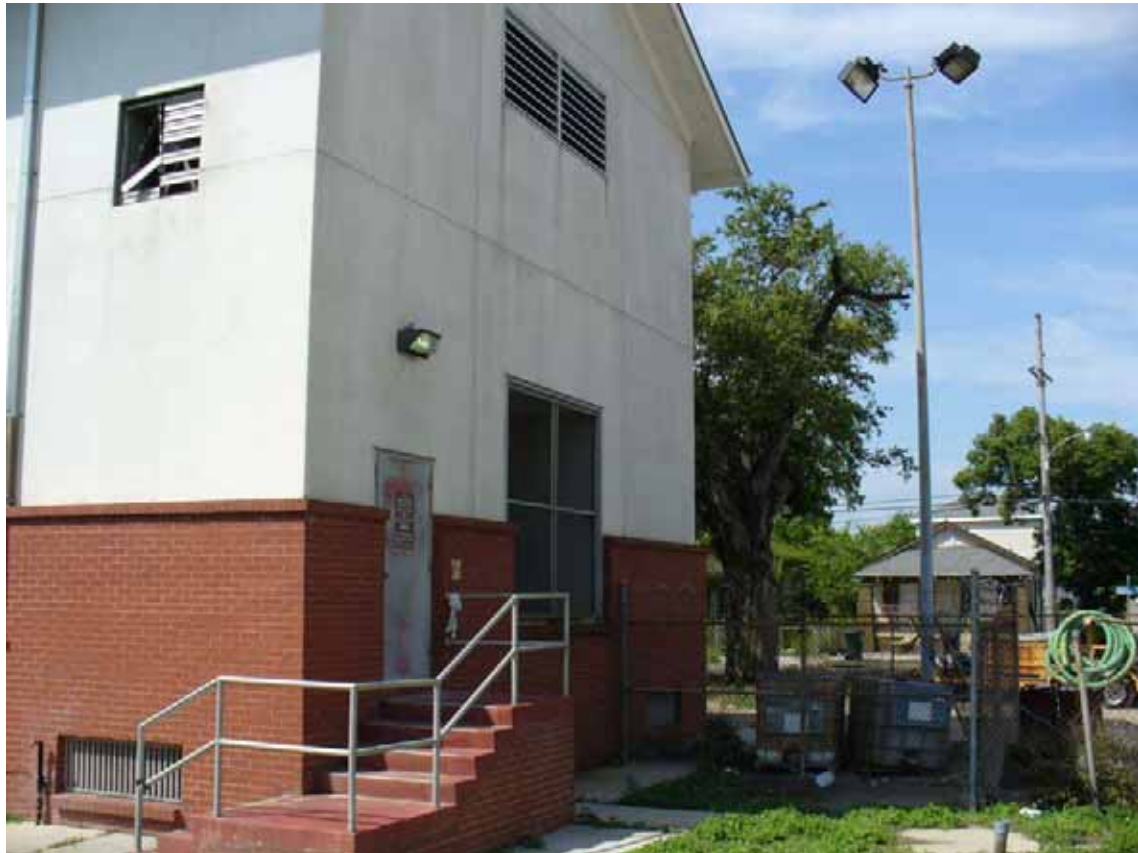
50. Gas compression building adjacent to power house.