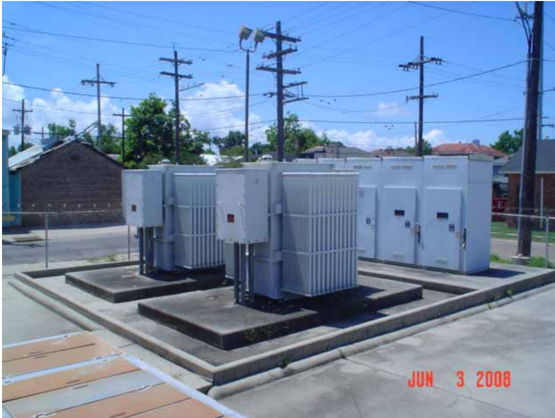
15. Transformers on property, and power lines in area.