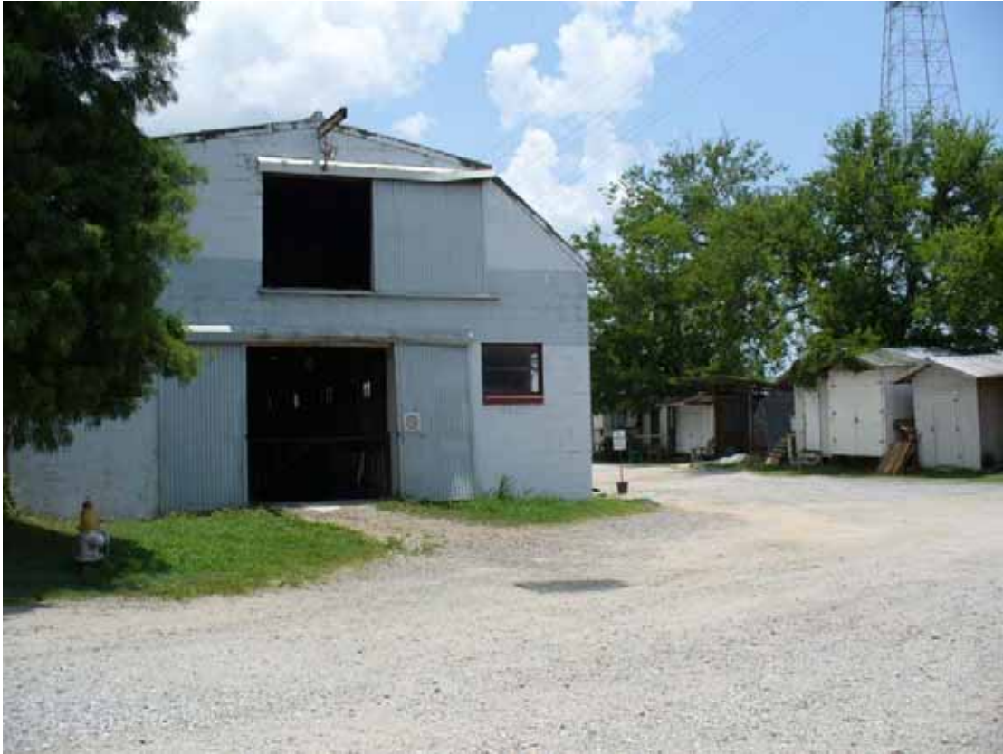
7. View of east area adjacent to the site, stables.