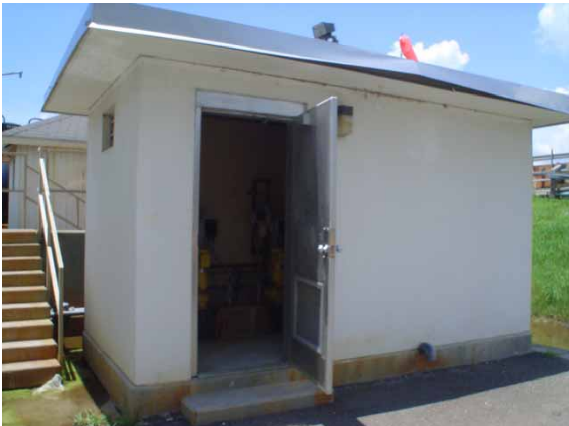
89. Example of polymer and ferric pump room buildings.