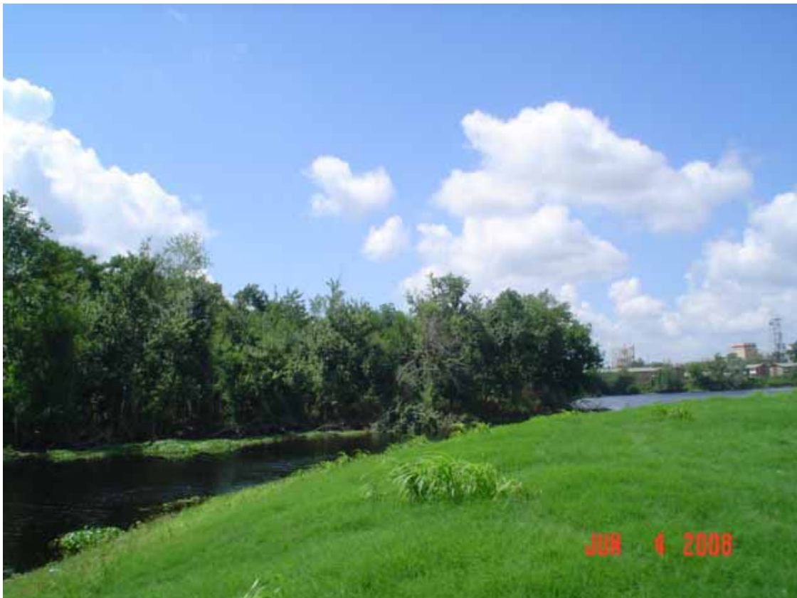
6. View of south area adjacent to the site, canal.