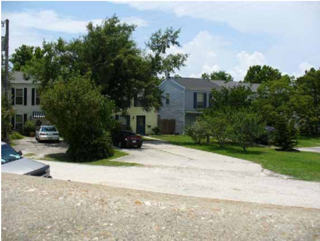
13. View of west area adjacent to the site, across wall residential.