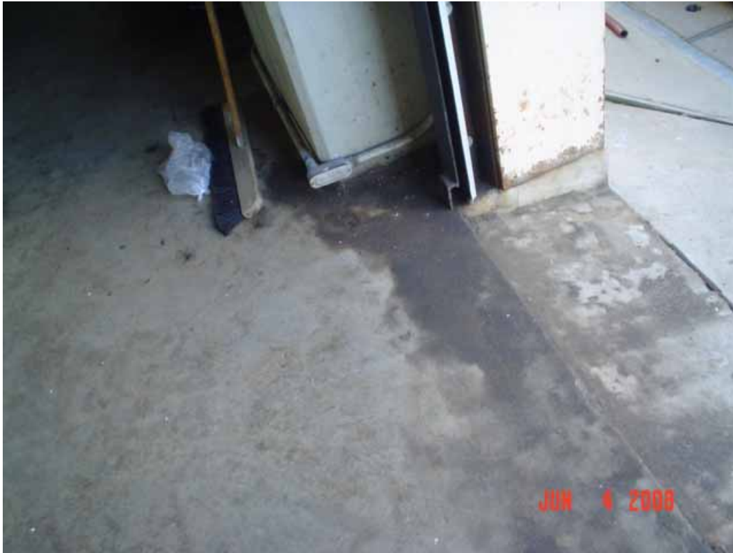
21. Oil stains by engine.