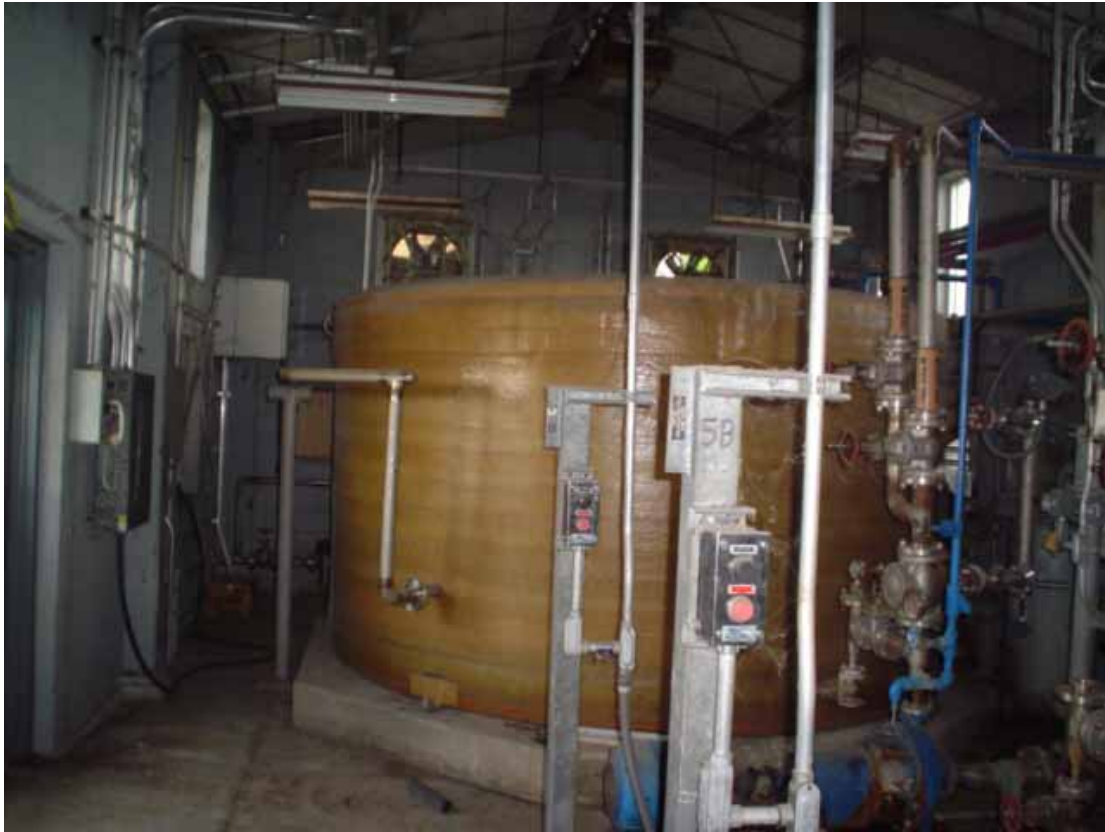
15. Purification treatment equipment, mixing tank for poly-electrolytes, no longer in use.