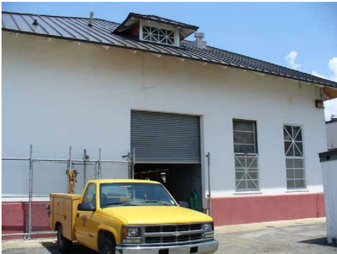
69. East side of meter building.