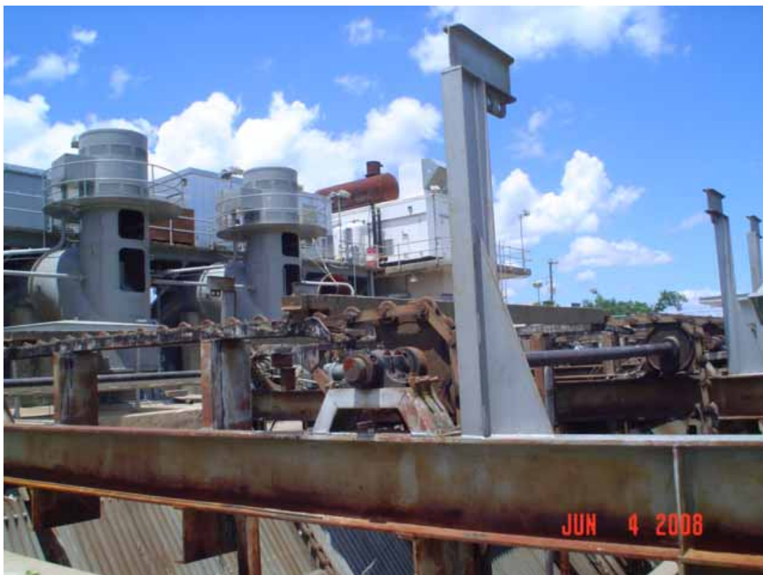
6. View of site as seen from the south direction.