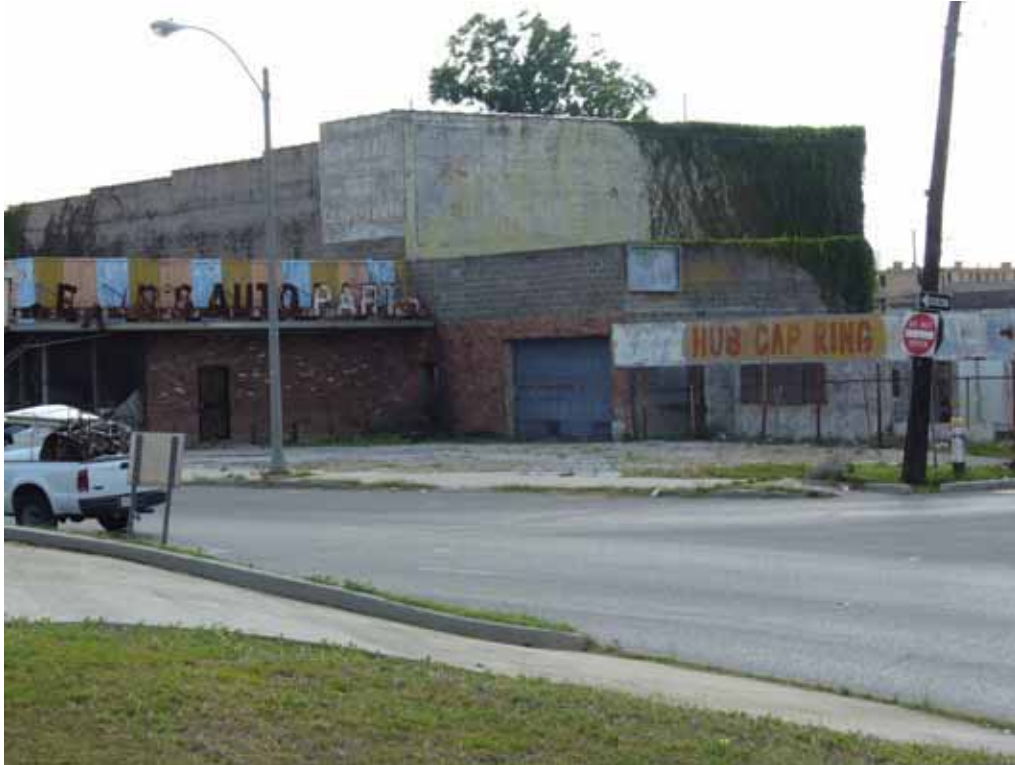
11. View of south area adjacent to the site, showing closed auto parts shop.