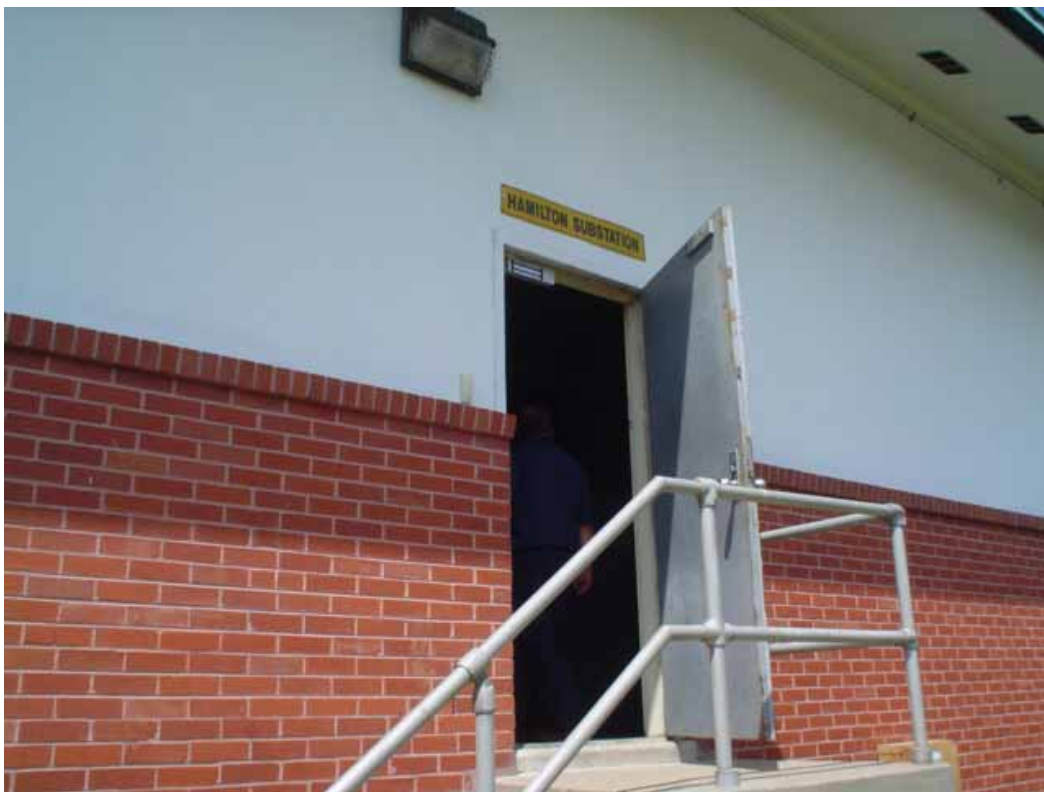
109. North side of Hamilton Street substation.