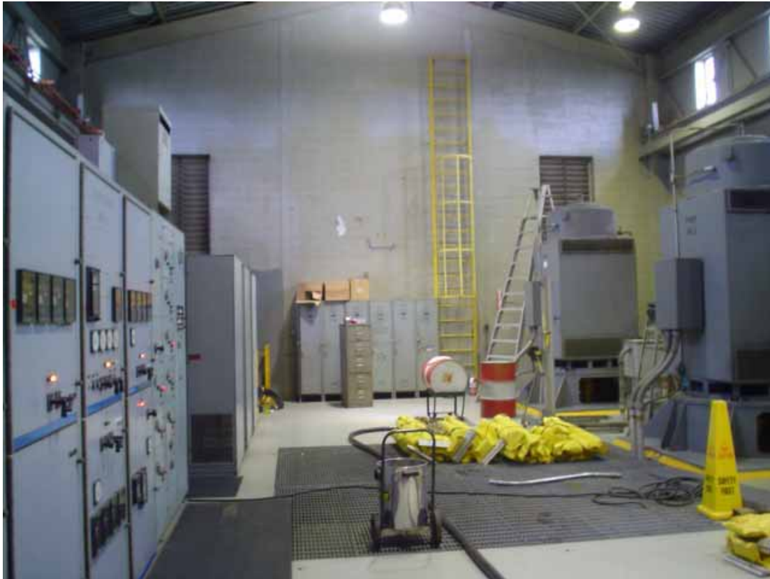
17. Inside main building, switches, drums and pumping equipment.