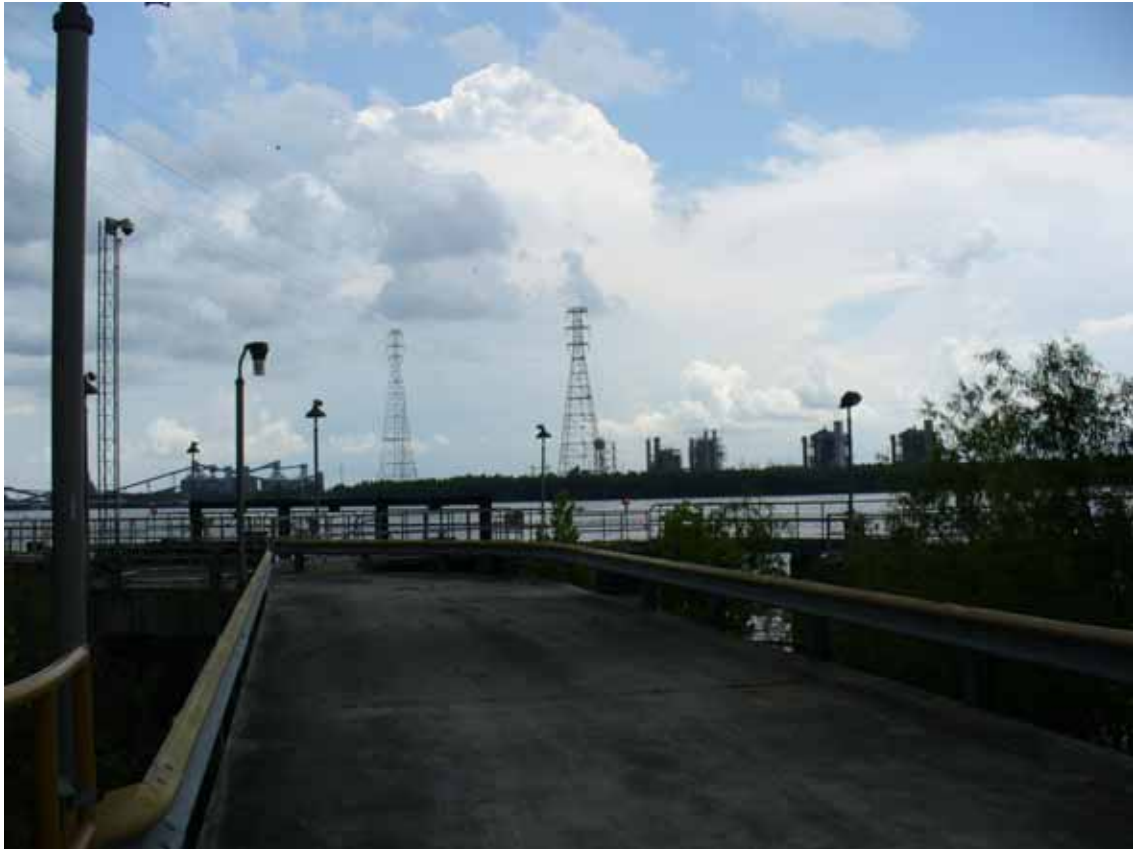
9. View of west area adjacent to the site, access to pier.