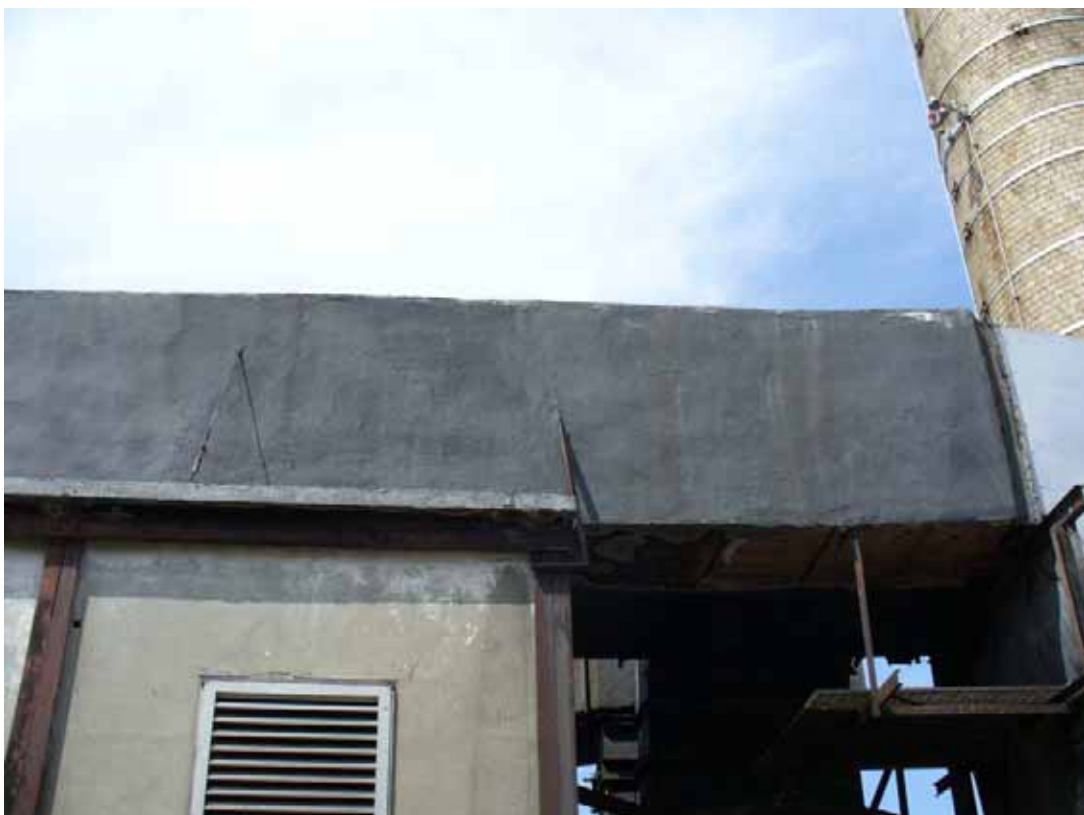
57. Asbestos wrapped duct insulation located on roof.