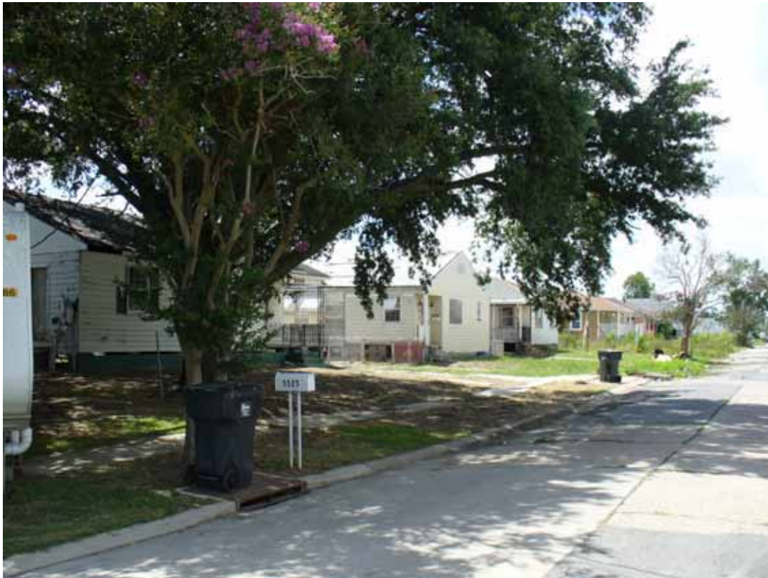
9. View of south area adjacent to the site, Warrington Drive, east side.