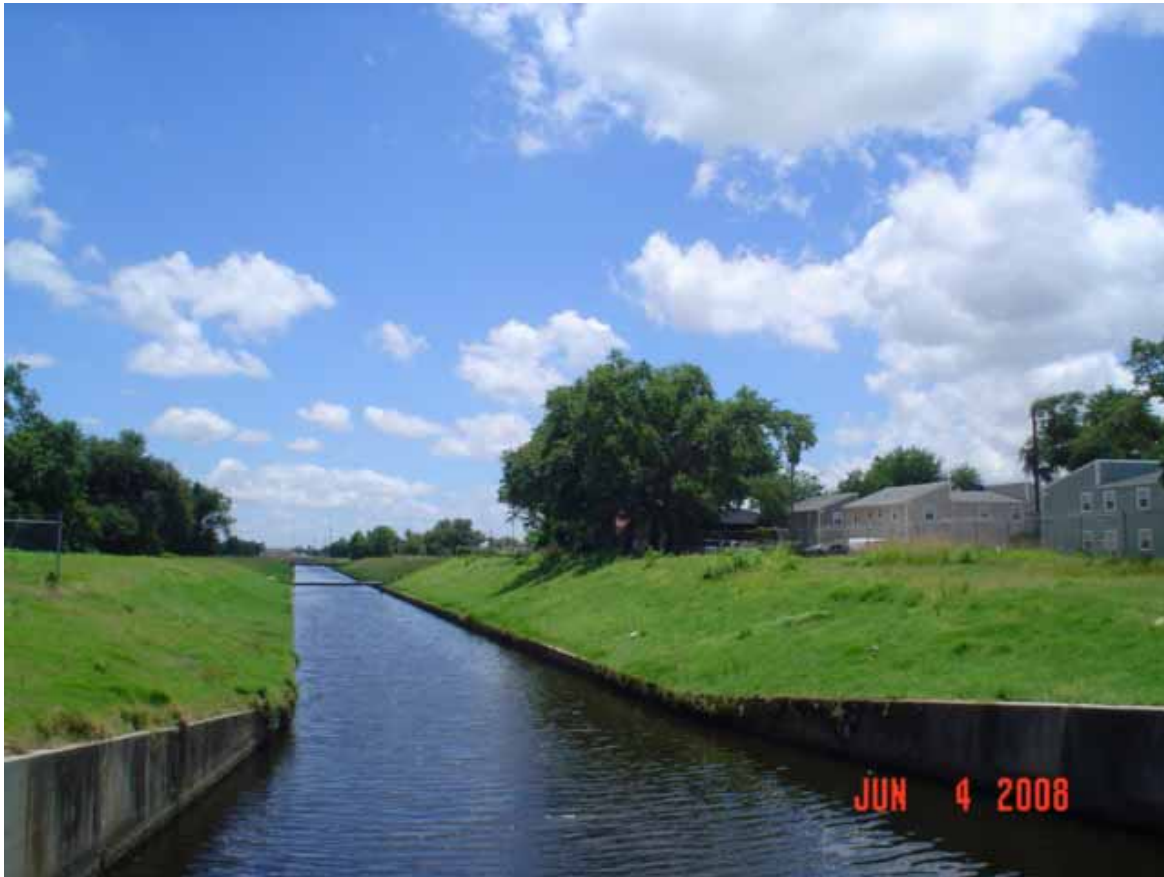
7. View of south area adjacent to the site, canal.