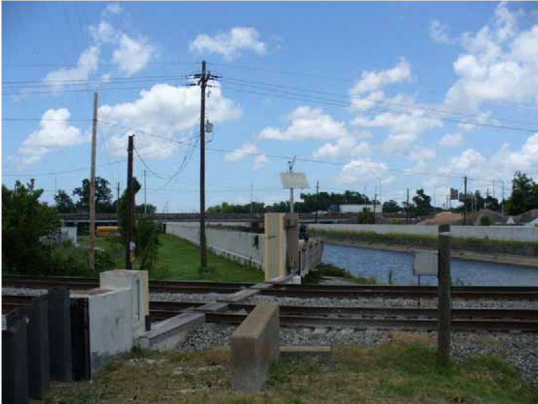
3. View of north area adjacent to the site, canal and railroad tracks.