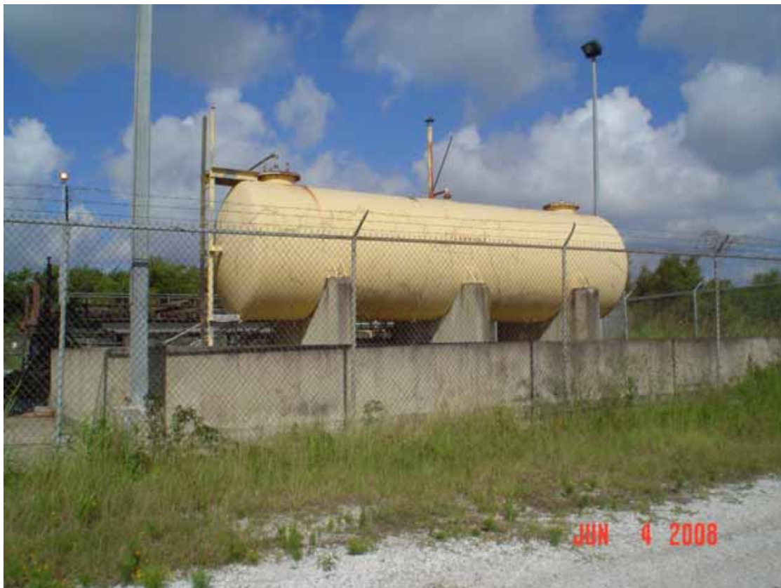
14. Fuel tank, northeast corner.