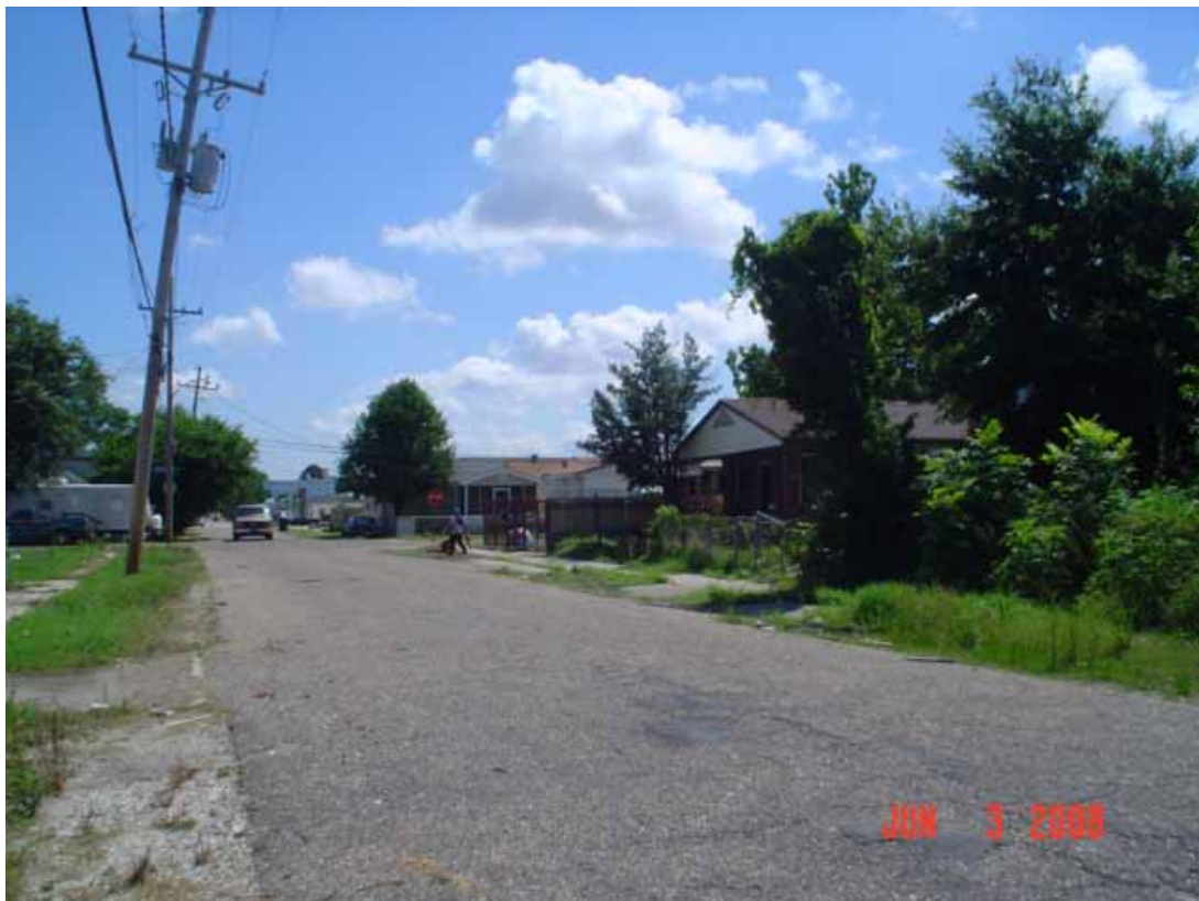
2. View of north area adjacent to the site, along Live Oak Street.