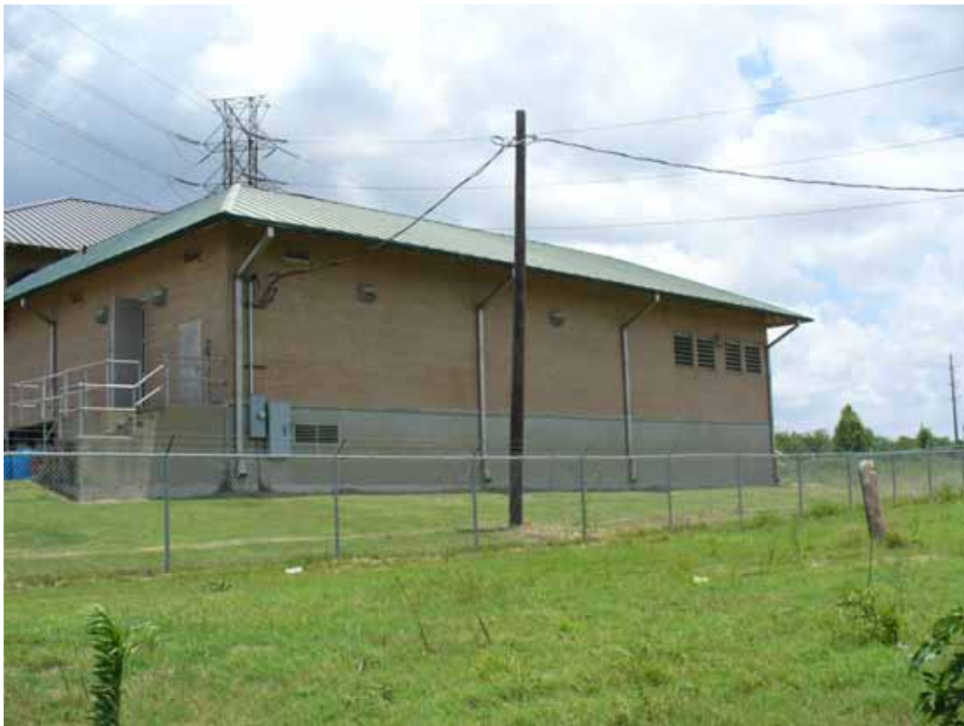
6. View of site as seen from the south direction.