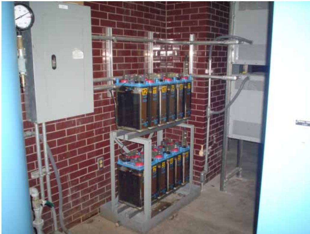
28. Battery banks near control center.