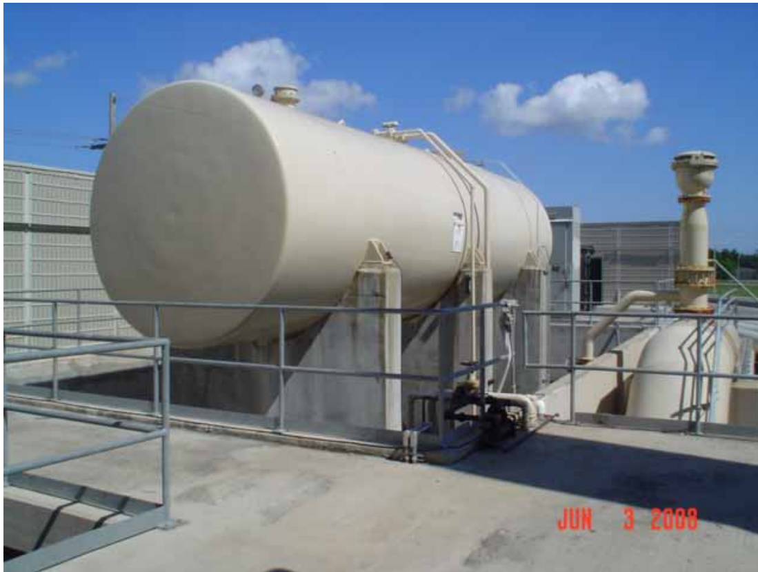
13. Fuel storage tank, northwest corner inside property.