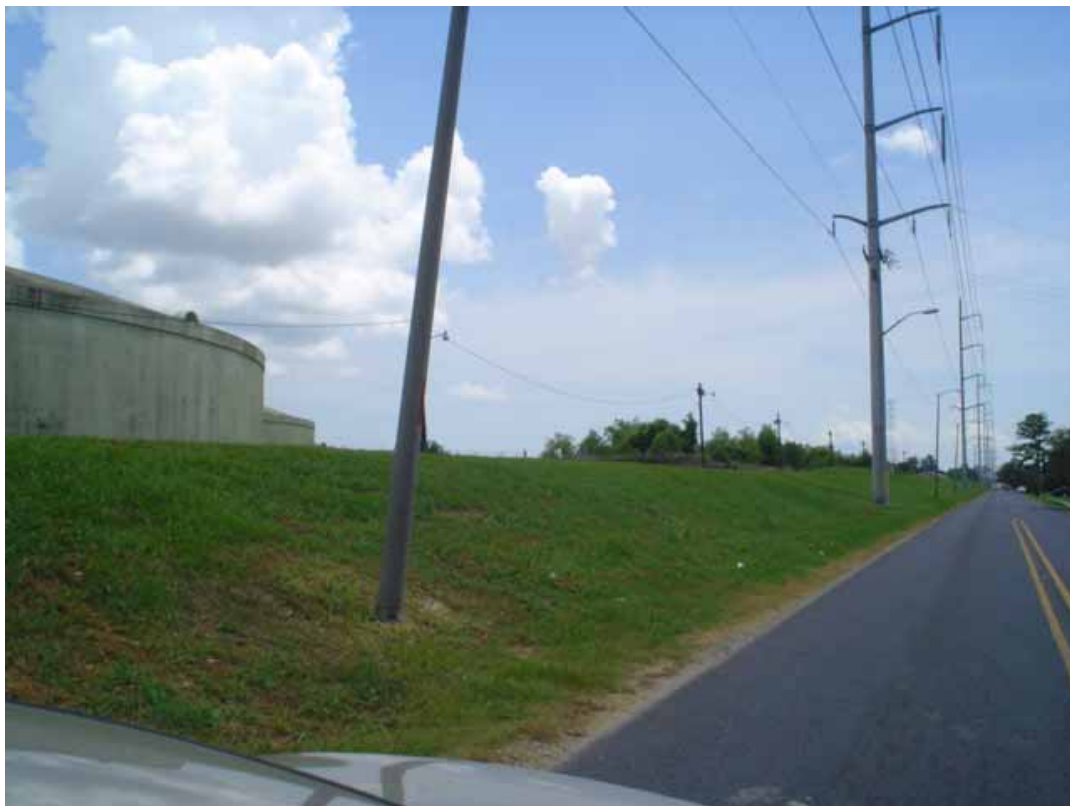
23. View of water tanks and Monticello Avenue from northwest corner of site looking south.