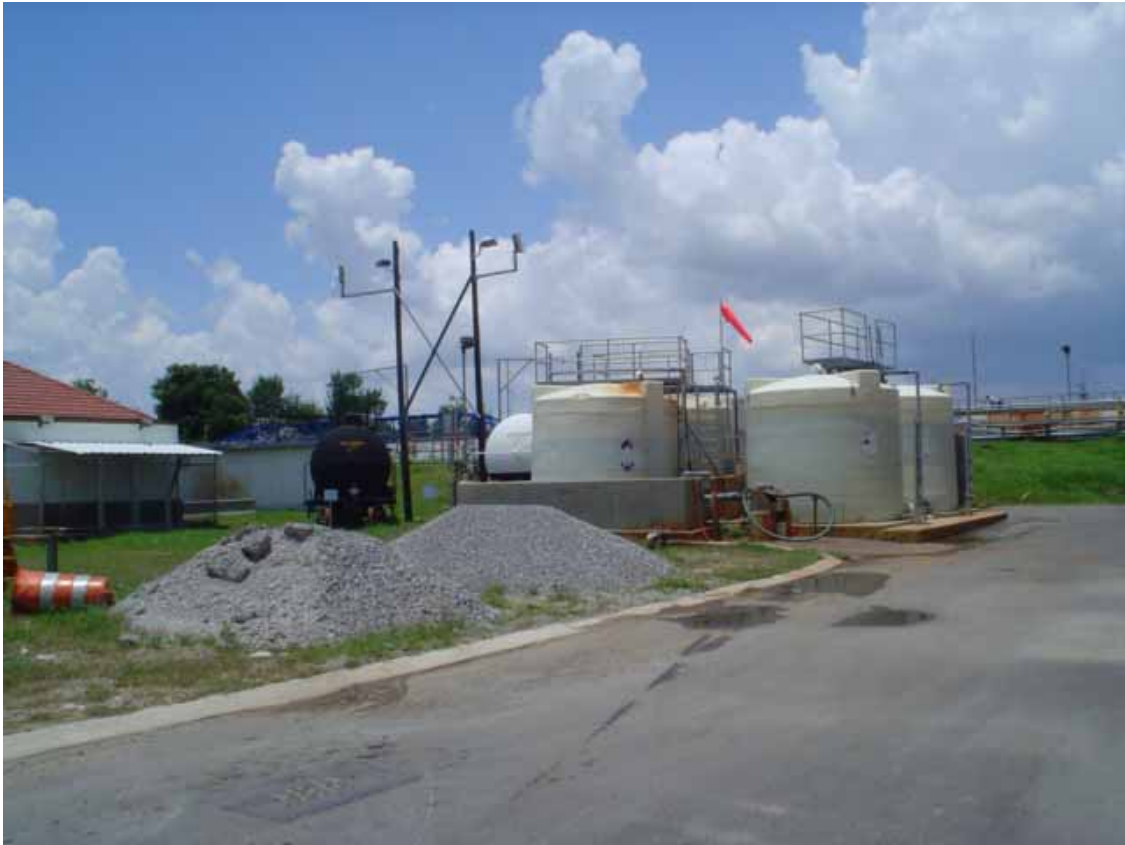
88. Two chlorine rail tanks, two ferric sulfate tanks and two clarifloc tanks southwest of chemical house.