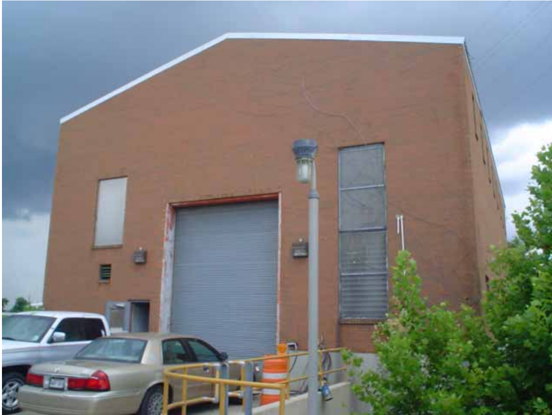
7. View of site as seen from the west direction.