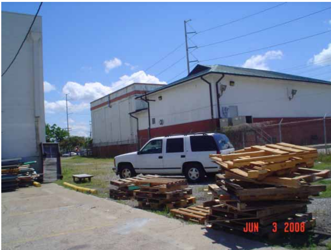
12. View of site as seen from the west direction.