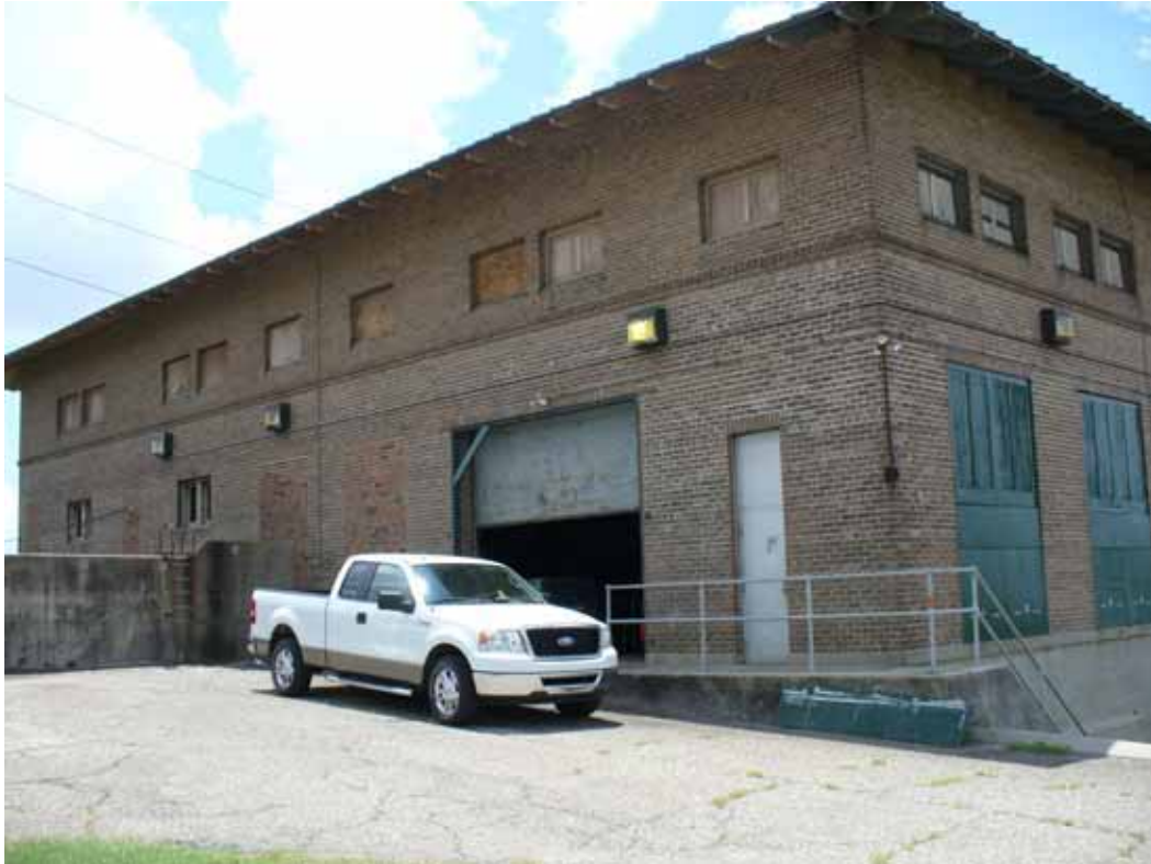
1. View of site as seen from the north direction.