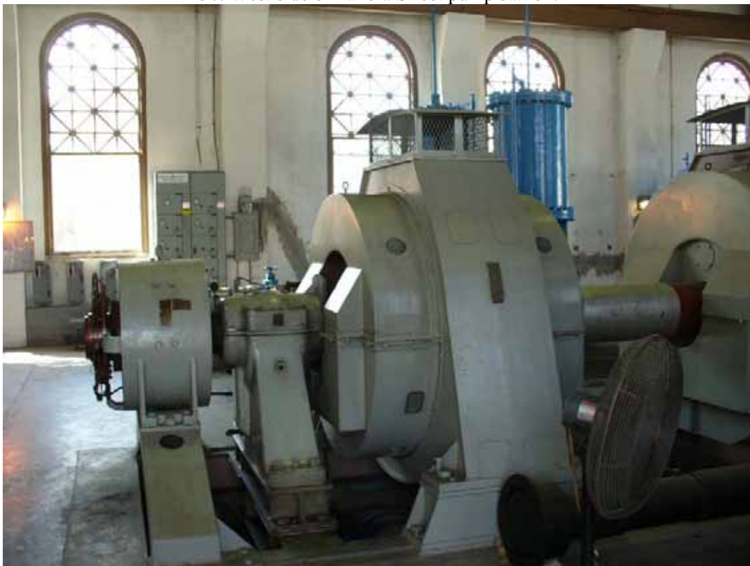
37. Pump located inside Panola Street station.