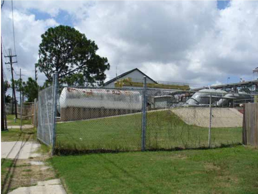
1. View of site as seen from the north direction. Observe abandoned chlorine AST's in foreground.