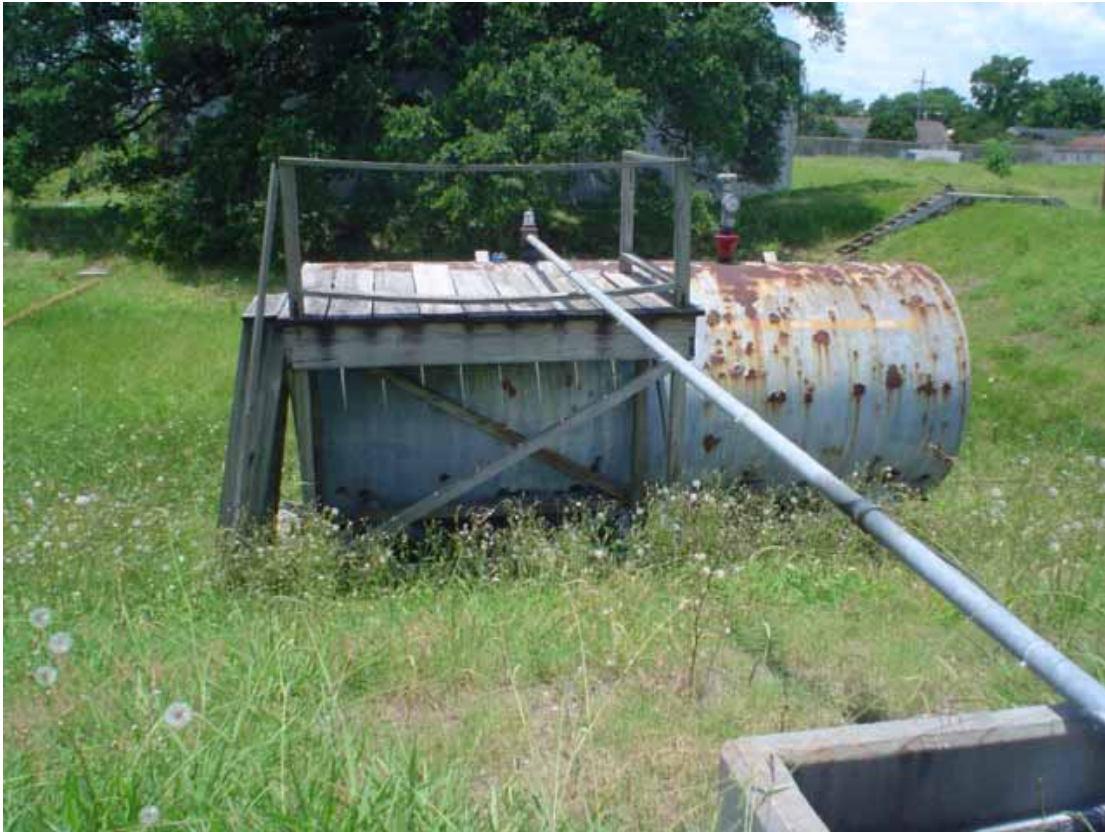
96. Diesel AST behind diesel pump that is stored in berm enclosure for one and a half million gallon tanks.