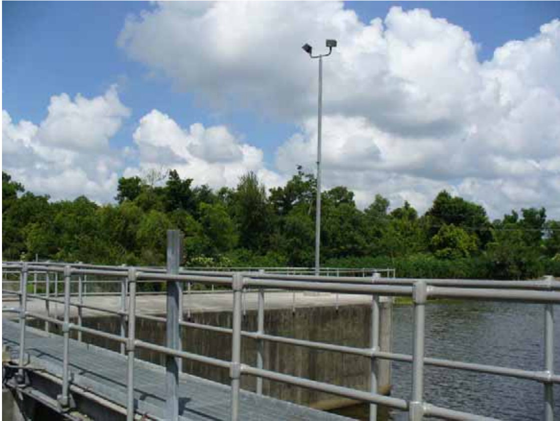
7. View of south area adjacent to the site, canal.