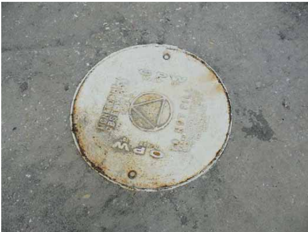
22. Underground storage tanks, for generator building located outside in west area.