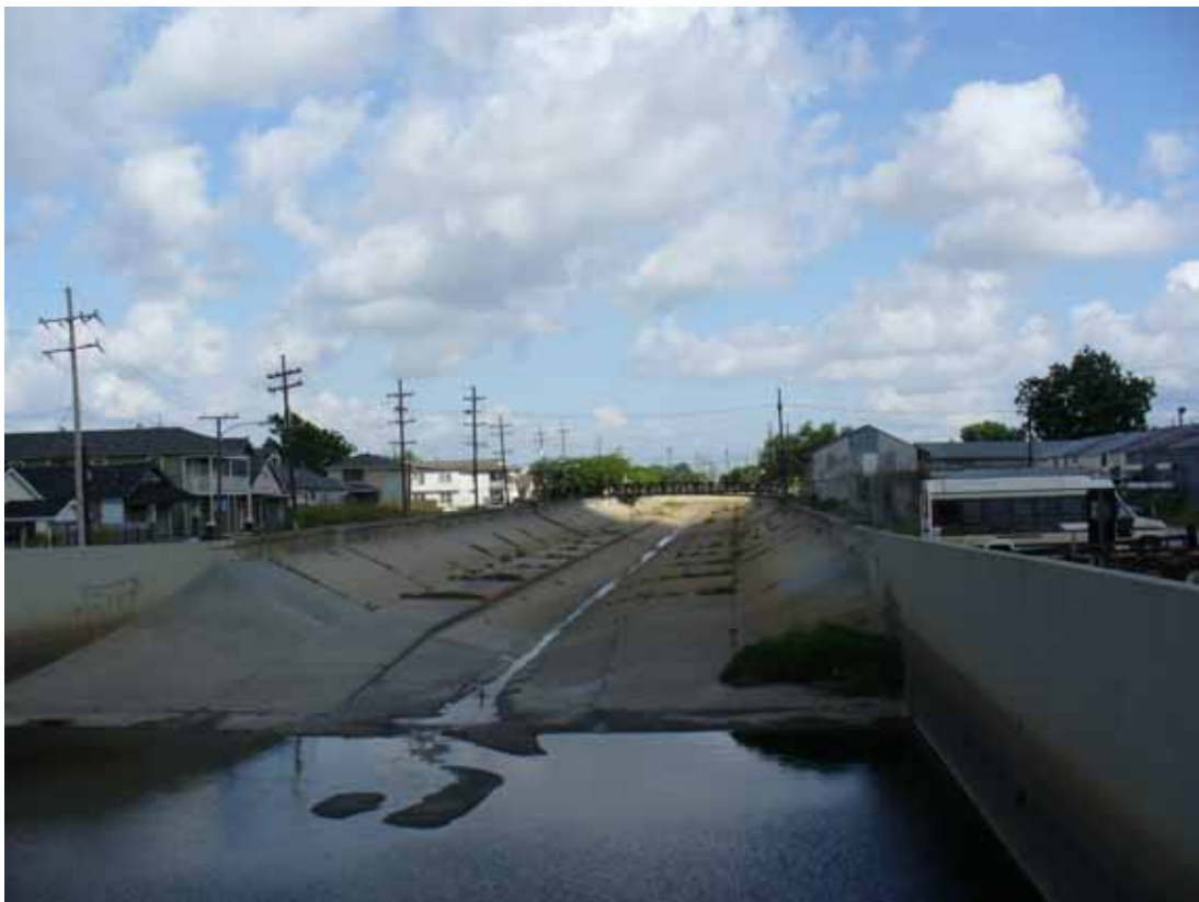
4. View of north area adjacent to the site, showing Palmetto Canal.