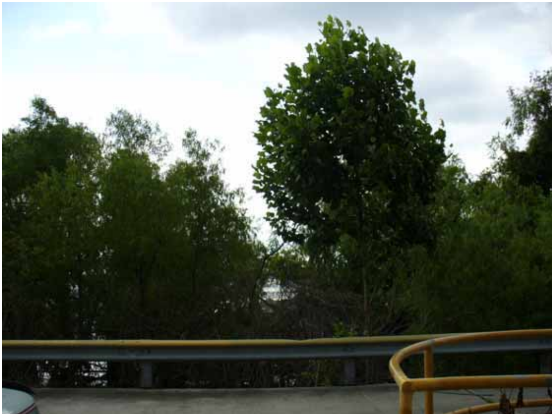
8. View of west area adjacent to the site.