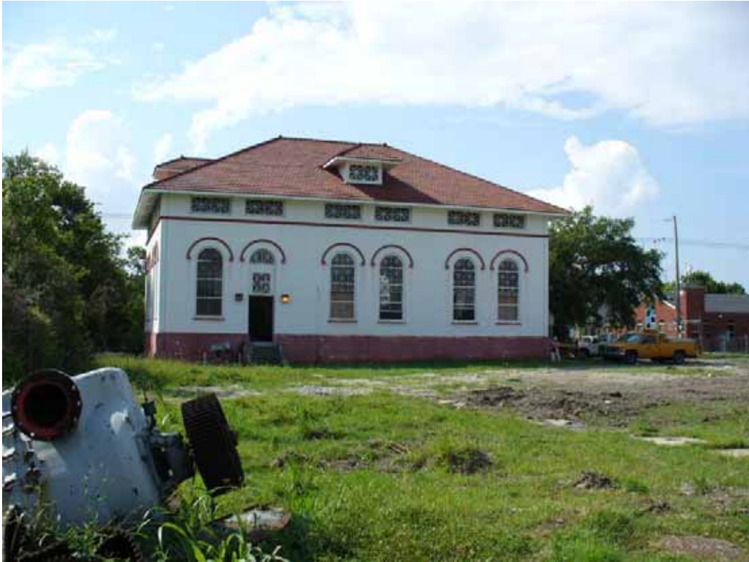
36. West side of Panola Street pump station.