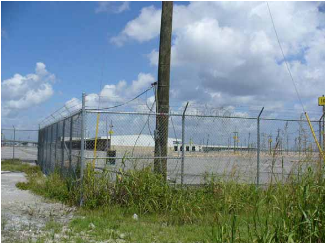
12. View of west area adjacent to the site in northwest direction