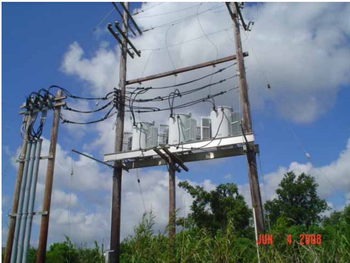
12. View of three transformers on stand located in northwest area from site.