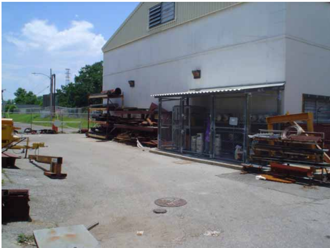
101. Northeast corner of Spruce Street warehouse showing propane tank cage.