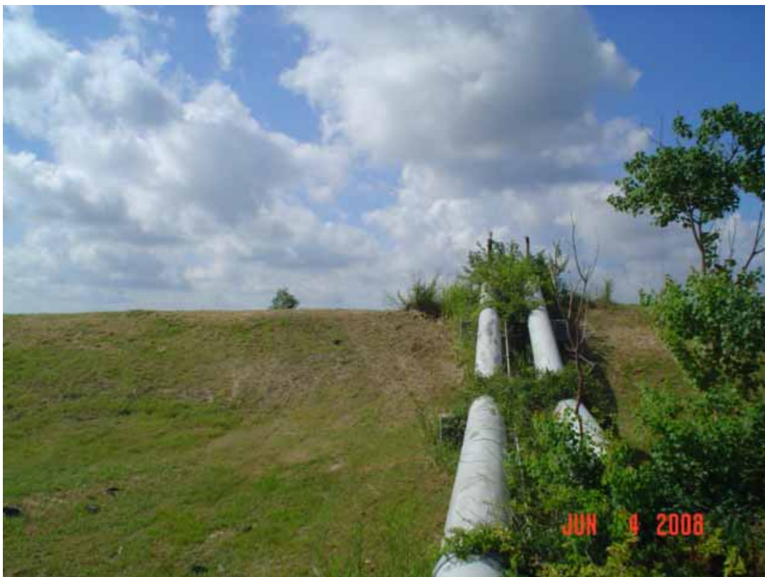
8. View of south area adjacent to the site, pipelines going over levee.