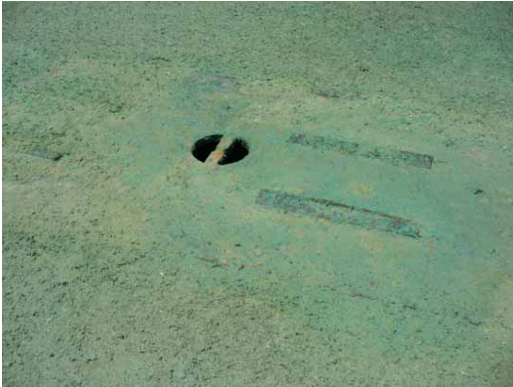
17. Large man-hole, pump drain access, across canal.