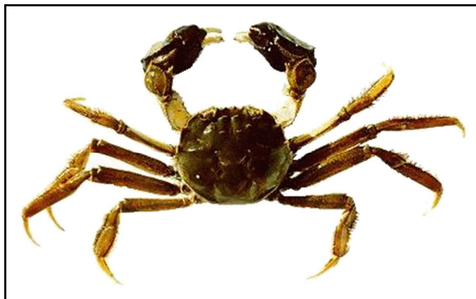
Figure 2. Chinese Mitten Crab, Eriocheir sinensis

The Chinese mitten crab Eriocheir sinensis (Figure 2) first appeared as an invasive species in German waterways during the early 1900's and has since spread through much of Europe (Clark et al. 1998). Detected in Lake Erie in 1973 (Nepszy and Leach 1975), it has since