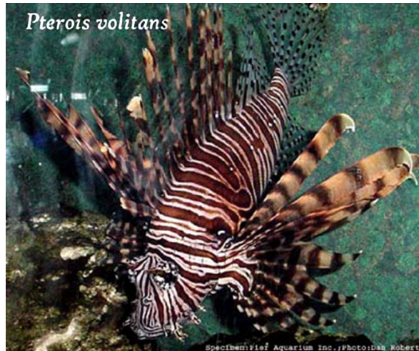
Figure 12. The Lionfish, Pterois volitans

It is presently found from Florida to Cape Hatteras, North Carolina. Although it is unlikely that breeding populations will be established further north than the Carolinas, juveniles have been reported as far north as Long Island, New York during the summer (Gare and Whitfield 2003). Lionfish are ambush predators that feed mostly upon small fish, crabs, and shrimp. Their effect on local ecosystems has not been assessed.