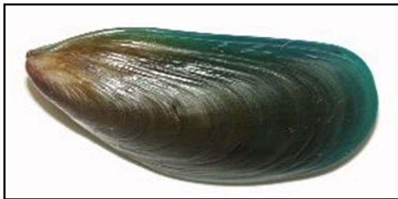
Figure 3. The Green Mussel, Perna viridis

Perna viridis , the Asian green mussel, is native to the tropical Indo-pacific with populations distributed between the South China Sea and the Persian Gulf (Figure 3). It first appeared in the western hemisphere in Trinidad in 1990 (Agard et al. 1992), then in Venezuela (Rylander et al. 1996) and in Tampa Bay, Florida in 1999 (Benson et al. 2003, Ingrao et al. 2001). At present, it is distributed from Tampa Bay to Charlotte Harbor, Florida and has been reported from Kingston Harbor, Jamaica (Buddo et al. 2003).