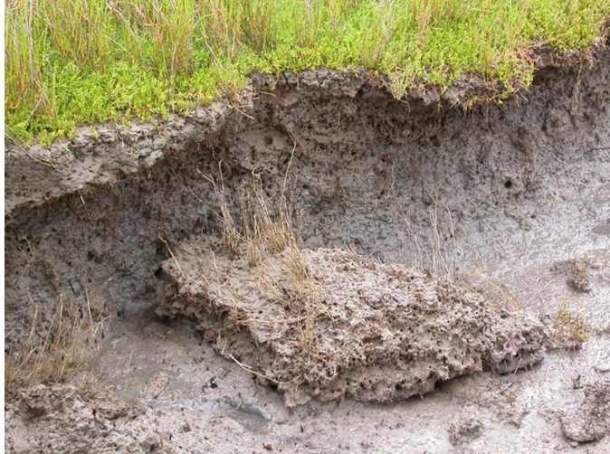
Figure 10. Marsh erosion due to burrowing

Sphaeroma appears to be a filter feeder; therefore, it does not actually consume the peat during burrowing (Talley et al. 2001). It can achieve densities as high as 8,000/m 2 . This species clearly has the potential to interfere with the long-term success of USACE wetland restoration efforts, however, it may be