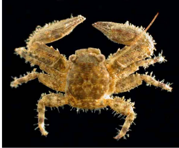
Figure 8. The Green Porcelain Crab, Petrolisthes armatus

inadvertently introduced outside its normal range. Hartman et al. (2001) suggest that the abundance of P. armatus may indirectly damage oysters by providing an alternative prey for predators of xanthid crabs. Xanthids feed on oyster spat, therefore, anything that reduces predation pressure upon them may lead to increased predation on spat. Field experiments by Hollebhone and Hay (2003) support this conclusion.