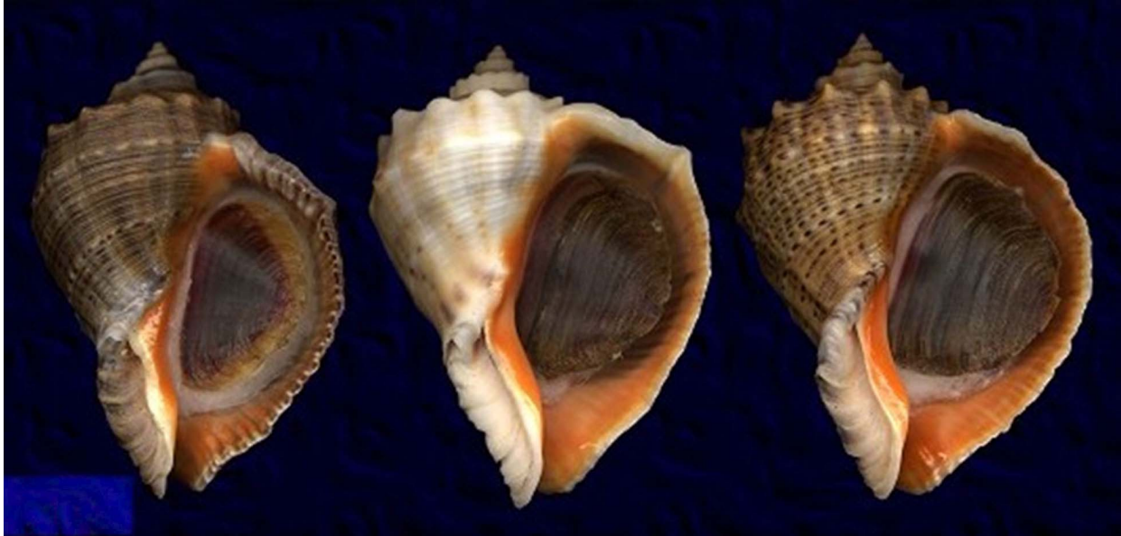
Figure 7. The Veined Rapa Whelk, Rapana venosa

Salinity appears to be a major factor determining the distribution of Rapana , particularly during its larval and juvenile stages. O'Neill (2001) reported that larvae begin to suffer mortality during 48-hr exposures to salinities below 15 ppt and cannot survive exposure at 10 ppt. The North American distribution of this species is limited to portions of Chesapeake Bay. Mann and Harding (2003) predict that bay currents will spread it to most of the lower western shore of the bay and even in the absence of separate introductions, it is likely to spread from Cape Cod to Cape Hatteras.