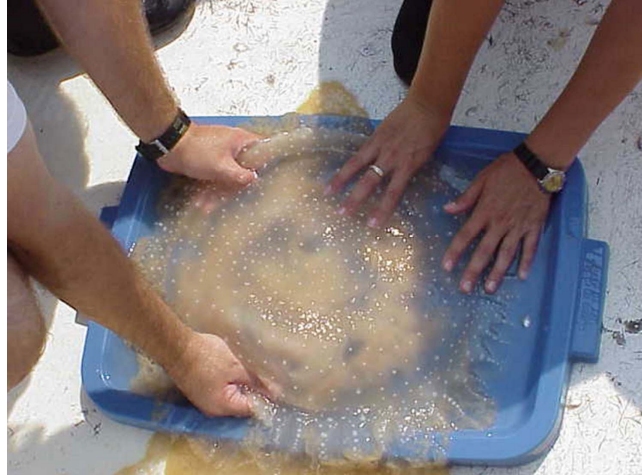
Figure 11. The Australian Jellyfish, Phylloriza punctata

Large masses of this species pose both a threat to fisheries and a severe inconvenience to the shrimp and fishing industries. The jellyfish clog trawl nets resulting in increased time to separate the catch and clean the nets. The primary concern in relation to this species is its potential to disrupt USACE fisheries restoration and enhancement projects.