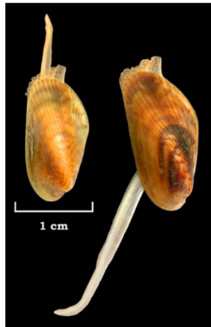
Figure 5. The Asian Date Mussel Musculista senhousia

The date mussel grows to about 32 mm total length, most of which (25 mm) occurs in the first of its two-year life span (Crooks 1998, Mistri 2002). It produces planktonic larvae that can remain in the water column as long as 55 days. The larvae preferentially settle out on muddy or sandy substrates. This species forms dense beds that significantly alter nearby sediments and native benthic assemblages (Crooks