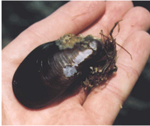
Figure 4. The Brown Mussel, Perna perna

Perna perna , the brown mussel, is also a potential threat (Figure 4). A native of South Africa, it has successfully invaded South America from Uruguay to the Caribbean (Gulf States Marine Commission 2003). It was first detected in the United States on a Port Aransas, Texas jetty in 1993 and is now distributed from Freeport, Texas to Veracruz, Mexico (Hicks and Tunnel 1993, 1995). Slightly smaller than its congener, the brown mussel shares most of its biological