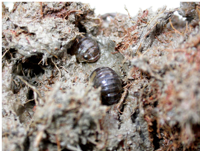
Figure 9. Sphaeroma quoyanum

Sphaeroma quoyanum is a marine isopod similar in size and shape to the common garden pillbug (Figure 9). Native to Australasia, it is a wood-boring species most likely introduced on the hulls of ships during the California gold rush. It is presently distributed from San Diego Bay,