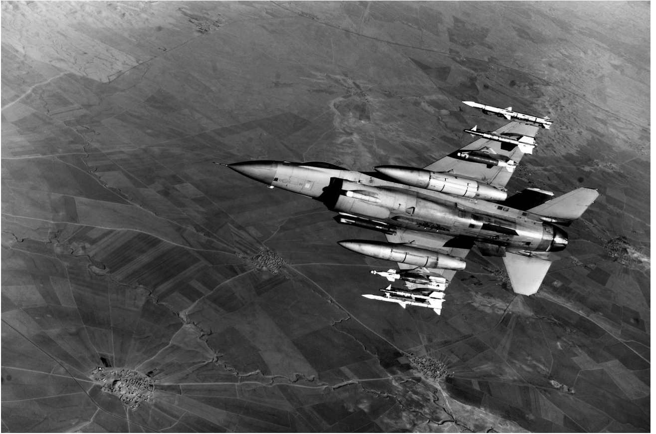
Falcon and Farmlandn