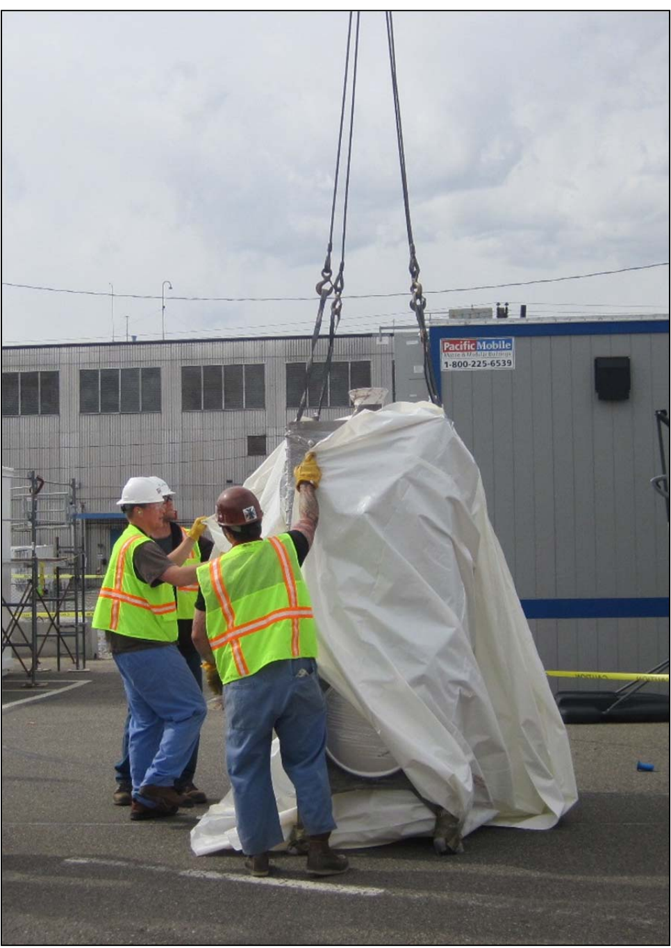
A section of glovebox 179 removed from the Plutonium Process Support Laboratory at the Plutonium Finishing Plant is prepared to be loaded into a container for shipment and disposal.

(ERDF), including gloveboxes 179-6, -9, -10, -11, and -12. Gloveboxes HA-21I, conveyor HC-4, two sections of the HC-3 conveyor, and two sections of the HA-28 conveyor (-28K and -28L) were also loaded for shipment to PFNW. Waste drums containing size-reduced sections of the WT-4 and -5 gloveboxes removed from the 242-Z building were shipped for disposal as TRU waste. Work documents were completed to support removal of more than 250 final HEPA filters from two deactivated filter rooms, which will be performed by PFP maintenance resources with support from the process vacuum system removal team.