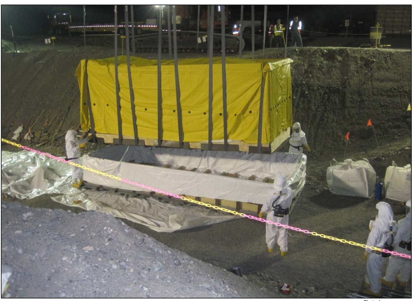
Workers perform a critical lift of Box 27 onto a shoring base in Trench 17 of the 3A burial ground.