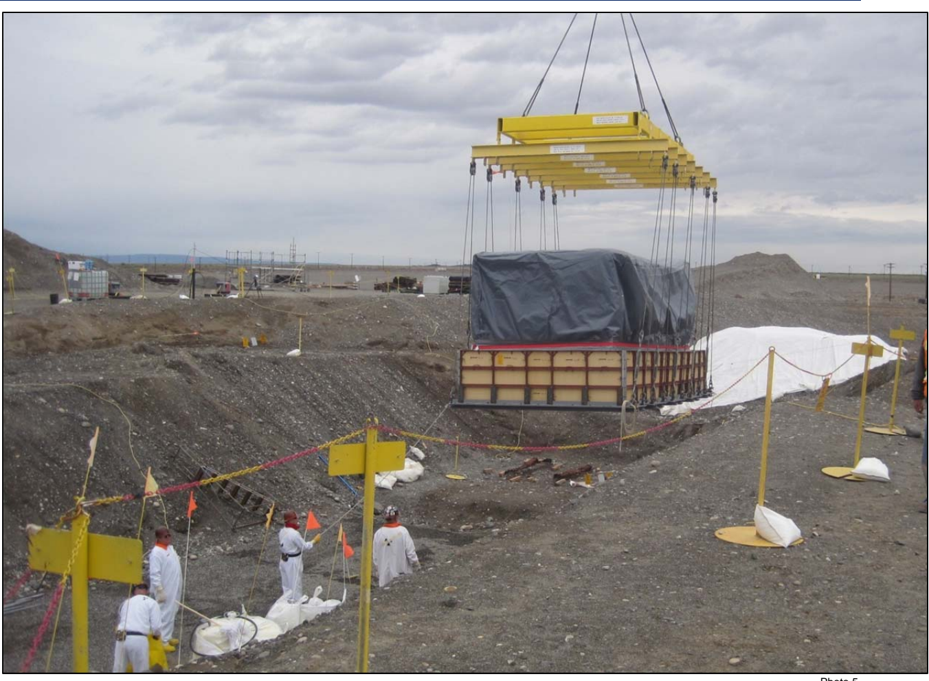
Box 27 is removed from Trench 17 of the 3A burial ground by a crane.