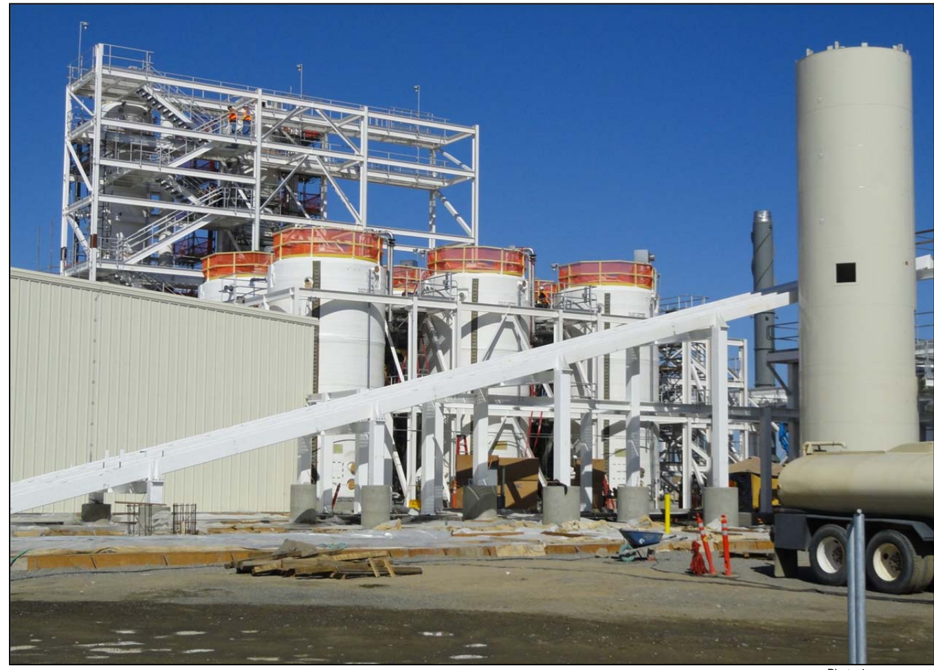
Construction of the 200 West Groundwater Treatment Facility nears completion.