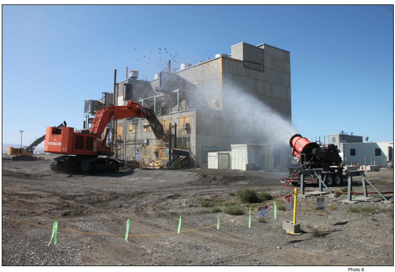
Demolition begins on the 284-W Power House after asbestos abatement was completed last week.