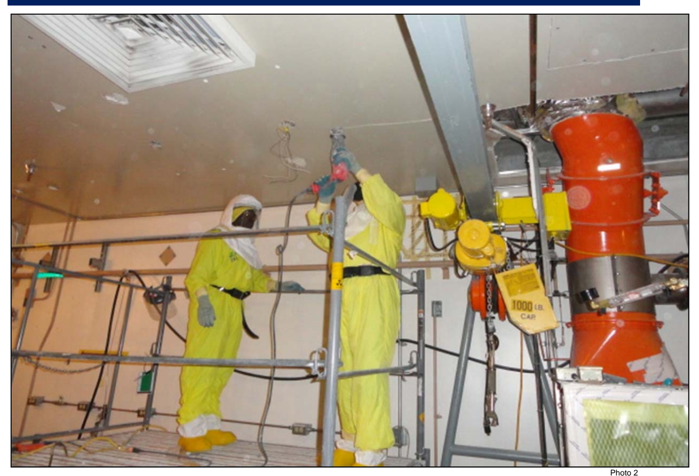
D&D workers removing ceiling from room 637 of the Plutonium Finishing Plant 2736-Z/ZB Vault Complex to expose contaminated ducting prior to painting.