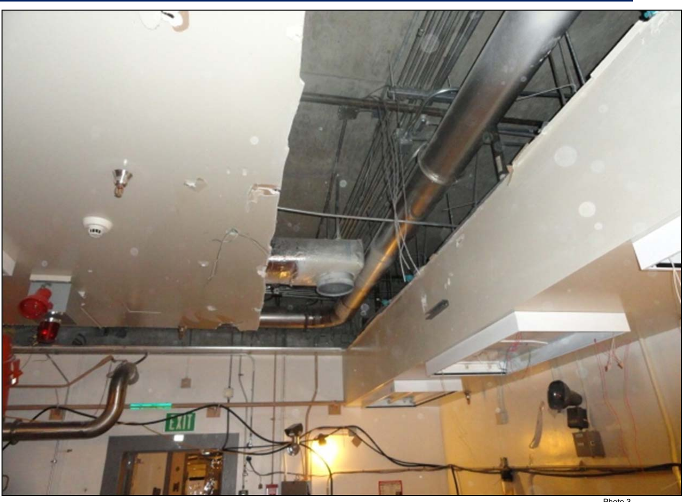
Contaminated ducting to be painted and removed from room 637 of the Plutonium Finishing Plant 2736-Z/ZB Vault Complex.