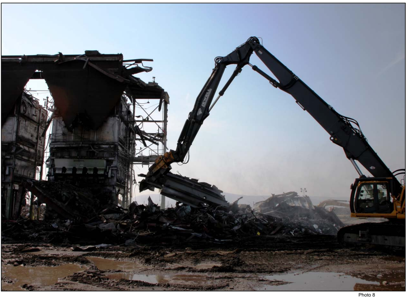
The west end of the 284-W Power House where the coal conveyor stood, just days after demolition began.