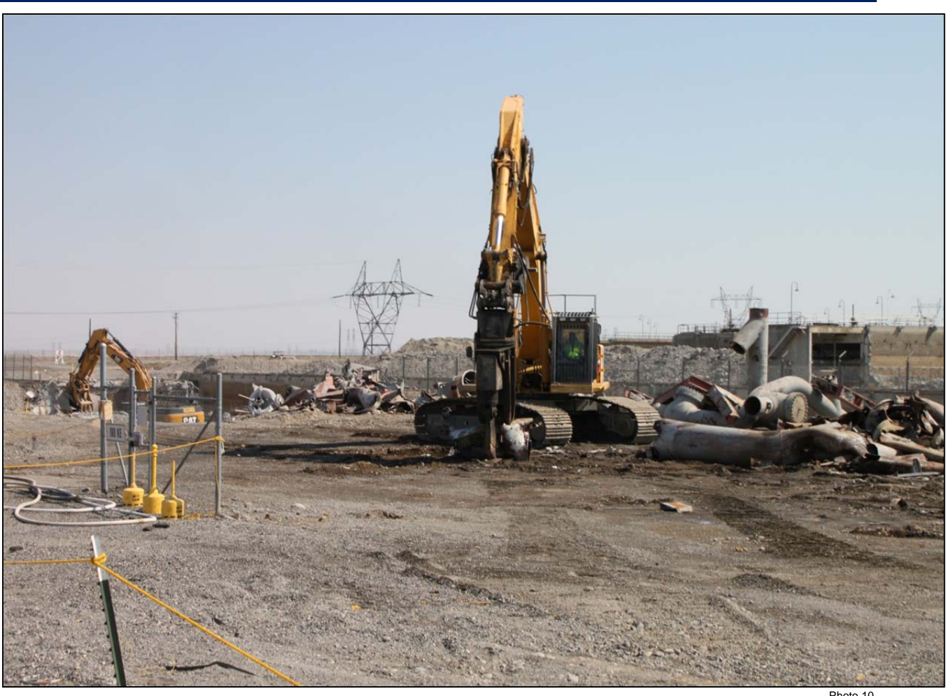
Cleanup and below-grade demolition continue at the 190-KE Main Pump House.