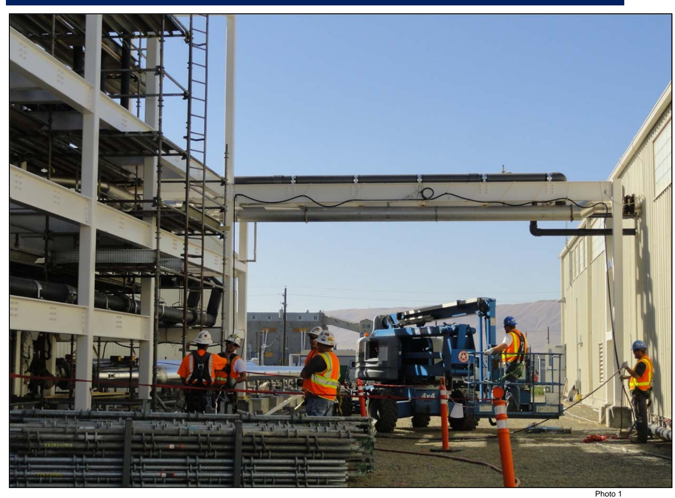
Workers are constructing piping between the Radiological and Biological Treatment Buildings that will make up the 200 West Groundwater Treatment Facility.