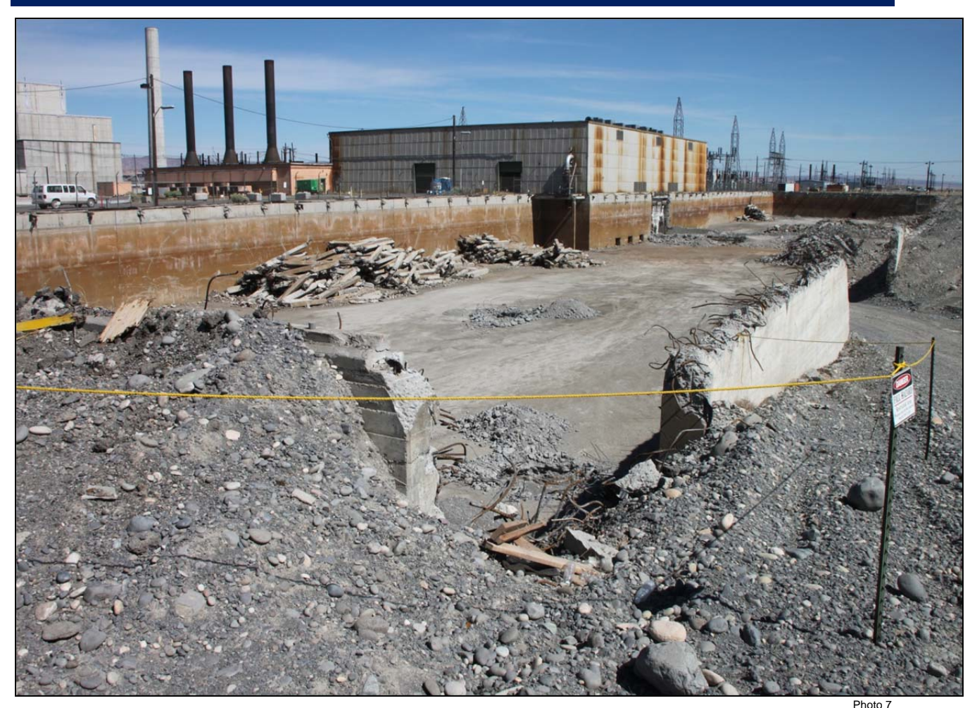
The site of the former 183.4-KW Clearwell. The 190-KW Main Pumphouse (center) is scheduled for demolition in the first quarter of FY2012 with carryover Recovery Act funds.