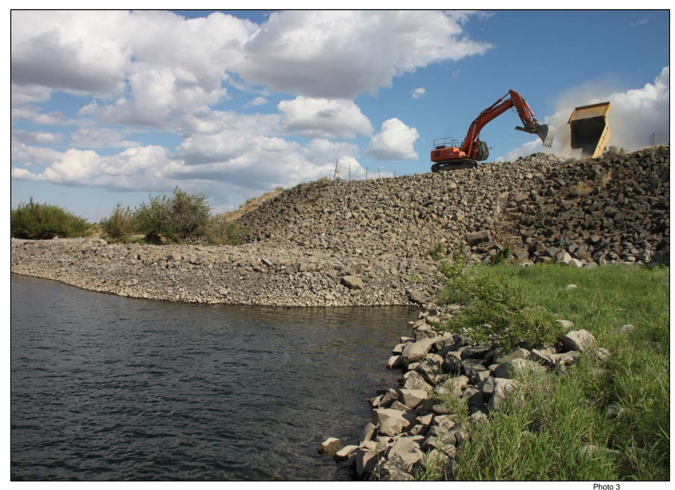
The site of the former 181-KE River Pumphouse Structure as the last loads of rock are placed. CHPRC subcontractor Watts Construction placed rock from approved sources at the sites of both 100-K River Pumphouses, completing recontouring of the Columbia River shoreline.

CHPRC D&D crews completed demolition and loadout of the 183.4-KE and 183.4-KW Clearwells, 183.3-KE Filter Basin, and 1720-K Main Administrative Office Building. Rock from approved sources was placed at the sites of the demolished 181-KE and 181-KW River Pumphouse structures. The physical work for CHPRC's KPP of 15 100K buildings demolished with Recovery Act Funds is now complete.