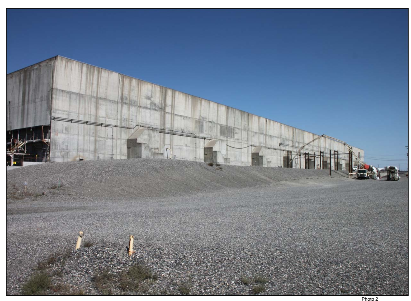
Grout operations have filled 88.2 percent of U Canyon void spaces with grout, placing 19,734 cubic yards of a planned total of 22,381 cubic yards.

CHPRC and subcontractors AGEC and Central Pre-Mix poured another 1,558 cubic yards of grout into U Canyon void spaces. In total, grouting has reached 88.2 percent, with 19,734 cubic yards poured of a planned total of 22,381.