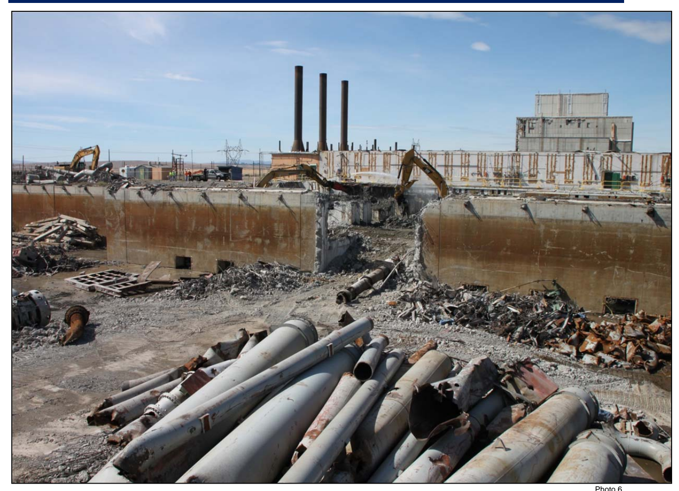
CHPRC crews use the completed 183.4-KE Clearwell (foreground) as a staging area during the ongoing demolition of the 190-KE Main Pumphouse.