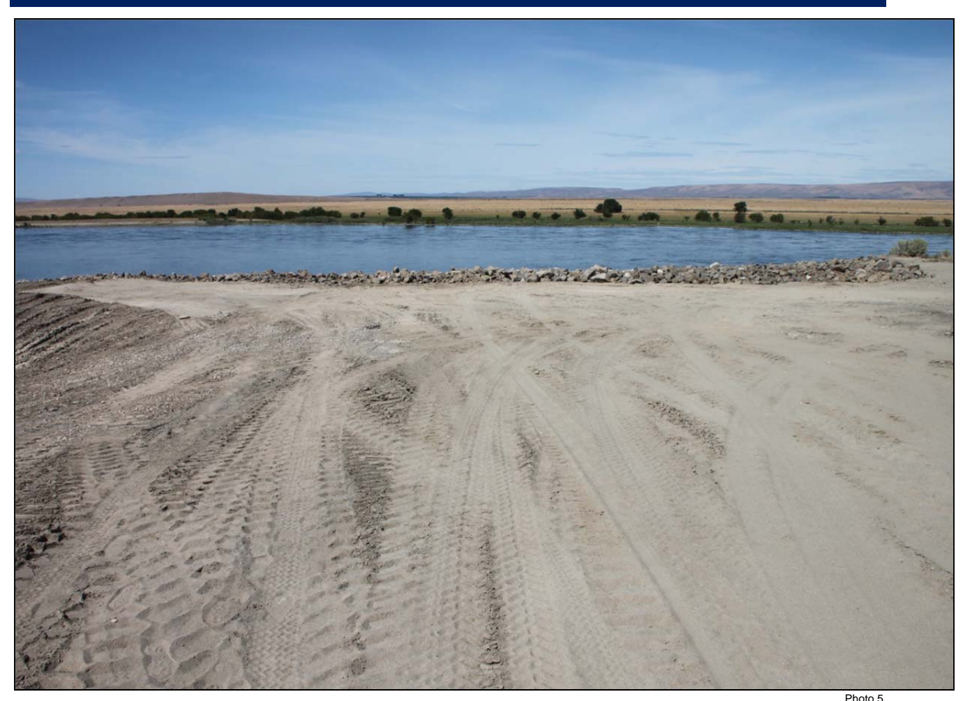
The site of 181-KW River Pumphouse Structure in September 2011 after rock from approved sources was placed at the site.