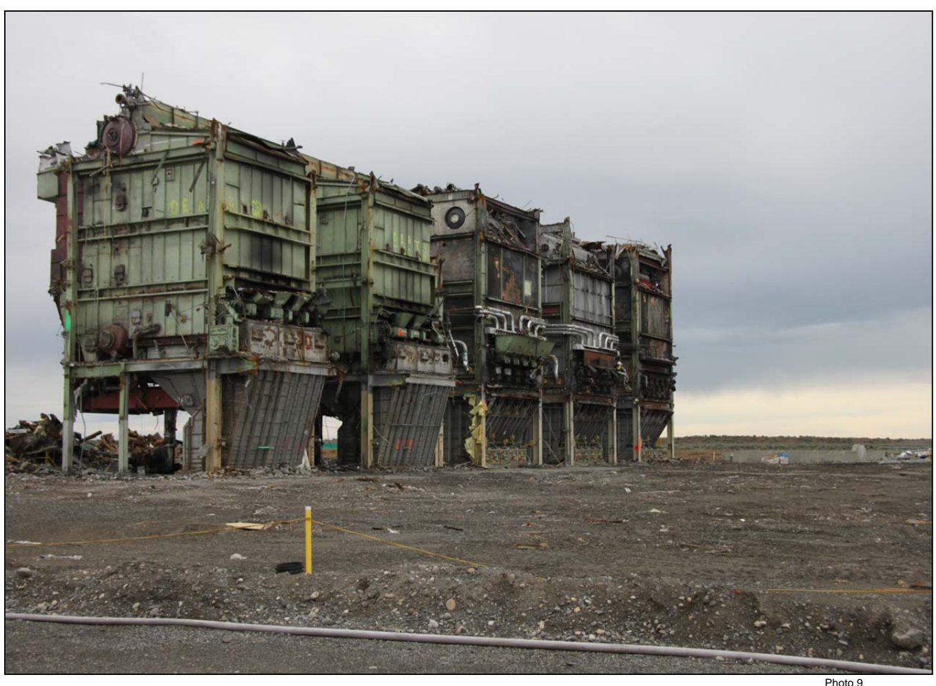
The remains of the 284-E Power House in May 2011 after CHPRC demolished and cleaned up debris from everything but the building's five boilers. Demolition of the boilers will require the use of a crane and occur over the upcoming weeks.