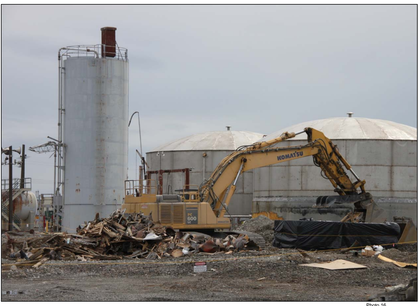
Size reduction and loadout of demolition debris from the 183.1-KE Headhouse continues. The headhouse was part of the 183-KE Sedimentation Basin complex that once supplied treated water to support reactor operations.