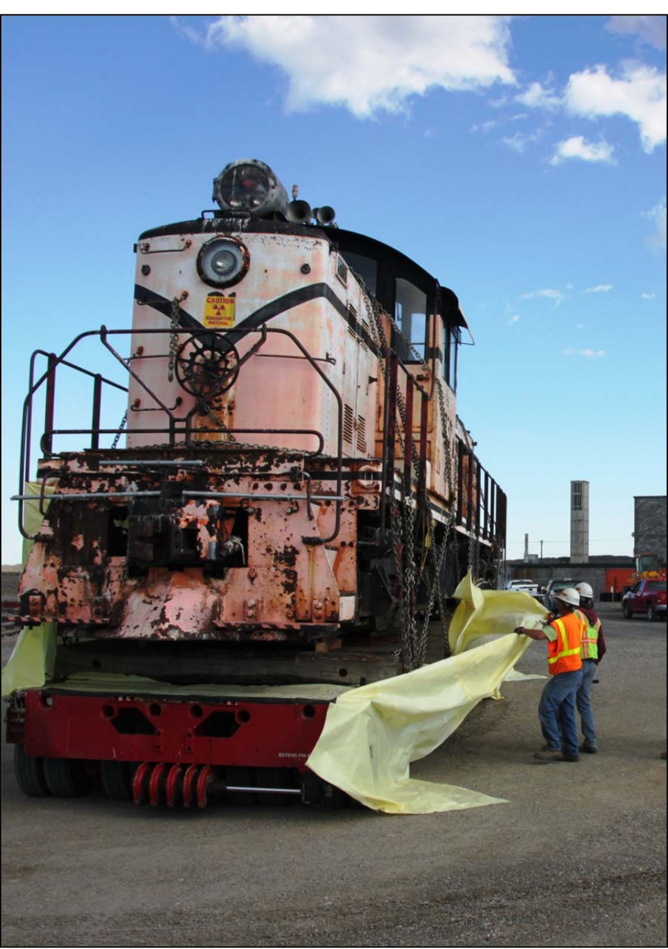
Workers unwrap a locomotive upon delivery to the B Reactor for preservation and display.

CHPRC crews and subcontractor Clauss Construction successfully delivered both locomotives to the B Reactor Preservation Project and placed them onto a stretch of track in front of the reactor for viewing by visitors to the site. Video, photos, and a news release about the event are available at <a href="https://www.hanford.gov">www.hanford.gov</a>.