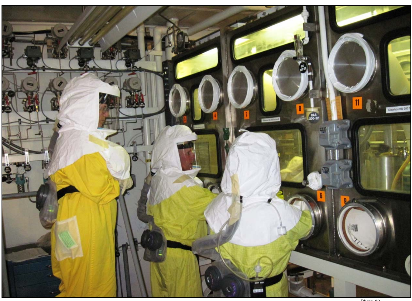
Glovebox H0-200 in the 209-E Criticality Mass Laboratory before size reduction in September 2010. Preparing the glovebox for removal was a task months in the making and will help prepare the building for demolition.