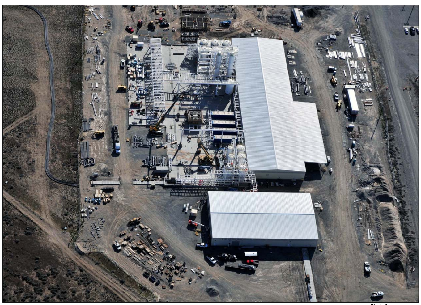
An aerial of the 200 West Groundwater Treatment Facility. Recovery Act-funded construction of the facility, which will be the largest pump-and-treat system at the Hanford Site – is approximately 63 percent complete.