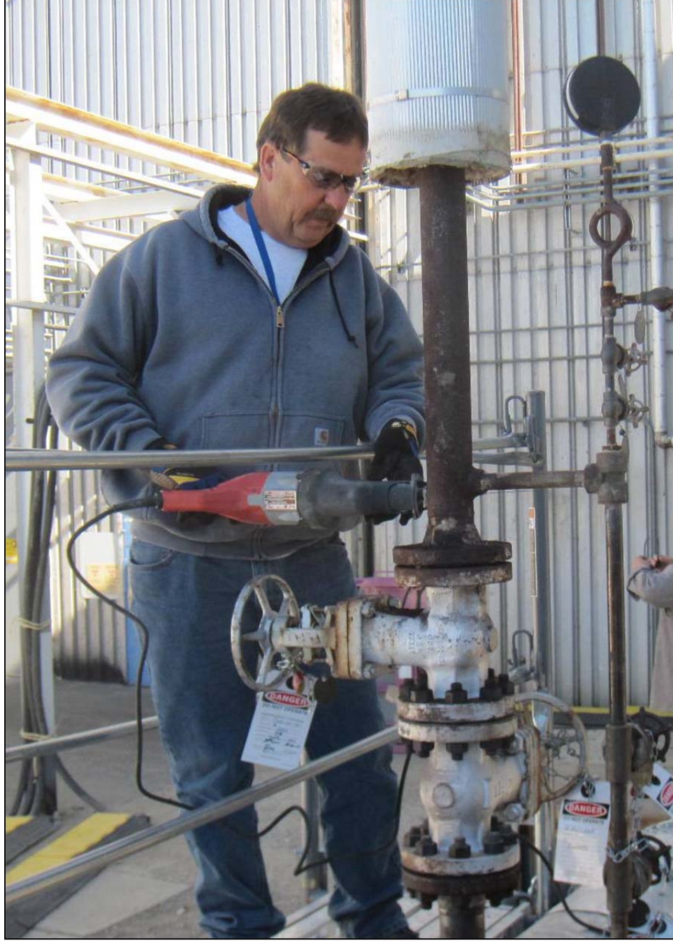
A worker isolates the steam supply from the Plutonium Finishing Plant 2736-ZB vault complex facilities, one of the last steps in bringing the facility to cold and dark condition. Demolition of the facility is scheduled to begin early this summer.