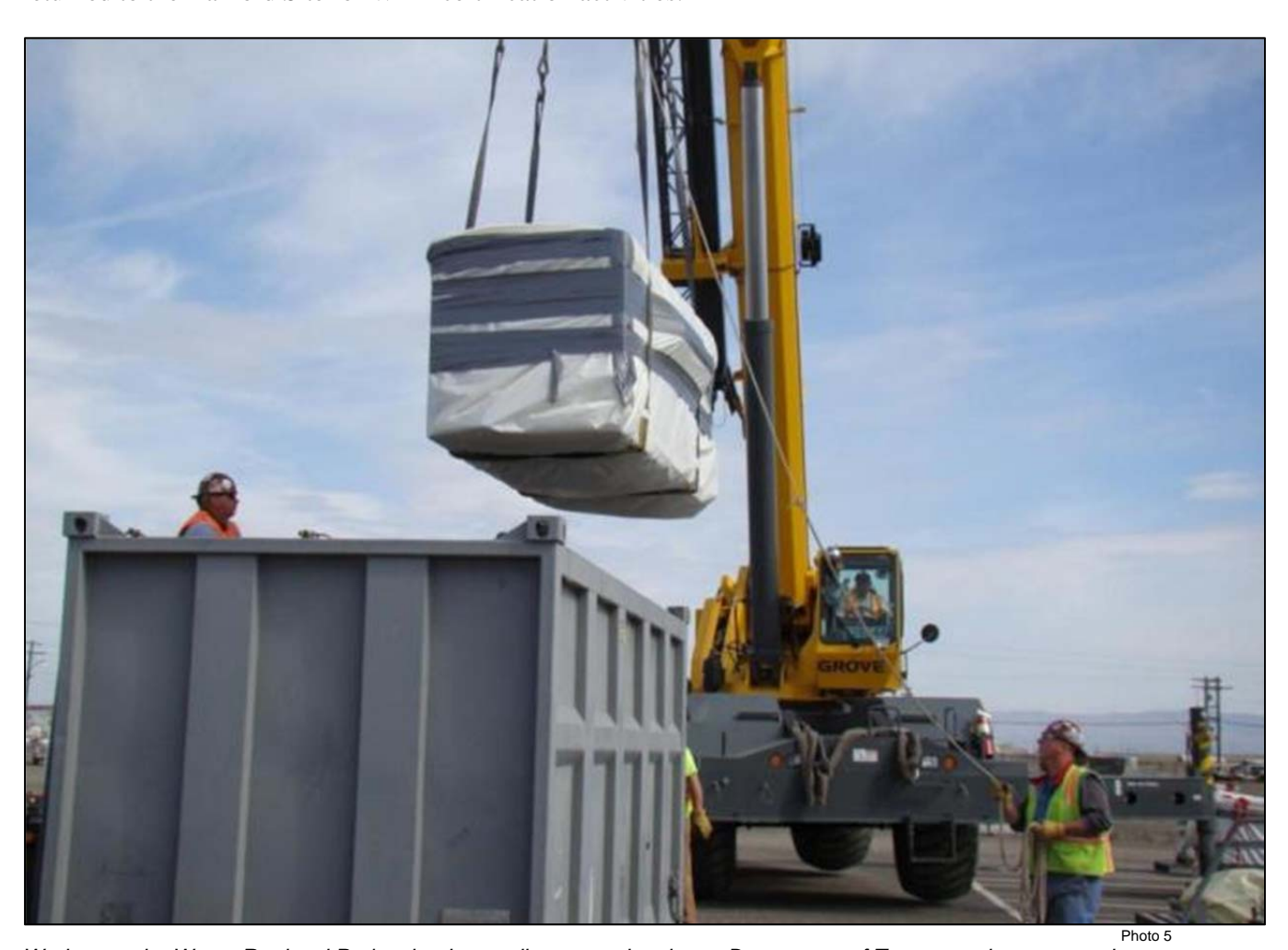
Workers at the Waste Retrieval Project load a small concrete box into a Department of Transportation approved shipping container. This box contains transuranic waste that will be repackaged into standard waste boxes and returned to the Hanford Site for Waste Isolation Pilot Plant certification.

Two shipments (13.9 m<sup>3</sup>) containing two boxes of TRU debris were shipped from the Waste Retrieval Project (WRP) to PFNW this week. The waste will be repackaged into standard waste boxes (SWBs) and returned to the Hanford Site for WIPP certification activities.