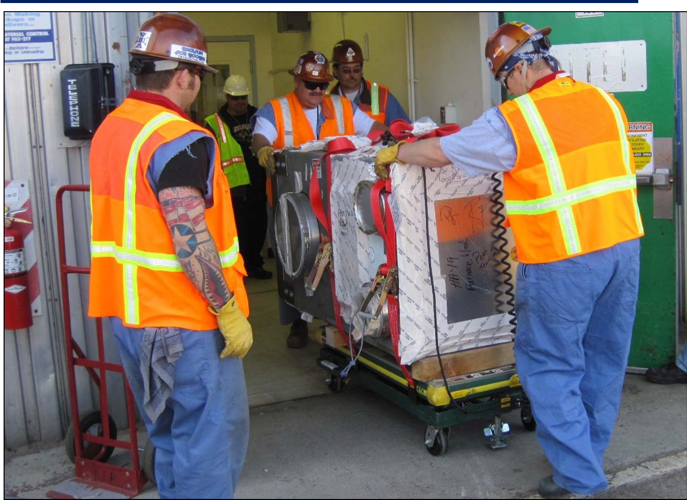
Part of glovebox HA19 is wheeled out from the Plutonium Finishing Plant to be loaded for disposal.