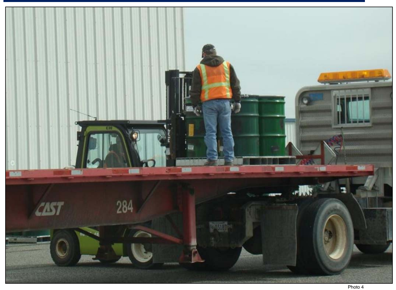
Workers load waste drums onto a flatbed trailer for two shipments leaving the Central Waste Complex headed to Perma-Fix Northwest for treatment.