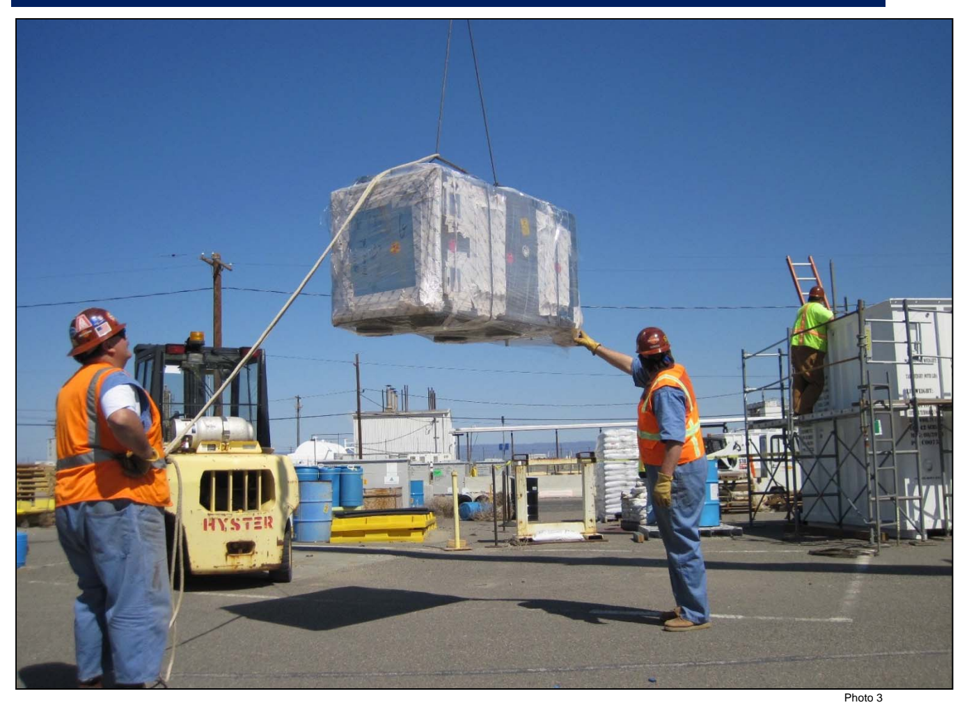
Part of glovebox HA19, removed from the Remote Mechanical Line A at the Plutonium Finishing Plant, is loaded for disposal.