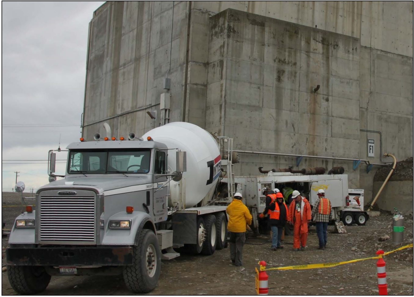
Grout is poured into the 221-U North Pipe Gallery at the U Plant canyon.

The U Canyon disposition team also completed an internal Hazard Review Board assessment of its plans to safely lift the D-10 Tank, inside the U Canyon building, to confirm that it is in a safe enough condition for removal. The tank has not been moved in 46 years.