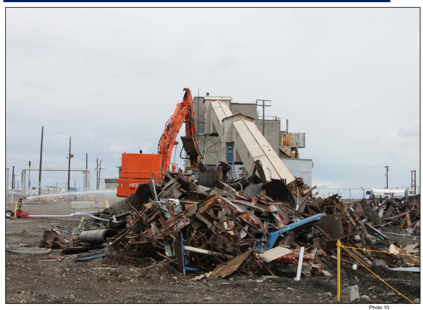
Debris cleanup nears completion outside the 284-W Power House where CHPRC used explosives to safely lower two exhaust chimneys and two baghouses on Feb. 18.