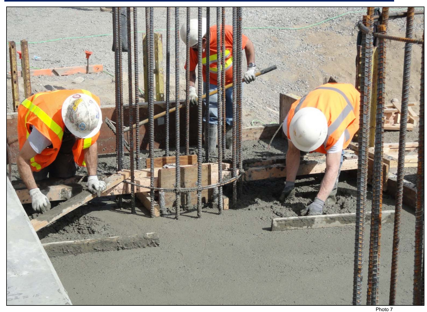
Concrete is placed for the Lime Stabilization Building that will be part of the 200 West Groundwater Treatment Facility.