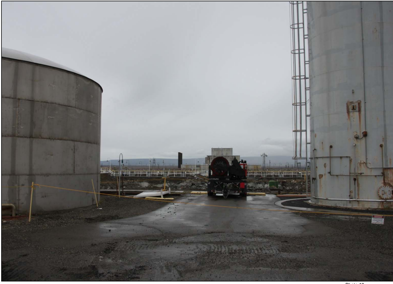
The site of the former 183.1-KE Head House. CHPRC completed above-grade demolition of the building with Recovery Act funds over the last two weeks.

on the west side of the 105KE Reactor building. CHPRC subcontractor Watts Construction continued hauling clean rubble from the demolished 183-KW Sedimentation Basins to U Canyon and returning with clean soil to use as backfill of the sedimentation basin site at approximately 65 loads a day. At the 181-KE River Pumphouse Structure, crews are preparing to deploy a crane to remove the structure's six 39,000-pound pumps next week.