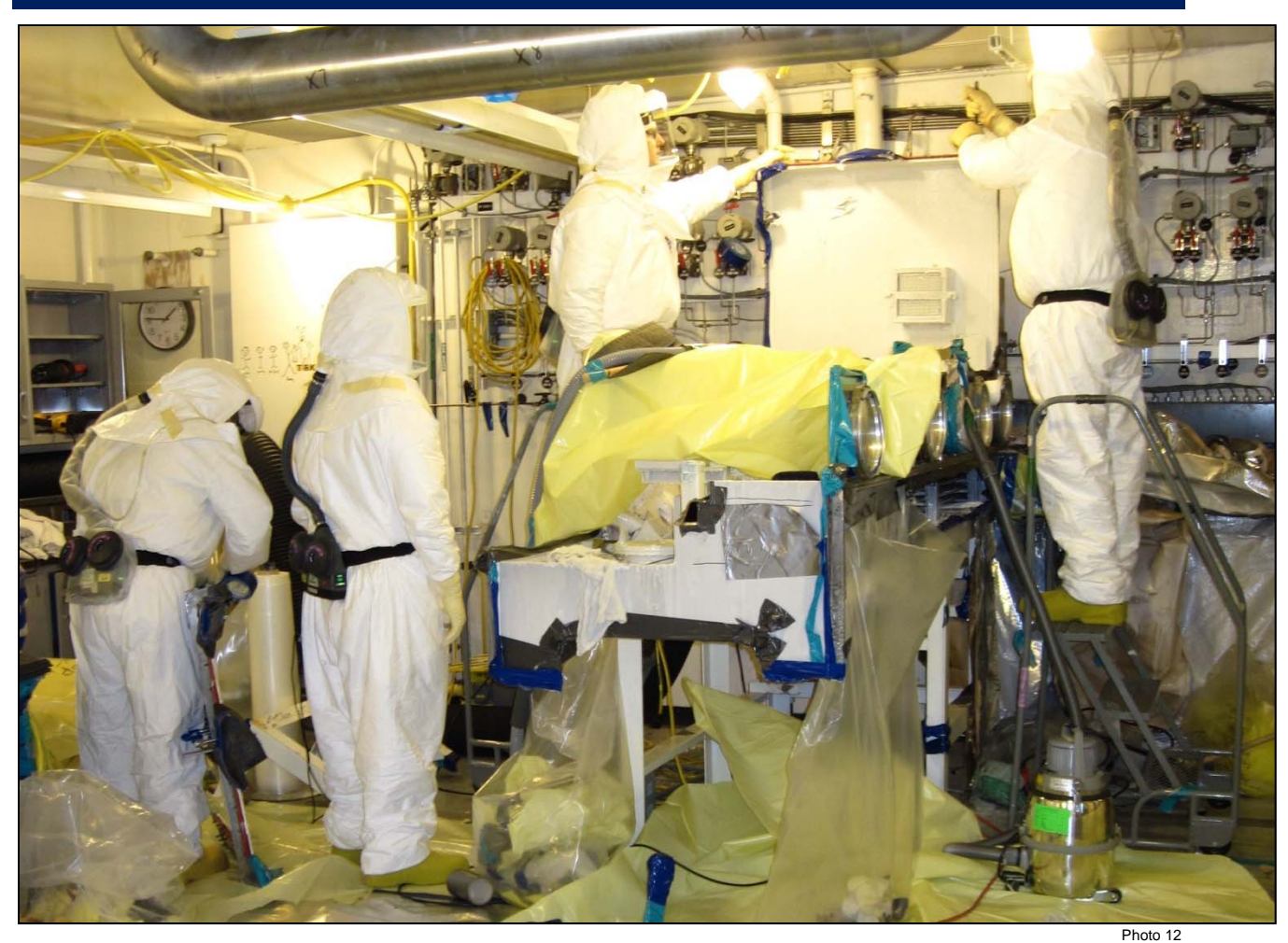
Workers continue size reducing the HO-200 glovebox to prepare it for removal from the Mix Room of the 209-E Criticality Mass Laboratory.