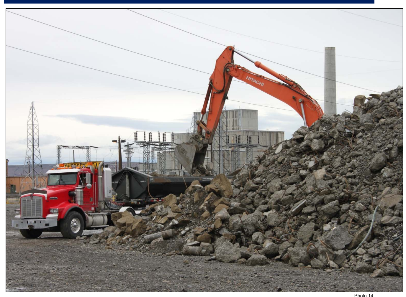
CHPRC subcontractor Watts Construction is hauling clean rubble from the demolished 183-KW Sedimentation Basins to U Canyon and returning with clean soil to use as backfill of the sedimentation basin site at approximately 65 loads a day.