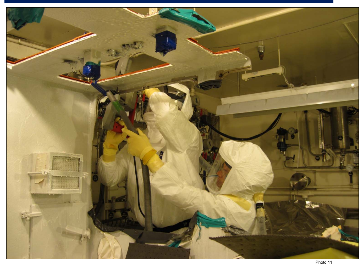
Workers size reduce, or cut up, the HO-200 glovebox in the Mix Room of the 209-E Criticality Mass Laboratory.