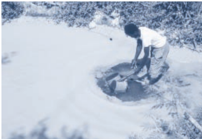
Water weed, Senegal

This Note is organized in six sections. A general description and typology of nuisance aquatic plants is followed by a description of the problems caused by these plants. The Note then discusses methods for controlling these plants, how to obtain benefits from them, and the advantages and disadvantages of the various control methods. It also provides cost estimates associated with different control options. The Note concludes with suggestions for obtaining further information from both websites and printed material.