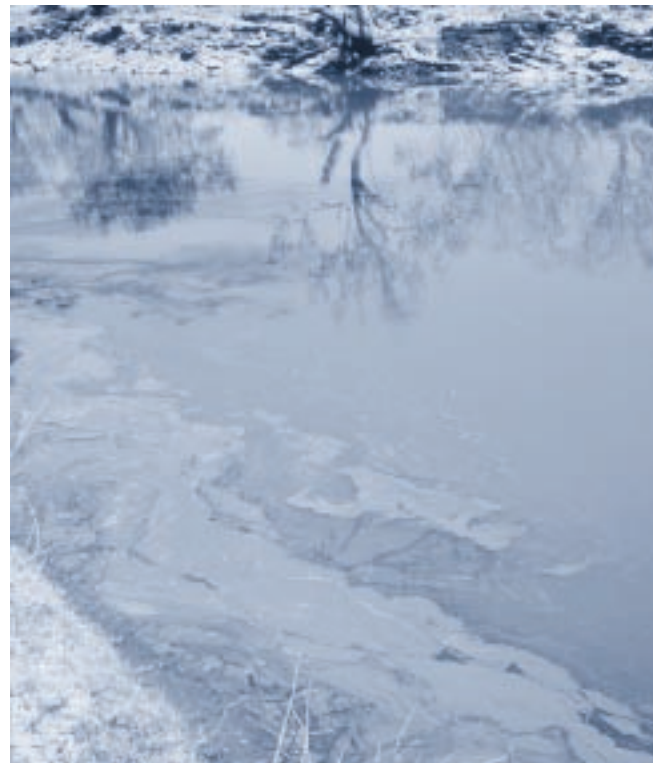
Algal bloom, Darling River, Burke, Australia

Both physical and chemical control methods usually need to be repeated at least every growing season. Physical and chemical methods rarely provide a permanent solution to weed problems; as a result, a long-term management program will need to be implemented.