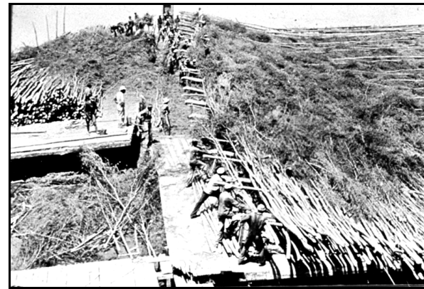
Laborers construct willow "mattresses."

Today, Southwest Pass is used by oceangoing vessels bound for the ports between New Orleans and Baton Rouge. The U.S. Army Corps of Engineers maintains the channel to a 45-foot depth.