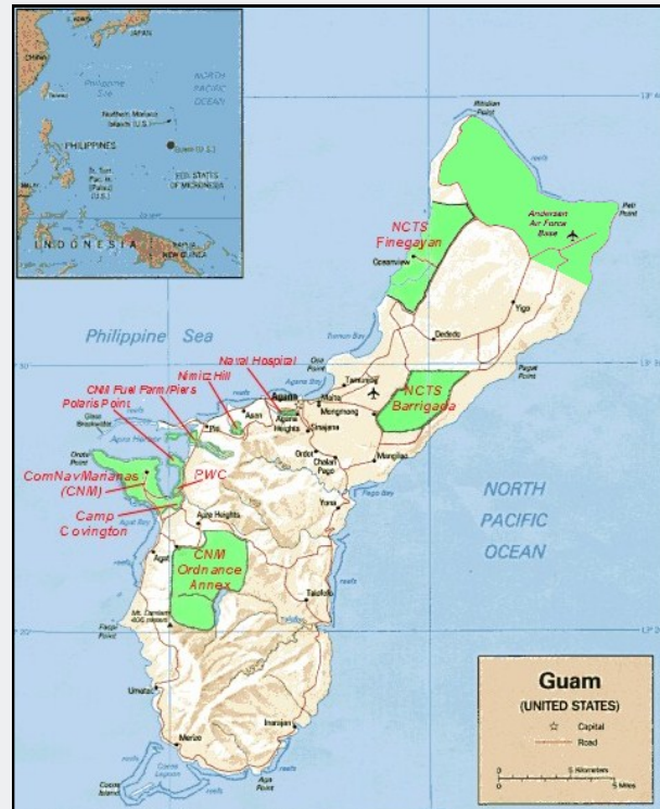
Map of Military Installations on Guam

In the final months of World War II, the U.S. Navy had built its largest advanced base on Guam, which supplied material support for more than one-third of U.S. Navy power. Five years of peace following World War II ended on 25 June 1950 when North Korean troops attacked South Korea. Approximately a decade later, the U.S. military was again deployed in Southeast Asia—this time in Vietnam. During the post-Vietnam period and throughout the 1980s, military installations on Guam and the Northern Mariana Islands remained vital overseas platforms for carrying out the U.S. mission of global nuclear deterrence. These events kept Guam on the front lines throughout the Cold War.