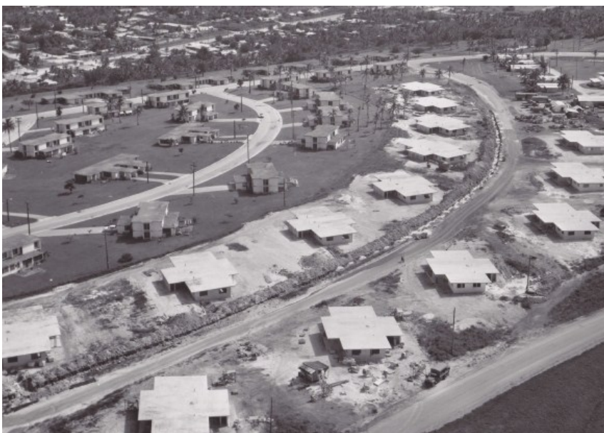
Junior officer housing NAS, August 1959 (troop and employee support facilities)

Source: National Archives Records Administration, Military Records