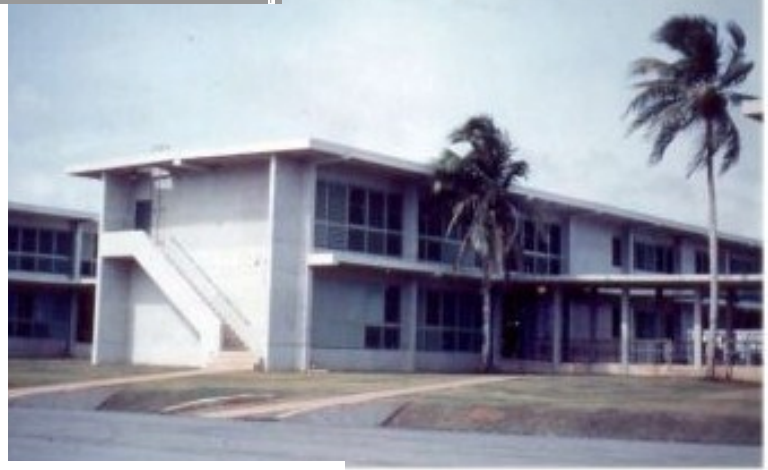
Aerial depiction of Glass Breakwater, Apra Bay, Guam ca. 1945 (Naval defense and operations)