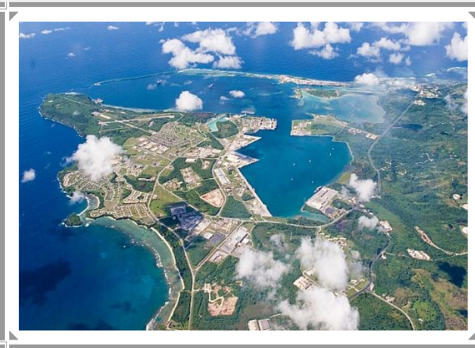
Apra Harbor and Orote Navy Base and Air Strip