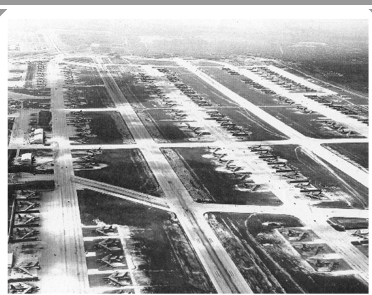
18–29 December 1972, Linebacker II

During the Operation LINEBACKER II mission, the population of Andersen AFB increased rapidly to at least 12,000 military personnel. Air Force personnel were housed in all available space at Andersen AFB, including a tent city and a temporary barracks facility without air-conditioning.