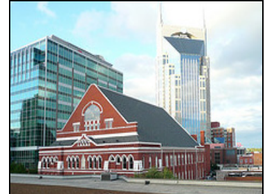
(Historic Ryman Auditorium, Nashville, TN)