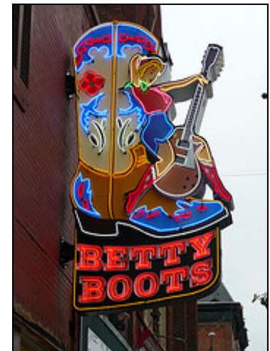
(in Nashville, TN)