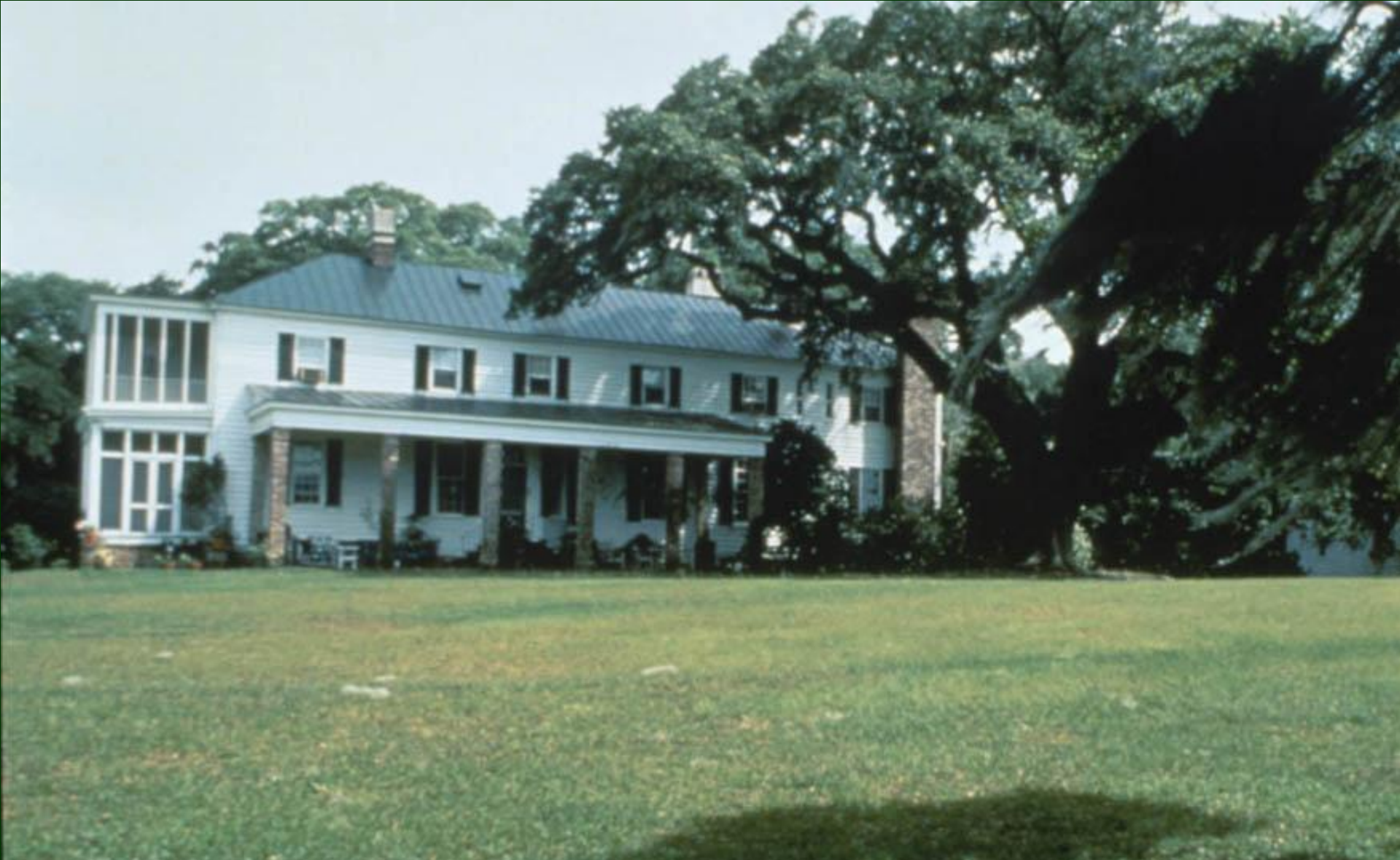
Prospect Hill 1985