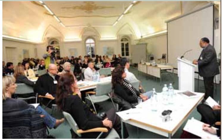
Above: Lonnie Bunch, Director of the Smithsonian National Museum of African American History and Culture, delivers the keynote address.

The schedule included not only six plenary sessions, based on the major themes of the conference, but also five working groups, the latter structured in a way that resulted in a series of practical recommendations. For example, the working group on “New Preservation Approaches” recommended that the conservation community “Design and carry out research to address the threat induced by environmental changes” and outlined five specific areas of needed research. In addition, the Fellows engaged in invigorating conversations and presentations on conservation in the developing world; the newly