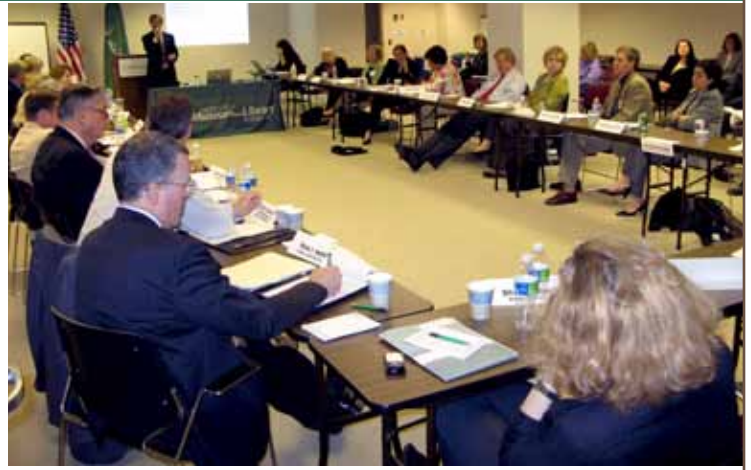
Above: "Museums and Libraries Advancing Global Understanding" convening.

During the course of 2009, IMLS convened three meetings to help the agency move forward in its international work. This update provides information about these meetings and other recent IMLS international activities.