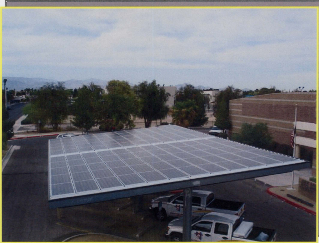
Figure 1: Example of a carport photovoltaic system

Denver Federal Center carports will be 38 feet wide and approximately 260 feet long.