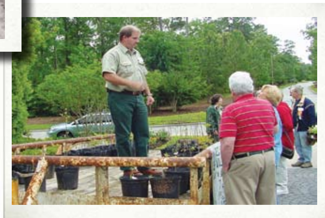
Windsor Heights, Texas