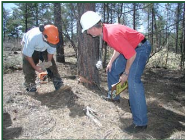
Mescalero forest crew training (Mescalero Apache Tribe), May 2007

out, will contractors and workers be willing to pay for the certification courses?