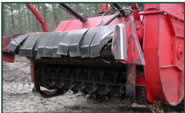
Close up of the head on experimental harvester

According to Roise, “If this small-diameter (less than 6-inch diameter) woody biomass material could be harvested by machine and sold to produce feedstock for energy production for less than the current rate of $500 per acre, it would spread the hazardous fuel reduction dollars over more acres.”