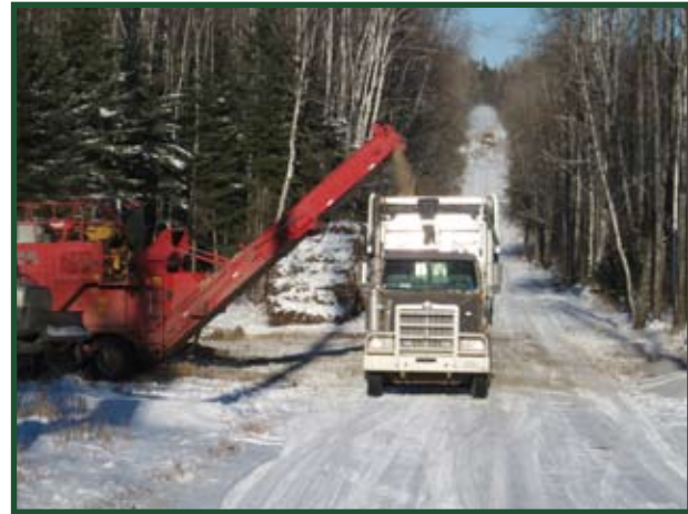
Loading trucks