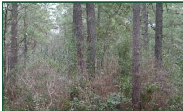
A pocosin, showing type of woody biomass material that needs harvesting, in an urban–wildland interface area on the Croatan National Forest

Department of Forestry and Environmental Resources North Carolina State University Raleigh, NC 27695