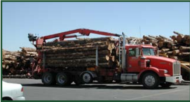
Truck load of juniper supply being delivered to yard