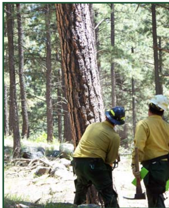
Pine Hill (Ramah Chapter of the Navajo Nation) training, June 2007

Mexico’s forests is directly linked to the viability of forest-based communities and workers. By reducing the barrier of high workers' compensation insurance, the Forest Worker Safety Certification program has improved the ability of forest workers to make a living from the forests.”