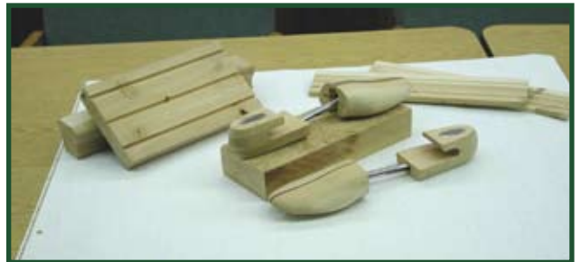
Decking material, paneling, and 2- by 4-inch kiln-dried cutstock blocks shaped into an aromatic shoe tree

The REACH mill is staffed with about 90 employees, and roughly 80% of their sales volume is from non-juniper products, such as pallets and dimension lumber, which are made from pine or fir. The mill also has a state-of-the-art dehumidification dry kiln and does some custom drying of other species.