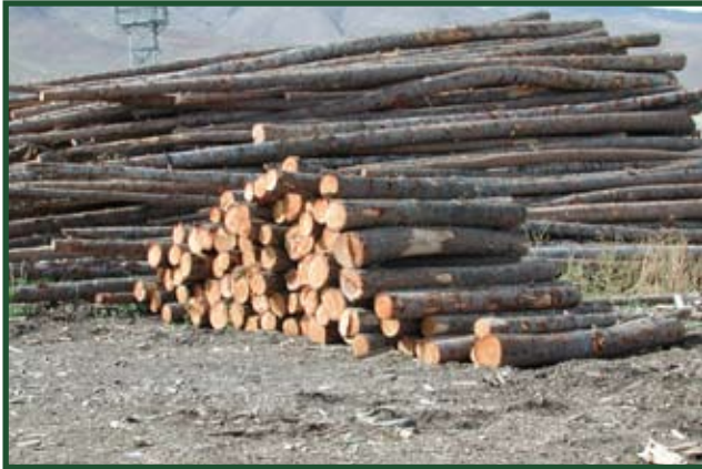
Small-diameter supply at England Sawmills

addition, his new high-valued wood flooring and house log products will add considerably to his profit margin. In September 2006, wood flooring was selling for about $1,000 per thousand board feet.