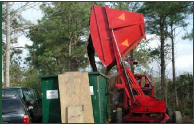
Dumping the woody biomass material for pickup

Wood Energy, a 45-megawatt electric generating plant in New Bern, North Carolina, is supplying the market for the harvested woody biomass, helping to test the biomass fuel properties, and providing logistical support including transportation. The North Carolina Forestry Foundation is providing access to their machine shop, staff support, equipment, and living arrangements for project personnel.