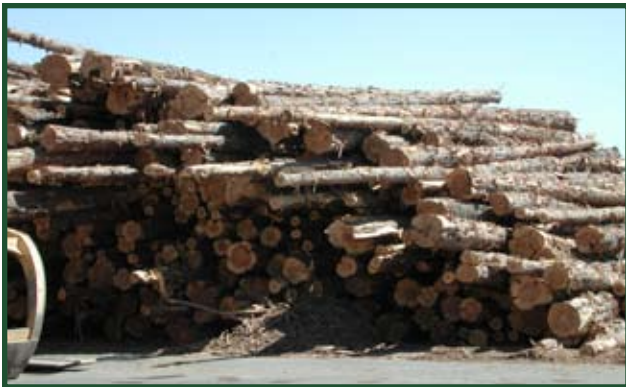
Juniper supply in yard

REACH has been instrumental in providing a solution for a diverse group of community concerns—from establishing a market for the invasive western juniper, to helping restore watersheds and ecosystems, to creating jobs in the community. It is a unique, non-profit rehabilitation business that I was fortunate to tour. I am proud to know this business not only exists but that it has prospered in so many ways.