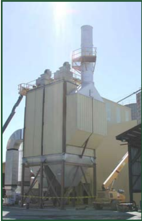
Wood-fueled steam-generated power plant

additional documents so that electrical power can be sold to their public utility.