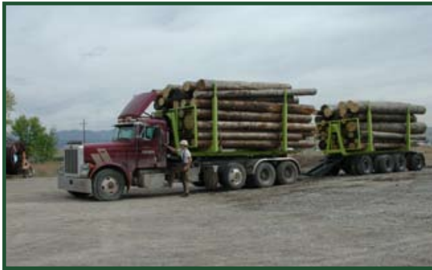
Truck and trailer transporting small-diameter logs—Roll-on/roll-off refers to a straight frame tractor and pup trailer configuration in which modular containers are “rolled” onto and off of the straight frame tractor (commonly referred to as a “Hook Truck”) and the pup trailer, by means of a tractor-mounted hydraulic grapple. (A pup trailer is a four-axle trailer towed by the hook truck.)