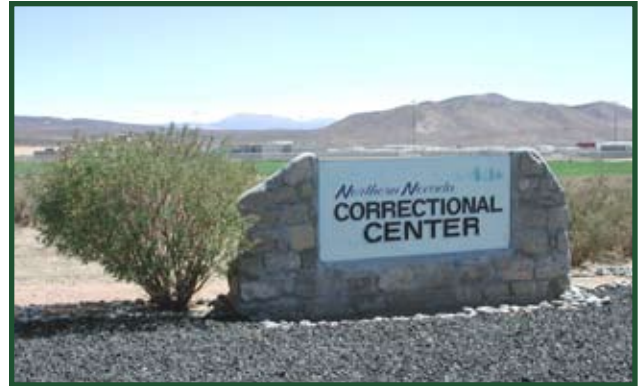
Sign outside correctional facility

Northern Nevada Correctional Center P.O. Box 7011 Carson City, NV 89702