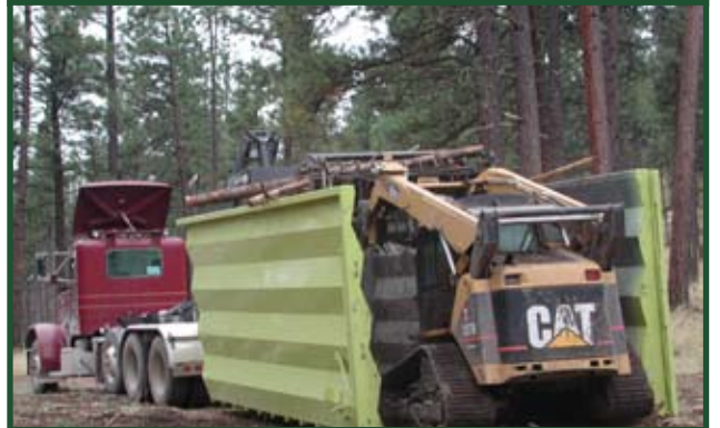
Woody biomass being loaded onto container