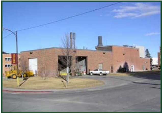
Forest biomass steam plant

together to see how they could turn this devastating fire into some positive action. The fact was that a tremendous volume of wood would go to waste if they didn’t do something. Eventually the resource analysis and engineering study for a forest biomass plant that had been sitting on the shelf for years came into play. In the end, State Senator Sandy Scofield came to the community’s rescue by putting together an innovative, renewable energy package for the College.