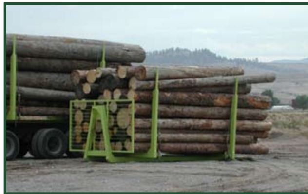
Roll-on/roll-off rack for transporting logs

Conservation & Development (RC&D) Council, and the University of Montana, School of Forestry. Currently, most of the forest fire reduction projects that the Collection System is working on are located on the Lolo and Bitterroot National Forests.