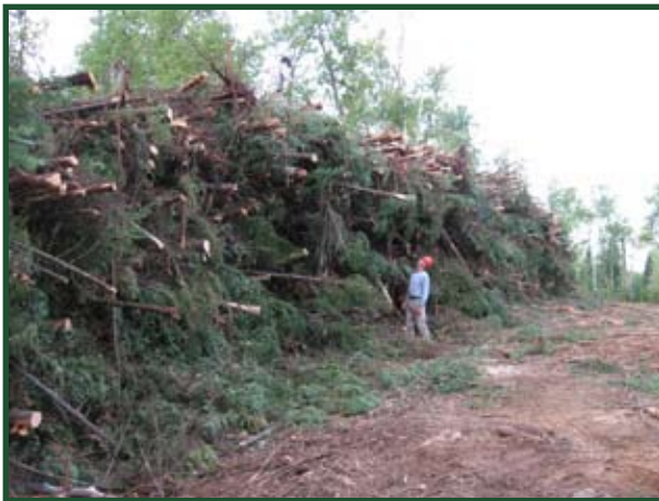
Loose woody biomass material

on more than 100 acres of sites on the Superior National Forest identified in Community Wildfire Protection Plans. Little of the woody biomass material from these sites had any commercial timber value. Sites were selected in areas of insect-killed balsam and where understory trees provided dense “ladder fuel” from the ground to the forest crown. Various harvesting equipment and techniques were tested. The project partners collected and analyzed environmental, cost, and productivity data for each test site and made this information available to the public.