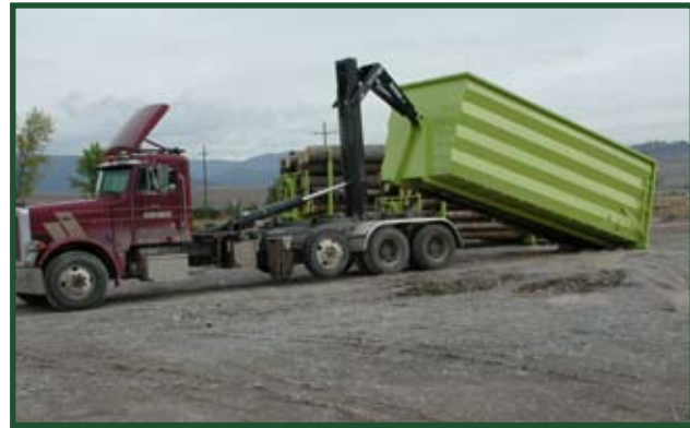
Truck loading roll-on/roll-off container.