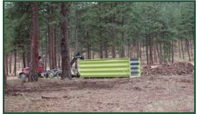
Roll-on/roll-off container placed in fuel reduction site

Based on their findings and with the help of a U.S. Forest Service National Woody Biomass