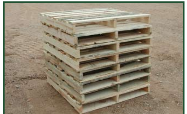
Pallets made by Bearlodge