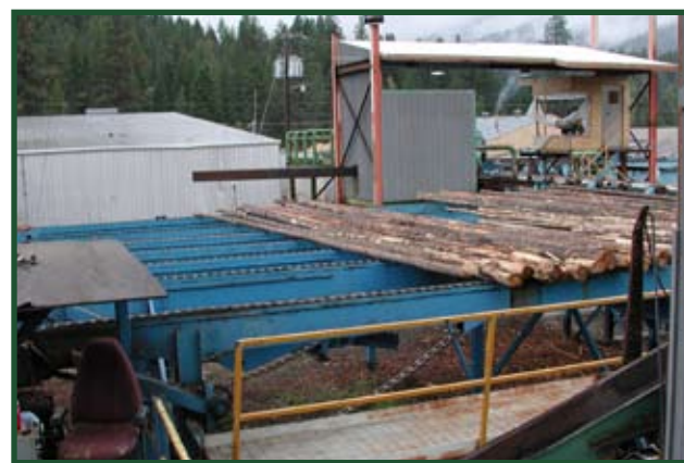
Operation at Big Sky

National Forests, the Flathead Indian Reservation, and Montana Department of Natural Resources.