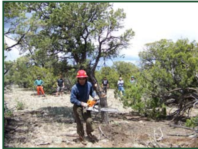
Mountainair training, May 2007