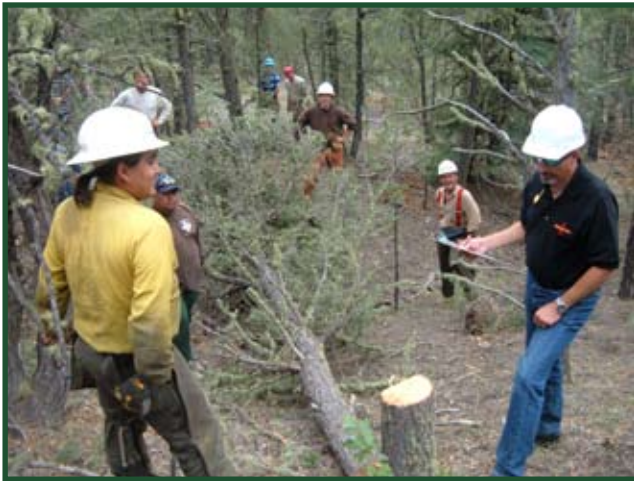
Taos Pueblo Recertification course, June 2007