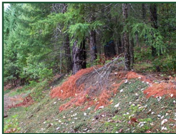
Bureau of Land Management stewardship contracts in progress.