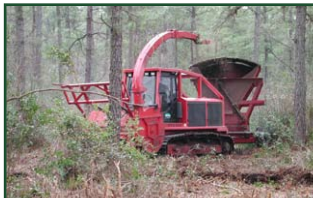
Experimental harvester in operation

FECON, Inc., had been working on a harvesting machine designed to collect woody biomass but had not manufactured or tested the design. After discussions with Dr. Roise at North Carolina State University, a project was laid out to manufacture, test, refine, demonstrate, utilize, and ultimately promote a redesign of the mulching head into a harvest and collection system that would efficiently harvest small-diameter woody biomass. It was decided that a good test for this prototype would be on Croatan National Forest acres that desperately needed fuel reduction in the wildland–urban interface.