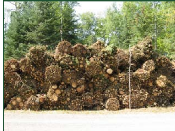
Woody biomass bundles

possibly the unknown cost of cutting non-commercial timber.”