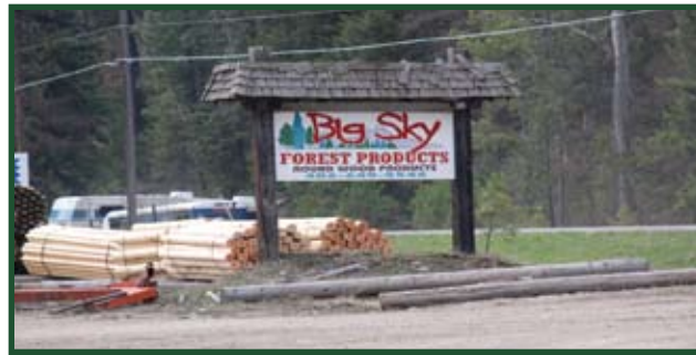
Big Sky Forest Products, Regis, Montana

Eighty percent of Big Sky’s supply is from public forestlands such as the Idaho Panhandle, Kootenai, and Flathead