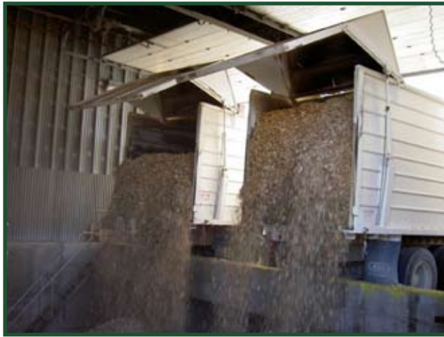
Trucks delivering woody supply to biomass steam plant

is between 7,000 and 8,000 tons, with wood ash generation an efficient 2% to 3%. Energy savings are averaging more than $130,000 per year compared with natural gas, resulting in a capital investment payback in 7 years! Because of these results, the college added a $1,350,000 air-conditioning chiller in 2004.