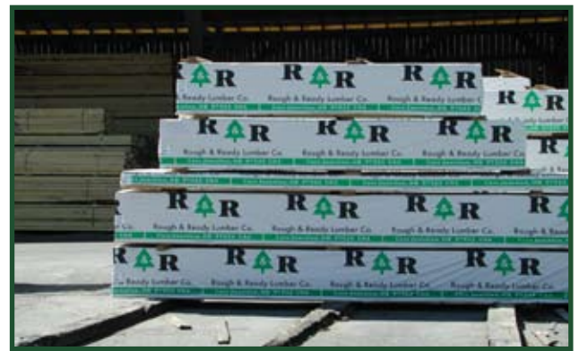
Lumber ready for transport

The new boiler and turbine will produce enough combined power and heat to operate the two sawmills, eight existing dry kilns, and the four new dry kilns that the company is in the process of building.