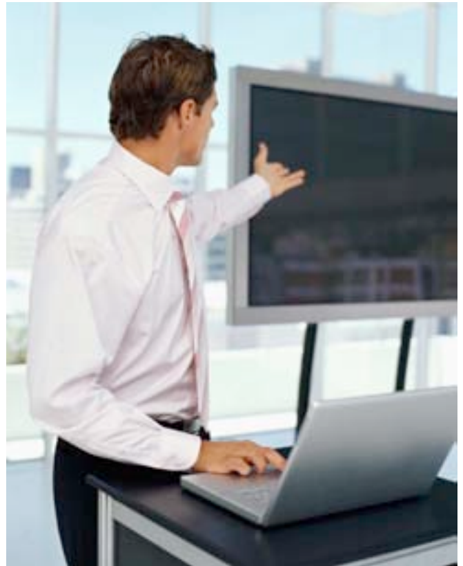
Education will have a blended learning approach to include classroom and distance learning.

In future years, CDSE Education Division will seek accreditation through Middle States Commission on Higher Education (MSCHE). MSCHE accreditation will credential CDSE to confer certificates and degrees that are recognized throughout the security and