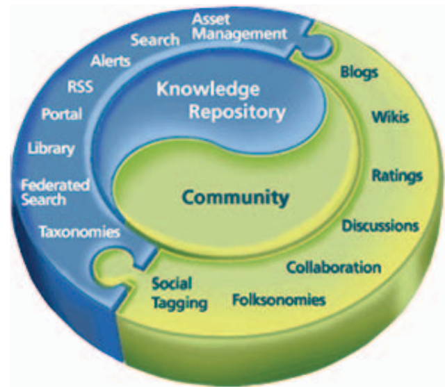
The Knowledge Repository and Community fit together to enable DSS to share ideas and catalog content.

The more extensive a man's knowledge of what has been done, the greater will be his power of knowing what to do. Benjamin Disraeli (1804-1881)