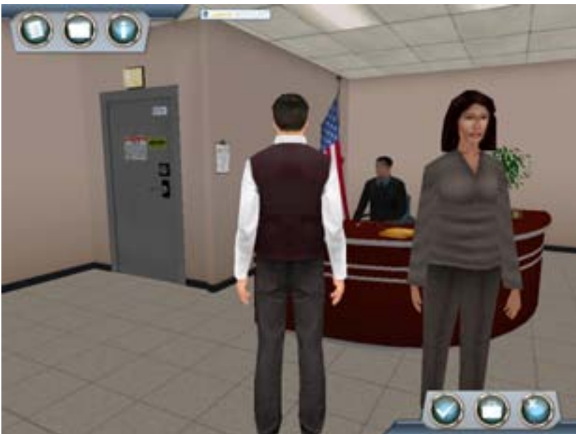
Screenshot of a Virtual Performance Environment

The CDSE is developing a Virtual Performance Environment that will provide students the opportunity to learn and practice security discipline tasks and procedures in safe but realistically simulated surroundings that allow the student to move freely through the virtual world and interact with people and objects. This capability will provide an arena for both practicing and assessing skill acquisition in multiple authentic security scenarios. Eventually, students will be able to practice alone or in teams, and assess each other's performance.