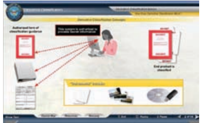
Screenshot from an eLearning course