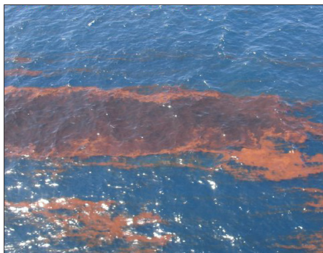
On April 22, 2010, the oil rig Deepwater Horizon MC252 sank off the coast of Louisiana, resulting in a leak of millions of gallons of oil from the well approximately a mile below the surface of the ocean.

NOAA works cooperatively with other natural resource trustees and, when possible, the parties responsible for the pollution. The Damage Assessment process promotes cost-effective assessment and restoration—benefiting the public, the responsible parties, and the environment.