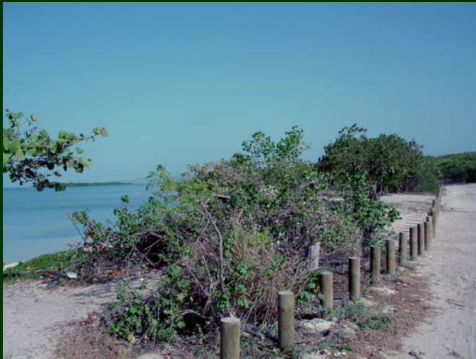
Guanica Beach Berm Restoration