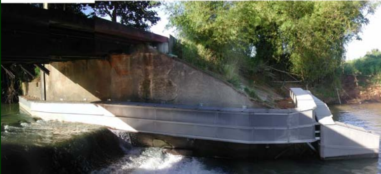
Migratory species passage