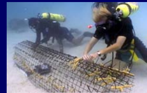
Setting up Farm Unit