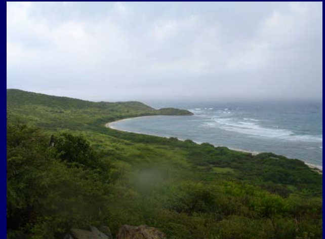
Dry Forest Restoration, St. Croix