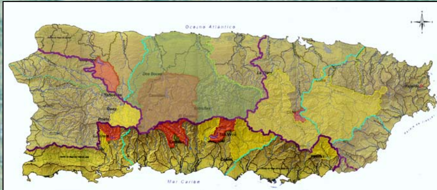
Southern Puerto Rican Watersheds