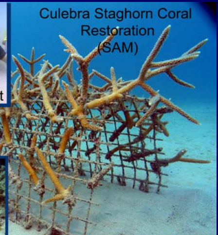
Culebra Staghorn Coral Restoration (SAM)