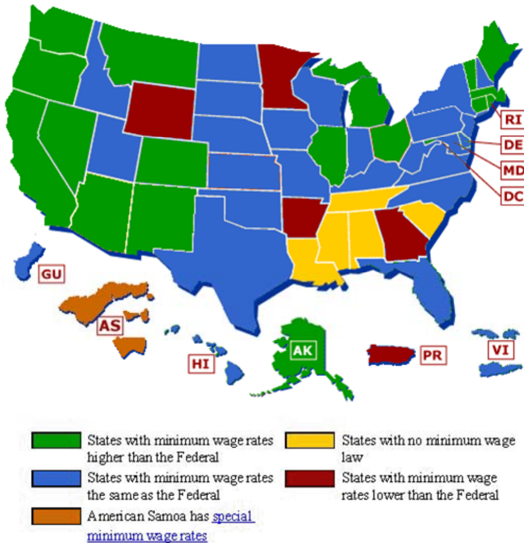
Chart 3. Minimum wage laws in the States, January 1, 2011