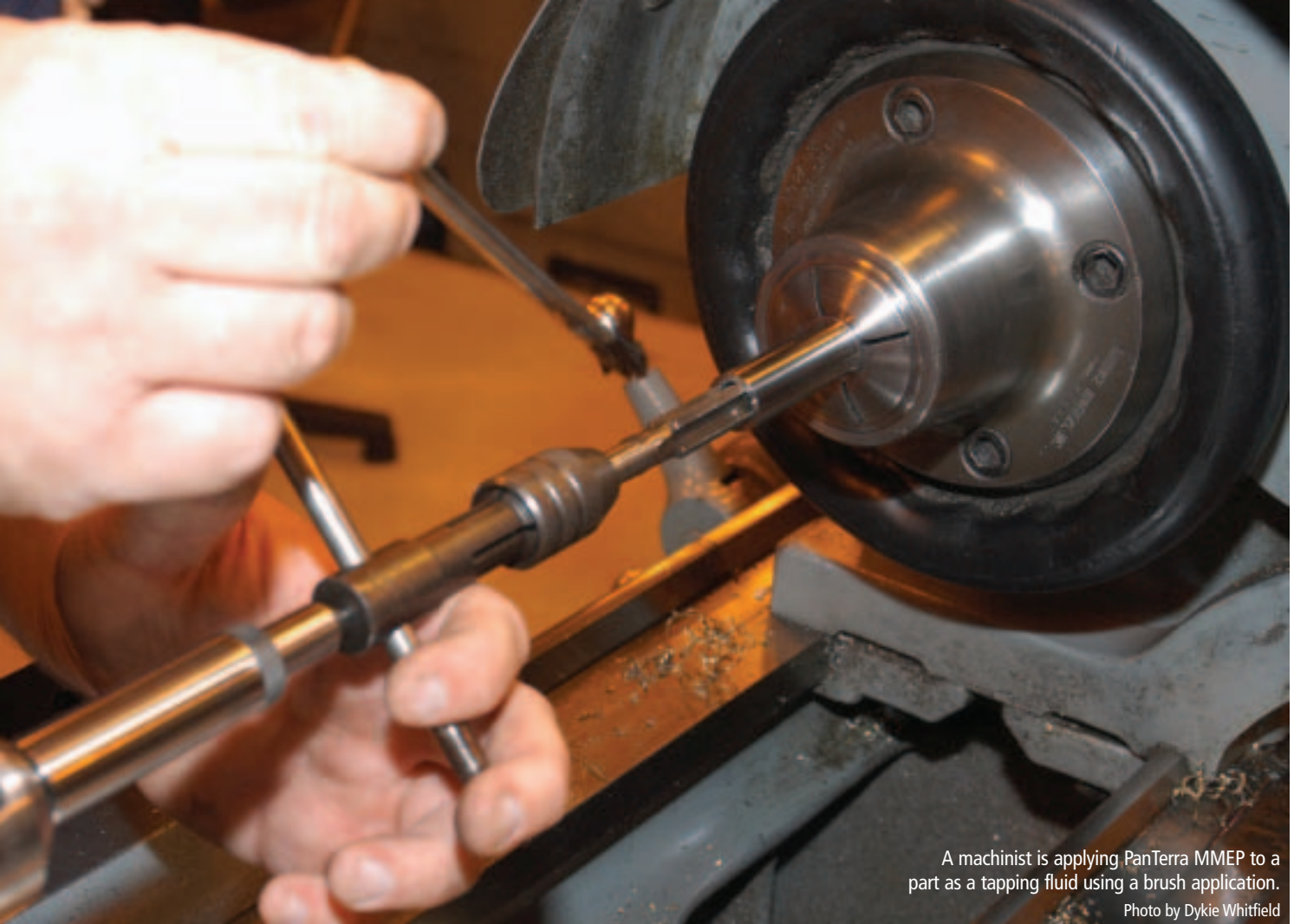
A machinist is applying PanTerra MMEP to a part as a tapping fluid using a brush application.