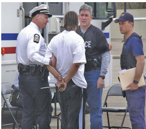
Columbus VCIT questions a targeted offender.

COLUMBUS VCIT Conducts Roundup Of Violent Drug Traffickers: ATF, the Columbus Division of Police (CPD), Adult Parole Authority, United States Marshals Service, the Franklin County Sheriff’s Office, and the Bureau of Criminal Identification and Investigation have conducted lengthy investigations of violent street level firearms and narcotics traffickers in the 10 th and 19 th precincts, and parts of the 11 th and 12 th precincts of Columbus, Ohio.