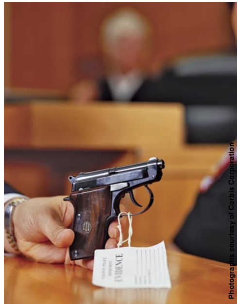
Firearms with obliterated serial numbers were key evidence used against targeted offenders.

The violent offender fought VCIT members, requiring the use of a taser by law enforcement. Subsequent to the search warrant, five handguns, including an assault pistol, a pistol with an obliterated serial number, and a bulletproof vest were seized, as well as other evidence. The assault pistol seized was linked through ballistic analysis to shell casings recovered from an incident involving the target in which an innocent bystander was shot. The target was a reputed armed robber and shooter, with an extensive arrest history, including an arrest for murder. He was released from State custody after posting bail. Upon release from custody, Philadelphia VCIT arrested the target on a complaint warrant charging him with Possession of a Firearm with an Obliterated Serial Number related to one of the firearms previously seized. Once again, upon his arrest by the Philadelphia VCIT, the suspect was armed with a handgun and fought VCIT members, requiring the use of a taser by law enforcement. The target was found guilty by jury of one count of Possession of a Firearm with an Obliterated Serial Number and is being held pending sentencing.