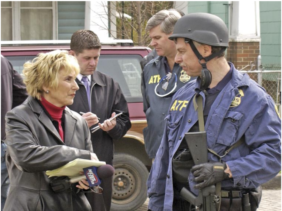
The VCIT relayed timely information to the media to deter offenders and reduce fear in communities.

Publicizing success deters would be offenders, reduces fear in the community, and bolsters team morale of those working with VCIT teams. The Los Angeles VCIT found that highlighting ATF’s work with local officers on the streets, grabbed the attention of the local gang members and related offenders. The word quickly spread that if ATF was involved, and arrests made, criminals were facing hard time in the Federal system.