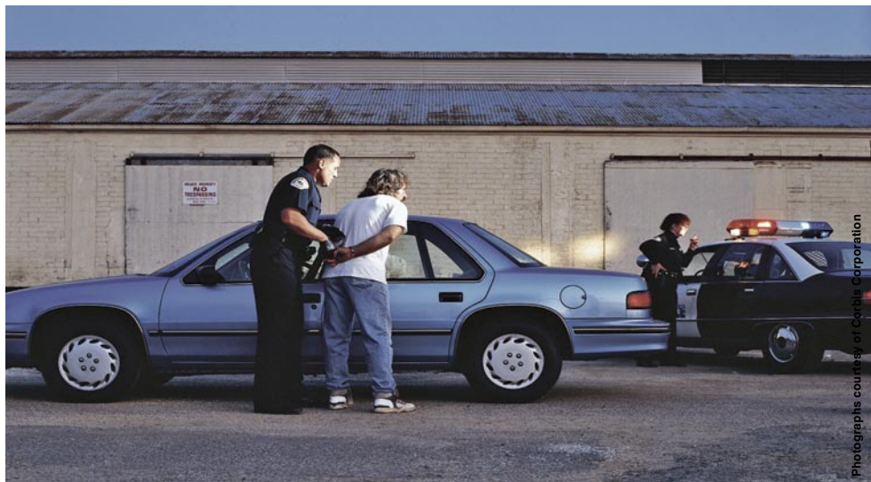
Police operations during peak hours of criminal activity made VCITs more effective.

Shift scheduling is critical to task force performance. Close monitoring of crime data and benchmarking efforts by other law enforcement agencies can empower team leaders to choose appropriate shifts and justify benefits to team members and supervisors alike.