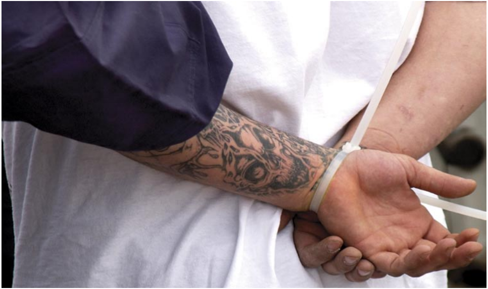
Gangs were linked to firearms-related violence in 13 of 15 VCIT cities.