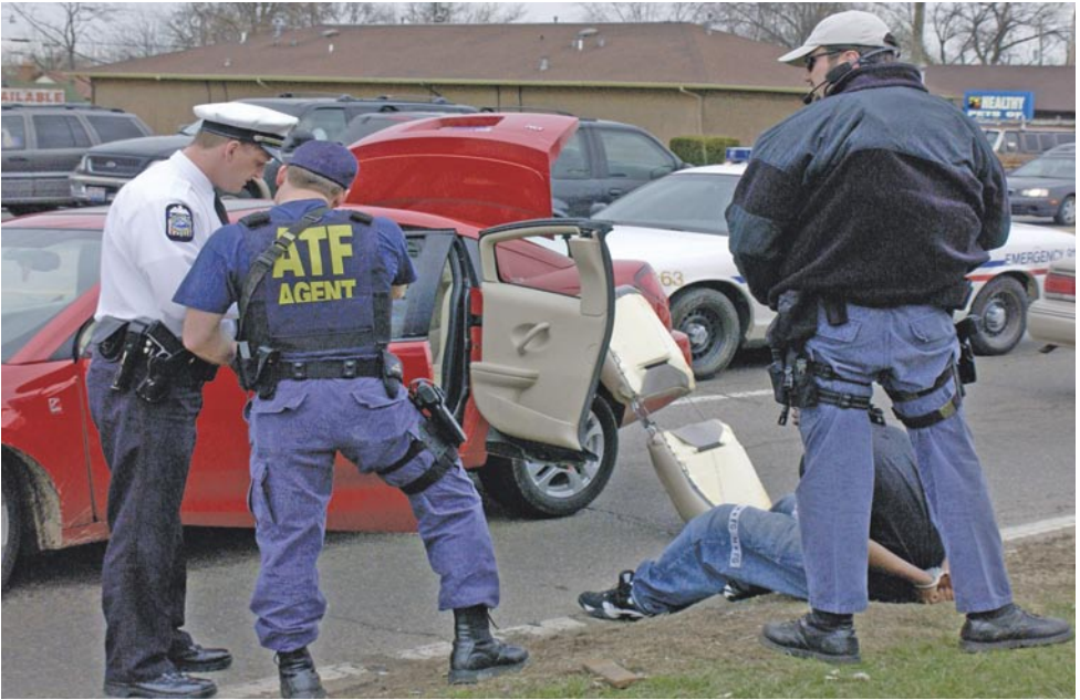
The Columbus Police Department supports a VCIT roundup.

Agents and officers conducted a roundup of 70 suspects that were indicted by a Federal grand jury based upon undercover buys. All of these individuals are facing substantial federal jail time in relation to these narcotics and weapons-related charges. Most are exposed to at least 5 years minimum mandatory time and some are looking at life in jail. This operation will have a large impact on crime in this tight knit community that will continue into the future.