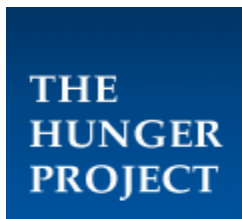
6. The Hunger Project