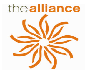
4. The Alliance to End Hunger