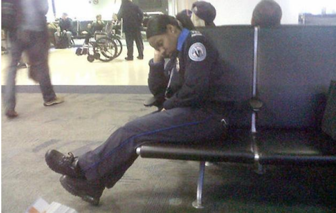
A TSA Transportation Security Officer takes a nap at LaGuardia Airport while on duty.

“Among these public servants are TSA's workforce, men and women who report to their posts each day motivated by the motto, "not on my watch."... Perhaps the next time you are going through airport security, taking a moment to convey respect and thanks to the Transportation Security Officers, the folks in the new blue uniforms, would offer well deserved recognition. After all, your safety is their priority.”