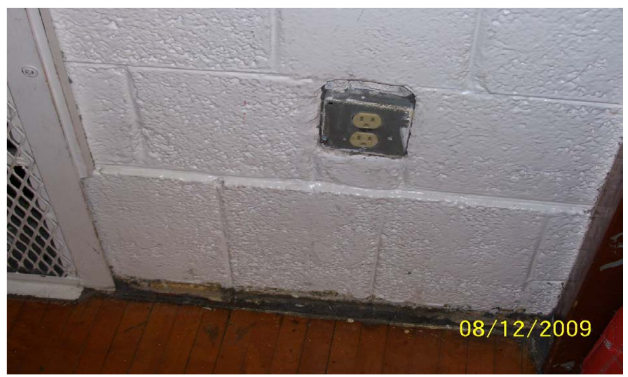
Photograph 3 – Taken at North Fond du Lac on December 8, 2009, showing an electrical outlet in the gymnasium without a safety cap.