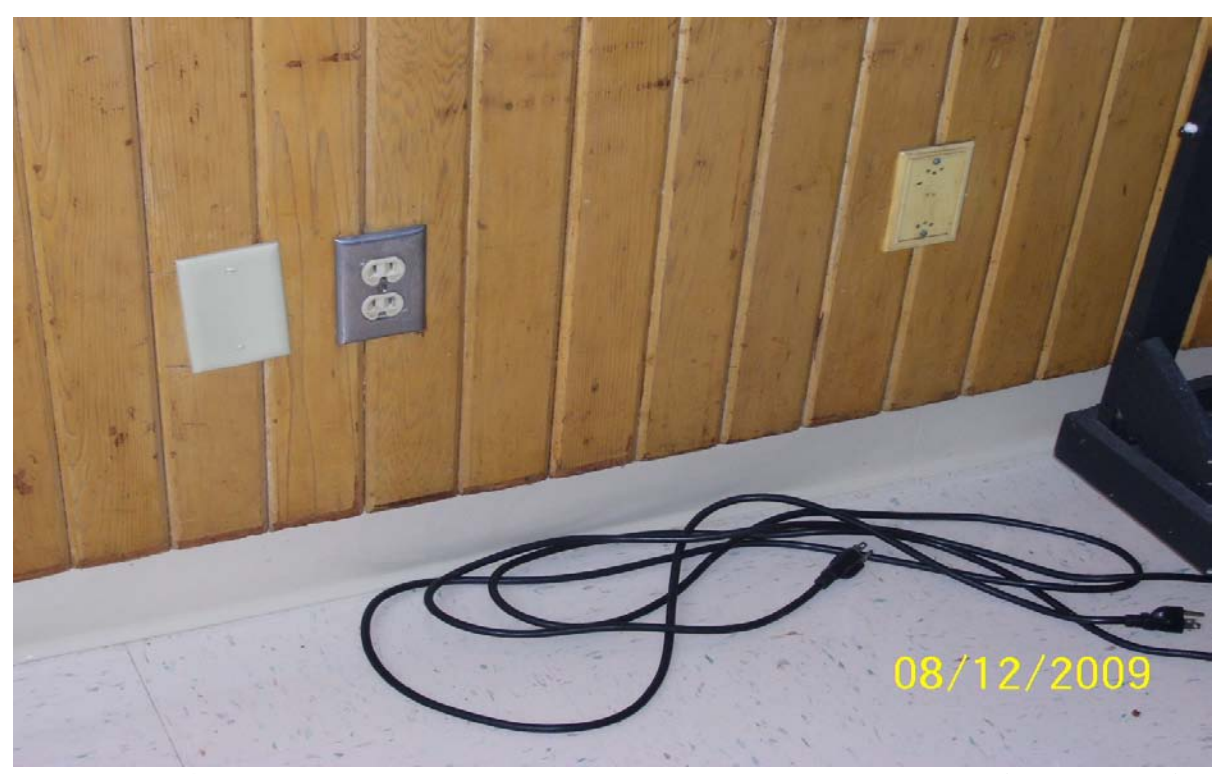
Photograph 4 – Taken at North Fond du Lac on December 8, 2009, showing an electrical outlet without a safety cap and a loose electrical cord that posed a safety hazard.