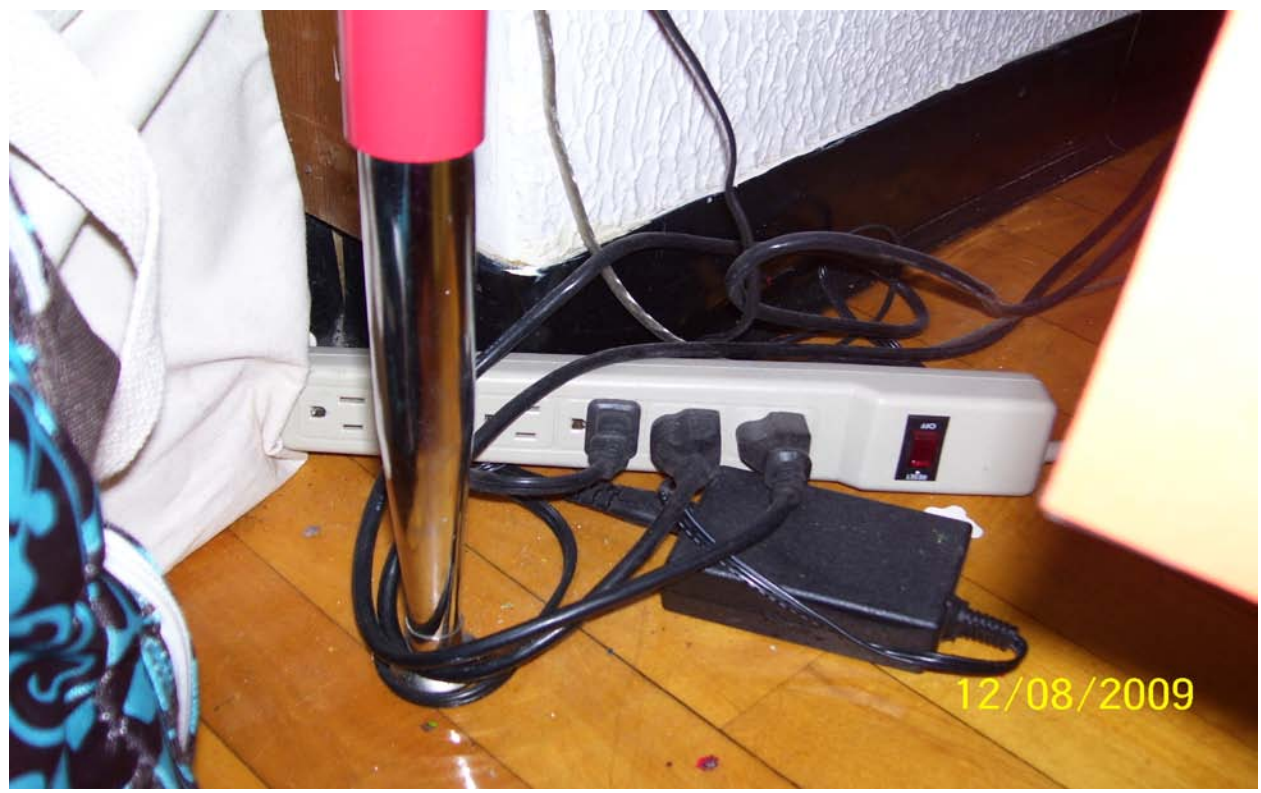
Photograph 7 – Taken at Fond du Lac on December 8, 2009, showing a power strip with exposed outlets on a classroom floor.