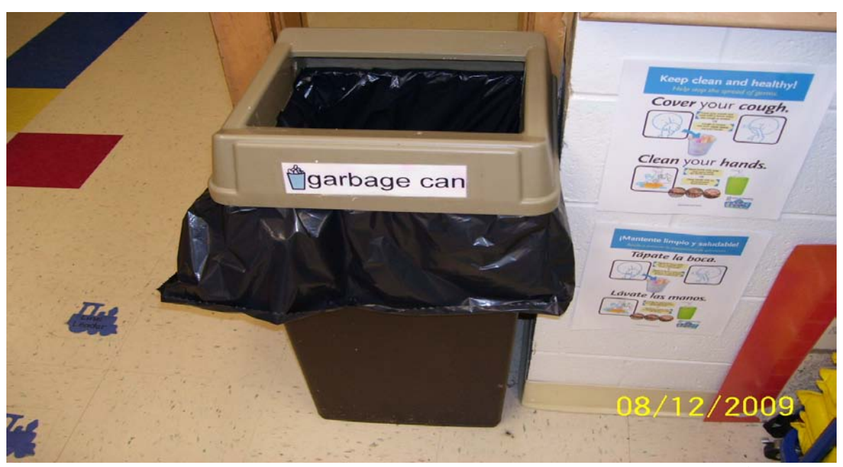
Photograph 1 – Taken at North Fond du Lac on December 8, 2009, showing an open trash can in the classroom.