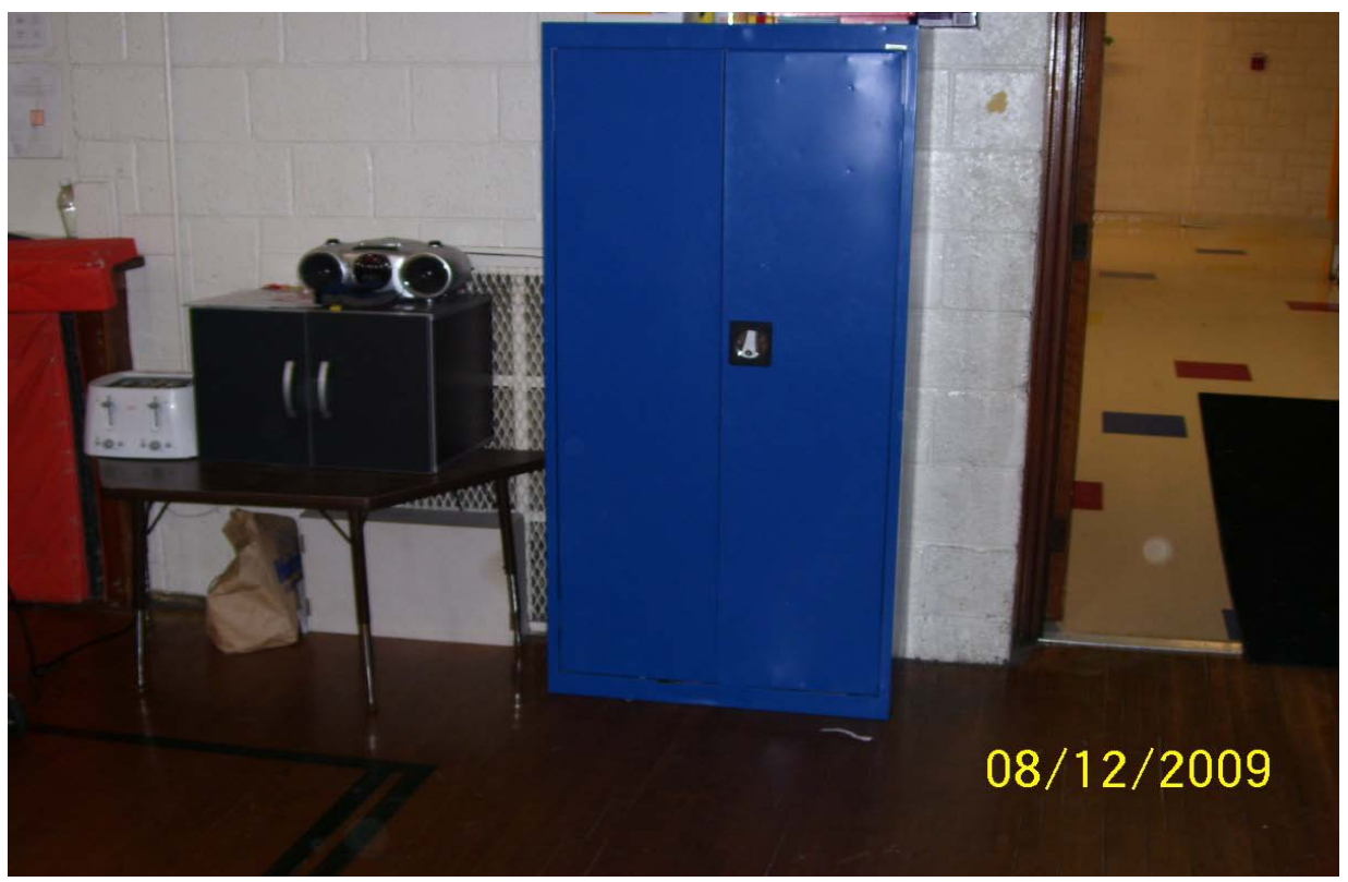
Photograph 5 – Taken at North Fond du Lac on December 8, 2009, showing a toaster plugged in near an entrance to the gymnasium.