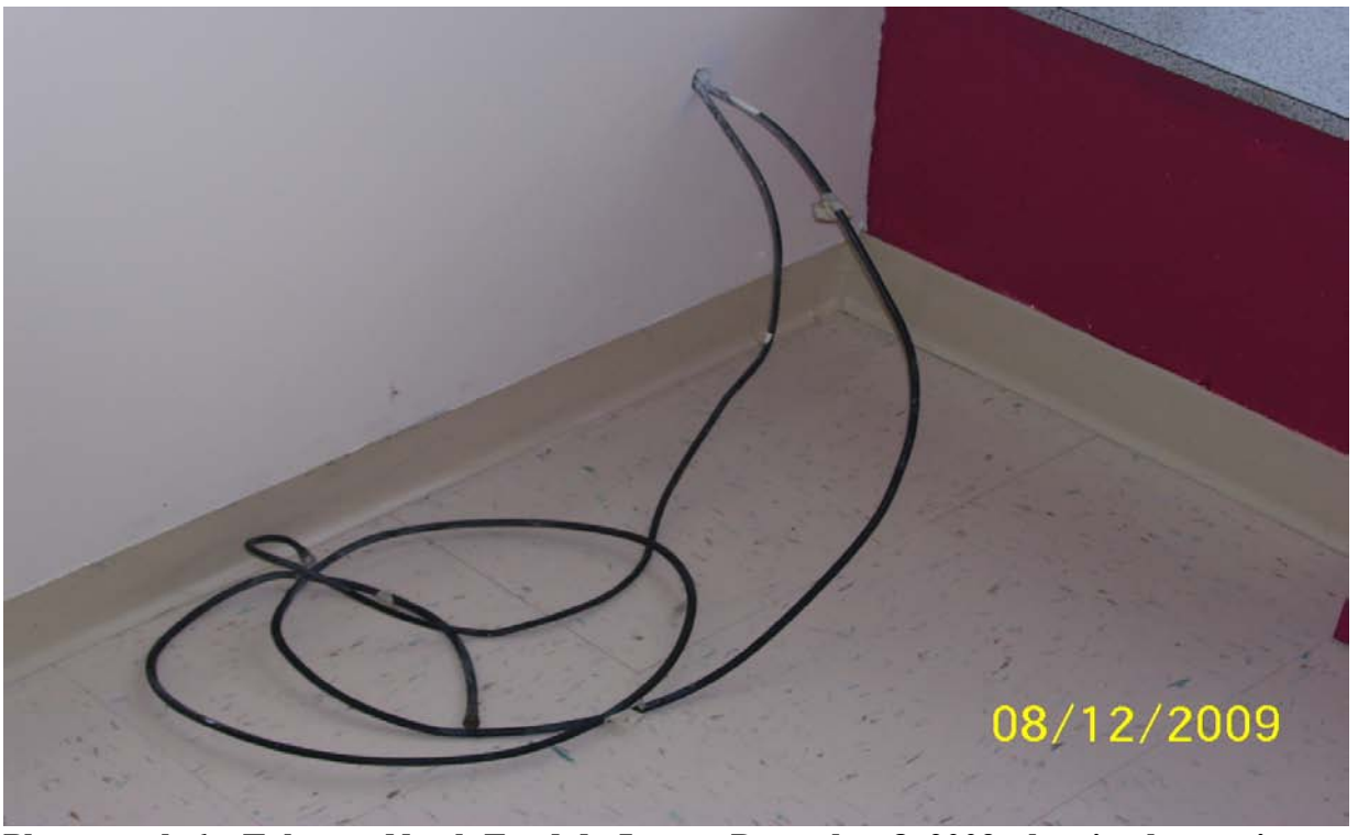
Photograph 6 – Taken at North Fond du Lac on December 8, 2009, showing loose wires coming out of the wall in an area accessible to children.