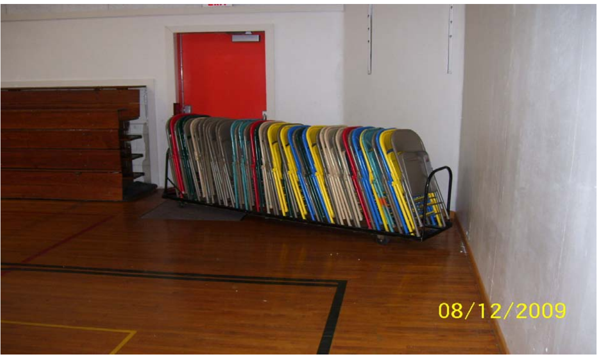
Photograph 2 – Taken at North Fond du Lac on December 8, 2009, showing a rack of folding chairs blocking an exit.