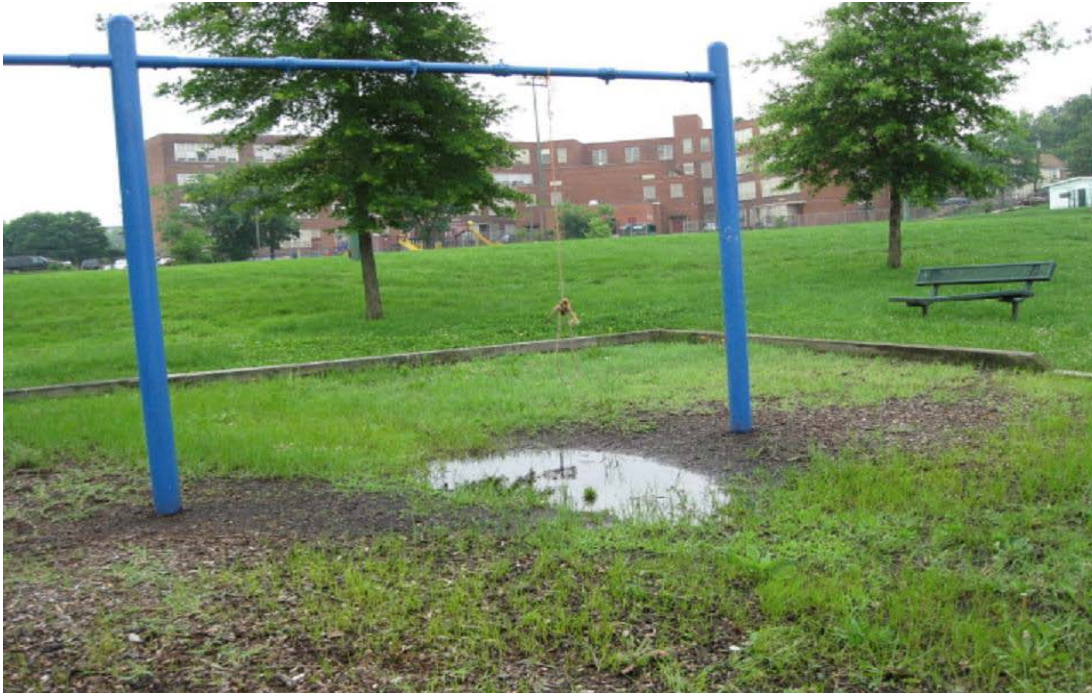
Photograph 5 – Taken at Barry Farms on 6/10/2009 showing a rope hanging from a swing area, a choking hazard.