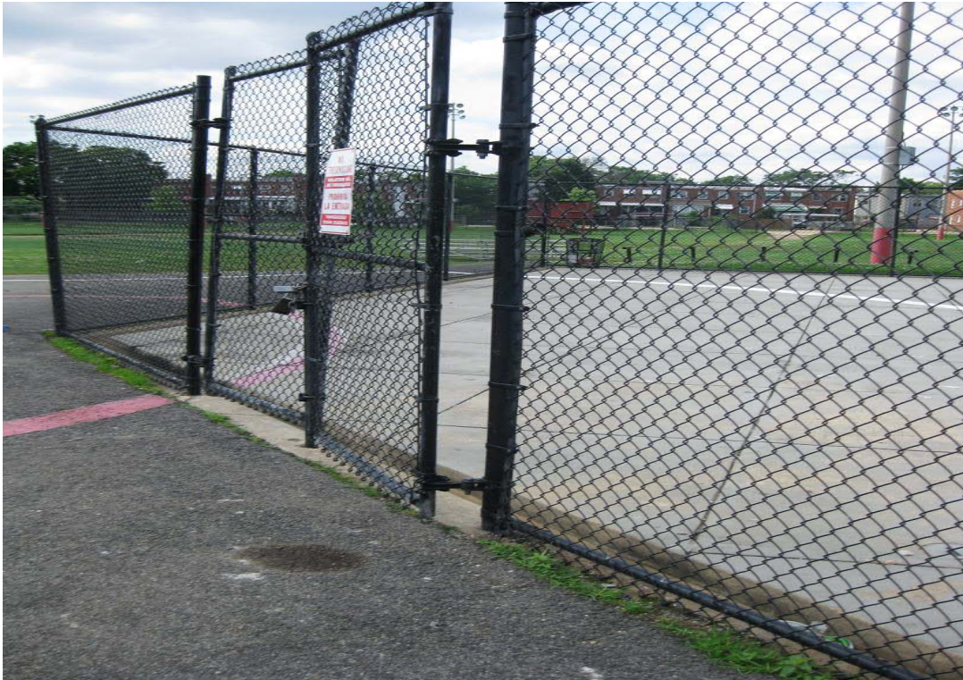
Photograph 13 – Taken at Rosedale on 6/12/2009 showing a large opening in the fence enclosing the swimming pool shown in Photograph 15. Children could easily fit through this opening and gain access to the pool.