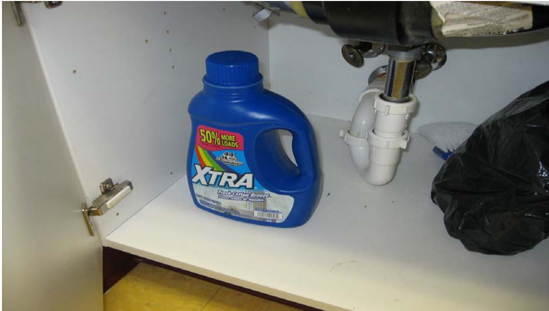
Photograph 7 – Taken at Edgewood on 6/16/2009 showing laundry detergent, a hazardous chemical, in an unlocked cabinet under a classroom sink.