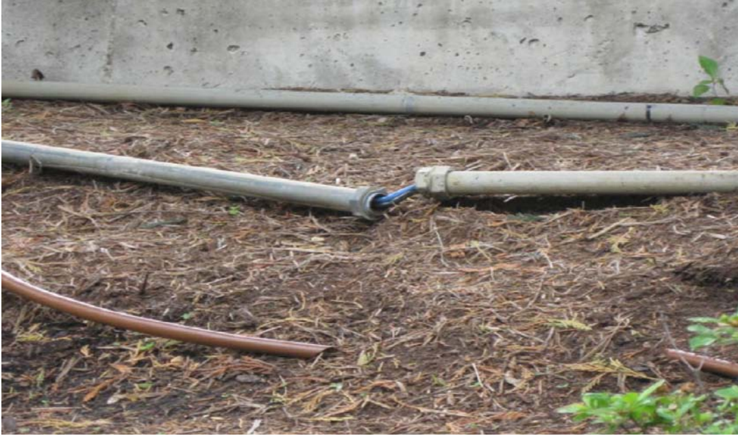
Photograph 9 – Taken at Edgewood on 6/16/2009 showing exposed wires on the perimeter of the playground.