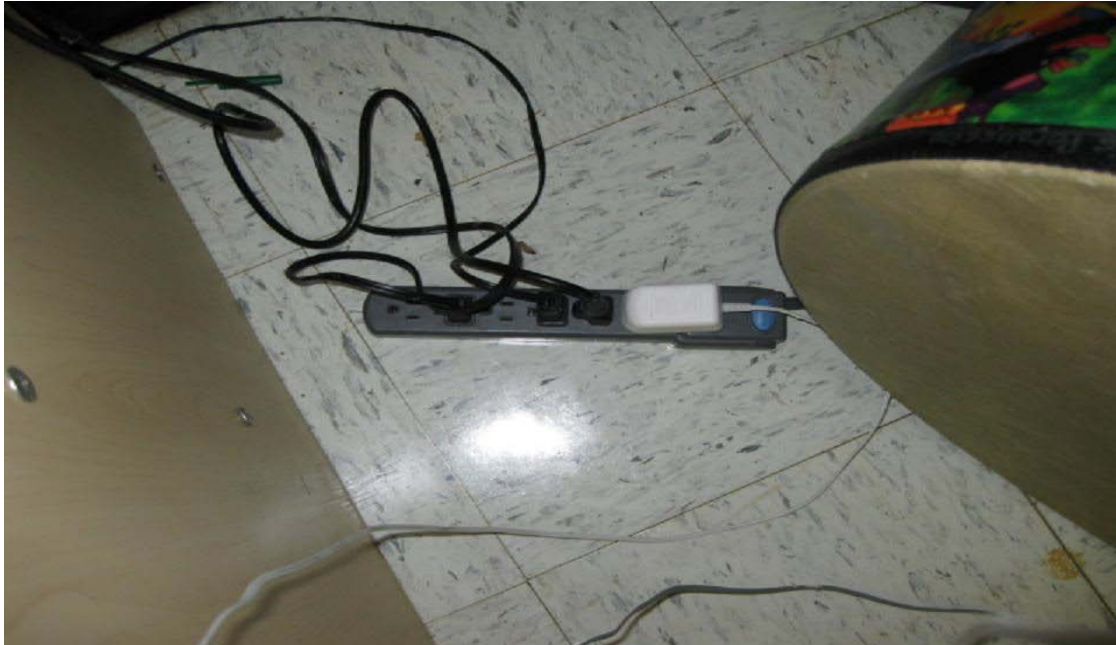
Photograph 1 – Taken at Atlantic Gardens on 6/11/2009 showing a classroom power strip containing two outlets without protective closures.