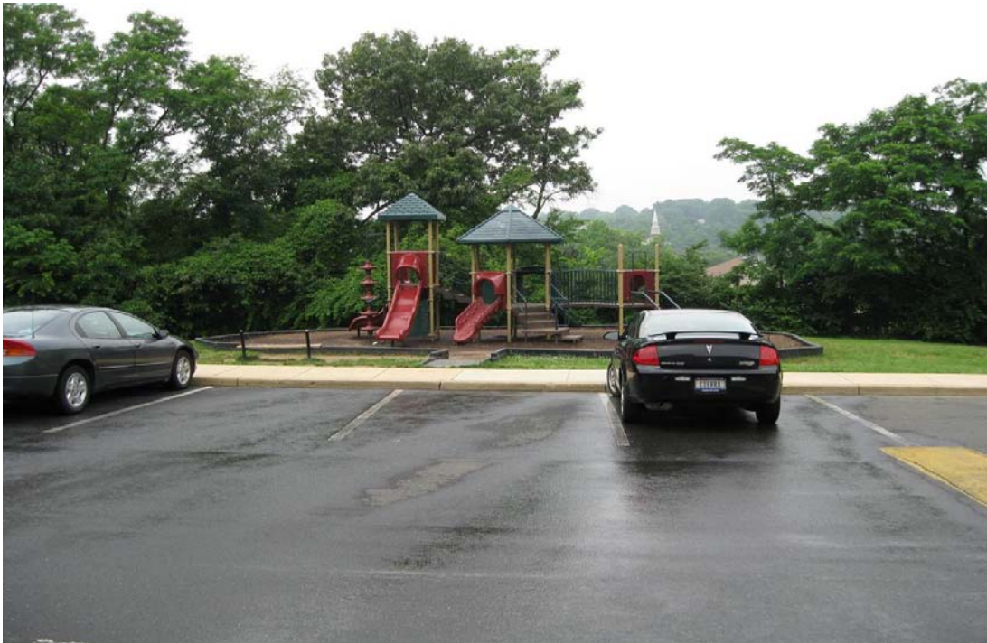
Photograph 1 – Taken at Atlantic Terrace on 6/11/2009 showing that children had to cross a parking lot to reach an outdoor play area that was not enclosed by a fence.