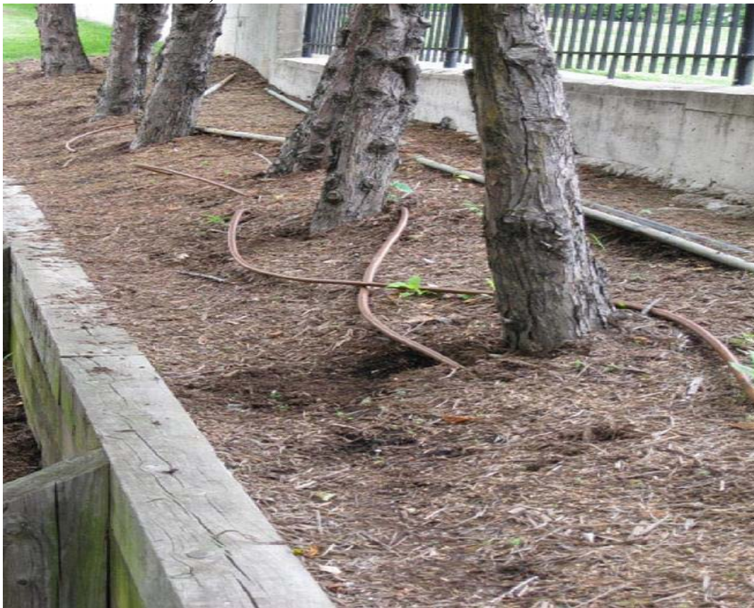
Photograph 8 – Taken at Edgewood on 6/16/2009 showing exposed copper tubing on the perimeter of the playground.