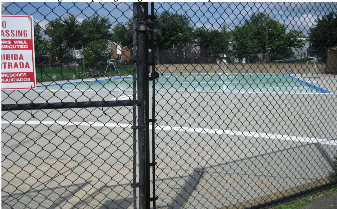
Photograph 14 – Taken at Rosedale on 6/12/2009 showing the enclosed swimming pool accessible through the opening seen in Photograph 14.