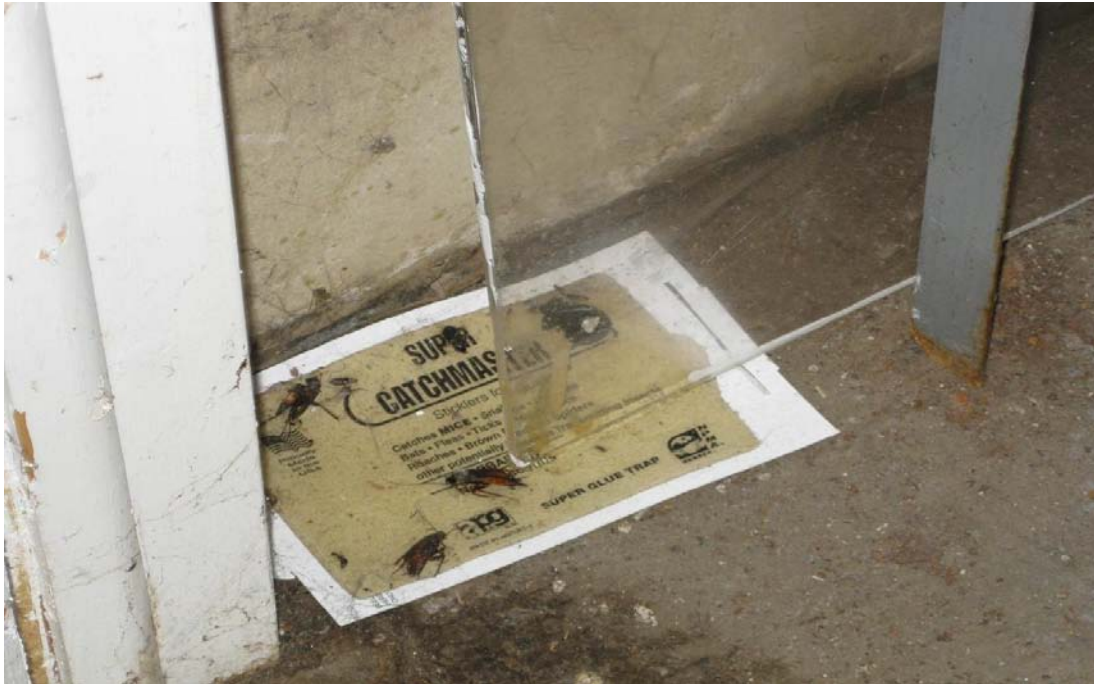
Photograph 11 – Taken at Paradise on 6/10/2009 showing a glue trap with dead roaches in an unlocked classroom closet. (The plexiglass did not have sharp edges.)