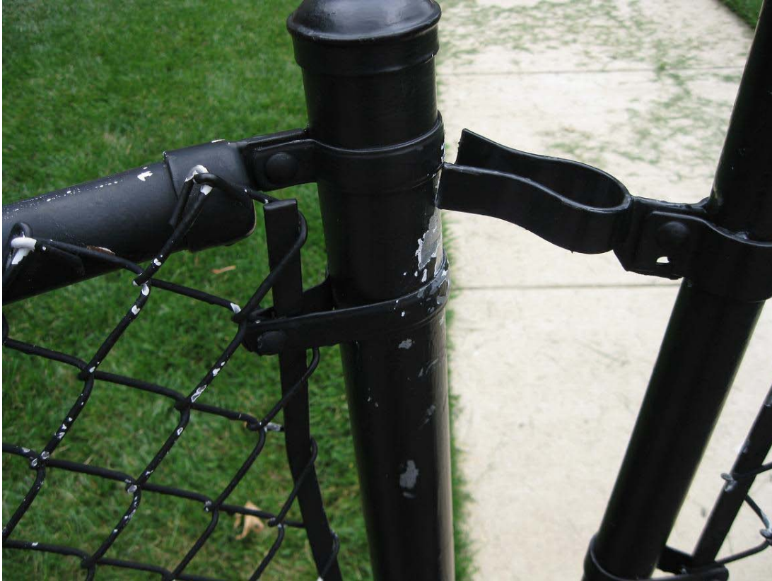
Photograph 3 – Taken at Edgewood on 6/16/2009 showing a latch on a play area entrance gate that did not close properly, allowing children to enter unsafe and unsupervised areas.