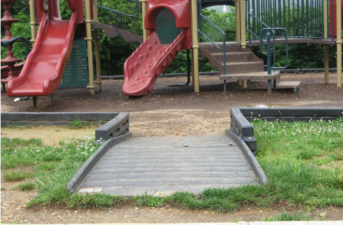
Photograph 3 – Taken at Atlantic Terrace on 6/11/2009 showing railroad ties and protruding bolts on the walkway to the playground, which created tripping hazards.