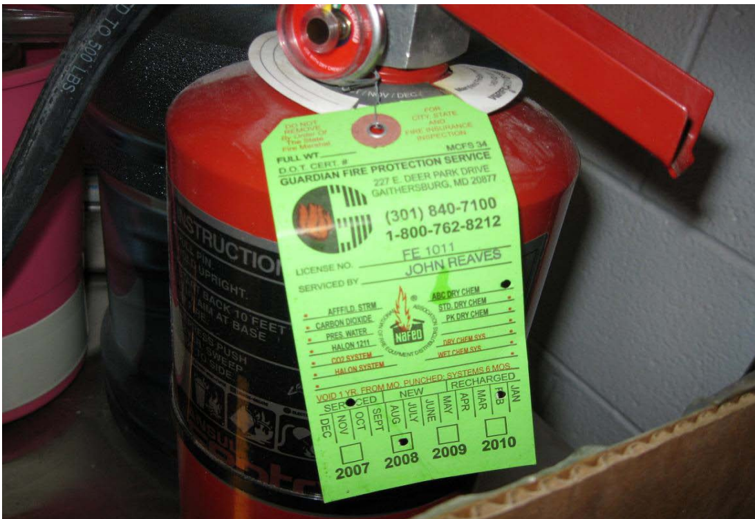
Photograph 6 – Taken at Benning Parks on 6/17/2009 showing a past-due fire extinguisher inspection tag dated 2/2008.