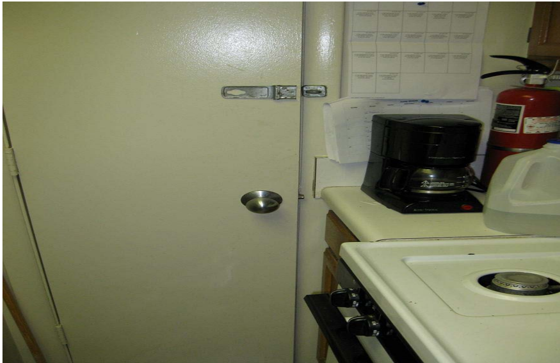
Photograph 2 – Taken at Atlantic Terrace on 6/11/2009 showing a fire extinguisher and a coffeepot within reach of children.