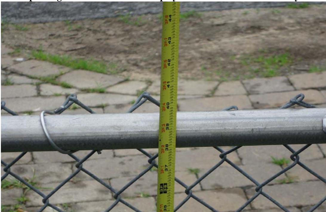
Photograph 2 – Taken at Benning Parks on 6/17/2009 showing that the fence enclosing the outdoor play area was 40 inches high rather than the required 48 inches.