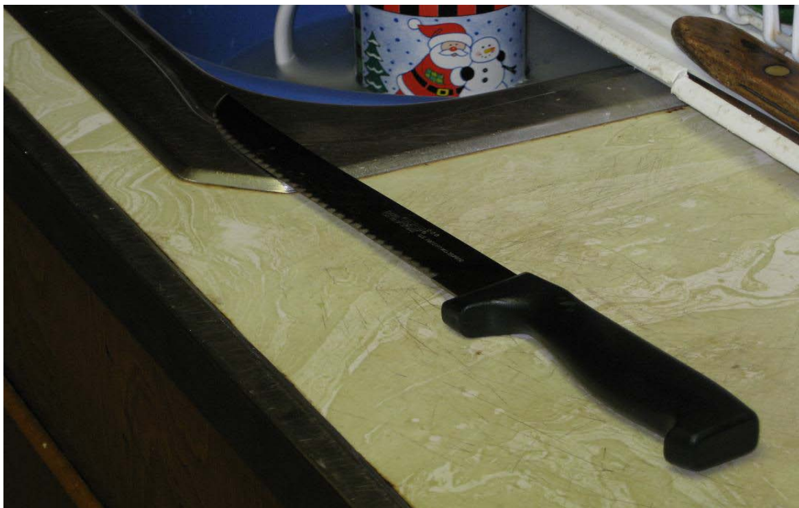
Photograph 15 – Taken at Watkins on 6/11/2009 showing a large knife on the kitchen counter within reach of children.