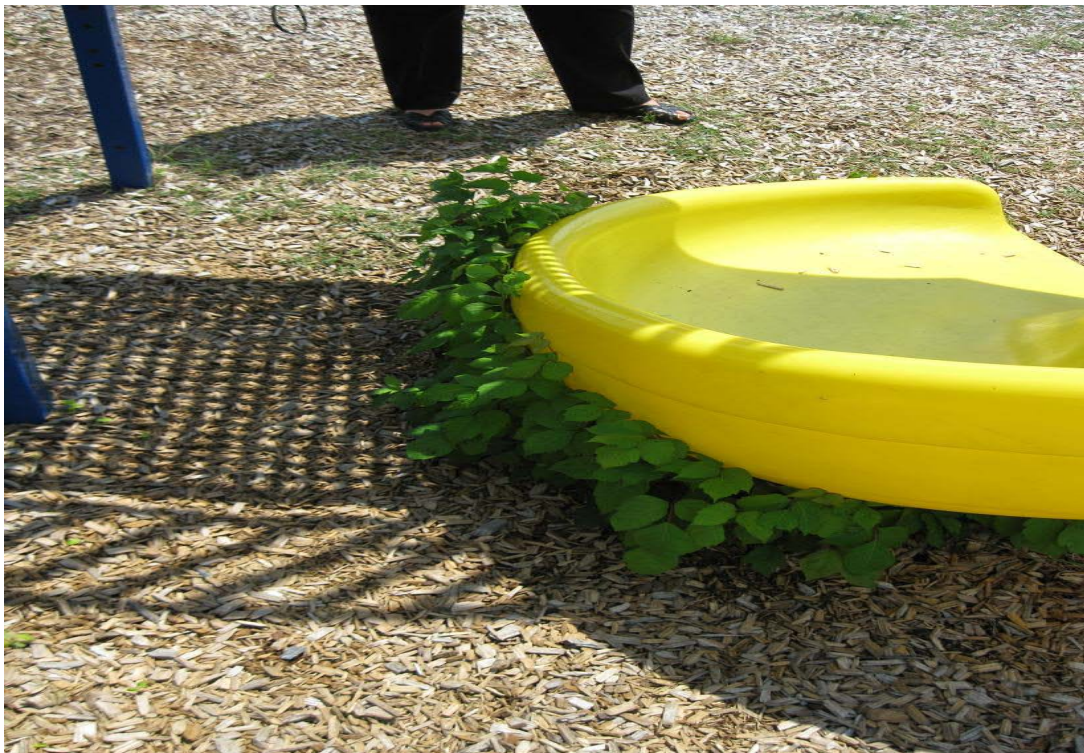
Photograph 10 – Taken at Kenilworth Parkside on 6/16/2009 showing poison ivy at the bottom of a slide.