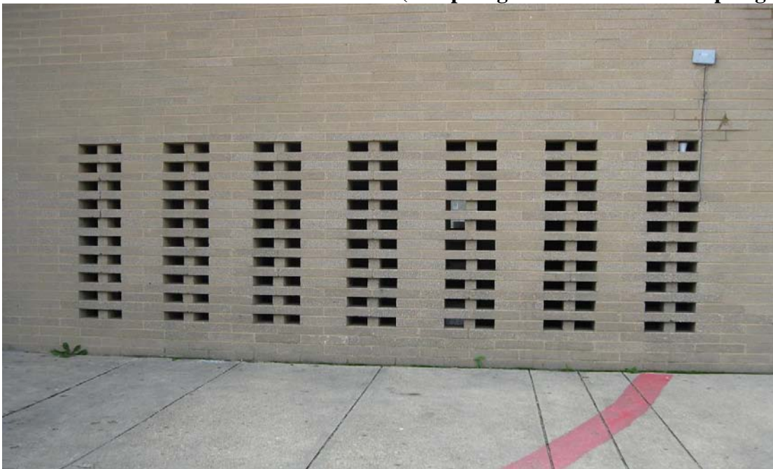
Photograph 12 – Taken at Rosedale on 6/12/2009 showing vents in the brick wall of a building in the courtyard play area. Children could climb on the vents and possibly fall and injure themselves.