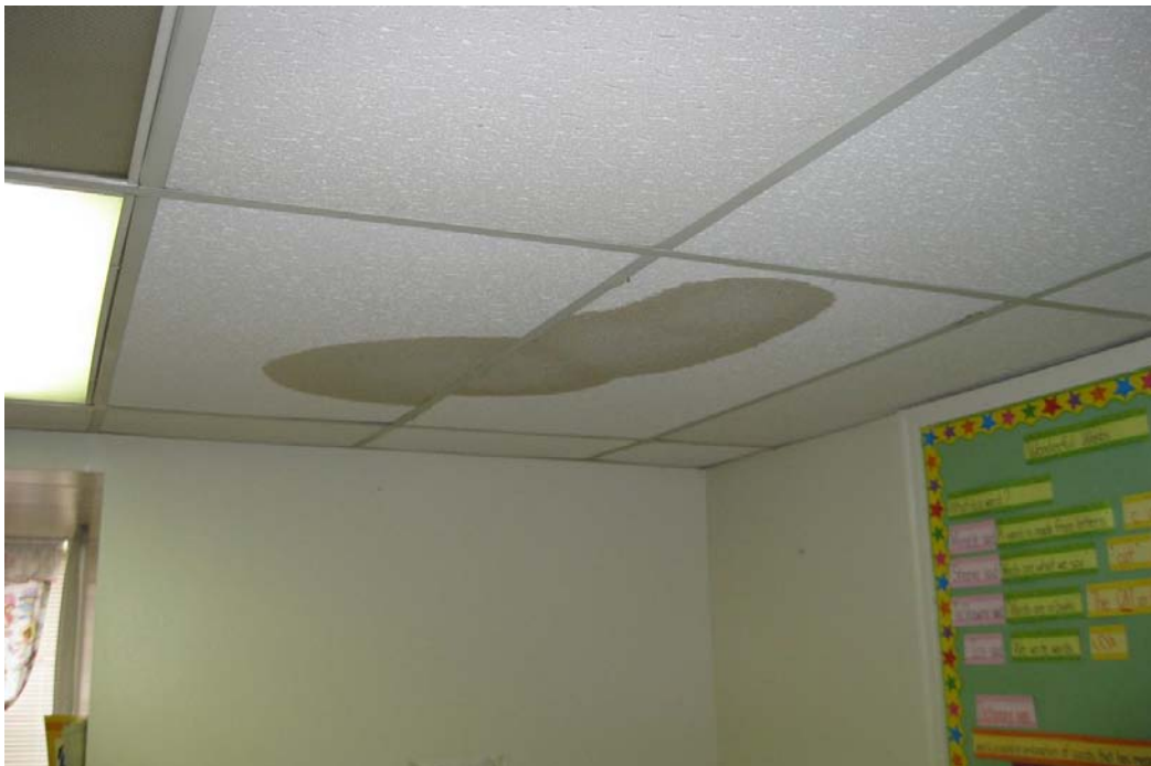
Photograph 4 – Taken at Atlantic Terrace on 6/11/2009 showing water-stained ceiling tiles.