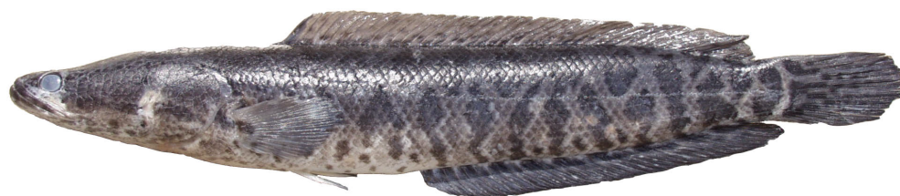
Channa argus

Snakeheads look very similar to the North American native Bowfin. Within the two genera, twenty-eight separate species are recognized; however, due to similar physical characteristics, these species are difficult to differentiate.