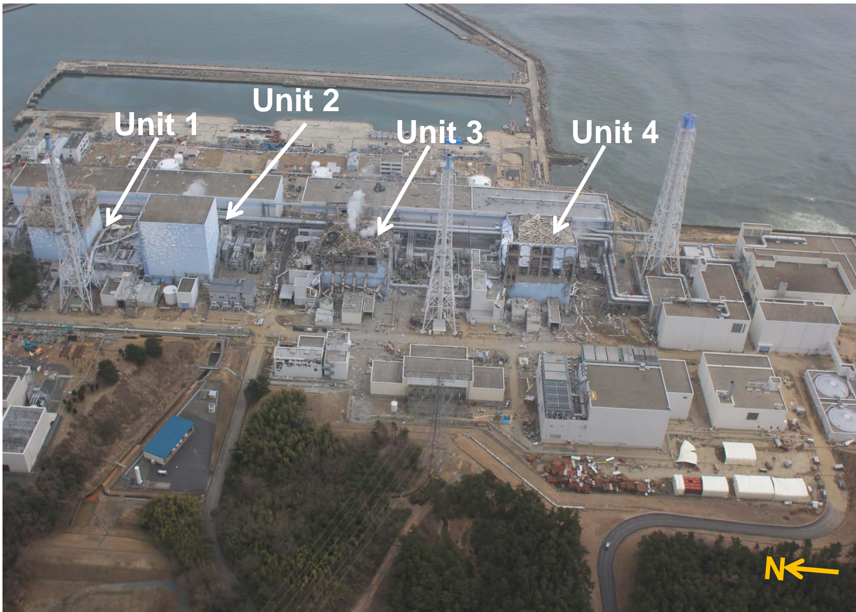
Fukushima Dai'ichi Nuclear Power Station