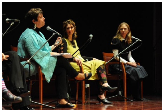
Speaking on a panel at the Future of Holocaust Education Conference

On November 21, I briefed board members and the leadership of expatriate Jewish communities in New York City at the Jewish Community Relations Council of New York at a breakfast meeting. Following that, I participated in “ Messaging to Remember – the Future of Holocaust Education ,” a conference that brought together international scholars to examine the past sixty years of Holocaust education in Europe and the United States and to talk about ways to develop new ways to teach future generations. I spoke on a panel after the showing of the documentary film Auf Wiedersehen, Til We Meet Again about its connection to my work. I highlighted this film in the May/June 2011 issue of the Monitor.