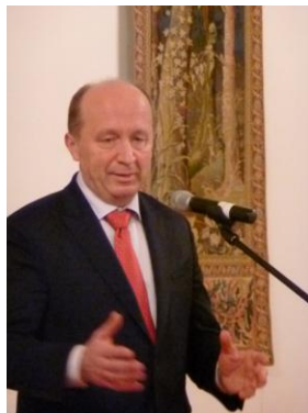
Prime Minister Azubalis

Our next stop was Lithuania. The Government of Lithuania has made strenuous efforts to come to terms with its role in the Holocaust. The Lithuanian Ministry of Foreign Affairs invited me to be a panellist at the International Academic Conference “Tolerance and Totalitarianism—Challenges to Freedom” on November 16. Lithuania’s Prime Minister, Audronius Azubalis, opened the conference by noting that Lithuanians are defined by those who believe in freedom, and how human values are more important than false promises among nations. I agree with the Prime Minister’s comment that tolerance and freedom requires those who care to be able to work toward it. In this new democracy, it is impressive that top governmental leaders are dedicated to spending such critical time, energy and resources to highlight the importance of fighting anti-Semitism and other human rights abuses as essential to a successful democracy.