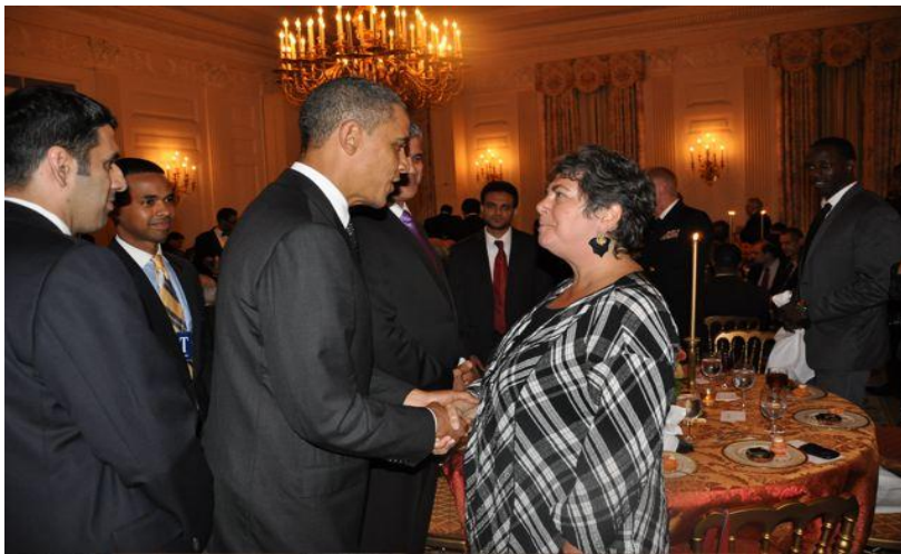
Greeting President Obama at White House iftar, August 10, 2011

The evening meal when Muslims break their fast during the month of Ramadan is known as an iftar. In August, during Ramadan, I was invited to join three iftars. I attended one hosted by the Turkic American Alliance, the first-ever iftar hosted by an Israeli Ambassador as well as one hosted by the White House. Secretary of State Clinton hosted a reception marking the end of Ramadan, called Eid ul-Fitr, at the Department of State, which I also attended.