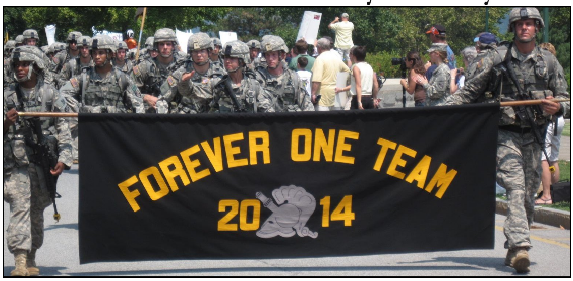
Plebe-Parent Information Guide March 11-13, 2011