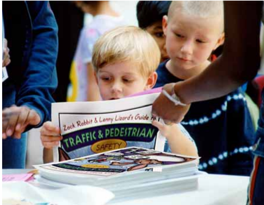
Figure 24-1. Photo. Comprehensive bicycle and pedestrian programs include more than bike lanes and sidewalks.

By then, it had become clear that simply providing a bicycle- and pedestrian-friendly road or trail environment, as important as it is, cannot solve all bicycle and pedestrian problems. Some safety problems, for example, may be more easily solved through programs than through facilities. In order to understand the importance of the other elements of a comprehensive program, consider the following two examples.