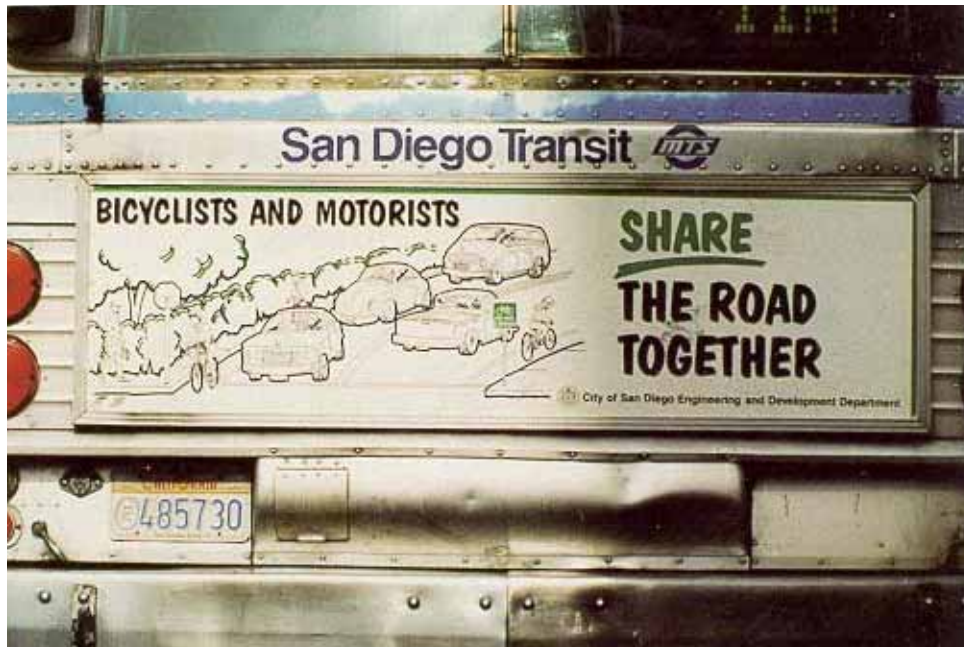
Figure 24-4. Photo. Target safety messages to key audiences through various media.

Examples: The Gainesville, FL, program determined that one of the audiences most in need of attention was the college student population. Key safety messages for these bicyclists were identified.