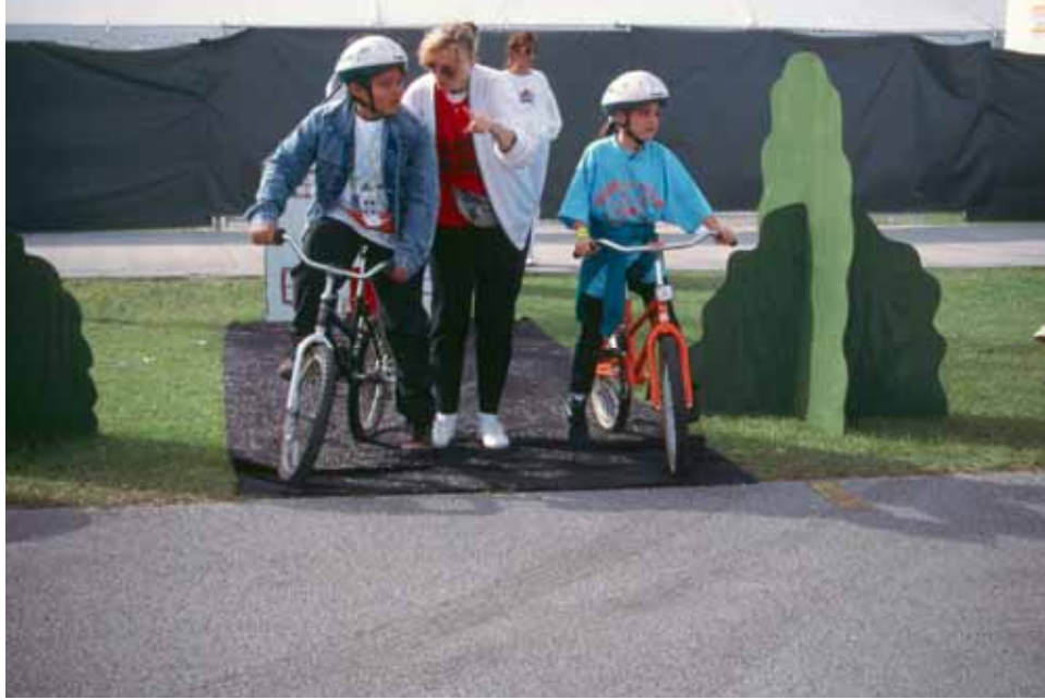
Figure 24-3. Photo. Safety education programs are essential for young children.