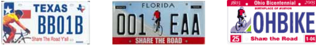
Figure 24-7. Photos. Vehicle license plates that promote sharing the road with bicyclists.