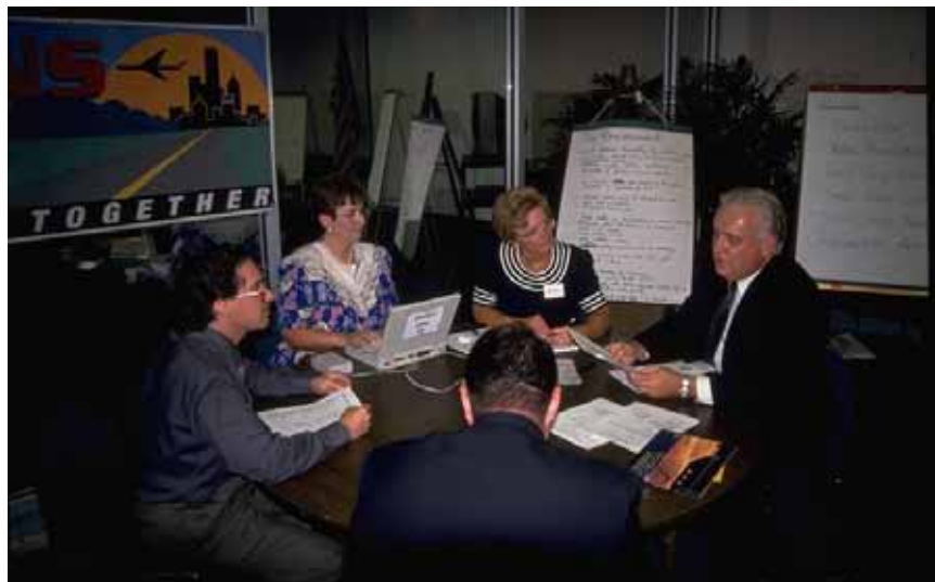
Figure 24-2. Photo. Comprehensive bicycle and pedestrian programs bring together a variety of stakeholders.

How, exactly, can an effective mix of engineering, enforcement, education, and encouragement be determined? The answer is that participants from a wide range of agencies and groups must get involved in the process. The Geelong, Australia, model is a good one to illustrate this point. The Geelong Bike Plan Team included members from the enforcement community, roads department, safety agencies, school system, and bicycling community (see figure 24-2). In assembling their comprehensive program, the project managers enlisted the help of those who would, ultimately, be responsible for implementing it.