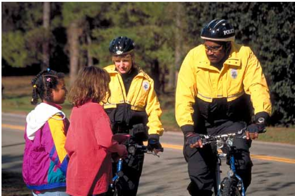
Figure 24-6. Photo. Police bicycle patrols are effective at outreach and crime prevention.

Examples: Seattle, WA, has pioneered the mountain bike patrol as a way of dealing with street crime. Begun in 1987, the patrol has grown to more than 100 officers, and the founders have given training seminars to police departments all over the country (see figure 24-6). Each year, hundreds of mountain bike officers gather for a national conference sponsored by the League of American Bicyclists; many also attend the annual Beat the Streets patrol competition hosted by that city.