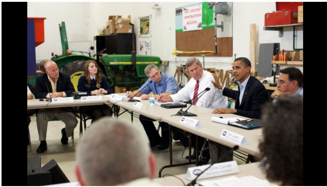
President Barack Obama, accompanied by Agriculture Secretary Tom Vilsack, holds a breakout session at the White House Rural Economic Forum at Northeast Iowa Community College in Peosta, Iowa, Aug. 16, 2011, as part of his three-day economic bus tour of the Midwest.

Administration officials traveled to rural communities in 46 states and met with rural Americans to hear about the unique challenges they are facing and the ways in which the Council can most effectively focus its efforts. Officials reported back on what they heard during these visits and their feedback is shared in this report.