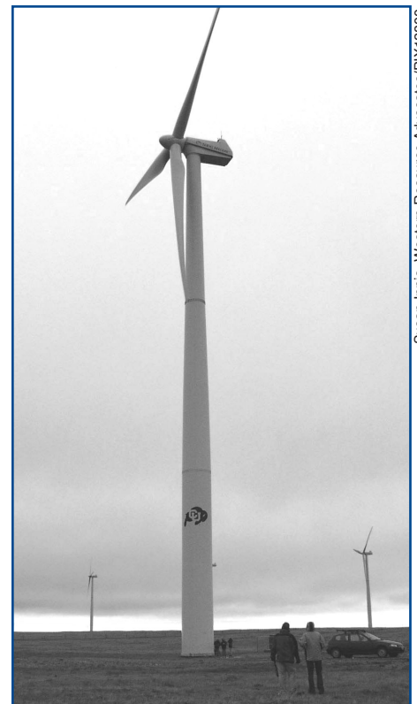
University of Colorado (CU) students voted to increase student fees by $1 per semester for 4 years to purchase wind power from Public Service Company of Colorado's Ponnequin wind farm. The increase in fees raised $50,000 per year to purchase the output of a wind turbine (seen here decorated with CU's buffalo mascot).

5 Blend wind energy with energy efficiency. Studies have shown that total energy and energy cost savings are maximized per unit investment when efficiency measures are combined with renewables installations. SEP funds could be used to produce an investment/sizing tool that optimizes the benefits of blending energy efficiency with wind energy for schools and to develop some demonstrations of those benefits.