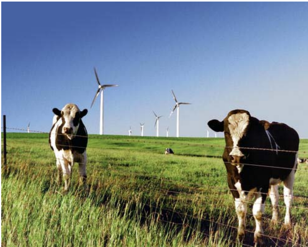
FIGURE 3: A WIND DEVELOPMENT SUPPORTED BY SEP FUNDS MAY RESULT IN THE RETENTION OF MONEY IN LOCAL ECONOMIES AND CAN BE PARTICULARLY HELPFUL IN SUPPORTING RURAL ECONOMIC DEVELOPMENT.