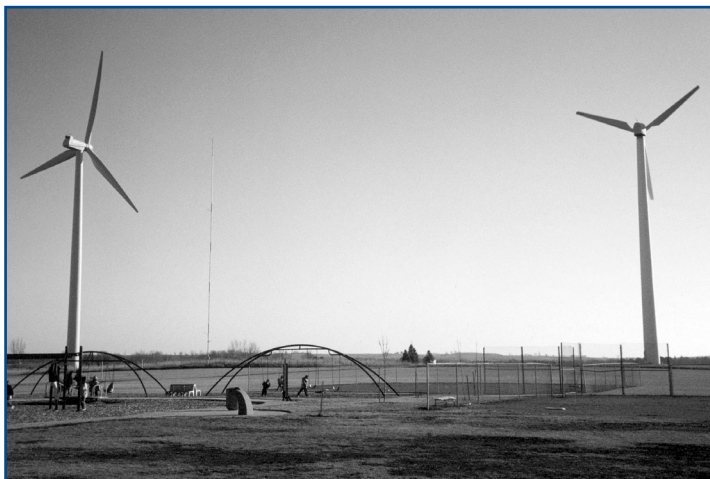
Spirit Lake Community School District/PIX11342

8 Purchase the wind “premium” for a local school. A utility might charge more for wind energy than for energy from traditional sources. SEP funds could be used to pay for this wind premium (cents/kWh) for a school for a certain time period. The