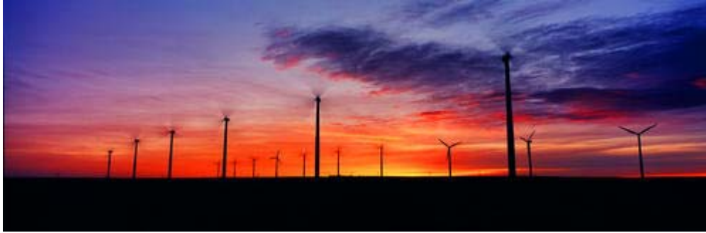
FIGURE 1: THE COLORADO WIND SEP RESULTED IN THE PURCHASE OF GREEN TAGS FROM XCEL'S WINDSOURCE PROGRAM (FROM THE PONNEQUIN WINDFARM) FOR AT LEAST 5 YEARS.

The National Renewable Energy Laboratory (NREL) and U.S. Department of Energy (DOE) assisted in calculations estimating the environmental benefits of this SEP. Resulting reductions in air emissions have been estimated as follows: