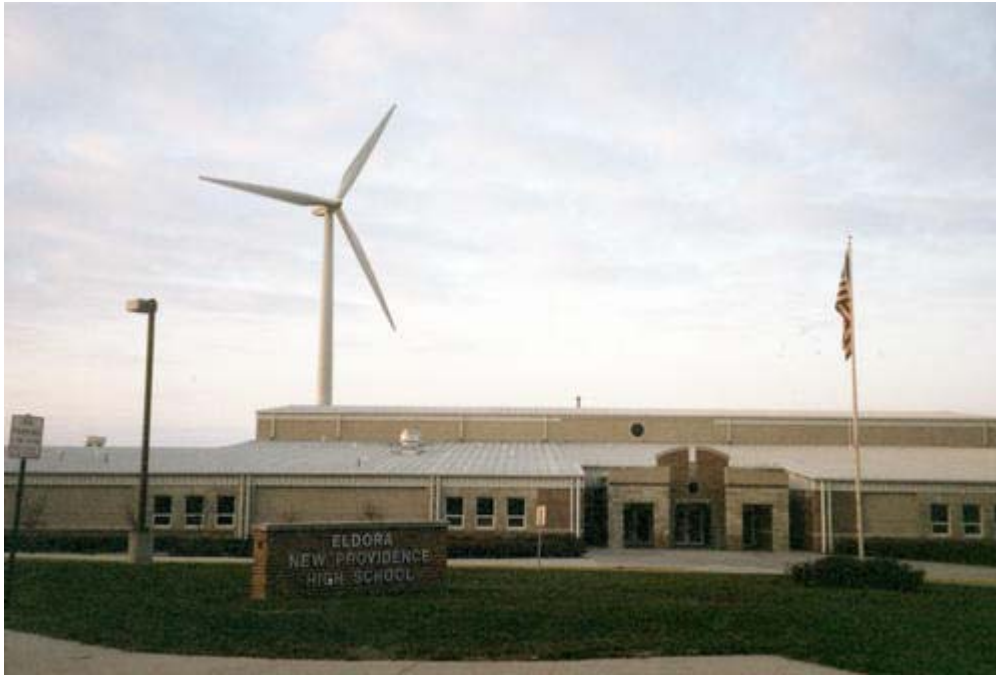
FIGURE 4: FUNDED THROUGH A SEP, A SCHOOL'S ELECTRICITY NEEDS COULD BE OFFSET BY INSTALLING A WIND TURBINE. THE WIND TURBINE COULD ALSO BE USED AS AN EDUCATIONAL TOOL IN THE SCHOOL'S CURRICULUM.