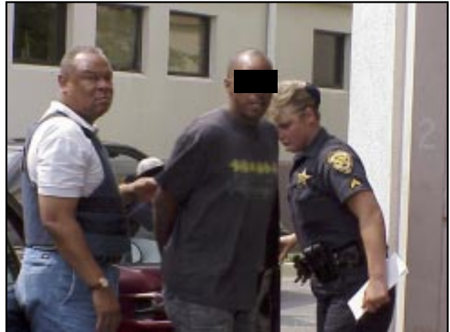
OIG agent and local officer transporting fugitive arrested during Operation Talon

■ A fugitive who had eluded authorities in New York for 17 years was arrested for failing to appear for his arraignment on a manslaughter charge. The fugitive allegedly drove into another vehicle while he was under the influence of alcohol. The collision killed the passenger in his vehicle.