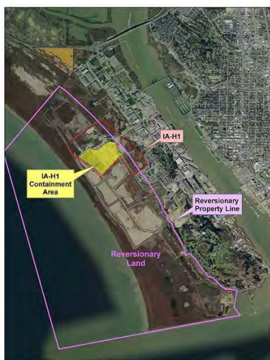
IA-H1 Location and Land Subject to State Reversion

The population of Vallejo is approximately 116,000 with a median household income of $61,000. MINS played a major role in the economic development of Vallejo and surrounding communities, and was the largest employer in Vallejo and Solano County. At the height of its operations in 1989, MINS employed 15,000 persons on base, with an additional 12,000 ancillary jobs indirectly supporting the shipyard. 1993 data shows that approximately 83% of MINS employees lived within Solano or Napa counties. In 2008, the City of Vallejo was the first municipality in California history to declare bankruptcy.