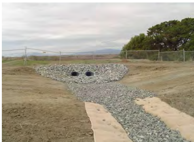
Concrete Rip-Rap Surface Water Drainage to Wetlands

The groundwater collection system was designed to utilize electrical line power rather than a fossil fuel-powered generator. The groundwater collection pumps are operated with compressed air and designed to automatically shut off at 120 psig and restart when the line pressure drops to 60 psig. This significantly reduces electricity usage, cost and CO 2 emissions to operate the compressor. An auto-dialer is used to notify personnel if a shutdown of the groundwater collection system occurs. Due to the limits of degraded waste within the landfill, it was determined not to be economically feasible to capture landfill gas and reuse it to power site operations or for commercial resale value. Instead wind turbines were utilized onsite as a safe and effective means to passively vent landfill gas.