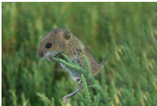
Salt Marsh Harvest Mouse in Pickleweed

Since the landfill closure in 1989, low-lying areas within the planned footprint of the IA-H1 Containment Area had developed into approximately 7-acres of low-grade wetlands containing pickleweed, which is the preferred habitat of the endangered SMHM ( Reithrodontomys raviventris ). These wetlands jeopardized acceptance of the preferred remedy of containment and capping, which required that the isolated wetlands be backfilled. The IA H1 Restoration Team successfully negotiated with the resource agencies to trap and relocate any recovered SMHM within the isolated wetlands prior to their removal. In addition, the Team negotiated an overall wetland compensatory mitigation ratio of only 1.15:1 (as opposed to 1.5:1) to replace the backfilled wetland area. After four years the 8.7 acres of created wetlands are exceeding the incremental goals for vegetation type and density.