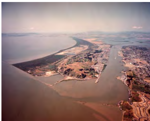
Aerial view of the Mare Island Naval Shipyard

The mission of the Department of the Navy (DON) Naval Facilities Engineering Command Base Realignment and Closure Program Management Office (BRAC PMO) is to expeditiously and cost effectively provide the services necessary to realign, close and dispose of DON BRAC properties. Such closures provide cost savings which can be reapplied to support DON and Department of Defense programs. The BRAC PMO prides itself on providing comprehensive environmental restoration and expedited property transfer actions to stimulate economic redevelopment at those installations where for many decades the community hosted the military mission.