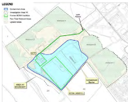
IA-H1 and Surrounding Wetlands

Investigation Area H1 (IA-H1), identified in 1983 during the Initial Assessment Study, comprises 230-acres. The Navy managed solid wastes at IA-H1 generated from the base during the early 1940s until 1989. Waste oil was discharged into unlined oil sumps constructed within IA-H1 from the early 1940s until the late 1960s. IA-H1 also contained an industrial wastewater